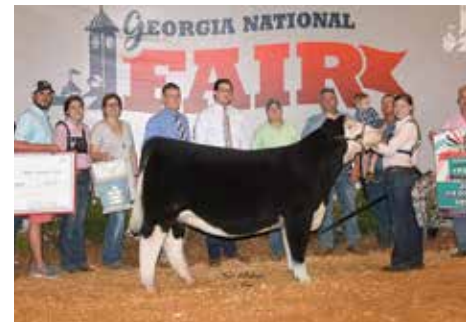
MISS CCF PANDA Dam of Lots 17 & 18

The demand for elite red hided cattle continues to surge, and females like Miss CCF Honey Pain are a prime example of this trend. We absolutely love this TMAS Can't Touch This 8513F sired daughter of Miss CCF Panda that will be a dominant force in the SimAngus division early and often. She exemplifies skeletal quality, presence, and balance from every angle. Her dam, Miss CCF Panda, was a competitive show heifer, and has turned into a role model in the donor pen. Can't Touch This progeny offer the added feature and form necessary to find the winners circle at the most competitive stock shows in the nation. Bid with confidence!