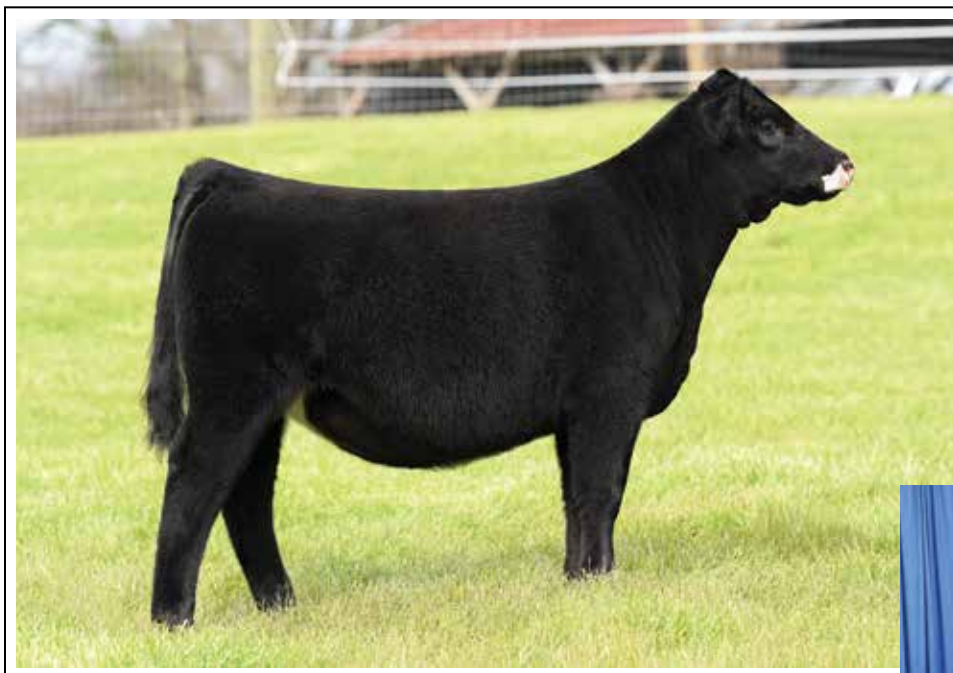
Lot 6 BELIEVE IN D J40

This pays to believe daughter of Miss CCF Double D D101 is awesome haired and just as sound as her mom was. Very symmetrical and balanced as they come. She's way laid back and is the one for a first-year showman. We're not crazy about selling this one because we can't find any faults with her and know she will produce just like her mother.