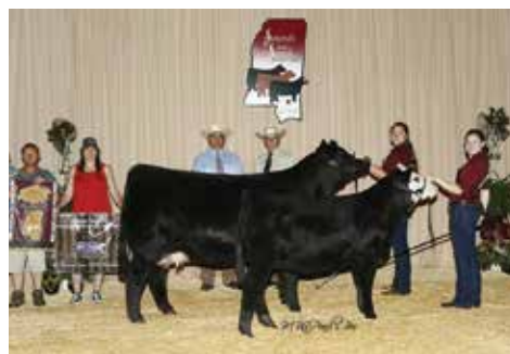
MISS CCF JESTRESS B79 2017 AJSA NATIONAL CLASSIC GRAND CHAMPION PERCENTAGE COW/CALF PAIR Dam of Lot 42