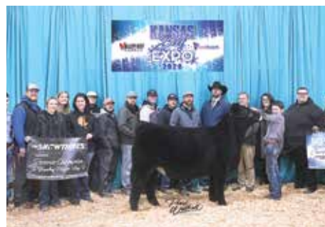
2021 KS BEEF EXPO RESERVE SUPREME CHAMPION BREEDING HEIFER Full Sister to Lots 1-4

Miss CCF Grace is a beautiful profiling female that is elevated about her chest floor, bold ribbed, and offers a long and smooth muscle pattern. She will make a tremendous senior yearling!