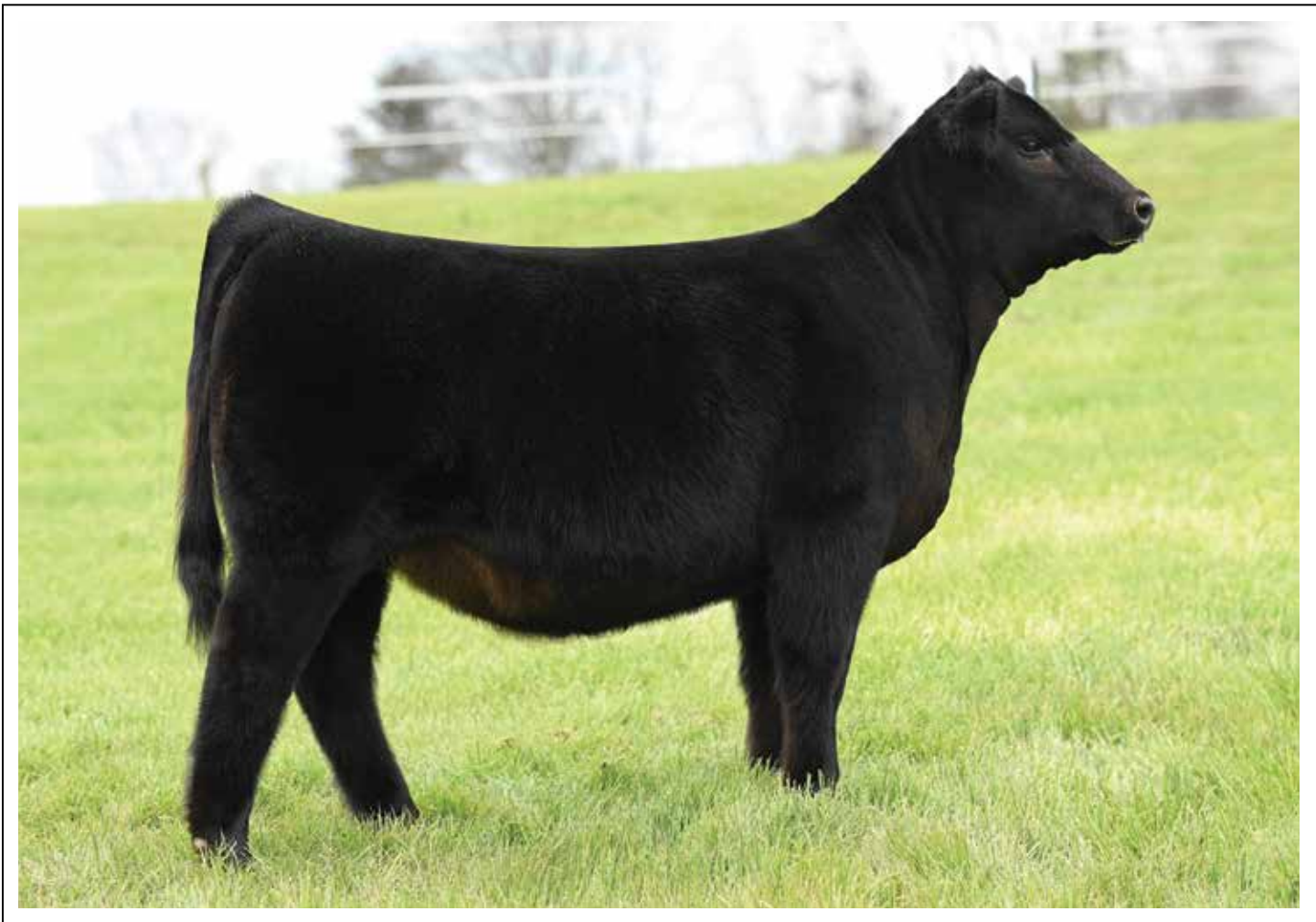
Lot 1 - MISS CCF IMPRESSION