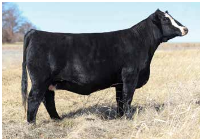
MISS CCF SHEZA SUPERSTAR Dam of Lots 55-57

PE 6/15/21 to 9/15/21 to T-T Judge H412 (ASA: 3749749).