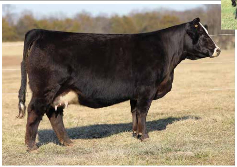
Lot 62 M2C HEIDI 205H

Lot 62A: Heifer Calf sired by MR CCF The Duke (ASA: 3583413). Born 2/5/22.