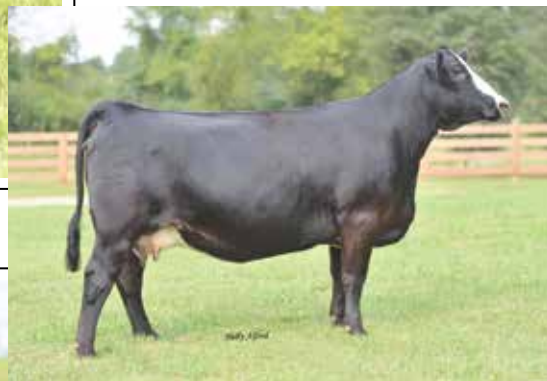
MISS CCF BLOWN AWAY Dam of Lots 15 & 16

This is one that has caught the eye of many that has looked through the sale heifers. Her overall mass and dimension is something to admire but what is truly impressive is the way she handles this when out on the move. With all this added substance she still looks like a lady. Very square and good footed with an awesome pin set. Her dam is sired by the now deceased MR CCF 20-20 and is one of the up-and-coming donors here at C&C Farms and owned with the Lamberth family. Awesome pedigree on the top and bottom side of this young female. Seller retains the right to 1 successful flush with a minimum of 6 transferable embryos. Work to be done at the buyer's convenience and the seller's expense.