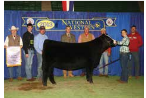
MISS CCF SHEZA BONNIE Y61 2013 NWSS Reserve Grand Champion Female & Dam of Lot 37

This fancy 3/4 blood The Duke daughter has caught the eye of many around the farm. The word intriguing comes to mind when studying this one. Her structure is flawless, but she comes by that honestly as the heritability of this trait from her National Champion mother is strong. The skeletal build and overall design of J608 has us excited about how she will mature as a bred heifer, we think she could be a big-time player on the tanbark.