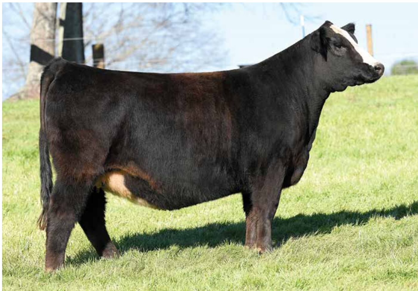
Lot 42 MISS CCF JESTRESS H11