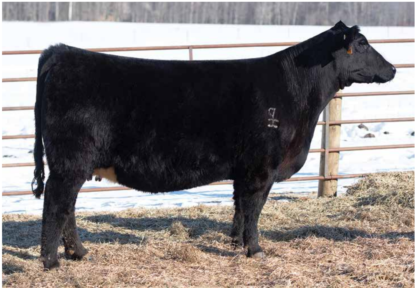
Lot 60 WPCc SHES THE DREAM H613