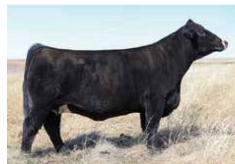
MISS CCF DREAMING Dam of Lot 32

Double Down worked extremely well for us over the past year and this female is no exception. J148 is a 3/4 sib to our high selling female in the 2021 Clear Vision spring sale commanding $19,000. J148 is a bit younger and green but has all the parts to make a great show heifer. The purebred side of the breed is as tough as ever and we believe she can hold her own. J148 is so soft haired for a purebred, while being sound structured and good looking. Her mother was an awesome show heifer for Madison McDaniel, and we fell she will follow right in her footsteps.