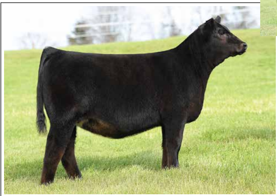
Lot 16 BLOWN APART

This one has the fresh front one third that Blown Away had as a baby, but with more volume and shape in her hip, body, and flank area. This one will be easy keeping and will make one incredible cow after her show career is done. Kid friendly!