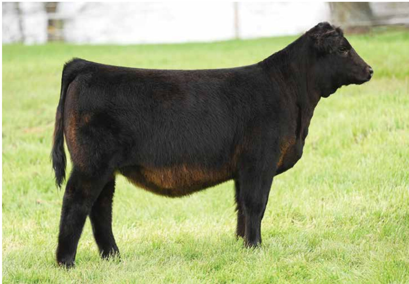
Lot 5 MISS CCF EVIDENT

Out of the Jestress B79 "Diddo" donor and sired by W/C Executive Order 8543B... the mating that keeps on giving! Full sibs have won across the nation. A few wins to mention, Reserve Champion Percentage female 2019 Jr. Nationals, Supreme Champion female 2019 Georgia National Fair, Champion Percentage bull 2021 Simmental Breeders Sweepstakes. Past the banner hanging these females and herd sires are going on to write their own stories in the programs they are working for. Evident has some big shoes to fill but she is up for the challenge. One major attribute to the B79 progeny is that they just get better with time. When you have the quality build that this one has, you can only move forward. Her head, neck, and shoulder blend together very well. The hip, pin width, and hind leg set is on point and her center body matches the build. It's EVIDENT that she is up for any task.