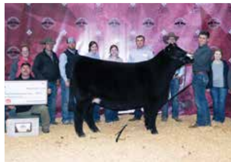
RESERVE SUPREME CHAMPION FEMALE Full Sister to Lots 1-4

Miss CCF Romance has the extra bells and whistles that it takes to be a dominant force, much like her full sister that was selected as the Supreme Champion Female at the 2022 Georgia National. Romance has the unique parts and pieces to find the backdrop when it truly counts!