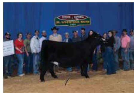
MISS CCF JESTRESS H301 2022 GEORGIA NATIONAL SUPREME CHAMPION FEMALE Full Sister to Lots 1-4