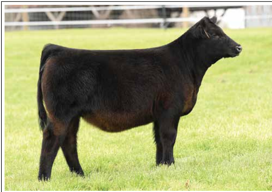
Lot 31 DADC DREAM CHASER 2106J