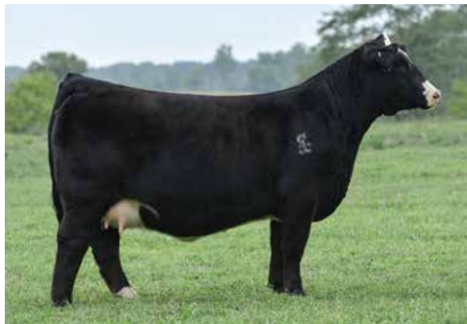
S/P TRUE LOVE F789 Full Sister to Dam of Lot 65