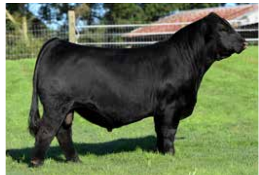
MR CCF PRIORITY Full Brother to Lot 63