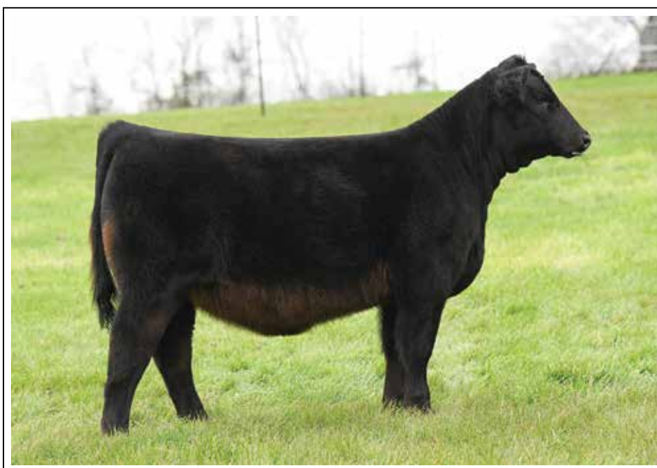
Lot 14 SCSF TIMELESS

SCSF Timeless is an ultra-complete three-quarter blood SimAngus female that is sired by MR CCF The Duke and backed by the full sister the Miss CCF Jestress B79. Miss AF Blaze is a stunning daughter of the legendary JAS Jestress 9015, that upholds the family tradition of phenotypic excellence. Timeless is flawless at the ground, bold ribbed, deep sided, and offers a super cowy and productive look of quality. This female will be competitive on the tan bark, and even more valuable in production to create the next generation of elite Purebred seedstock. Timeless combines the most prolific cow families at C&C Farms in a single pedigree... help yourself to a unique investment opportunity!