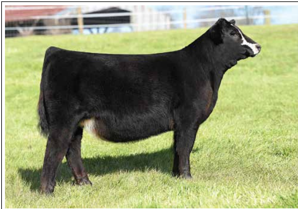
Lot 13 MISS CCF STORM

Sired by JSUL Something About Mary 8421, "SAM" and out of the Miss AF Blaze donor. This baldy female is super complete in her build. One that is hard to pick a major hole in. Sound on her feet and legs, awesome turn to her rib with that long elegant front one third. Her dam Blaze is a full sib to the Jestress B79 donor. Maternal sibs have sold well in the past sales at $11,000 and $10,000. Promising future with a pedigree for the times.