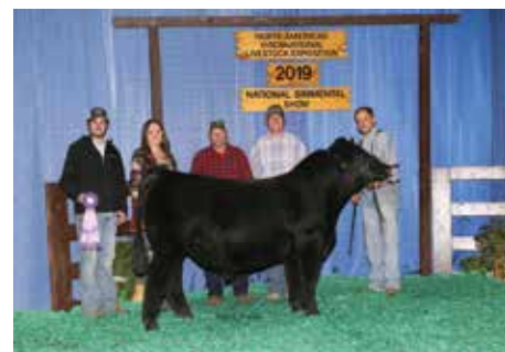
MR CCF THE DUKE Sire of Lot 14

SCSF Timeless is an ultra-complete three-quarter blood SimAngus female that is sired by MR CCF The Duke and backed by the full sister the Miss CCF Jestress B79. Miss AF Blaze is a stunning daughter of the legendary JAS Jestress 9015, that upholds the family tradition of phenotypic excellence. Timeless is flawless at the ground, bold ribbed, deep sided, and offers a super cowy and productive look of quality. This female will be competitive on the tan bark, and even more valuable in production to create the next generation of elite Purebred seedstock. Timeless combines the most prolific cow families at C&C Farms in a single pedigree... help yourself to a unique investment opportunity!