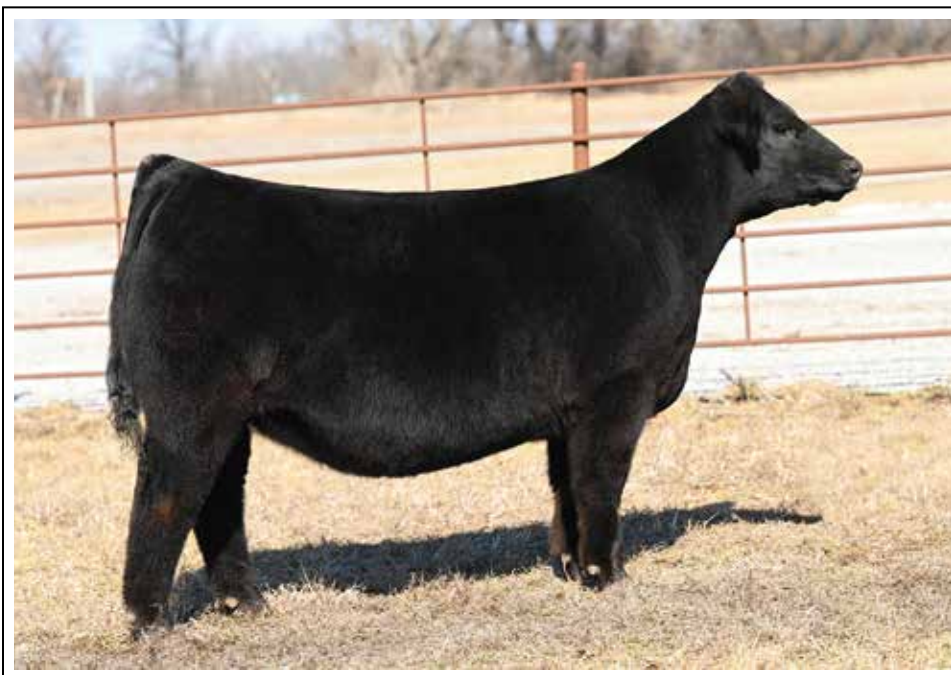
Lot 38 T-T BLACKBIRD J09

8003 is the lead donor and matriarch of the T-T females. This female is huge ribbed, great fronted, and has a ton of eye appeal. Her full sister was a past high seller for us and went on to win the Missouri State Fair FFA Junior show in 2020 along with another full sister being Reserve Champion Missouri State Fair 4-H female in 2020. This female has a first-year showman attitude, with senior year quality.