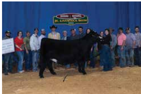
2022 GEORGIA NATIONAL SUPREME CHAMPION FEMALE Full Sister to Lot 43

It's no secret that Jestress B79 has a special place in the donor pen here at C&C Farms. She is just flat getting it done with the progeny she is producing. Essential is one that we look at every time we walk in the bred pen. Her structure is phenomenal, she has a huge sweeping spring of rib and is beautiful in her build. Her full sister was selected Reserve Champion Percentage Female at the 2022 Cattleman's Congress in the Jr. & Open Show. She is due to calve to MR CCF The Duke before sale day. Join in on the fun and make sure to study this lady on sale day!