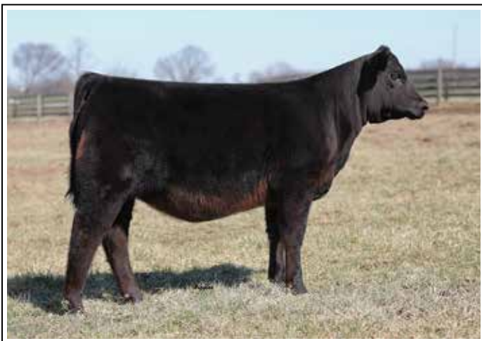
Lot 41 WOMACK SOUTHERN LUCY 1216

This heifer is sired by SCC SCH 24 Karat 838. A bull that is currently putting as many competitive cattle in the show ring as any one sire. This middle of October heifer calf is still lean in her condition. She is beautiful necked, long topped, out of a tremendous donor dam sired by the past sire of the year Leachman Saugahatchee.