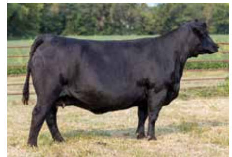
FBF1 BLACKBIRD Dam of Lot 20

J204 has the parts to make an extremely fun show heifer project and even more productive cow. She has the wow factor frontend, with a huge center body and great running gear. Her donor dam, A203, has been as productive a female as any at T-T and this female only adds to this great cow family's legacy. J204 is super gentle and should work for any junior project.