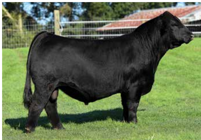
MR CCF PRIORITY Full Brother to Lot 5