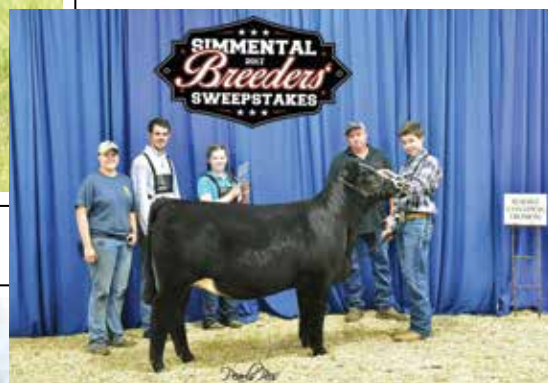
MISS CCF DOUBLE D D101

This pays to believe daughter of Miss CCF Double D D101 is awesome haired and just as sound as her mom was. Very symmetrical and balanced as they come. She's way laid back and is the one for a first-year showman. We're not crazy about selling this one because we can't find any faults with her and know she will produce just like her mother.