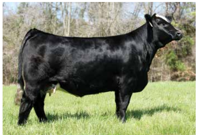
MISS CCF SHEZA LOOKER

The Fantasy N906 matriarch is one that truly got us started in the Simmental breed. Going on 20 plus years old and still producing daughters that are the cattlemen's kind. This Vision daughter is striking in her overall appearance and elegant when put on the move. She is building a beautiful udder and was bred to MR CCF Re-Run, an Executive Order x Jestress B79 son. PE 4/10/21 to 6/20/21 to MR CCF Re-Run (ASA: 3741890).