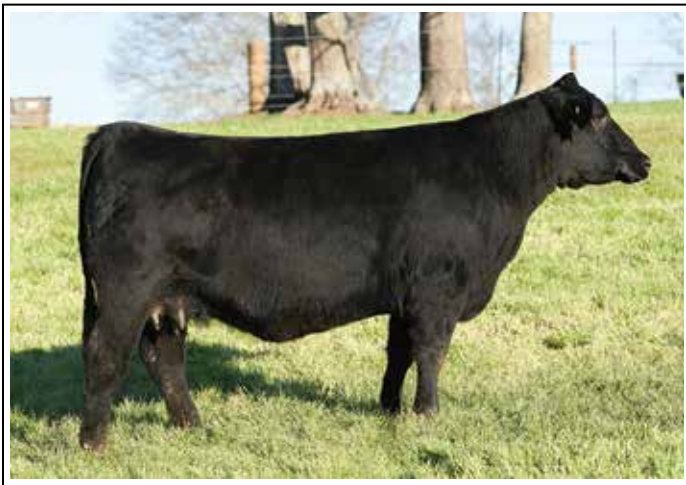
Lot 51 MISS CCF BLOODLINE

Lot 50A: MR CCF K1 (ASA: 4013392). Bull calf born on 2/2/22 sired by MR CCF Re-Run.