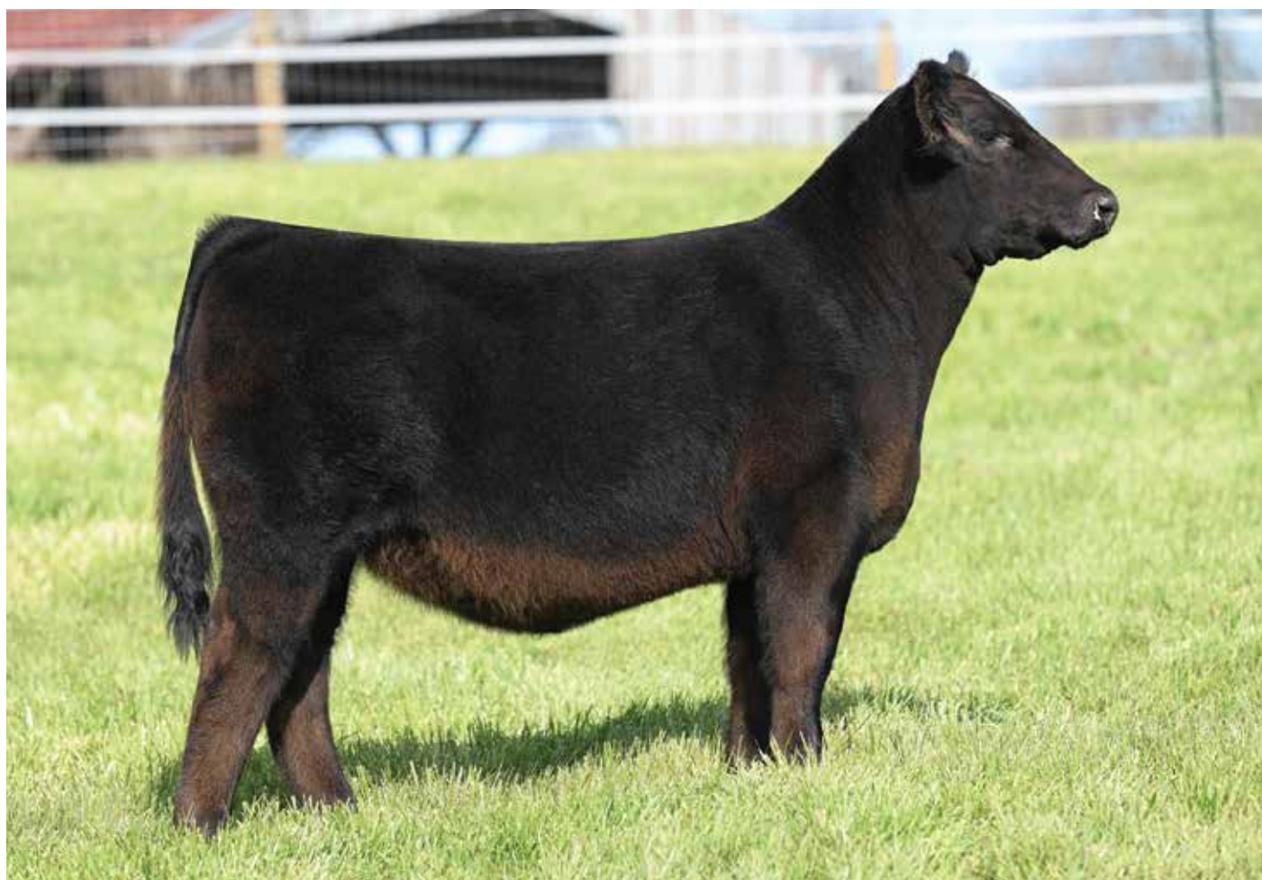
Lot 11 MISS CCF UNWOUND

Lot 11 MISS CCF UNWOUND BD: 10/1/21 ASA: 4013146 TATTOO: J215 W/C LOADED UP 1119Y MR HOC BROKER W/C BANKROLL 811D MISS CCF JESTRESS C102 MISS WERNING KP 8543U JAS JESTRESS 9015