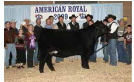
RP/MP RIGHT TO LOVE 015U