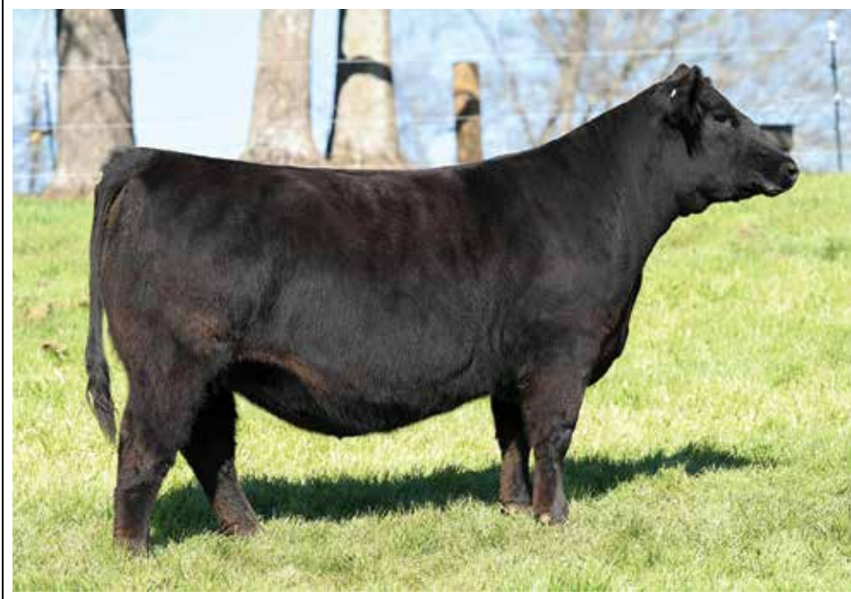
Lot 58 TGF SHINING STAR

This 20-20 daughter has already been in the champion spotlight. Shining Star and her dam were slapped Champion Purebred Cow/Calf at the 2019 Simmental Breeders Sweepstakes Open Show. In typical 20-20 fashion this one has done nothing but improve and get better since then. She's one heck of a feature in the sale pen. Awesome in her lines, perfect in her structure and sow bellied! Buy with confidence on this one. She's the money generating kind!