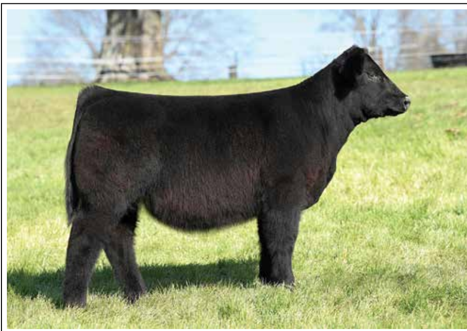
Lot 18 MISS CCF FORGIVENESS

Forgiveness has been a favorite since birth. Her mother is becoming one of our rising donors here at the farm because of her ability to produce high quality cattle but also her versatility when it comes to choosing matings. We chose to mate the upcoming Can't Touch This herd sire to the Panda donor and these two females in this sale show nothing but true potential. She stomps the ground with a big sound foot and pastern and does it in a graceful form. Let's just add that she is dang good looking while she's on the move. Big square hipped, plenty of rib shape and has awesome hair.