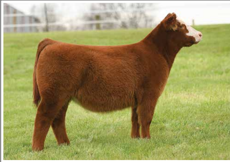
Lot 17 MISS CCF HONEY PAIN

The demand for elite red hided cattle continues to surge, and females like Miss CCF Honey Pain are a prime example of this trend. We absolutely love this TMAS Can't Touch This 8513F sired daughter of Miss CCF Panda that will be a dominant force in the SimAngus division early and often. She exemplifies skeletal quality, presence, and balance from every angle. Her dam, Miss CCF Panda, was a competitive show heifer, and has turned into a role model in the donor pen. Can't Touch This progeny offer the added feature and form necessary to find the winners circle at the most competitive stock shows in the nation. Bid with confidence!