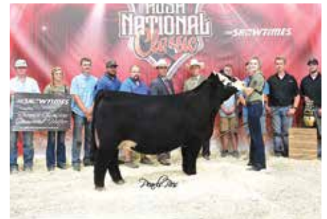
S/P TRUE LOVE F789 Maternal Sister to Lot 59

H55 is a maternal sister to the 2020 AJSA National Classic Grand Champion Female, backed by the influence of the legendary 015U matron. She is sired by HTP/SVF Duracell T52, making her a three-quarter sister in blood to both Quantum Leap and Love Boy! A unique pedigree to compliment her added quality and style.