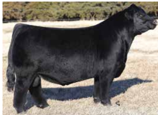
JSUL SOMETHING ABOUT MARY Sire of Lot 21