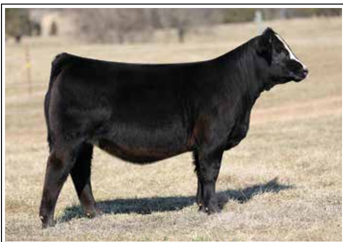
Lot 28 M2C JOLENE 236J

M2C Juliet 237J is another member of the great SVF Above & Beyond T87 cow family via the influence of M2C PHFC Above & Beyond 187Y. This late October Purebred is also supported by the Remington Lock N Load 54U influence on the maternal side of her pedigree. She is one of the youngest females in the entire offering, but her quality and the influence of lineage is sure to make her an attraction sale day.