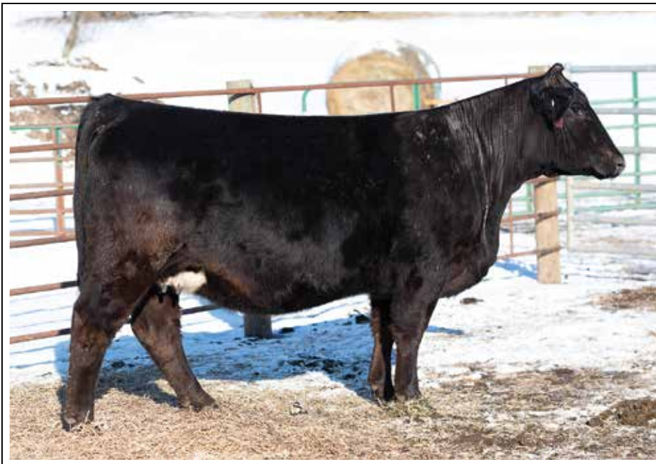
Lot 59 S/P RIGHT IN LOVE H55