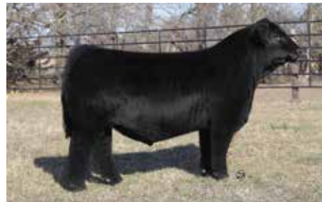
FRKG VICTORY 78J $210,000 Son of Mr CCF 20-20