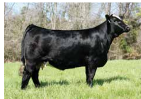
MISS CCF SHEZA LOOKER 3rd Generation Dam of Lots 31 & 32