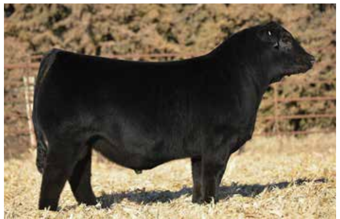
FRKG CKCC PLATINUM 009H ET $175,000 Sire of Embryos Selling