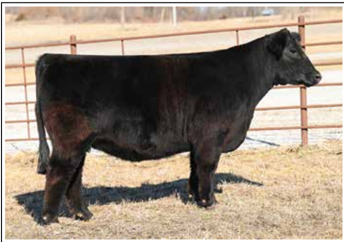
Lot 55 T-T SUPERSTAR H152

Lot 55 T-T SUPERSTAR H152 BD: 5/10/20 ASA: 4013162 TATTOO: H152