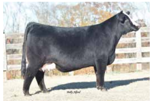
MISS CCF JESTRESS B79 Dam of Lot 63