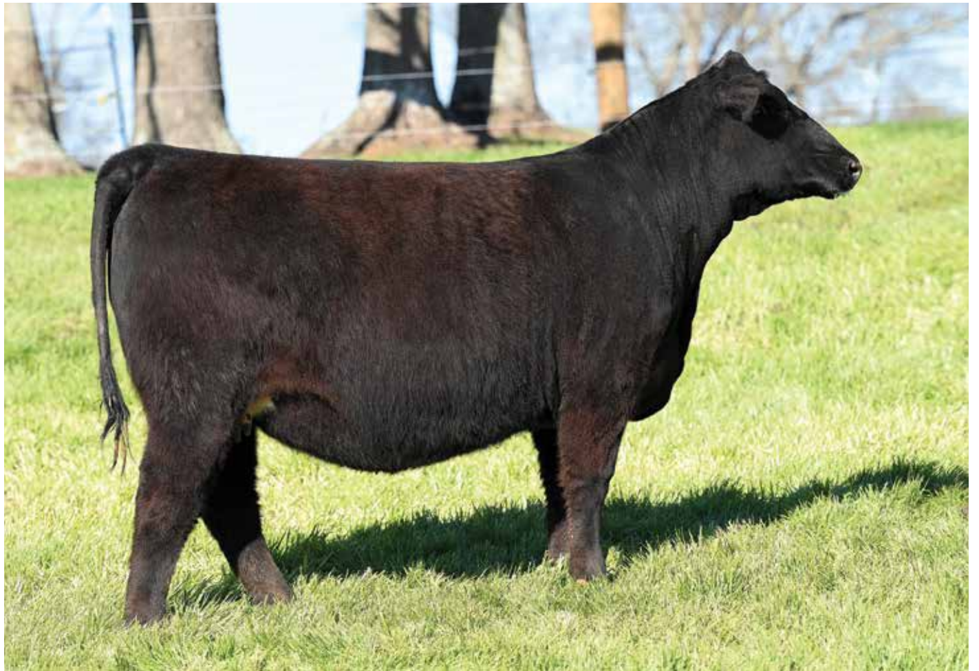
Lot 43 MISS CCF ESSENTIAL 5H

Lot 43 MISS CCF ESSENTIAL 5H BD: 5/10/20 ASA: 3855556 TATTOO: 5H HPF QUANTUM LEAP Z952 FBF1 COMBUSTIBLE WLE COPACETIC E02 MISS CCF JESTRESS B79 CMFM JOY 02ZB JAS JESTRESS 9015