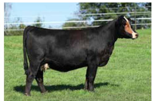
MISS CCF RED EYE G89 $17,500 Maternal Sister to Lot 30