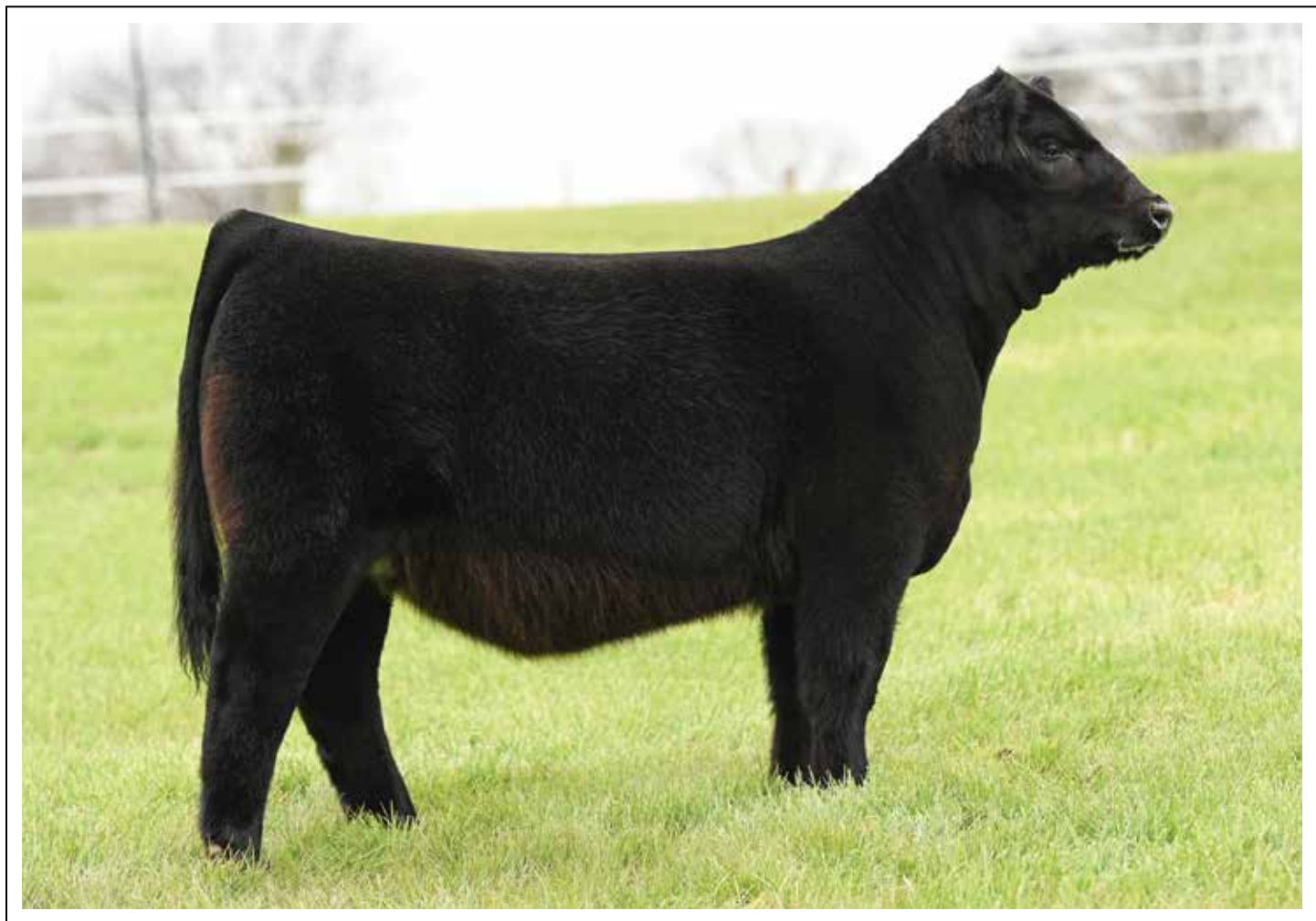
Lot 2 - MISS CCF DIGNITY