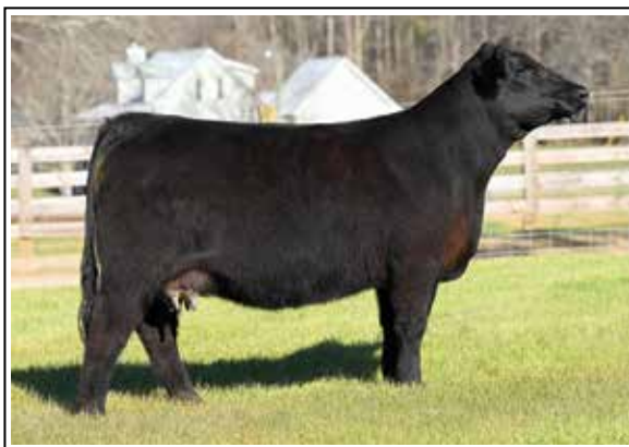
Lot 44 SCSF DEBRA

The Double D donor is making paving her own way to top. Debra is the first progeny of the Double D donor to hit production and she hasn't disappointed. This Quantum Leap daughter is big footed, stout built while still having the look of a lady. She is raising a purebred MR CCF The Duke baldy heifer that is a true standout! Lot 44A: SCSF Chilly (ASA: 4013428). Heifer Calf born 2/10/22 sired by MR CCF The Duke.