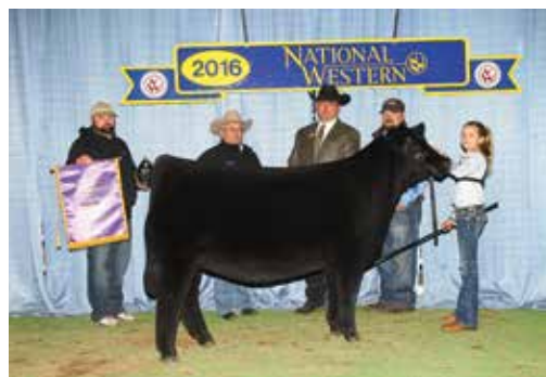
DAF REBA C85 Dam of Lot 64