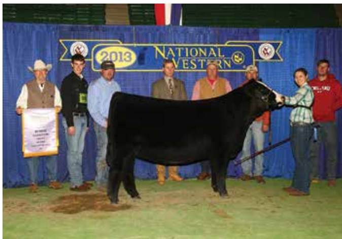
MISS CCF SHEZA BONNIEY61

Lot 51A: MR CCF J357 (ASA: 4013390). Bull calf born on 11/6/21 sired by Reckoning 711F.