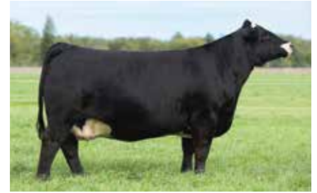
HPF RIGHT TO LOVE 283C