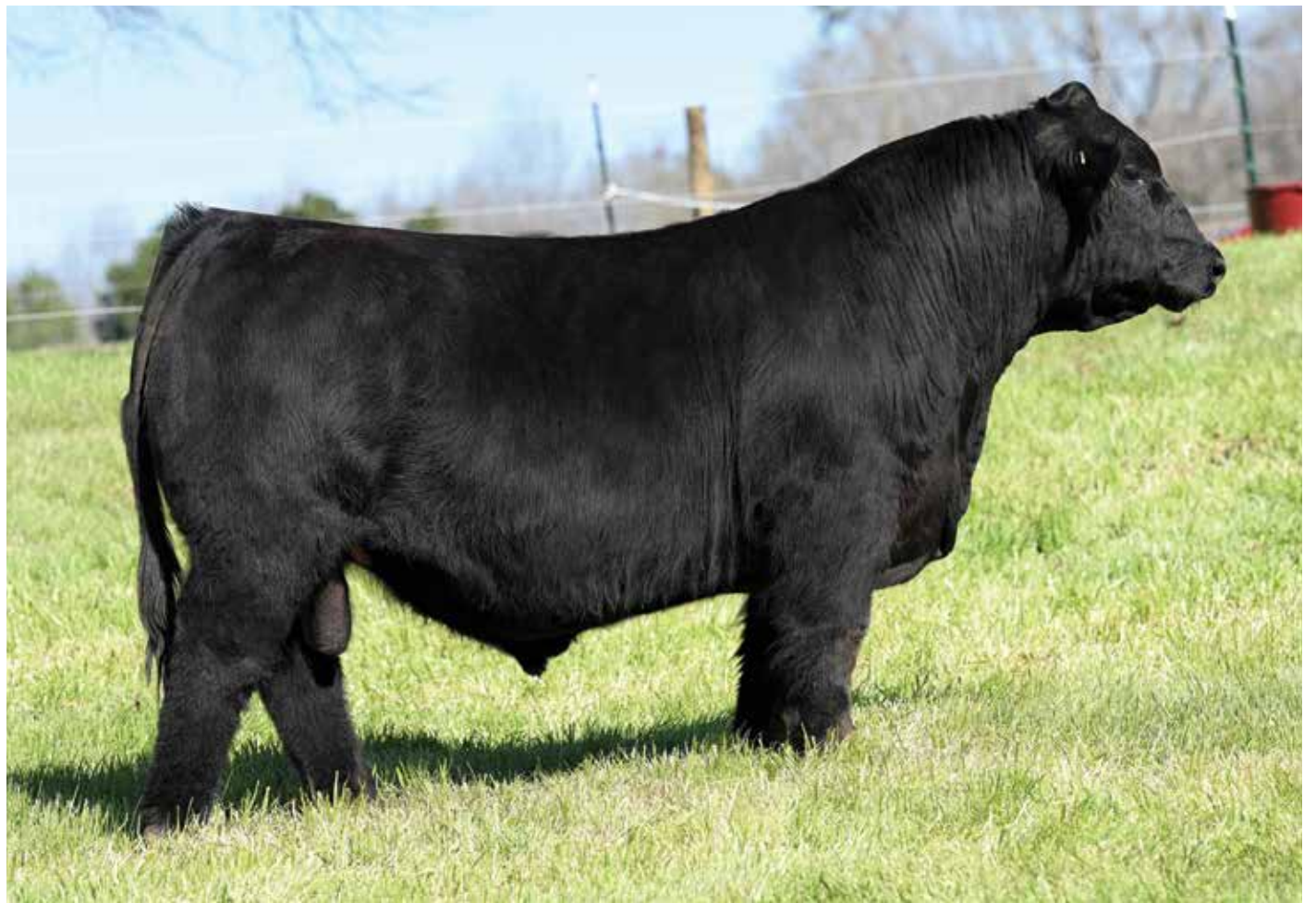
Lot 63 MR CCF COMPASS