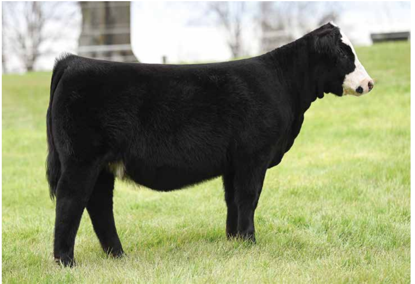
Lot 30 MISS CCF SOUTHERN STAR