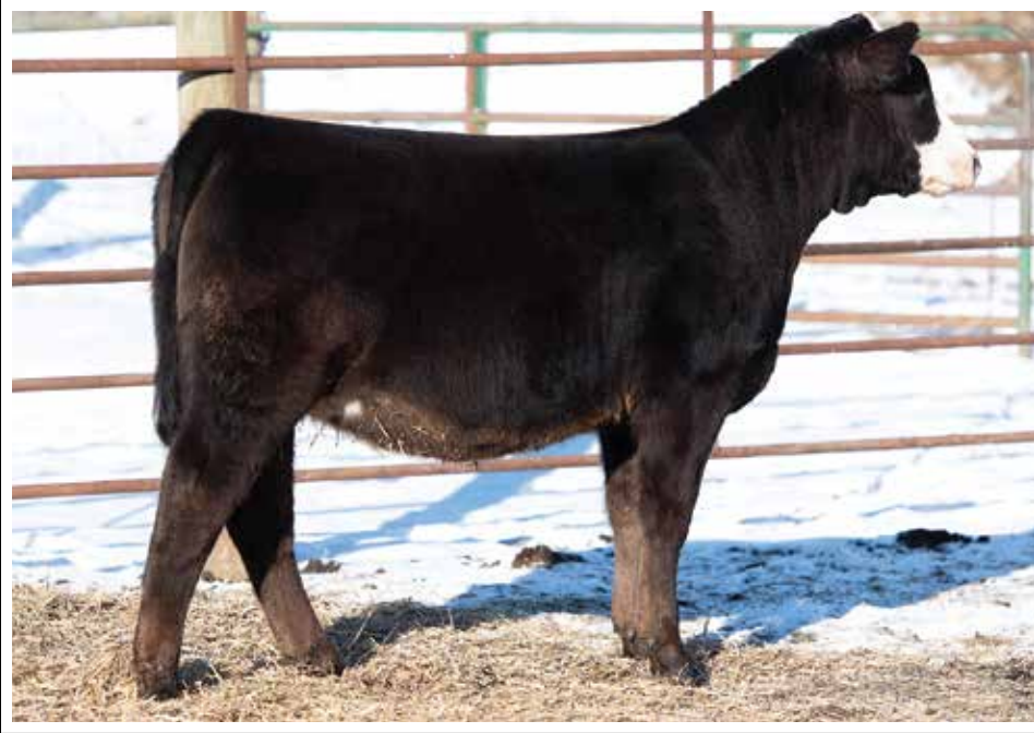
Lot 33 S/P LOVELY J30