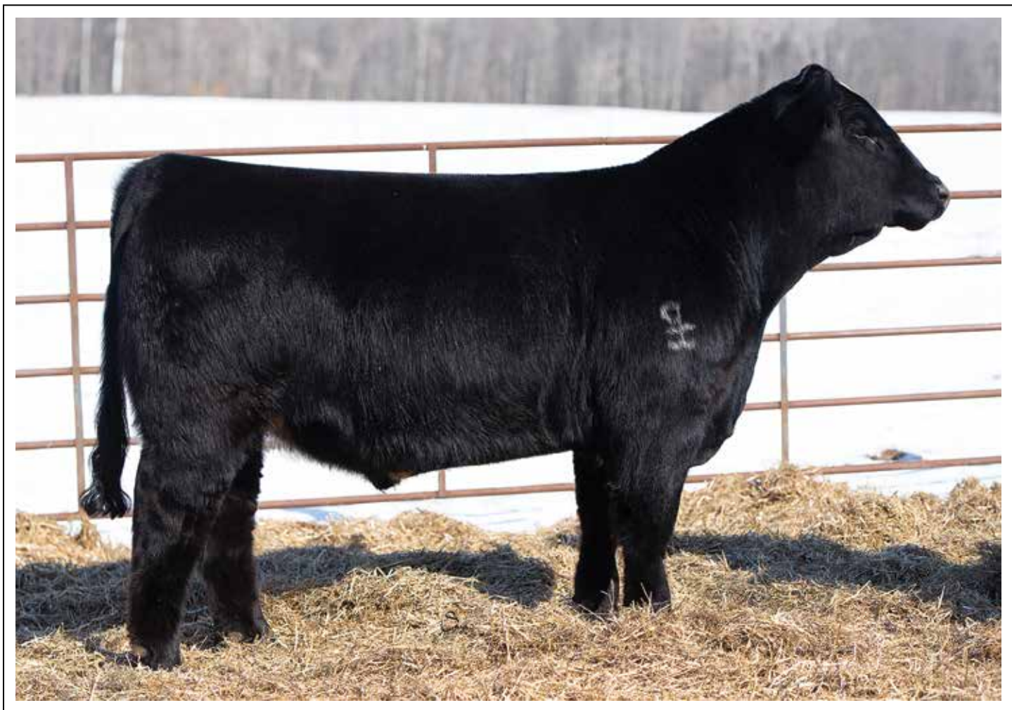
Lot 65 WPC HAMMERTIME J712

WPC Hammer Time J712 is a stylish Purebred bull that offers a moderate 65 pound actual birth weight to accompany his double digit CE EPD. He is smooth made, clean jointed, and moderate framed. The dam of J712 is a full sister to the 2020 AJSA National Classic Reserve Grand Champion Purebred Heifer. A potential heifer safe option that combines some of the elite cow families in the breed.