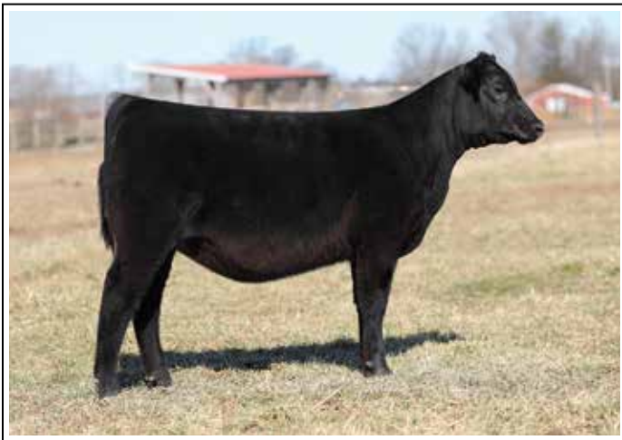
Lot 40 WOMACK SOUTHERN 24 KARAT 1253

Just a November heifer calf and a direct daughter of Dameron First Class. A bull that has had more influence than any one bull in the show ring for the past 15 years. This heifer is extremely complete with a great look through her front end, big bodied, square hiped. This heifer has a lot of potential!