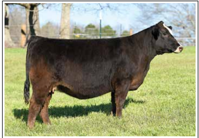
Lot 47 MISS CCF RADIANCE

A full sib to the now deceased MR CCF 20-20! We really should be keeping this one back in the herd. Extremely good in her overall build and design. Big centered with sound feet and legs. Genetically enhanced with the look of a female. Proven genetics here! Due to calve to WLE Copacetic before sale day. AI Bred to WLE Copacetic E02 (ASA: 3299037). Due prior to sale day.