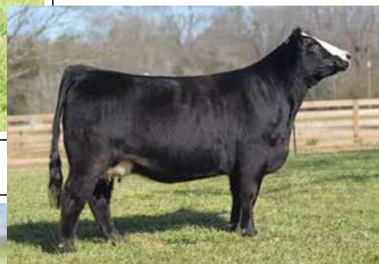
MISS CCF SUGAR AND SPICE

When the Lamberth family purchased the dam of Mirror, Miss CCF Double D, we had very high expectations for her. Not only what we thought she could win as a show heifer but what she could achieve as a donor. Well, let's just say, the day we clipped Mirror out all we could picture was her mother at that age. This Relentless daughter is wicked cool about her front third in how she ties together about her head and neck. This size of this female's foot, bone and structure is crazy for the elegant look that she gives yet she doesn't give up the adequate belly shape. She gets our hearts pumping every time we walk in the sale pen.