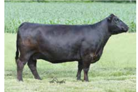
CHAMPION HILL BLACKBIRD 8003 Dam of Lot 19

The backbone of T-T 8003 does it again. We were excited to see how W/C Double Down would work on her and man are we glad we decided to flush her this way. J10 is so cool looking from the profile with added shape and dimension for a half-blood. She excels in foot shape and bone, with added shape through her middle and a great disposition to boot. 8003 is a no miss type female and J10 has us extremely excited.