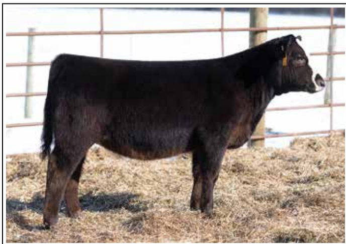
Lot 35 WPCC STAR J23

WPCC Star J23 is a brockle faced September born Purebred that is long fronted, angular in her shoulder design, strong topped, and square hiped. J23 combines the National Champion influence of both TJSC Hammer Time 35D and HILB/SHER Data Breach. A pedigree rich in history and tradition!