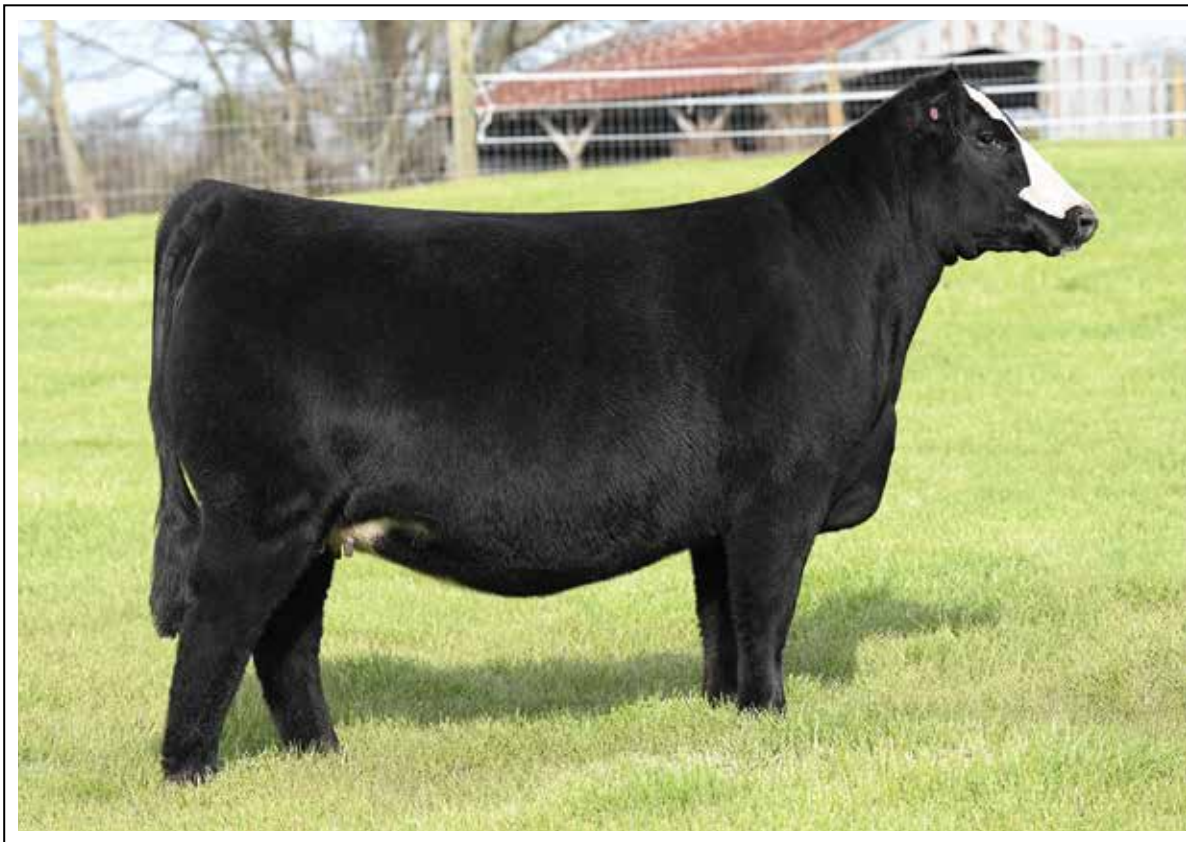
Lot 45 MISS HATTIE MAE H21