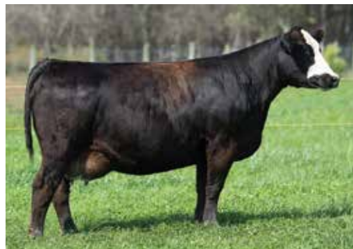
WPCC STAR STRUCK G235