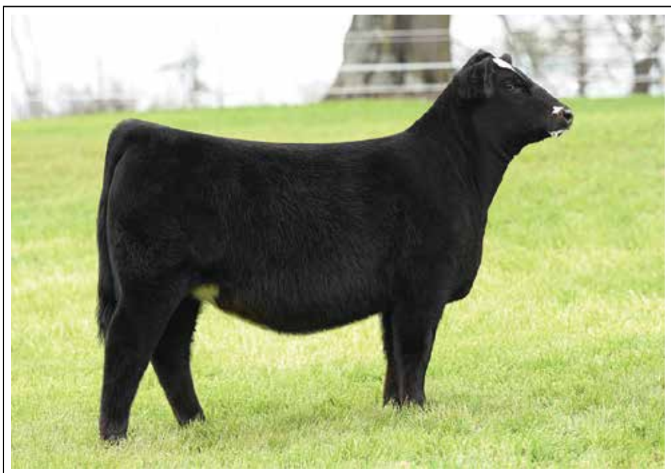
Lot 4 MISS CCF GRACE

Miss CCF Grace is a beautiful profiling female that is elevated about her chest floor, bold ribbed, and offers a long and smooth muscle pattern. She will make a tremendous senior yearling!