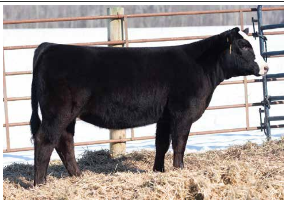
Lot 34 S/P LOVER J880