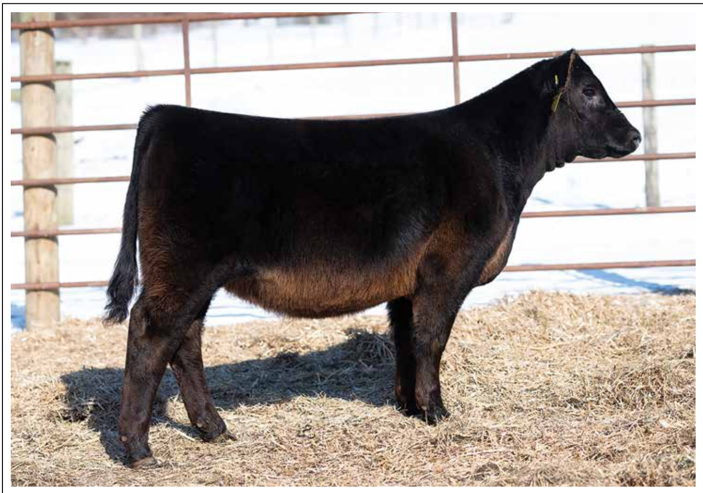
Lot 21 MMCC WPCC DAZZLE J122

Lot 21 MMCC WPCC DAZZLE J122 BD: 11/20/21 ASA: 4015034 TATTOO: J122 W/C RELENTLESS 32C W/C UNITED 956Y JSUL SOMETHING ABOUT MARY 8421 DAMAR DAZZLE D122 JBSF PROUD MARY DAMAR DAZZLE Z136