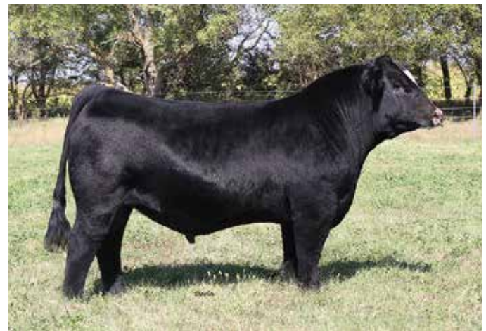
MR CCF 20-20

The Dew The Stroke donor has been a huge asset to our success in the Simmental business. She adds that extra extension and look with the longevity factor. This baldy Vision daughter is long throughout her hip and is very long and elevated through her front one third. PE 4/10/21 to 6/20/21 to MR CCF Re-Run (ASA: 3741890).