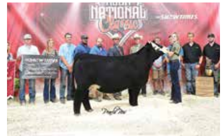
2020 AJSA NATIONAL CLASSIC RESERVE GRAND CHAMPION PUREBRED FEMALE