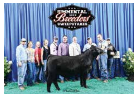
MR CCF THE DUKE Sire of Lot 54A

A direct daughter of the past National Champion Miss CCF Sheza Looker. One of the mainstay donors here at C&C Farms! The Relentless progeny are thriving throughout the country and are proving to not only be competitive show stock but the cattlemen's kind out in the field. She is raising a nice MR CCF The Duke bull calf at side. Lot 54A: MR CCF J358 (ASA: 4013153). Bull calf born 12/15/21 sired by MR CCF The Duke.