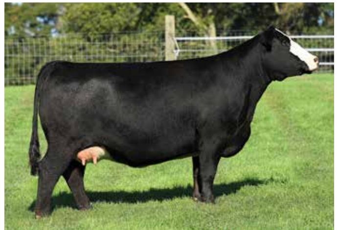
MISS CCF EMPRESS E40 Full Sister to Dam of Lot 46