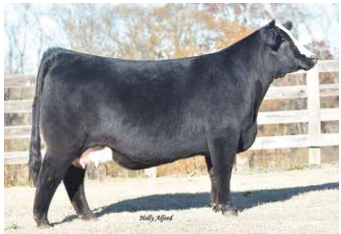
MISS CCF JESTRESS B79 Dam of Lots 1-5