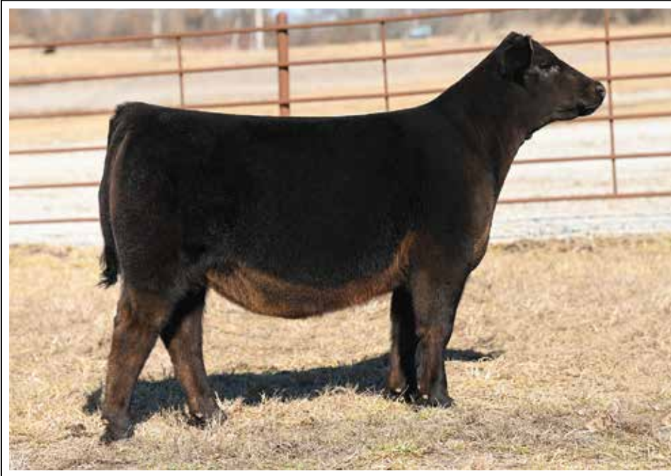
Lot 19 T-T BLACKBIRD J10

The backbone of T-T 8003 does it again. We were excited to see how W/C Double Down would work on her and man are we glad we decided to flush her this way. J10 is so cool looking from the profile with added shape and dimension for a half-blood. She excels in foot shape and bone, with added shape through her middle and a great disposition to boot. 8003 is a no miss type female and J10 has us extremely excited.