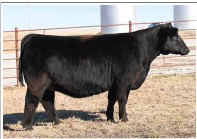
Lot 56 T-T SUPERSTAR H151

PE 6/15/21 to 9/15/21 to T-T Judge H412 (ASA: 3749749).