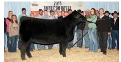
M2C/PHF ETERNITY 414B 2015 AMERICAN ROYAL GRAND CHAMPION PUREBRED FEMALE $140,000 Maternal Sister to Lots 25 & 26

We initiate the Purebred division of the 2022 Clear Vision Spring offering with a direct daughter of the legendary SVF Above & Beyond T87 that is sired by the $205,000 W/C Bankroll 811D. We love the build, design, and skeletal quality that she represents. She is long sided, loose built, and comes to town ready to hit the road. She is a maternal sister to countless champions and high sellers, including the $140,000 Eternity that was selected as the 2015 American Royal Grand Champion Purebred Heifer for Miranda Raithehl of Nebraska. A unique pedigree that combines two of the most dominant producing females in the history of the breed!