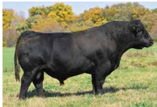
FHEN HALFTIME A127 Sire of Lot 64