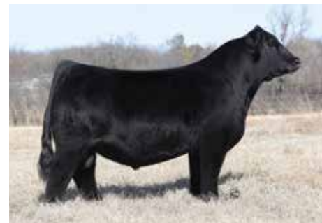
WHF/JS/CCS DOUBLE UP G365 Service Sire to Lot 53

Circle T Bonnie H13 is a beautiful profiling daughter of the late WS Pilgrim H182U that is backed by the stunning Miss CCF Sheza Bonnie Y61, the many times National Champion. H13 is tremendous in terms of her build, with exemplary udder quality. A unique breeding piece that deserves serious consideration on sale day! Lot 53A: Heifer Calf sired by WHF/JS/CCS Double Up G365 (ASA: 3658592). Born 2/23/22.