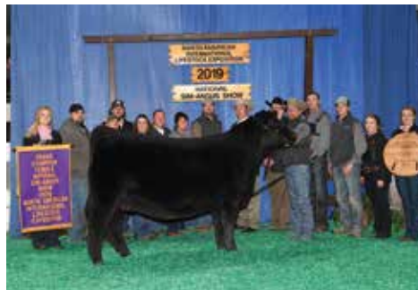
JSUL DREAM BIG 8992F 2019 NAILE GRAND CHAMPION PERCENTAGE SIMMENTAL FEMALE Full Sister in Blood to Lot 60