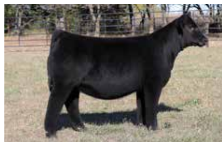
TMAS CKCC JEWEL 1691J $50,000 Daughter of Mr CCF 20-20