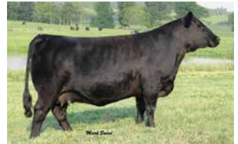
SVF ABOVE & BEYOND T87 Dam of Lots 25 & 26

This beautiful Copacetic daughter is an intriguing three-quarter blood female that is backed by the cornerstone female of Metzger Cattle Company, SVF Above & Beyond T87. Above & Beyond is one of the most timeless females in the business when considering the impact that she has had on the business for the last decade. This October show heifer prospect offers a flawless design in terms of her structure from the ground up, remains flexible in her spine, and posses with a look of quality that is hard to ignore. Pay attention here... this female has the parts and pieces to be a big-time contender in the percentage division!