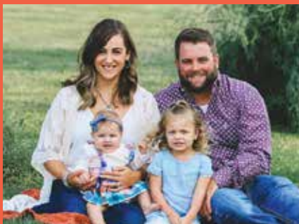
The Templeton Family