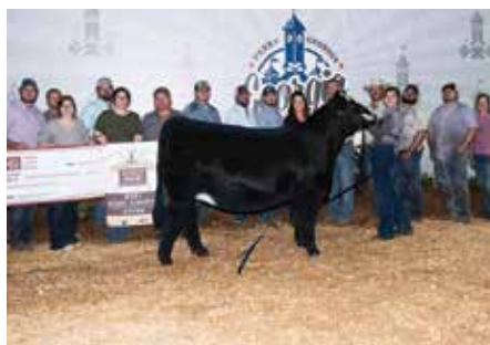
MISS CCF JESTRESS H301 Full Sister to Lots 1-4