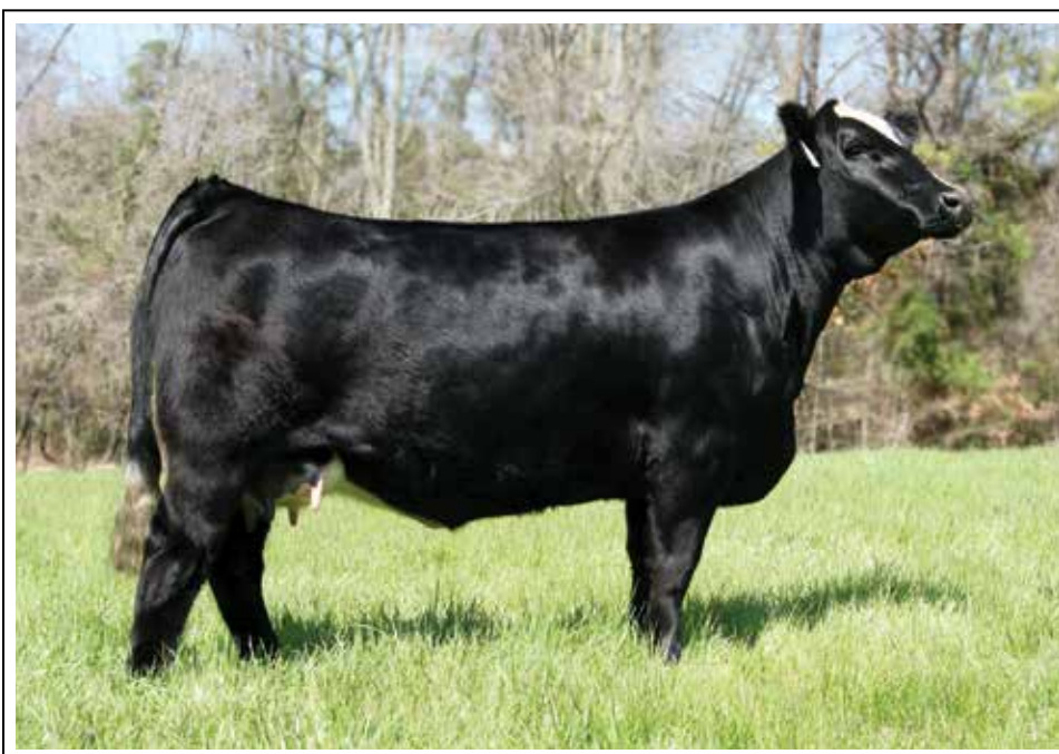
MISS CCF SHEZA LOOKER Dam of Lot 54

A direct daughter of the past National Champion Miss CCF Sheza Looker. One of the mainstay donors here at C&C Farms! The Relentless progeny are thriving throughout the country and are proving to not only be competitive show stock but the cattlemen's kind out in the field. She is raising a nice MR CCF The Duke bull calf at side. Lot 54A: MR CCF J358 (ASA: 4013153). Bull calf born 12/15/21 sired by MR CCF The Duke.