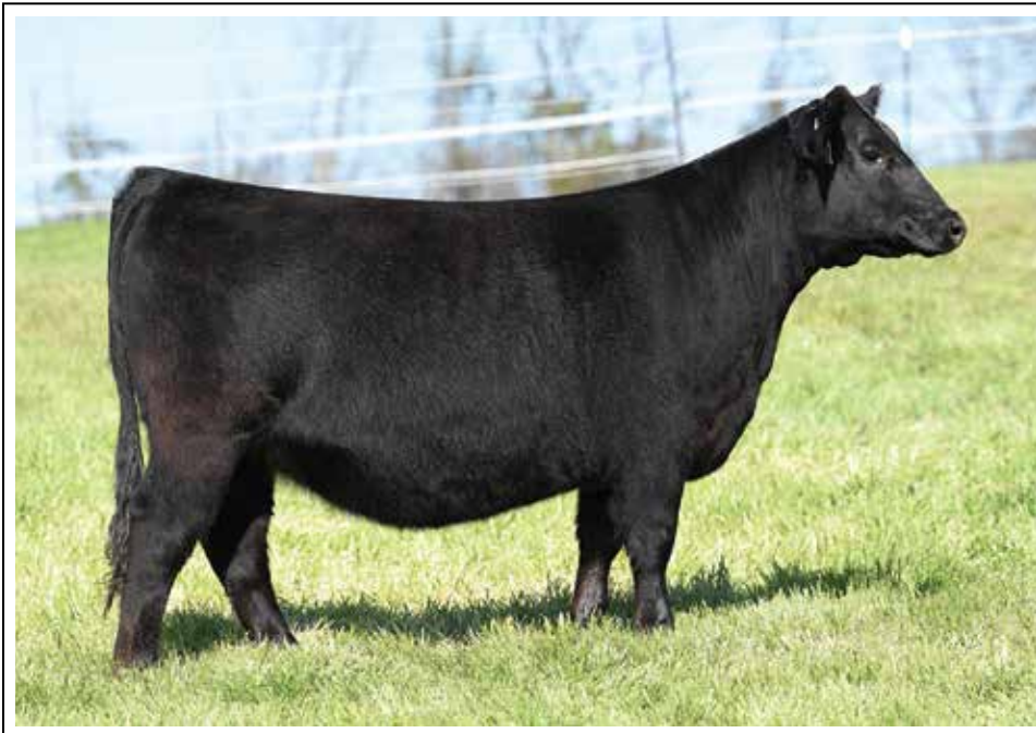
Lot 37 MISS CCF BONNIE J608

This fancy 3/4 blood The Duke daughter has caught the eye of many around the farm. The word intriguing comes to mind when studying this one. Her structure is flawless, but she comes by that honestly as the heritability of this trait from her National Champion mother is strong. The skeletal build and overall design of J608 has us excited about how she will mature as a bred heifer, we think she could be a big-time player on the tanbark.