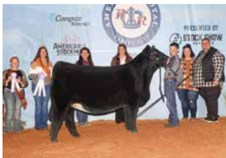
2021 AMERICAN ROYAL RESERVE GRAND CHAMPION PERCENTAGE SIMMENTAL FEMALE Full Sister to Lots 1-4