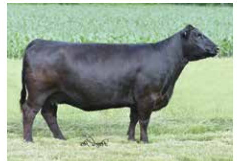
CHAMPION HILL BLACKBIRD 8003 Dam of Lot 38

8003 is the lead donor and matriarch of the T-T females. This female is huge ribbed, great fronted, and has a ton of eye appeal. Her full sister was a past high seller for us and went on to win the Missouri State Fair FFA Junior show in 2020 along with another full sister being Reserve Champion Missouri State Fair 4-H female in 2020. This female has a first-year showman attitude, with senior year quality.