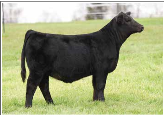
Lot 22 ELMR LACEY'S VISION 109J