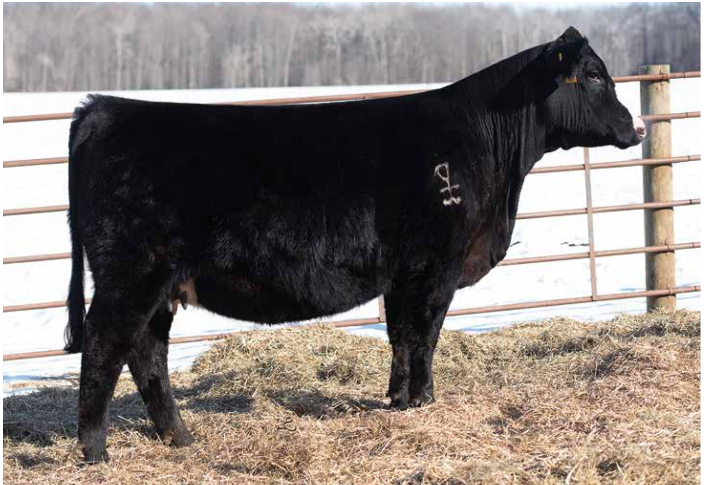
Lot 46 WPCC JESTRESS H995

Here is a very attractive, smooth built daughter of the late MR CCF 20-20 that is backed by the time-tested MR HOC Broker x JAS Jestress 9015 mating that has produced so many champions, high sellers, and individuals of influence. This genetic combination is certain to be a homerun in production for any progressive operation! AI Bred on 5/21/21 to WHF/JS/CCS Double Up G365 (ASA: 3658592). Estimated due 2/27/22.