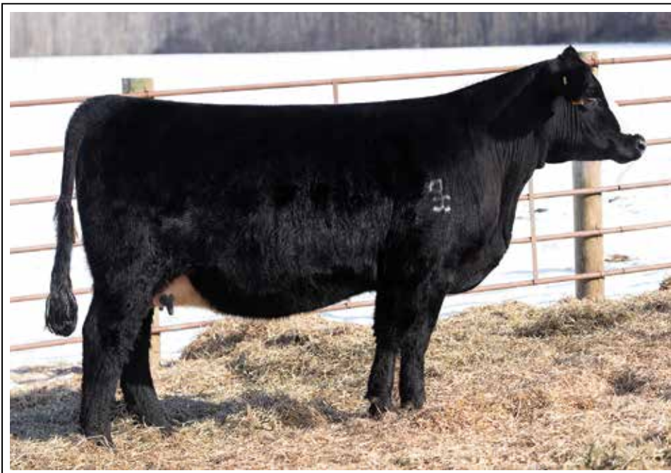
Lot 53 CIRCLE T BONNIE H13

Circle T Bonnie H13 is a beautiful profiling daughter of the late WS Pilgrim H182U that is backed by the stunning Miss CCF Sheza Bonnie Y61, the many times National Champion. H13 is tremendous in terms of her build, with exemplary udder quality. A unique breeding piece that deserves serious consideration on sale day! Lot 53A: Heifer Calf sired by WHF/JS/CCS Double Up G365 (ASA: 3658592). Born 2/23/22.