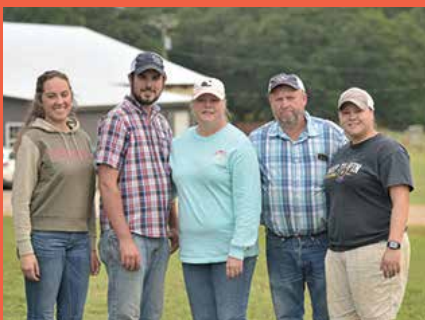
The Cooper Family