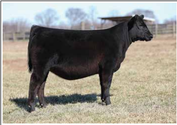
Lot 39 WOMACK SOUTHERN CLASS 1304

Lot 39 WOMACK SOUTHERN CLASS 1304 BD: 11/4/21 AAA: 20285597 TATTOO: 1304 EXG RS FIRST RATE S903 R3 LEACHMAN SAUGAHATCHEE 3000C DAMERON FIRST CLASS WOMACK LUCY 4227 DAMERON NORTHERN MISS 3114 GRANDVIEW WOMACK LUCY 2713