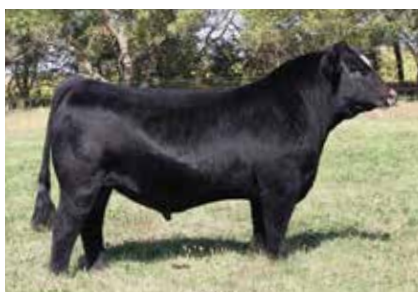
MR CCF 20-20 Full Brother to Dam of Lot 29

Check out this October purebred female. Awesome in her overall build and just keeps getting better every day. Her dam is Crystal Clear sold has one of the high selling females in one of our Clear Vision online sales and is a full sib to the HOT and now deceased MR CCF 20-20. This one just needs a little patience, feed, and TLC. She could be the DIAMOND in the rough.