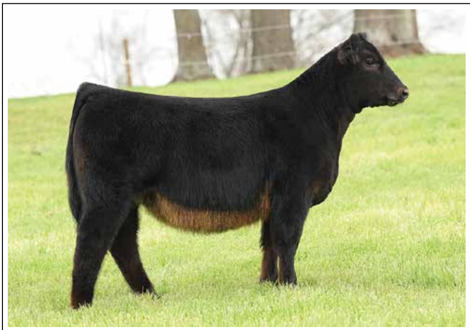
Lot 3 MISS CCF ROMANCE

Miss CCF Romance has the extra bells and whistles that it takes to be a dominant force, much like her full sister that was selected as the Supreme Champion Female at the 2022 Georgia National. Romance has the unique parts and pieces to find the backdrop when it truly counts!