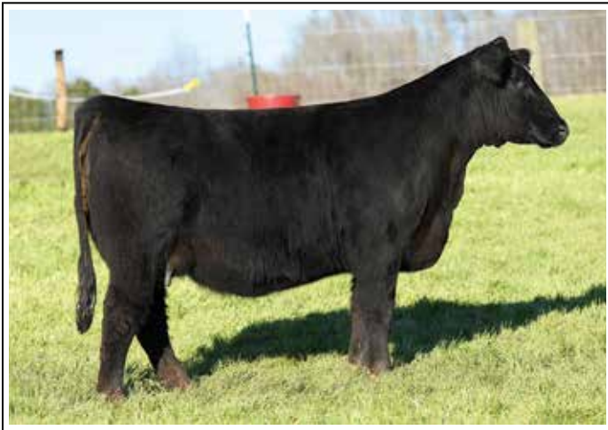
Lot 50 MISS CCF EXPOSURE