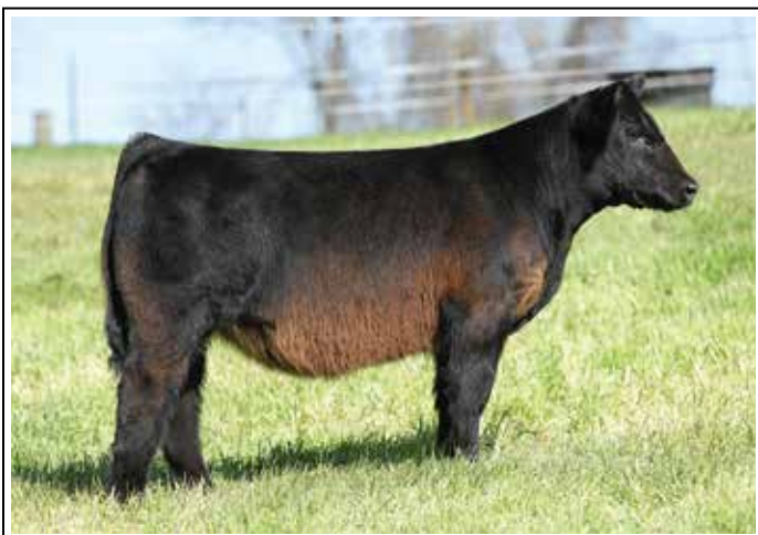
Lot 29 MISS CCF DIAMOND

M2C Jolene 236J is a daughter of the resident herd sire at Metzger Cattle Company, MR CCF Ledger G702, an own son of the great Miss CCF Sheza Bonnie Y61. The dam of 236J is a powerful young LF Dream Doctor daughter that traces to the P12E cow family at Sunset View Farms in Kentucky. This beautiful blaze faced September Purebred has the credential to be a competitive show heifer, and the functionality to make an impact in production.