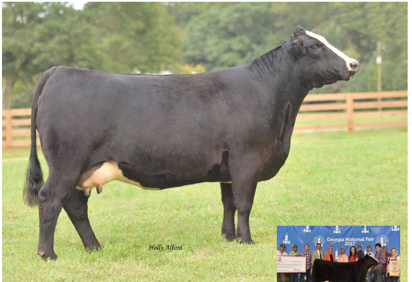
MISS CCF DOUBLE D D101 Dam of Lots 6-9 & Lot 10 Embryos