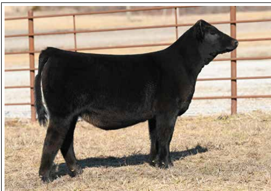
Lot 32 T-T DREAMING J148

Double Down worked extremely well for us over the past year and this female is no exception. J148 is a 3/4 sib to our high selling female in the 2021 Clear Vision spring sale commanding $19,000. J148 is a bit younger and green but has all the parts to make a great show heifer. The purebred side of the breed is as tough as ever and we believe she can hold her own. J148 is so soft haired for a purebred, while being sound structured and good looking. Her mother was an awesome show heifer for Madison McDaniel, and we fell she will follow right in her footsteps.