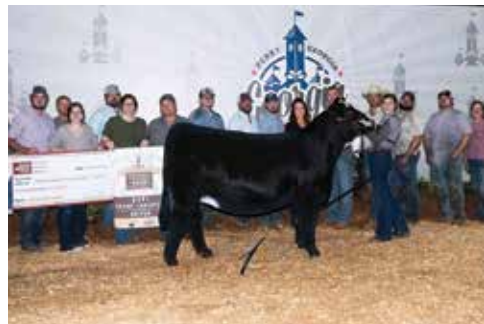
MISS CCF JESTRESS H301 Full Sister to Lot 43