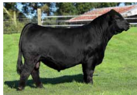
MR CCF PRIORITY Full Brother to Lot 42