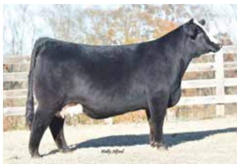
MISS CCF JESTRESS B79 Dam of Lot 42