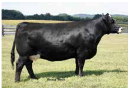
M2C/PHFC ABOVE & BEYOND 187Y Maternal Granddam of Lot 27