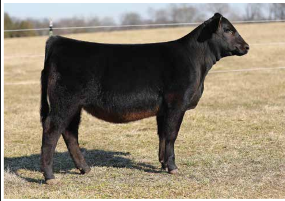
Lot 25 M2C JAIME 234J

This beautiful Copacetic daughter is an intriguing three-quarter blood female that is backed by the cornerstone female of Metzger Cattle Company, SVF Above & Beyond T87. Above & Beyond is one of the most timeless females in the business when considering the impact that she has had on the business for the last decade. This October show heifer prospect offers a flawless design in terms of her structure from the ground up, remains flexible in her spine, and posses with a look of quality that is hard to ignore. Pay attention here... this female has the parts and pieces to be a big-time contender in the percentage division!