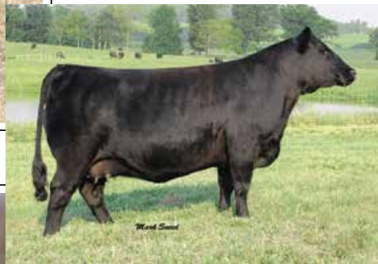
SVF ABOVE & BEYOND T87

AI Bred on 6/20/21 to MR CCF The Duke (ASA: 3583413). Estimated due 3/29/22.