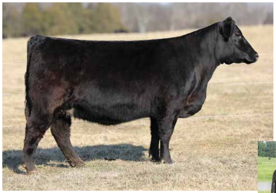
Lot 61 M2C GRACE