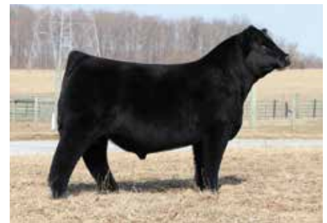
TMAS CAN'T TOUCH THIS 8531F Sire of Lots 17 & 18

Forgiveness has been a favorite since birth. Her mother is becoming one of our rising donors here at the farm because of her ability to produce high quality cattle but also her versatility when it comes to choosing matings. We chose to mate the upcoming Can't Touch This herd sire to the Panda donor and these two females in this sale show nothing but true potential. She stomps the ground with a big sound foot and pastern and does it in a graceful form. Let's just add that she is dang good looking while she's on the move. Big square hipped, plenty of rib shape and has awesome hair.