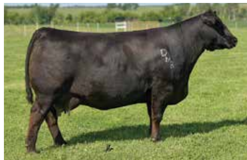
DAMAR DAZZLE Z136 Maternal Granddam of Lot 21

A beautiful JSUL Something About Mary 8421 daughter that is backed by the Damar Dazzle D122 cow family, incorporating the influence of W/C United 956Y. The maternal granddam of J122 is the powerful Damar Dazzle Z136, a female that anchored the Simmental program at both Damar Farms and Cloud 9 Cattle Company during her tenure in Wisconsin. Power, presence, and structural integrity that you can count on!