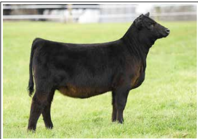
Lot 23 MISS CCF VIRGINIA

The Elmore family of South Carolina have brought a high quality 3/4 blood 20-20 daughter here. One that is big in her rib shape, stout featured and will make one heck of a brood cow at the end of her show career.