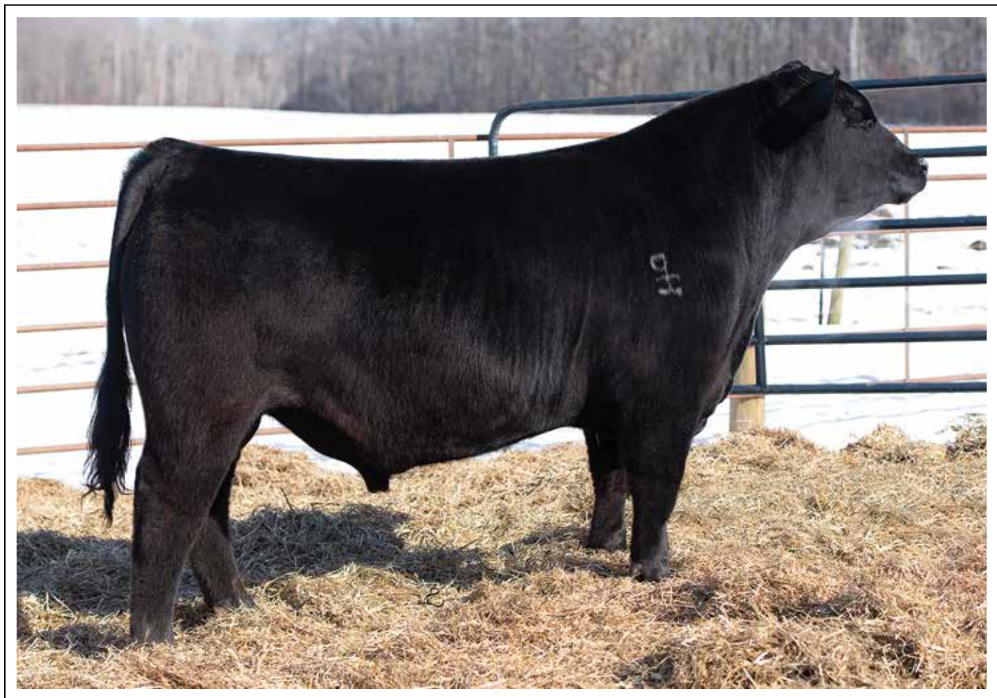
Lot 64 WPCC OVERTIME J613