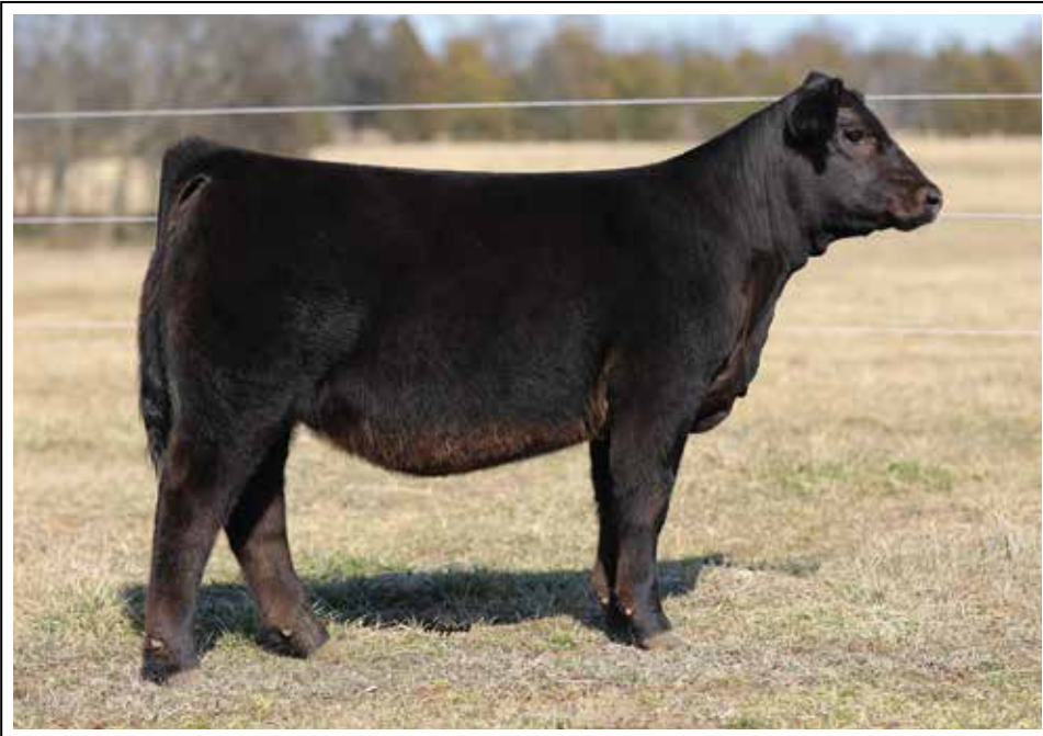
Lot 26 M2C JULIA 235J