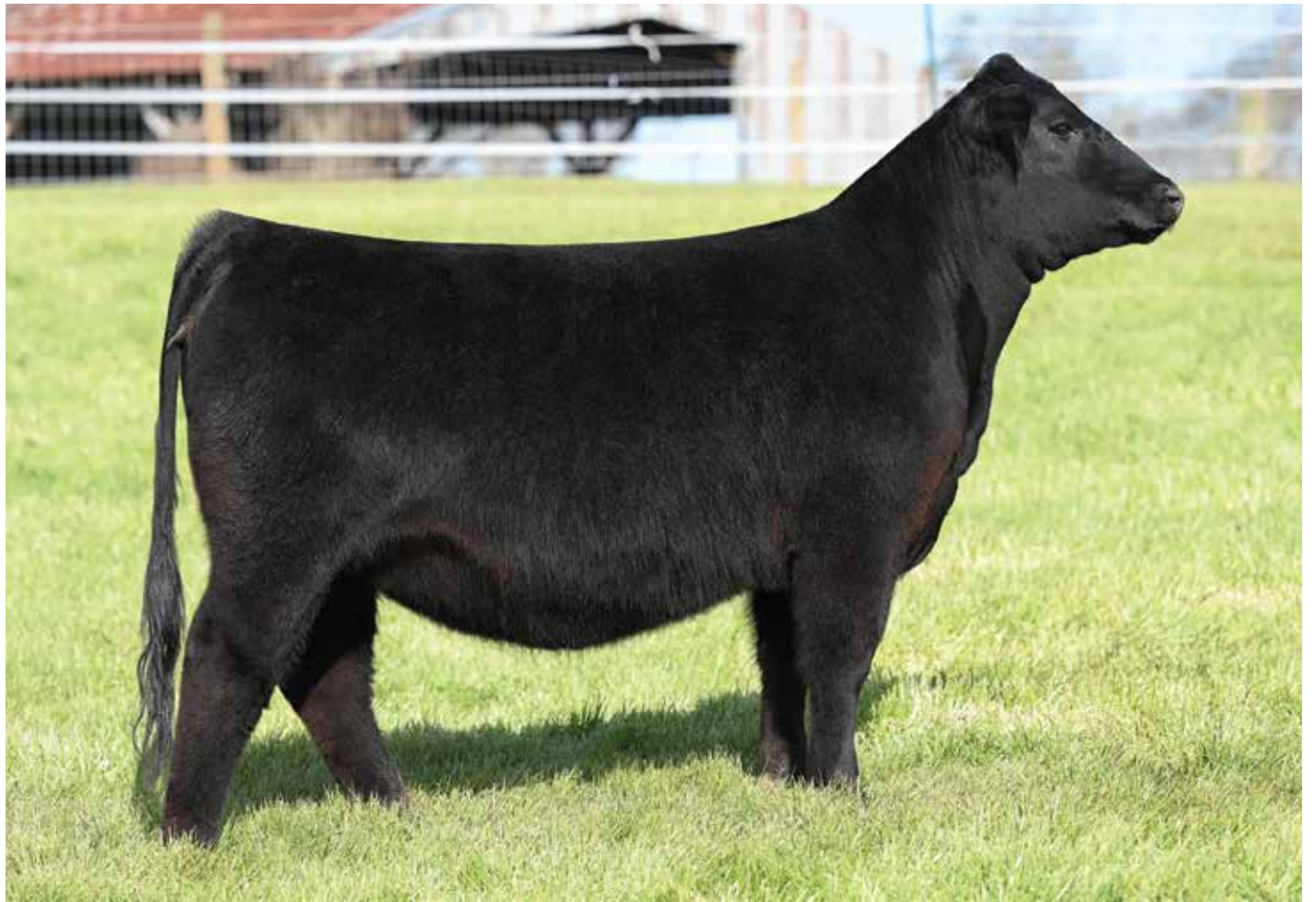
Lot 36 MISS CCF JESTRESS J356