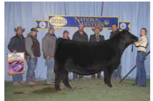
JSUL DREAM BIG 8992F 2020 NWSS GRAND CHAMPION PERCENTAGE SIMMENTAL FEMALE Full Sister in Blood to Lot 60