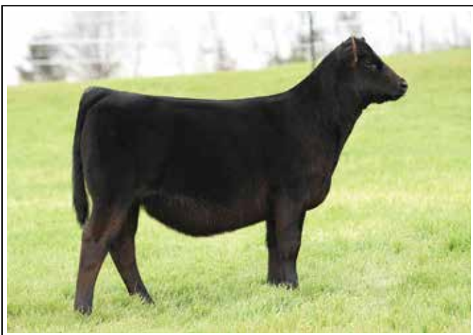
Lot 24 TUITION

One of the youngest females in the sale but she will catch your eye on sale day. Weaned from a first calf heifer Style daughter, and let's just say once her mother calves again, she will enter the donor pen. This Duke daughter has loads of potential with that killer show ring look. Her granddam is the well-known Champion Hill Georgina 6518. Sound and soft in her pastern when put on the move, with tons of center body. Ones like this are hard to part with at such a young age because it's hard to say what their ultimate potential could be. But we feel that she has the best of both worlds genetically and phenotypically!