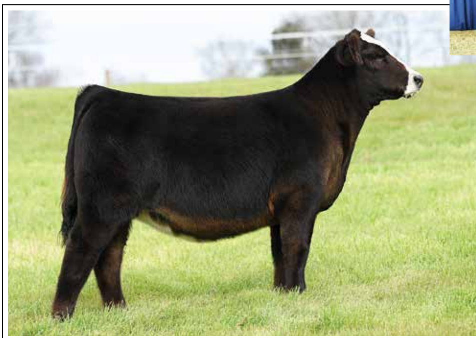
Lot 7 ACE IN THE HOLE J35

What can we say...You only raise one like this when your son's show career is over. Double D had an amazing show career and now we think her best days are ahead producing heifers like this one. Super stout legged and boned but just as sound as Double D was as a baby... Her name speaks for how we think her show career will go. Invest with confidence.