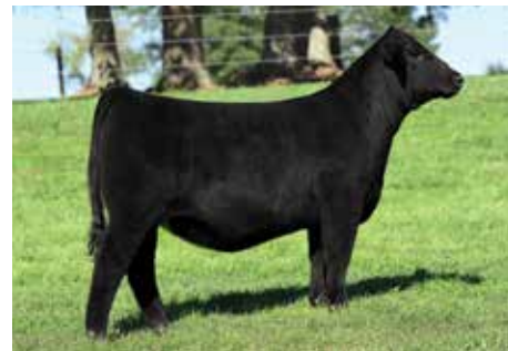
MISS CCF SHIMMER Maternal Sister to Lots 13 & 14

Sired by JSUL Something About Mary 8421, "SAM" and out of the Miss AF Blaze donor. This baldy female is super complete in her build. One that is hard to pick a major hole in. Sound on her feet and legs, awesome turn to her rib with that long elegant front one third. Her dam Blaze is a full sib to the Jestress B79 donor. Maternal sibs have sold well in the past sales at $11,000 and $10,000. Promising future with a pedigree for the times.