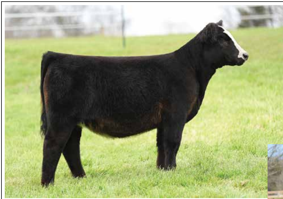
Lot 8 SCSF MIRROR

When the Lamberth family purchased the dam of Mirror, Miss CCF Double D, we had very high expectations for her. Not only what we thought she could win as a show heifer but what she could achieve as a donor. Well, let's just say, the day we clipped Mirror out all we could picture was her mother at that age. This Relentless daughter is wicked cool about her front third in how she ties together about her head and neck. This size of this female's foot, bone and structure is crazy for the elegant look that she gives yet she doesn't give up the adequate belly shape. She gets our hearts pumping every time we walk in the sale pen.