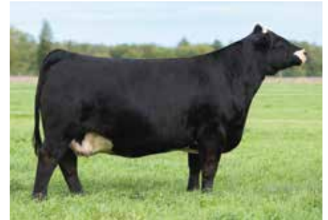
HPF RIGHT TO LOVE 283C Dam of Lot 59

PE 4/10/21 to 6/10/21 to MR CCF Re-Run (ASA:3741890)