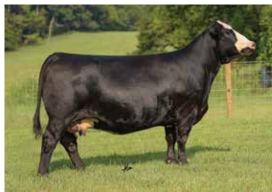
MISS CCF MAMA D D361 Maternal Sister to Dam of Lots 44 & 45

This one has the unique front end and exquisite jaw shape as her mother. You can't put a cleaner more feminine head and neck on a female than Hattie Mae has. This is what is so hard to breed into Simmental cattle. As a donor we think she will carry on this trait to her offspring. She is safe in calf to The Duke and is due to calve mid-April. Pure C&C genetics here! PE 6/15/21 to 9/15/21 to MR CCF The Duke (ASA: 3583413). Estimated due 4/16/22.