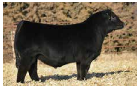
FRKG CKCC PLATINUM 009H ET $175,000 Son of Mr CCF 20-20