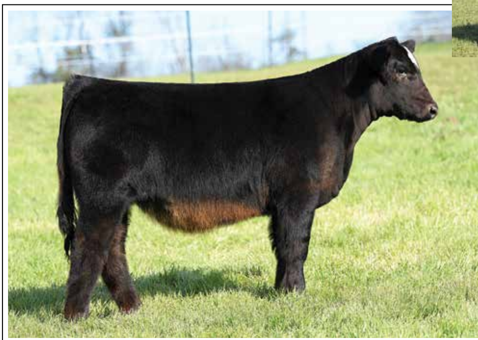
Lot 9 SCSF GAMBLE

Let's not overlook quality because of greenness. She took weaning a little harder than others, but boy has she made a turn around. We had high hopes that this mating would click and that it did! Gamble ties so many good things together. Sound, big footed, beautiful skeletal build, and that arrogance to catch your eye. Sometimes you must Gamble a little to win big!