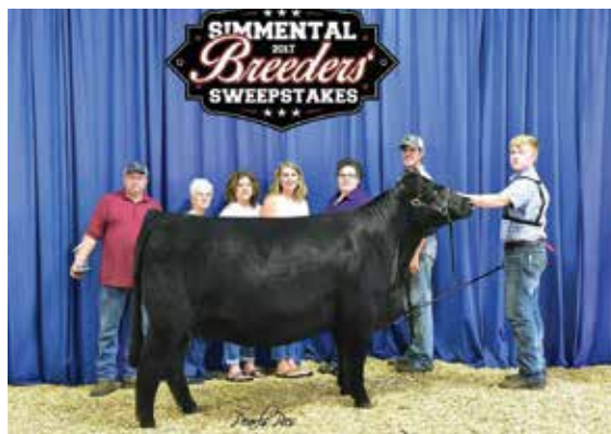
MISS CCF JESTRESS C102 Dam of Lots 11 & 12

This Executive Order daughter is one that keeps getting better and better every day. She is sound at the ground, with a very well-balanced look. Awesome genetic profile on both top and bottom of her pedigree.