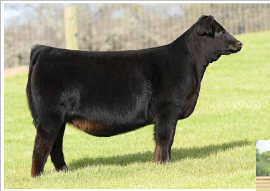
Lot 15 MISS CCF FOREVER LOVE

This is one that has caught the eye of many that has looked through the sale heifers. Her overall mass and dimension is something to admire but what is truly impressive is the way she handles this when out on the move. With all this added substance she still looks like a lady. Very square and good footed with an awesome pin set. Her dam is sired by the now deceased MR CCF 20-20 and is one of the up-and-coming donors here at C&C Farms and owned with the Lamberth family. Awesome pedigree on the top and bottom side of this young female. Seller retains the right to 1 successful flush with a minimum of 6 transferable embryos. Work to be done at the buyer's convenience and the seller's expense.