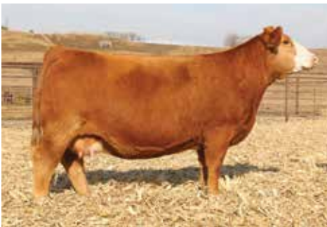
SVJ SHE`S THE DREAM B796 Full Sister to Dam of Lot 60