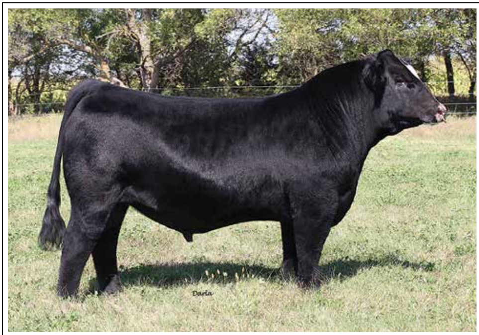
Lot 101 MR CCF 20-20 DECEASED SIRE OF SEMEN SELLING

MR CCF 20-20 is a Purebred Simmental bull that has gained huge amounts of respect from cattlemen around the nation, even with his untimely passing, several of the businesses most decorated production sales have been highlighted by his progeny and the esteem around the influence he transmits only becomes more lucrative. The cattle he sires have a refreshing looseness of structure, both at the ground and in their spines, the added presence that is common with his service is resounding. Couple this with the rapid injection of back and hip shape he sires and it's no wonder that this outcross breeding option has become so highly sought after.