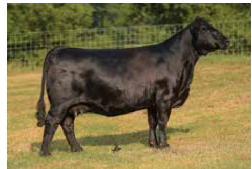
MISS CCF BREAKING HEARTS Dam of Lot 30

If you want your show projects to be heavy structured, sound made, level and cool fronted then Southern Star is your lady. Her dam Breaking Hearts is on fire for producing high quality cattle. Three full sibs sold last spring in the Clear Vision Sale and averaged $14,000. Two maternal sibs sold as pairs in the fall for $17,500 and $13,000. This one could quite possibly be the best one yet. This young baldy female should have plenty of admirers on sale day.