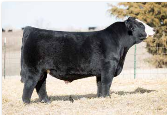
RUBY/SWC GENTLEMAN'S JACK - Maternal Brother to Lot 40