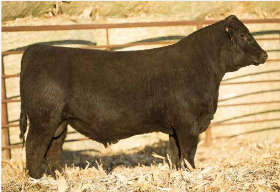
LOT 60 RUBY SC GUARDIAN 186J