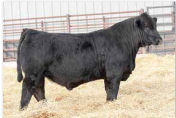
CLRS GUARDIAN 317G - Sire of Lots 48-64