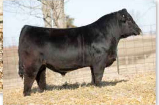
RUBYS OUTER LIMITS 935G Sire of Lots 26-27