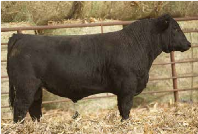
LOT 5 RUBYS CURRENCY 0H92