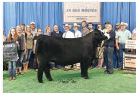
RUBY NFF RHYTHM 4B1 Dam of Lot 66