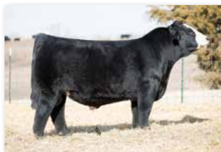
RUBY/SWC GENTLEMAN'S JACK Maternal Brother to Lots 8 & 9