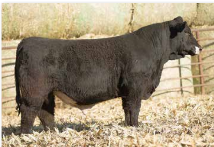
LOT 21 RUBYS TURNPIKE 164J

One of the more attractive Turnpike sons in the sale out a good Relentless Rhythm family member.