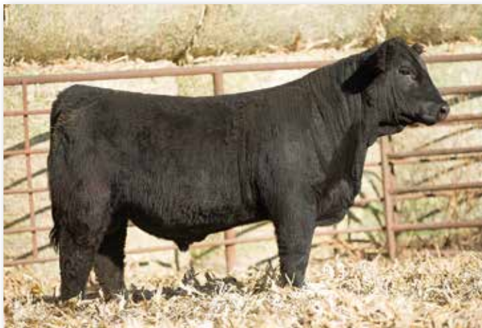
LOT 20 RUBYS TURNPIKE 115J