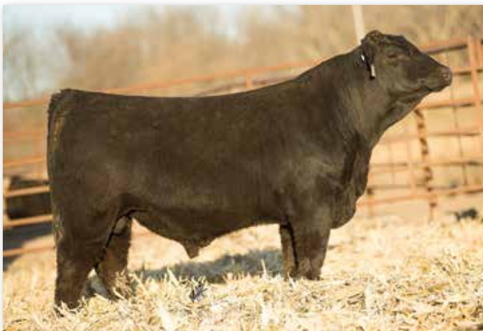
LOT 46 RUBY NFF CASH FLOW 1159J