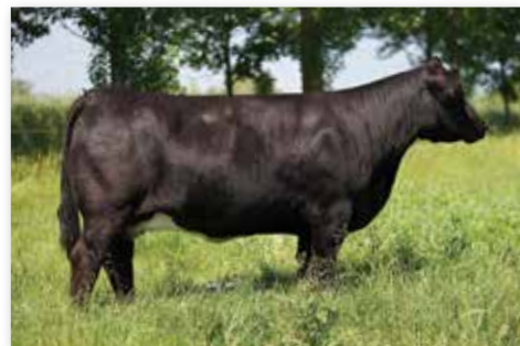
RHYTHM 418P Foundation Donor Dam at Ruby Cattle Company