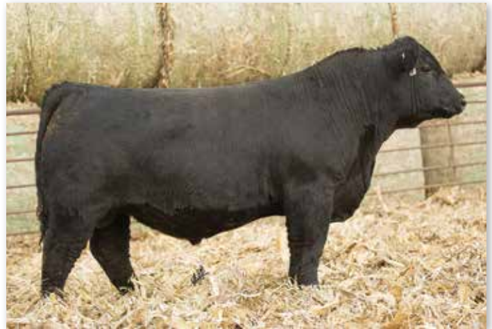
LOT 38 RUBY NFF CASH FLOW 0H112