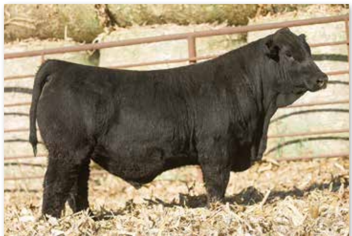
LOT 64 RUBYS GUARDIAN J102

Here is another one of the stout, burly, rugged bulls in the offering. He was born on a damn cold day and is missing pieces of a few extremities, but don't fear, his calves won't! This is a big footed bull with extra body and rib shape, which in turn makes him extra easy doing. As an added bonus, you may have noticed he comes from the Miss Cleo tribe and his granddam, 785E, is one of the best looking cows on the place.