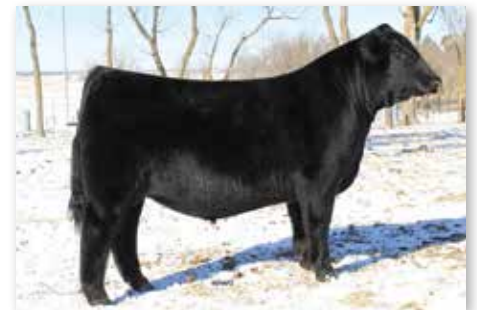
RUBY'S CURRENCY 7134E Full Brother to Dam of Lots 60 & 61