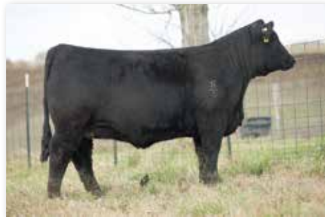
RUBYS RHYTHM 097H - Full Sister to Lot 74