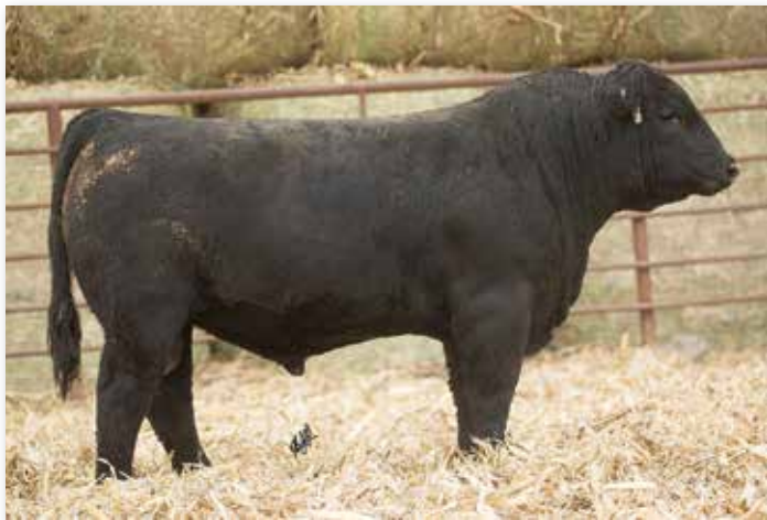
LOT 35 RUBY NFF CASH FLOW 0H73