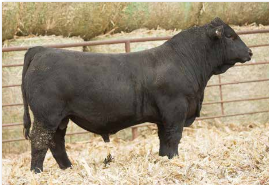
LOT 16 RUBYS TURNPIKE 0H60

This is a great example of what we love about the Turnpikes. Extra length and extension with a shot of added frame on a super sound running gear that is built to handle heavy use. His young dam is doing a great job and his maternal granddam raised several top end bulls.