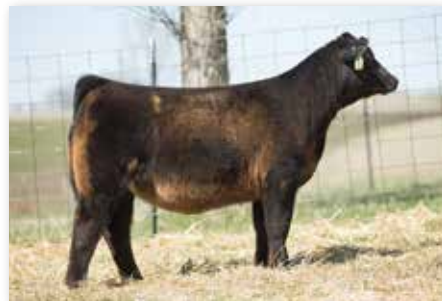
RUBY SWC YETTI 9G36 - Full Sister to Lots 8 & 9