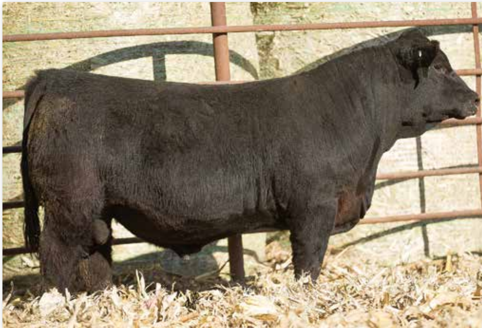
LOT 18 RUBYS TURNPIKE 175J