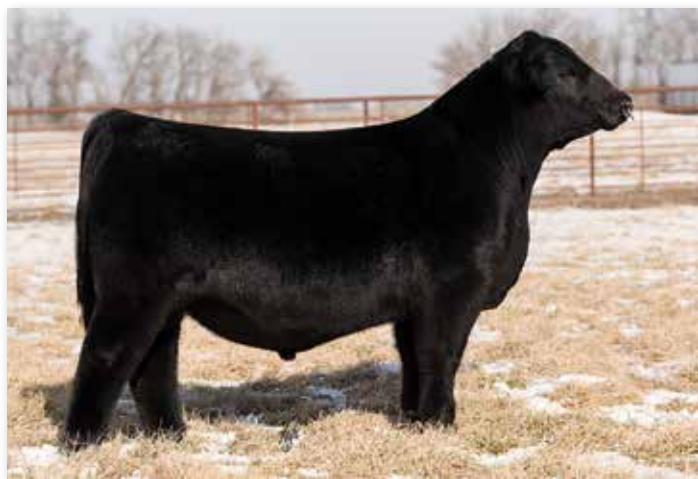
PVF BLACKLIST 7077 - Sire of Lots 76-78