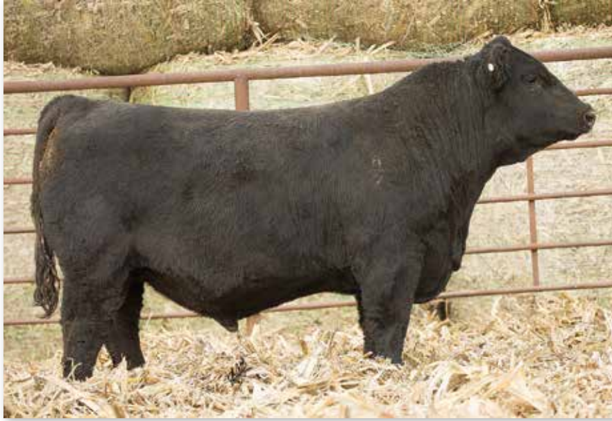
LOT 29 RUBYS CASH FLOW 0H88