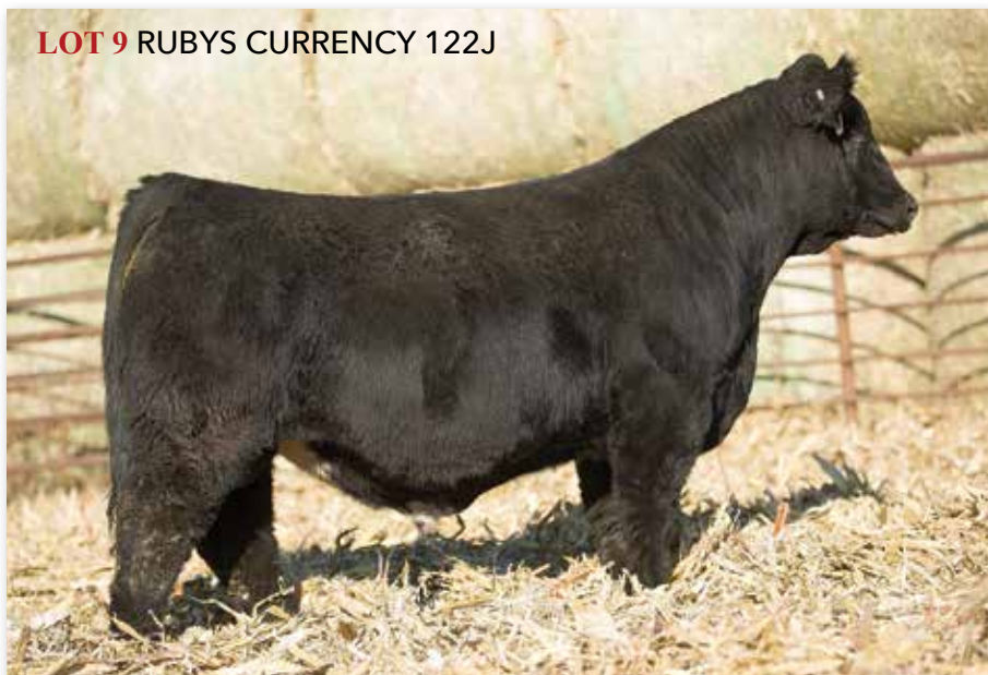
LOT 9 RUBYS CURRENCY 122J