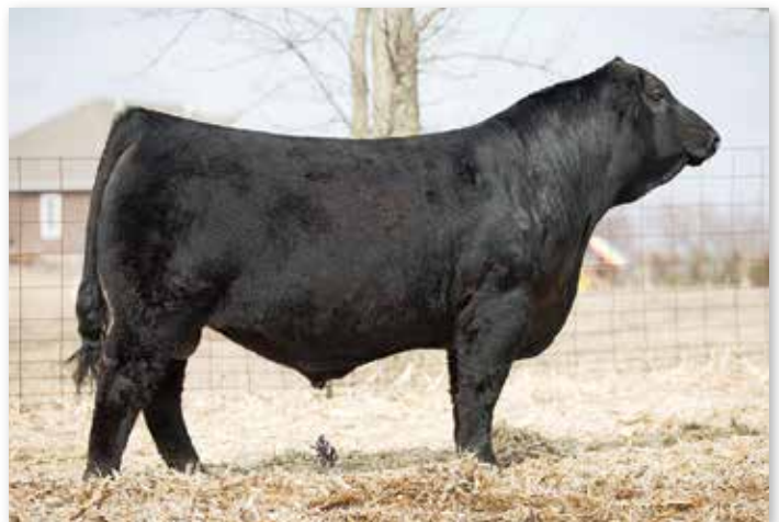
OVAL F ECHO E709 - Maternal Grandsire of Lot 59

If you need to improve your carcass traits in your herd, this would be a good place to start. 115 IMF ratio, 102 REA ratio, and 82 BF ratio, he is one of leanest bulls in his contemporary group. He would be a great solution to add marbling while reducing Yield grade in a British based cow herd.