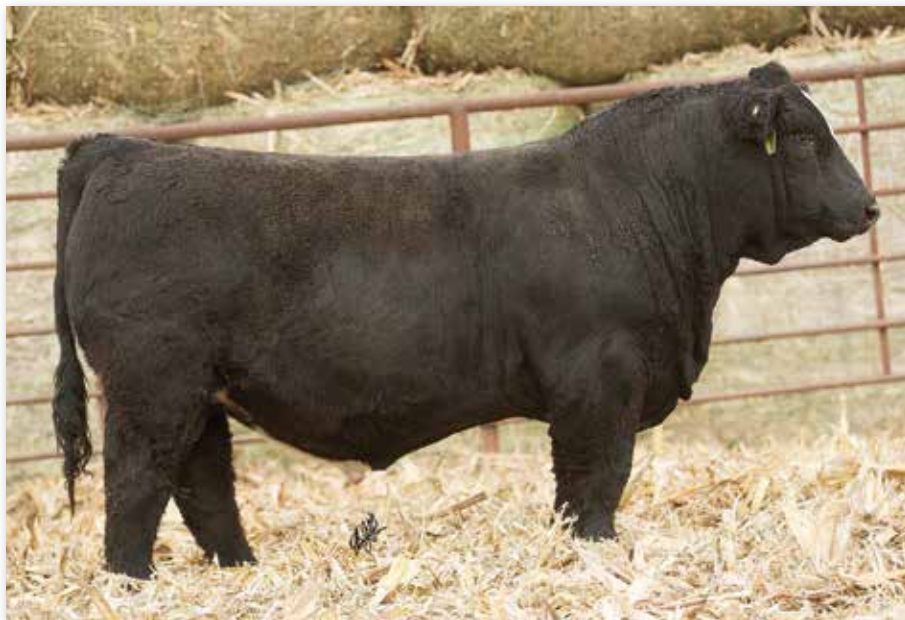
LOT 15 RUBY NFF TURNPIKE 0H48