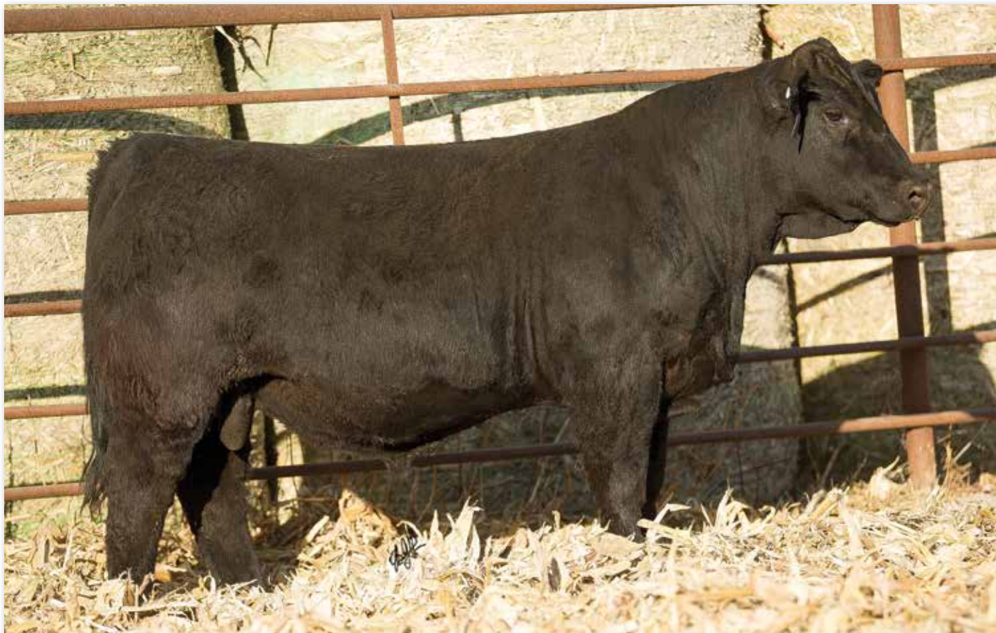
LOT 17 RUBYS TURNPIKE 166J

If we would have made it to Denver, here would have been our Purebred pen of 3. These brothers are very easy to like and once again, if you want to turn out multiple bulls on a group cows and still maintain consistency and predictability, I can't think of a better place to look than these fellas. They are purebred bulls that look like halfbloods. Super attractive, big bellied, stout made, and really excel in the foot, leg, and flexibility department. They are the first male offering out of their powerful young donor and she has delivered the goods in spades. Buy one or buy all three, but make sure they are on your list!