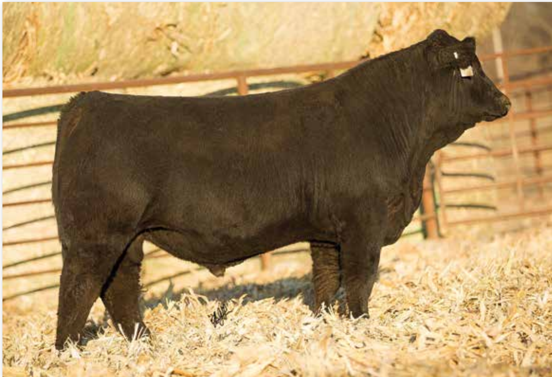
LOT 54 RUBYS GUARDIAN J106