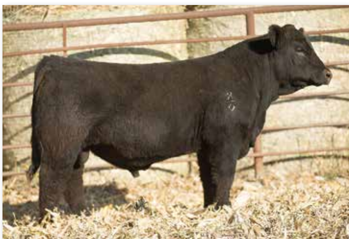
LOT 22 RUBYS TURNPIKE 152J

High growth, big bodied, sound made baldy stud here. Here's one that should add some chrome to his calves heads and still tie in the predictability of the Rhythm cow family.