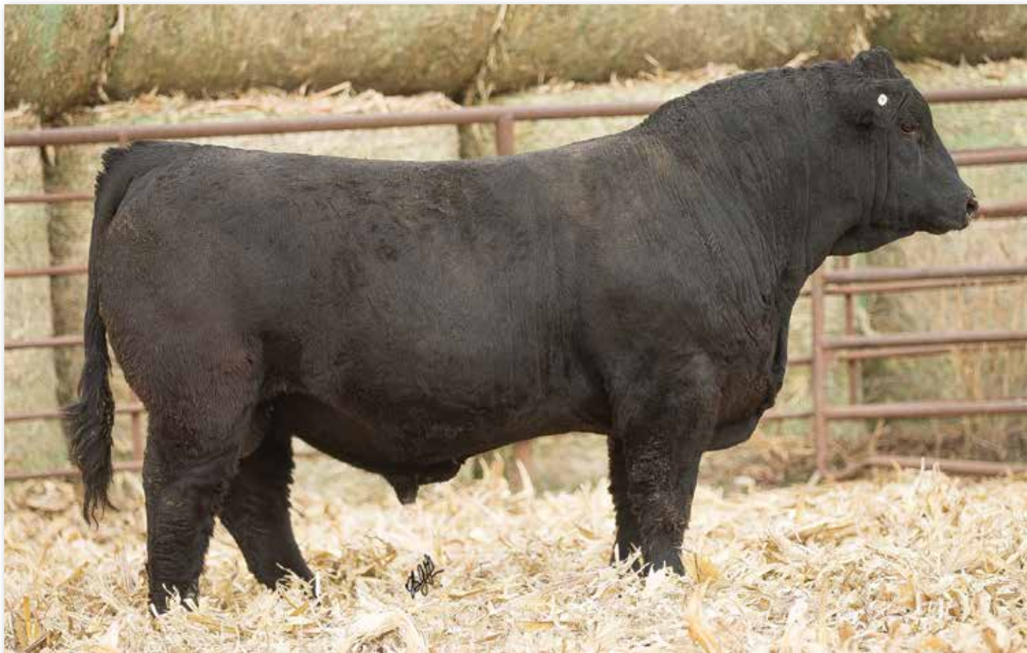
LOT 14 RUBYS TURNPIKE 0H16

This one is a physical specimen. If you want to add some eye appeal, stoutness, and growth to a plainer group of cows, here is one that can do it. Look at the cow families that back this bull, Linda, Miss Cleo, and Yetti, the backbone of our operation. If you believe in cow power as much as we do, it makes this bull hard to pass up. Check out the breed leading growth figures here as well!