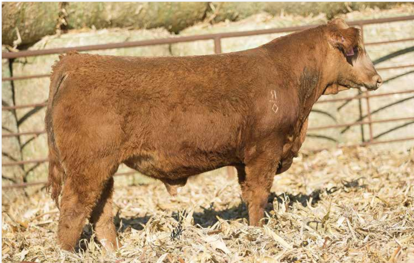
LOT 81 RUBYS SNIPER J166