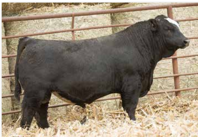
LOT 70 RUBY NFF ECHO 0H6

30% 40% 40% 60% 25% 40% 80% 45% 40% 70% 20% 90% 65% 80% 60% 55% 45% Blaze faced bull unassisted out of a Pays to Believe x 2124Z first calf heifer. Think of the daughters he will make.