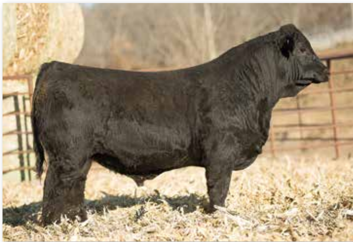
LOT 50 RUBYS GUARDIAN 107J

We really like this litter of flush brothers. Their dam is one of the most influential donors in our operation and is also the dam of the great 721E. You hope when you get a group of brothers like this, they all come out this uniform. They are soggy, loose made bulls, that are deceptively stout made. We love their feet and legs and how quick they shed off this spring, making them ideal for fescue country. If you want to add milk to your cow herd, these guys will do just that. Look at them on paper and their rankings for their individual traits within the breed, what an impressive set of brothers!