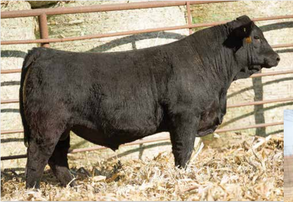
LOT 26 RUBYS OUTER LIMITS 155J