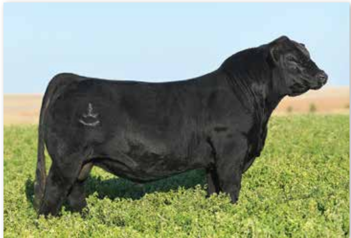
KCC1 EXCLUSIVE 116E - Sire of Lot 67

Here is a full brother to the high selling bull from last year's bull sale. Extra stoutness and shape in this Exclusive son. Note that his dam is the great Yetti donor, one of the best producers of herd sires in the country.