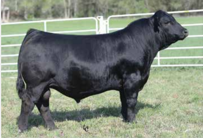
WS PROCLAMATION E202 - Sire of Lot 47