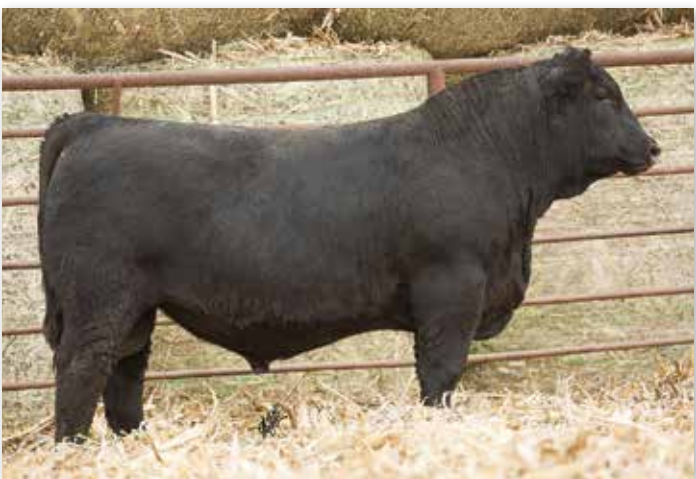
LOT 36 RUBY NFF CASH FLOW 0H89