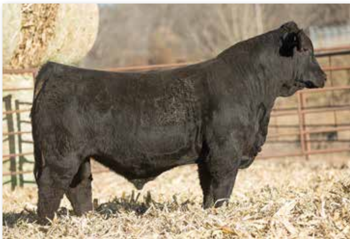
LOT 51 RUBYS GUARDIAN 125J