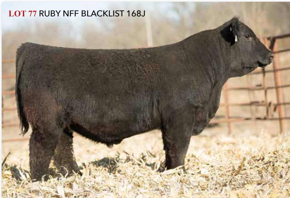
LOT 77 RUBY NFF BLACKLIST 168J