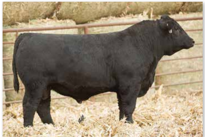
LOT 39 RUBY NFF CASH FLOW 0H113