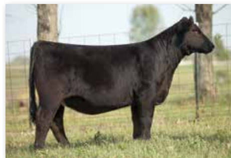
RUBYS ROSETTA 0118H Maternal Sister to Lot 65