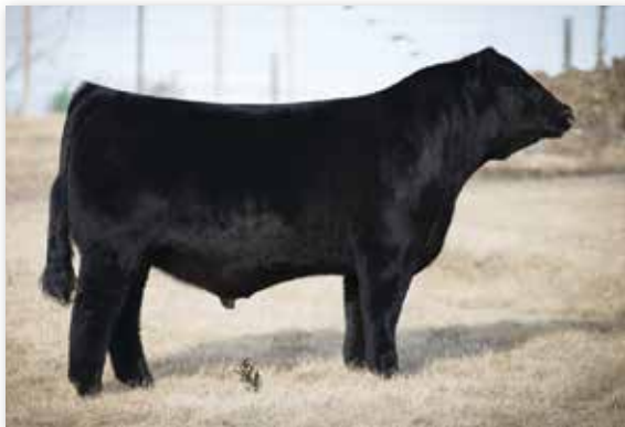
RUBY SWC BATTLE CRY 431B - Maternal Brother of Lot 53