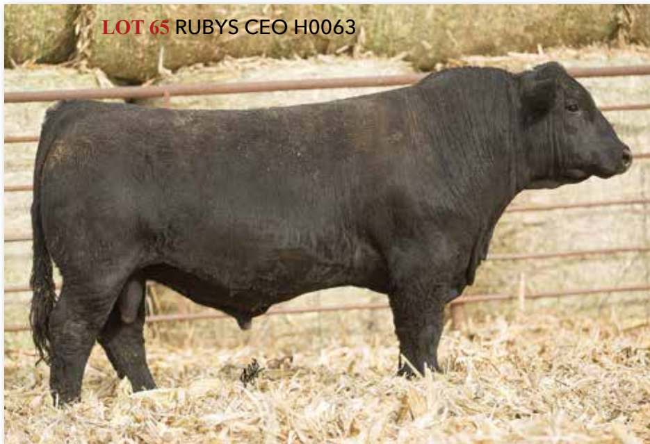
LOT 65 RUBYS CEO H0063