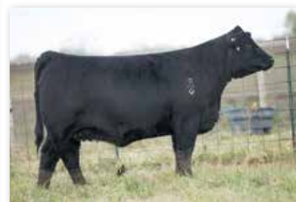
RUBYS MISS CLEO 015H Maternal Sister to Lot 73

If you want to add frame and length to your calves, here is your guy. His blaze faced mother checks all the boxes for us, feet, udder, fertility and is a full sister the Yucatan bull that left us many great daughters.