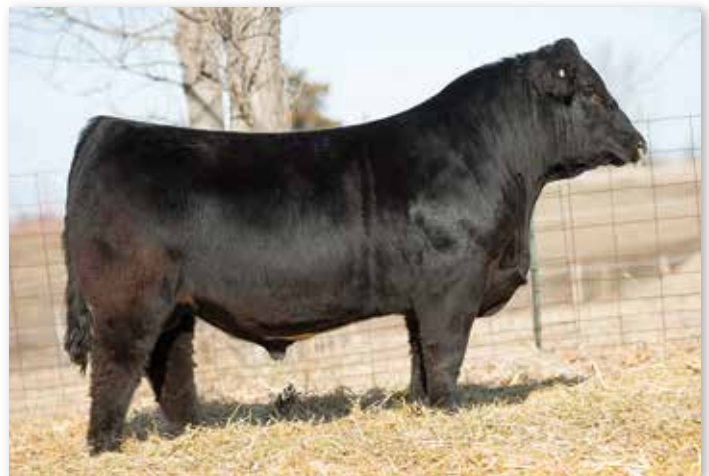
RUBYS OUTER LIMITS 935G Maternal Brother to Lots 47-49