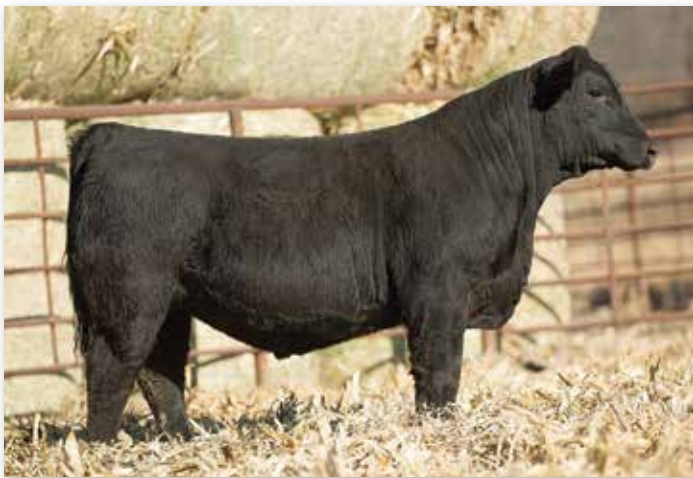
LOT 45 RUBY NFF CASH FLOW 1138J