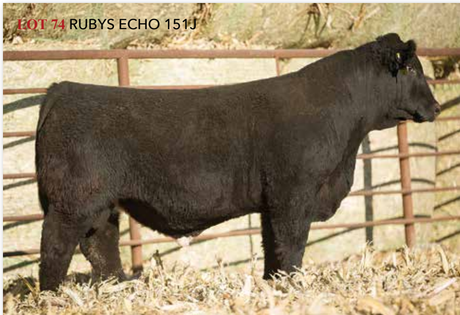
LOT 74 RUBYS ECHO 151J