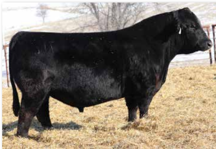
RUBYS TURNPIKE 771E - Maternal Brother of Lot 1

A quick look at this guy's pedigree and you will notice that he is a brother to the great Turnpike. 0H3 is one of my favorite bulls in the offering. He was small at birth, offers good growth with a very balanced EPD profile. Well above average in several traits with indexes in the top 30% of the breed. He's good looking, super smooth in his design, soft, sound, and deceptively stout. Lots of good in this bull.