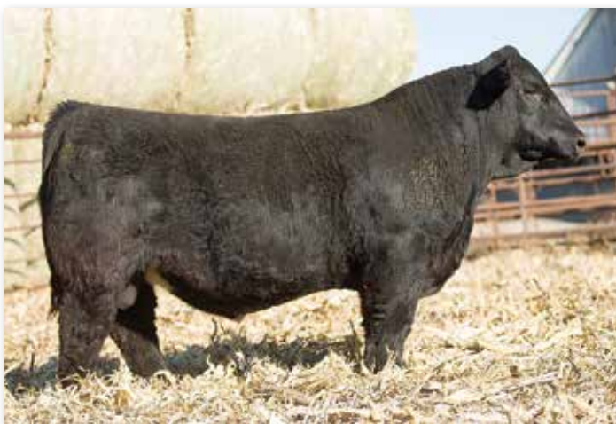
LOT 6 RUBYS CURRENCY 128J

Here's a long bodied, bigger framed bull that is sure to add extension and eye appeal. Top 20% growth EPDs and you will also find the great 418P in his pedigree.