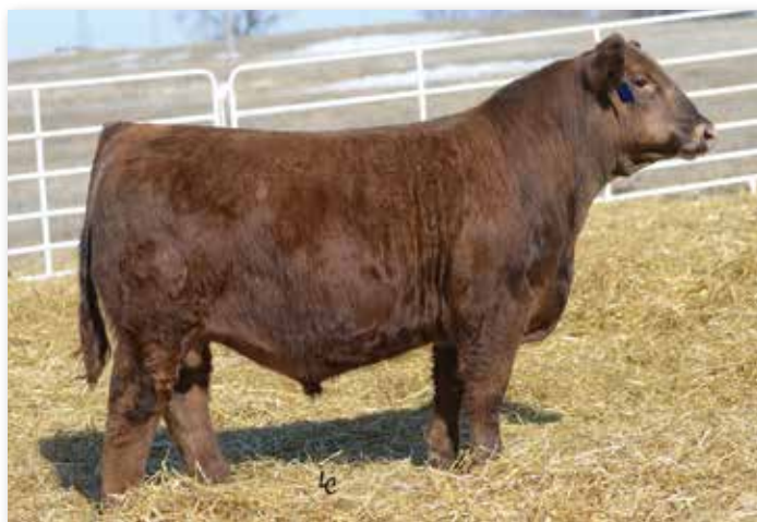
KBHR SNIPER E036 - Sire of Lot 81

The lone red bull in the offering. We love his look, body length, added frame, and structure. He is one of the youngest bulls in the sale and gives up some maturity to some of the older bulls, but if you can see through that, this one has a lot to offer a program who wants to add some red genetics. Great calving ease prospect that is top 1% for Docility.