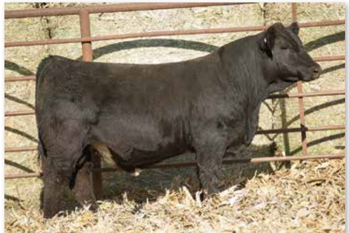
LOT 42 RUBYS CASH FLOW 1103J

60% 75% 60% 40% 70% 99% 25% 40% 90% 10% 65% 60% 65% 80% 45% 40% 70% Here is a bull I really keep liking out in the bull lots. Attractive made with lots of middle body shape, and still stout ended. Weaned over 700 and has an adjusted yearling weight over 1200 pounds with just 0.16 of back fat. That is performance bred in, not fed in!