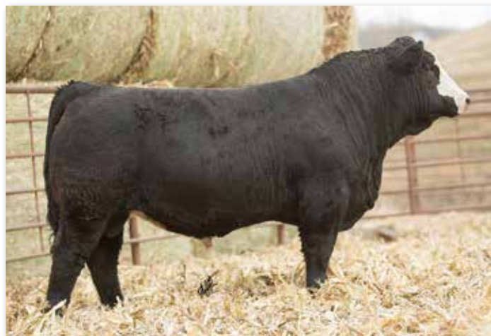
LOT 12 RUBYS SIGNIFICANT H0062