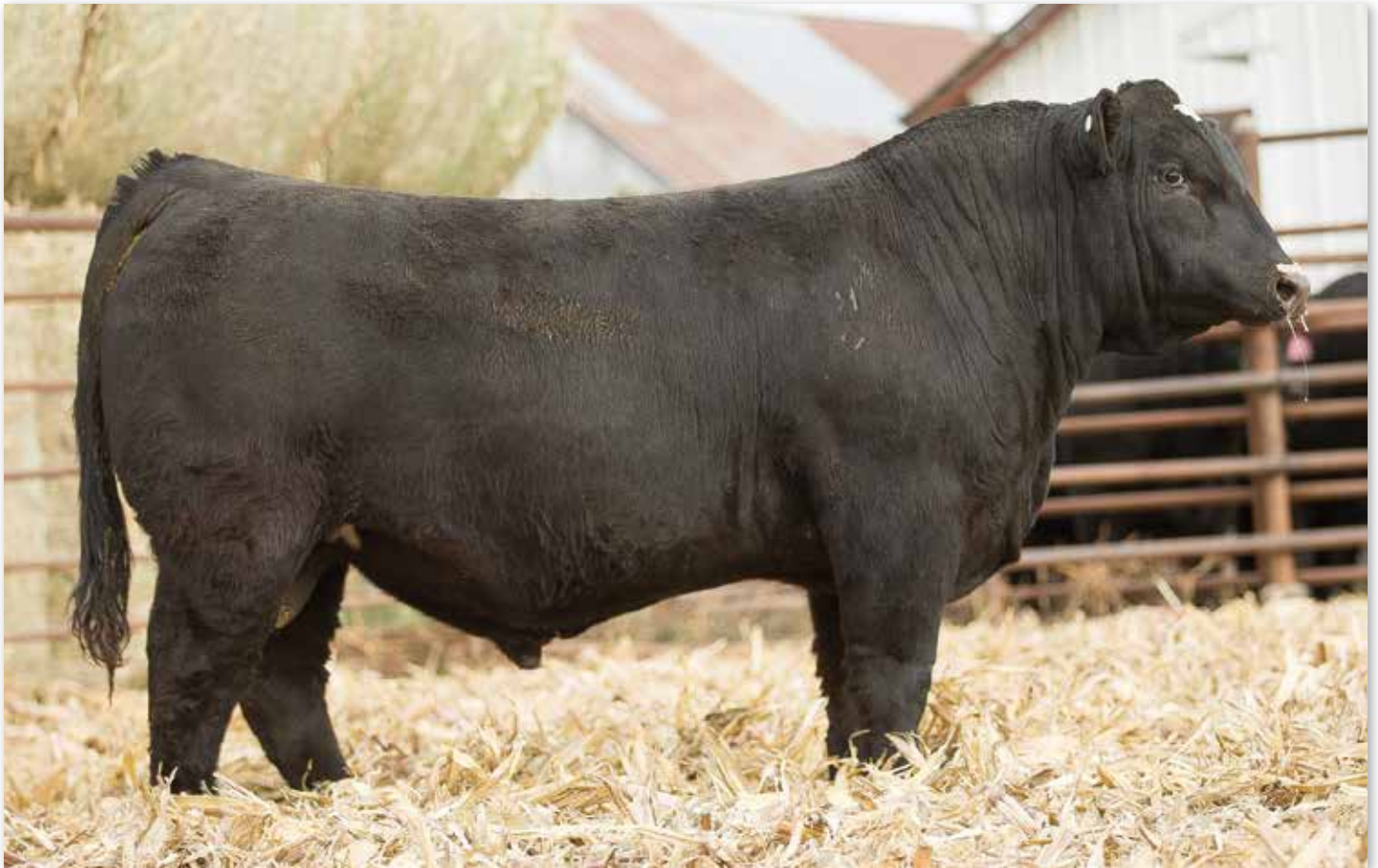
LOT 2 RUBYS CURRENCY 0H9