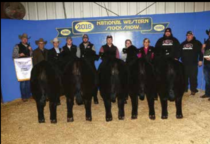
2018 National Western Reserve Champion Pen of 5 Simmental Bulls