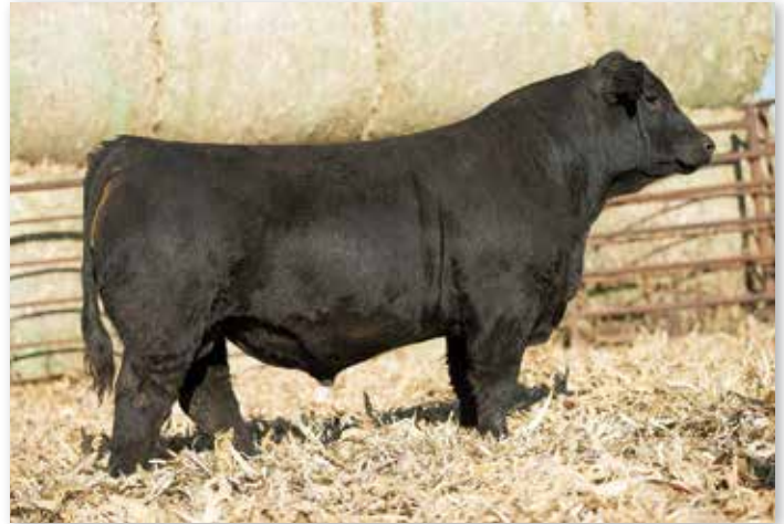
LOT 41 RUBYS CASH FLOW 1105J

80% 90% 15% 15% 90% 75% 20% 65% 35% 10% 65% 15% 75% 25% 15% 45% 40% This 3/4 blood SimAngus bull is hard to miss. He has a front end that grabs your attention, and all the power, body depth and athleticism to keep you coming back for more. Big time growth numbers and he cracked the 800# barrier at weaning.