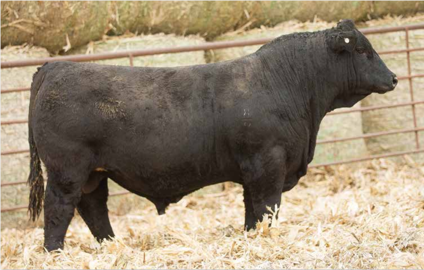
LOT 13 RUBYS TURNPIKE 0H35