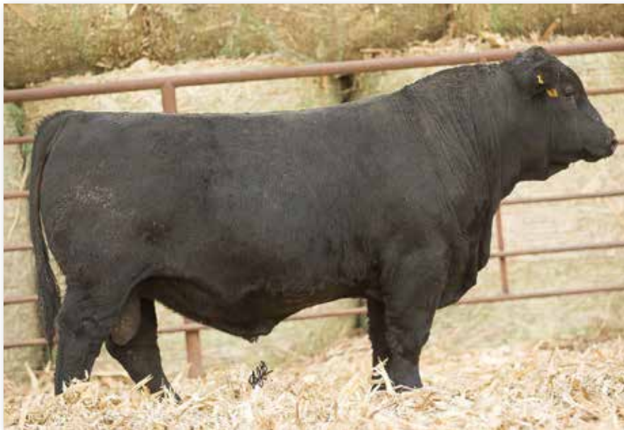
LOT 30 RUBYS CASH FLOW 0H74

A very nice balance of efficiency and growth with a huge scrotal. Top 1% Stay.