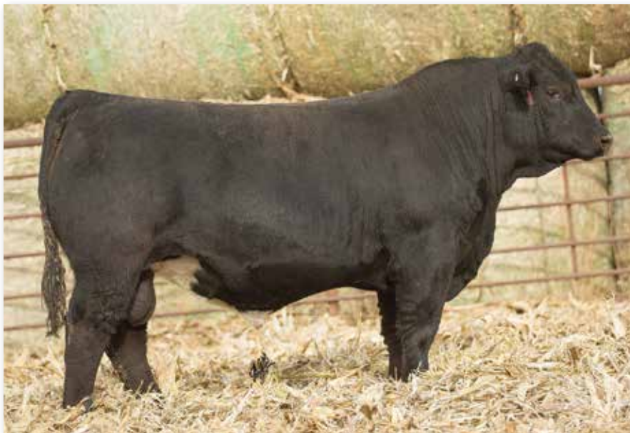
LOT 32 RUBYS CASH FLOW 0H109

A high performing Cash Flow son with a monster ribeye in him. Very balanced EPD profile with top end indexes.