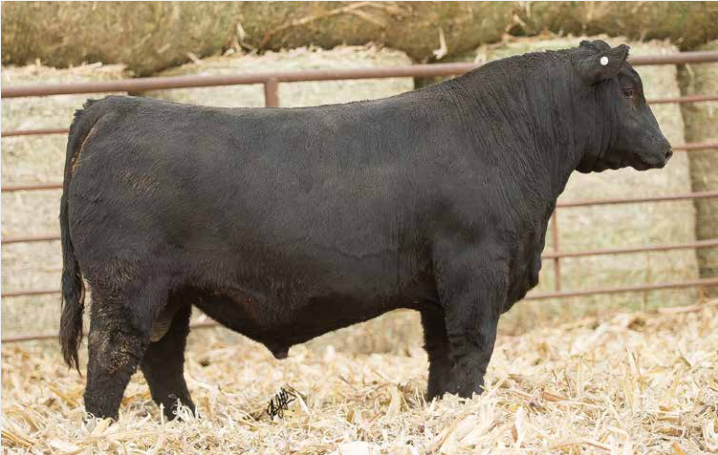
LOT 4 RUBYS CURRENCY 0H62

If you like more moderate, easy keeping cattle, this one will be right up your alley. Still one that grabs your attention in the pen, he will add efficiency and fleshing ability to his calves. 146 IMF ratio as well. His dam is one of my favorite cows and one of the most productive In Dew Time females we have.