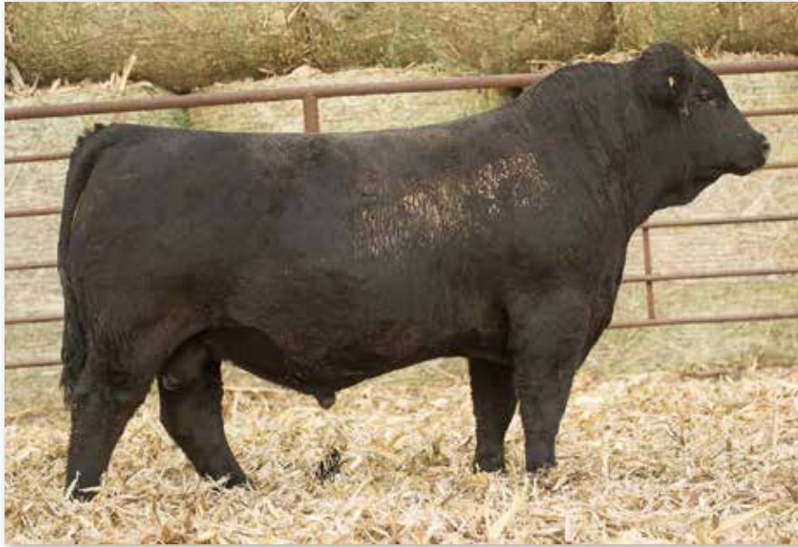
LOT 31 RUBYS CASH FLOW 0H82