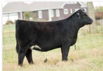
RUBY NFF RHYTHM 148J Full Sister to Lots 76-78