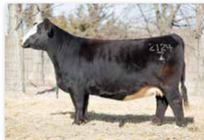
RUBY NFF RHYTHM 2124Z Dam of Lots 76-78