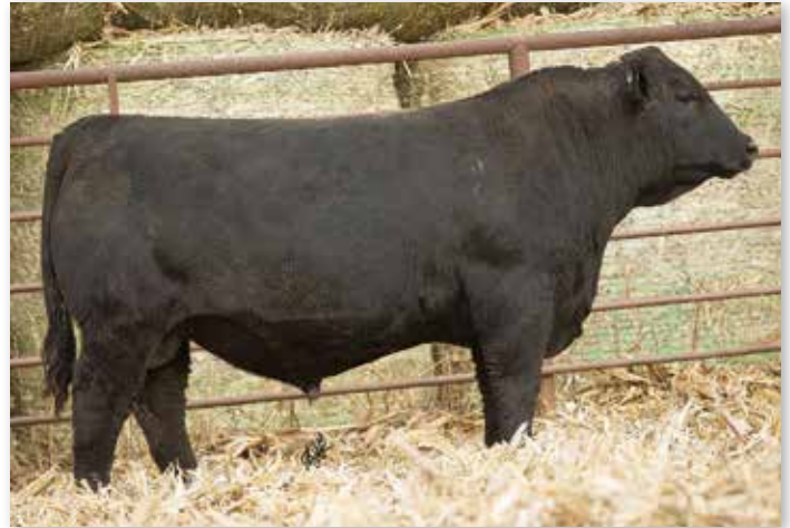
LOT 37 RUBY NFF CASH FLOW 0H95