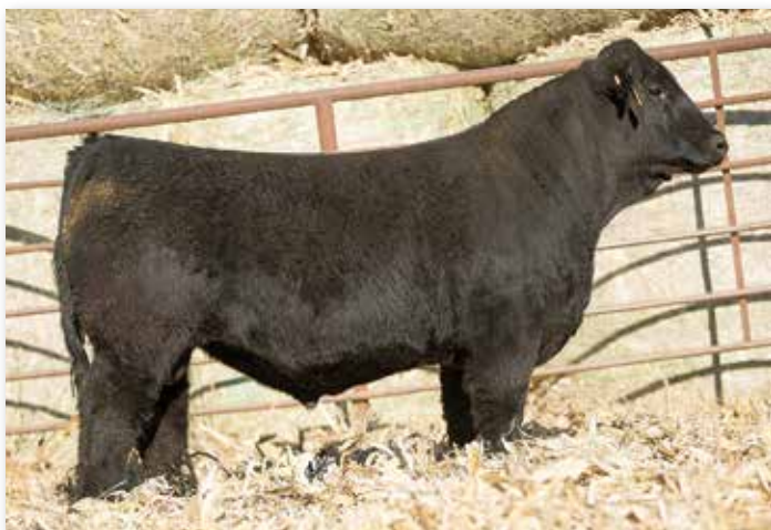
LOT 52 RUBYS GUARDIAN 139J