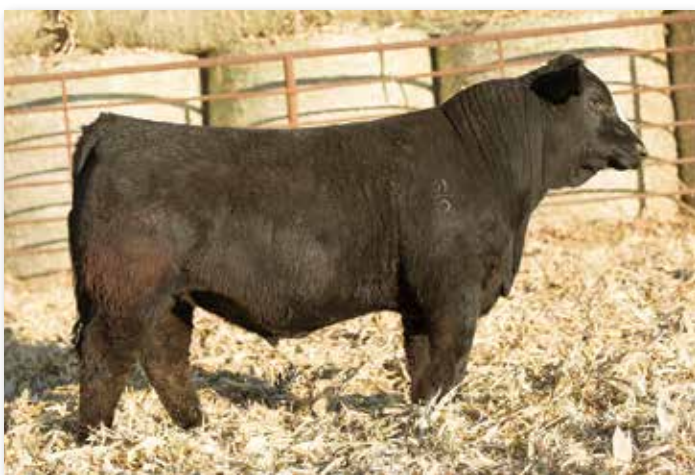
LOT 7 RUBYS CURRENCY 147J

I will be upfront with you, this has been one of my favorite bulls of this calf crop. He was small at birth, offers explosive growth, in an attractive, stout, soft made package. His dam is flat awesome and is one we need consider flushing. Check him out on paper as well, top 10% calving ease, top 25% growth, with both indexes in top 15% of the breed. Another SimAngus bull that does everything right.