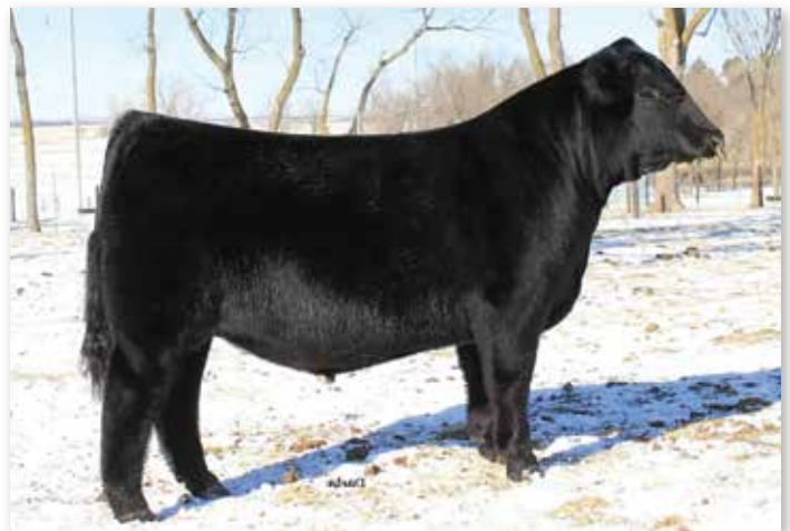
RUBY'S CURRENCY 7134E - Maternal Brother to Lot 28

Cash Flow out of Currency's mother. Big time growth with top 1% stay so keep every daughter that you can. Also boasts a 120 IMF ratio.