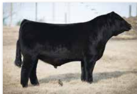
RUBY SWC BATTLE CRY 431B Maternal Brother to Lots 8 & 9