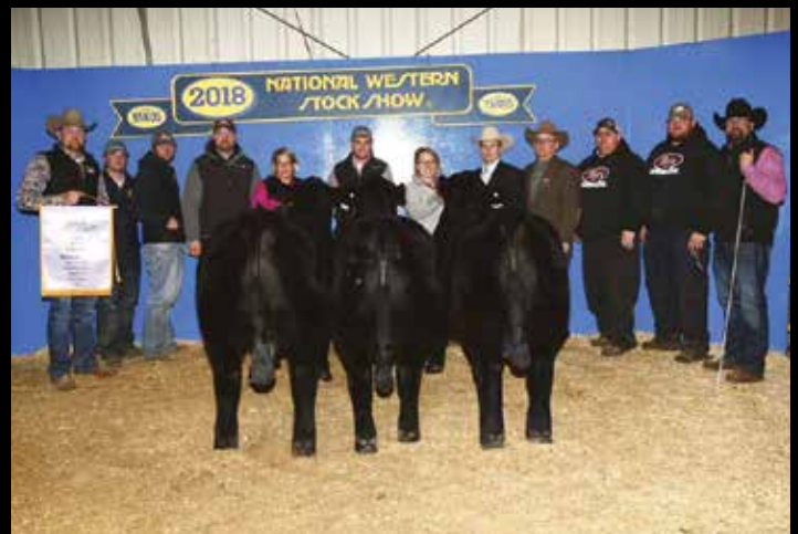
2018 National Western Reserve Champion Pen of 3 Simmental Bulls