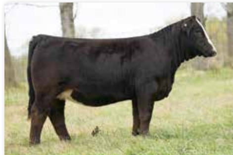
RUBYS RHYTHM 189J - Full Sister to Lot 75