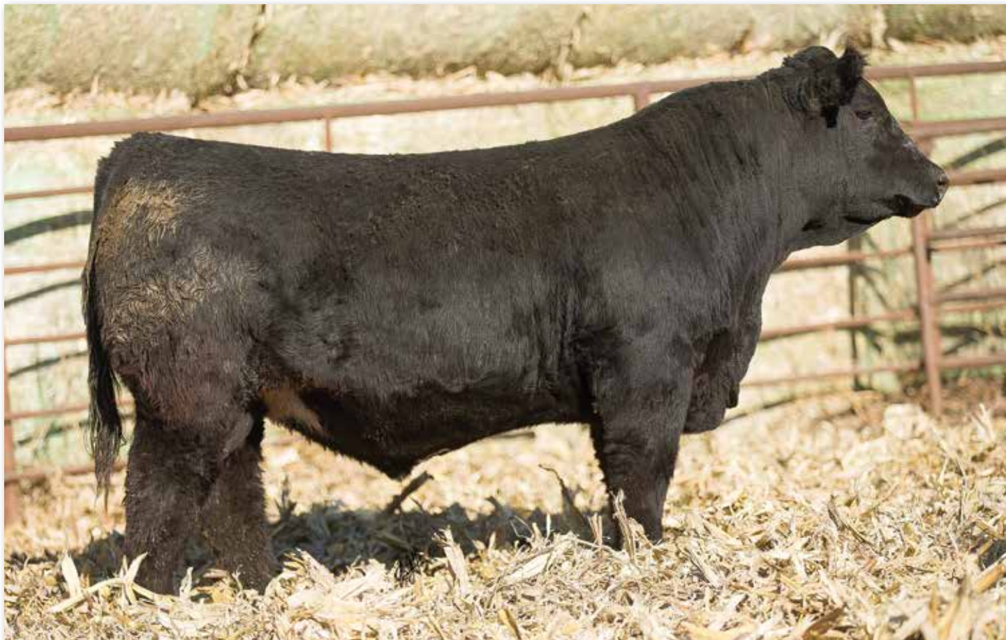
LOT 40 RUBYS CASH FLOW 197J

The great Yetti donor has raised many great sons over her years of production. I think this Cash Flow son ranks right up there with the best of them. I love his attractive look coupled with an explosive rib cage and as much red meat as you can pack into one. He is incredibly sound and good on the move and handles his power with ease and grace. He has two sisters in the replacement pen that are near the top in that group, and they are part of the reason this bull excites me as much as he does. He boasts great individual performance with impressive ultrasound ratios. This calf's outcross pedigree provides a lot of mating flexibility as well. He is one that I think a lot of and were sure you will find him too.