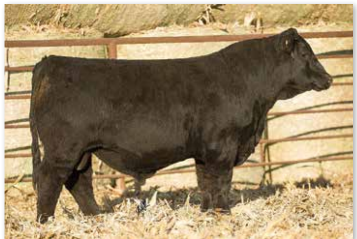
LOT 43 RUBYS CASH FLOW 1129J

20% 60% 55% 40% 85% 90% 30% 50% 80% 5% 90% 80% 40% 95% 80% 20% 50% I may sound repetitive, but deep, stout, attractive with good individual growth and carcass figures.