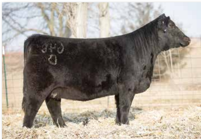
RUBYS MISS CLEO 648D - Dam of Lots 17 - 19