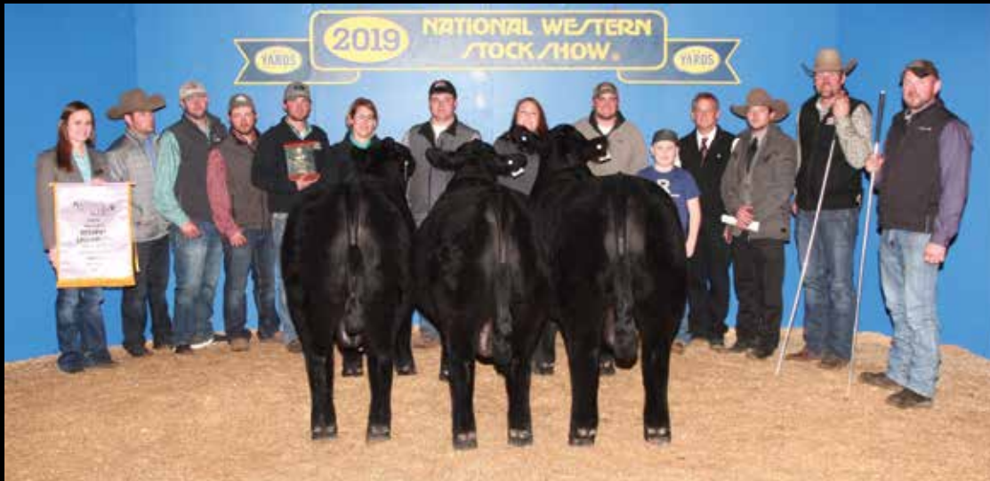
2019 National Western Reserve Champion Pen of 3 Simmental Bulls

Visit www.rubycattleco.com or www.innovationagmarketing.com for additional updates and supplement information.