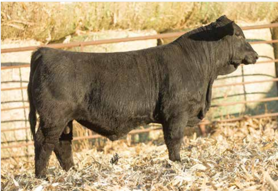
LOT 56 RUBYS GUARDIAN J104

If you pull up Guardian on the Simmental data base and do a search, here is the number 1 WW and YW offspring born to date. If you're looking for a growth and power bull to put on a mature group of cows, this one would be right at the top of my list. 128 WW ratio, 125 YW ratio, 121 IMF ratio, 106 REA ratio and did it all with under 0.2 of back fat, that's impressive! There are several generations of great cows in the Juanada family that stand behind this bull as well, so you know he will leave you with some great females too. With his slick hair coat and great feet and legs, he is ready to thrive on fescue pasture. Bulls like him aren't offered every day, so take advantage of the opportunity here!