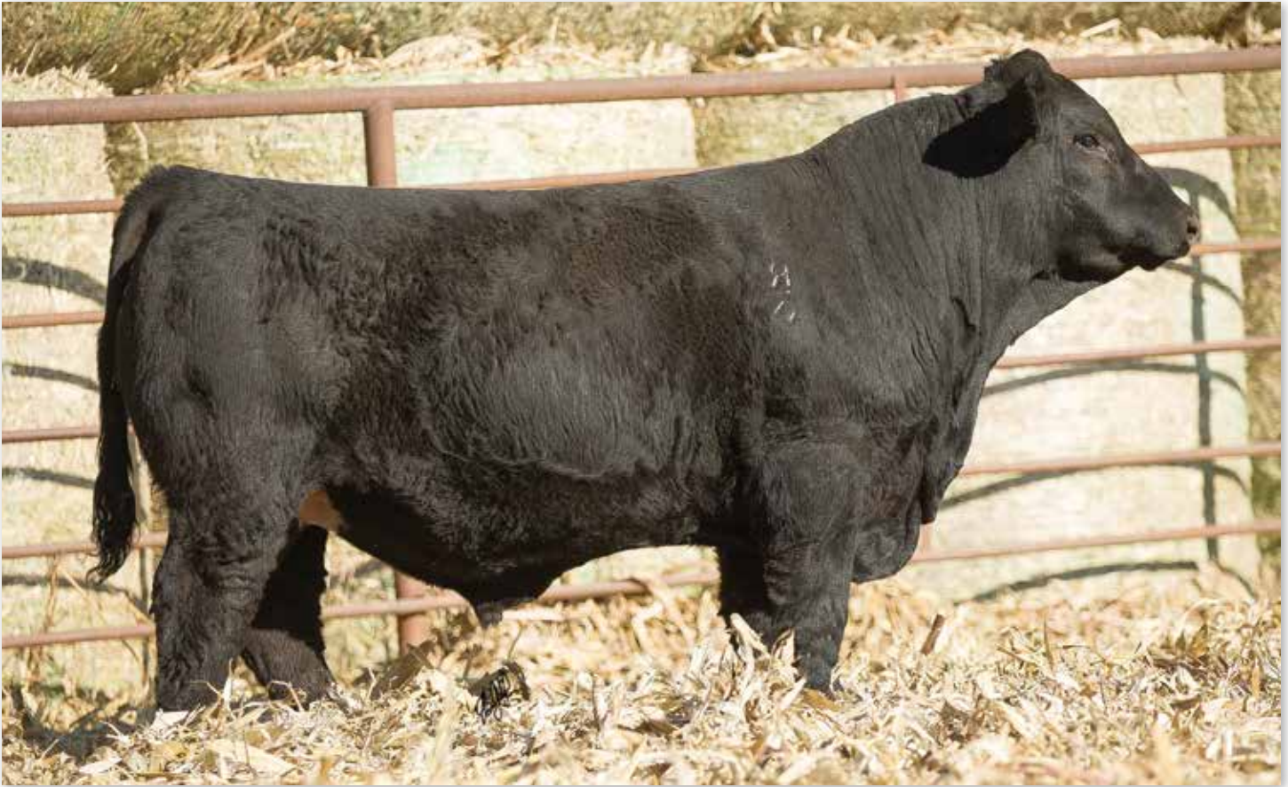
LOT 49 RUBYS GUARDIAN 114J

The other brother from this exciting mating is no slouch himself. Born at 57 pounds, yes that is right, and still performed incredibly well for starting so small. He too is great footed, sound in his design, big bodied and stout made. One that could be used on any heifer in the country and still feel confident about calving ease, yet still expect performance on the back side. One of the most exciting things about these two bulls, is the full sister sitting in the replacement pen. We expect big things from her. Without a doubt, this is one of the most exciting matings we have had born here to date.