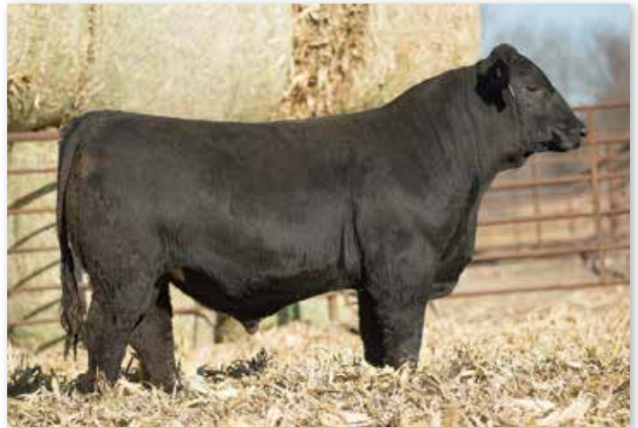
LOT 57 RUBYS GUARDIAN 113J

Big, stout, and burly is the best way to describe this guy! He has been easy to find since a young age and early visitors have found him in the bull pen as well. His dam, 3176A, is also the granddam of the 1114J Turnpike son we think so much of.