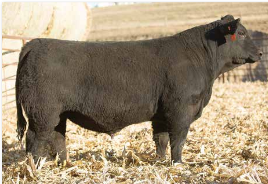
LOT 24 RUBYS TURNPIKE 176J