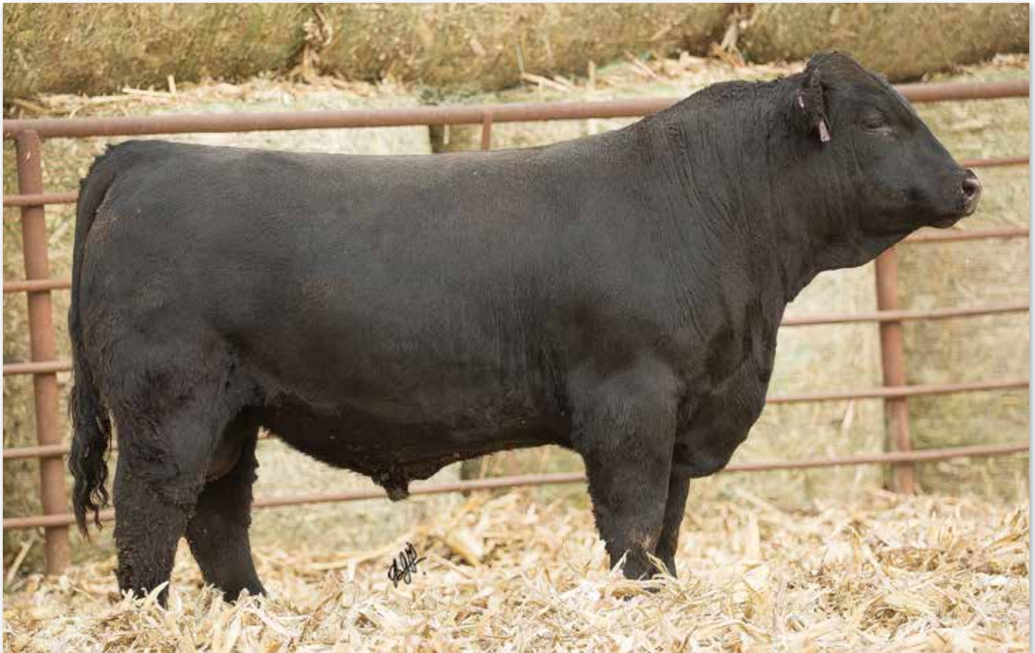
LOT 28 RUBYS CASH FLOW 0H93

We purchased Cash Flow as a clean up bull from the great NLC ranch but after a couple of calf crops, we realized we had something special. Most of these sons are the result of natural service, so I hope it gives you an appreciation of what he can do on a wide variety of cows. We started AI'ing to him and using him in our ET program and are excited with the results. His progeny are tremendously consistent. They come easy, they grow well, they are bigger framed and stout made with lots of muscle shape, have great feet, and are the first ones to shed in the spring. They are perfectly designed for our fescue environment, and will thrive anywhere else they go. His first daughters calved this spring as well and are going to make awesome cows. Buy these Cash Flow sons with confidence as they are real world beef cattle sires.