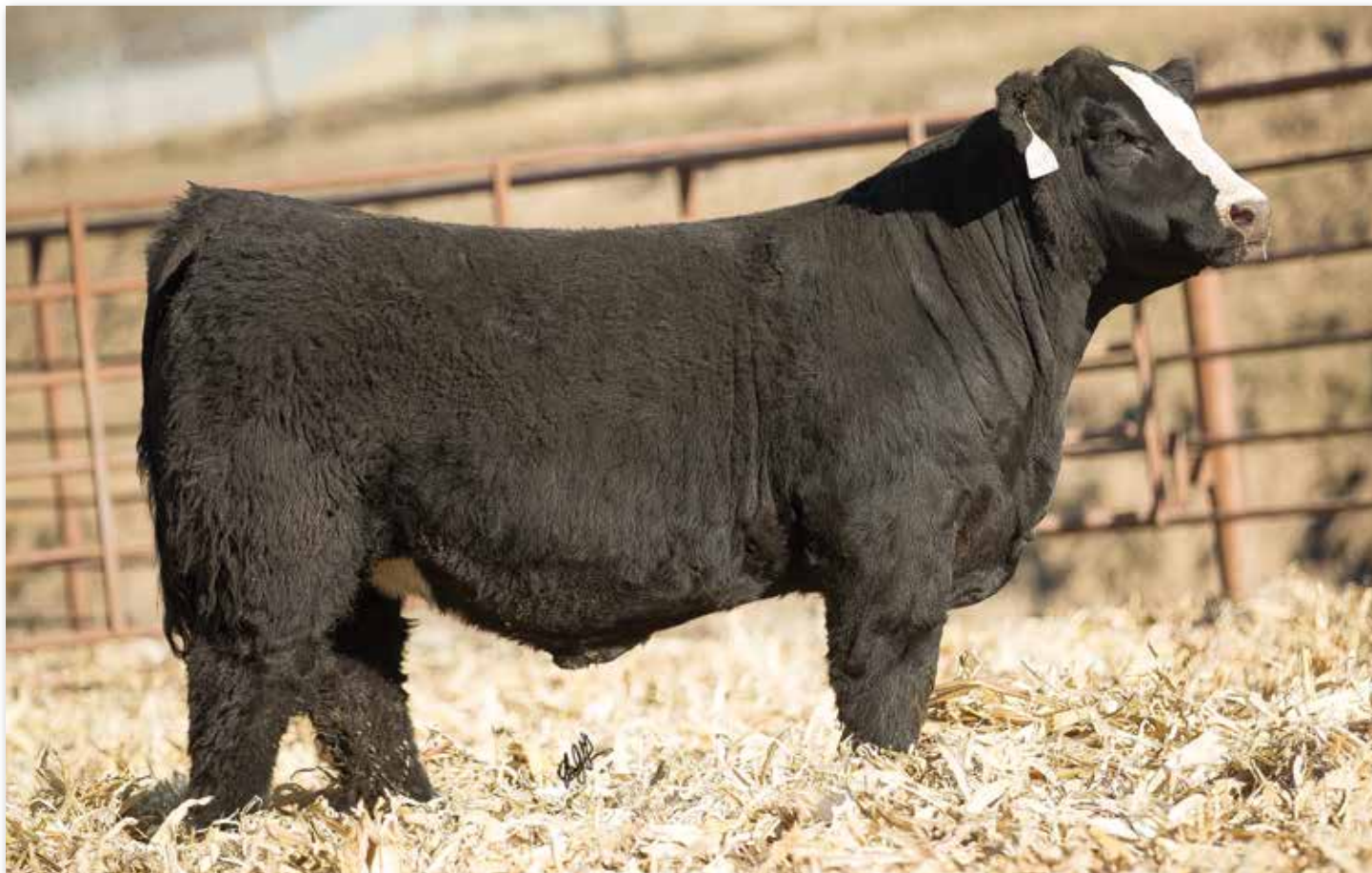
LOT 76 RUBY NFF BLACKLIST 149J

We used Blacklist on the 2124Z donor to try something different on her, mainly with the idea of making show heifers. I was absolutely blown away with the quality of bulls produced by this mating. They are good looking, stout made, big bodied, big legged, and great footed. They are sure to add extra eye appeal and maternal traits to your calf crop without sacrificing stoutness and performance. They are peas in a pod and would have made an awesome percentage pen in Denver. A full sister was a high seller in our past female sale. We hope you like these SimAngus studs as much as we do!