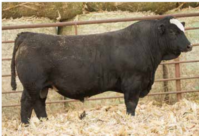
LOT 71 RUBYS ECHO 0H46

75% 75% 50% 75% 80% 50% 95% 55% 45% 25% 55% 65% 60% 65% 70% 55% 65% White faced bull that is stout made, soft middled, and very good on his feet and legs. Another very maternal bred bull who will make some front pasture females.