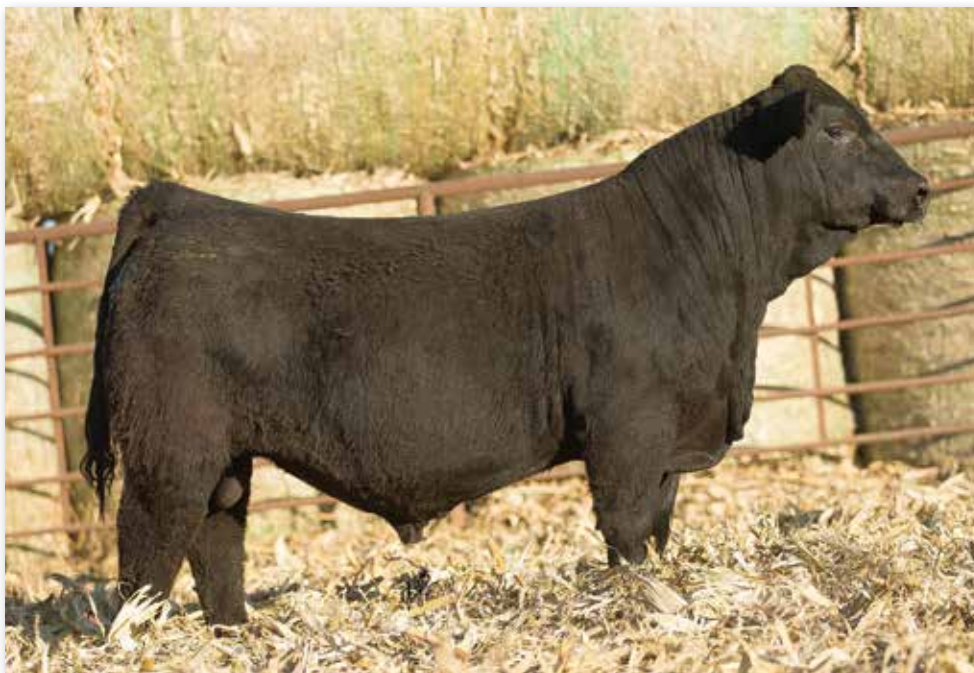
LOT 19 RUBYS TURNPIKE 179J