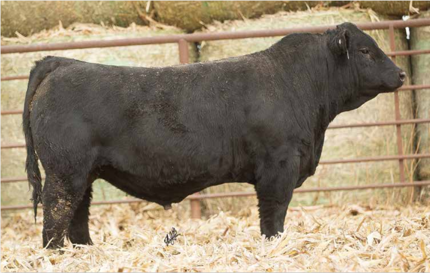
LOT 67 RUBYS EXCLUSIVE 0H36