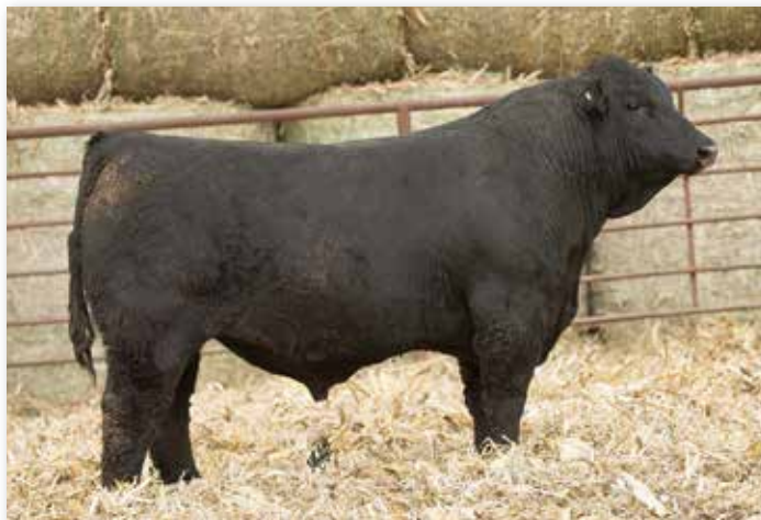
LOT 69 RUBYS ECHO 0H1

80% 75% 15% 20% 85% 30% 35% 45% 15% 70% 10% 95% 10% 90% 40% 25% 10% Unassisted out of a first calf heifer with a 165 IMF ratio.