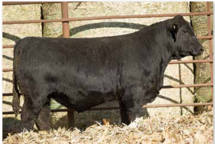
LOT 63 RUBYS GUARDIAN 196J

If you want a SimAngus version of some of these high powered Guardian sons, here he is. We love his Turnpike sired dam and the cow she comes from. The 176J Turnpike bull is a full brother to the 998G cow. 196J himself boasts an IMF ratio of 131, and with a 60# actual birthweight, here is a heifer bull prospect that is sure to help with carcass quality. As balanced on paper as they come with a great individual look.