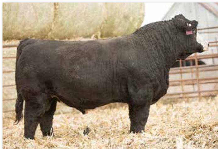
LOT 11 RUBYS SIGNIFICANT H0061