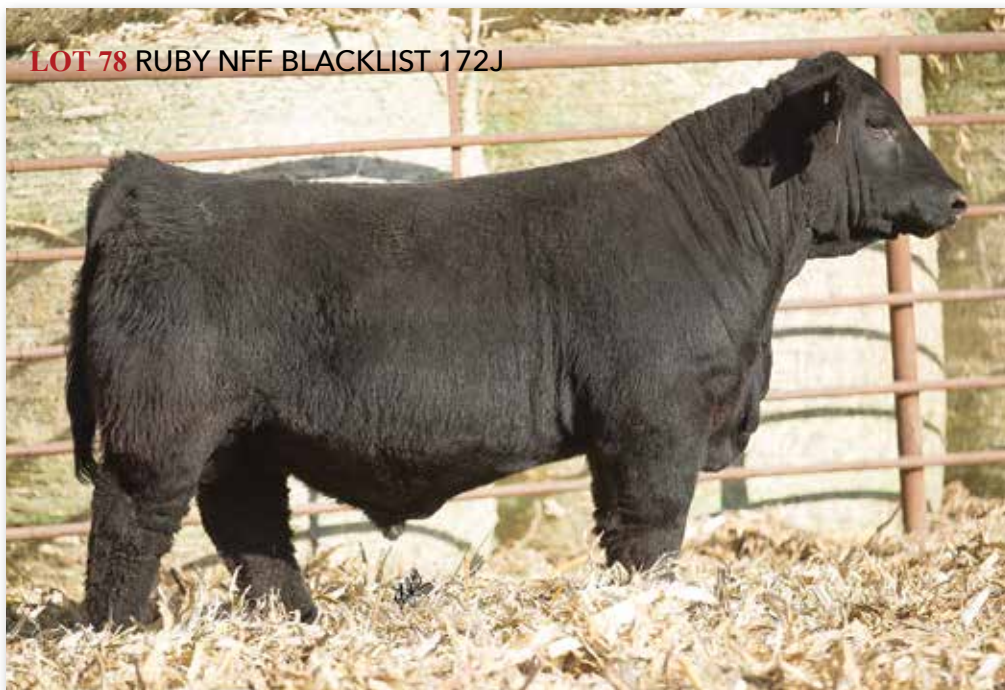
LOT 78 RUBY NFF BLACKLIST 172J