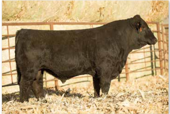
LOT 62 RUBYS GUARDIAN 198J

This Guardian son has really done every thing right. He started small with an actual birth weight of 54 pounds, yet ratios 112 and 107 for his WW and YW respectively. He has an above average REA and is right at average with his IMF score. He has one of the best dispositions in the pen as well. His is in the top 5% for about every measurable trait! Here is a heifer bull that will add pounds and is bred to make difference to your bottom line.