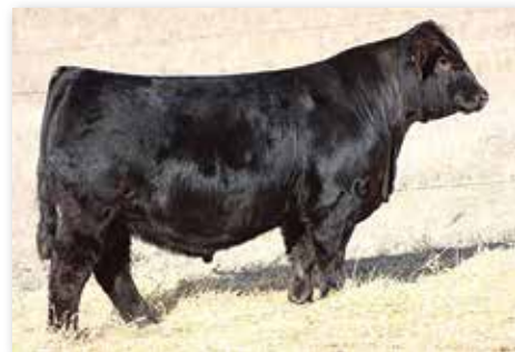
W/C EXECUTIVE ORDER 8543B Sire of Lot 66