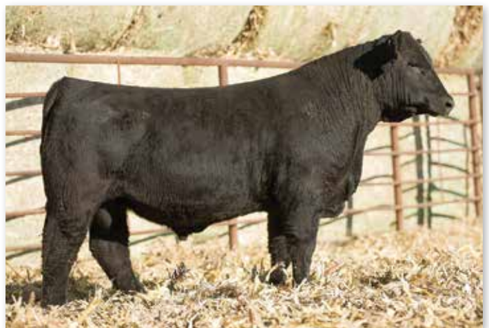
LOT 59 RUBYS GUARDIAN J103

Talk about a bull that puts together everything we are looking for. First and foremost, he has to be the most attractive top 1% API and TI bull that I have laid my eyes on. You will drive all over the country trying to find a better looking one that combines a set of EPD's like this guy. He boasts impressive ratios all the way from birth to ultrasound and the Rita cows that stand behind him have been raising the good ones here year in and year out. This one is really unique, make sure you find him.