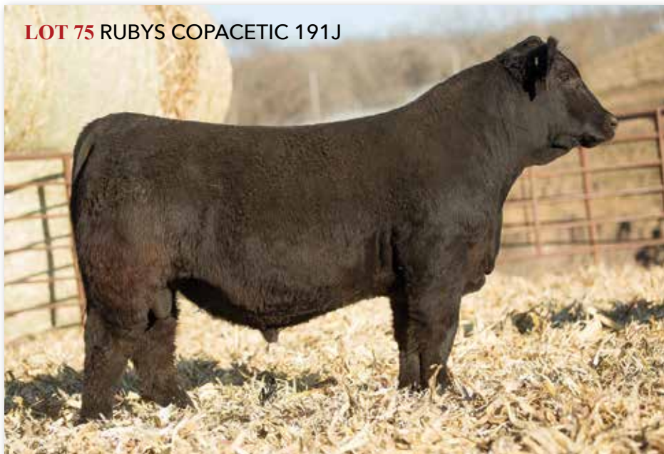
LOT 75 RUBYS COPACETIC 191J