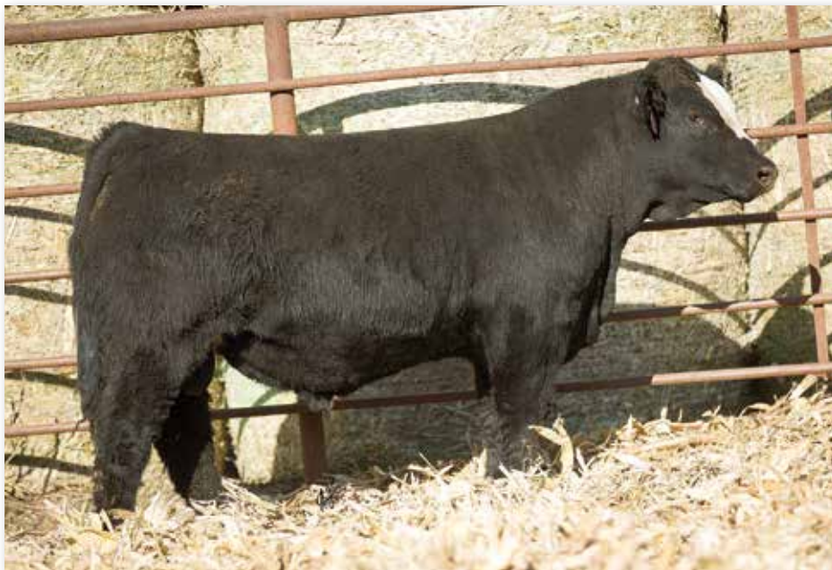
LOT 79 RUBY NFF BATTLE CRY 111J