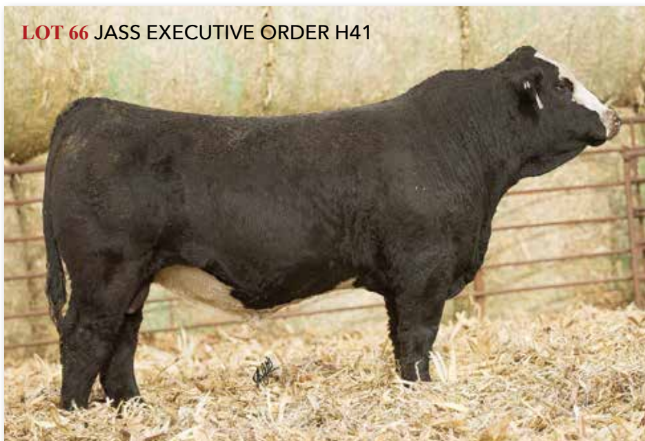
LOT 66 JASS EXECUTIVE ORDER H41