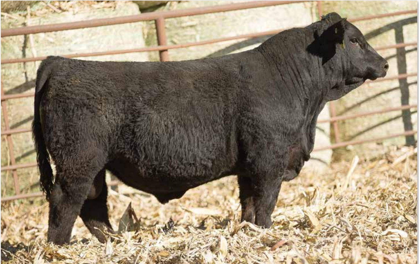
LOT 48 RUBYS GUARDIAN 1122J

In our breeding program, we haven't used much for Shear Force/Beacon genetics over the years. With a larger portion of our customer base retaining ownership of their calves, we went hunting for a bull that could add some marbling genetics and calving ease to compliment our stout made, high performing, big ribeye genetics we have been using the last few years. We landed on Guardian and have been extremely pleased with the results. His calving ease was awesome, but with that calving ease there was no growth sacrificed and still maintained the ever important integrity of feet and legs. We think the added phenotype of the females in our operation allow these sons to be some of the more attractive Beacon derivatives you will find across the country. You will also notice that the indexes of these bulls are at the forefront of the breed, and I challenge you to find a better combination of elite API and Growth figures anywhere else in the country. What a great combination sire group of heifer bulls, growth bulls and carcass bulls.