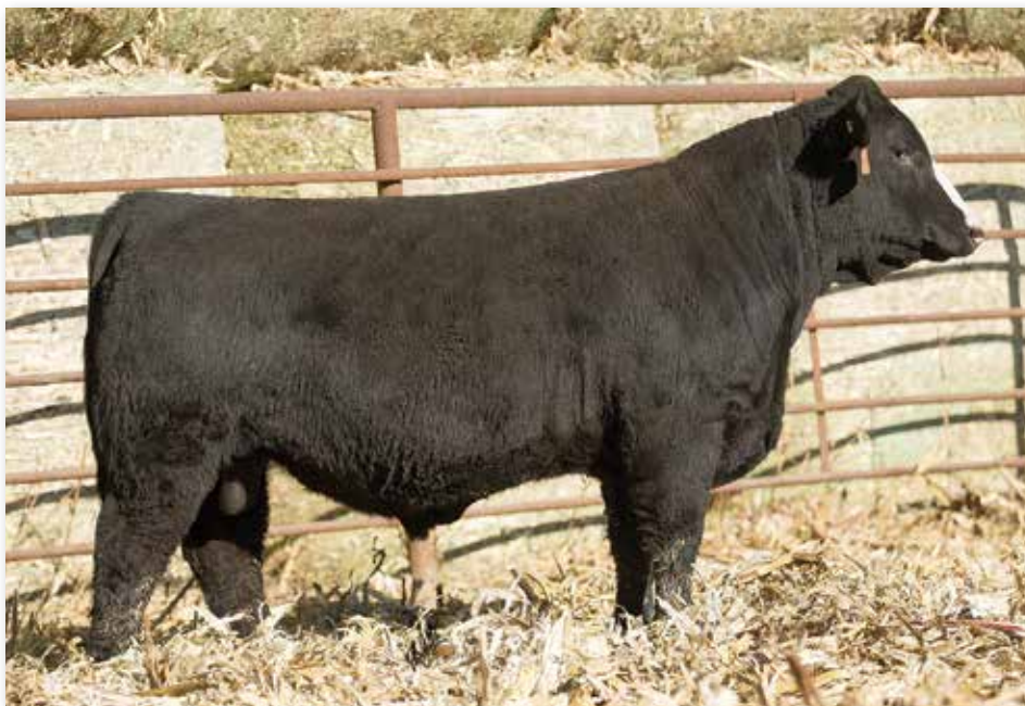
LOT 61 RUBY SC GUARDIAN 187J