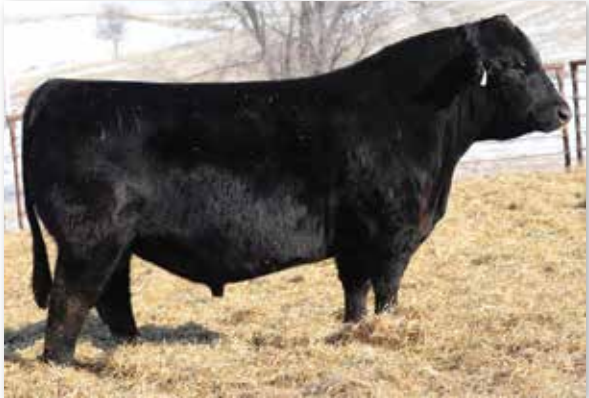
RUBYS TURNPIKE 771E - Sire of Lots 13-25

If you haven't yet figured out why we like these Linda's so well, take a look in here. This is the 341A donor's natural calf. Here is a true power and growth bull that will add pounds, increase ribeye size, yet doubles as a high maternal sire that is in the top 2% of the breed for Milk. I debated long and hard about turning this bull out in our program, but we are so limited where we can use him with several close relatives on both the cow and sire side. He is a great combination of 2 of the best producing cow families on the place and boasts WW and YW ratios of 118 and 120 respectively. Don't miss this one, he is really good and is sure to put more green in your pocket.