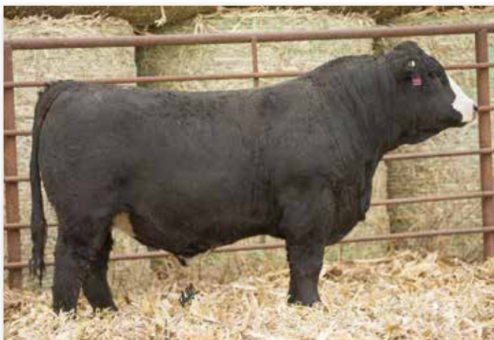
LOT 10 RUBYS SIGNIFICANT H0065

This is the first time that we have offered any male full sibs to the great Currency. Full sisters have commanded top dollar in our female sales and we think you will really like these brothers. All three brothers are blessed with that awesome blaze face, and are all very similar in their design. Good looking, stout made, big bodied, and athletic in their structure. Three full sibs that would be a great option to kick out on a big bunch of cows to keep the uniformity we're all after. Keep every female you can out of these bulls as well. Breeders take note of the H0065 bull. He is one of the very best bulls in the offering. It's not easy making them that good looking without sacrificing center body, muscle mass, and structure. He's the real deal without a doubt.