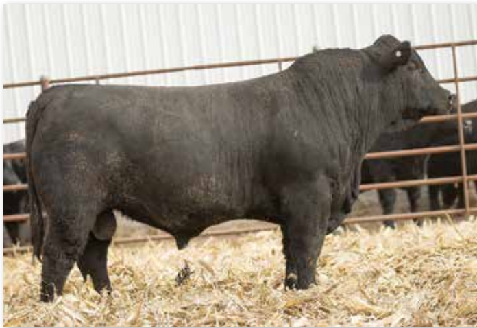
LOT 34 RUBY NFF CASH FLOW 0H59