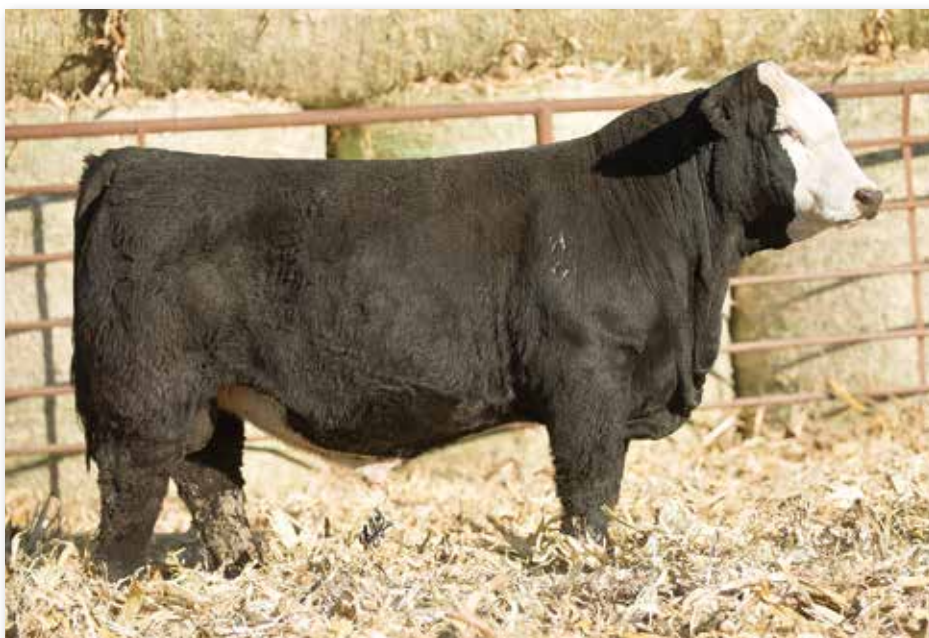
LOT 80 RUBYS JACK 141J