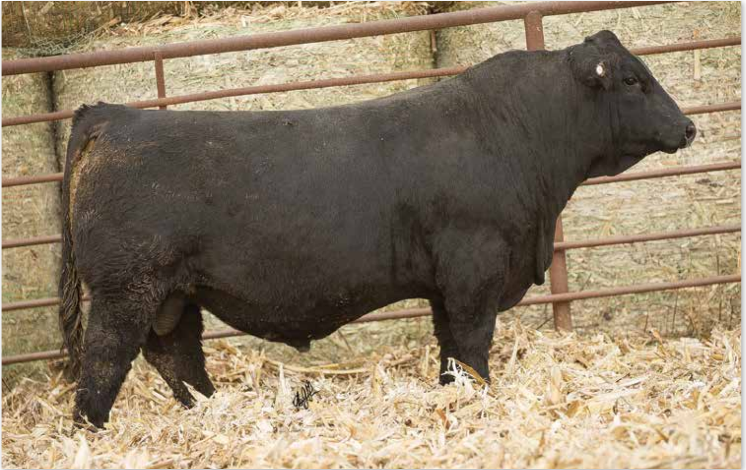
LOT 68 RUBYS ECHO 0H47