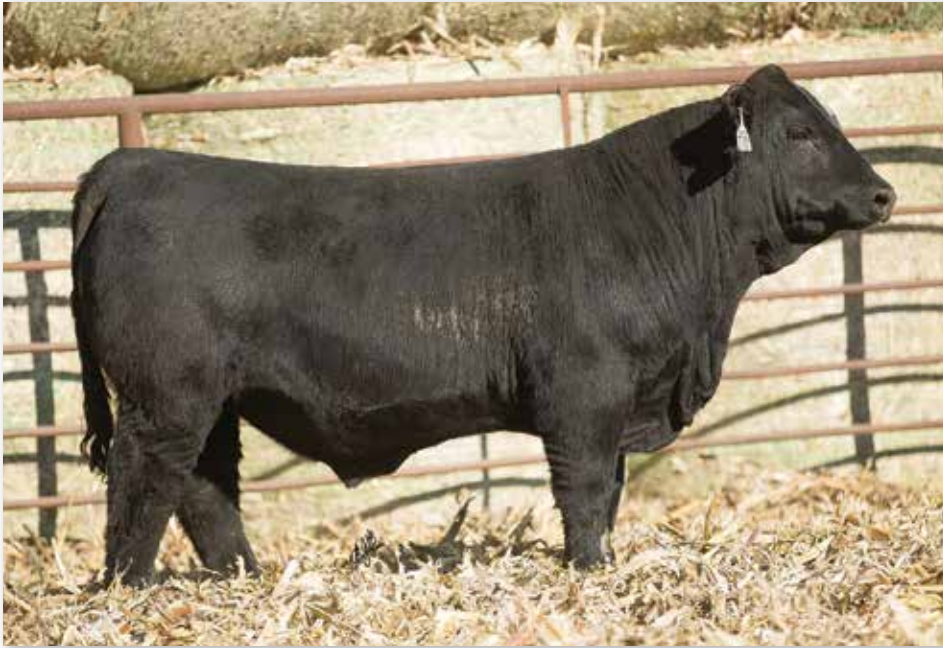
LOT 55 RUBYS GUARDIAN J101

If you pull up Guardian on the Simmental data base and do a search, here is the number 1 WW and YW offspring born to date. If you're looking for a growth and power bull to put on a mature group of cows, this one would be right at the top of my list. 128 WW ratio, 125 YW ratio, 121 IMF ratio, 106 REA ratio and did it all with under 0.2 of back fat, that's impressive! There are several generations of great cows in the Juanada family that stand behind this bull as well, so you know he will leave you with some great females too. With his slick hair coat and great feet and legs, he is ready to thrive on fescue pasture. Bulls like him aren't offered every day, so take advantage of the opportunity here!