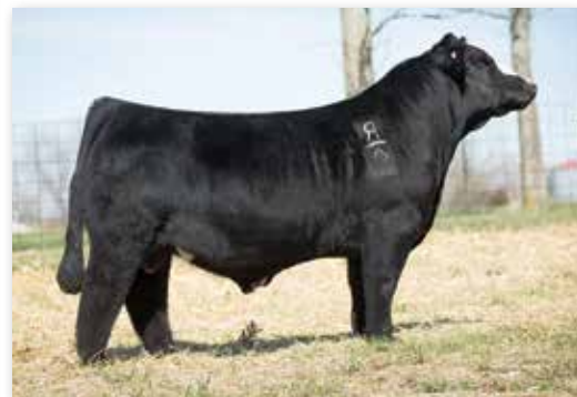
Ruby NFF Up the Ante 9171G Three-Quarter Brother to Lot 15