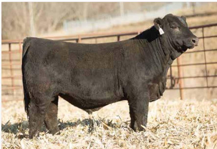
LOT 25 RUBYS TURNPIKE 1175J

One of the youngest bulls in the offering but one of the highest performing. He was the number 2 WW bull in his contemporary group at 840# with a 117 ratio. If you want to add pounds yet keep mature cow size in check, this is your guy.