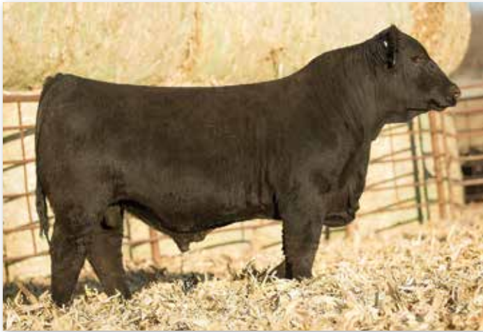
LOT 44 RUBY NFF CASH FLOW 182J

The next three spring yearling Cash Flow sons are backed by the maternal influence of western origin Angus cows that originated from the A&B Ranch. Much like their brothers that are age advantaged, this trio of brothers are tremendous footed, big ended, sound-built herd sire prospects that are designed to last. They have balanced genomic data and come with the extra frame size and length of body necessary to sire market topping feeder cattle. They have the growth, carcass data, eye appeal, and strong maternal backing to warrant your appraisal.