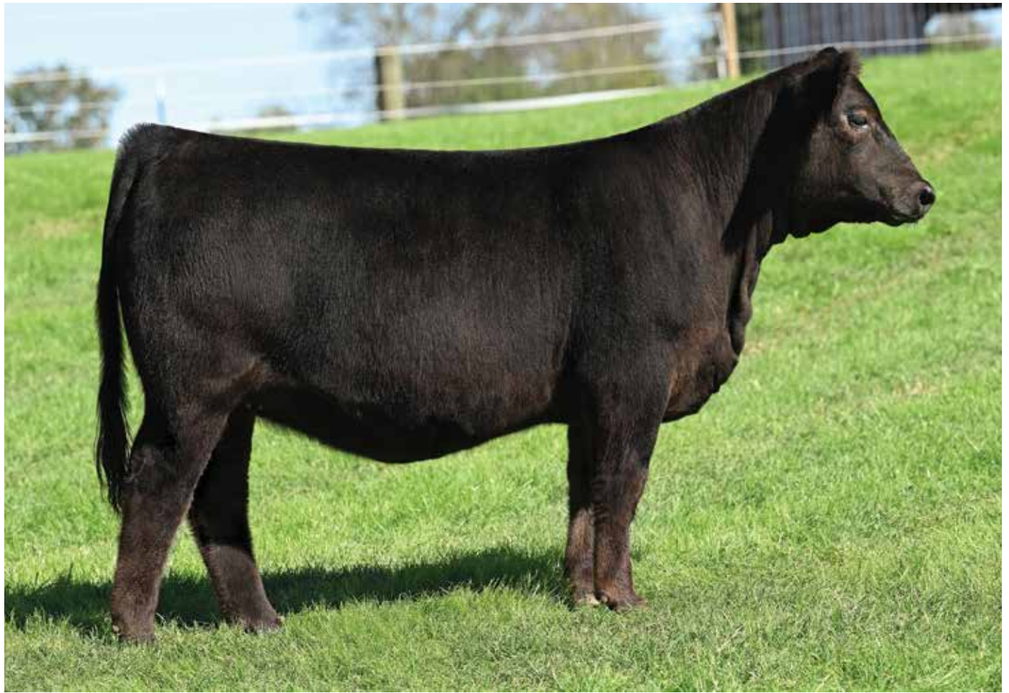
Lot 3 - MISS CCF BREATHLESS

The lineup of Jestress B79 progeny in this sale is impressive. This Duke daughter didn't want to show off her up headed, eye catching presence on picture day but trust us, you won't be disappointed when you see her on sale day. She is the definition of sound and good footed. We feel this one exemplifies what it means to be fancy and broody in one package. At the end of the day, her type are the ones that make it in the real world. Seller retains the right to one successful flush with a minimum of six transferable embryos.