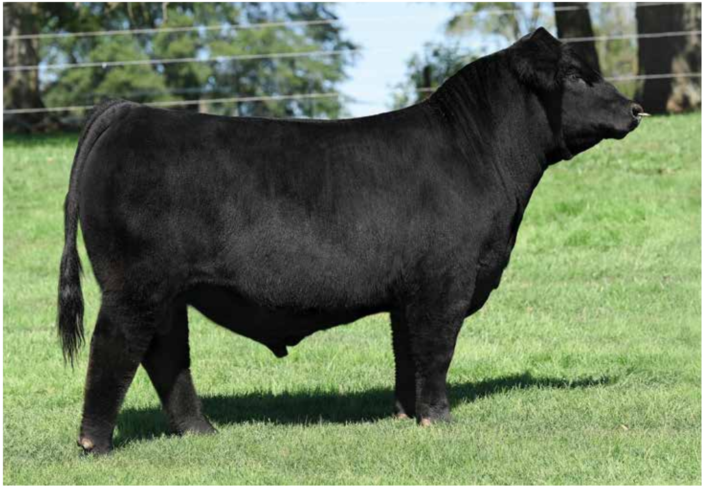
Lot 2A - MR CCF BILLS PAID

Finding a herd bull prospect that carries the same massive physic, explosive muscle shape and ultra-dense body composition as Bills Paid J306 will be a difficult task. He is a very impressive bovine that is for sure, to be able to carry all the product he possesses with the ease that he does makes him unique among contemporaries in the breed. The Pays To Believe ZU194 progeny have proven to be versatile, they are accepted on either end of the industry, have true shape and performance and the daughters are expectational mothers. Then you look to the maternal pedigree that supports Bills Paid J306 and it doesn't leave much further to be desired, the B79 Jestress female has emerged as perhaps the most potent daughter of the 9015 matron we have had the privilege of propagating. A herd bull that will make a positive impact regardless of your selection criteria. Please contact the Innovation AgMarketing team or C&C Farms for details.