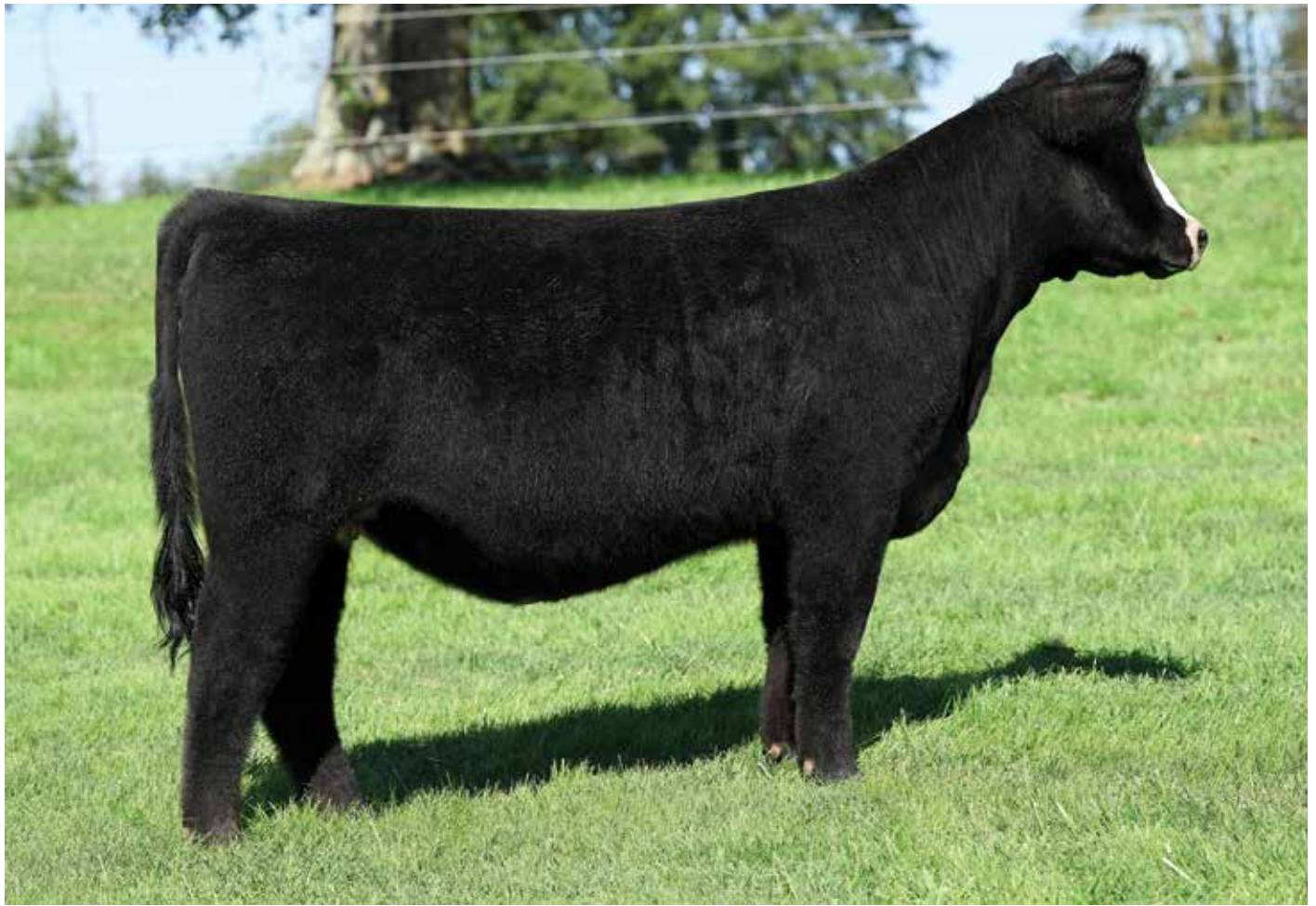
Lot 42 - MISS CCF PEARL