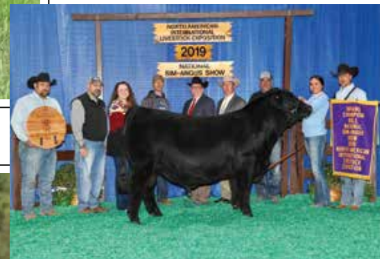
RECKONING 711F - Sire of Lot 8A & 8B

This one grabs our attention every time we walk in the pen. So big bodied and super sound. When you think of cow power, she would fit the bill. Ones that are so easy keeping are the money-making kind. Along with the brood cow potential she still carries the showing eye appeal with plenty of arrogance.