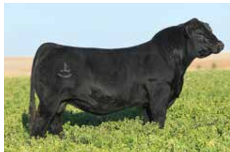
KCCI EXCLUSIVE I16E Sire of Lot 114