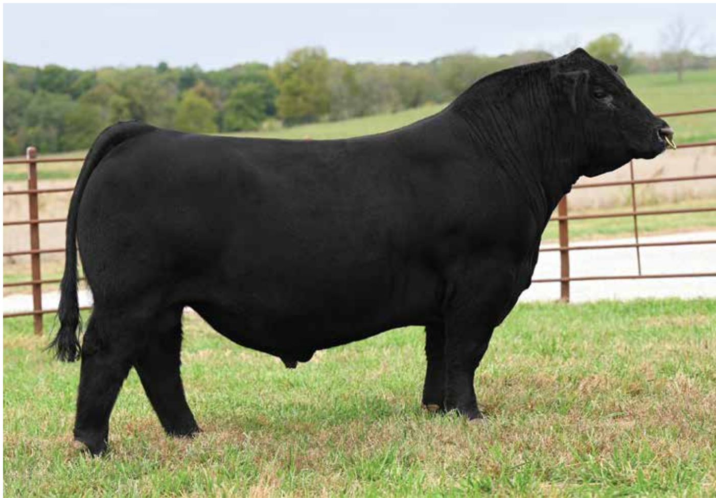
Lot 101 - HBE G-MONEY