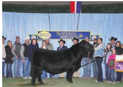
RECKONING 711F - NAILE, NWSS, & Cattlemen's Congress Grand Champion Product of the Champion Hill Blackbird 8003 cow family!