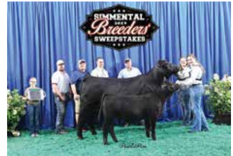
2019 SIMMENTAL BREEDERS SWEEPSTAKES GRAND CHAMPION COW-CALF PAIR

A Purebred daughter of the promotional sire, JSUL Something About Mary that has created quite the stir with his rookie calf crop, and out of a beautiful FBF1 Combustible female. This solid black late February born heifer calf leaves nothing further to be desired in regards to stoutness of feature and dimension, yet the way she collects herself on the move is impressive. We think this one is very unique from the standpoint of her build, and offers a pedigree that is versatile enough to mate to many of the popular options the industry is trending towards.