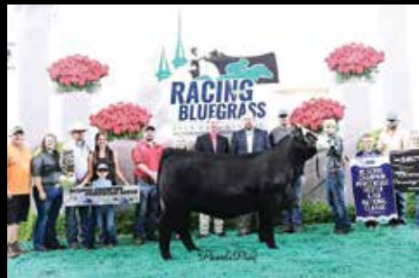
MISS CCF TGF JESTRESS Full Sister to Lot X