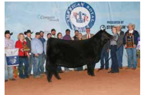
2021 AMERICAN ROYAL SUPREME CHAMPION JUNIOR BREEDING HEIFER - Maternal Sister to Lot 41