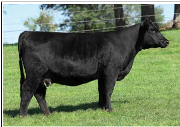
Lot 15 - MISS CCF JESTRESS G412