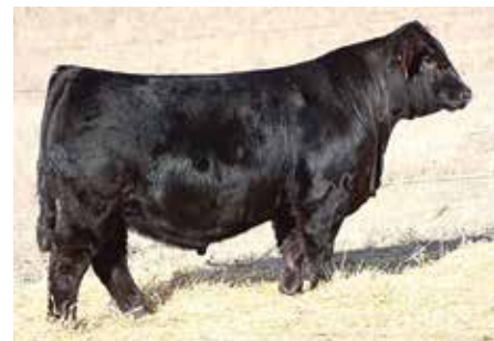
W/C EXECUTIVE ORDER 8543B

Talk about a stout, rugged bull that is super sound, big footed and could cover a large set of cows. Change up is what we like to think of as a multipurpose bull that should add some look along with some growth, power and performance to his calf crops.