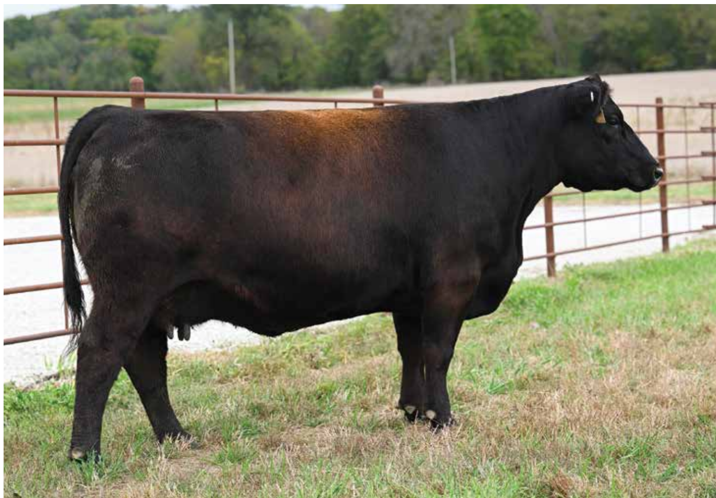
Lot 28 - T-T BLACKBIRD F12