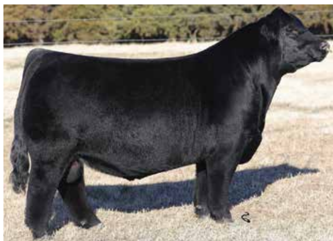
JSUL SOMETHING ABOUT MARY 8421 - Sire of Lot 9

Look how square and neat this one is built, she is a daughter of the most talked about sire in the Simmental breed, the Relentless son out of the triple crown winner JBSF Proud Mary. His name is JSUL Something About Mary 8421 and this marks an early opportunity to get in on his influence, if he continues to consistently make offspring at the caliber of Denna J116 he will go down in the history books of the breed. We like how dense this one is built, she has natural dimension underneath her good hair coat, couple that with the maternal power you will receive from the Broker x Jestress 9015 female on the bottom side and we think this is a big-time opportunity.