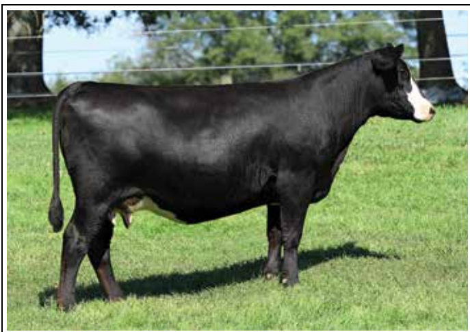
Lot 14 - MISS CCF SPADE G37