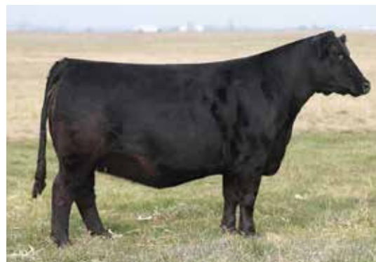
CMFM JOY 02ZB - Paternal Grandam of Lot 102