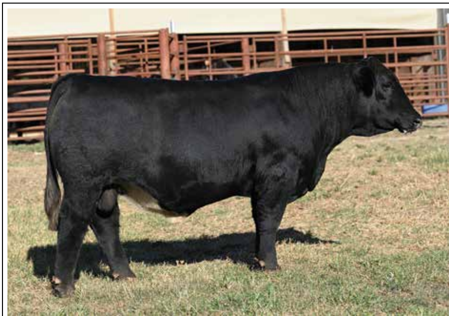
Lot 112 - MR CCF H156

H156 is the stout featured, performance driven son of the $250,000 TL Ledger. This Purebred herd sire prospect is backed by the widely popular and proven Miss CCF Sheza Looker cow family. A powerful herd bull that will add pounds, look, and generations of predictable lineage to any cowherd!