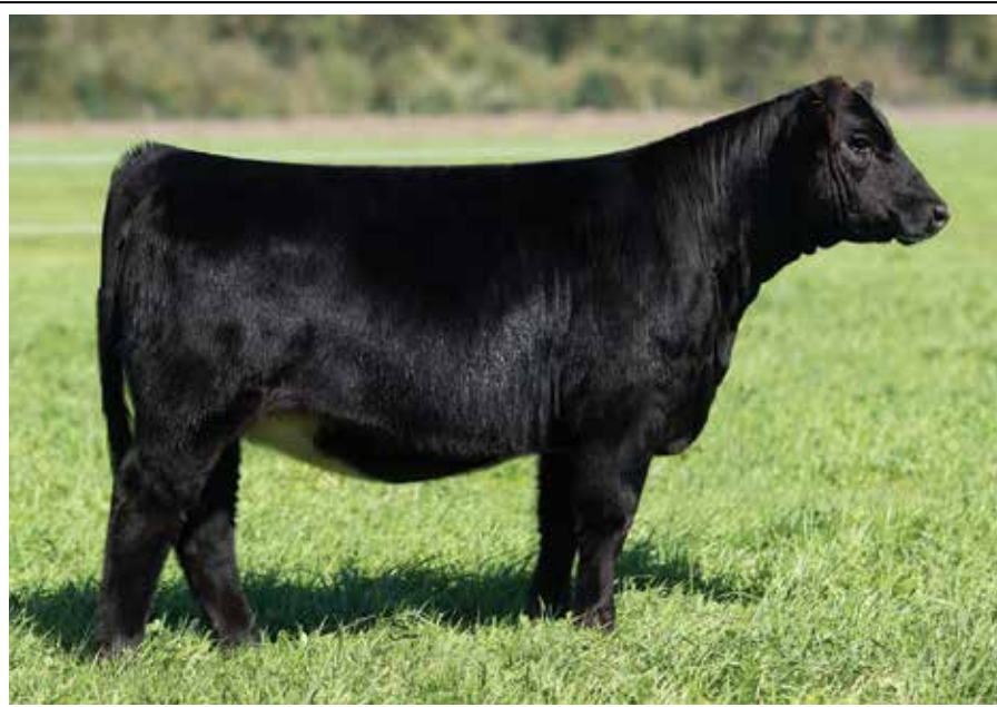
Lot 34 - WPCC GEMSTONE J056

A late March born Purebred daughter of W/C Relentless 32C that has the big belly, shapely rib cage and big, soft running gear. We love the stoutness and body shape Gemstone J056 combines with the good looks and soft hair type. You'll notice the One Eyed Jack female on the bottom side of her pedigree, with this comes udder quality and mothering ability.