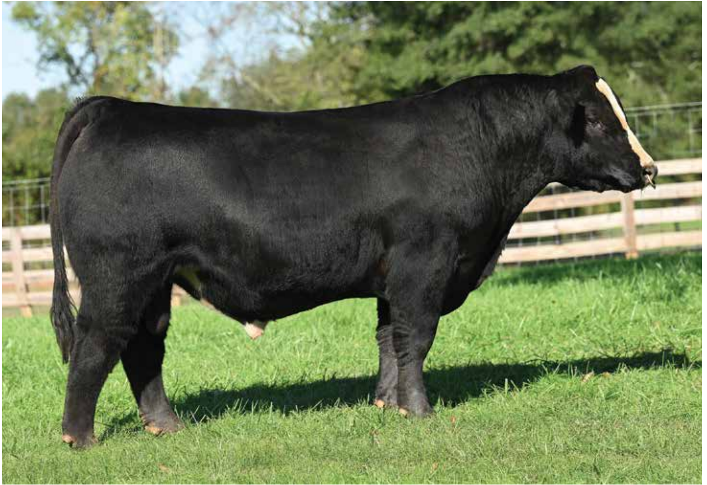
Lot 103 - MR CCF LIKEWISE