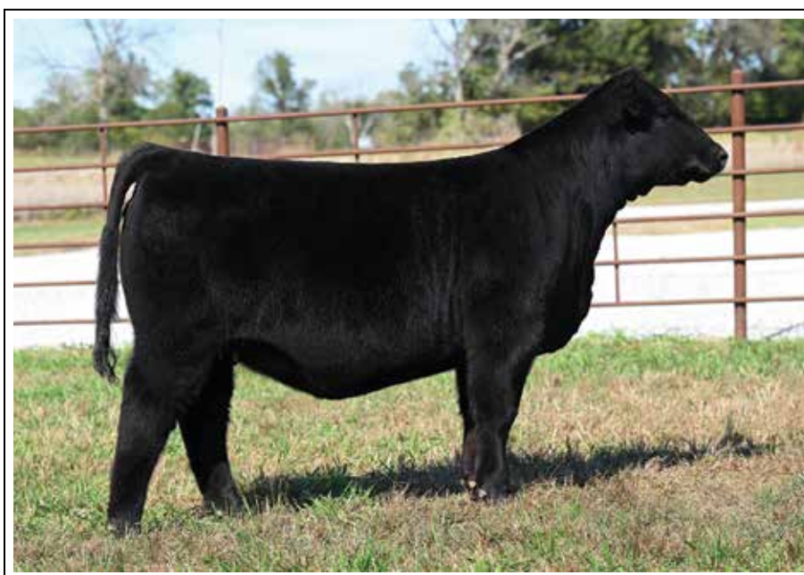
Lot 26 T-T BLACKBIRD J04

The backing of T-T 8003 does it again. We were excited to see how KCC1 Exclusive 116E would work on her and man are we glad we decided to flush her this way. J04 is so cool looking from the profile with added muscle shape and dimension. She is sound, good middled and has a great disposition to boot. 8003 is a no miss type female and J04 may be one of her greatest accomplishments to date. Check her out on display at the 2021 North American International Livestock Exposition.