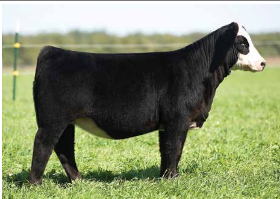
Lot 38 - WPCC J036

If you're open to working with one that might be in one of the smaller divisions at the AJSA National Junior Heifer Show, then your attention here would be well warranted! Here is a stylish May born daughter of the National Champion TJSC Hammer Time 35D that is striking from any vantage point. This Purebred is shapely about her mid-section and square about her stance, we love her baldy face and the presence she struts with.