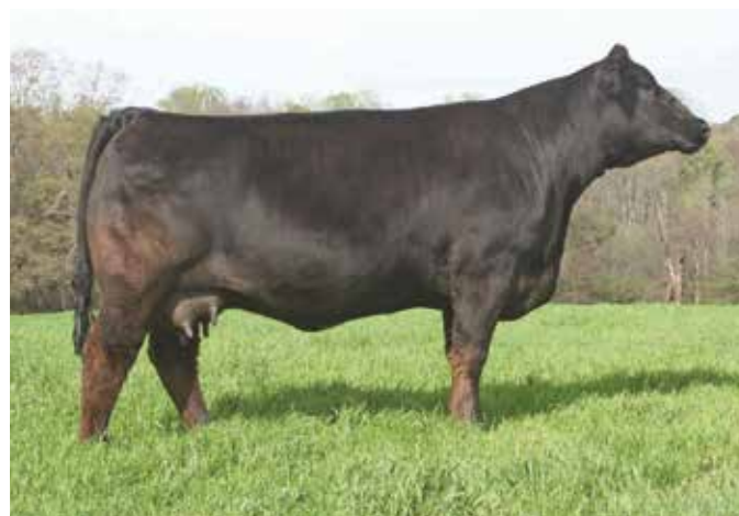
HTP SVF DEW THE STROKE - Dam of Lot 115

A full brother to Mr CCF The Duke and the deceased Mr CCF 20-20. Sired by the popular Mr CCF Vision. Masterplan is a sleek, smooth made and sound coming 2 year old. A bull that should give some added value along with a consistent and proven pedigree.