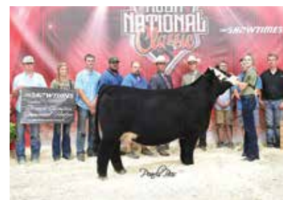
S/P TRUE LOVE F789 2020 AJSA National Classic Reserve Grand Champion Purebred – Maternal Sister to Lot 35