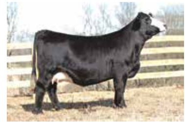
MISS CCF SHEZA DREAMER Dam of Lot 19