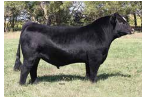
MR CCF 20-20 - Sire of Lot 106

Mastermind is fun to look at out in the field. He grabs your attention with his overall composition. It's just hard to pick a big hole in this one. His mother was Reserve Champion Percentage Female in the 2016 NAILE Jr. Show and has gone on to be a donor female for our program, she is consistently making high quality cattle with a unique look.