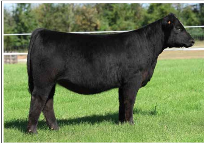
Lot 7 - CIRCLE T CHILLING

This could be one of the sleepers in the sale, but boy is she made cool! The Jestress B79 daughters are proving to be more than just banner hangers! You have to be productive out in the field and they are doing that. This Duke daughter is beautiful in her skeletal design and super sound! Give this one time and feed and we think she could be special!