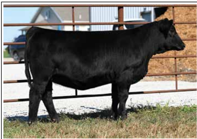
Lot 21 - T-T MAYFLOWER J98

The mother of T-T Mayflower J98 was the top selling pair in the Inaugural Clear Visions sale demanding $10,500, that initial investment has proven to be a good one for us as her position in the T-T cowherd continues to be very profitable. J98 has a royal pedigree, it is stacked on both sides and we think her phenotypic quality needs to be seen in the showring. She is a big growth, stout, sound female that keeps impressing us as she matures. Another Purebred that we are very excited to see exhibited, however we know that some of her best days could be still yet to come as she's turned out to pasture.