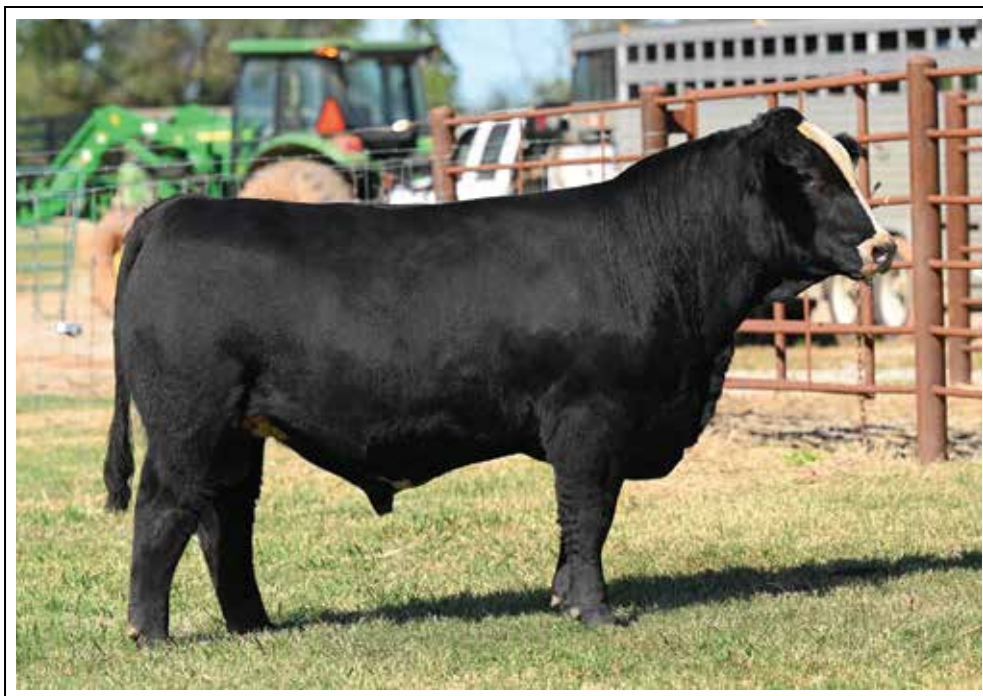
Lot 110 - MR CCF SHARP SHOOTER