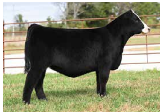
T-T BLACKBIRD J06

Maternal Sister to Dam of Lot 101, sired by W/C Bankroll 811D