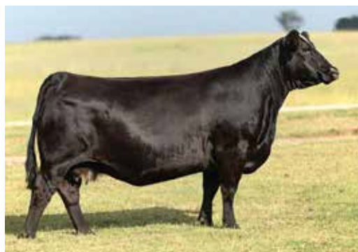
RWA KRISHA ET - Maternal Sister to Lot 24 & Dam of the Many Times Champion Percentage Simmental Bull, Reckoning 711F