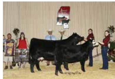
2017 AJSA NATIONAL CLASSIC GRAND CHAMPION PERCENTAGE COW CALF PAIR