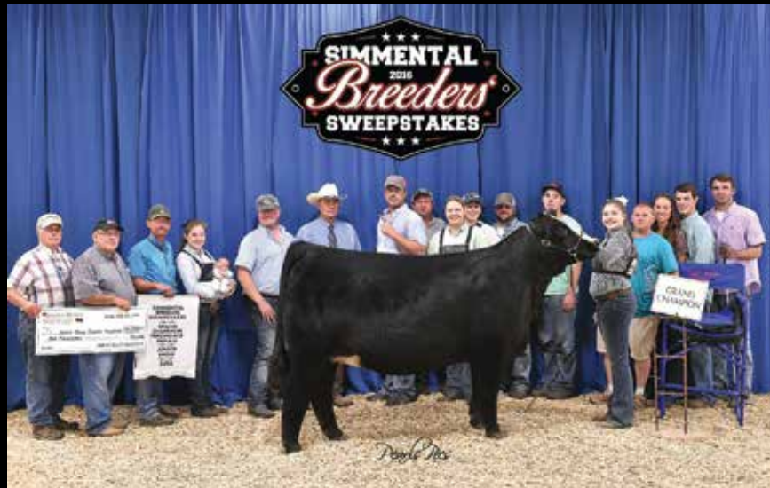
2016 SIMMENTAL BREEDERS SWEEPSTAKES SUPREME CHAMPION