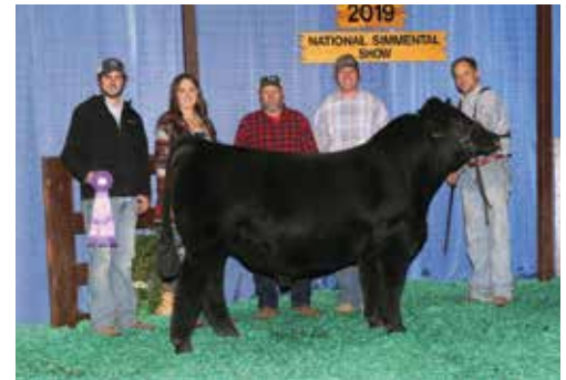
MR CCF THE DUKE Sire of Lot 33

This initial calf crop of MR CCF The Duke progeny have us excited to keep using his influence at the breeding box, the combination of power, dimension and structural integrity he is delivering is impressive. You will notice the sire of significance on the maternal side of Daisy Duke 106J to be Profit, and then turn to her maternal Grand Dam and see another member of Simmental royalty, the SVF Above & Beyond T87 matron. In short we just hope you realize the maternal power that has equated to what we will bring to Jefferson, Georgia.