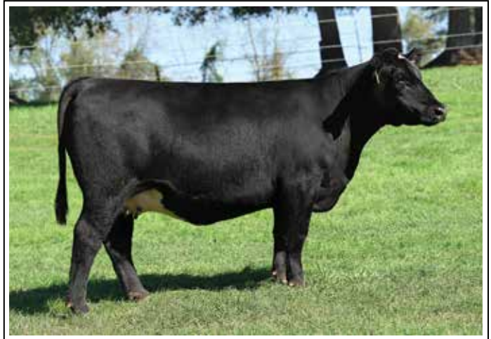
Lot 13 - MISS CCF IMAGINE THAT