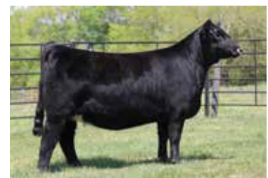
CTS SHEZA BONNIE TWO T18G Maternal Sister to Lot 20