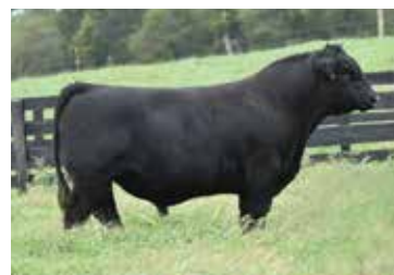
MR CCF LEDGER G702 Sire of Lot 32