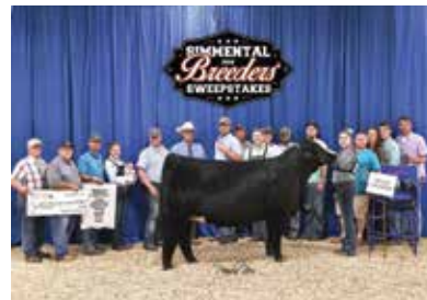
2016 SIMMENTAL BREEDERS SWEEPSTAKES SUPREME CHAMPION