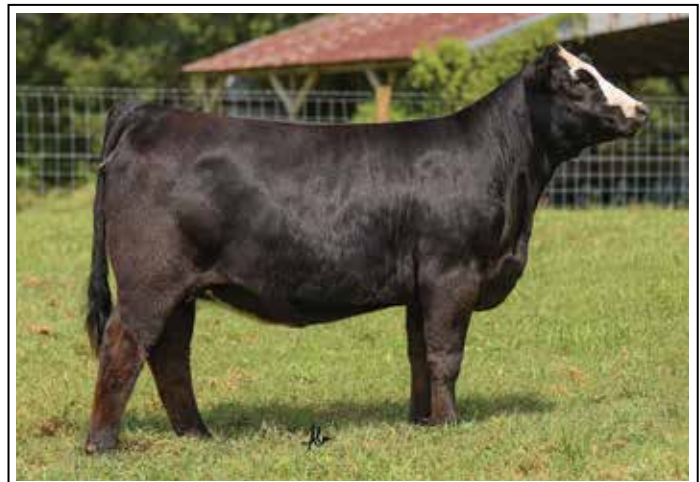
Let 2C - MISS CCF BLOSSOM

Guaranteeing 1 60-day pregnancy if transferred by a certified technician.