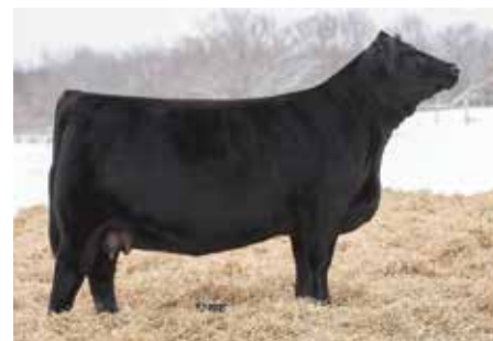
CAJS SWEET EMOTION 42Z Maternal Grandam of Lot 38