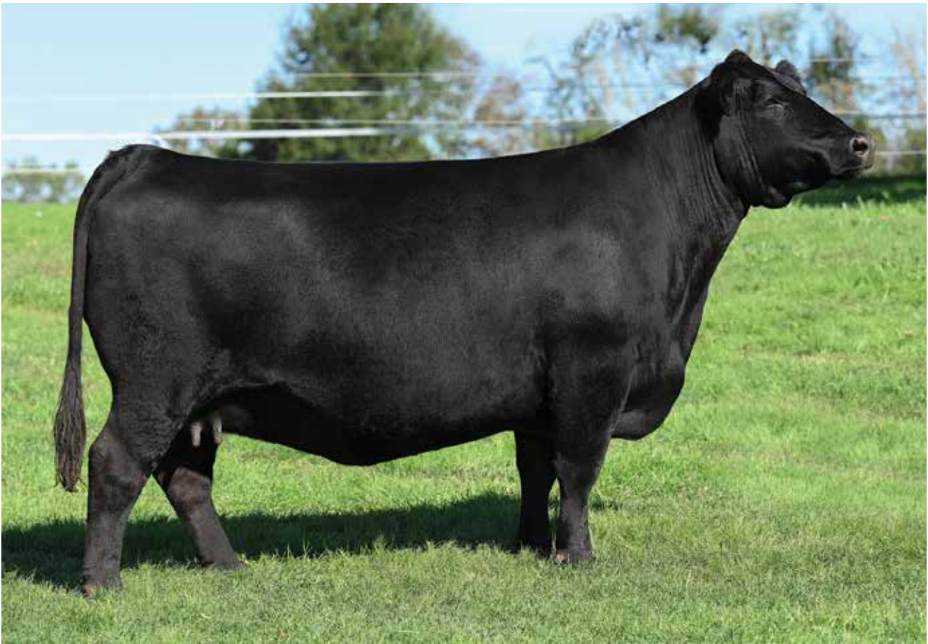
Lot 45 - MM SHADOE 5121

You can check the inventory records around the ranch and not find too many Purebred Angus females on the charts, so when you do find one, just realize they have had to pull their weight, or be very easy on the eyes to hold their spot at the feed bunk. A direct daughter of the Angus phenom EXAR Blue Chip 1877B, a sire that has immortally left his mark on the Angus breed as the producer of high selling and award winning seedstock. We purchased Shadoe 5121 from the Grimes Family of Ohio, as a centerpiece for building the Percentage Simmental program here at C&C. The BC Lookout female on the maternal side of 5121 remains a mainstay donor female for Maplecrest Farms, and her Grandam is the infamous Gambles Shadoe 3117 that was Reserve Grand Champion Female at the Angus Junior Nationals for the Schnoor Family. There are generations of the Angus breeds most potent cow families aligned in the pedigree of 5121.