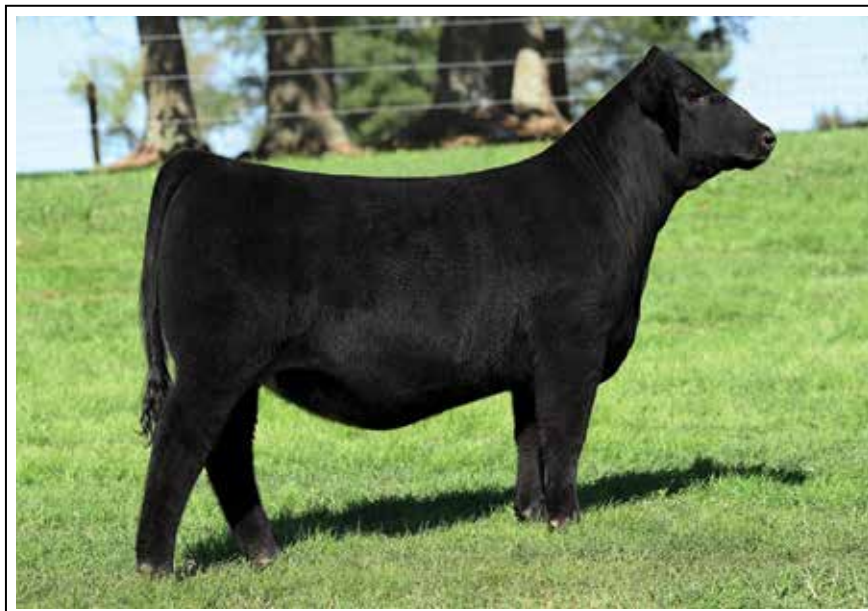
Lot 5 - MISS CCF SHIMMER

Not only does this one have a pedigree for the times but she looks as well! Out of the Blaze donor, a full sib to the "Diddo" donor out of one of the most popular Simmental bulls in the business, HPF Quantum Leap Z952. It's pretty easy to find this one in the sale group. There are not many holes you can pick in this female. She is awesome in her skeletal build, with a great turn to her rib. Her feet and legs are phenomenal! Promising future with a proven pedigree.