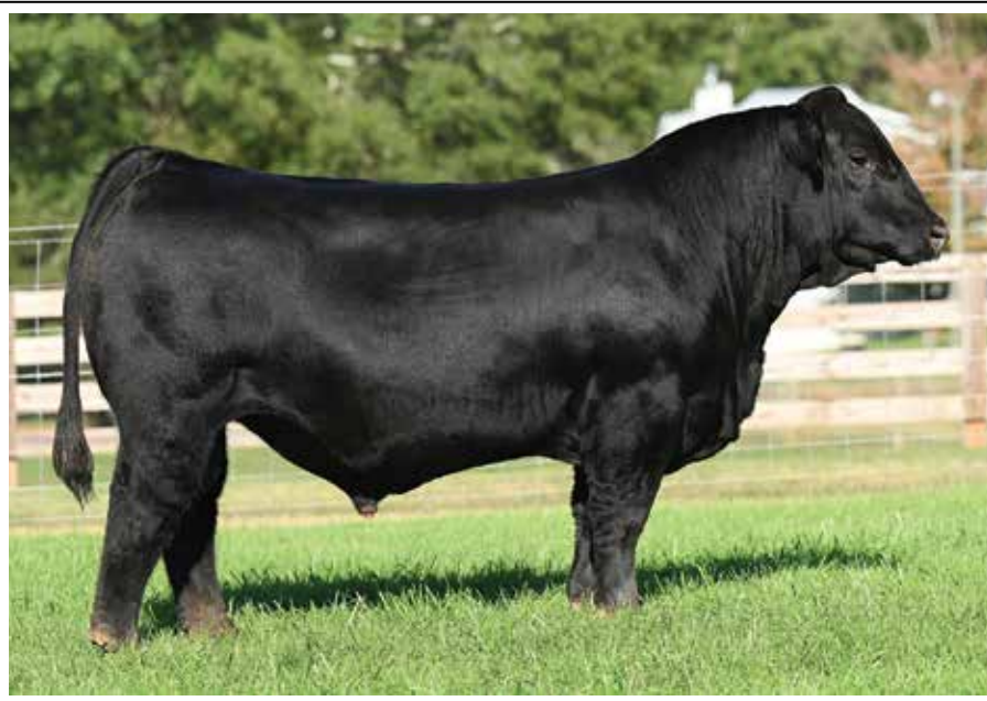
Lot 107 - MR CCF RECKLESS

An investment made here would be anything but reckless, because this homozygous polled son of MR CCF 20-20 would be a great addition to any cowherd that pays attention to structural integrity, udder quality and longevity. You will hear us harp on about how much we like these 20-20 cattle regardless of sex, because we truly believe that we will feel his influence for generations to come in our cowherd. He goes back to the Jestress cow family on the bottom side, it does not get anymore from the heart of our breeding program than this. Retaining 1/3 Semen Interest.