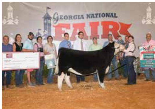
2019 GA NATIONAL FAIR 3RD OVERALL JUNIOR BREEDING HEIFER - Dam of Lot 42