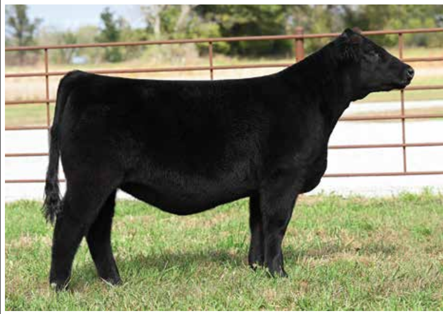
Lot 25 T-T BLACKBIRD J03