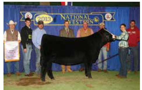
MISS CCF SHEZA BONNIE Y61 Maternal Granddam of Lot 114