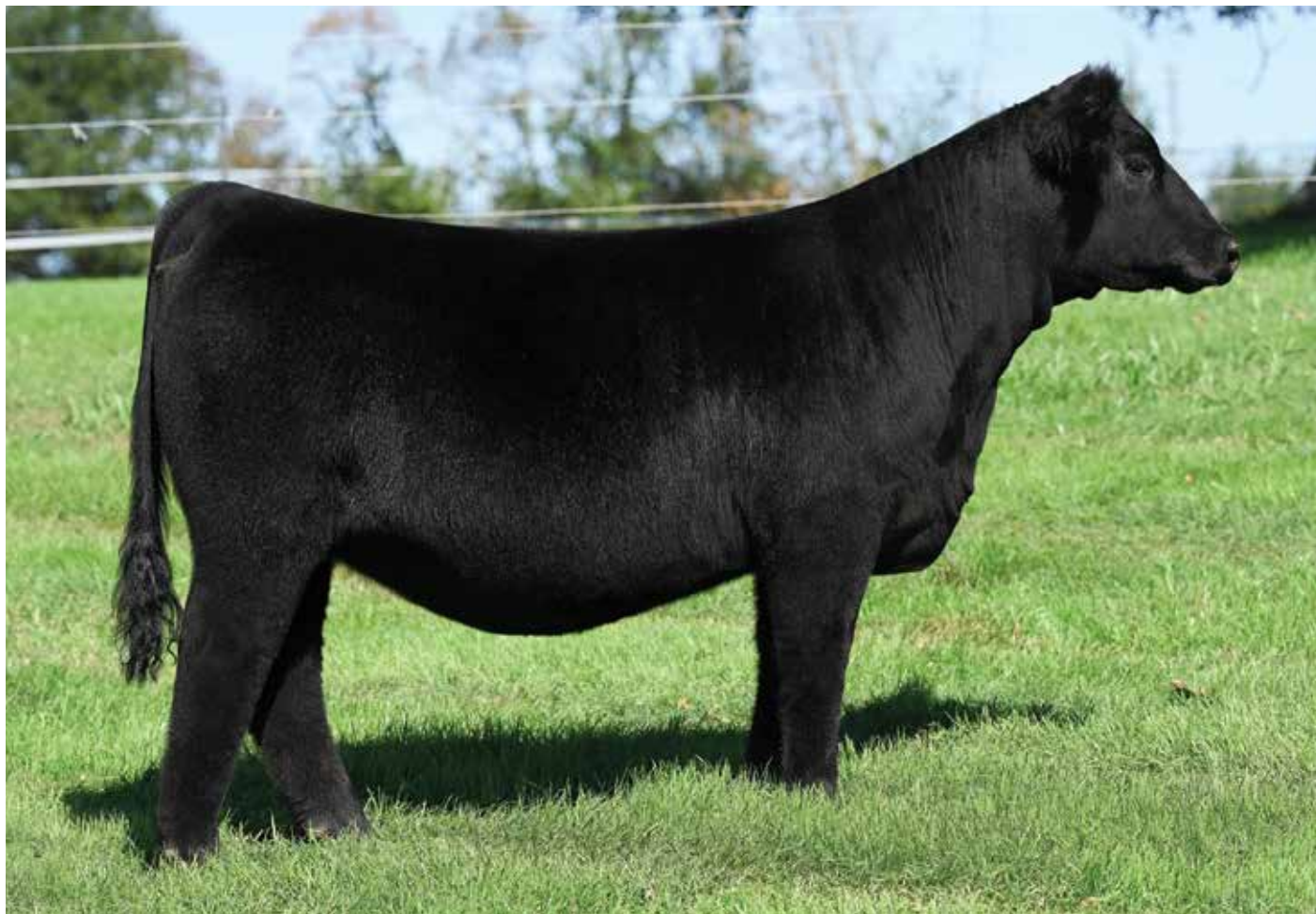
Lot 29 - CIRCLE T ALLIE