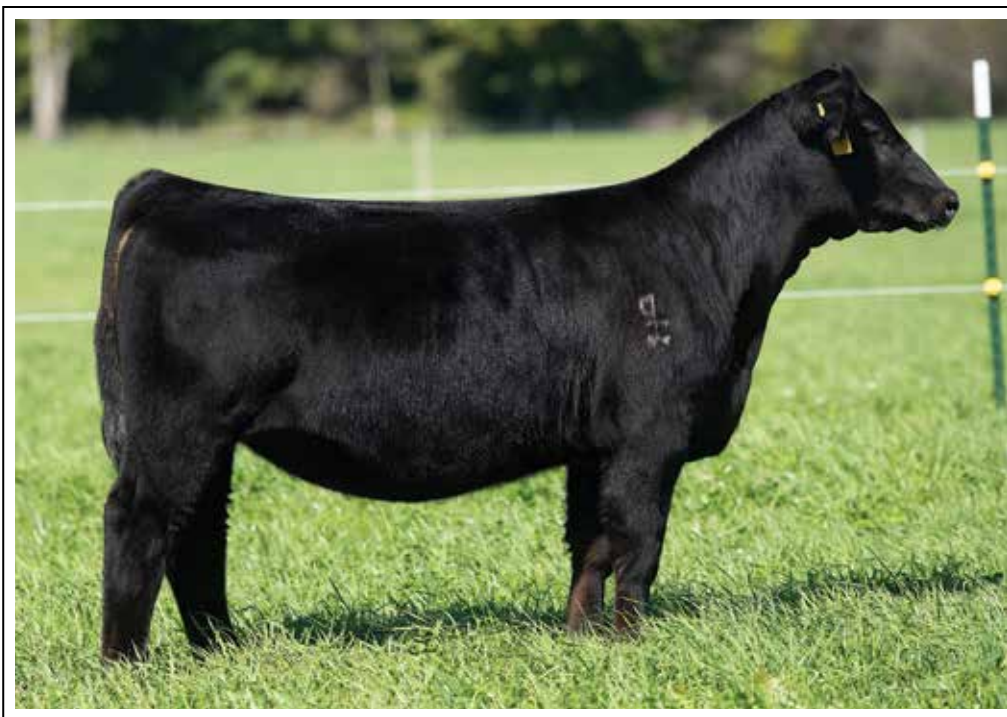
Lot 35 - S/P RIGHT IN LOVE J484