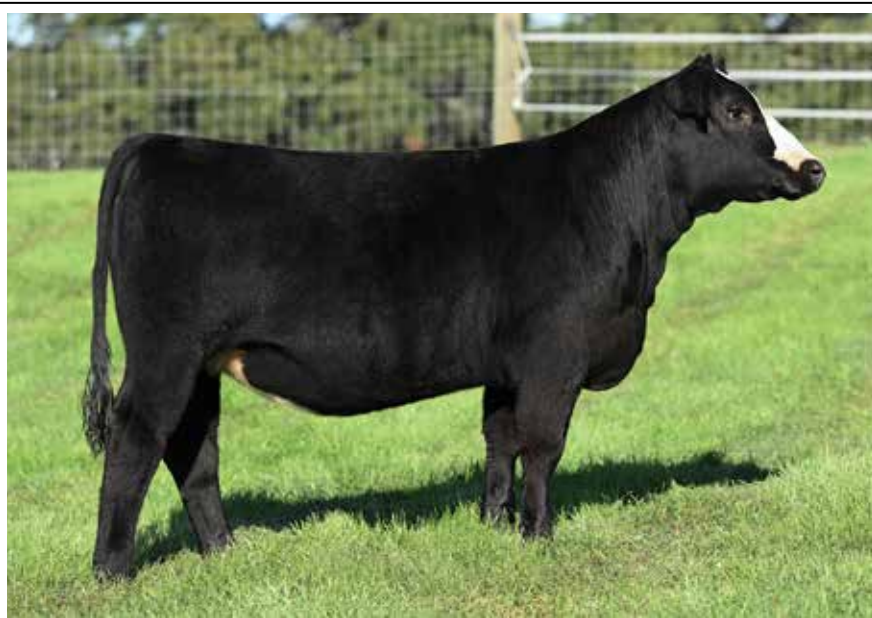
Lot 20 - MISS CCF BONNIE J603