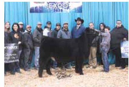
2021 KS BEEF EXPO RESERVE SUPREME CHAMPION Full Sister to Lot 1