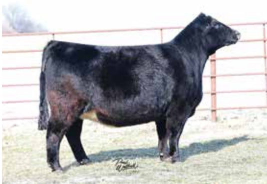
DAUGHTER OF A203