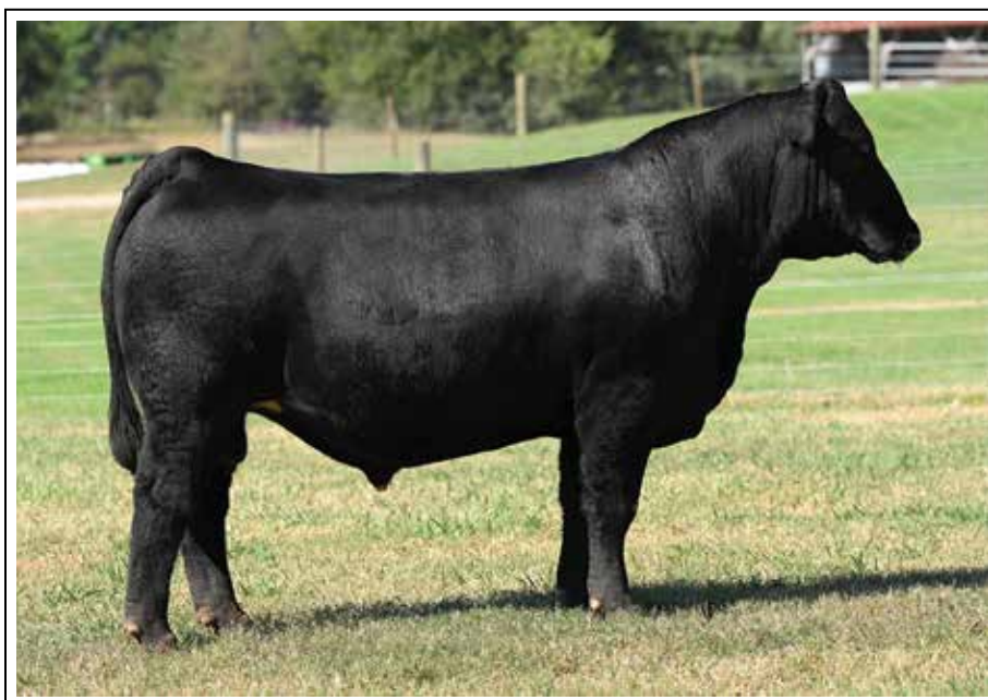
Lot 105 - MR CCF UNDERCOVER

Undercover is backed by one heck of a proven winning pedigree. The Executive Order x Jestress B79 mating has been one the most consistent matings we have had here at C&C. State and national winners, with the most recent being Champion Percentage Simmental Bull at the 2021 Simmental Breeders Sweepstakes. This young bull hasn't been awarded the accolades in the showing but sure has the all of the right pieces and the genetic background to enhance anyone's herd.