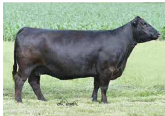
CHAMPION HILL BLACKBIRD 8003 - Maternal Grandam of Lot 101