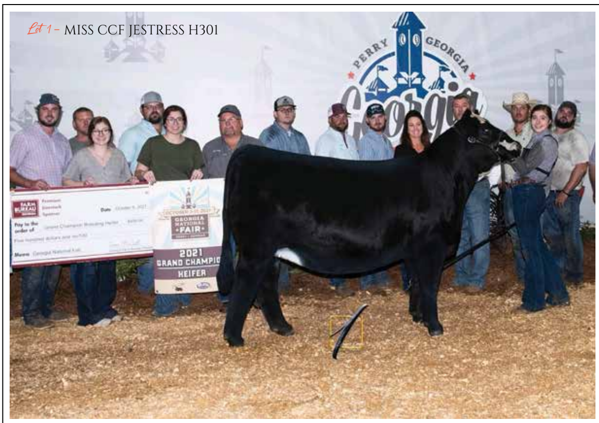
Lot 1 - MISS CCF JESTRESS H301