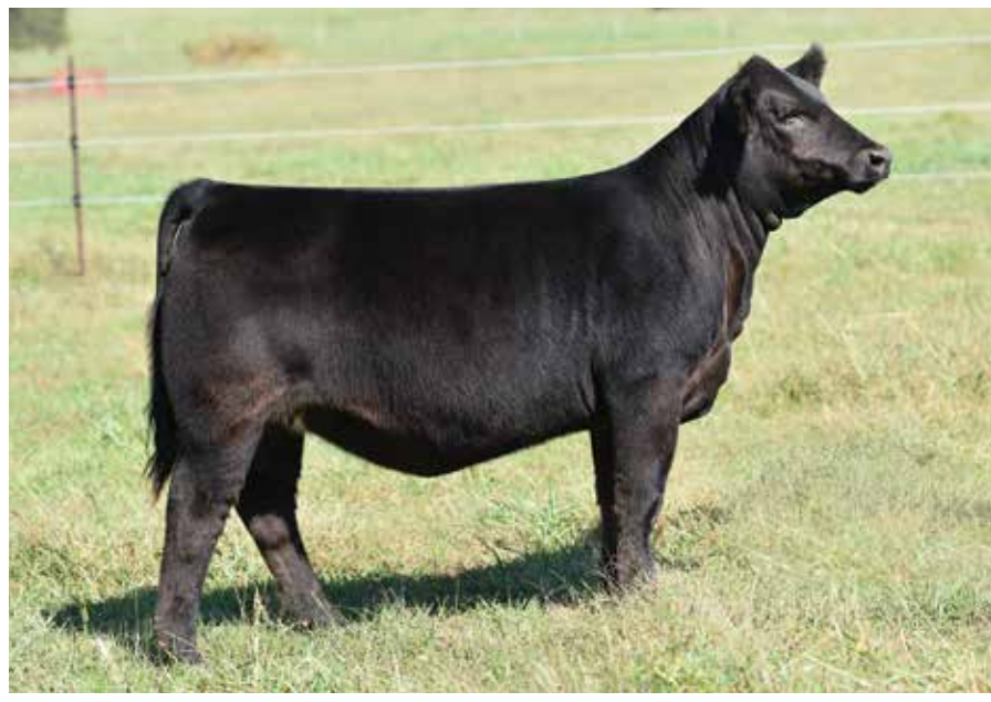
Lot 33 - M2C DAISY DUKE 106J

This initial calf crop of MR CCF The Duke progeny have us excited to keep using his influence at the breeding box, the combination of power, dimension and structural integrity he is delivering is impressive. You will notice the sire of significance on the maternal side of Daisy Duke 106J to be Profit, and then turn to her maternal Grand Dam and see another member of Simmental royalty, the SVF Above & Beyond T87 matron. In short we just hope you realize the maternal power that has equated to what we will bring to Jefferson, Georgia.