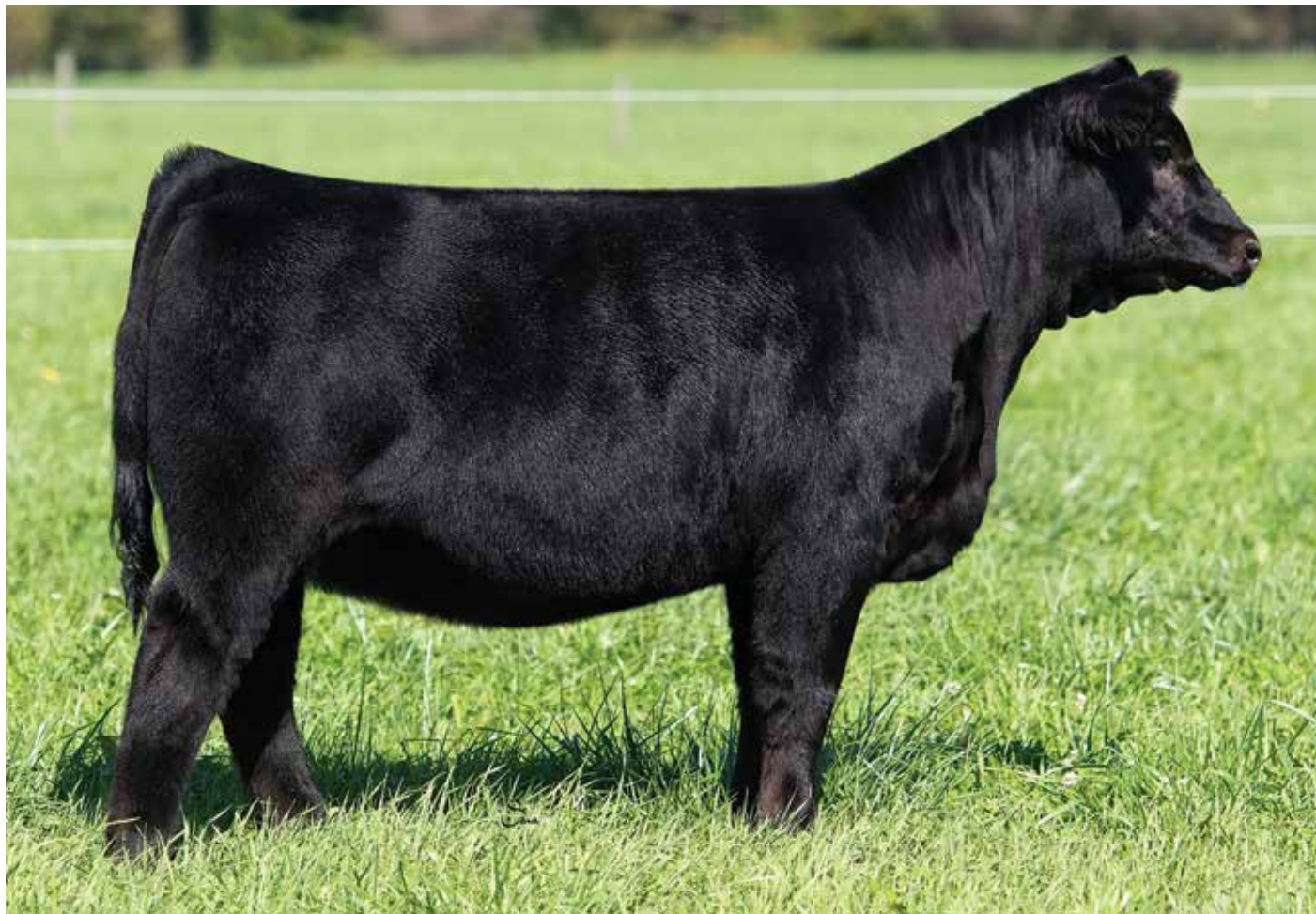
Lot 9 - WPCC DEANNA J116

Look how square and neat this one is built, she is a daughter of the most talked about sire in the Simmental breed, the Relentless son out of the triple crown winner JBSF Proud Mary. His name is JSUL Something About Mary 8421 and this marks an early opportunity to get in on his influence, if he continues to consistently make offspring at the caliber of Denna J116 he will go down in the history books of the breed. We like how dense this one is built, she has natural dimension underneath her good hair coat, couple that with the maternal power you will receive from the Broker x Jestress 9015 female on the bottom side and we think this is a big-time opportunity.