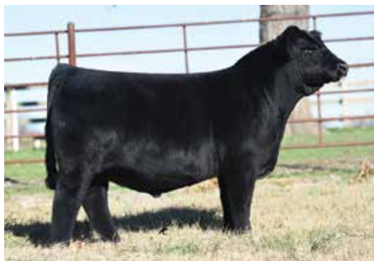
OBCC CMFM DEPLORABULL D148 - $100,000 Sire of Lot 29