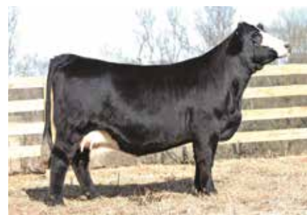
MISS CCF SHEZA DREAMER

H156 is the stout featured, performance driven son of the $250,000 TL Ledger. This Purebred herd sire prospect is backed by the widely popular and proven Miss CCF Sheza Looker cow family. A powerful herd bull that will add pounds, look, and generations of predictable lineage to any cowherd!