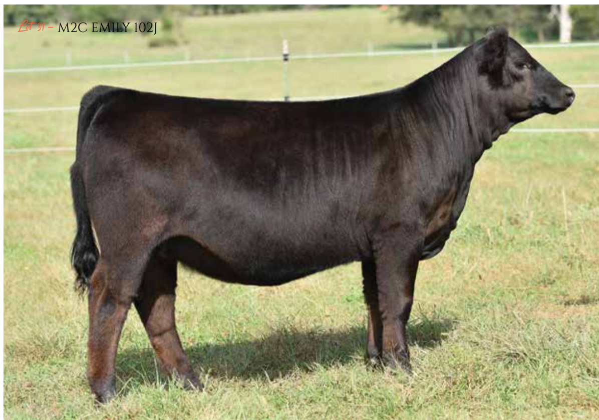
Lot 31 - M2C EMILY 102J