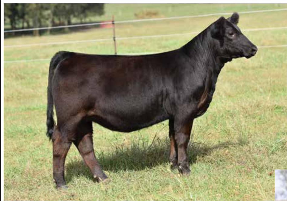
Lot 30A - TNM JADE 105J

We love the added presence and feature of this direct daughter of the $400,000 Profit, she truly is one of the most balanced and complete females we may have raised, and she ties together two sides of the industry both phenotypically and genetically. Her powerful body shape transitions effortlessly into a super attractive head and neck set, with a pair of big fluffy ears that come out high off the top of her skull, couple this with the big feet and bones that she moves with ease and we think this one is pretty special. The CCR Cowboy Cut daughter that you find in the first generation maternally, is an impressive bovine that visitors always want more information about, you can trust her influence will continue to be featured in the stock that come out of our program.