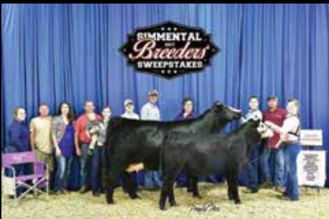
2017 SIMMENTAL BREEDERS SWEEPSTAKES GRAND CHAMPION PERCENTAGE COW CALF PAIR