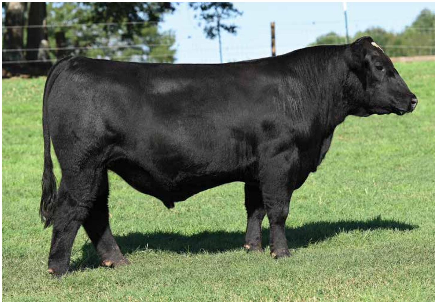
Lot 111 - MR CCF H157