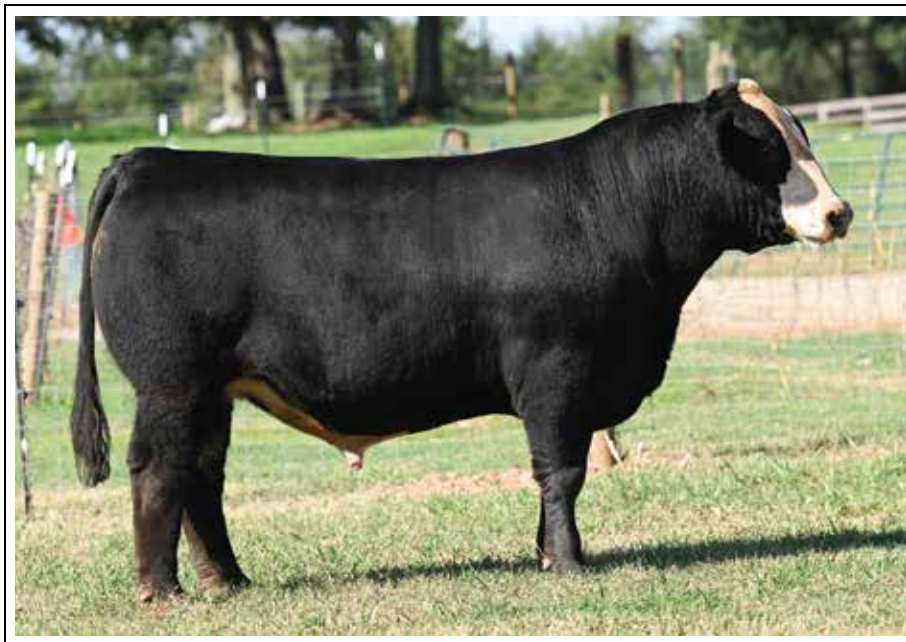
Lot 104 - MR CCF CHANGE UP

Talk about a stout, rugged bull that is super sound, big footed and could cover a large set of cows. Change up is what we like to think of as a multipurpose bull that should add some look along with some growth, power and performance to his calf crops.