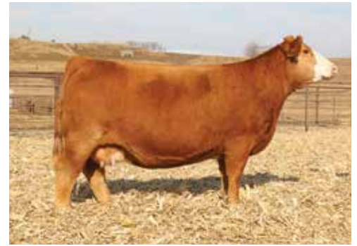
SVJ SHE'S THE DREAM B796