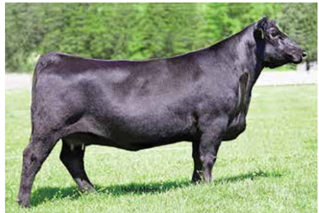
GAMBLE SHADOE 3117 - Maternal Grandam to Lot 45

You can check the inventory records around the ranch and not find too many Purebred Angus females on the charts, so when you do find one, just realize they have had to pull their weight, or be very easy on the eyes to hold their spot at the feed bunk. A direct daughter of the Angus phenom EXAR Blue Chip 1877B, a sire that has immortally left his mark on the Angus breed as the producer of high selling and award winning seedstock. We purchased Shadoe 5121 from the Grimes Family of Ohio, as a centerpiece for building the Percentage Simmental program here at C&C. The BC Lookout female on the maternal side of 5121 remains a mainstay donor female for Maplecrest Farms, and her Grandam is the infamous Gambles Shadoe 3117 that was Reserve Grand Champion Female at the Angus Junior Nationals for the Schnoor Family. There are generations of the Angus breeds most potent cow families aligned in the pedigree of 5121.