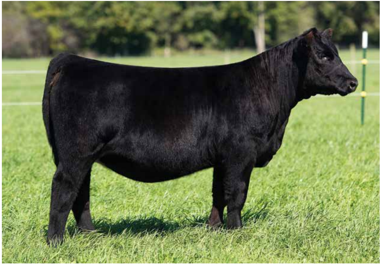
Lot 41 - WPCC REBA J517