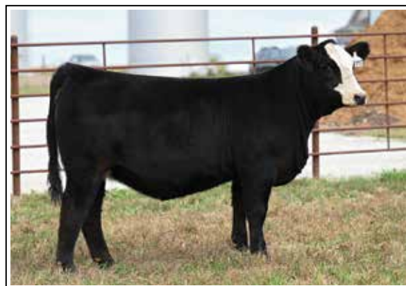
Lot 22 - T-T SUPERSTAR J145

Miss CCF Superstar has worked extremely well for us and this daughter of her's is no exception. J145 is a beautiful baldy Purebred that is awesome on the profile. She is big bodied, sound, good haired, and has that cocky show heifer look. She has a great disposition and will make a tremendous cow when her show career is comes to an end. As an added bonus she is a full sister to MR CCF Clarified that is doing an outstanding job for Schick-Haefner Cattle Company.