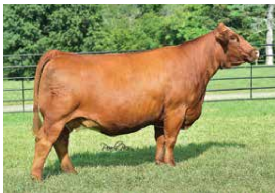
WHF:PRS:HPF ALLEY 247Y - 3rd Generation Dam of Lot 29