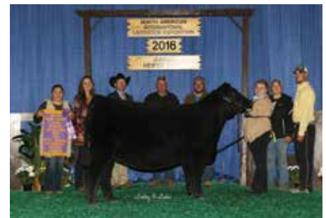
MISS CCF JESTRESS C12 - Dam of Lot 107

An investment made here would be anything but reckless, because this homozygous polled son of MR CCF 20-20 would be a great addition to any cowherd that pays attention to structural integrity, udder quality and longevity. You will hear us harp on about how much we like these 20-20 cattle regardless of sex, because we truly believe that we will feel his influence for generations to come in our cowherd. He goes back to the Jestress cow family on the bottom side, it does not get anymore from the heart of our breeding program than this. Retaining 1/3 Semen Interest.