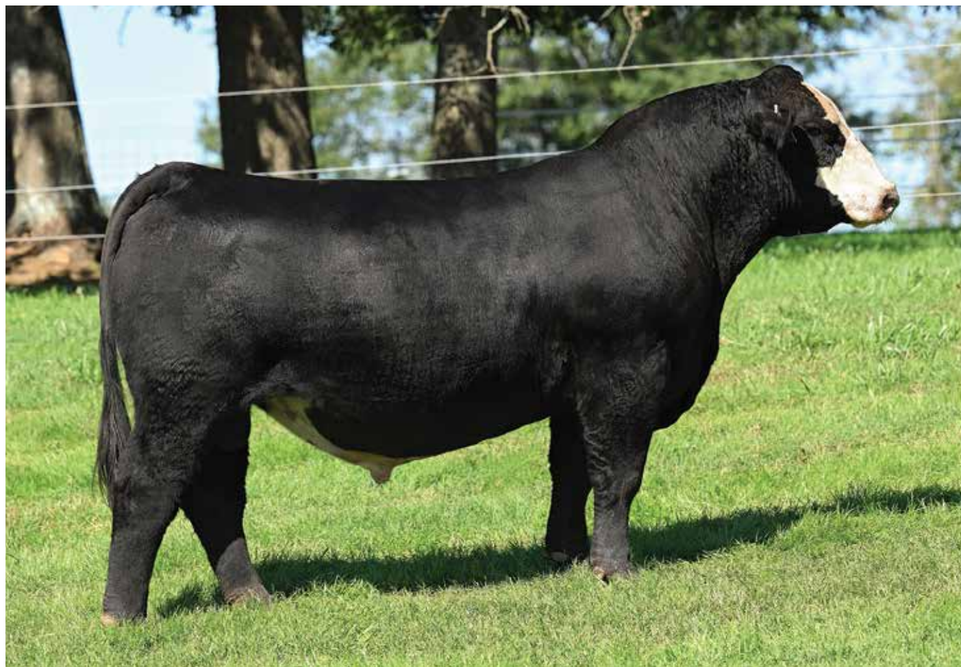
Lot 102 - MR CCF THE INFLUENCE