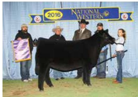
2016 NWSS GRAND CHAMPION PERCENTAGE FEMALE - Dam of Lot 41