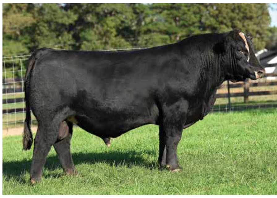
Lot 106 - MR CCF MASTERMIND

Mastermind is fun to look at out in the field. He grabs your attention with his overall composition. It's just hard to pick a big hole in this one. His mother was Reserve Champion Percentage Female in the 2016 NAILE Jr. Show and has gone on to be a donor female for our program, she is consistently making high quality cattle with a unique look.