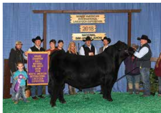
WLE COPACETIC E02 - Sire of Lot 102

MR CCF The Influence stands alone as the sole two-year-old member of this year's Clear Visions bull offering, he is a phenotypically impressive, high performing and extra ruggedly designed son of the WLE Copacetic E02 bull that is quickly writing his name among the most utilized bulls of the current day. The Influence is a litter mate to the featured heifer calves that the Hazelbaker and Seay Families selected out of the 2020 edition of Clear Visions and we think the set of replacements he could generate will be head turning to say the least.