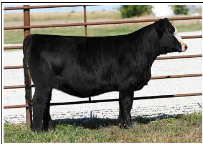
Lot 23 - T-T SUPERSTAR J147

This young Superstar female has a front end that is hard to replicate in these Purebred Simmental females. She is still green but the parts are coming together very nicely. She is cool headed, ties in high at the point of her shoulder, sound and very good haired. J147 is quickly developing into an exciting show heifer prospect, and with a good feeding program we think the future will be very bright for this daughter of KCC1 Exclusive 116E.