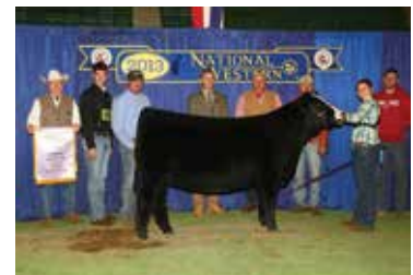
MISS CCF SHEZA BONNIE Y61 Dam of Lot 20