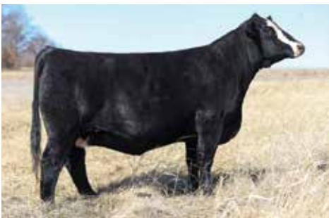
MISS CCF SHEZA SUPERSTAR Dam of Lot 114