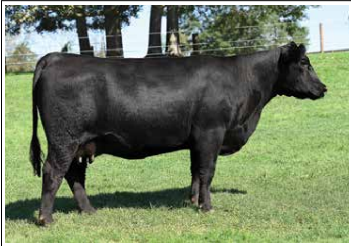
Lot 12 - MISS CCF JESTRESS G56