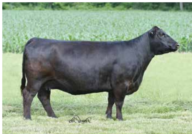
CHAMPION HILL BLACKBIRD 8003 - Dam of Lots 24 - 28

Talk about an awesome female! T-T Blackbird F12 is the type we strive to raise and honestly we shouldn't be selling, however we have made the commitment to offering our very best for this sale so here she is. She is the kind that can be mated to the really attractive bulls that aren't packing as much punch and make a guy look smart. F12 is sound, long bodied, good fronted, with a ton of compacity and rib shape to boot. Future donor with a heifer calf at side that looks to have the right parts.