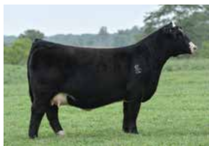
S/P TRUE LOVE F789 Maternal Sister to Lot 35