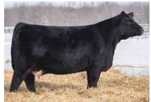
TNGL A GEMSTONE A527 Maternal Grandam of Lot 34

A late March born Purebred daughter of W/C Relentless 32C that has the big belly, shapely rib cage and big, soft running gear. We love the stoutness and body shape Gemstone J056 combines with the good looks and soft hair type. You'll notice the One Eyed Jack female on the bottom side of her pedigree, with this comes udder quality and mothering ability.