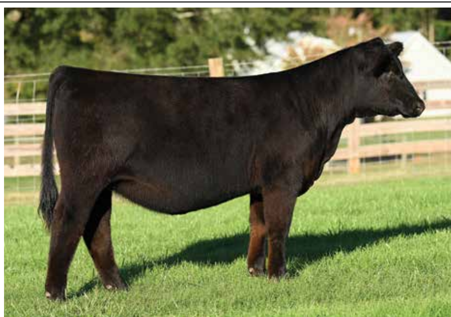
Lot 40 - MISS CCF J50

Out of the 2018 GA National Fair Supreme Champion Female and 2019 Champion Purebred Pair at the Simmental Breeders Sweepstakes! Its exciting when champions can prove to make high quality offspring. Glory exemplifies a lot of what we thought her mother was as a show heifer. Long, level, big center ribbed, and good footed. Here at C&C we used MR CCF The Duke heavily this past breeding season. With the quality of his first offspring, we will continue to do so. Check this one out on sale day.