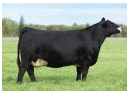
HPF RIGHT TO LOVE 283C Dam of Lot 35