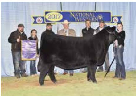
2017 NWSS GRAND CHAMPION PERCENTAGE FEMALE