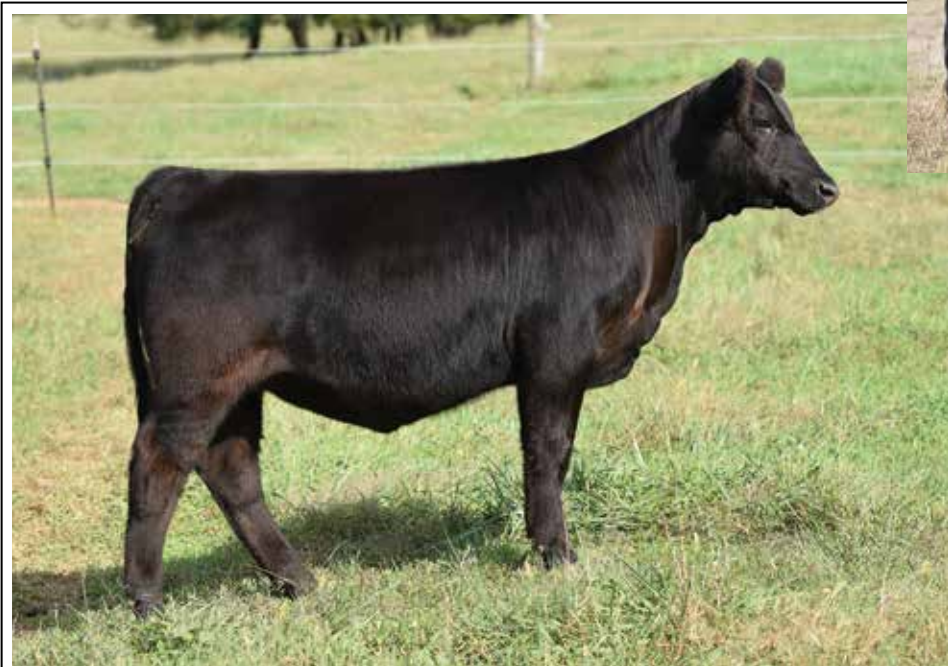
Lot 30B - TNM 123J

We love the added presence and feature of this direct daughter of the $400,000 Profit, she truly is one of the most balanced and complete females we may have raised, and she ties together two sides of the industry both phenotypically and genetically. Her powerful body shape transitions effortlessly into a super attractive head and neck set, with a pair of big fluffy ears that come out high off the top of her skull, couple this with the big feet and bones that she moves with ease and we think this one is pretty special. The CCR Cowboy Cut daughter that you find in the first generation maternally, is an impressive bovine that visitors always want more information about, you can trust her influence will continue to be featured in the stock that come out of our program.