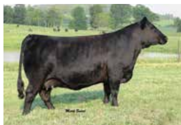
SVF ABOVE & BEYOND T87 Matriarch of Metzger Cattle Company