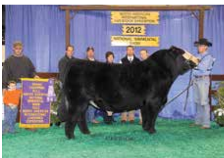
MR HOC BROKER Sire of Lot 10