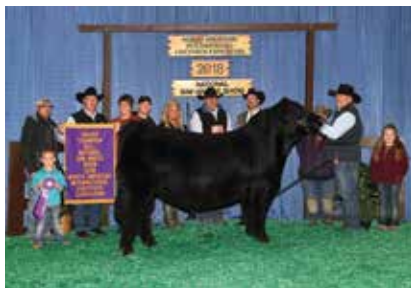
WLE COPACETIC E02