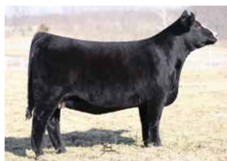
HARAS MISS USA

Full sister to Maternal Grandam of Lot 36