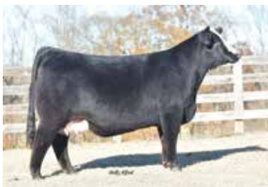
MISS CCF JESTRESS B79 Dam of Lot 103

Likewise is a bull with a pedigree for the times. Sired by the popular WLE Copacetic and his dam is the Jestress B79 donor. This bull is extended in every way possible. Long spined and powerful out through his hip. Extremely extended up through his front 1/3. With all of this extension, he still maintains his balance with the structure that will make him last for years.