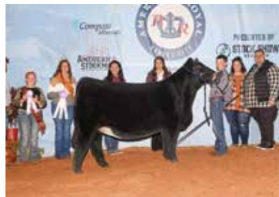
2021 AMERICAN ROYAL RESERVE GRAND CHAMPION PERCENTAGE SIMMENTAL - Full Sister to Lot 1