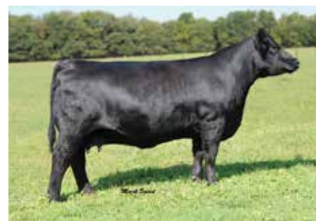
CNS QUEEN ME S613 Maternal Grandam to Lot 37

A Purebred daughter of the one of the breeds most talked about sires, JSUL Something About Mary 8421, in this first calf crop he has already sired a $100,000 Percentage that sold earlier this Fall. The dam of J109 is a Mr. Vision daughter that originated in the SVJ program, if you trace her pedigree back a couple of generations you will find perhaps one of the most influential females of where we are today in the Simmental breed, HART Hollywood Queen 700, a female that has over 270 direct progeny listed in the breeds registry. Phenotypically we aren't sure there is much you would want to change about this one, so dense and massive, rugged bone design and the eye appeal necessary to be noticed.