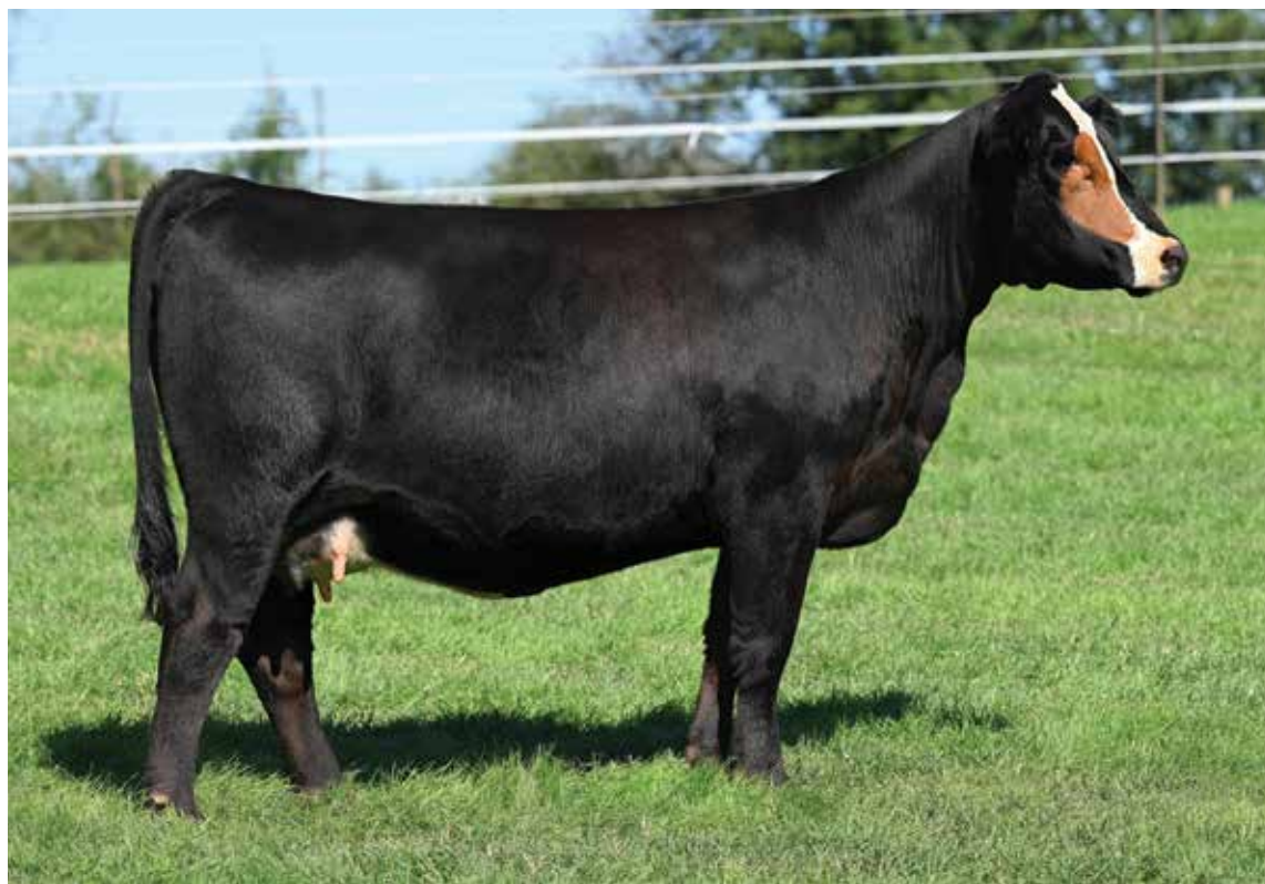
Lot 17 - MISS CCF RED EYE G89