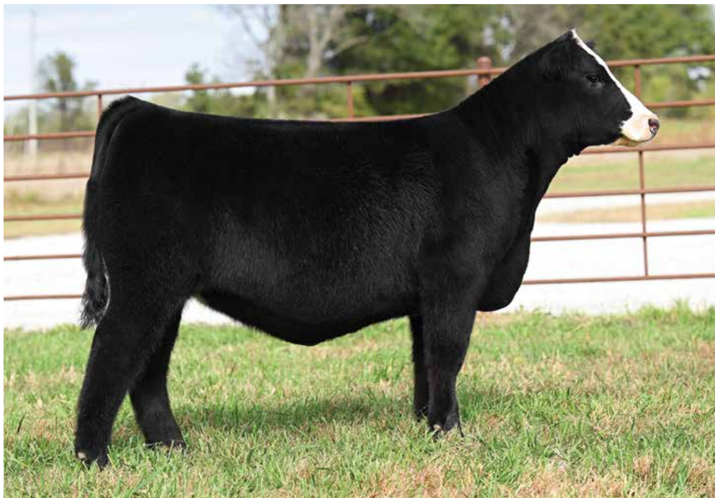
Lot 24 - T-T BLACKBIRD J06