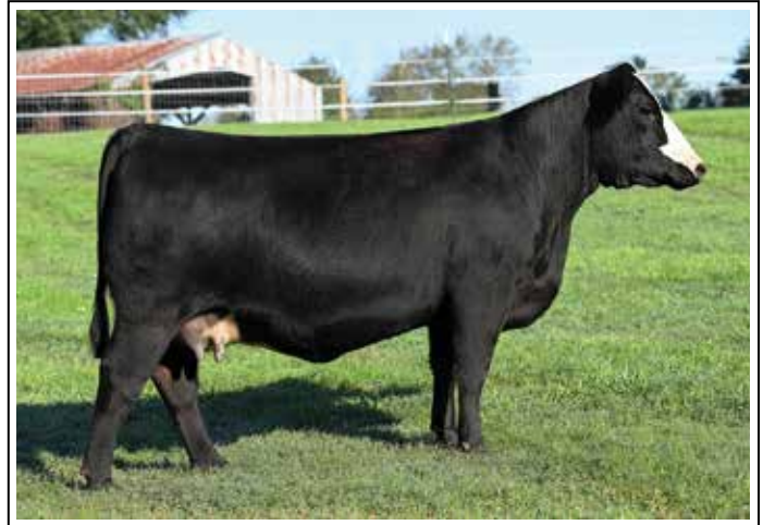
Lot 11 - MISS CCF VISIONARY G382