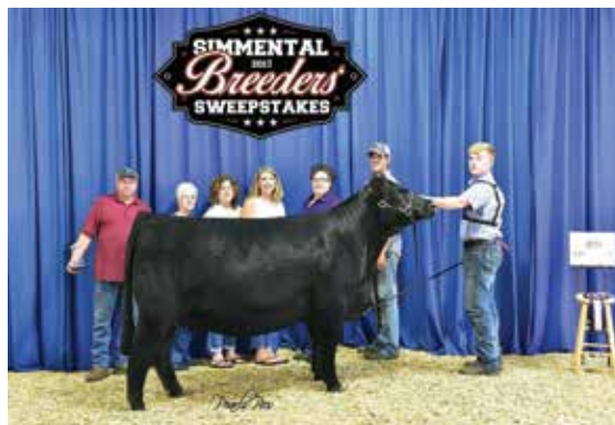
MISS CCF JESTRESS C102 Dam of Lot 15