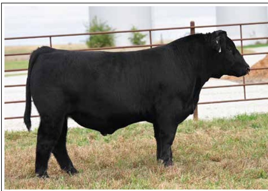
Lot 113 - T-T 20-20 H98

This striking baldy has herd bull written all over him. J98 will make a great AI/pasture sire for a Purebred operation looking to keep consistency in their calf crop. His mother was a previous high selling pair out of the Inaugural Clear Vision sale and we think this is her best son to date. He is sound, good looking, stout, and possesses that herd bull look.