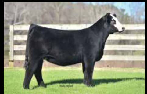
MISS CCF TRINITY Full Sister to Lot X