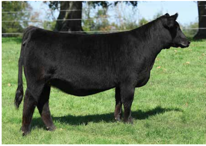
Lot 19 - MISS CCF DREAMER J608