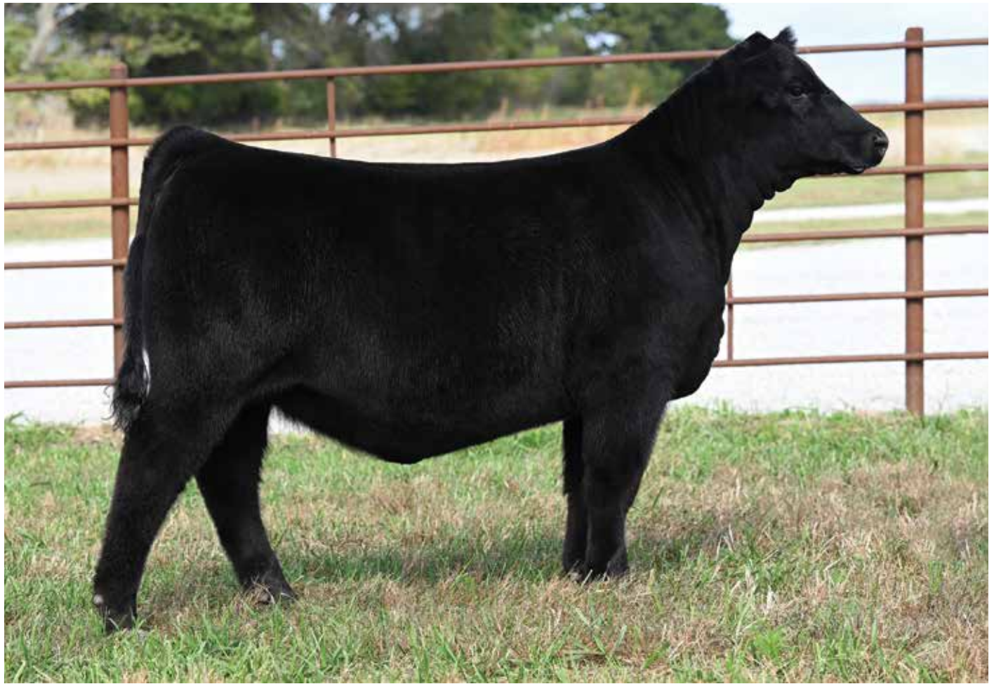
Lot 27 - T-T BLACKBIRD J203