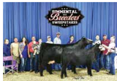
2017 SIMMENTAL BREEDERS SWEEPSTAKES GAND CHAMPION PERCENTAGE COW CALF PAIR