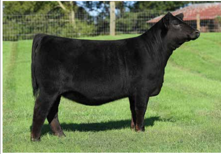
Lot 6 - MISS CCF SALT AND PEPPER