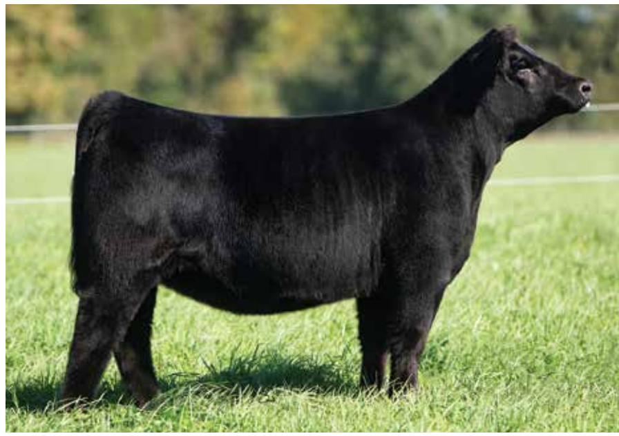
Lot 39 - WPCC MARY J518

A Purebred daughter of the promotional sire, JSUL Something About Mary that has created quite the stir with his rookie calf crop, and out of a beautiful FBF1 Combustible female. This solid black late February born heifer calf leaves nothing further to be desired in regards to stoutness of feature and dimension, yet the way she collects herself on the move is impressive. We think this one is very unique from the standpoint of her build, and offers a pedigree that is versatile enough to mate to many of the popular options the industry is trending towards.