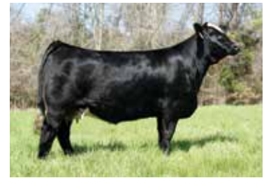
MISS CCF SHEZA LOOKER Maternal Grandam of Lot 19