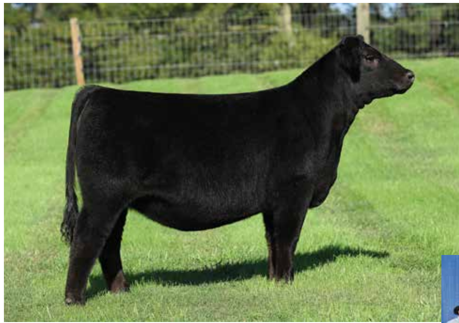
Lot 8A - MISS CCF J52

This one grabs our attention every time we walk in the pen. So big bodied and super sound. When you think of cow power, she would fit the bill. Ones that are so easy keeping are the money-making kind. Along with the brood cow potential she still carries the showing eye appeal with plenty of arrogance.