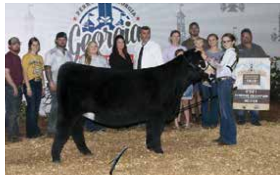
2021 GA NATIONAL FAIR RESERVE SUPREME CHAMPION Full Sister to Lot 1