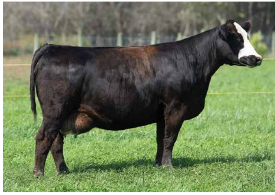
Lot 44 - WPCC STAR STRUCK G235