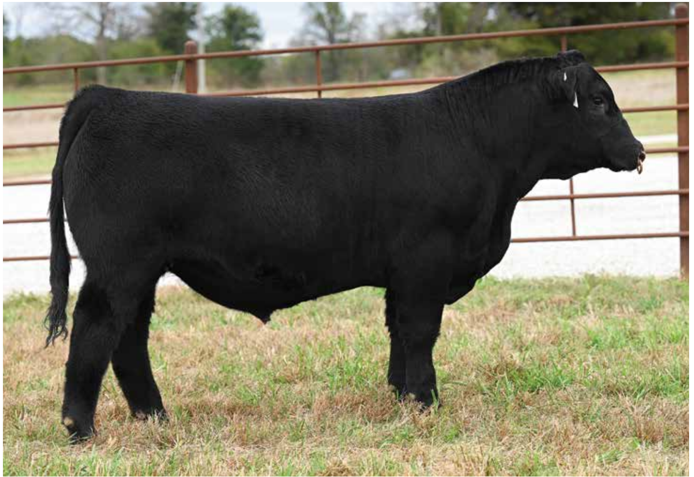
Lot 114 - T-T EXCLUSIVE J146