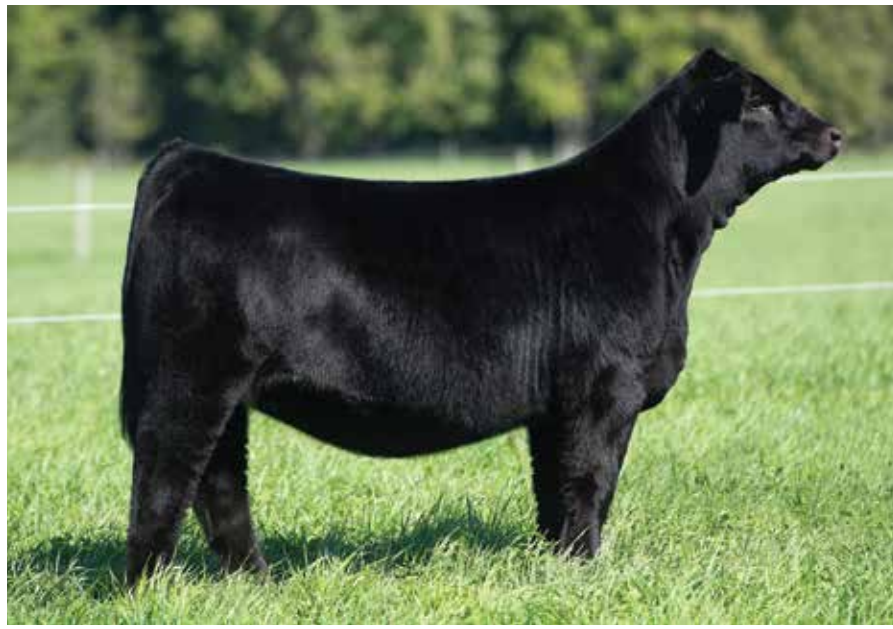
Lot 37 - L/P QUEEN OF DENIAL J109

A Purebred daughter of the one of the breeds most talked about sires, JSUL Something About Mary 8421, in this first calf crop he has already sired a $100,000 Percentage that sold earlier this Fall. The dam of J109 is a Mr. Vision daughter that originated in the SVJ program, if you trace her pedigree back a couple of generations you will find perhaps one of the most influential females of where we are today in the Simmental breed, HART Hollywood Queen 700, a female that has over 270 direct progeny listed in the breeds registry. Phenotypically we aren't sure there is much you would want to change about this one, so dense and massive, rugged bone design and the eye appeal necessary to be noticed.