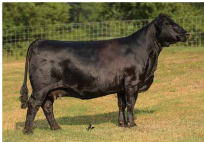
MISS CCF BREAKING HEARTS - Dam of Lots 109 - 110

Essential is a stout made bull sired by MR CCF 20-20 and out of the Breaking Hearts donor. A solid black Purebred bull that is impressive in his overall muscle shape while still maintaining a nice look from the side.