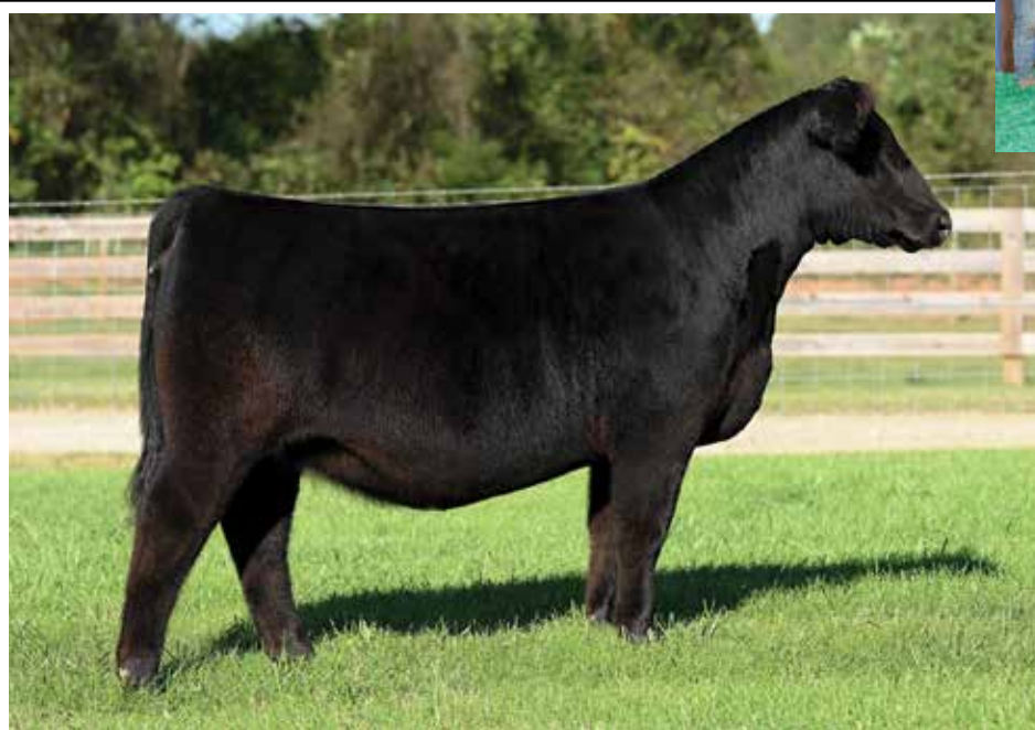
Lot 8B - MISS CCF J53

The ones that are this cocky are what makes picture days fun! This Reckoning posed for the camera and strutted her stuff! Jewel is one elegant creature. Super sound in her structure, big center ribbed and a neck and head that could be seen for miles. Check her out on sale day. She's an eye catcher! Seller retains the right to one successful flush with a minimum of six transferable embryos.