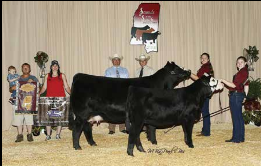
2017 AJSA NATIONAL CLASSIC GRAND CHAMPION PERCENTAGE COW CALF PAIR