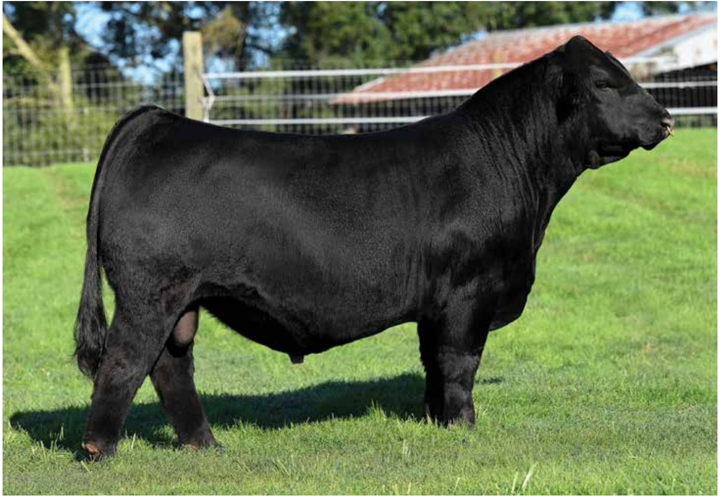
Let X - MR CCF PRIORITY