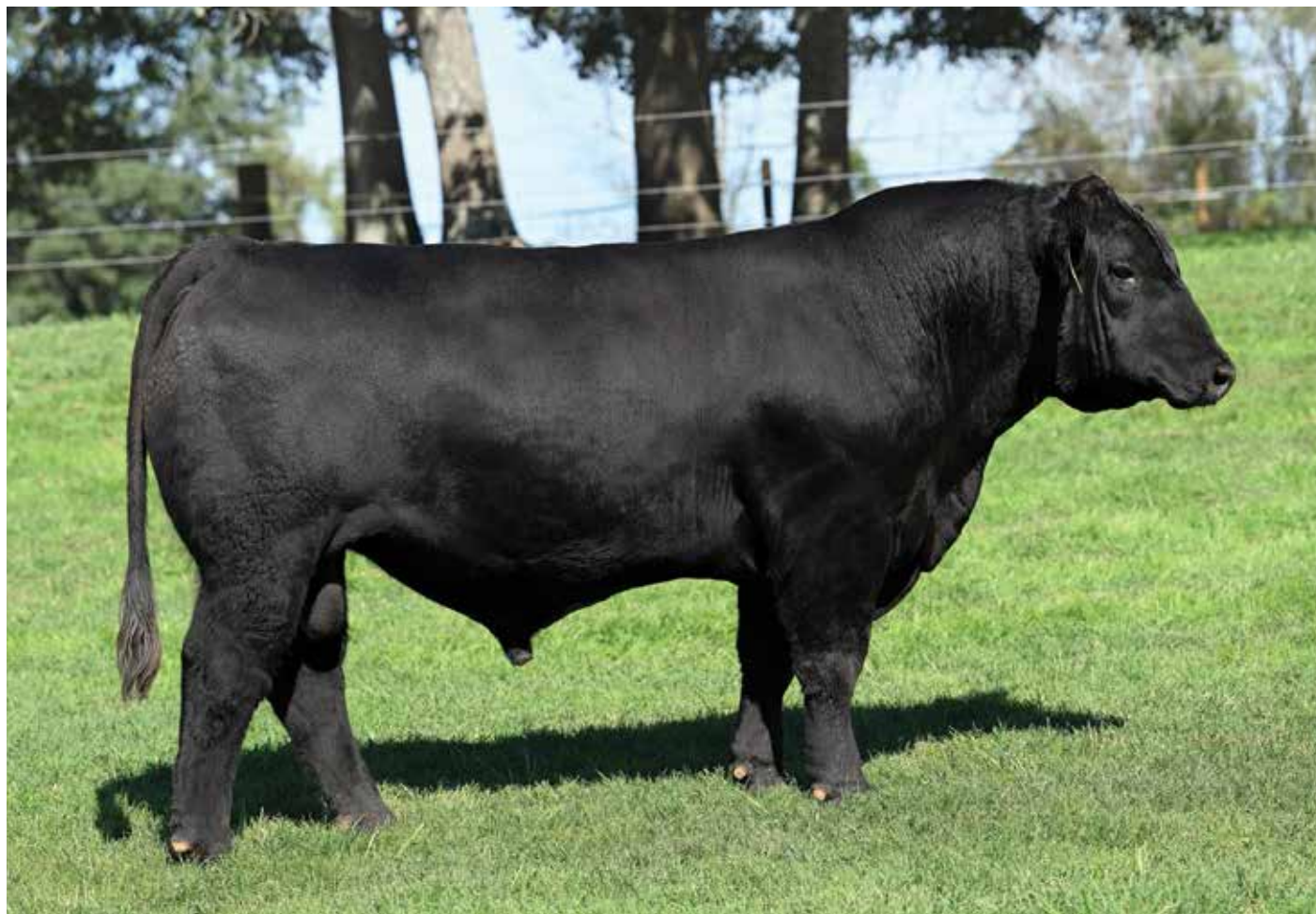
Lot 115 - MR CCF MASTERPLAN