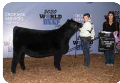
2020 World Beef Expo Reserve Grand Champion Heifer