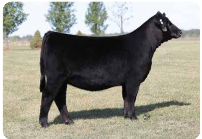
LOT 9B JS DAIRY QUEEN 33J