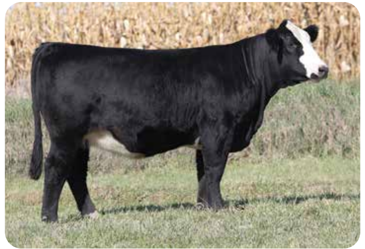
LOT 20A JS FLIRT AWAY 45H

AI BRED ON 4/11/21 TO WHF/JS/CCS DOUBLE UP G365 (ASA: 3948321). PE 5/1/21-6/30/21 JBSF LOGIC 5E (ASA: 3337441). LIKELY SAFE AI.