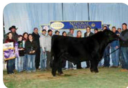
CDI Innovator 325D 2018 NWSS Grand Champion Percentage Simmental Bull