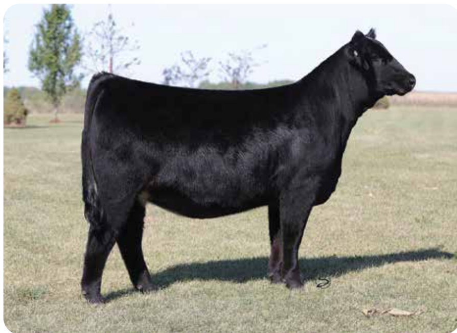
LOT 2A CCS/JS SUMMER 35J