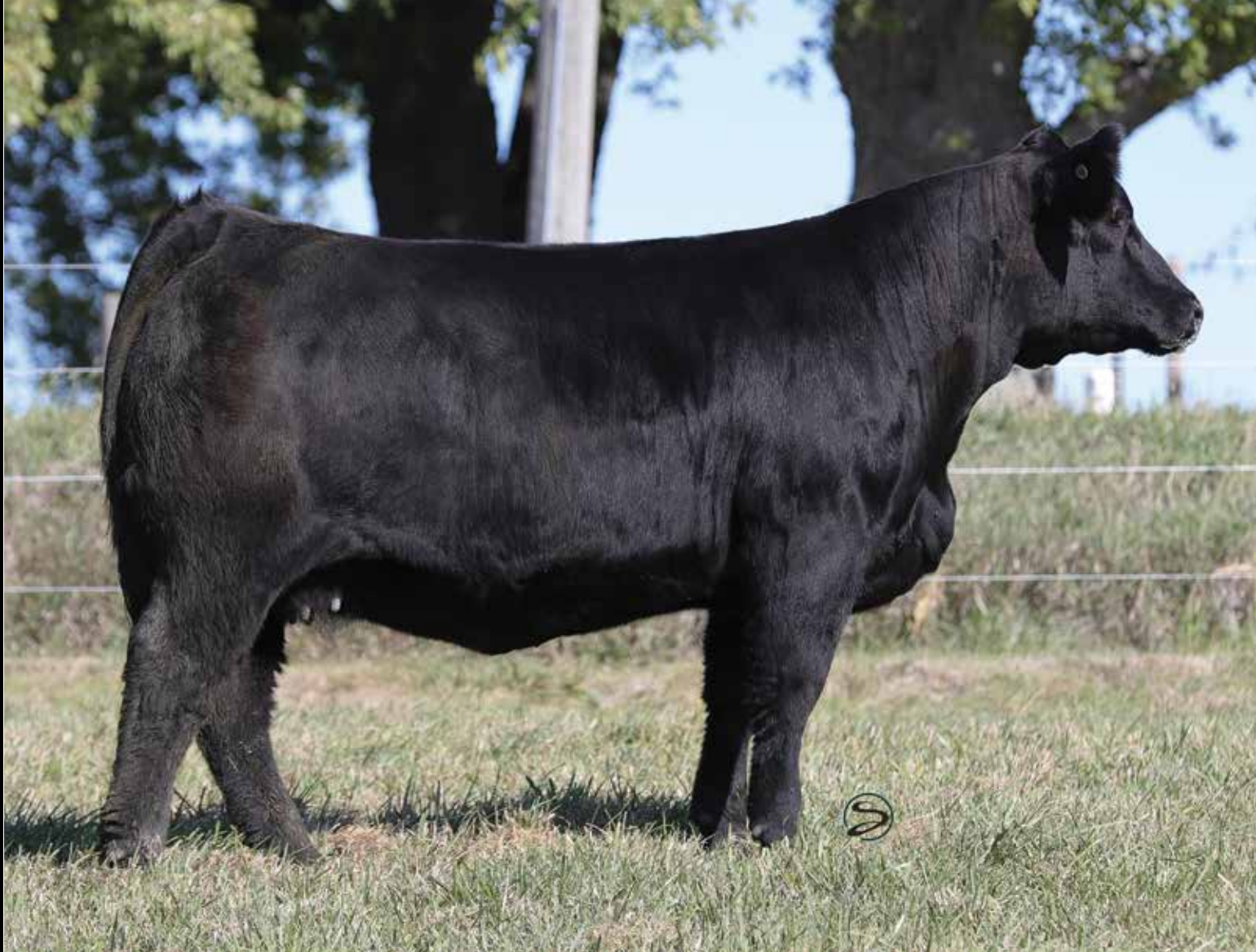
LOT 19 JS FLIRT AWAY 51H