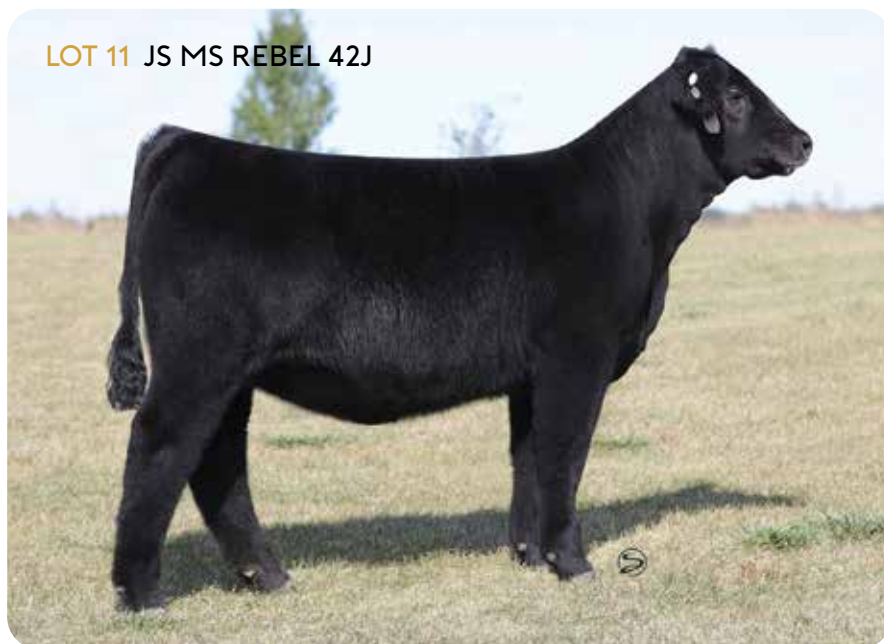
LOT 11 JS MS REBEL 42J