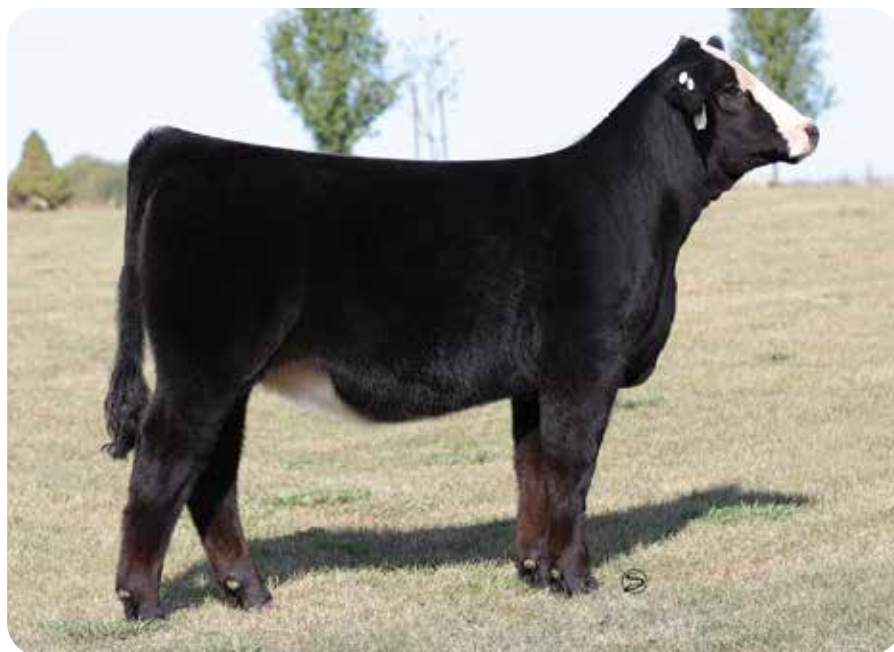
LOT 6A JS FLIRT AWAY 34J