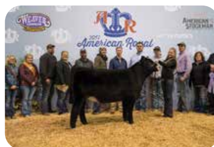
WLE Missy E3055 2017 American Royal Reserve Champion Percentage Simmental Female