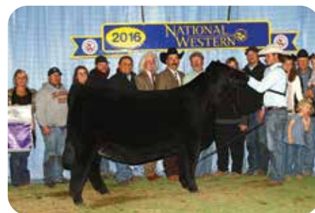
JS Black Satin 9B | 2015-2016 Triple Crown Winner, Maternal Sister to Lot 5 and Full Sister to Lots 6A-6B