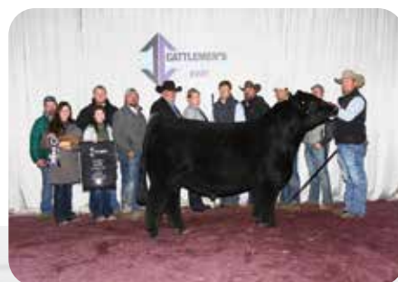
WHF/JS/CCS Double Up G365