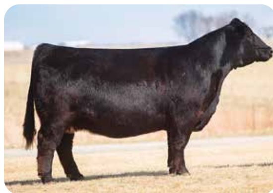
JS Flatout Flirty 46T | Dam of Lot 7