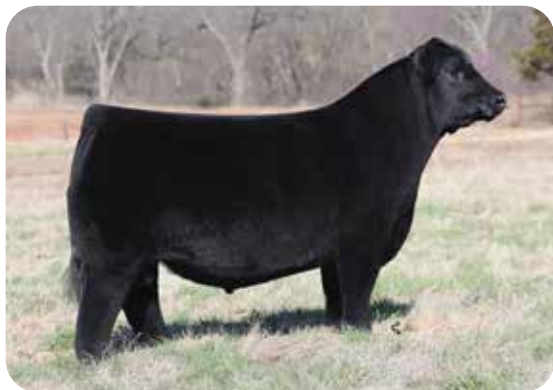
Gateway Follow Me F163 | Sire of Lot 4