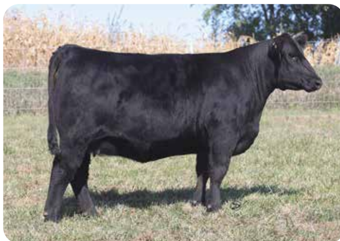
LOT 25 JS BURNING POWER 10H

This one stems from a cow family that has been a part of our success over the years in the early stages of our program, it was the absolute go to. The cattle from the Burning Power line are still good today with added performance and power always readily accessible when implemented. This daughter of Innovator is from a Bush's Unbelievable x Burning Power that felt necessary to keep in our program and we have not been disappointed by what her dam can contribute moving forward. 10H offers a very balanced number profile with a combined carcass and growth combination that is suitable for mating either direction, EPD stock, or Phenotype stock. AI BRED ON 4/11/21 TO WHF/JS/CCS DOUBLE UP G365 (ASA: 3948321). PE 5/1/21-6/30/21 JBSF LOGIC 5E (ASA: 3337441). LIKELY SAFE AI.