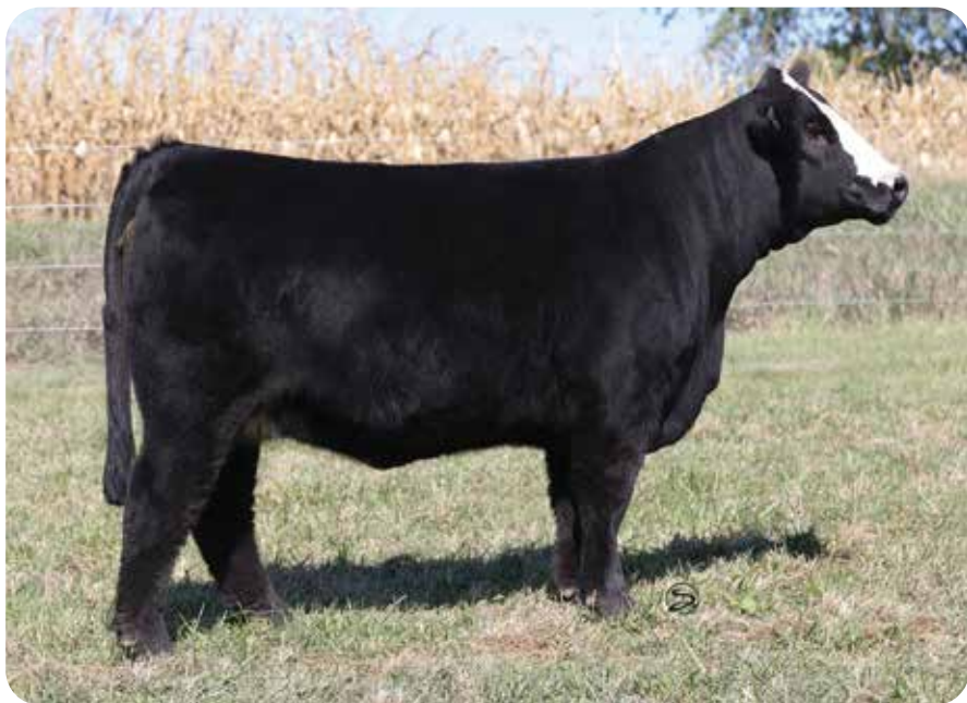
LOT 22 CCS/JS SUMMER 51G

This offering is saturated with each proven donor and herdsire that JS owns. The potency of the donor battery and sire lineup is known and evident as you turn the pages of this sale book. These bred cattle are a set to be proud of and so we present a pair of sisters from Summer herself. AI BRED ON 4/11/21 TO W/C DOUBLE DOWN 5014E (ASA: 3336150). PE 5/1/21-6/30/21 JBSF LOGIC 5E (ASA: 3337441). LIKELY SAFE AI.