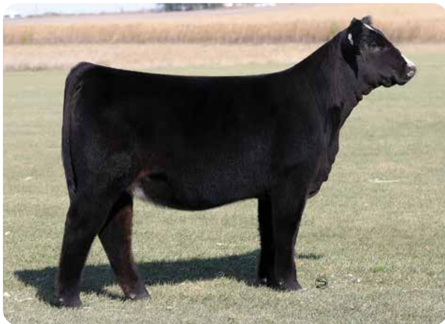
LOT 1C CCS/JS SUMMER 39J