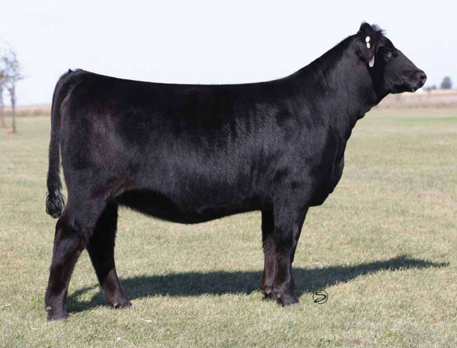
LOT 3 CCS / JS SUMMER 27J

W/C RELENTLESS 32C JBSF LOGIC 5E BROOKS STEELMAGNOLIA X57 CCR WIDE RANGE 9005A WHF SUMMER 365C WHF ANDIE 365A