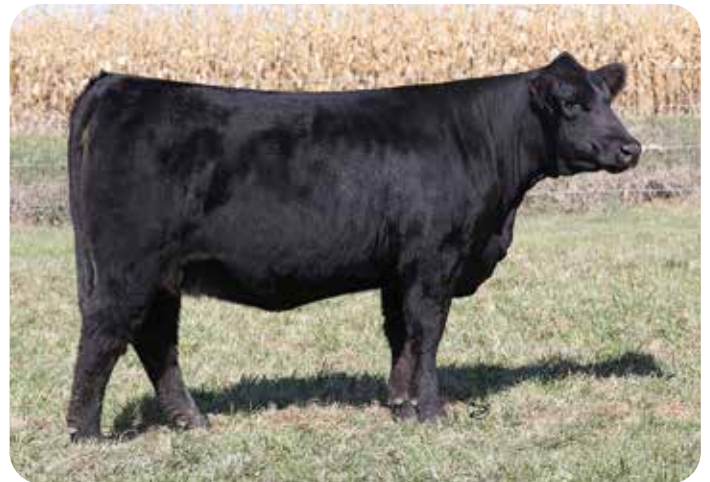
LOT 20B JS FLIRT AWAY 46H

AI BRED ON 4/11/21 TO WHF/JS/CCS DOUBLE UP G365 (ASA: 3948321). PE 5/1/21-6/30/21 JBSF LOGIC 5E (ASA: 3337441). LIKELY SAFE AI.