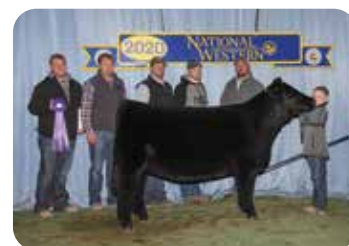
WHF Andie 369F 3/4 Sister in blood to Lots 2A-2B