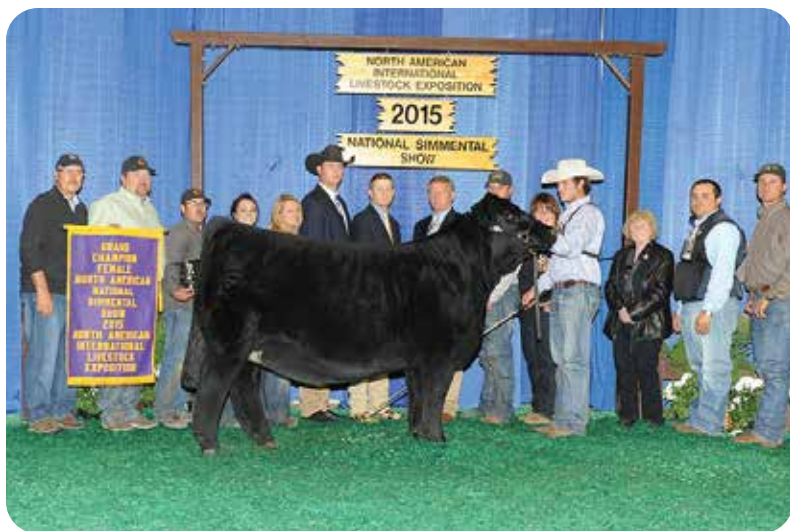
JS Black Satin 9B | 2015 NAILE Grand Champion Purebred Female