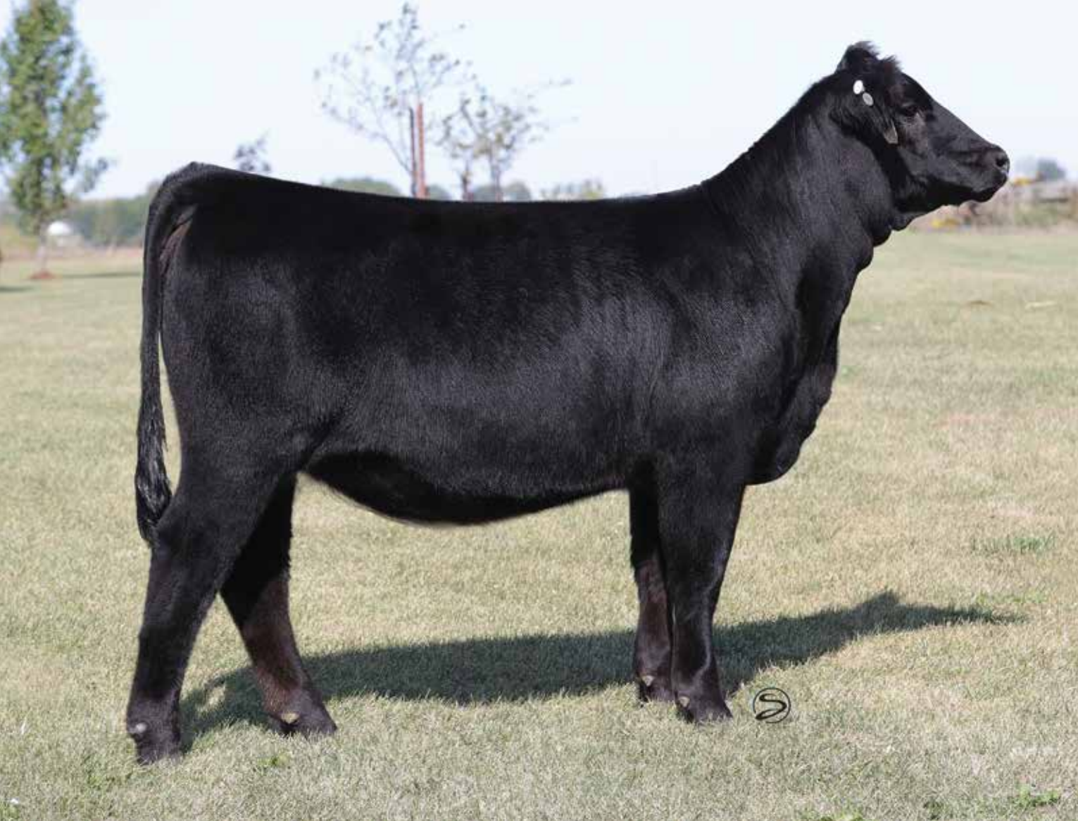
LOT 5 JS FLIRT AWAY 26J