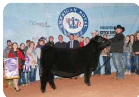
UDE Queen Ruth 0104 | 2021 American Royal Grand Champion Angus Heifer & Maternal Sister to Lot 15