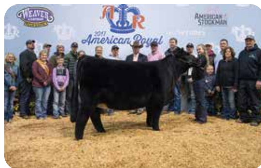
WHF Summer 365C | 2017 American Royal Supreme Champion

2017 NAILE Grand Champion Simmental Heifer