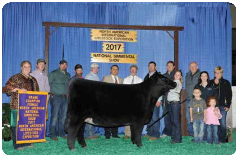
WHF Summer 365C | 2017 NAILE Grand Champion Simmental Heifer