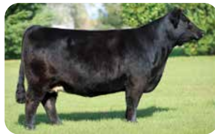
WHF Summer 365C Dam of Lots 1A-1C, 2A-2B, & 3