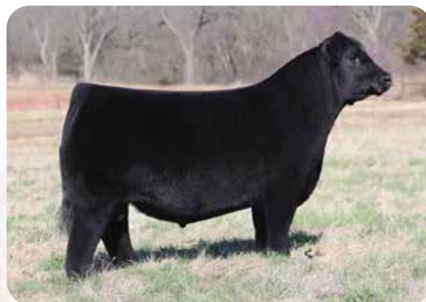
Gateway Follow Me F163 Sire of Lot 17