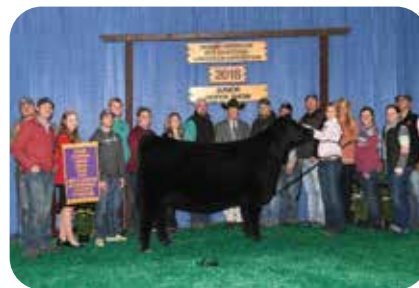
UDE Ellie 153E 2018 NAILE Grand Champion Angus Female Jr. Show