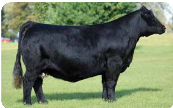
JS Flirt A-Way 59Y | Dam of Lots 19 - 20C