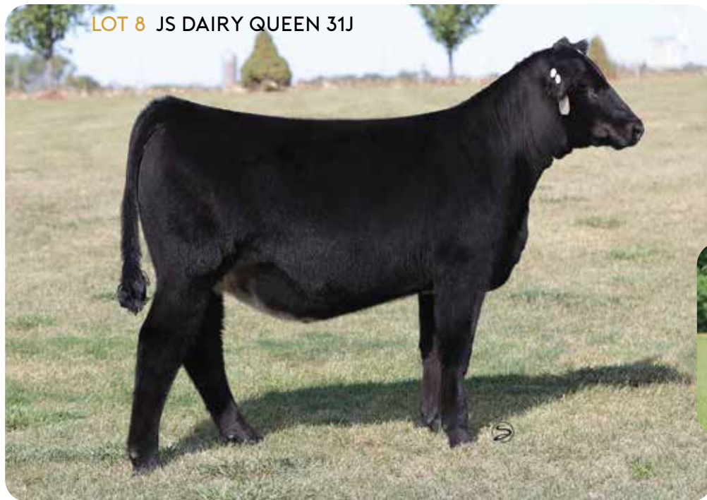
LOT 8 JS DAIRY QUEEN 31J