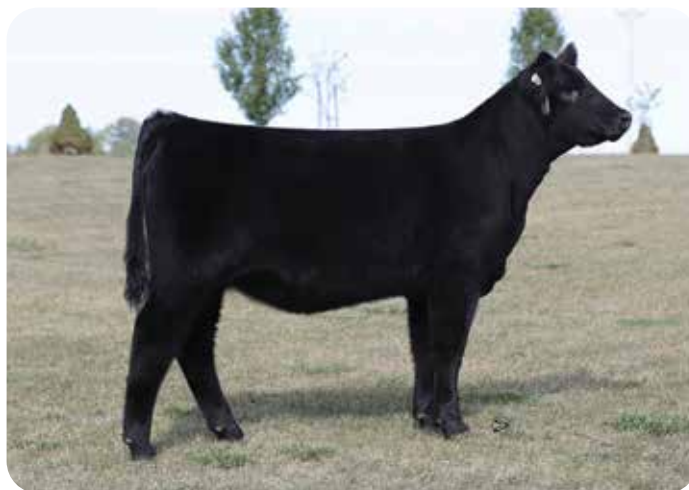
LOT 14 GGC/JS KEYMURA KATY 16J

CCS/CG Watch For Me 8209 201H | Maternal Brother to Lot 14