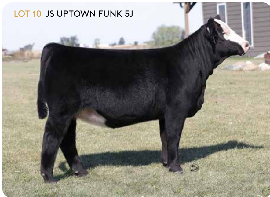
LOT 10 JS UPTOWN FUNK 5J