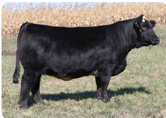
LOT 24 JS DAIRY QUEEN 54G