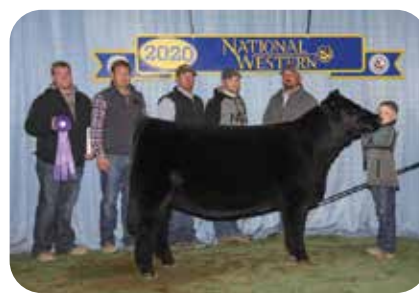
WHF Andie 369F 2020 NWSS Division Champion