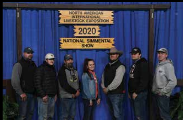
2020 NAILE Premier Breeder