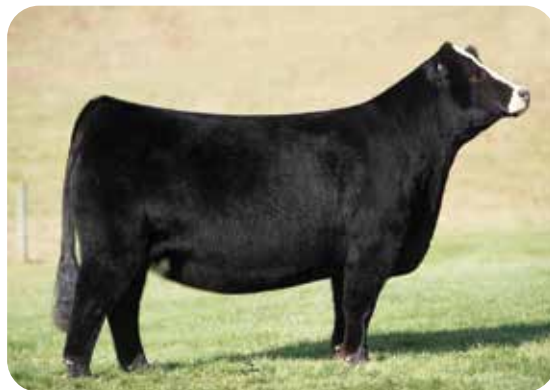
JS Pearl 37E | Donor Dam of Lot 4