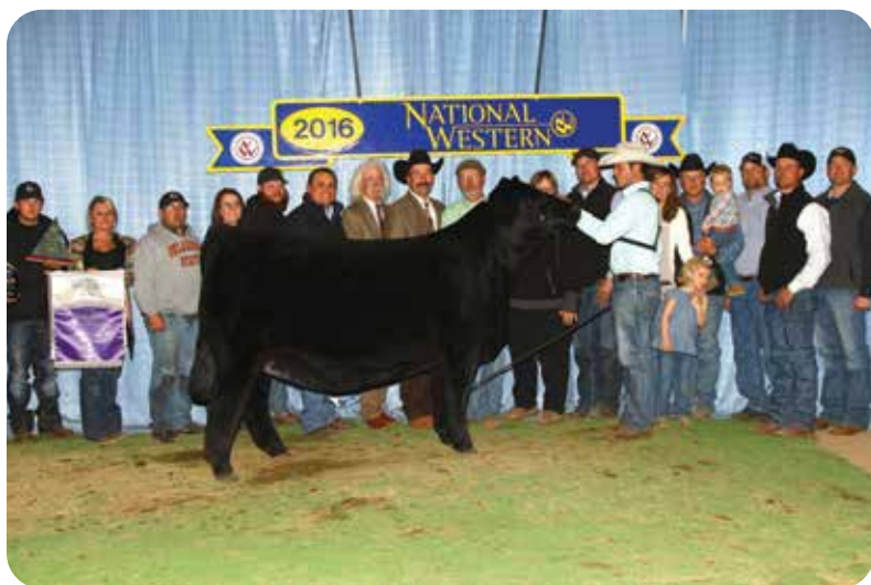
JS Black Satin 9B | 2016 NWSS Grand Champion Purebred Female