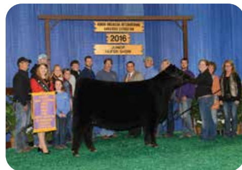
KDJ Queen Ruth 502 | Dam of Lot 15