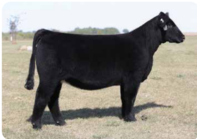
LOT 12 JS BROKER`S BEST

What a great SimGenetic female with dual registry to add to extras. That's right, she can be shown SimGenetic or Maintainer! This female is way cool as would be expected. She is awesome made, good boned, great shaped, and has the needed look to achieve greatness.