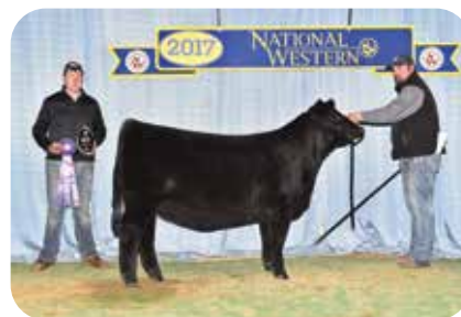
GLS Dash of Fame 2017 NWSS Division Champion