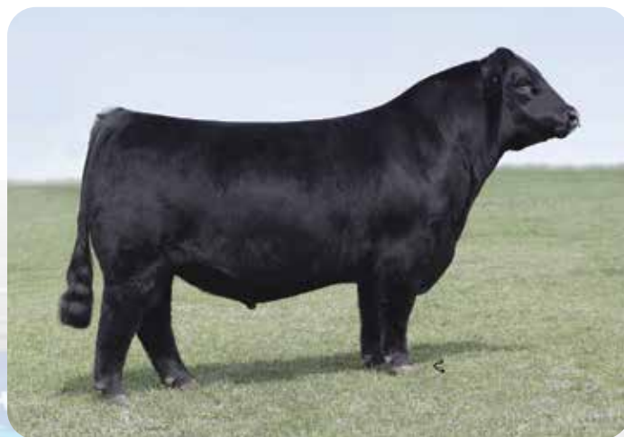
JBSF Logic 5E | Sire of Lot 3