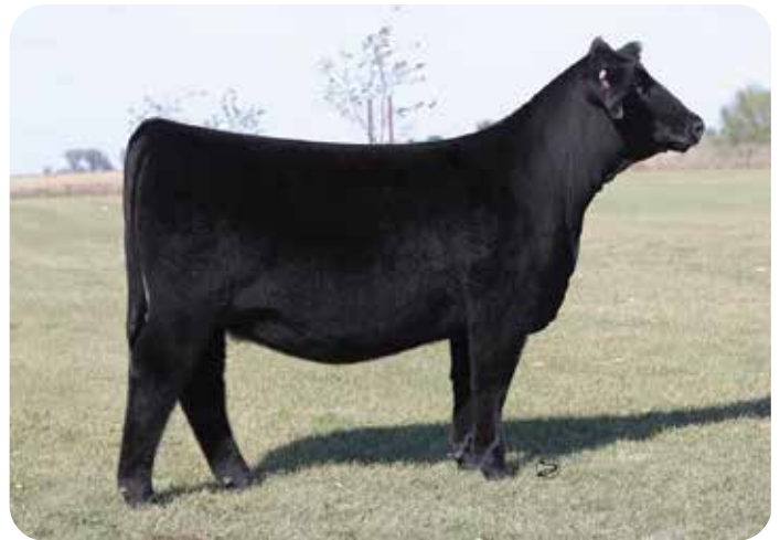
LOT 9A JS DAIRY QUEEN 25J