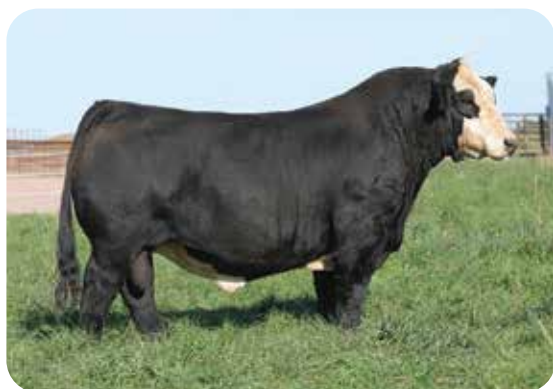
W/C Bankroll 811DT | $205,000 Sire of Lot 7