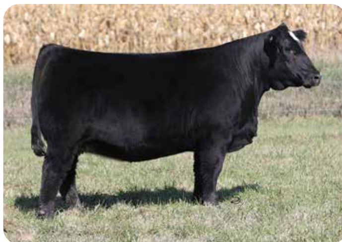
LOT 23 JS BARB 34H

A female that comes to you all sired by the proven Broker and from a very productive Bismarck daughter. Predictability and reliability in production sells in 34H. Both sides of the pedigree are noted for shear, basic, cowboy production and performance. The mating to Double Up only improves the value she has on December 10. AI BRED ON 4/11/21 TO WHF/JS/CCS DOUBLE UP G365 (ASA: 3948321). PE 5/1/21-6/30/21 JBSF LOGIC 5E (ASA: 3337441). LIKELY SAFE AI.