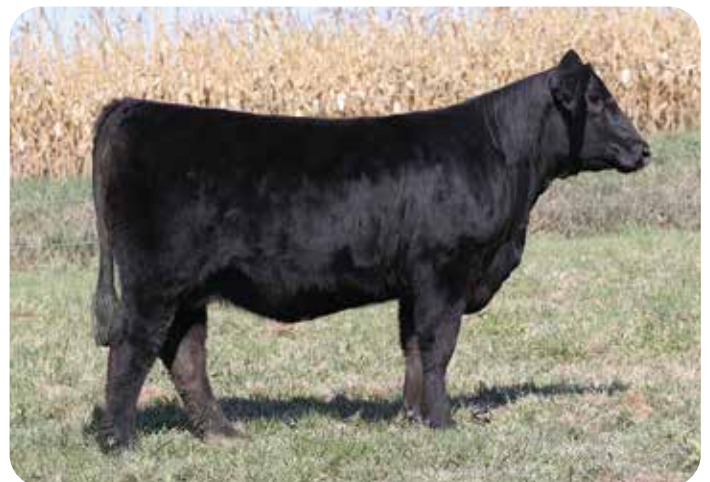
LOT 20C JS FLIRT AWAY 47H

AI BRED ON 4/11/21 TO WHF/JS/CCS DOUBLE UP G365 (ASA: 3948321). PE 5/1/21-6/30/21 JBSF LOGIC 5E (ASA: 3337441). LIKELY SAFE AI.