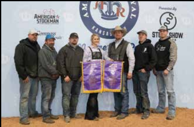
2020 American Royal Premier Breeder and Exhibitor