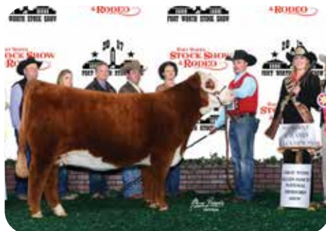
2017 FWSS Reserve Grand Champion Full Sister to Dam of Lot 18