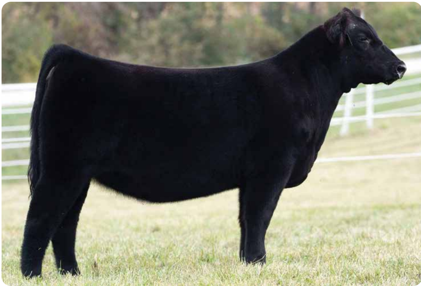
LOT 17 JS LAF 863J

The Maine-Angus division has become one of the hottest and fastest growing composite breeding heifer shows each summer during the Junior National run, and for very good reason... The cattle are the real deal! Here is a stunning daughter of Gateway Follow Me F163 that has been blessed with the extra bells and whistles! The dam of this female traces to the influence of BPF Premium 1001Y, the elite SLC Sooner 101M son that was bred in the Bushy Park program of South Dakota. 863J is flawless at the surface, square built, and offers a bold outward shape to her rib cage. We love the balance and symmetry that this late February prospect portrays. Make plans to be in Louisville next summer... this one will be a contender!