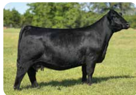
JS Black Satin 9B | 2015-2016 Triple Crown Winner, Maternal Sister to Lot 5 and Full Sister to Lots 6A-6B