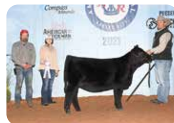
CCS/JS Summer 36J 2021 American Royal Reserve Division Champion

If we were to write a footnote on a bull mate to the next two direct daughters of Summer, we would rant and rave about the balanced traits on the EPD profile and how they rank in the top 15% of the breed for both WW and YW along with a TI in the top 20% and a REA rank in the top 30%. However, we are writing about prospective "show heifers" with unquestioned futures of being incorporated into a donor battery post show career. These leading ladies of this proven mating are quite impressive when viewed and evaluated on physical presence and beef business kind. Both are very similar to their dam with a big soft hind leg loaded with flexibility. They too share the same kind of center body shape and skeletal width while tying it all together into a very neat and ideal front skeleton. Their necks set and tie high and desirable. A very centered and unique pair of full sibs with a lot to offer any beef entity.