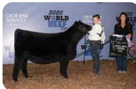
2020 World Beef Expo Reserve Grand Champion Simmental Heifer | Full sister to Lot 8 & Maternal Sister to Lots 9A-9C