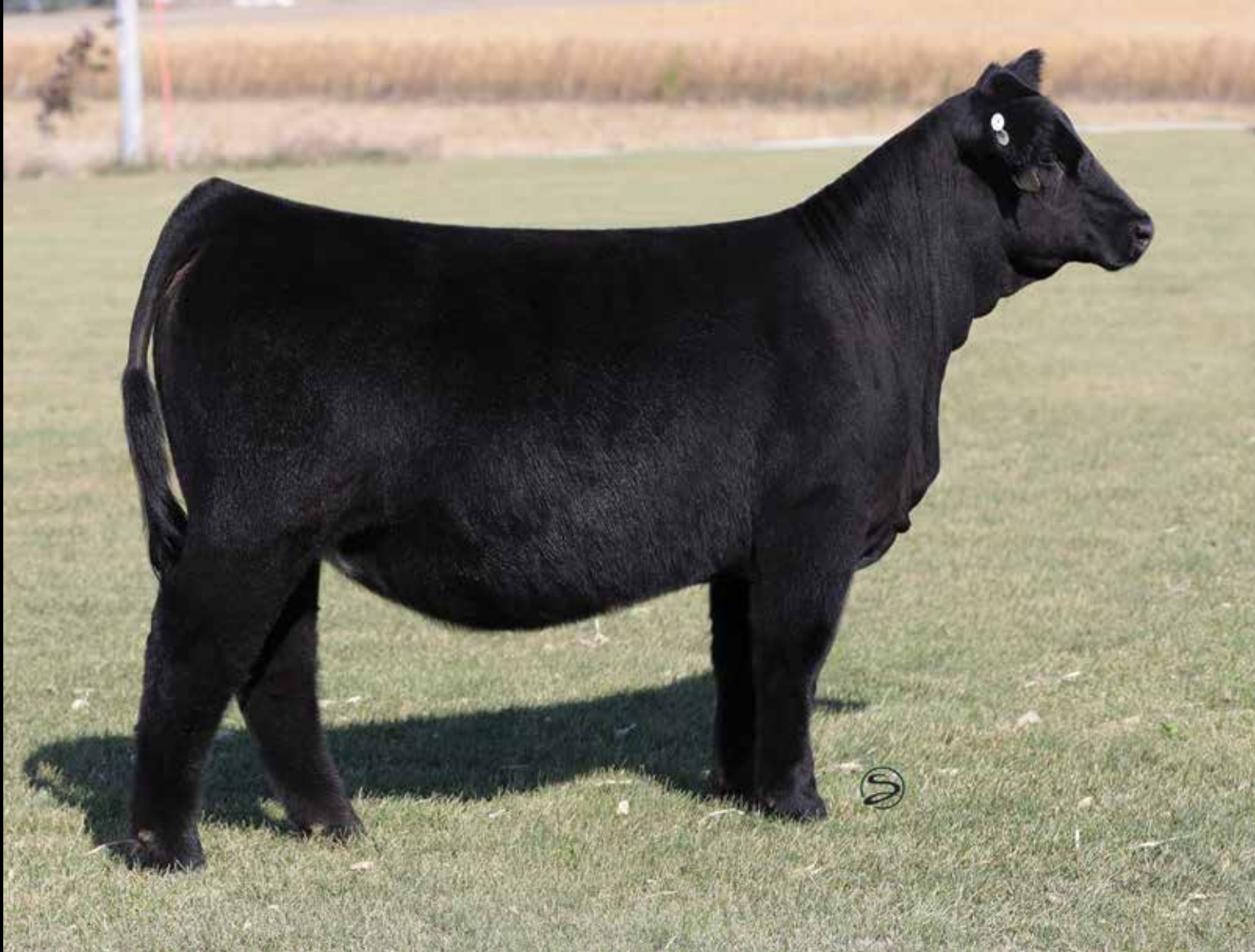
LOT 4 JS PEARL 37J