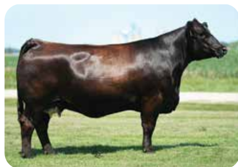
JS Sweet Memories 7P Maternal Grandam