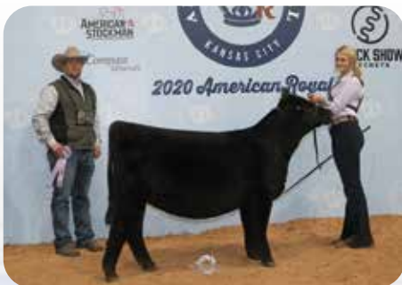
JS Dairy Queen 28H

2020 American Royal Reserve Senior Heifer Calf Champion and Maternal Sister to Lots 8 & 9A-9C owned by Baty Livestock