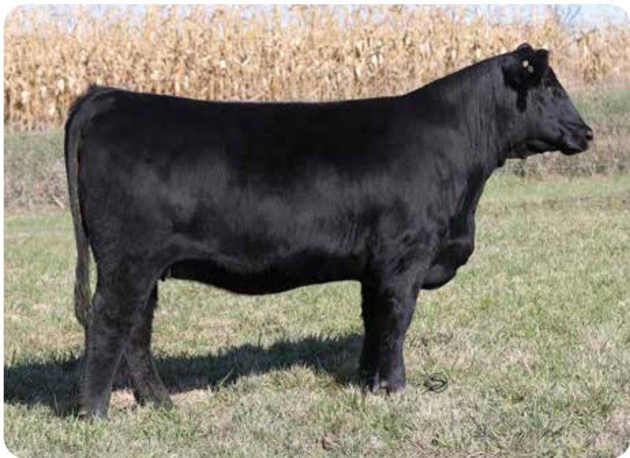
LOT 21 CCS/JS SUMMER 9H

9H is the full sister to the XTB owned stud, Ol' Son. She tops the pen on multiple values from an EPD standpoint as she ranks in the top 15% WW and YW, along with top 20% TI, and top 30% REA. The pedigree alone puts this one on the short list but when the numbers and kind are considered it places more value in her favor. She sells safe to Double Down. AI BRED ON 4/10/21 TO W/C DOUBLE DOWN 5014E (ASA: 3336150). PE 5/1/21-6/30/21 JBSF LOGIC 5E (ASA: 3337441). LIKELY SAFE AI.