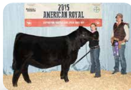
Jass Sass N Flare 107B 2015 American Royal Fall Calf Champion Jr. Show