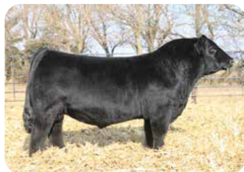
EC Rebel 156F $200,000 Sire of Lot 11