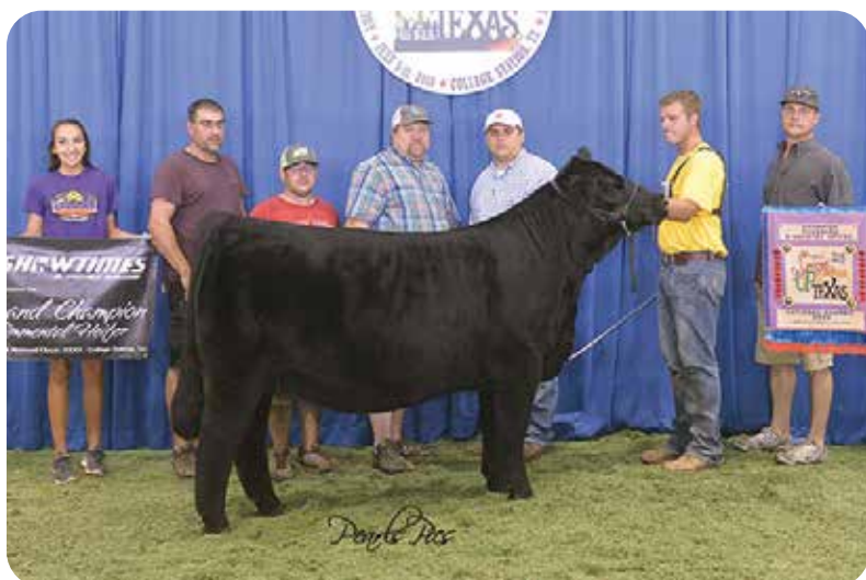
JS Black Satin 9B | 2015 AJSA Summer Classic Grand Champion Purebred Female