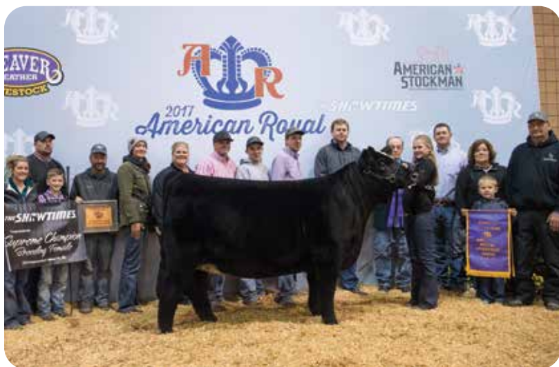
WHF Summer 365C | 2017 American Royal Supreme Champion Female