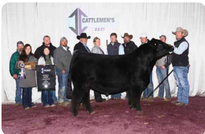
WHF/JS/CCS Double Up G365 | 2021 Cattlemen's Congress Reserve Grand Champion Purebred Simmental Bull