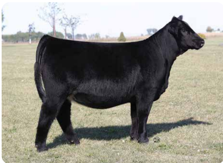
LOT 2B CCS/JS SUMMER 36J