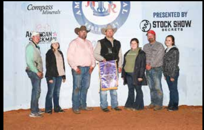
2021 American Royal Premier Breeder