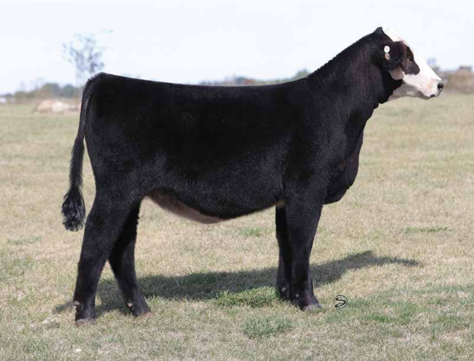
LOT 7 JS/BL FLATOUT FLIRTY 40J