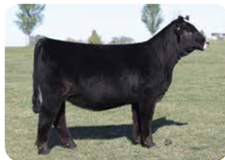
CCS/JS Summer 33H Full Sister to Lots 1A-1C, 2A-2B, & 3