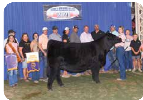
JS Dairy Queen 57G | Full Sister to Lot 8

2021 IA Beef Expo 5th Overall Breeding Heifer, 2021 Cattlemen's Congress Division Champion and 2021 IA State Fair Grand Champion Purebred Simmental Female Open Show