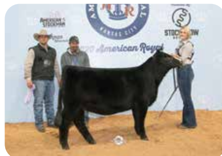
CCS/JS Summer 1H 2020 American Royal Reserve Sr. Heifer Calf Champion