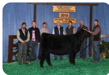
WHF Autumn 365E 2018 NAILE Division Champion