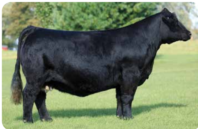
JS Flirt A-Way 59Y | Dam of Lots 5 - 7

If pedigree alone guaranteed the desired result, then the search would be near it's end right here. Logic on the dam of "Boots" yields one with opportunity. This female's length and overall extension ensures predictability of making the ideal yearling. Her bone, foot, and running gears tells us that she will remain sound with certain longevity in the years to follow beyond her show career. She is certainly a bit green as we write these footnotes but by December 10 one will recognize the absolute of all the possibilities that can be with this female.