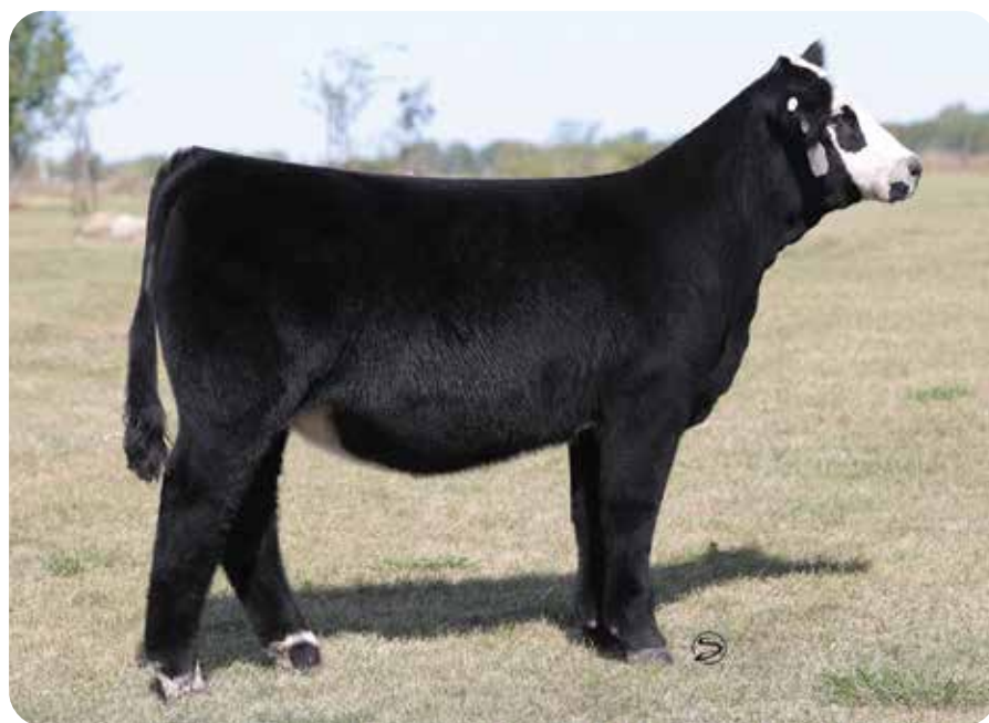
LOT 6B JS/BL FLIRT AWAY 41J