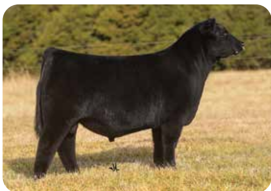
Rose MC Encore 0463 $240,000 Valued Promotional Sire