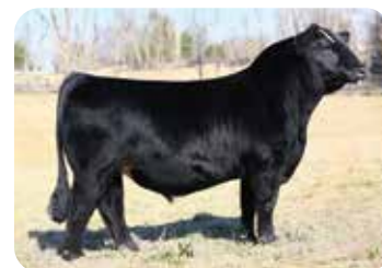
CCS WHF OI Son 48F Full Brother to Lots 2A-2B