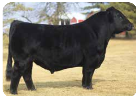
CDI Innovator 325D Sire of Lot 10