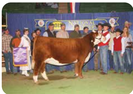
TCC MS Diana 01 Maternal Grandam of Lot 18

The lone Hereford of this year's offering blends some of the most notable individuals in the Hereford breed. Her maternal grandam, Diana is one of the most recognized cows in the Hereford breed! Diana 01 was the $150,000 high selling female in the Sullivan Hereford dispersal and her record of success is known by many. Diana 01 is easily one of the most decorated females in the breed and her success continues. Diana herself had an impressive show career being named the two-time NWSS Grand champion as in 2011 she was Grand in the Junior show and 2012 she was Grand in the Open show among many other titles in 2011 and 2012. Diana's dam, Shelby and Grandam Harley, were both NWSS Grand Champion title winners. We love her look, style, and presence. 101J is sired by the FWSS Grand Champion, H Montgomery 7437 ET. There is no denying that this female is bred in the PURPLE!