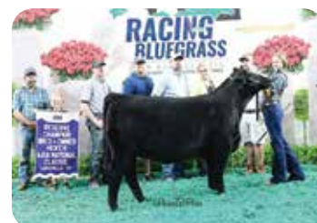
CCS WHF Summer 50F Full Sister to Lots 2A-2B