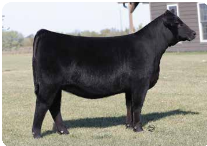
LOT 13 JS EMPRESS J122

This would be one of the stoutest built SimGenetic females to invest in of the offering. One will notice and admire the sheer shape and natural width this female maintains. She is no doubt from a very potent Angus dam that's as dense and 3-dimensional as they come, but yet has the high end model features that enables her sweet look and presence.