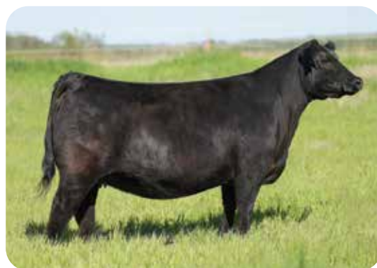
Burns Elba 1454 Maternal Sister to Dam of Lot 16