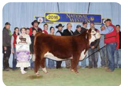
2016 NWSS Grand Champion Full sister to Dam of Lot 18