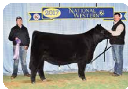
JS Precious Star 41C 2017 NWSS Division Champion