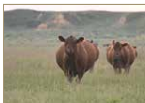
SMOKY Y Blackwood 1779E Daughter of LOT 119