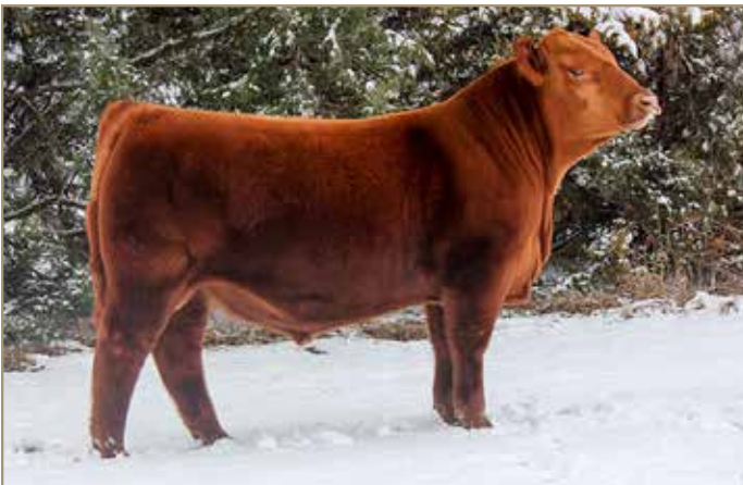
AHL Flashback 446B Sire of LOT 152A