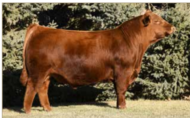
DAMAR Next D852 Sire of LOT 3

85 53 32 10 -0.2 68 112 0.27 1.65 23 7 11 7 15 0.28 0.03 28 0.23 0.01