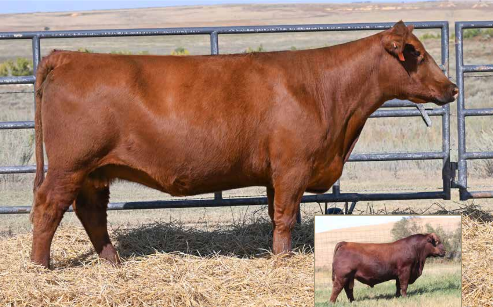
SMOKY Y Ridley 1635D LOT 120