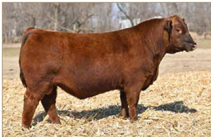
WEBR Declare 59H

Our choice from the 2021 Weber Land & Cattle record setting bull sale. Declare combines the rugged, masculine, fault free phenotype that we all can appreciate, with the extra credentials that set him into a league of his own. Declare sets the bar high when it comes to his performance and ultrasound data, boasting a BW Ratio at 99, with a WW Ratio at 109, a YW Ratio at 111, an IMF Ratio at 125, and a REA Ratio at 107. Numerically he ranks top 6% WW, top 3% YW, top 1% ADG, top 15% CEM, top 10% Marb, top 5% CW, top 23% REA, and top 4% GM. Declare is backed by a dark cherry red daughter of WEBR TC Card Shark 1015. 59H is a truly unique breeding piece that will experience heavy use in our program and the Weber Land & Cattle program.