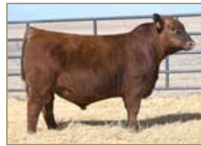
STR PTO 80H Son of LOT 116