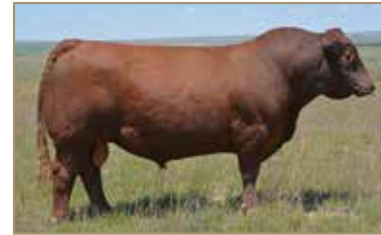
PXC TMAS RED SKY 2794 Sire