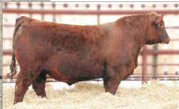
RED SSS Tycoon 225E Sire of LOT 106 and LOT 107