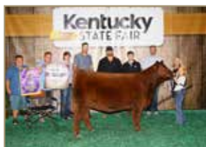
2021 KY State Fair Grand Champion Red Angus Daughter of Lot 118