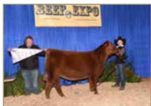
2021 KY Beef Expo Grand Champion Red Angus Daughter of Lot 118