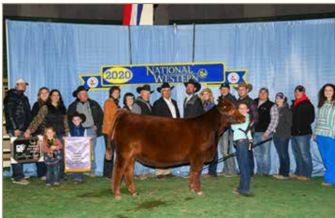
SMOKY Y Gisele 1900G Daughter of Windy Hill Ms Dream 1226Z

150B 5 BIEBER HARD DRIVE Y120 (1436718) X WINDY HILL MS DREAM 1226Z (1722588)