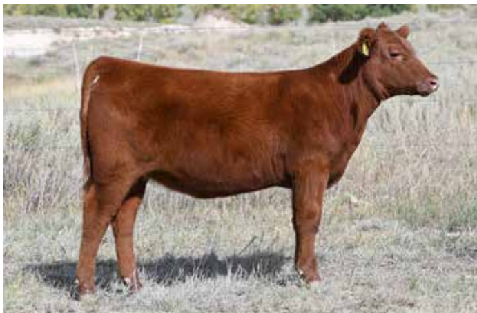
SMOKY Y Dawn J15 LOT 108