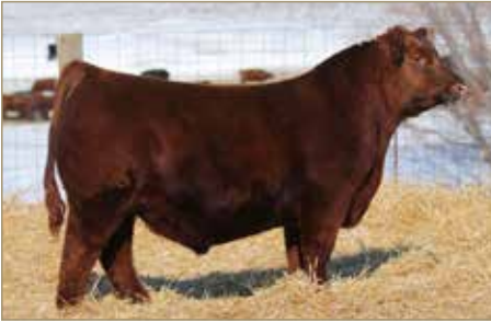
Six Mile John Wick 882E Sire of LOT 151