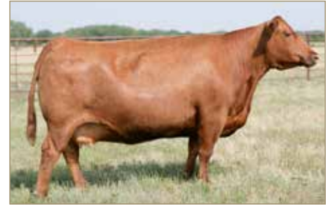
RED Wilbur Cora 443P Maternal Grand Dam of Donor

Cockburn Cora 254Z has established herself as one of the most accomplished Red Angus females in North America. She stems from the Cora family that has been one of the constant creators of breed improvement. It is no surprise that her influence is so potent, she is a maternal sister to Ribeye 308U, and many sisters remain in the heart of the herd at the Cockburn Ranch. Red Cockburn Assassin 624D, is a direct son of Cora 254Z, he was a high-selling bull going to Brylor Ranch for $77,500. This new mating on 254Z could be absolutely lights out, the $114,000 valued, Six Mile John Wick 882E has quickly lived up to the hype that surrounds him with high sellers across North America, his semen is indefinitely unavailable so an opportunity such as this will be hard to replicate again. With each set of five (5) embryos we will guarantee the purchaser two (2) sixty day pregnancies if they are implanted by a certified embryo technician.