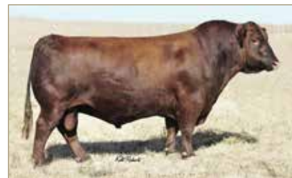
Andras Fusion R236 Sire of LOT 1

SYR Fusion 25H leads off the set of extra rugged and mature, age advantage herd sire prospects that we will sell on November 8th. The Andras Fusion R236 cattle have proven their worth on either side of one's pedigree, they are reliable from the ground up and the heritability of longevity and performance in their progeny is high. The balanced set of EPD's that accompany 25H only go to compliment his stout and shapely phenotype.