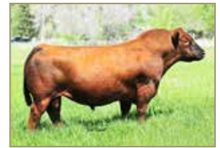
LSF Night Calver 9921W Service Sire of LOT 116