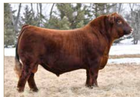
MCKY 8731 ET "Josie Wales" Sire of LOT 104

DOB: 3.3.21 | REG: 4472545 | TATTOO: J7 | 100%AR