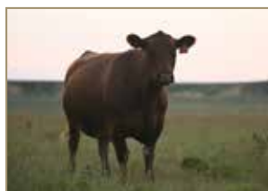
SMOKY Y Blackwood 1779E Daughter of LOT 119

1779, one of the premier young females in our program working this past summer. Body, fleshing ease, and a structural build that you can hang your hat on. The lone bull she has raised works for Victor Schwartz in Lansing, Kansas. She is bred up early for a January calf sired by Red Wheel Stark 67G.