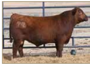
SMOKY Y Assassin 9155G Son of LOT 116