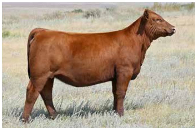
SMOKY Y Emuly J4 LOT 101

There is only a small sampling of these NCJ Coming In Hot 24E daughters but we are pretty excited about what he did for us this calf crop at Smoky Y. Smoky Y Emuly J4 is also backed by a female that we hold in very high regard at the ranch, Smoky Y Emuly 1442B, a female that holds an elusive position in our donor pen, and the opportunity to purchase the rights to flush her also sell on November 8th.