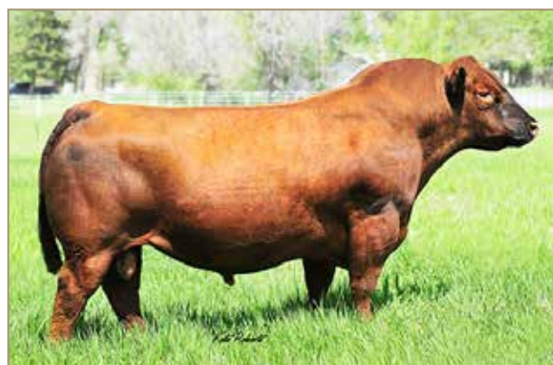
LSF Night Calver 9921W Sire of LOT 6

If you're in the market for a sleep all night heifer bull then you need to take SYR Night Calver 71H into serious consideration as you make a decision on sale day. Check out the impressive EPD profile that supports this sleep all night heifer bull, a top 8% BW, top 14% CED, top 1% CEM, top 2% HerdBuilder and top 4% ProS are just a few of the traits that he excels in. If you need further proof of his calving ease prowess then note his ratio of 78 at calving, he was the low birthweight leader of his contemporary group, at a mere 63 pounds at birth.