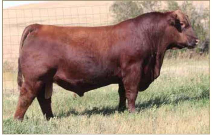
RED Wheel Stark 67G

The newest but perhaps most anticipated member of the bull battery, we gained an interest in Stark 67G because of the extreme outcross he brings to not just our cowherd but many Red Angus herds. Additionally the buzz around the progeny he is propagating north of the boarder is surreal, we look forward to the extreme body shape, performance, maturity and carcass that he is supplying in the first generation. We turned to Wheel Stark 67G hard at the breeding box this breeding season and we eagerly await the results, we do not plan to sell very much of this semen so take advantage of the opportunity while it exists.