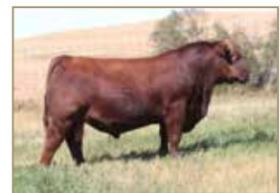
RED Wheel Stark 67G Service Sire of LOT 117