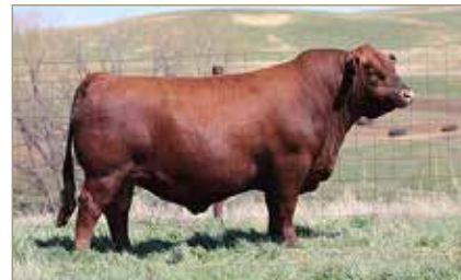
RED Six Mile Custom Made 505 Sire of LOT 15

A bigger outlined and longer spined son of the highly accoladed Red Six Mile Custom Made 505, he is the lone descendant in this offering however we wish we had more of his influence. On the bottom side of SYR Custom Made 125H's pedigree you will find an exciting young daughter of PIE One Of A Kind 352 that is making her presence felt strong in the cowherd. Great looks, good structured and nice patterned, a fault free bull that will keep your program headed in the right direction.