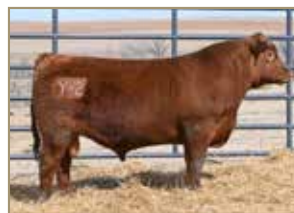
SMOKY Y RTH III 9103G Son of LOT 117

Safe AI to RED Wheel Stark 67G, RAAA: 2104790. Estimated due 1/7/22. Retaining 50% Embryo Interest.