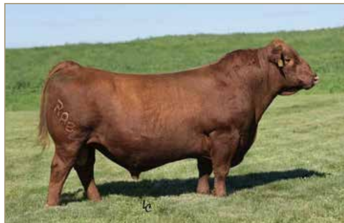
Bieber Hard Drive Y120 Sire of LOT 150B