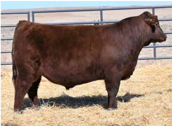
SYR Landslide 119H

All cows have been pasture exposed to: SYR Out Cast 131H (RAAA 4426513) and SYR Landslide 119H (RAAA 4390373)