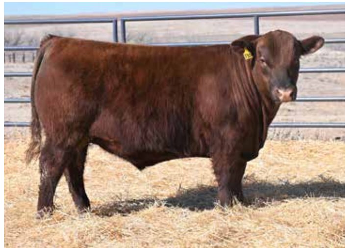
SMOKY Y Atomic 40H

Exposed to: Smoky Y Atomic 40H (RAAA 4388365), Smoky Y Nebula 9217G (RAAA 4220574) and Smoky Y Detour 9121G (RAAA 4220612)