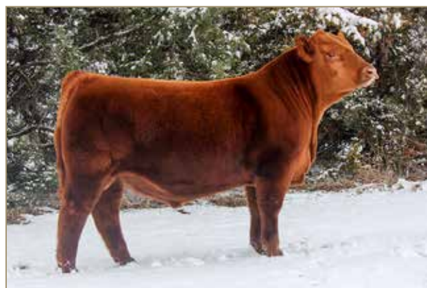
AHL Flashback 446B Paternal Grand sire of LOTS 18-25

67 51 15 7 2.5 81 130 0.3 1.77 21 2 10 5 15 0.1 0.04 31 0.15 0