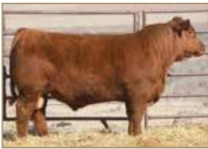
SMOKY Y One of A Kind 7140E Son of LOT 116

Safe AI to LSF Night Calver 9921W, RAAA: 1368797. Estimated due 1/7/22. Retaining 50% Embryo Interest.