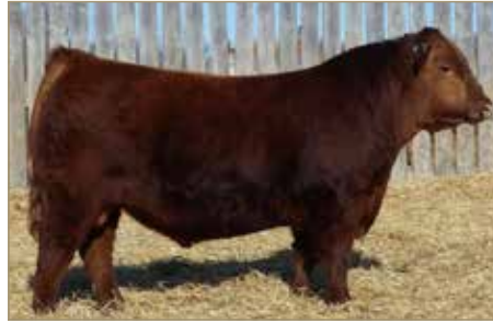
Cockburn Assassin 624D $77,500 High Selling son of Donor