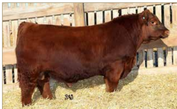
RED U-2 Renown 193C Sire of LOT 105

51 50 0 6 2 62 85 0.15 1.27 23 -20 8 3 13 0.25 -0.01 10 0.9 0