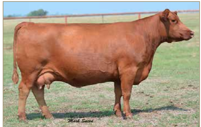
A-1 Sierra Indeed 549X Donor Dam of LOT 152A and LOT 152B

A-1 Siera Indeed 549X was a featured female in the historic Wildcat Creek Ranch Dispersal, we have never for a moment regretted the investment we made that day, she is a maternal sister to the Red Six Mile Sakie 832S bull that during his time was the most utilized Red Angus bull in the breed and for good reason. Siera consistently makes them dense, big bodied, super functional and regardless of sex they quickly elevate themselves to the forefront of a calf crop. She has over 65 head of progeny registered in the Red Angus Association of America's database, many of which are employed within either our cowherd or others on prominence. The Lot A package combines two of our herds most influential individuals, the combination of AHL Flashback 446B and Siera is tried and true, we have an awesome set of young cows that will set the foundations for our Spring and Fall sales in the years to come. The Lot B embryos are out of a Canadian bull purchase, BAR-E-L Concept 49C a high performing, and growth driven son of U-2 Justified 235Z. With each set of five (5) embryos we will guarantee the purchaser two (2) sixty day pregnancies if they are implanted by a certified embryo technician.