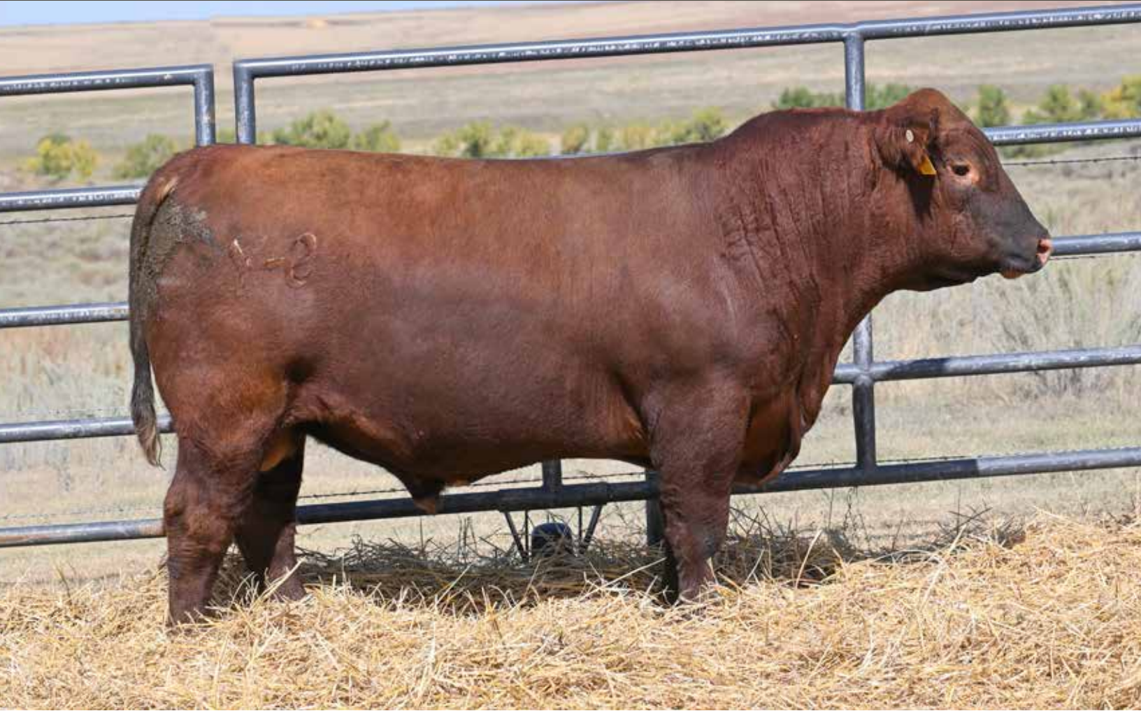
SY Regulator 155H LOT 22