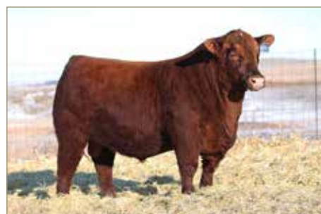
NCJ Coming In Hot Sire of LOT 101, LOT 102 and paternal grandsire of LOT 103

This group of open heifer calves come from truly the heart of the replacement pen, we have hand sorted on them to bring you a group that are easy on the eyes, and out of our most potent cow families, meaning their ability to go on and generate is high. We put a lot of value in the build of Smoky Y Riley J6, she is extra square topped, deep bodied and great structured.