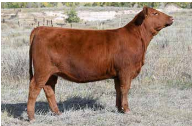
SMOKY Y Rita J12 LOT 114