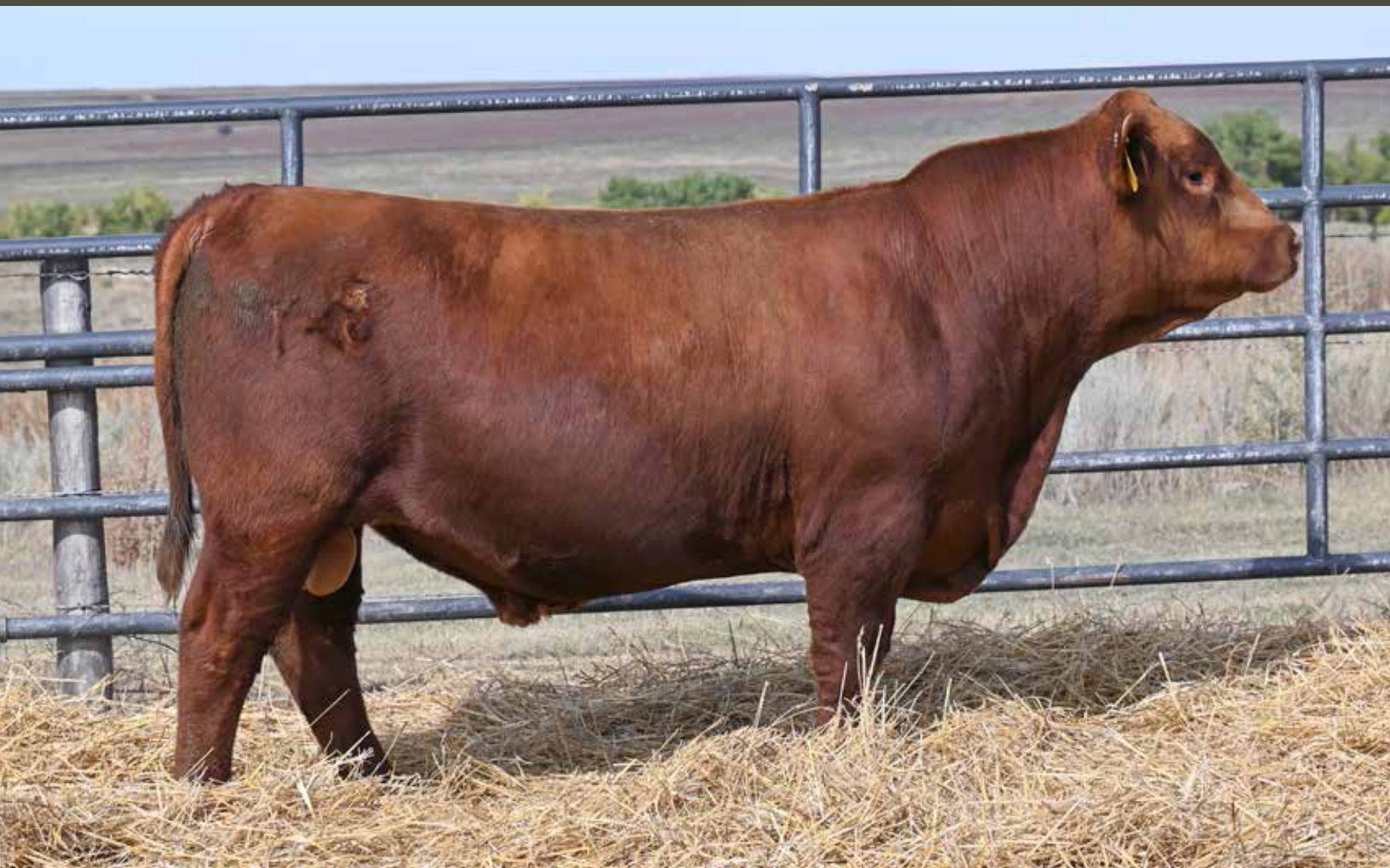
SY Outback 56H LOT 19