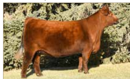
ROJAS Navarre 6054 Paternal Granddam of LOT 16

We continue to utilize the Damar Trump C512 influence throughout the cowherd, his progeny are renowned for bringing extra substance and density to their calf crops in the first generation whilst still being a great calving ease option. You will notice the Rojas Navarrea 6054 matron on the paternal side of Trump 104H, she is one of the most impressive Red Angus females you will ever see. We think the set of replacements that could be generated through the service of 104H would be great additions to any cowherd.