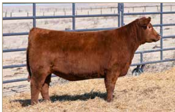
SMOKY Y Emuly 1921G Daughter of LOT 115

109 92 17 6 2.9 69 105 0.23 1.53 27 -11 10 4 19 0.24 -0.02 20 0.19 0