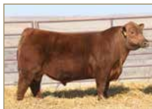
SMOKY Y Now or Never 7139E Son of LOT 117