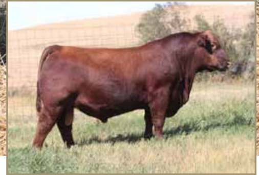
RED Wheel Stark 67G Service Sire of LOT 121