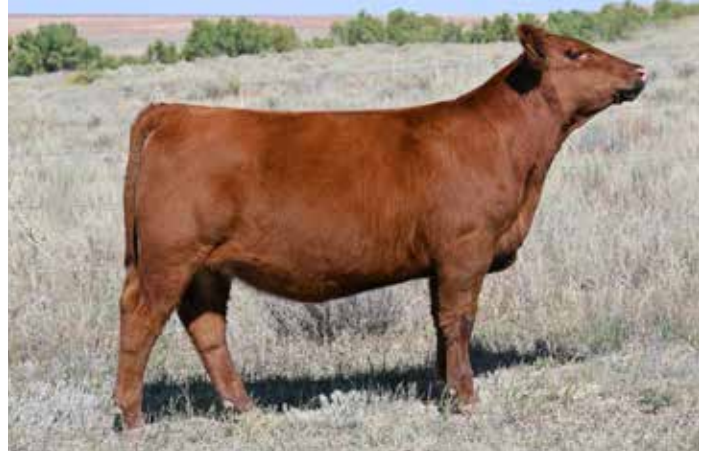
SMOKY Raven J8 LOT 110