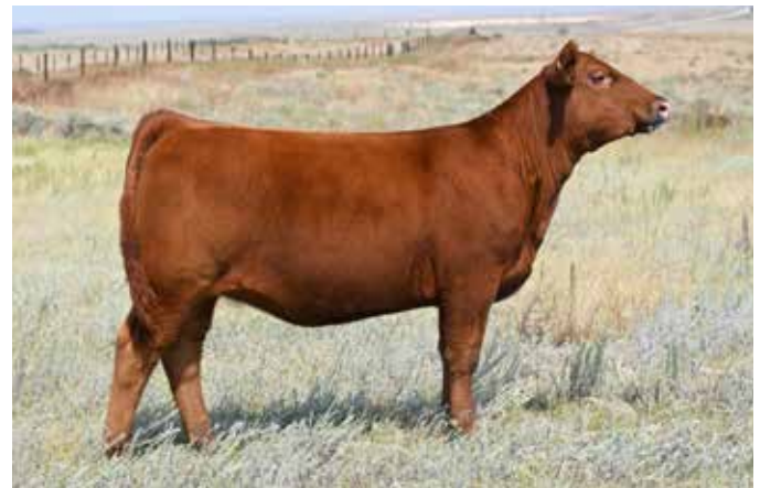
SMOKY Y Lana J5 LOT 113

We can begin by talking about her fault free build that is correct from the ground up, she is dense and bold. After examining the phenotype check out the genomic data that supports her, massive growth indications highlight her ability to quickly and potently add payweight from the maternal side.