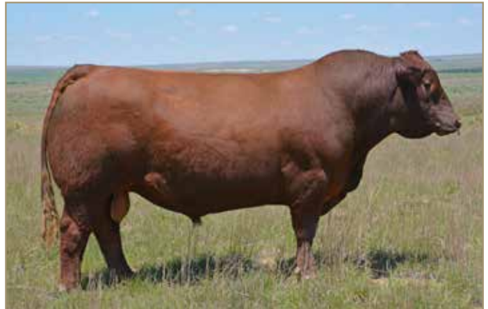
PZC TMAS Red Sky 2794

Red Sky is the flush mare brother to Red Zone that we selected from the Thomas Ranch Annual Bull Sale in Harold, South Dakota. Red Sky is without a doubt one of the most dominant producers that we have ever used in our program. His sons topped previous sales and continue to be a hot commodity on sale day. The daughters are without a doubt the most valuable asset that Red Sky possesses. In production it seems that the stoutest, heaviest, and highest quality calves each year are backed by a Red Sky daughter! Red Sky continues to walk the pastures of North Western Kansas and services cows naturally during the spring and fall breeding seasons.