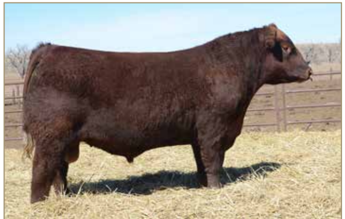
PZC TMAS Red Zone 2795

Red Zone is a flush mate brother to Red Sky that is now deceased. Sired by Firestorm and backed by the great Whitestone Lana donor. He was our pick of the bulls that were on "the hill" at the National Western Stock Show in 2014. He was tremendous in terms of his foot size, stoutness, and muscle shape. A dark red herd sire that transmits exceptional stoutness and eye-appeal into his progeny. The Red Zone daughters are making tremendous producers in the pasture. Red Zone was purchased by Blairs.Ag and was used extensively in their progressive program in Saskatchewan, Canada.