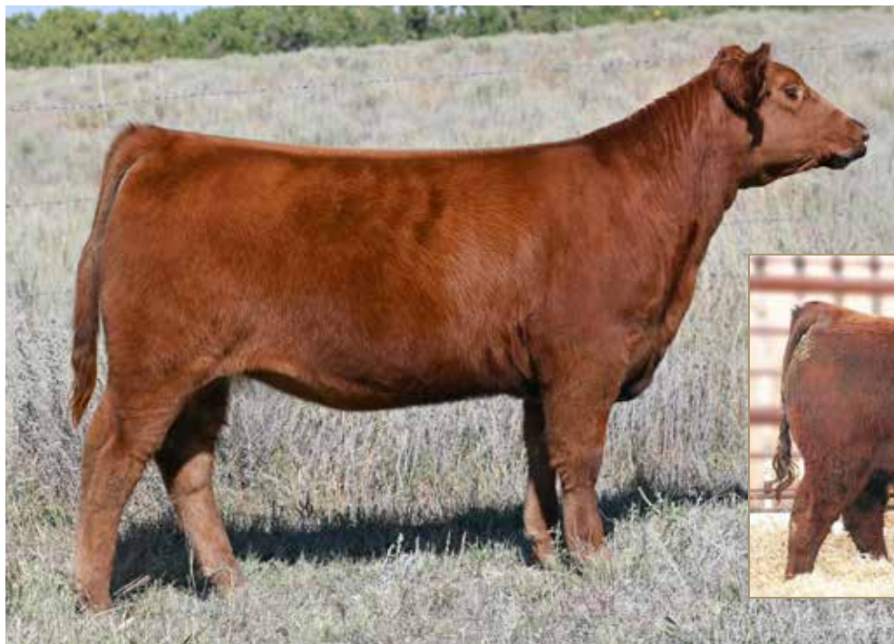
SMOKY Y Brandie J9 LOT 106