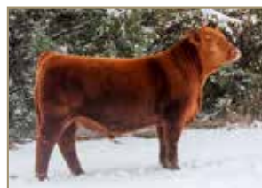
AHL Flashback 4468 Service Sire of LOT 118

Safe AI to AHL Flashback 446B, RAAA: 1667094. Estimated due 1/7/22. Retaining 50% Embryo Interest.