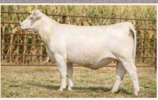
LOT 111 · CCC MS BESS 0090 P