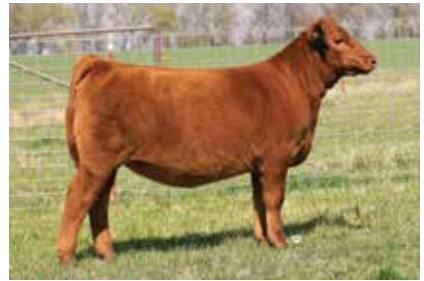
JCL Raspberry - Maternal Sister to Lot 17 Embryos