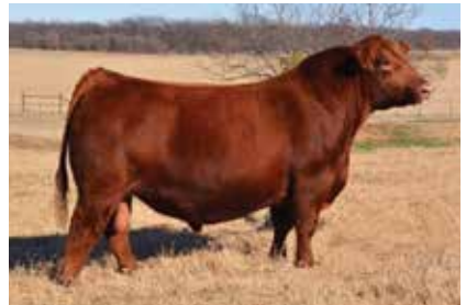
Red Northline Tucker 54E - Sire of Lot 2

Have a wish list? Sparkle may check a lot of boxes... EPD's, plus structure, plus depth of rib. She's from Northline Tucker, the Champion bull at the 2020 Fort Worth show. Her dam is the $54,000, top selling female from the 2017 Denver Champion... Royce's Sensational. She is now deceased, so if you want a daughter, get her now! Take a gander at her EPD's... Tough to find this EPD/pedigree/structure combo.