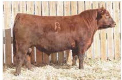
Leachman Pledge A282Z - Sire of Lot 12

From the resident EPD Queen at JCL, Royce's Sensational 14A (now deceased). Peggy Sue is a big young cow, sired by the high-performing Leachman Pledge. She is a high EPD female herself, with lots of breeding possibilities. She sells safe in calf to JCL Dayton – due in February. AI'ED TO JCL Dayton 923G (RAAA# 4231006) sexed heifer. Due 2/21/22