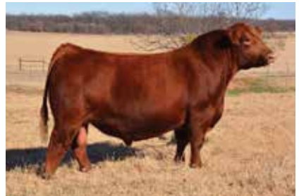
Red Northline Tucker 54E- Sire of Lot 18 Embryos

Mimi is a young cow with rock-solid pedigree... one of the select few females we chose to sell in this first sale. Mimi is a strong producer, and we really like the mating on these embryos. Mimi is beautiful fronted, modest framed, and has a beautiful udder. Tucker will add some frame and extension in this exciting mating! 3 x Conventional Embryos