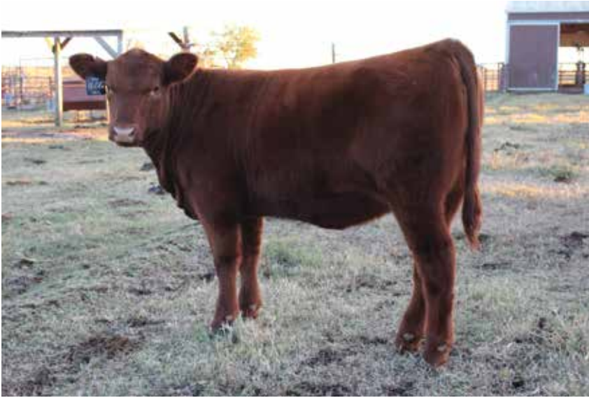
JCL Hilda - Maternal Sister to Lot 13