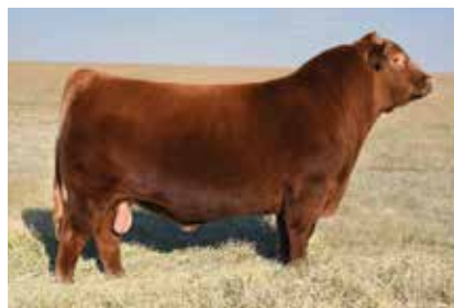
JCL Bandito - Full Brother to Lot 1

Snowflake is an all-around good girl . . . easy to work with, beautiful hair (even in the 100 degree heat of August). Like her full brother, JCL Bandito, she is super smooth although she is darker red than Bandito. Notice her strong EPD's for weaning and yearling. Full sister to JCL Bandito, a member of the 2020/2021 Show string. She has a pedigree that works . . . her mother is SO consistent. She's the kind that can work in the ring and in the pasture.