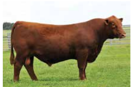
Jeffries Gladiator 24C - Sire of Lot 13

A beautiful female, from one of our young favorite cows... Rose catches the attention of visitors for her beautiful front, strength of top and correctness. Once you see her pedigree, you know that look is no accident. She is a daughter of Jeffries Gladiator 24C, going back to Bieber Spartacus on the top side. On the bottom side of her pedigree you'll find a powerful, yet refined daughter of Jeffries Checotah. Rose's mother remains a foundation cow in the JCL herd. Bred to JCL Dayton - calf due in February, 2022. AI'ED TO JCL Dayton 923G (RAAA# 4231006) sexed heifer. Due 2/11/22