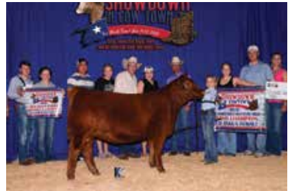
JCL Jackie-O - Full Sister to Lot 6

JCL Chanel... the name goes with the heifer. Elegant. A full sib to JCL Jackie-O... She's the package... Long hipped, strong topped, with a good angle the her shoulder and extension up front. She's good and she knows it... she's a nosy little gal that likes the halter and loves attention. Selling one-half interest (JCL maintains possession) or double the bid and own all of Chanel. JCL Chanel is entered in the 2021 American Royal.