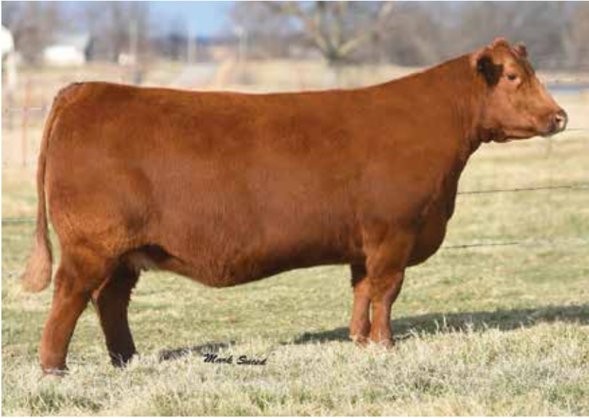
Royce's Sensational 14 - Dam of Lot 12