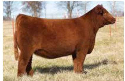
Rojas Duchess 8321 - Dam of Lot 10