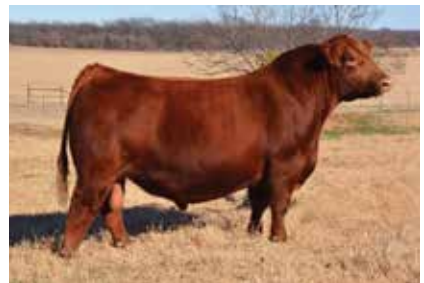
Red Northline Tucker 54E - Sire of Lot 7