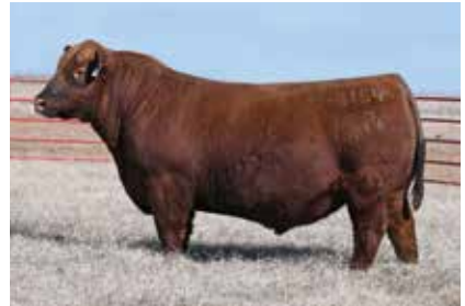
Duff Red Bear 18154 - Sire of Lot 5

From the cow who never misses, and Duff Red Bear. She is a natural calf. Her mother just doesn't miss... Sapphire is a maternal half-sister to JCL Fire N Ice, JCL Jackie-O, JCL Dayton, and JCL Jackie... to name a few. Deep, sound, thick and a sweetie. A real gem! JCL Sapphire is entered in the 2021 American Royal.