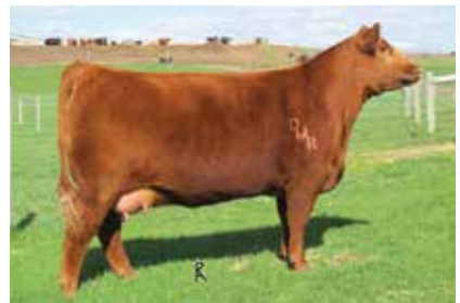
Damar Mimi W085 - Legendary Maternal Granddam

AI'ED TO JCL Polo (RAAA# 4331181) due 4/20/22