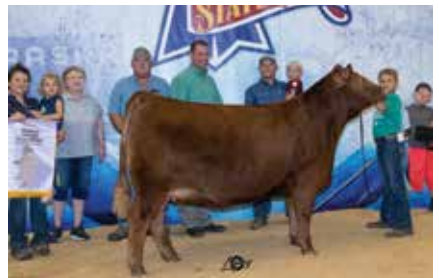
JCL Polly - Maternal Sister to Lot 15 Embryos

Where is Fire N Ice? The most mentioned cow at JCL. JCL Fire N Ice was one of the very first Red Angus born at our place. She's only 3, but already managed to work her way into the spotlight. The mother of JCL Molly (Winter calf champ at the 2021 National Open Show, class winner at the 2021 Junior National Heifer Show), JCL Polly (Champion Red Angus and Reserve Supreme Champion at the 2021 Nebraska State Fair), JCL Dolly (class winner at the Junior National heifer show and Breeders Futurity, 2021). The sire is Duff Red Bear... the $80,000 high seller owned by Trademark Genetics and Pure Beef Genetics. A young bull known for modest birth weights on his progeny that develop with structural soundness, expressive shape and power. 3 x Conventional Embryos