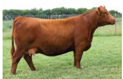
JCL Jackie 812F - Dam of Lot 11

This time last year, Jacque's full sister sold for $15,000 in our Fall 2020 sale. Jacque shares her sister and mom's strengths in structure, broodiness, and pattern. Here is your opportunity to buy a daughter from one of the most favored cows in our pastures. . . JCL Jackie. AI Bred to sexed female JCL Dayton. AI'ED TO JCL Dayton 923G (RAAA# 4231006) sexed heifer. Due 3/10/22