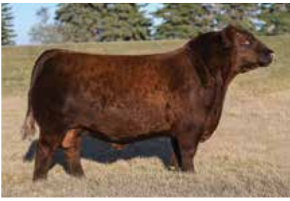
KJHT Power Take Off - Sire of Lot 8

Bunny is a youngster... just an April. It's quite spectacular that she weaned so easily and has taken to the comb and the show stick. She's green – but just where she needs to be for this time of year. A PTO daughter from one of our favorite young cows.