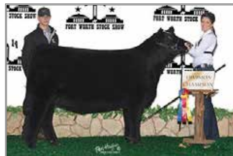
SWC ZEDUCTIVE 166Z 2014 FWSS DIV. CHAMPION MATERNAL SISTER TO DAM OF LOTS 42 & 43