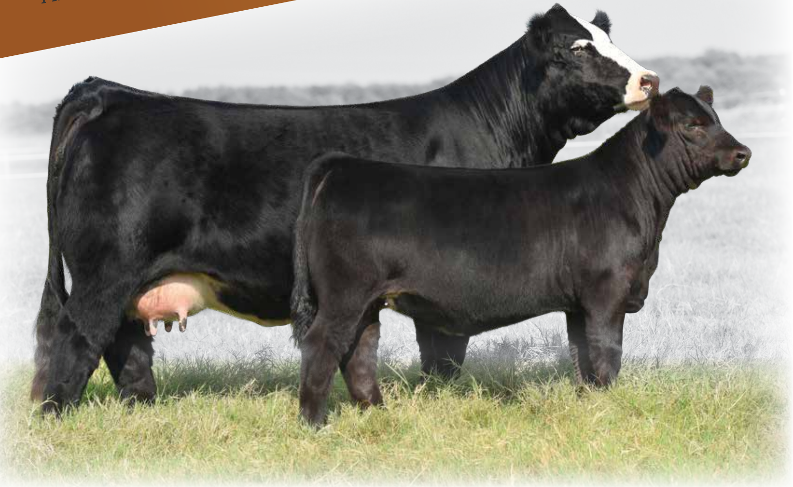
DAM OF LOTS 14A, 14B, 17, & 18