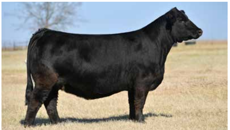
BCL1 ESTELLE 373E FIRST BORN DAUGHTER OF 5073C