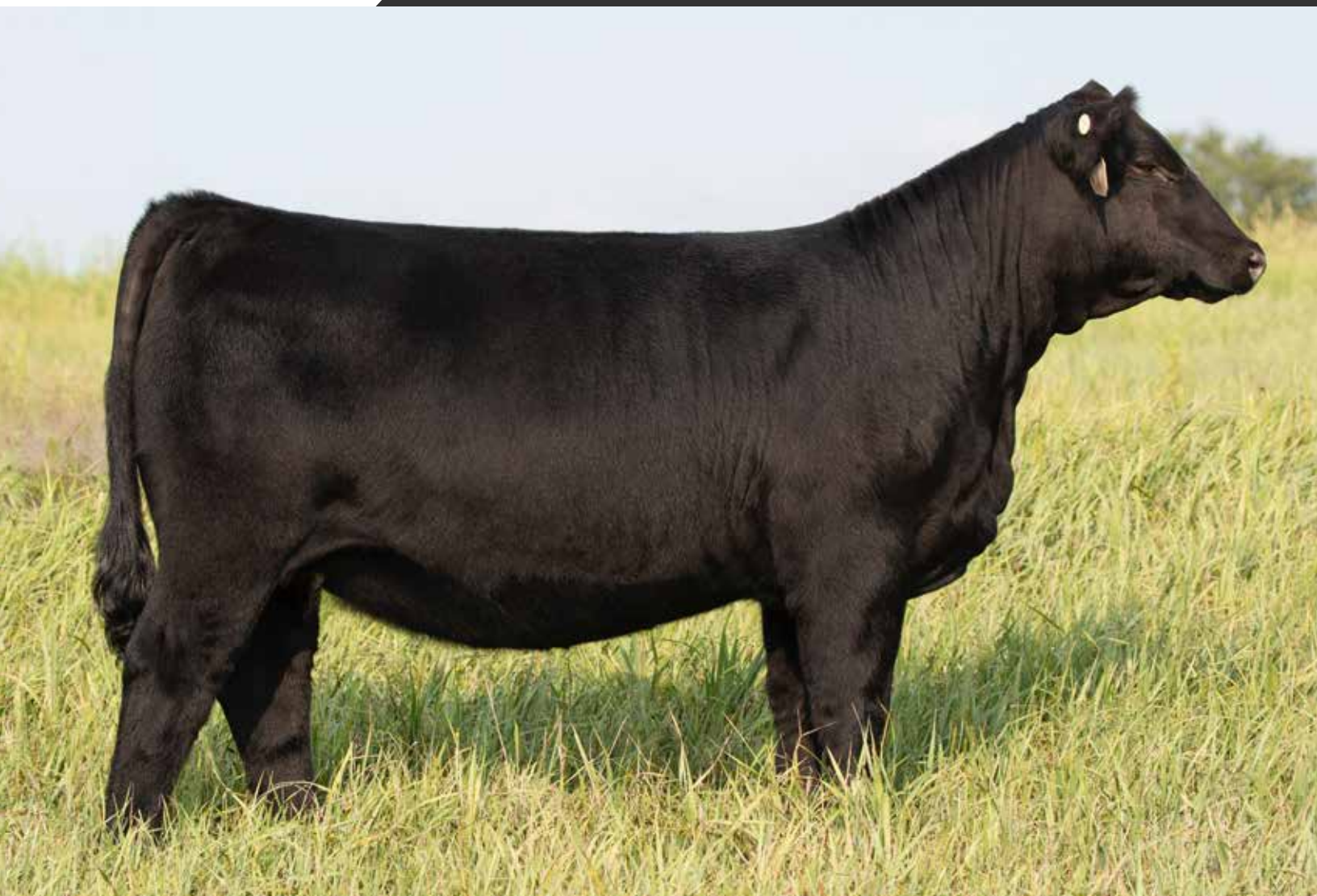
BAR O JAZLYN 107J OFFERED BY BAR O CATTLE COMPANY