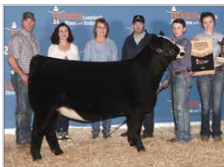
JCBB LADY E3301 2018 HOUSTON LIVESTOCK SHOW & RODEO RESERVE GRAND CHAMPION SIMMENTAL FEMALE