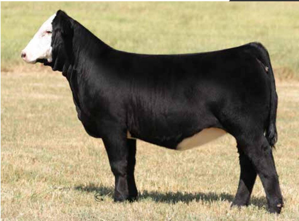
JCB DREAM TIARA 122J OFFERED BY BIRD CATTLE CO. & RICHBURG CATTLE CO.

year for $22,000 and has been campaigned by the Butler family of Texas. 122J offers an elite combination of phenotype and cow family that collectively will make her a valuable investment for any breeding program or ASJA member!