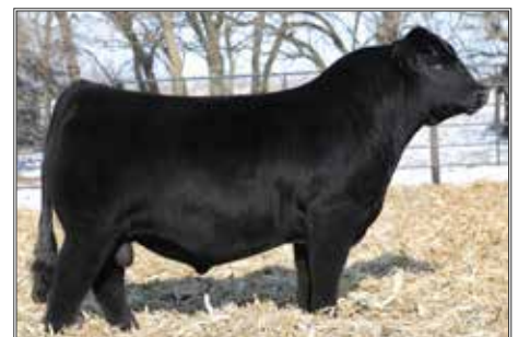
SO REMEDY 7F $530,000 SIRE OF EMBRYOS