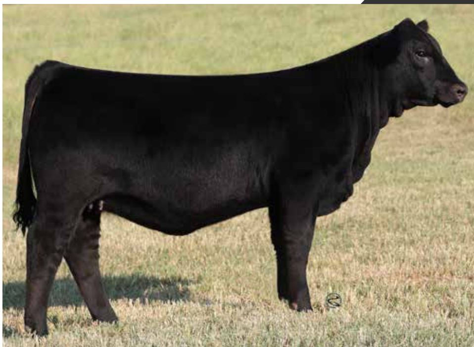
HSC SWC JILLIAN 012J OFFERED BY SHIPWRECK CATTLE CO. & HILMES CATTLE COMPANY

Another potent duo of flush mate sisters to select from one of the true foundation cow families affiliated with this sale offering. The maternal grandam of these sisters was a member of a trio of private treaty cows from the famed Limestone program of Oklahoma. She is responsible for some of the early high sellers in the Black Label series and left a set of daughters to carry on the Vale Bar influence. The donor dam of these females is quite powerful in type and kind and would have been a sure enough equal contributor towards the 3-dimensional kind that they are. She has been a very productive and profitable female for Hilmes Cattle Co. Enterprise, the sire, is a past high seller of the Kearns Cattle Co. bull sale, he is a full brother to Exclusive, and his flush mate sister is the dam of the 2020 Black Label high selling female as well. I know it sounds like a broken record, but again saturated in proven genetics and when you factor in their modern phenotype, the possibilities are limitless.