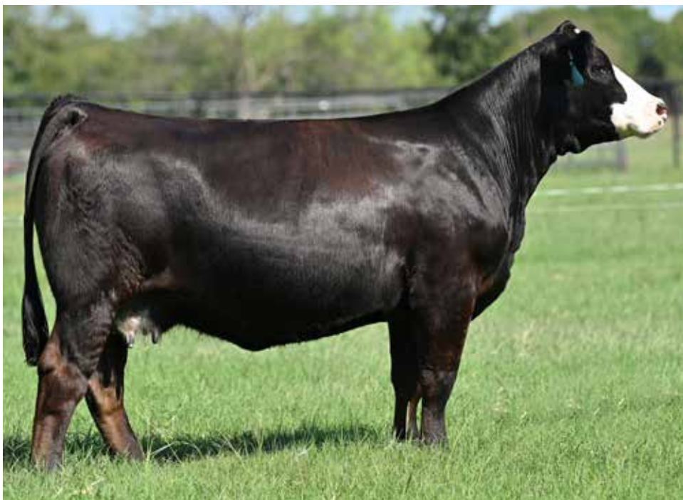
BLC1 FAIREN 473F OFFERED BY SHIPWRECK CATTLE CO.

Our approach on mating Chanel hasn't knocked one out of the park, but they have been fundamentally right in all aspects of evaluation and production. Like many of the 5073Cs, 473F is built good but not freaky. This direct daughter of Ledger leaves us a very good black, blaze-faced son of High Rise in the bull pen from her efforts this year. I have always admired this one's type in terms of tying high out of her shoulder, the boldness of her back and rib shape in combination with the ultra-flexible, trendy hind leg set with true depth of heel to absorb the ground pounding that she does so elegantly. This mating to Right Time will be special and profitable. AI BRED ON 3/28/21 TO ES RIGHT TIME FA110-4 (ASA: 3481590). SAFE AI.