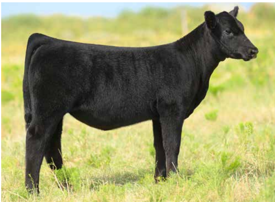
JARR JOLENE 102J OFFERED BY RICHBURG CATTLE CO.

JARR Jolene 102J is the JCBB Cash Money daughter that has the eccentric features that ultimately will allow her to stand out from the crowd. Ultra-feminine and refined about her front third, flat shouldered, elevated in her chest floor, and square in her basic build. This May born show heifer prospect is one to keep an eye on, they don't make them like this every day!