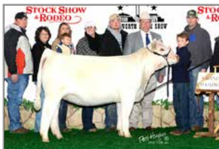
LJR MS TIGER LILLY 2041C ET 2016 FWSS GRAND CHAMPION CHAROLAIS FEMALE - DAM OF LOT 64