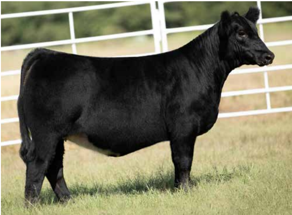
FUS QUEEN OF HEARTS 14J OFFERED BY F4 LAND & CATTLE

Ultra cowy very flexible beast at every viewpoint with the definite cobra style neck on picture day! This female has all the belly, width, and dimension needed to get to the next goal post. Her dam is doing a real nice job and we look forward to from this great young female. These Bankroll daughters are making great young cows and this one won't be any different with the 056 influence.