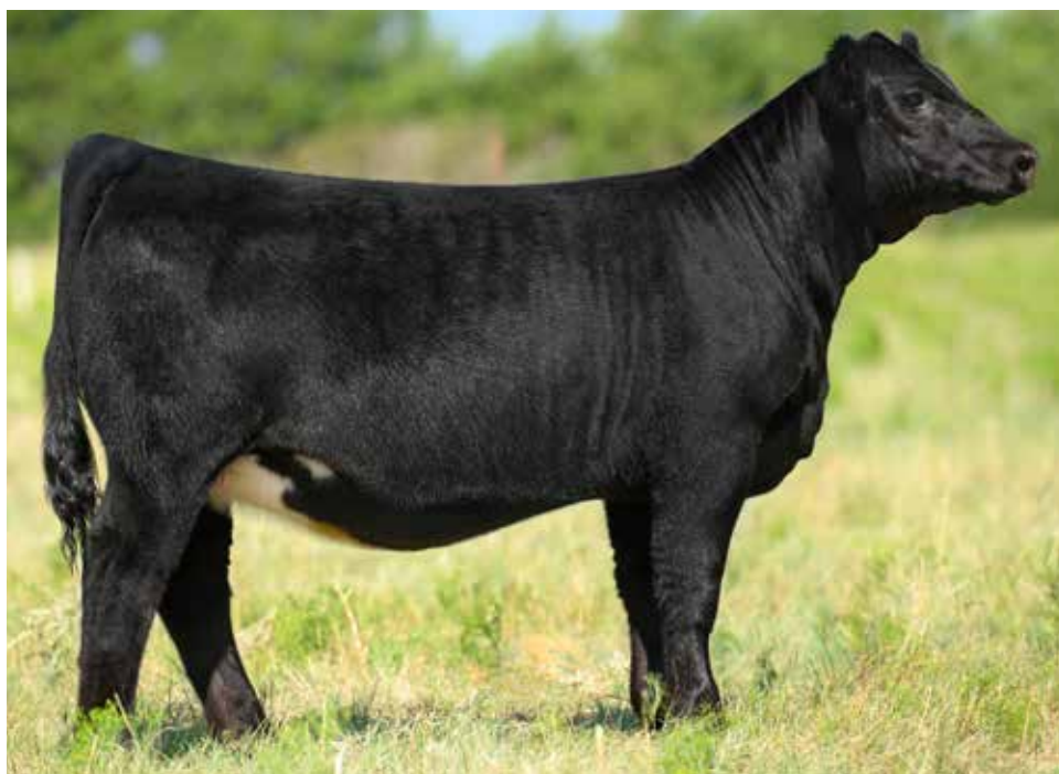
JARR JENNY 101J OFFERED BY RICHBURG CATTLE CO.