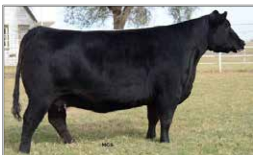
RF PRINCESS 512R MATERNAL GRANDAM OF LOT 63