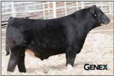
TJ FROSTY 318E SIRE OF EMBRYOS 12C