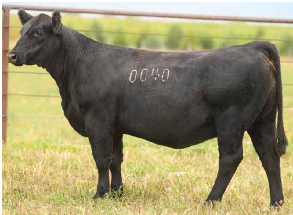
TKCC ECHO 0040 OFFERED BY KEARNS CATTLE COMPANY

TKCC Dolly 0034 is the Battle Cry sired daughter of the matriarch of the Kearns Cattle Company program, Ford RJ Dolly Y83. Dolly has done it all in terms of producing elite females of influence, herd sires, and high sellers. Dolly's most notable son would be the great Classified, a former herd sire in