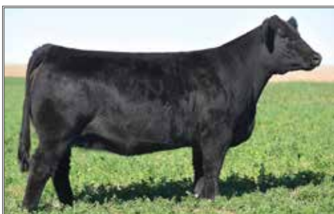
TKCC VICTORIA 57A LEGENDARY DAM OF LOT 74