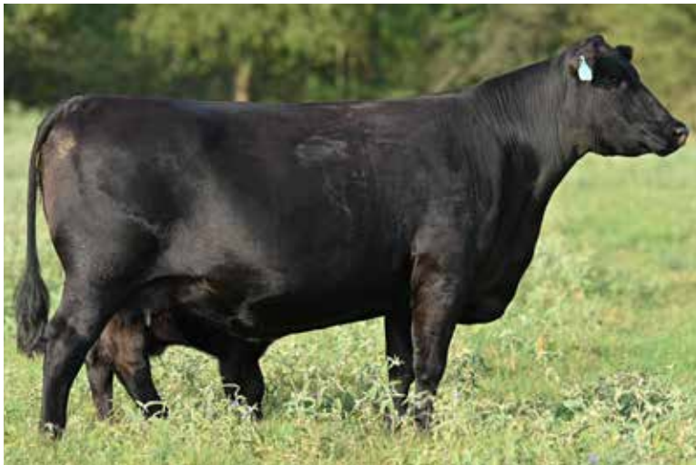
B3R E260 BLACKBIRD W233 S040 OFFERED BY SHIPWRECK CATTLE CO.

81A: HEIFER CALF BORN 8/12/21. SIRED BY DOUBLE G PAYWEIGHT 7705 (AAA: 18883465).