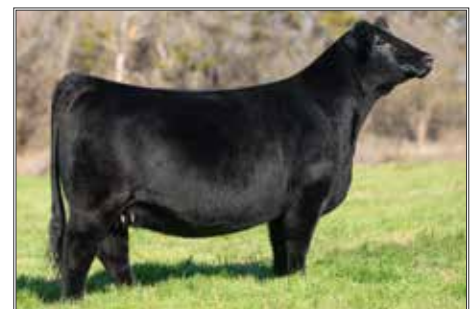
MMK SINISTER HEART 129F DAM OF LOT 54