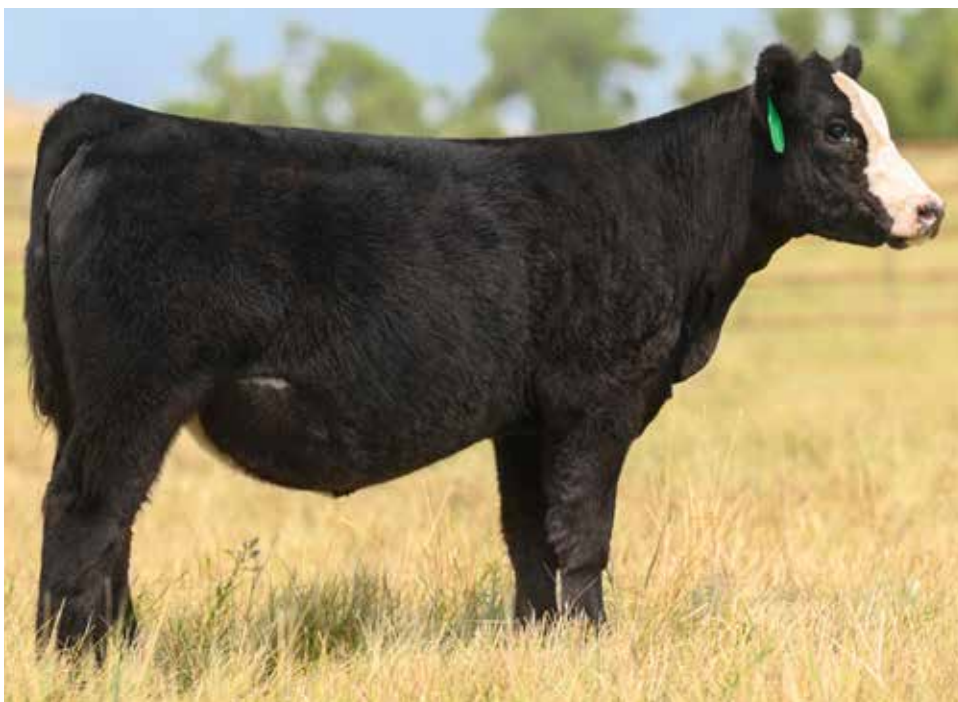
KCC1 ESTELLE 5003J OFFERED BY KEARNS CATTLE COMPANY