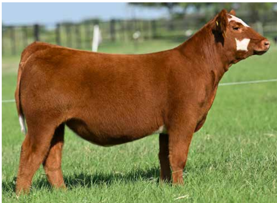
BAILEY'S SWC DREAMY LEAP 166J OFFERED BY SHIPWRECK CATTLE CO. & BAILEY LIVESTOCK

Unique in color, skeletal design, and balance... ladies and gentlemen here is a direct daughter of the legendary Bailey's Ms Dreamy 946W matriarch, one of the HOTTEST cows in the Simmental breed! This million dollar producing donor dam has produced Junior National Champions, six figure high sellers, and now daughters are making their mark in production. The sire of this chrome marked Purebred is the $109,000 JBSF Berwick 41F. This is the first daughter from the new mating to EVER sell! Just image the ROI potential here when her show career comes to a close!