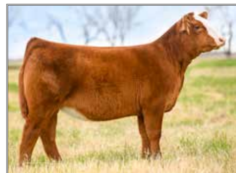
SWC ANNIE ROSE 091F $30,000 FULL SISTER TO LOTS 11A & 11B

AI BRED ON 3/21/21 TO ES RIGHT TIME FA110-4 (ASA: 3481590). SAFE AI.