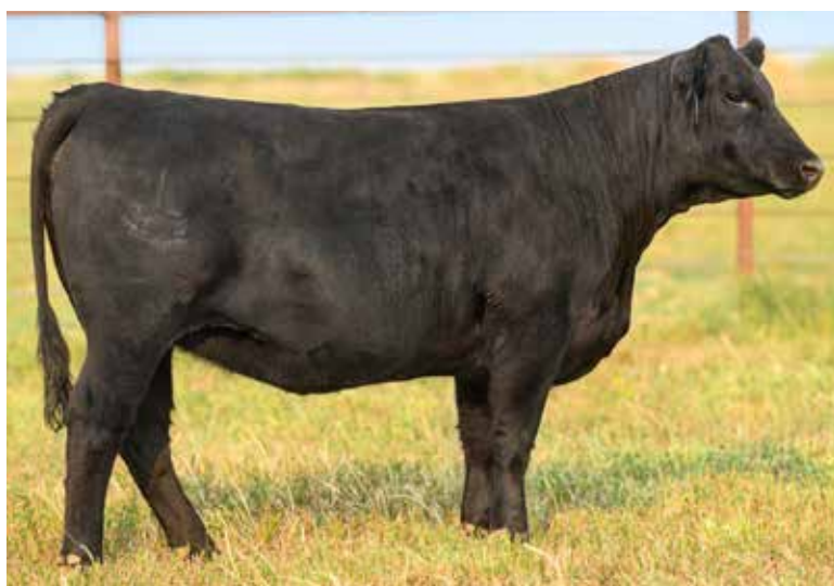
KCC1 MS EMPIRE 0042 OFFERED BY KEARNS CATTLE COMPANY

KCC1 Ms Carver 0062 is a big boned, bold centered, powerful hipped daughter of the $33,000 TKCC Carver 65C, tracing to the legendary matriarch known as Ford RJ Dolly Y83. The dam of 0062 was our selection from the Hanel's Simmental female sale a few years ago that is sired by Premium Beef and from a top S A V Bismarck 5682 dam. AI BRED ON 4/15/21 TO KCC1 WAR CRY 878G (ASA: 3678383). PE FROM 5/10/21 TO 7/10/21 TO BAR CK 3016A 9045G (ASA: 3766652).