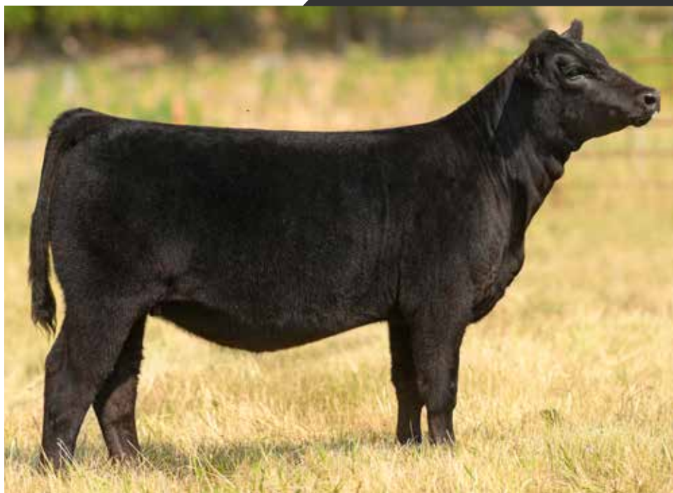
KCC1 ESTELLE 503J OFFERED BY KEARNS CATTLE COMPANY

Colorado. She may be a tick greener in her condition at sale time, but we believe that this sleek made, neat featured female is one to project what she will look like as a heavy bred. Elite cow families line her pedigree from top to bottom!