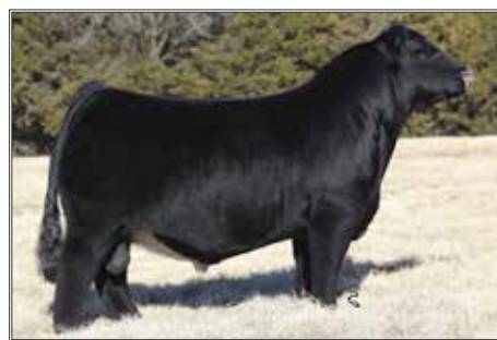
GEFF COUNTY O SIRE OF LOT 44-46

The red and white painted female that offers unlimited mating flexibility post show career! Some would throw her away on color alone, but one better study the type and build here before being hasty. In this state (Texas) and in this region (Southwest), this female's color and kind can go a long way in terms of utility in production and the potential to generate land payments. She's one of the biggest footed in the book, very heavy and dense boned with an exceptionally loose and flowing skeleton for the amount of power and center mass she offers to the eye. One that is certainly BURLY, yet neat enough featured to draw attention. She's the rare, BIG colored purebred of the day.