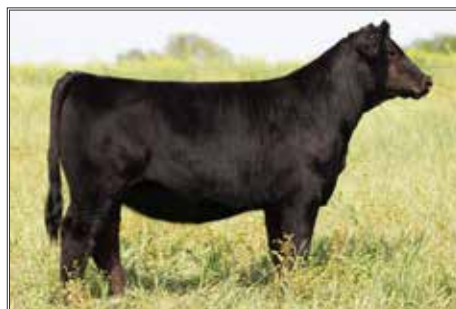
BAR O HALLIE 019H $35,000 FULL SISTER TO LOT 41