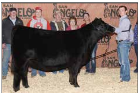
J&J PRINCESS 619 DAM OF LOT 48 2018 SAN ANGELO GRAND CHAMPION ANGUS