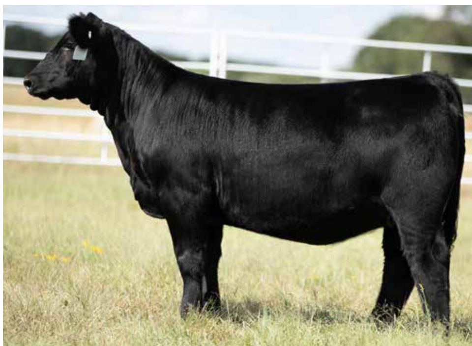
WBL I CROSS MY HEART 412J OFFERED BY BARKER LIVESTOCK

No DNA needed here as she blood types on appearance alone. Wide based, bold built-in rib and muscle, yet still handles her running gear in textbook form with flex of pastern, knee, and the right set to her hock. Certainly true to kind.