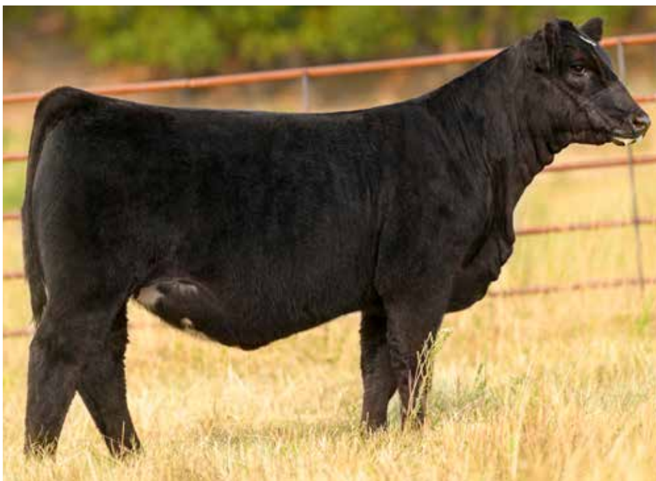
KCC1 ESTELLE 755J OFFERED BY KEARNS CATTLE COMPANY

We love the body shape, depth of rib, and width of center that this set of flush sisters possess. They certainly have their differences, but the quality of build, look and style is something you can hang your hat on with this set of full sisters on sale day!