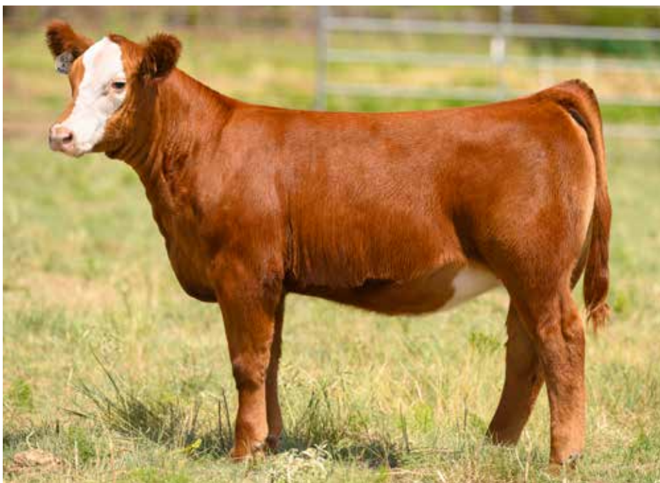
JCBB MISSY 118J OFFERED BY BIRD CATTLE CO. & RICHBURG CATTLE CO.