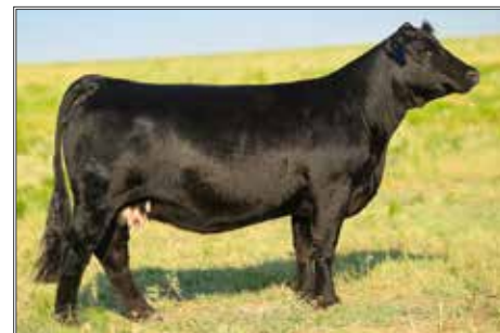
LKCC MISS GENESIS 72G DAM OF LOTS 39