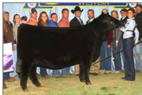
FCF PROVEN QUEEN 419 - NWSS GRAND CHAMPION ANGUS FEMALE AND PRODUCT OF THE DAMERON PVF PROVEN QUEEN 010 COW FAMILY!