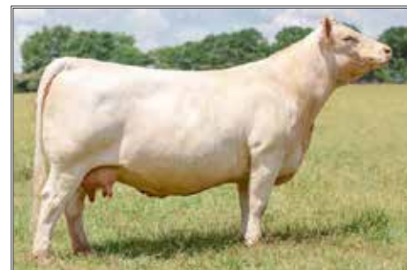
LJR MS FIREWATER IMAGE 1955B ET DAM OF LOT 65