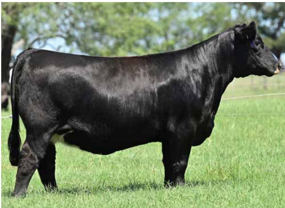
SWC HARMONY 125H OFFERED BY SHIPWRECK CATTLE CO.

This striking baldy is the kind one spots as soon as they drive into the bred pasture. She has always been a great looking one with a near perfect silhouette. Very feminine and refined through her skull and neck with that perfect shoulder, body depth and width, with symmetry at all angles. She is suitably mated and safe in calf to the calving ease specialist, HOC Dakota 111D. AIBRED ON 3/23/21 TO HOC DAKOTA 111D (ASA: 3227853). SAFE AI.