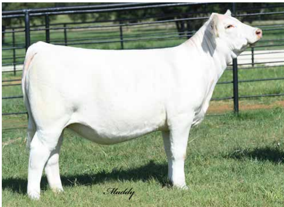
LJR MS SAVANNAH 3165J ET OFFERED BY JACKSON CATTLE COMPANY

LJR Ms Savannah 3165J ET is another attractive daughter of Outsider that is backed by the Firewater influence via her powerful donor dam, LJR Firewater Image 1955B ET. Much like her donor dam, 3165J is robust in her rib cage, stout hipped, wide pinned, and sets to the surface with confidence. We love the added foot and bone that this March born female possesses. A competitive show heifer prospect that is backed by true cow power!