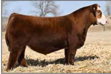
W/C BET ON RED 481H SIRE OF EMBRYOS 12B