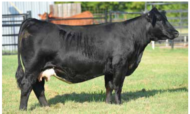
SWC HOC ANNIE K 214C DAM OF LOTS 10, 11A, & 11B