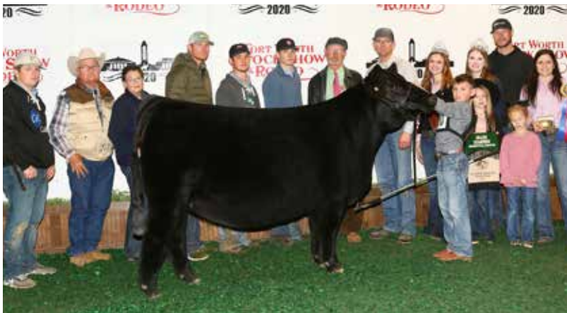
SWC RUBY WICKED FRAN MATERNAL SISTER TO LOTS 3-6 2020 FWSS GRAND CHAMPION JR SIMMENTAL HEIFER