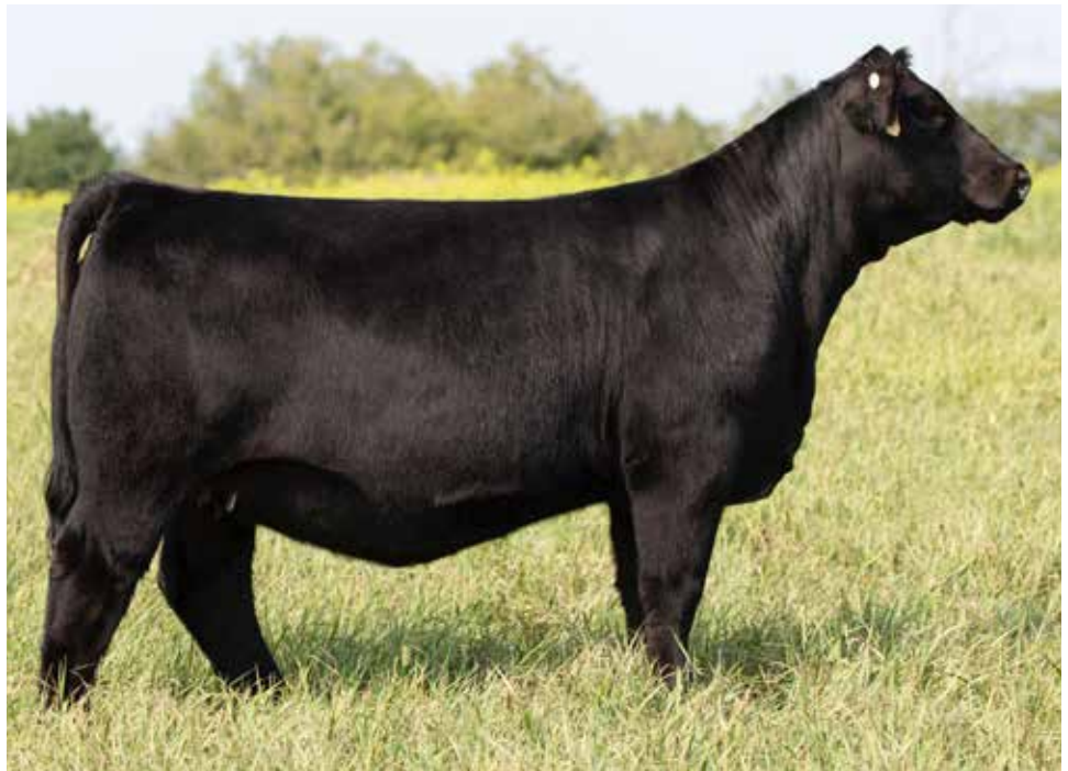
BAR O JAYLANI 105J OFFERED BY BAR O CATTLE COMPANY

Bar O Cattle Company brings a tremendous trio of sisters to Grandview, Texas that are backed by SWC M2C Zereasa 825Z, the full sister to the triple crowing winning MR HOC Broker. 825Z has remained a pillar in the Oskaloosa, Kansas based donor pen for some time and there is no denying the impact that she has had in production. The first pair of sisters, 105J and 106J, are sired by the $105,000 W/C Double Down 5014E stud that is owned by High Prairie Genetics and H2O's Cattle Company. This duo personifies the fundamentals yet offer the extra bells and whistles that are essential to be a force on the tan bark. We admire their look of balance from the side that is further complimented by a three-dimensional rib cage and pin set. We firmly believe that this pair of sisters will be competitive on any stage of competition.