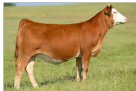
HSC SWC STARBURST 046F MATERNAL SISTER TO LOTS 42 & 43