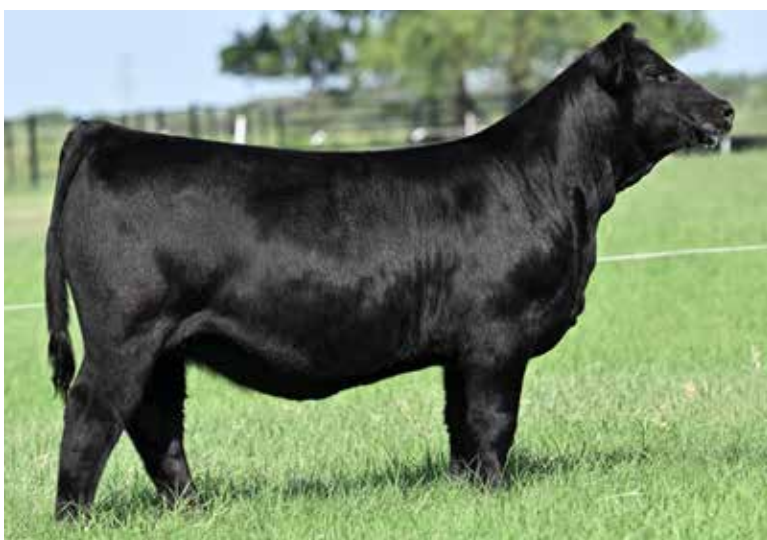
VCL SWC JULIAS FOXY 24J OFFERED BY SHIPWRECK CATTLE CO. & VOGLER CATTLE CO.