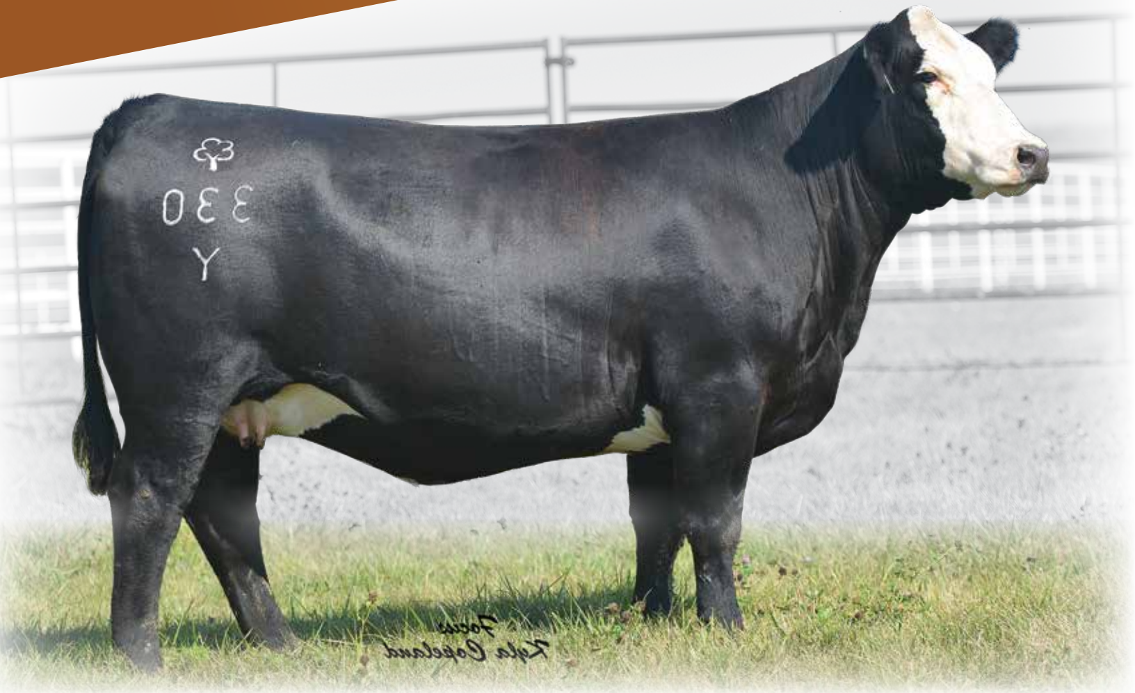
DAM OF LOT 12 MATRIARCH OF THE ANNIE K COW FAMILY