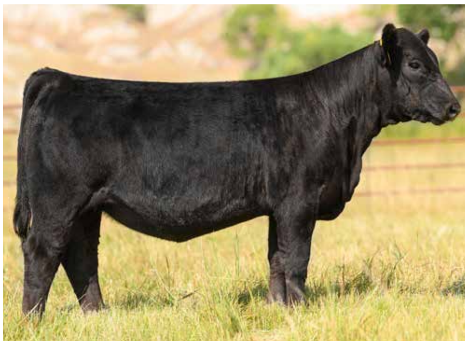
TKCC DOLLY 150J OFFERED BY KEARNS CATTLE COMPANY

Colorado. She may be a tick greener in her condition at sale time, but we believe that this sleek made, neat featured female is one to project what she will look like as a heavy bred. Elite cow families line her pedigree from top to bottom!