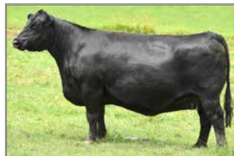
TTA PRECISION 056 OF 124 THIRD GENERATION DAM OF LOT 46

Anyone looking for "Good Cattle"? The pedigree behind this one bred true each generation to get to this point without question. She's a feminine brood cow that's definitely attractive especially when you have her attention. One will admire her transition from shoulder to center rib and notice it gets better when you evaluate her bold back shape and width from behind. This one leaves you square from hock to ground from behind with the right set from the side as well. There's a substantial amount of cow family and power to take advantage of here with the dominant Angus influence of the great 056 herself.