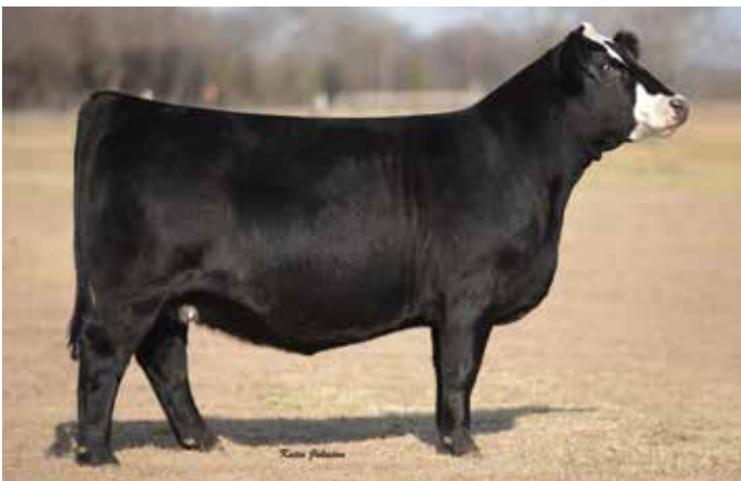
SWC HOC ANNIE K 165C DAM OF LOT 8