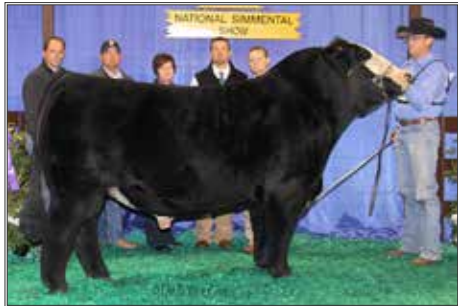
MR HOC BROKER MATERNAL BROTHER TO DAM OF LOT 69