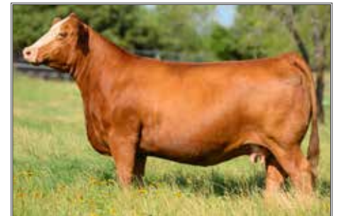
KCC1 TIARA 131Z GRANDDAM OF LOT 34 DAM OF LOT 35

JCBB Dream Tiara 122J is a stunning black blaze faced show prospect sired by DMCC Counter Attack 8C and backed by the $33,000 HOC Dream Tiara 131D matriarch that topped the bred heifer division a few years back from Hidden Oaks Cattle. The dam of 131D is KCC1 Tiara 131Z, now a member of the donor battery at Nixon Family Farms in Floyd County, Texas. A full sib to this female sold in the Black Label last