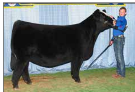
KCC1 HAVANA 83E PROVEN DONOR DAM AND MATERNAL SISTER TO LOT 74

KCC1 Victoria 0038 is a direct daughter of the great TKCC Victoria 57A, sired by the $435,000 Ruby's Currency 7134E. The late Victoria 57A is the dam of the $120,000 Exclusive, and the prolific KCC1 Havana 83E. 83E is the dam of the $60,000 Right Time heifer that topped the Black Label in 2020, as well as $230,000 Right Time son known as Countertime, one of the most exciting herd bull prospects to sell in 2021! Not only does 0038 combine an elite pedigree, but she also offers a unique number profile. This combined only adds credibility to her true earning potential! AI BRED ON 4/15/21 TO OMF EPIC E27 (ASA: 3317371). PE FROM 5/10/21 TO 7/10/21 TO BAR CK 3016A 9045G (ASA: 3766652).