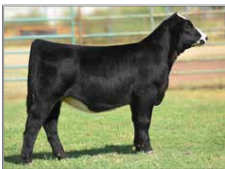
JCBB LADY E3301 PICTURED AS A CALF DAM OF LOTS 22A, 22B, & 23