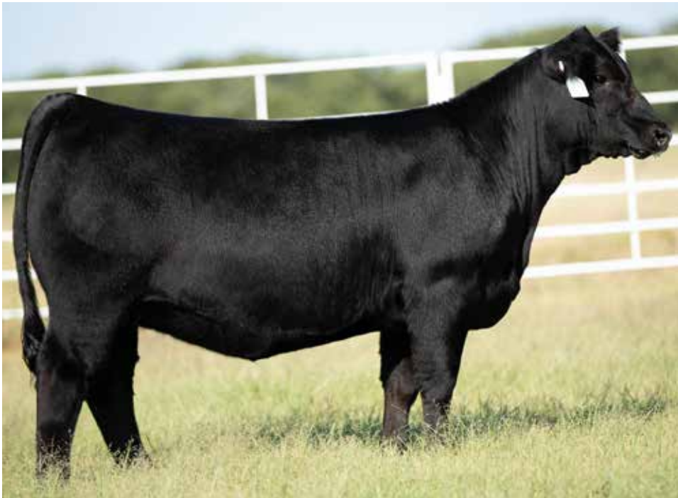
WBL JEALOUS HEART 77J OFFERED BY BARKER LIVESTOCK

Ultra cowy very flexible beast at every viewpoint with the definite cobra style neck on picture day! This female has all the belly, width, and dimension needed to get to the next goal post. Her dam is doing a real nice job and we look forward to from this great young female. These Bankroll daughters are making great young cows and this one won't be any different with the 056 influence.