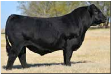
ES RIGHT TIME FA110-4 PATERNAL BROTHER TO EMBRYOS 12D