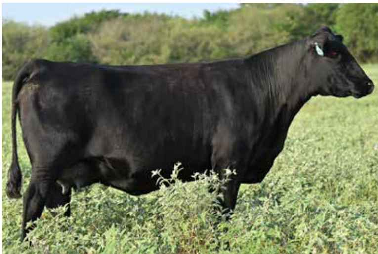
B3R E177 LILLY C429 B158 OFFERED BY SHIPWRECK CATTLE CO.

82A: BULL CALF BORN 8/14/21. SIRED BY DOUBLE G PAYWEIGHT 7705 (AAA: 18883465).