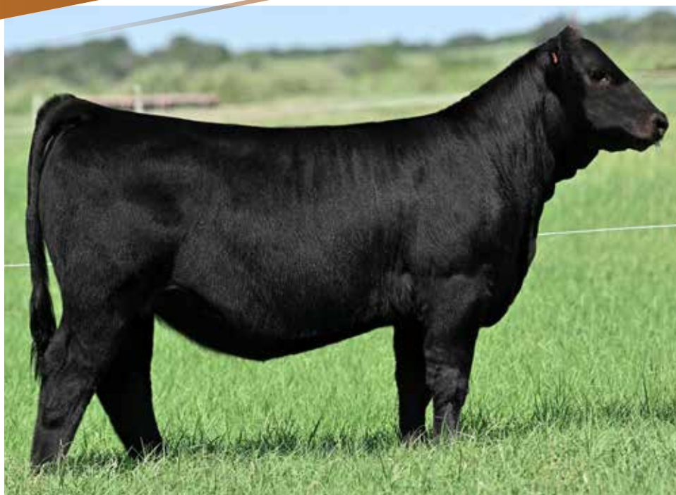
SWC JUST WICKED 203J OFFERED BY SHIPWRECK CATTLE CO.

Just Wicked has always dominated her pen in terms of size and performance. She is sound built, big bellied, and maintains that broody, bold look of her dam. We realize that this female's true worth will be discovered after she enters production, and as we project this one out a year from now, it's certain that she will be noticed as a bred female dense in quality. This one represents the productivity and the generating value of the cow family.