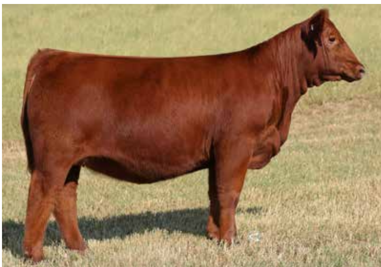
HSC JOLENE 030J OFFERED BY HILMES CATTLE COMPANY

HSC FF CHLOE 008E OYE SUPREME AND DAM OF LOT 56