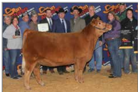
LJR MS WHO DA MAN BLONDE ET DAM OF LOT 62 2020 SAN ANTONIO LIVESTOCK EXPOSITION RESERVE SUPREME CHAMPION JUNIOR BREEDING HEIFER

TATTOO: 3117J | DOB: 5/6/21 | REG: 409027