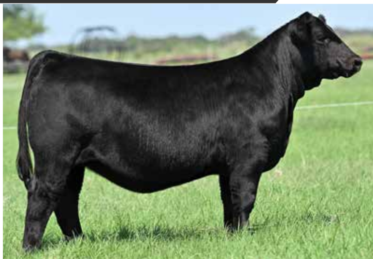
VCL SWC JADA CHEER 28J OFFERED BY SHIPWRECK CATTLE CO. & VOGLER CATTLE CO.