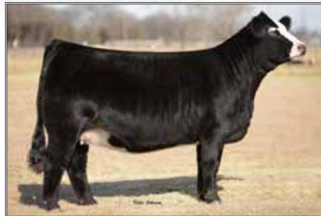
WAGR CHANEL 5073C