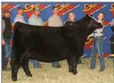
2019 SAN ANTONIO LIVESTOCK EXPOSITION RESERVE GRAND CHAMPION SIMMENTAL FEMALE FULL SISTER TO DAM