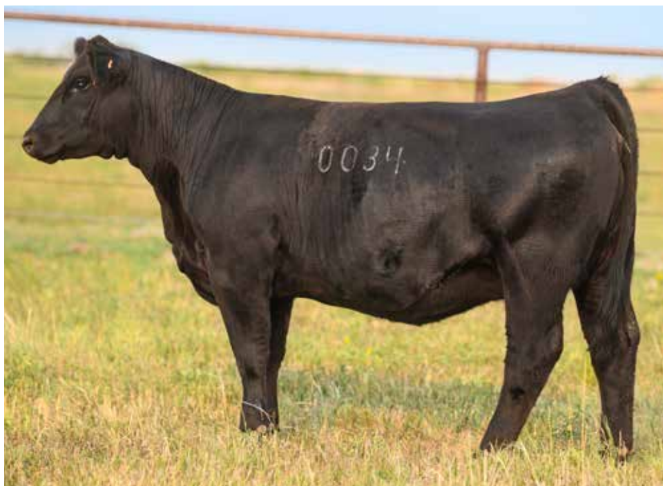
TKCC DOLLY 0034 OFFERED BY KEARNS CATTLE COMPANY

the Hudson Pines program. A full brother to 0034, TKCC Fury 2F, is working for Ernie Rieke at McLouth, Kansas. Other maternal sisters and brothers to 0034 can be found working in some of the top seedstock firms across the country. AI BRED ON 5/5/21 TO SO REMEDY 7F (ASA: 3419044). PE FROM 5/10/21 TO 7/10/21 TO BAR CK 3016A 9045G (ASA: 3766652).