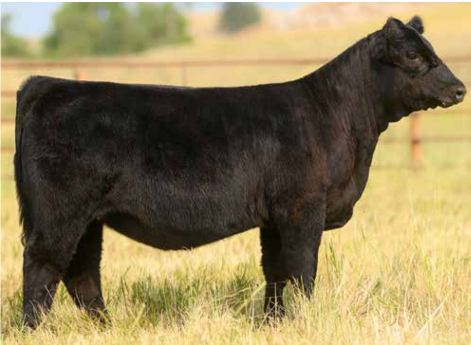
KCC1 WICKED FAE 070J OFFERED BY KEARNS CATTLE COMPANY

Without question, the best or at least most proven mating on B125 would be to Battle Cry. This mating generated cattle that were very competitive and complete with backdrop photos taken. The dam of this pair of Remedy daughters would be one of the best from that genetic combination and is a past sale feature of The Black Label herself. Wicked Fae has proven herself productive in short fashion at Kearns Cattle Co. producing both sexes with ultimate marketability. This pair of females tip the balance heavily on look and soundness while maintaining the dimension assumed from the mating.