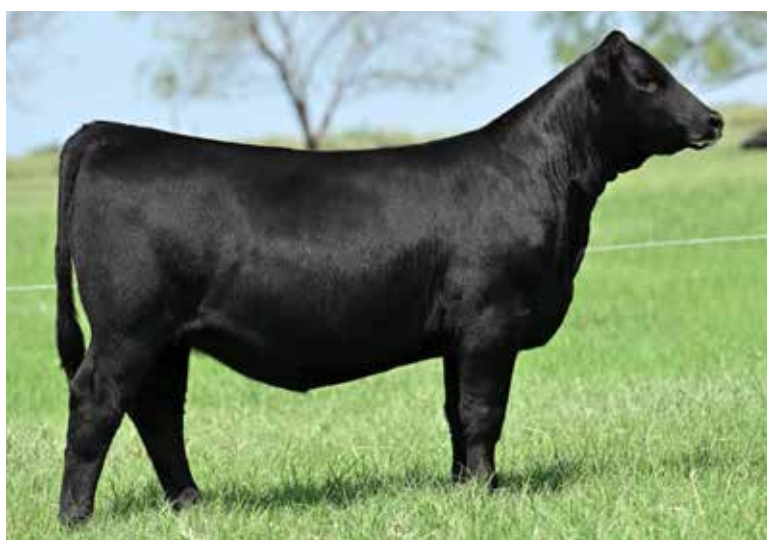
VCL SWC JALISA CHEER 30J OFFERED BY SHIPWRECK CATTLE CO. & VOGLER CATTLE CO.