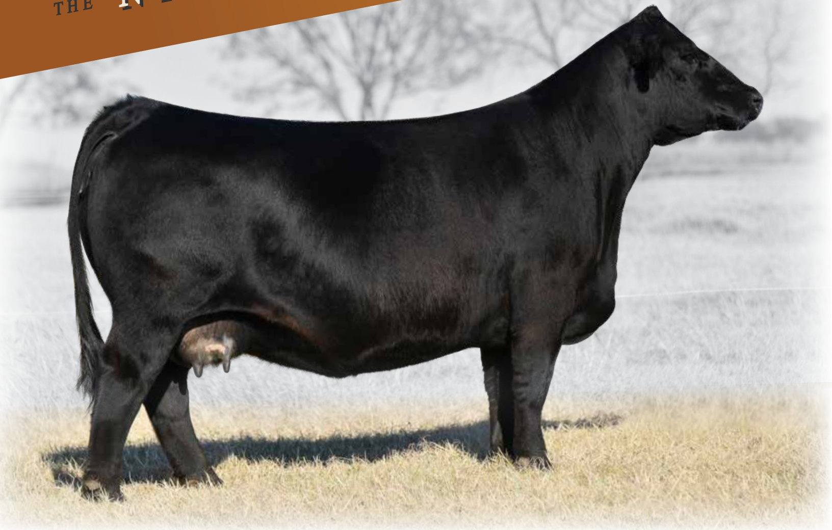
DAM OF LOTS 3 - 6 & MATERNAL GRANDAM OF LOTS 7A & 7B