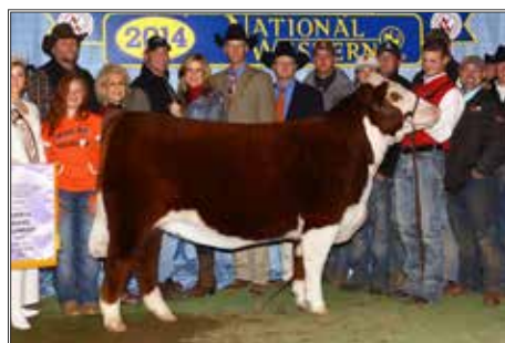
CHEZ STRAWBERRY WINE 204Z ET 2014 NWSS RESERVE GRAND CHAMPION POLLED HEIFER - MATERNAL SISTER TO GRANDAM OF LOT 59