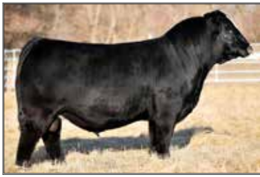
JBSF BERWICK 41F SIRE OF EMBRYOS 12A