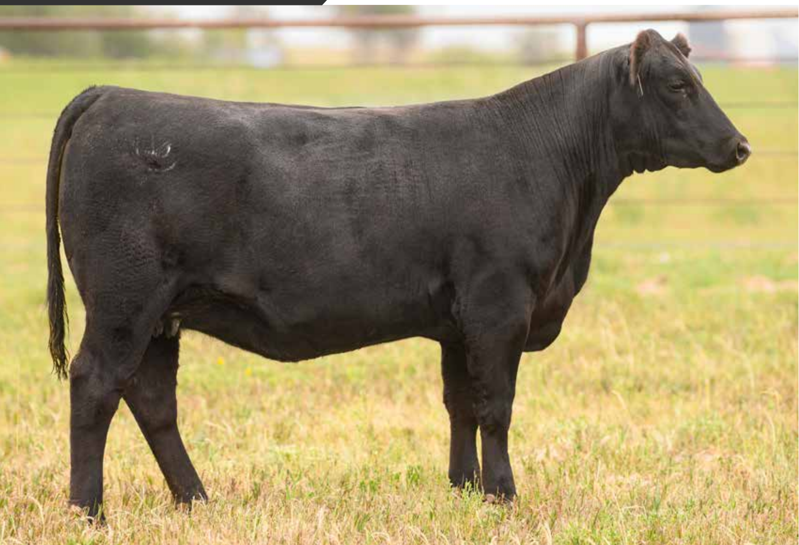
KCC1 VICTORIA 0038 OFFERED BY KEARNS CATTLE COMPANY