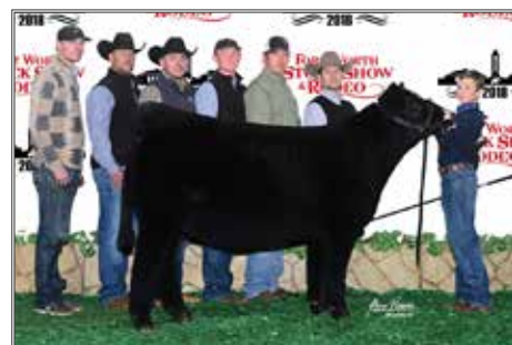
KCC1 ESTELLE 510E 2018 FT WORTH CLASS WINNER