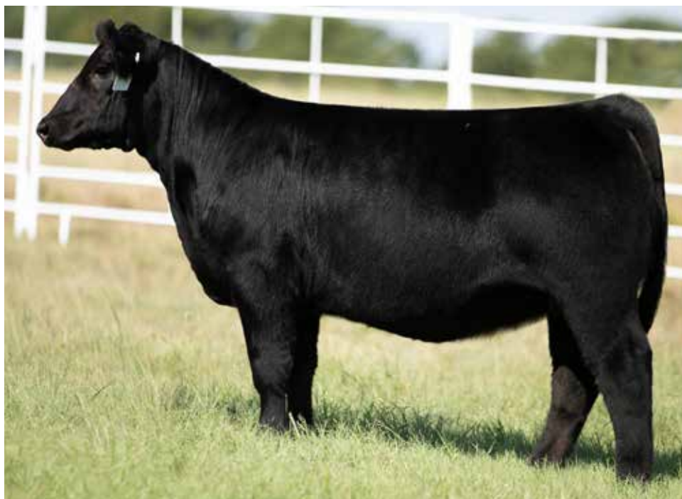
FUS DESTINY 281J OFFERED BY F4 LAND & CATTLE