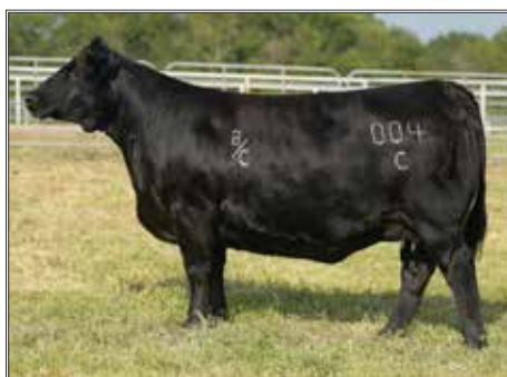
JSSC CAROLINA 004C DAM OF LOTS 20 & 21