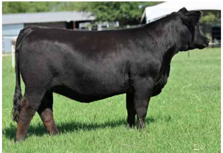
SWC HELLO DARLIN 450H OFFERED BY SHIPWRECK CATTLE CO.

SWC Hello Darlin 450H is a direct daughter of the great MR HOC Broker. She embodies the fundamentals that Broker has become so widely famous for. Extra big footed, stout boned, wide pinned, and built for the long haul. She doesn't have a notable cow line to support her, but she is a productive, stout made, low input type female that will earn her keep! OBSERVED SERVICE 6/20/21 TO GCC BLACK DEW 1618H (ASA: 3838533). PE FROM 5/12/21 TO 8/1/21.