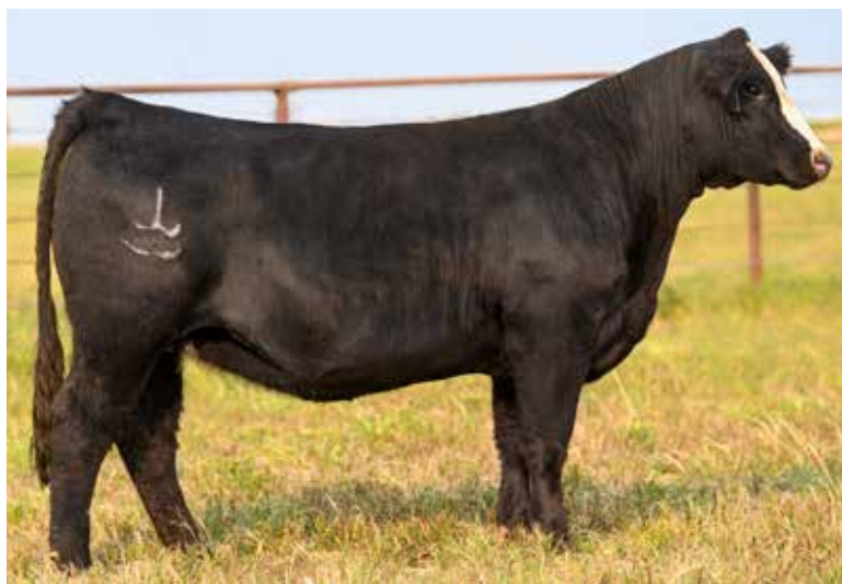
KCC1 MS EMPIRE 0027 OFFERED BY KEARNS CATTLE COMPANY