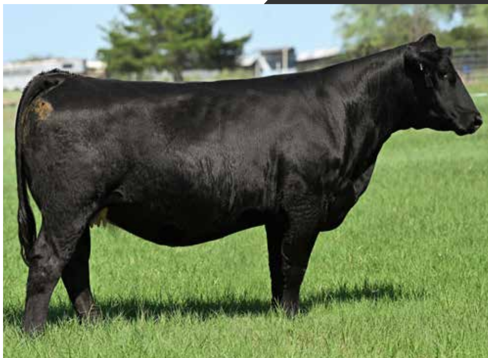
SWC GET THERE ANNIE 140G OFFERED BY SHIPWRECK CATTLE CO.

11A has always maintained the advantage in size and kind with one of the best recip dams on the ranch raising her, she has maintained that physical advantage throughout. She has always had a look and presence about her of squareness and correctness of lines with a very sharp featured front end, pin set, and the ideal hid leg set. She too, is bold and open in her rib with a big foot and bone. As a calving two year old, her first calving experience was met with record cold temperatures and to no fault of her own we weren't able to save her calf. However, she went ahead and settled first service post calving and is safe in calf to calve early 2022 to the hard to come by ES Right Time. There is absolutely no doubt in my mind how exciting and good the resulting calf should be.