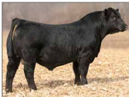
VCL FORESIGHT SIRE OF LOT 10

The crew at Vogler Cattle Company tied into the “pick of the donor pen” flush opportunity in a past Black Label sale. The unanimous decision was to flush SWC HOC Annie K 214C to the new young gun stud produced in the Vogler program, VCL Foresight. Foresight is now a member of the herd bull battery at King Cattle Company. He was the standout MR CCF 20-20 son that was a favorite of many that saw him prior to crossing the auction block in February of 2019. Fast forward to 2021 and this will be a sire group to pay close attention to as the sale season progresses through the fall. SWC VCL Just Go Annie 32J is a big boned, bold centered, three-dimensional bodied female that is ready for early action on the tan bark. Her added substance complimented by the signature Annie K balance and symmetry from the side. Dig your heels in here if you’re serious about an older Purebred that will do the trick!