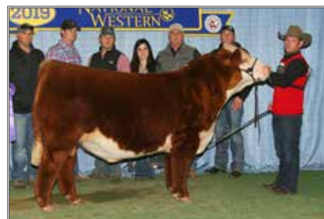
CH HIGH ROLLER 756 ET SIRE OF LOT 59 & 60

KGB SWC Roller Jaye 105J is a Polled April daughter of the widely popular CH High Roller 756. The dam of this sharp featured, bold centered female was bred in the CK Cattle Company program and is a derivative of the fame R Sweet Red Wine 039 matriarch. The maternal grandam of 105J is a three-quarter sister in blood to CHEZ Strawberry Wine ET 204Z, the 2013 NJHE Reserve Grand Champion Polled Hereford Heifer, 2014 NWSS Reserve Grand Champion Polled Hereford Heifer, and influential Hereford matriarch. Power in the blood!