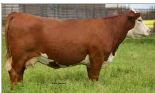
GO MS 7195 ADVANCE X54 MATERNAL GRANDAM OF LOT 60

TATTOO: 101J | DOB: 2/15/21 | REG: 44205218