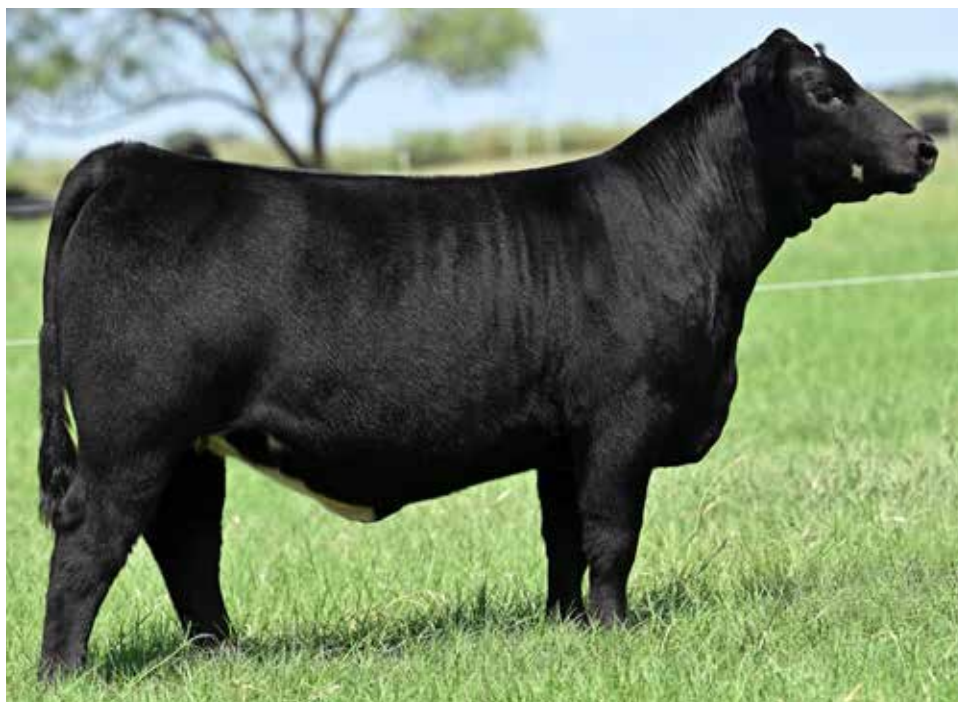
WSFC BR PROVEN QUEEN 03J OFFERED BY SHIPWRECK CATTLE CO. & WINTER SPRINGS FARM