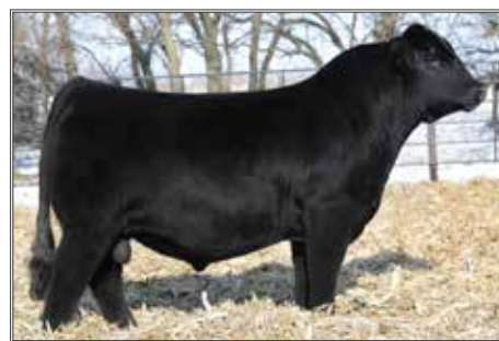
SO REMEDY 7F $530,000 SIRE OF LOT 30

We proudly present one of the first daughters of the $530,000 SO Remedy 7F to sell at public auction! There is no denying the presence, structural perfection, and added balance from the profile that this striking February born show heifer/donor prospect portrays. The dam of this bombshell is M4 Ms Heartbreaker D35G, sired by the $435,000 Ruby's Currency 7134E and backed by the famed Heart Throb cow line that was bred in Schaaqe Farms program. We admired the genuine squareness, looseness of build, and flexibility that 1020J offers. Her futuristic look and maturity pattern lead us to believe her best days on the tan bark will come when it truly counts!