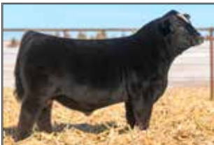
KCC1 COUNTERTIME 872H