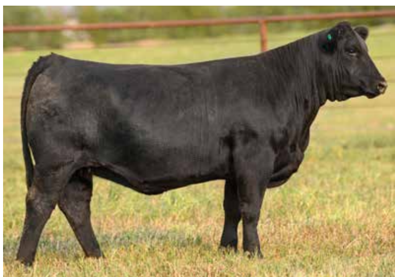
KCC1 MS CARVER 0062 OFFERED BY KEARNS CATTLE COMPANY

KCC1 Ms Empire 0027 is one of the most phenotypically eye appealing bred females that Kearns Cattle Company has ever let go. This blaze faced brood cow prospect is perfect from the side, bold in her upper rib cage and sets to the surface with a big stout foot. Her dam is sired by the $29,500 KCC1 Defiant 540D, purchased by Vanhove Cattle Company of Madison, South Dakota. This mating to War Cry is sure to produce a double half-blood calf that rings the bell! AI BRED ON 4/15/21 TO KCC1 WAR CRY 878G (ASA: 3678383). PE FROM 5/10/21 TO 7/10/21 TO BAR CK 3016A 9045G (ASA: 3766652).