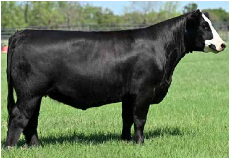
T-T BLACKBIRD H30 OFFERED BY SHIPWRECK CATTLE CO. & 3B CATTLE CO.

Blackbird H30 is a direct daughter of the $205,000 W/C Bankroll 811D, arguably one of the most heavily used sires of the last years! The dam of H30 was bred in the storied Champion Hill program and is from the famed S A V Blackbird 5296 line. She is ultra-feminine, smooth made, and clean in her lines. She sells safe to Night Watch for a quick return on investment! AI BRED ON 5/22/21 TO W/C NIGHTWATCH 84E (ASA: 3336327).