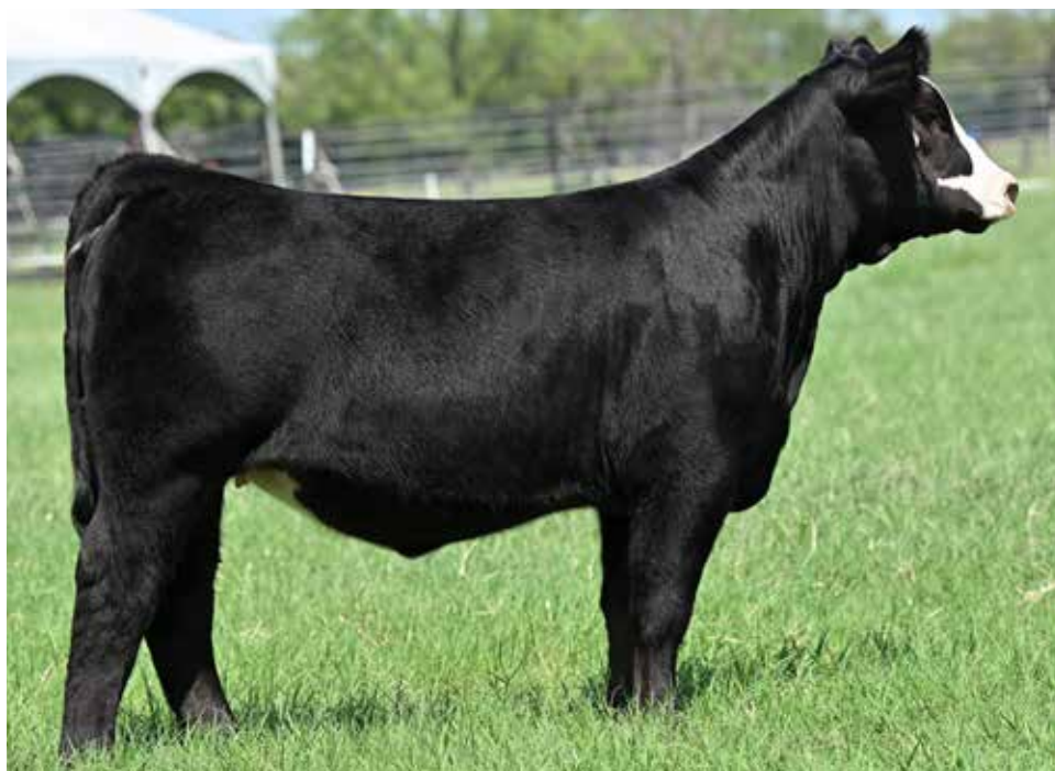
3BCC SWC TEARDROP 36J OFFERED BY SHIPWRECK CATTLE CO. & 3B CATTLE CO.

36J is the sharp featured blaze faced daughter of the $120,000 W/C VIP 005G that is backed by the multi-million dollar producing 8543U. The dam of 36J is a GSC Black Cap 336F, the $18,500 high seller from the Buckles & Banners Sale in 2018. Here is an ultra complete, fault free female that is big footed, stout boned, and offers an intriguing look of balance from the side. Pedigree, phenotype, and potential wrapped into one!