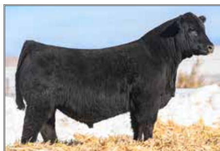
KCC1 WAR CRY 878G SIRE OF LOT 27

KCC1 Estelle 363J is the three-quarter blood sister to the Berwick sired females that precede her in lot order. If you're looking for a unique Percentage Simmental female to run with in the highly competitive ORB division at the Texas Majors, then take a seat. We love her genuine mass, boldness, and maternal look that is further complimented by a bullet proof look of balance from the profile. Her presence is sure to stand out like a sore thumb when those 60+ head classes come around the corner in Fort Worth. Pay attention here!