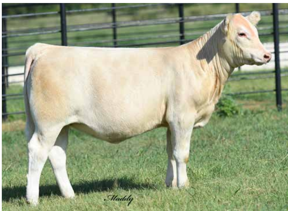
LJR HEIDI 3168J OFFERED BY JACKSON CATTLE COMPANY

is a stout made Rhinestone daughter that has worked very well to generate high quality composite females and steers alike. This yellow hided beauty can be shown at two Junior Nationals next summer. The Charolais are in Grand Island and the Red Angus will be hosted in Chickasha, Oklahoma... get your rooms booked now, she is a contender at both!