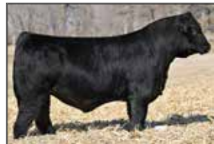
CKCC SERENA'S CASH 0813H "CASH IS KING"

SWC Annie K 214C is lone daughter of the late ACW Annie K 330Y that is in existence sired by Wide Body. Several sisters to 214C are working for top programs from coast to coast and border to border. We have mated 214C several different ways, but most recently mated her to the talk of the business, ES Right Time FA110-4. This spring the Right Time sire group was met with HIGH demand from producers across the country. Between the CK Cattle & Wager Cattle Production Sale, Kearns Cattle Company Bull Sale, and Hartman Cattle Company Bull Sale there were 16 sons to average an astonishing $38,421. This mating is absolutely one to have on your radar come October 9 if you're serious about creating the next big time herd sire or donor dam prospect that you can label with your own prefix. Guaranteeing 1 pregnancy per three embryos if transferred by a certified technician.