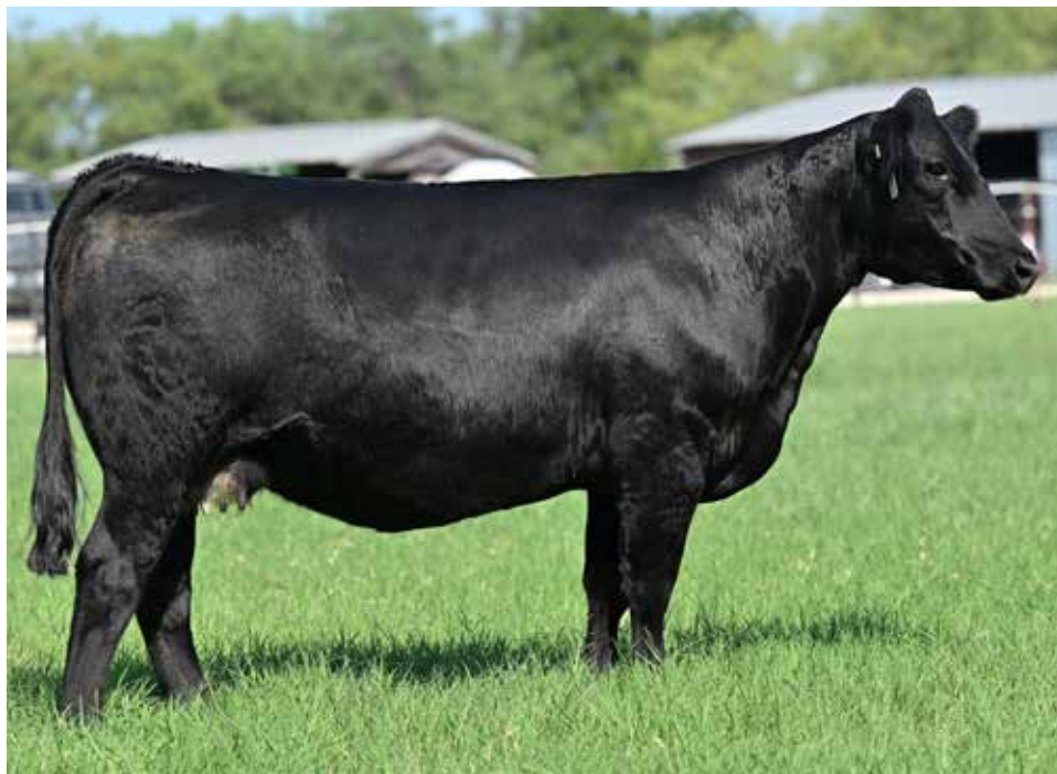
SWC FROSTED ANNIE 128F OFFERED BY SHIPWRECK CATTLE CO.

11B is one that has always been a pinch behind in terms of size due to a less than desirable recip dam. However, she did overcome the odds and