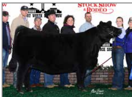
JSSC CAROLINA 004C 2017 FWSS GRAND CHAMPION SIMMENTAL FEMALE

OFFERED BY SHIPWRECK CATTLE CO. &amp; SHEFFIELD