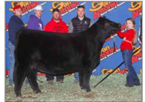
RUBY SWC WICKED E756 2019 SAN ANTONIO LIVESTOCK EXPOSITION RESERVE GRAND CHAMPION PUREBRED SIMMENTAL FEMALE FULL SISTER TO DAM OF LOTS 7A & 7B