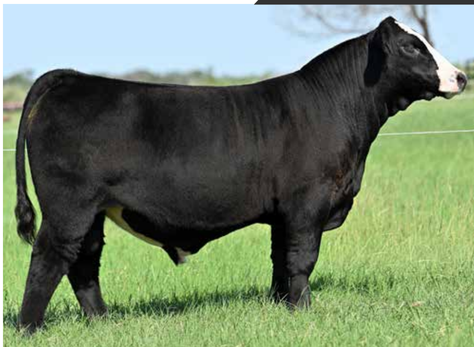
WSFC SUGAR DADDY 04J OFFERED BY SHIPWRECK CATTLE CO. & WINTER SPRINGS FARM

We liked this bull's sister so much that we decided to take this full brother with the deal. Good SimAngus bulls are not hard to find, good SimAngus bulls with great supporting cow families are a bit tougher to find, but solid SimAngus cattle with phenotype, genetics, and quality have the most value. We believe that this stud can offer a lot of performance and depth to any operation; seedstock or commercial. This genetic combination of Bankroll on an Insight is undoubtedly proven with much success, so why not invest in something that is proven and solid like Sugar Daddy.