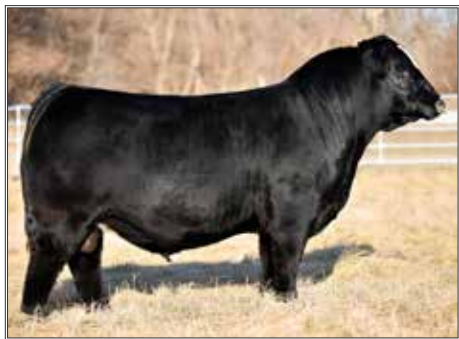
JBSF BERWICK 41F $109,000 SIRE OF LOTS 1A & 1B

TATTOO: J70 | DOB: 4/11/21 | REG: 3931257