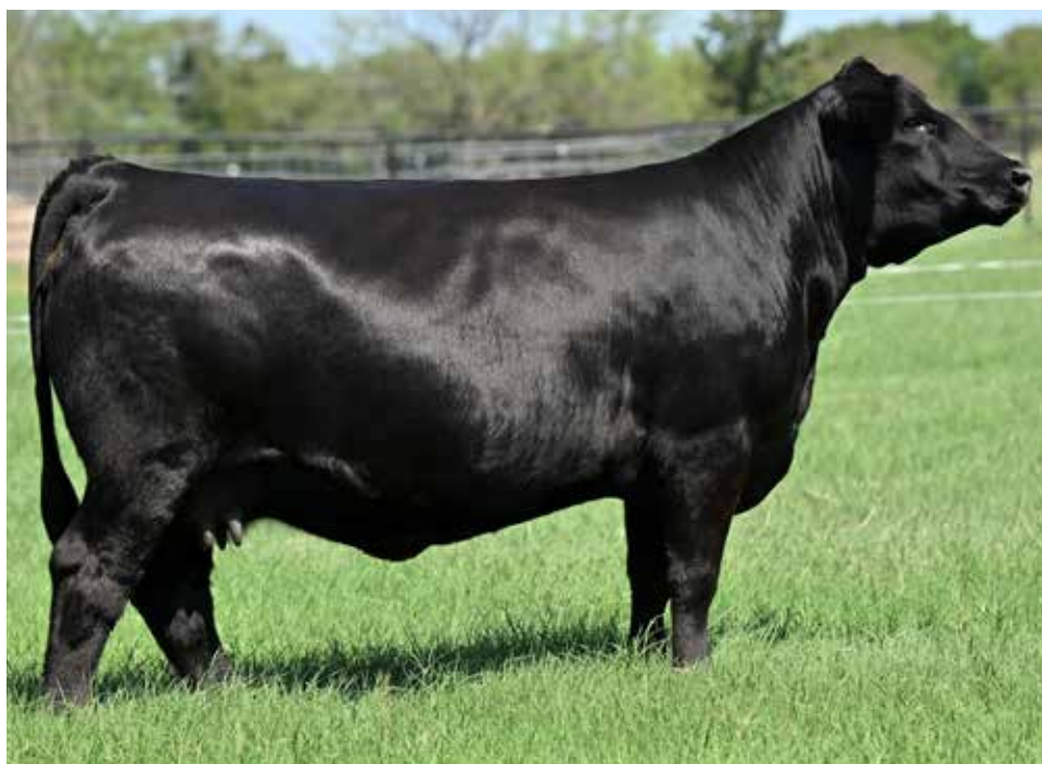
BLC1 FAITH 313F OFFERED BY SHIPWRECK CATTLE CO.

body and muscle as well, just simple power and longevity in skeleton. The Right Time calf on the way will have plenty of greatness regardless of sex. AI BRED ON 3/28/21 TO ES RIGHT TIME FA110-4 (ASA: 3481590). SAFE AI.