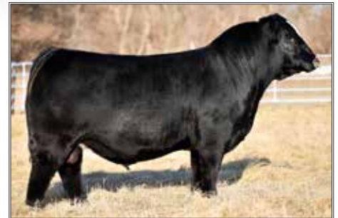
JBSF BERWICK 41F

Without a doubt one of the most exciting matings that we have created at Shipwreck Cattle. The $109,000 JBSF Berwick 41F has proven that he is a true breeding bull, with some of the most elite SimGenetic progeny to sell at public auction this fall. The embryos selling are full sibs to lots 14A and 14B. SWC NFFS Hoo-Rah 547H is a true sale feature and a herd bull prospect that we believe will take the place of his sire at some point. Study the foot, bone, power, and dimension that lines the pedigree of this elite mating! Guaranteeing 1 pregnancy per three embryos if transferred by a certified technician.