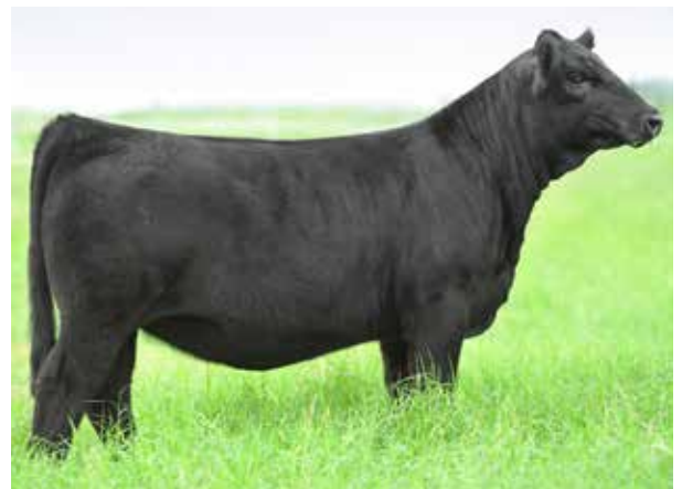
SWC RUBY WICKED FAE 230F DAM OF LOTS 7A & 7B