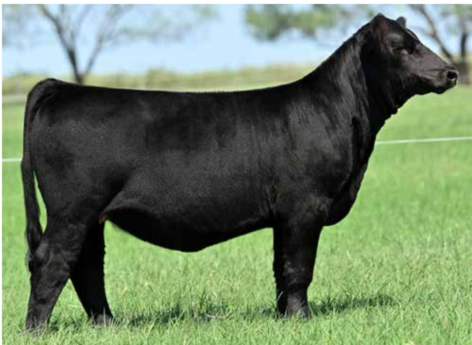
SWC WICKED JEMMA 310J OFFERED BY SHIPWRECK CATTLE CO.

Jemma is an interesting female and again one that changes daily as we prep for October 9. This heifer is ultra-extended, with good width and turn to her back and rib with a sound flexible build. I believe this female will be good haired as we enter late fall and winter as well. Two shots of bold bodied stock and smoking good cows supporting the pedigree should lead to the perfect end goal.