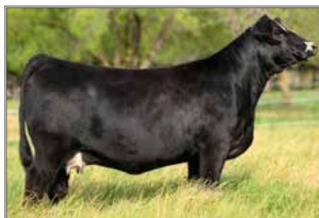
KCC1 ESTELLE 510E DAM OF LOTS 26A-26C & 27-28

Kearns Cattle Company brings a top shelf selection of elite open show heifer/donor prospects from the most prolific and profitable cow line that walks the Sandhills of Sheridan County, Nebraska. The late TKCC Victoria 57A is the maternal grandam of this set of flush sisters that are sired by the $109,000 JBSF Berwick 41F. The dam of this trio is KCC1 Estelle 510E, the $30,000 TL Bottomline daughter that was a class winner in Fort Worth during the National show in 2018, the day after her maternal brother topped the Cowtown Classic at $120,000 for 1/2 semen interest. Estelle has evolved into a role model type donor dam, personifying the fundamentals, and adding the signature Victoria 57A "look" to her progeny.