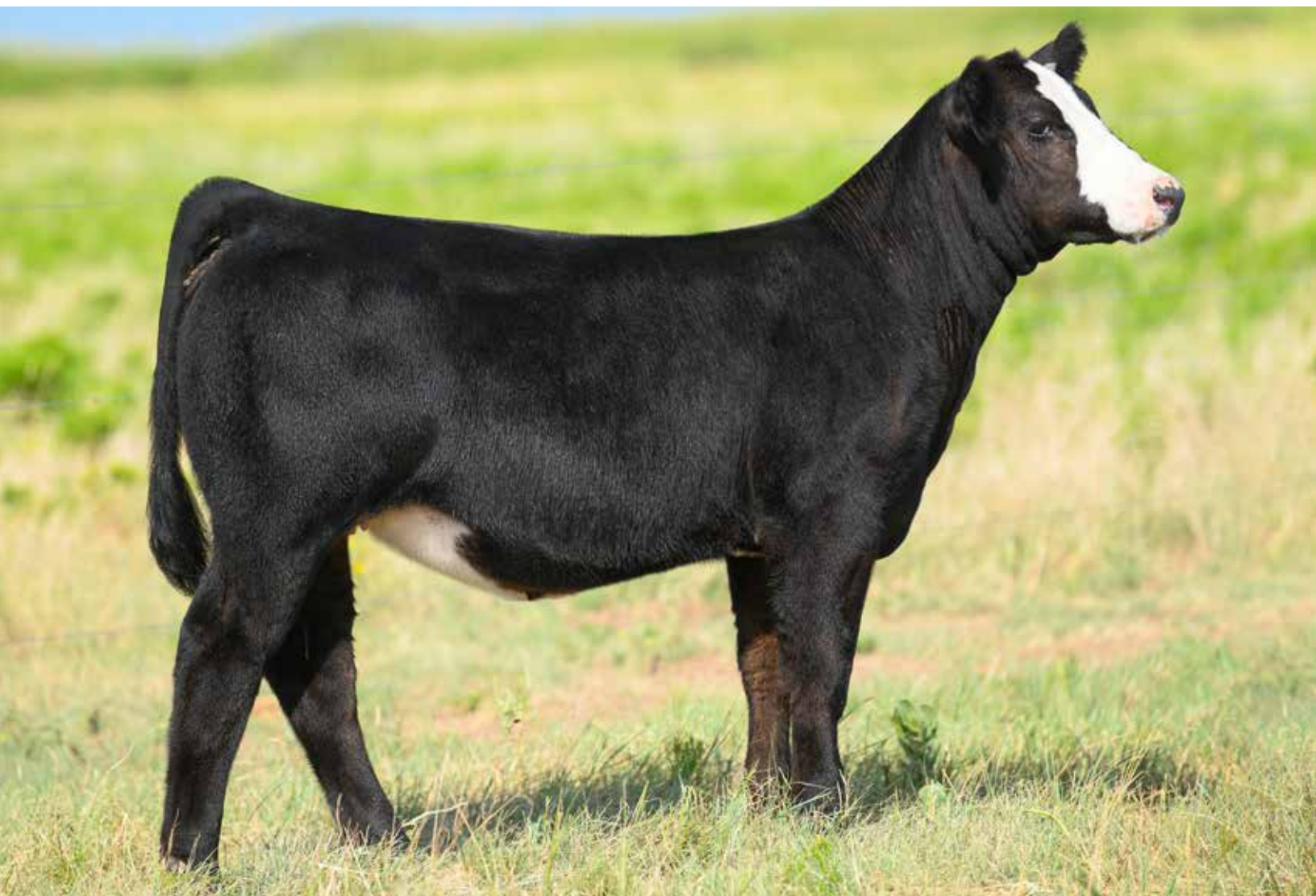
MTZ LADY JAZELLE J2104 OFFERED BY METZLER CATTLE & RICHBURG CATTLE CO.