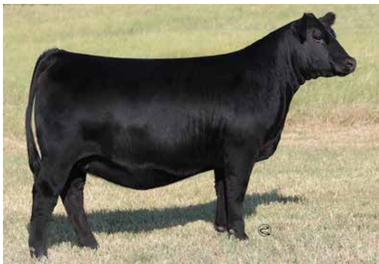
SWC HSC JU JU DOLL 902J OFFERED BY SHIPWRECK CATTLE CO. & HILMES CATTLE COMPANY