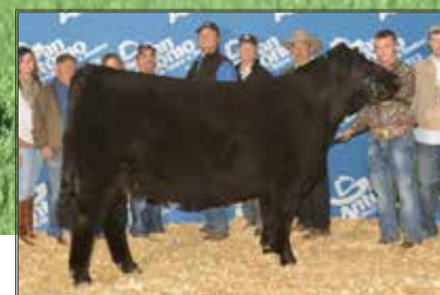
JSSC YOVELLA 032Y DAM OF LOT 67

TATTOO: 935G | DOB: 5/5/19 | REG: 3602483