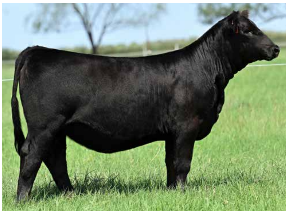
SWC WICKED JEWELS 305J OFFERED BY SHIPWRECK CATTLE CO. & NIXON FAMILY FARMS

Just Wicked has always dominated her pen in terms of size and performance. She is sound built, big bellied, and maintains that broody, bold look of her dam. We realize that this female's true worth will be discovered after she enters production, and as we project this one out a year from now, it's certain that she will be noticed as a bred female dense in quality. This one represents the productivity and the generating value of the cow family.