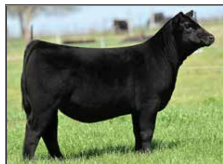
SWC NFFS WICKED HANNAH 825H FULL SISTER TO LOT 4

The Wicked Cow Family track record of success is well documented over the years. You will find the influence at Nelson's in Minnesota, Ruby Cattle Co of Iowa, and of course here and many other places that have invested in the cow family over the years. These cattle are much like their dam with the fundamentals handled first and foremost. You will notice those attributes readily in this direct daughter of Remedy.