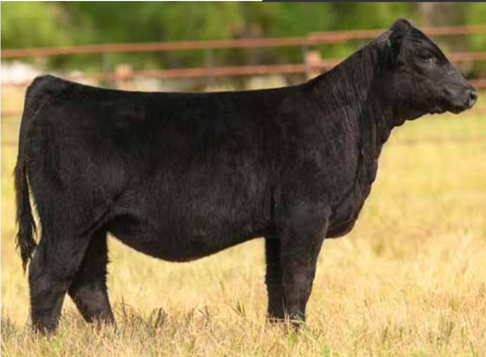
KCC1 WICKED FAE 965J OFFERED BY KEARNS CATTLE COMPANY

Without question, the best or at least most proven mating on B125 would be to Battle Cry. This mating generated cattle that were very competitive and complete with backdrop photos taken. The dam of this pair of Remedy daughters would be one of the best from that genetic combination and is a past sale feature of The Black Label herself. Wicked Fae has proven herself productive in short fashion at Kearns Cattle Co. producing both sexes with ultimate marketability. This pair of females tip the balance heavily on look and soundness while maintaining the dimension assumed from the mating.