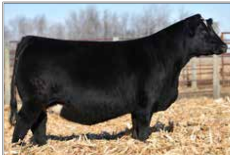
BAILEY'S MADONNA 720E

Bailey's Madonna 720E is the newest and most exciting young female in the highly decorated donor pen at Bailey Livestock. Madonna is the dam of the Lot 10 heifer that sold for $20,000 in the 24th Annual Hartman Cattle Company Customer Appreciation Female Sale. Skeletal quality, presence, and a look that is second to none would be the best way to describe the result of this powerful mating. Madonna has been mating to several breed leading sires, but this mating