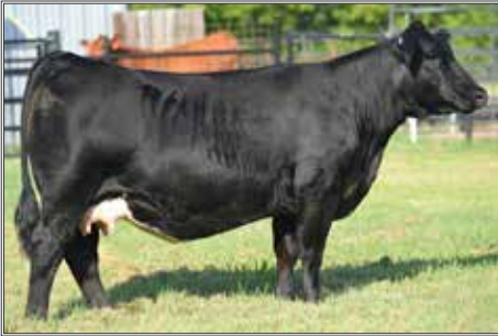
SWC HOC ANNIE K 214C