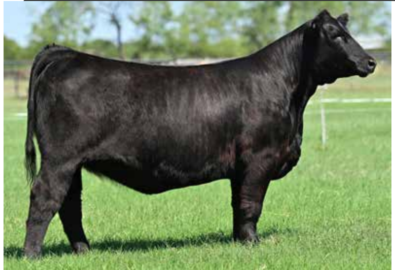
FRKG HANNAH 010H OFFERED BY SHIPWRECK CATTLE CO.

AI BRED ON 4/19/21 TO HOC DAKOTA 111D (ASA: 3227853). SAFE AI.