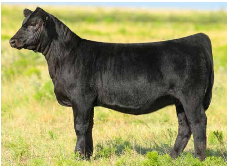
JCBB MISSY 179J OFFERED BY BIRD CATTLE CO. & RICHBURG CATTLE CO.

118J and 179J are flush mate sisters from the iconic WLE Missy U409 matron, sired by DMCC Counter Attack 8C. 118J is the stunning red baldy that resembles the quality of feature that we have come to expect from this rock solid mating. A full sister to 118J that was marked near identical sold to Rust Mountain View Ranch. JCBB Missy E3856 was a highlight in the RMVR Female Dispersal last fall where she commanded $26,500 to Elk Meadows of Idaho. 179J is the solid black full sister to 118J that has the added extension about her front third. This neatly made Purebred show heifer prospect is elegant in her design, sound build, and is ready for the bright lights! Depending on personal preference these sisters will have different fans on sale day, but we are confident that we can all agree on the level of quality that each female represents.