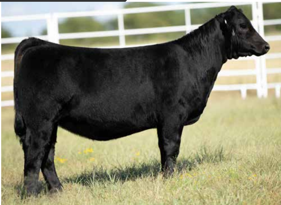
FUS HARPER 53J OFFERED BY F4 LAND & CATTLE