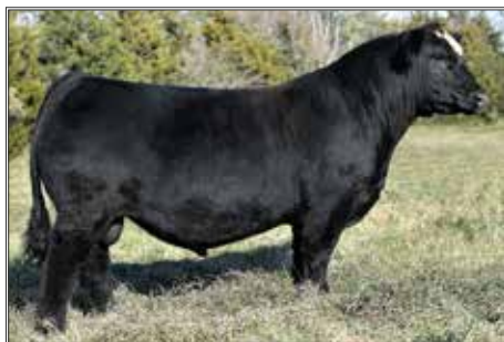
W/C FORT KNOX 609F $180,000 3/4 BROTHER IN BLOOD