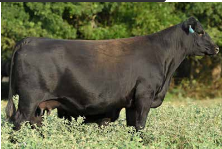
B3R E324 BLACKBIRD Y409 S040 OFFERED BY SHIPWRECK CATTLE CO.