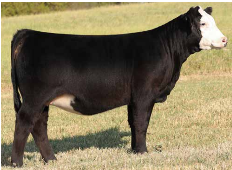
HSC SWC JACKIE 028J OFFERED BY SHIPWRECK CATTLE CO. & HILMES CATTLE COMPANY

Another potent duo of flush mate sisters to select from one of the true foundation cow families affiliated with this sale offering. The maternal grandam of these sisters was a member of a trio of private treaty cows from the famed Limestone program of Oklahoma. She is responsible for some of the early high sellers in the Black Label series and left a set of daughters to carry on the Vale Bar influence. The donor dam of these females is quite powerful in type and kind and would have been a sure enough equal contributor towards the 3-dimensional kind that they are. She has been a very productive and profitable female for Hilmes Cattle Co. Enterprise, the sire, is a past high seller of the Kearns Cattle Co. bull sale, he is a full brother to Exclusive, and his flush mate sister is the dam of the 2020 Black Label high selling female as well. I know it sounds like a broken record, but again saturated in proven genetics and when you factor in their modern phenotype, the possibilities are limitless.