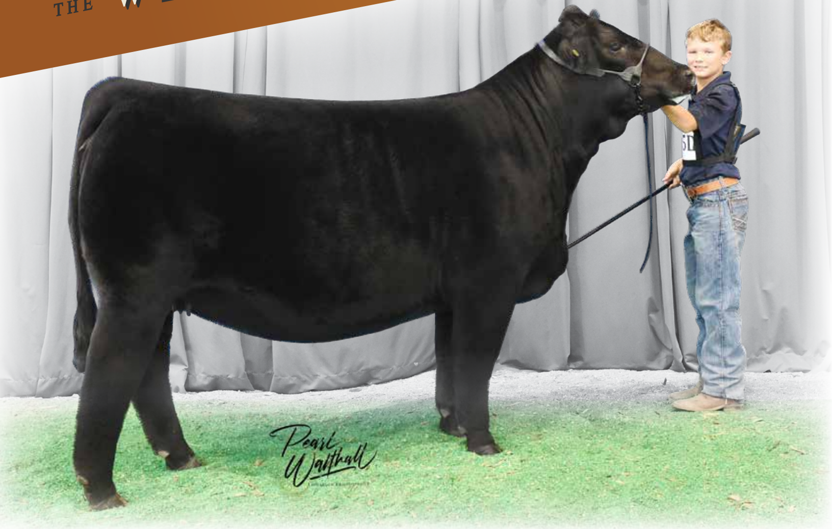
DAM OF LOTS 1A - 2B 2016 AJSA NATIONAL CLASSIC 8TH OVERALL PUREBRED SHOWN BY BRECKEN SHIPMAN