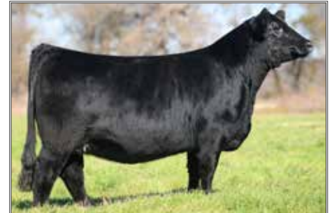
MMK HEARTLESS 128F DAM OF LOT 53