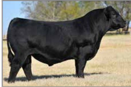
ES RIGHT TIME FA110-4