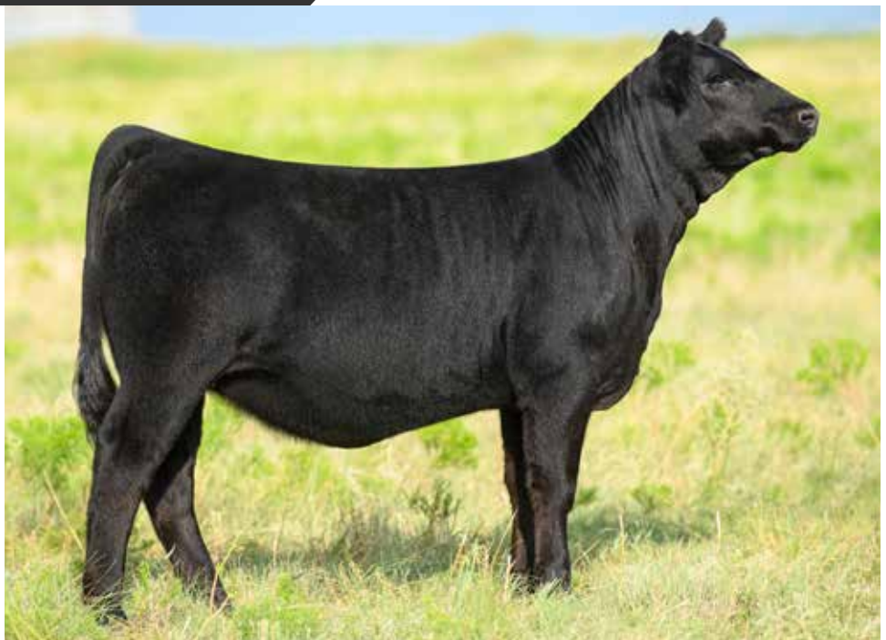
MTZ LADY JEWEL J2101 OFFERED BY METZLER CATTLE & RICHBURG CATTLE CO.

These three sisters represent one more generation of depth in generational quality and showcase another of the multiple success stories from past Black Label sales. The initiating duo of the three would be sired by the $109K Berwick and like the balance of the sire group they are great footed, stout, dense shaped stock with ideal running gear and great features that will allow them to sort to the top end of their respective class, division, and possibly any show they go to.