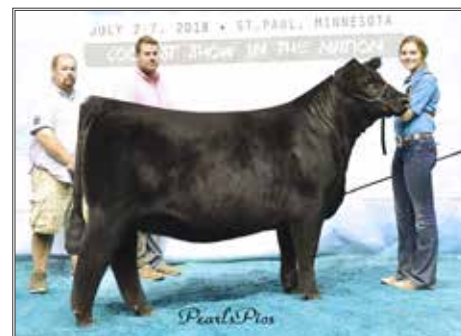
BAILEY'S PROFIT'S DREAMY - 2018 AJSA NATIONAL CLASSIC GRAND CHAMPION PUREBRED SIMMENTAL FEMALE - MATERNAL SISTER TO LOTS 31 & 32