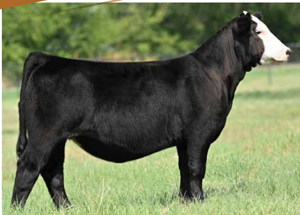
NFFS SWC JUST DANCE ANNIE 565J OFFERED BY SHIPWRECK CATTLE CO. & NIXON FAMILY FARMS

and most three dimensional SimAngus females we have ever been around. This mating to the record setting $530,000 SO Remedy 7F yielded a unique May born Purebred that is elite in terms of her feature and form. We initiate the legendary Annie K cow family with a female that we anticipate leaving her mark, just like the females that line her pedigree.