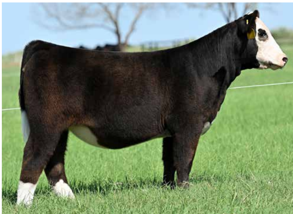
BAILEY'S SWC DREAM MAKER 119J OFFERED BY SHIPWRECK CATTLE CO. & BAILEY LIVESTOCK

Unique in color, skeletal design, and balance... ladies and gentlemen here is a direct daughter of the legendary Bailey's Ms Dreamy 946W matriarch, one of the HOTTEST cows in the Simmental breed! This million dollar producing donor dam has produced Junior National Champions, six figure high sellers, and now daughters are making their mark in production. The sire of this chrome marked Purebred is the $109,000 JBSF Berwick 41F. This is the first daughter from the new mating to EVER sell! Just image the ROI potential here when her show career comes to a close!