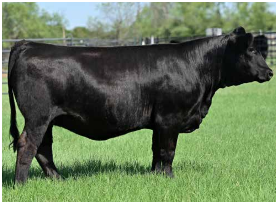
SWC HELLA 313H OFFERED BY SHIPWRECK CATTLE CO.

A mother daughter duo sells as lot 18 and 19 respectively. When these Chanel daughters entered production, I thought that 313F replicated a lot of physical characteristics of her dam. She is one that is ultra-broody, stout in her bone work, with substance of