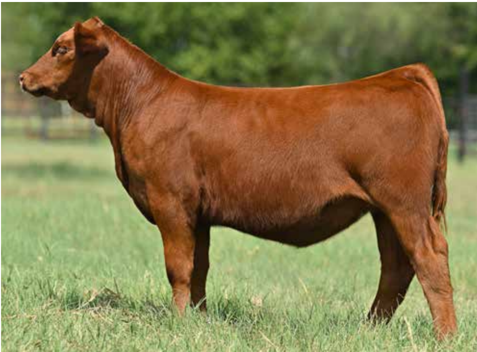
SWC NFFS JULIANAS TIARA 531J OFFERED BY SHIPWRECK CATTLE CO. & NIXON FAMILY FARMS

year for $22,000 and has been campaigned by the Butler family of Texas. 122J offers an elite combination of phenotype and cow family that collectively will make her a valuable investment for any breeding program or ASJA member!