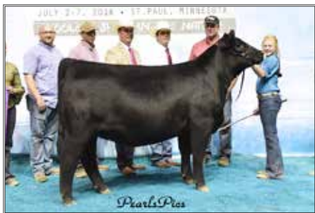
SJF EMERALD 2018 AJSA GRAND CHAMPION PERCENTAGE SIMMENTAL & MATERNAL SISTER TO DAM OF LOT 70

SWC Her Time 206H is the homo black and homo polled Purebred sired by WLE Copacetic E02 stud and from the Pilgrim sired maternal sister to the Triple Crown winning MR HOC Broker. This elegant made female is loose built, bold ribbed, and square built. She was AI bred with sexed heifer semen to OMF Epic E27, a surefire mating that will add power, shape, and quality to the equation! AI BRED WITH SEXED HEIFER SEMEN ON 4/18/21 TO OMF EPIC E27 (ASA: 3317371). SAFE AI