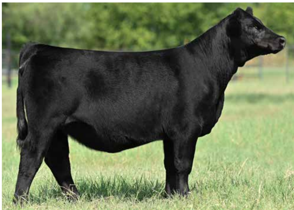
SWC BAR QH ANNIE K 492J OFFERED BY SHIPWRECK CATTLE CO. & BAR QH SIMMENTALS