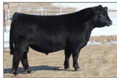
W/C VIP 005G SIRE OF LOT 40