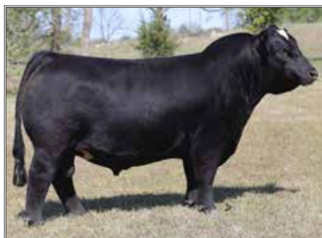
CONLEY HIGH RISE F3 SIRE OF LOT 15