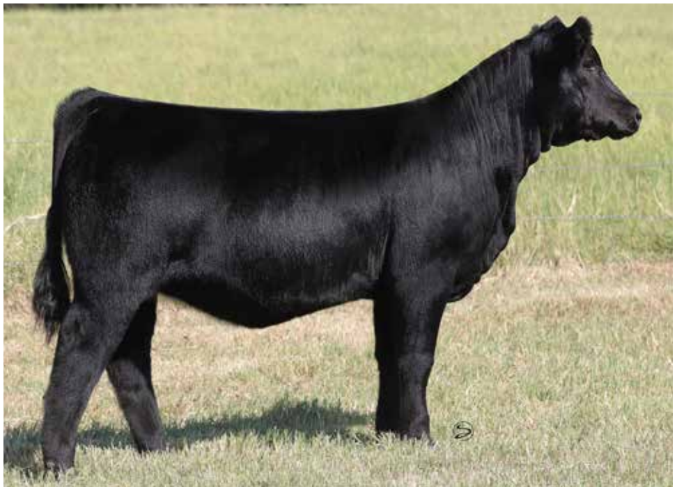
MTZ LADY JACKIE J2102 OFFERED BY METZLER CATTLE & RICHBURG CATTLE CO.