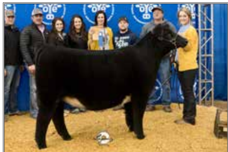
LJR MS COOL DA STYLE 171E DAM OF LOT 61 2018 OYE BRONZE MEDALLION CHIANINA FEMALE