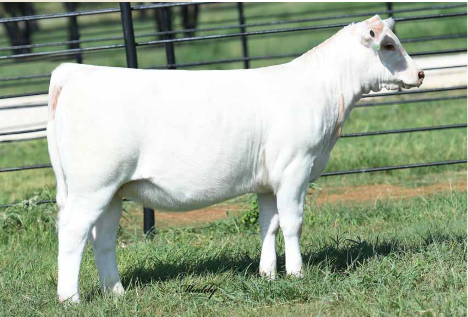
LJR MS TIGER 3164J ET OFFERED BY SHIPWRECK CATTLE CO. & JACKSON CATTLE CO.