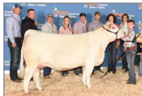
LJR MS TIGER LILLY 2041C ET 2017 HOUSTON LIVESTOCK SHOW & RODEO GRAND CHAMPION CHAROLAIS FEMALE - DAM OF LOT 64