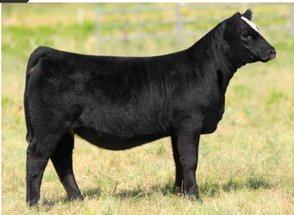
JCBB JEWELS 107J OFFERED BY BIRD CATTLE CO. & RICHBURG CATTLE CO.

107J is the picture perfect blaze faced half-blood female that is sired by the $120,000 KCC1 Exclusive 116E. This April born female is exquisite in her design, setting to the surface with a near perfect set to her hip and hind leg. The dam of this female was bred in the Jones-Stewart Angus Ranch program of North Central Kansas. Without a doubt we believe this female will be a force in the April ORB next winter and spring at the Texas Majors.