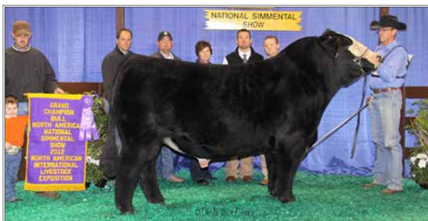
MR HOC BROKER TRIPLE CROWN WINNING SIRE OF INFLUENCE AND FULL BROTHER TO DAM OF LOTS 24A, 24B, & 25