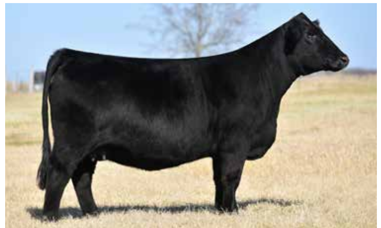
SWC BAR O FEELING IT 856F $34,000 INNOVATOR DAUGHTER OF LOT 1