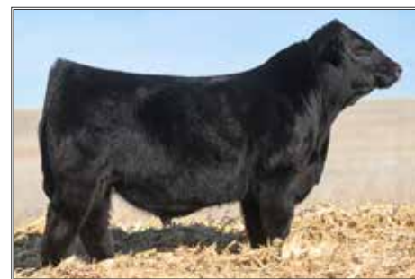
KCC1 FOLSOM 512F SIRE OF LOTS 28 & 29

Here is one of the younger Purebred daughters of KCC1 Estelle 510E that is sired by the $39,000 high selling bull at Kearns Cattle Company a few years back that sold to Lee's Cattle Company of Brush,