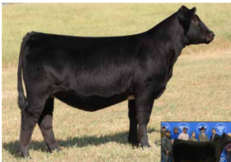
HSC JADE 019J OFFERED BY HILMES CATTLE COMPANY

This Profit daughter is from a proven Total Recall dam that produced a Ft. Worth SimAngus Champion for Bar O Cattle Co. Her Angus lineage would have been one of the key cow families that built the Ohlde Cattle Co program of Kansas. The maternal Grandsire would be a son of OCC Anchor and from OCC Great Plains' full sister 907C. On the bottom of the maternal side her granddam would be the legendary full sister to OCC Broadside, 919E. Profit's dam is quite possibly the highest and most consistent generator at Hartman Cattle Co, the great Panarama. Unique fronted, with near ideal body shape, coupled with a great pin and hindleg set. What a solid and predictable SimAngus donor candidate.