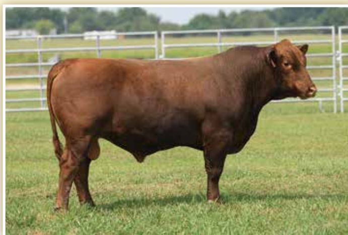
LOT 71 - JEFFRIES EXTEND 273G

Jeffries Extend 273G is another logical calving ease option that is sired by Extend and backed by a top daughter of Andras JLJ Smart Choice R264. He offers a unique combination of a moderate 72 pound actual birth weight, and spreads to a WW Ratio at 122! Here is a multi-purpose herd sire prospect that can be used on heifers or mature cows with confidence.