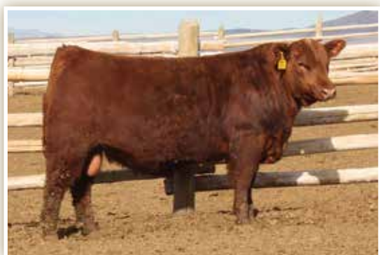
5L OUT IN FRONT 1701-457B - SIRE OF LOT 137