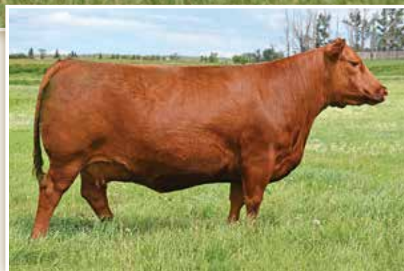
RED BRYLOR PRISCILLA 67W FAMOUS MATERNAL SISTER OF LOT 8

BECKTON NEBULA M045 BW: 80 BECKTON LANA M809 EP Adj. WW: 652 LJC MISSION STATEMENT P27 Scan Wt: 1480 BROWN MS ABIGRACE L7730 Act. REA: 14.55 SSS BLACKTREND 13B Act. BF: 0.18 MEADOW CK MS SEAMAN 31A Act. IMF: 3.77 RED WIL-SEL PRESIDIO 26E SC: 38 CM RED WIL-SEL MISS REDFORD 45E DMPPA: 100