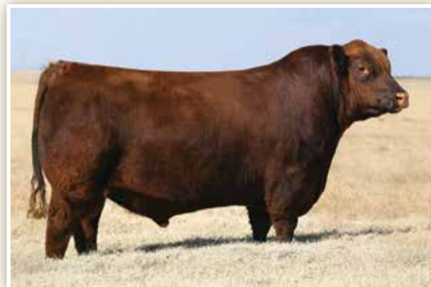
MANN RED BOX 55C - FAMOUS SON OF WIDELOAD, THE MATERNAL BROTHER TO LOT 121

HXC CONQUEST 4405P BROWN C- ABIGRACE S602 FEDDES BIG SKY R9 BROWN C- JOLENE S605 BUF CRK CHF 824-1658 MRM 1431 8611 9109 BJR MONU 4X-303 BJR ALTHEA 27C-245 BW: 68 Adj. WW: 609 Adj. YW: 697 Act. REA: 6.62 Act. BF: 0.09 Act. IMF: 5.78 DMPPA: 104