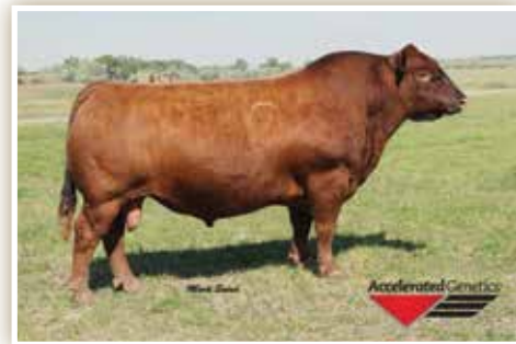
RED SSS OLY 554T - PATERNAL GRANDSIRE OF LOTS 48 - 50

259G is a long and extended son of VGW Oly 903, the 554T son that traces to a powerful and productive Fritz Justice 8013 dam. 259G is a smooth shouldered, clean jointed bull that is larger outlined and will add pay weight to a set of feeder calves. He ranks top 18% ADG, top 7% CEM, and top 24% YG.