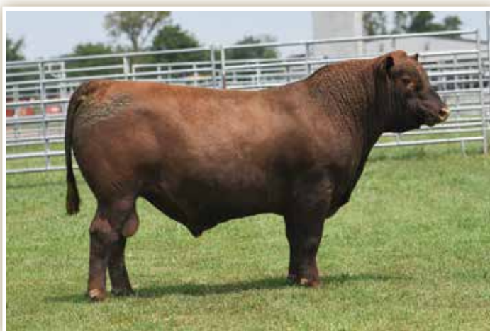
LOT 47 - JEFFRIES GLADIATOR 160H

Jeffries Gladiator 125H comes in a moderate framed, bolded ribbed, deep sided 24C son that is from a 5L Out in Front 1701-457B daughter that was purchased by Kings River Land & Cattle. 125H ranks top 2% WW, top 2% YW, top 3% ADG, top 15% HPG, top 11% Marb, and top 9% CW. Here is a big scrotal bull that offers a 60 pound actual birth weight and spreads to nearly 800 pounds at weaning time.