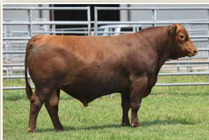
LOT 46 - JEFFRIES GLADIATOR 125H

61H is a long sided, big hipped, sound-built son of Gladiator that is a performance specialist! 61H is backed by a Loosli Hobo 923 daughter that was bred in the TJS program. Top 3% WW, top 3% YW, top 5% ADG, top 23% Milk, top 18% HPG, and top 10% Marb.