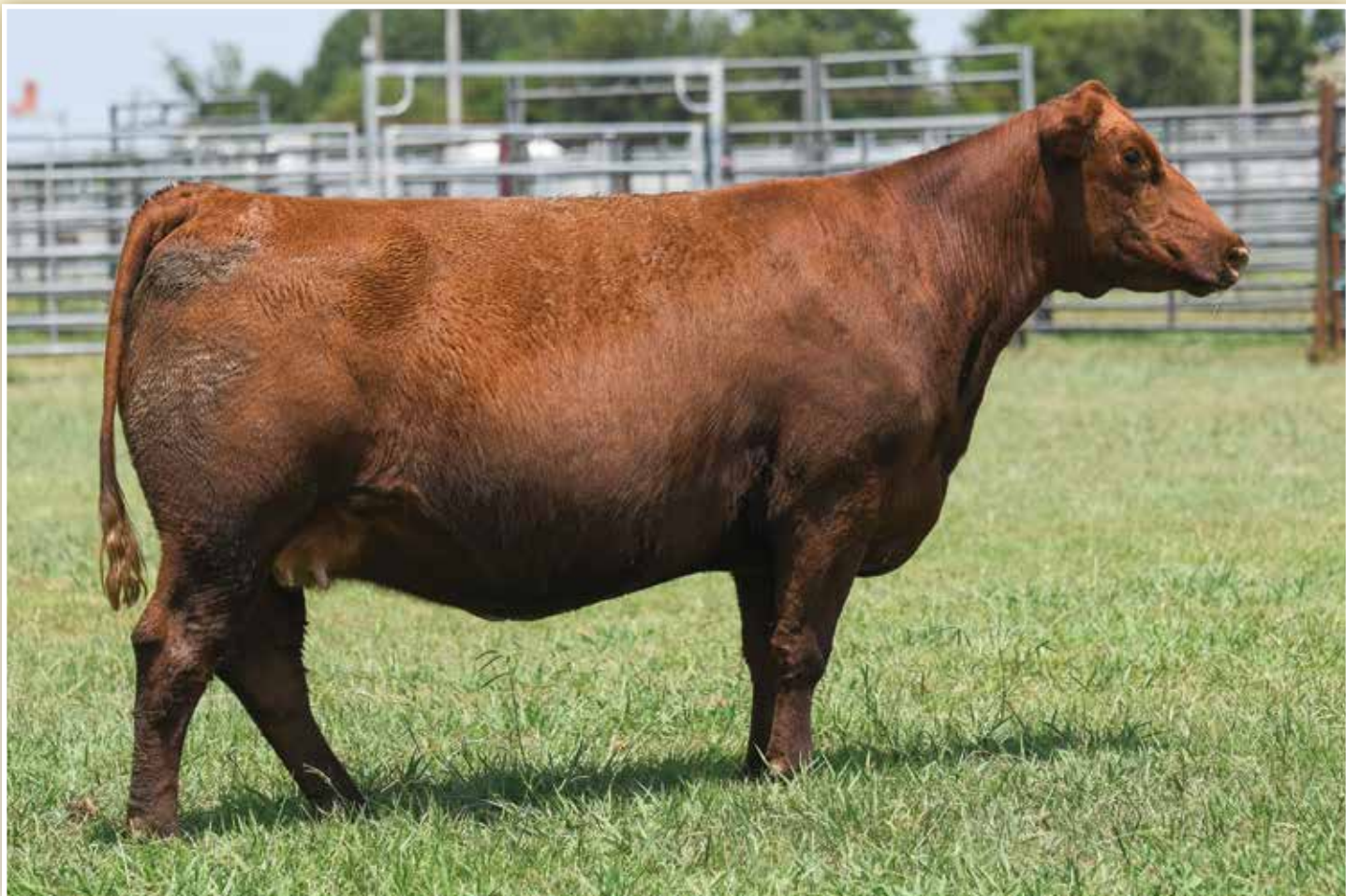
LOT 122 - JEFFRIES MS JOTEN E454

Jeffries Ms Joten E454 is one of the most eye appealing, stout featured and just overly impressive females you will witness when touring this dispersal of the 2017 set of females. With our commitment to refresh the cowherd, its females like E454 that make it extremely difficult to let go of an entire year group like this. She is a female with high predictions to increase carcass quality in her offspring, she herself uniquely ratioed a 104 for both marbling and rib eye area something that often act conversely of one another. E545's mother is a super productive and hardworking member of our cowherd, her sire C-BAR Contour 107X is a Conquest 4405P son who is renowned for adding maternal value. Her mating with Jefferies Gladiator 24C is bound to be one of the most interesting pregnancies of this offering, there is something to be said about the proven potency of this combination.