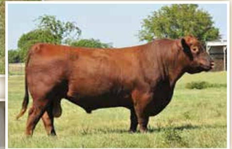
ANDRAS THUNDER A092 SIRE OF LOT 9 & 10

Jeffries Thunder 208H is one of two sons of Andras Thunder A092, an outcross herd sire that we purchased from Andras Stock Farm with Nine Mile Ranch. 208H is backed by a Red SSS Oly 554T daughter that was bred by TJS Red Angus. 208H is a top maternal sire that ranks top 5% for Milk and top 23% ME. He is a sound footed, big scrotal bull that offers added body mass and shape.