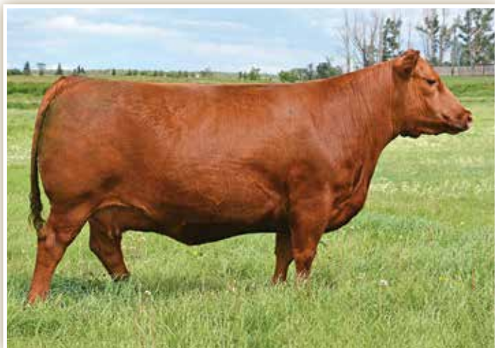
RED BRYLOR PRISCILLA 67W FAMOUS MATERNAL SISTER TO LOT 110

AI BRED ON 2/6/21 TO EGL GUIDANCE 9117 (RAAA: 4208972). PE FROM 2/27/21 TO 5/6/21 TO EGL GUIDANCE 9117 (RAAA: 4208972). ESTIMATED DUE EARLY NOVEMBER.