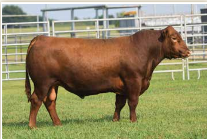
LOT 62 - JEFFRIES RENOWN 59H