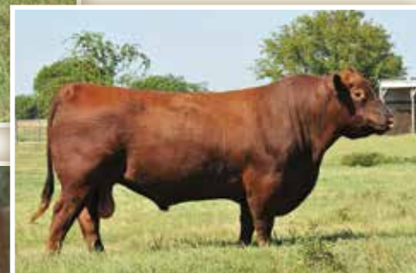
ANDRAS THUNDER A092 SIRE OF LOT 25 & 26

282H is an eye appealing son of Thunder that is backed by a female purchased from the 3-J Farms program in Ravia, Oklahoma. He is sound built, smooth made, and tough built. 282H is balanced numerically as he ranks top 6% Milk and top 17% ME.