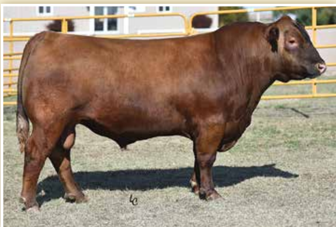
JEFFRIES BLUEPRINT 258Z - SIRE OF LOTS 139 - 141

AI BRED ON 4/7/21 TO EGL GUIDANCE 9117 (RAAA: 4208972). PE FROM 4/14/21 to 6/4/21 TO JEFFRIES FRANCHISE 786F (RAAA: 4008024). ESTIMATED DUE LATE FEBRUARY.