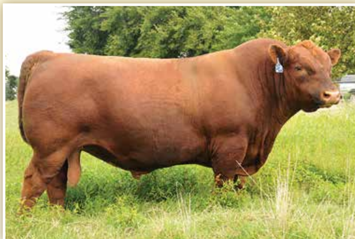
VGW OLY 903 SIRE OF LOTS 143 & 144