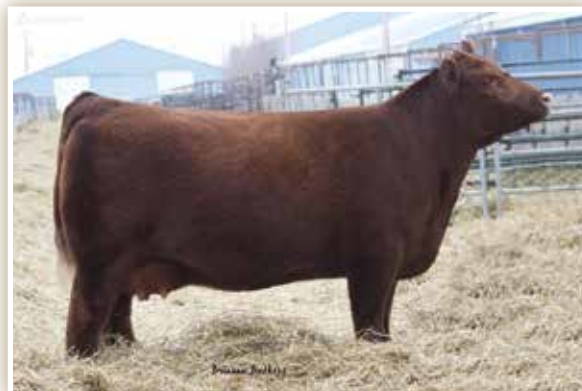
RED BLAIRS PRISCILLA 44Z DAUGHTER OF 67W, MATERNAL SISTER TO LOT 8