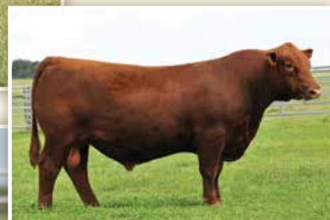
JEFFRIES GLADIATOR 24C SIRE OF LOTS 104-107

AI BRED ON 1/27/21 TO EGL GUIDANCE 9117 (RAAA: 4208972). PE FROM 3/7/21 TO 5/6/21 TO BIEBER FOREFRONT H551 (RAAA: 4308161). ESTIMATED DUE EARLY FEBRUARY.