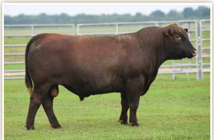
LOT 70 - MLCRA MASSEY'S G213

G213 is a top performance son of HXC Dawson 7003E that offers a balanced combination of performance predictors with elite carcass figures. G213 is among the top 9% ProS, top 3% GM, top 26% WW, top 13% YW, top 6% ADG, top 20% Marb, and top 3% CW. Study the natural spring of rib and depth of body that this beef bull from Massey Land & Cattle offers!