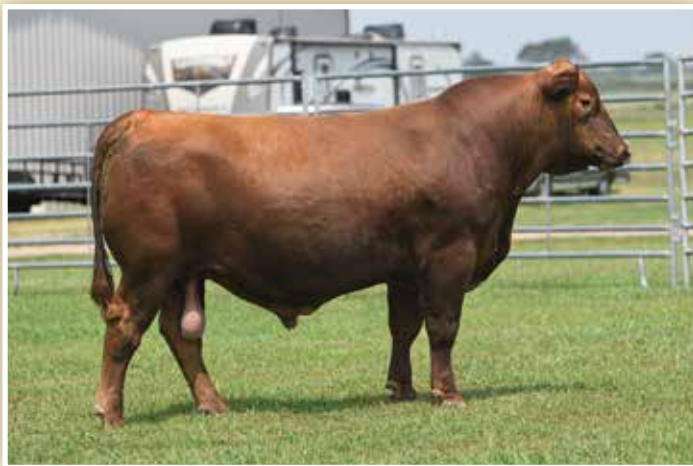
LOT 35 - JEFFRIES BIG CHIEF 293H