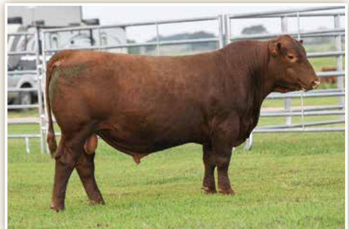
LOT 44 - JEFFRIES GLADIATOR 298G

298G is backed by the Jeffries Ms Gloria E467 dam that is also selling in this offering. 298G is a bold bodied, bigger outlined bull that is flawless on his feet and legs. He charts top 6% GM, top 18% WW, top 9% YW, top 4% ADG, top 10% HPG, top 9% Marb, and top 9% CW. Study his body mass and fleshing ease!