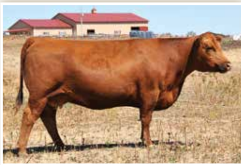
BROWN MS BIG SKY U7877 MATERNAL GRANDDAM OF LOT 31