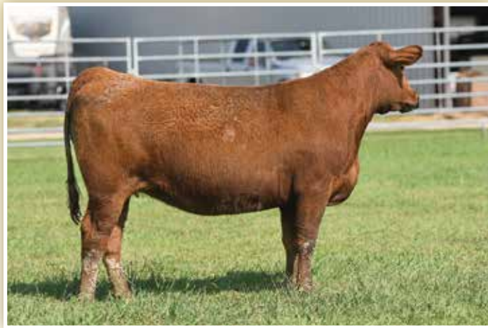
LOT 119 - JEFFRIES MS DIXIE H254