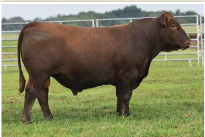
LOT 37 - JEFFRIES BIG CHIEF 6H

Jeffries Big Chief 63H is an elite herd sire candidate, ranking among the top 1% ProS, top 1% HB, top 1% WW, top 1% YW, top 2% ADG, top 10% Milk, top 17% Stay, and top 3% CW. 63H is a slick hided, easy shedding bull that is smooth made and offers a moderate birth weight of 72 pounds. Here is a potential candidate for use on larger well managed heifers to enhance performance, length, and frame size.