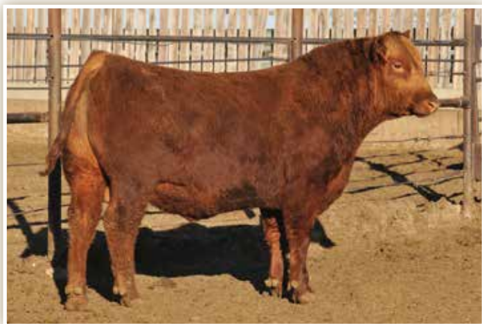
TJS EMPIRE E045 - SIRE OF LOT 102

AI BRED ON 2/5/21 TO EGL GUIDANCE 9117 (RAAA: 4208972). PE FROM 2/27/21 TO 5/6/21 TO EGL GUIDANCE 9117 (RAAA: 4208972). ESTIMATED DUE EARLY JANUARY.