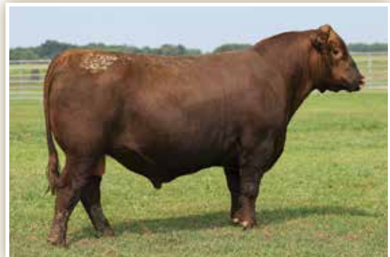
LOT 49 - JEFFRIES OLY 259G