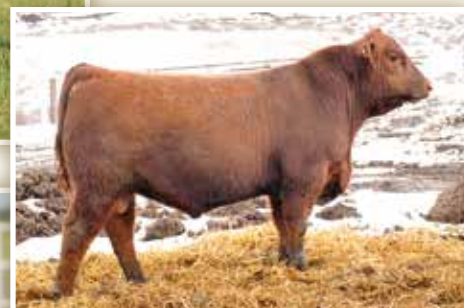
9 MILE BIG CHIEF 8281 SIRE OF LOTS 116, 117, & 119

AI BRED ON 2/6/21 TO EGL GUIDANCE 9117 (RAAA: 4208972). PE FROM 2/27/21 TO 5/6/21 TO EGL GUIDANCE 9117 (RAAA: 4208972). ESTIMATED DUE EARLY JANUARY.