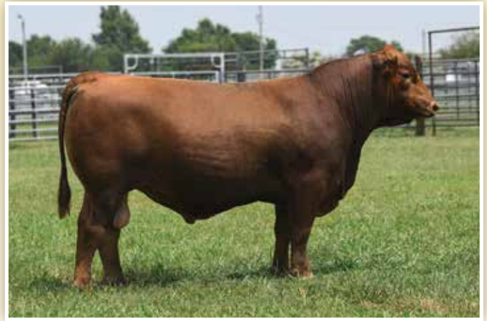
LOT 42 - JEFFRIES GLADIATOR 179H

Gladiator 179H has surfaced as one of the elite performance sires to be offered on September 24 in Checotah! The dam of 179H is now employed by Kings River Land & Cattle in Huntsville, Arkansas. 179H boasts an impressive WW Ratio at 139 with nearly 900 pounds of weaning weight performance! Here is a slick haired, smooth made, big bodied, thick ended herd sire prospect that charts top 1% WW, top 1% YW, top 2% ADG, top 9% Marb, and top 10% CW. A true sale feature from the Gladiator sire group that will add pounds to your next calf crop!