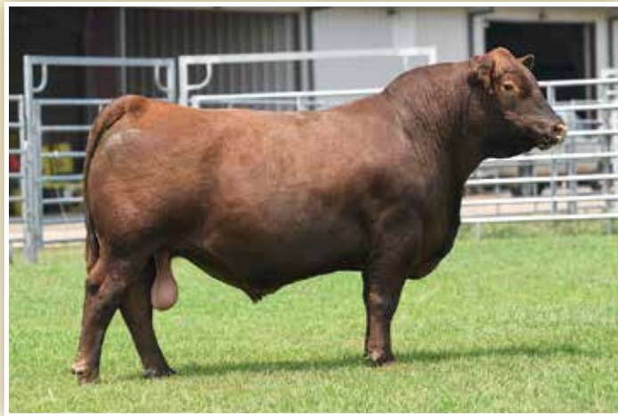
LOT 24 - JEFFRIES ROLLIN DEEP 279H

Jeffries Rollin Deep 169H is a super sleek made herd bull candidate that is sired by our Bieber Rollin Deep 805F son. 169H is supported by a stunning Andras New Direction R240 dam that is now working for Kats Red Angus in Prairie View, Kansas. 169H is among the elite 2% for WW, top 4% YW, top 10% ADG, top 6% CW, and top 24% REA. He came to the weaning pen with over 800 pounds of adjusted pay weight. 169H is an eye appealing bull that is an absolute must see on sale day!