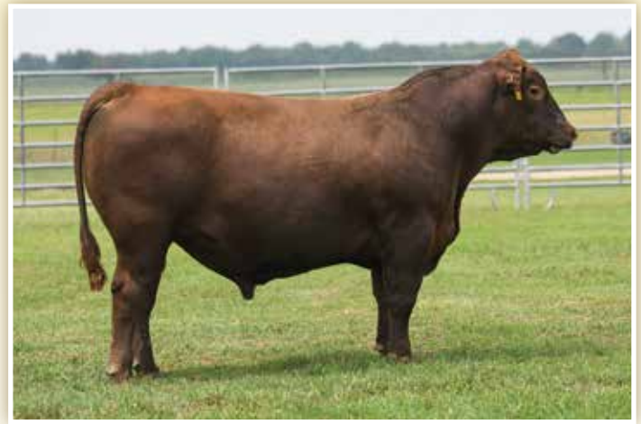
LOT 38 - JEFFRIES BIG CHIEF 53H

Here is another performance focused son of 9 Mile Big Chief 8281 that is from a member of the Primrose family. 53H is a bigger outlined herd sire prospect that is big footed, stout boned, and big ended. He ranks top 1% WW, top 1% YW, top 2% ADG, top 2% Milk, top 5% HPG, top 17% Stay, and top 3% CW. A logical sire choice for use on production age cows to add pay weight when it counts!