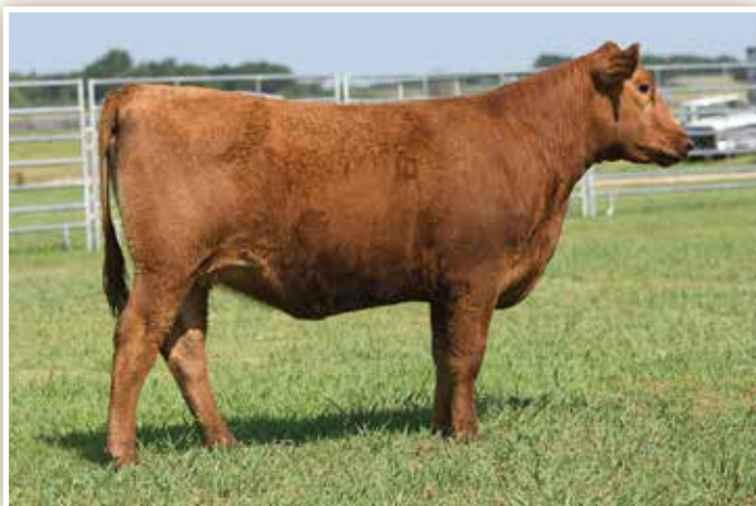
LOT 120 - JEFFRIES H209

AI BRED ON 2/6/21 TO EGL GUIDANCE 9117 (RAAA: 4208972). PE FROM 2/27/21 TO 5/6/21 TO EGL GUIDANCE 9117 (RAAA: 4208972). ESTIMATED DUE EARLY DECEMBER.