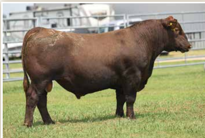
LOT 21 - MLCRA MASSEY'S H231

Without a doubt one of the most unique built herd bulls in the entire offering. MLCRA Massey's H231 is an own son of Jeffries Deep End 396D that is from Canyon Classic bred dam on the bottom side. This cherry red stud is near perfect in his hip and hind leg design, bold in his rib cage, and shapely down the top side of his skeleton. He came to the weaning pen with over 800 pounds. Power bull!