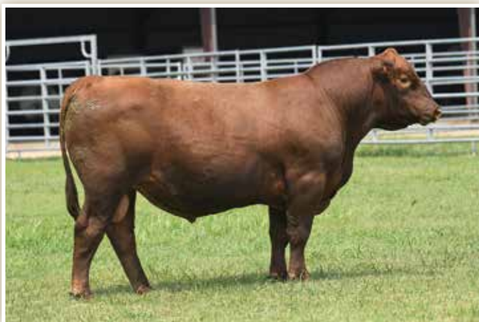
LOT 63 - JEFFRIES RENOWN 252H