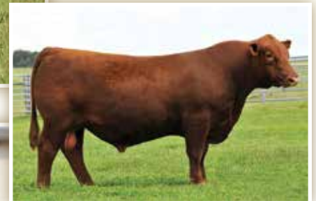
JEFFRIES GLADIATOR 24C SIRE OF LOTS 1-4

What a way to initiate the 2021 Jeffries Red Angus offering! Jeffries Gladiator 58H is sired by senior herd sire, Jeffries Gladiator 24C. The dam of 58H is young and productive Jeffries Ms Rosette E655, a female who offers a MPPA of 104. 58H is a sure shot calving ease specialist that charts a -3.8 BW EPD that is accompanied by a moderate birthweight of 64 pounds. He posts a BW Ratio at 96 and a WW Ratio at 109. 58H ranks top 16% GM, top 16% BW, top 5% WW, top 4% YW, top 4% ADG, top 5% HPG, top 18% CEM, and top 7% Marb. Additionally, he scanned with over a 15 inch eye and an IMF of 3.15. 58H is a moderate framed, bold ribbed, deep sided, shapely bull that is a true herd sire prospect among a deep set of age advantage bulls!