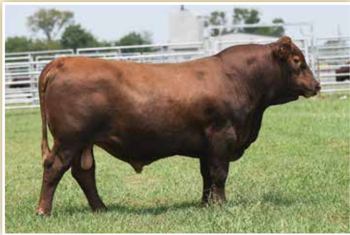
LOT 82 - JEFFRIES ONE OF A KIND 296H