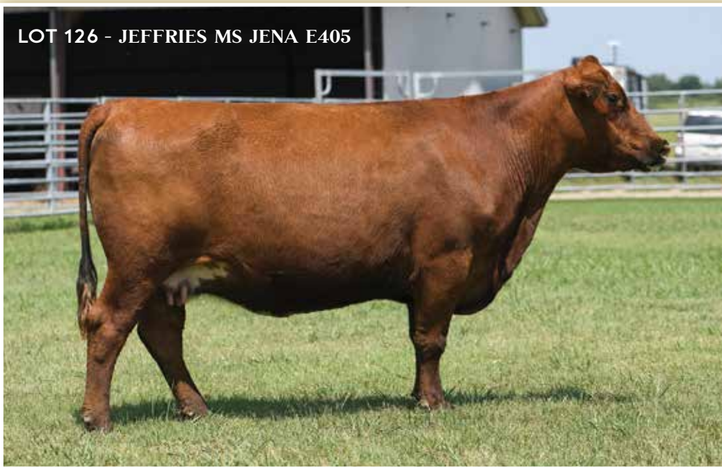
LOT 126 - JEFFRIES MS JENA E405