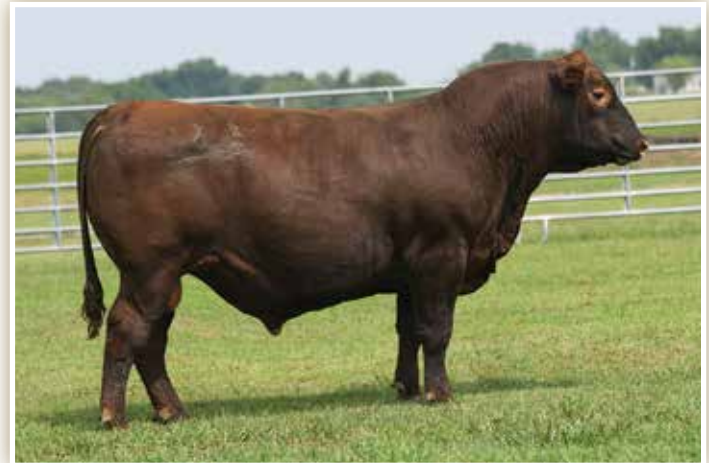
LOT 43 - JEFFRIES GLADIATOR 292G

292G is a blood red son of 24C that is from a Bieber H Hughes W109 daughter with an MPPA of 102. He boasts a WW Ratio at 102 and charts top 4% WW, top 5% YW, top 11% ADG, top 6% HPG, top 19% Marb, and top 15% CW. He is a sound footed, long strided, athletic herd bull prospect that is sure to turn heads on sale day.