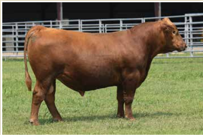
LOT 61 - JEFFRIES RENOWN 134H

252H is a big time performance oriented herd sire prospect that is backed by the influence of Badlands Opportunity 53Y. 252H ranks top 3% WW, top 6% YW, top 15% ADG, top 9% CW, and top 19% REA. He is a moderate birth weight herd sire prospect that came to the weaning pen with a WW Ratio at 104.