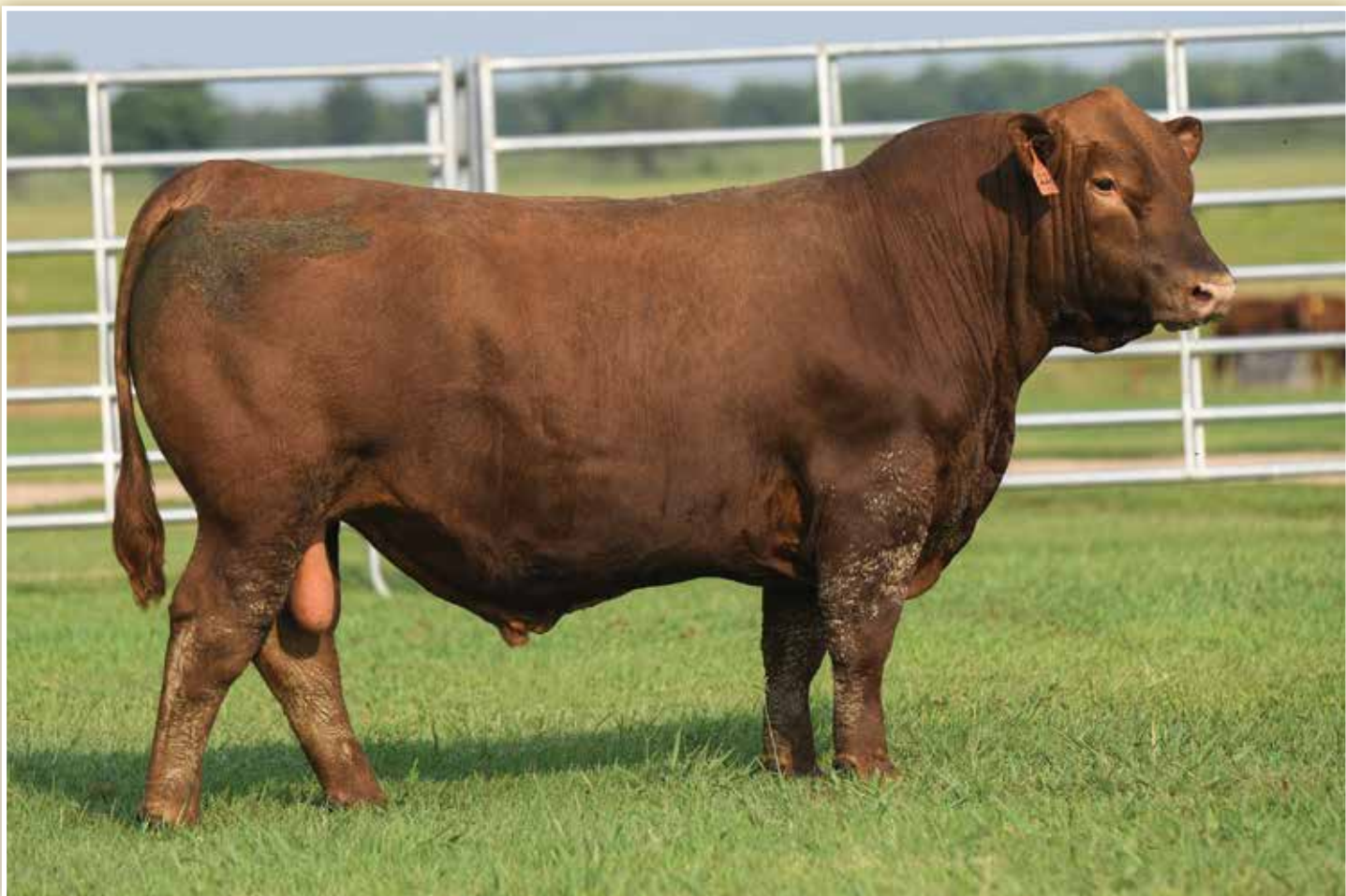
LOT 41 - JEFFRIES GLADIATOR 22H

Jeffries Gladiator 22H is an eye-appealing son of Gladiator that is backed by a female that we selected from the Six Mile program in Canada. 22H is bold in his rib cage, wide pinned, and square made. Numerically he ranks top 26% GM, top 20% WW, top 16% YW, top 14%, top 16% Milk, top 6% HPG, and top 12% Marb. 22H is a moderate birth weight bull that has matured into a true beef bull!