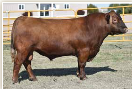
JEFFRIES BLUEPRINT 258Z - SIRE OF LOT 138