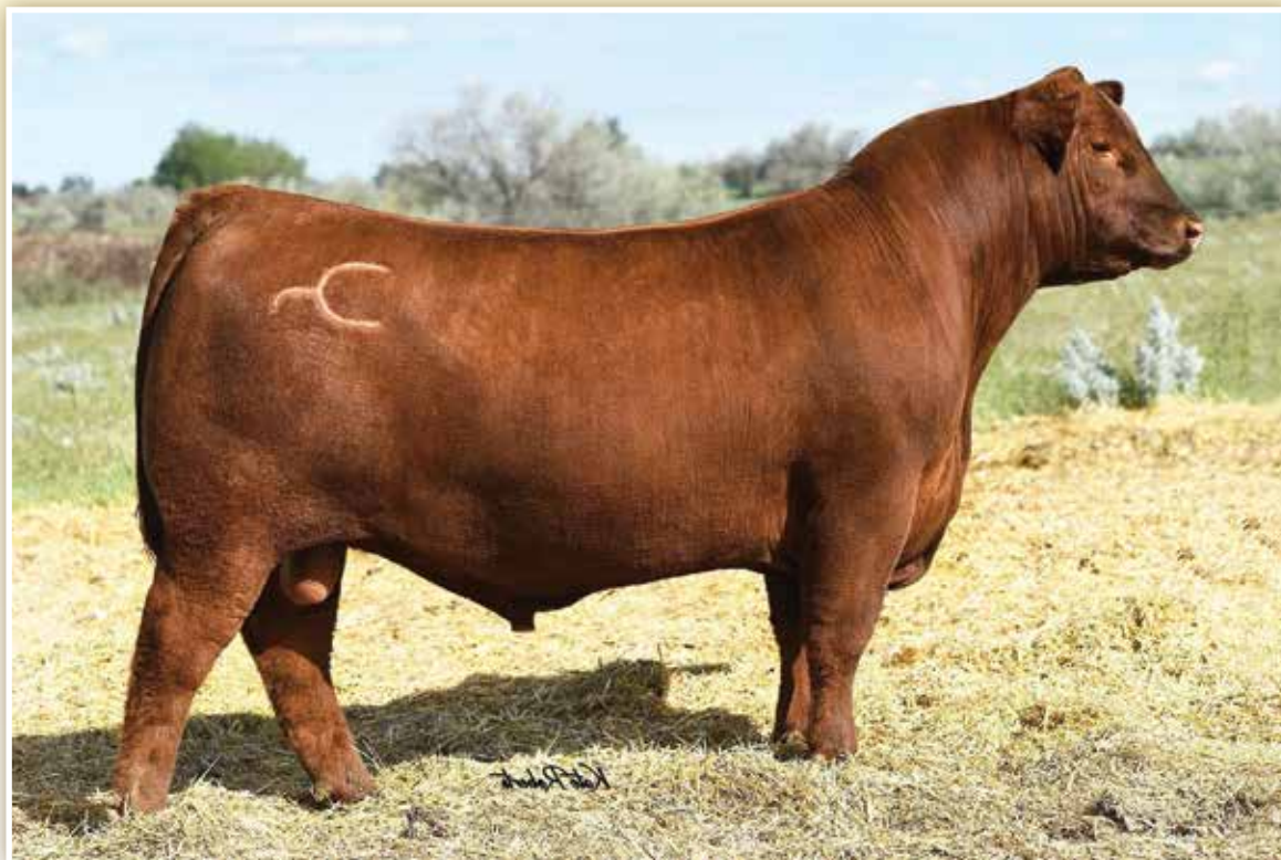
EGL GUIDANCE 9117 - $70,000 SERVICE SIRE TO MANY FEMALES THROUGHOUT THE OFFERING!