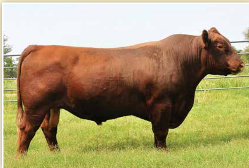
LSF RR EXTEND 2313Z - SIRE OF LOT 150 & 151