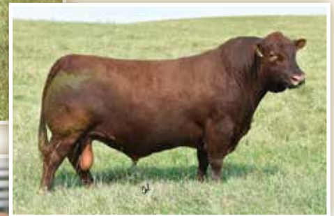
BIEBER ROLLIN DEEP Y118 PATERNAL GRANDSIRE OF LOTS 57 & 58

272H is an elite performance sire that is sired by Jeffries Rollin Deep 805F that is backed by Bieber Rollin Deep Y118, the legendary son of Bieber Tilly 399W. He ranks top 1% for WW and top 1% YW. Here is a big topped, thick ended, larger framed herd bull prospect that boasts a WW Ratio at 107.