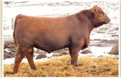
9 MILE BIG CHIEF 8281 - SIRE OF LOTS 29-40