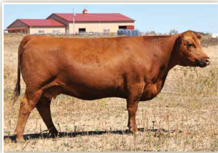
BROWN MS BIG SKY U7877 MATERNAL GRANDDAM OF LOT 122

PE FROM 2/25/21 to 5/8/21 TO JEFFRIES GLADIATOR 24C (RAAA: 3534240). ESTIMATED DUE MID DECEMBER.