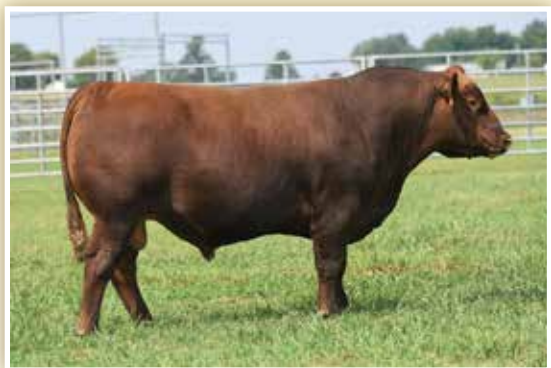
LOT 12 - JEFFRIES FRANCHISE 309H