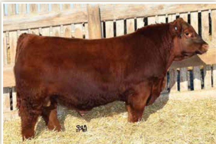
RED U-2 RENOWN 193C - PATERNAL GRANDSIRE OF LOT 81

133H is another son of Smoky Y Renown 8128F, our purchase from the Smoky Y program that traces to the Canadian sire Red U-2 Renown 193C. The dam of 133H is a daughter of Jeffries Reddington 865C. He offers a 72 pound birth weight, while posting a WW Ratio at 102.