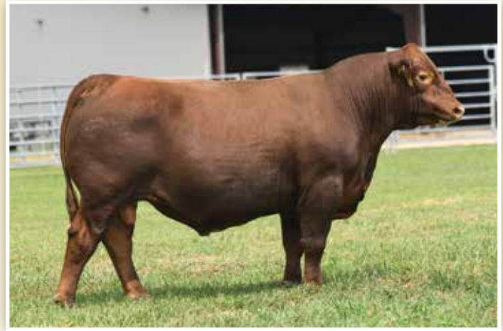
LOT 32 - JEFFRIES BIG CHIEF 52H

Pounds pay! Here is a stout made son of Big Chief that holds true to his sire group! 52H is a wide bodied, big topped, thick made herd bull that ranks top 1% WW, top 1% YW, top 2% ADG, top 10% Milk, top 5% HPG, top 17% Stay, top 8% ProS, and top 3% CW. 52H spreads from a moderate 70 pound birth weight and performed to 600+ at weaning time.