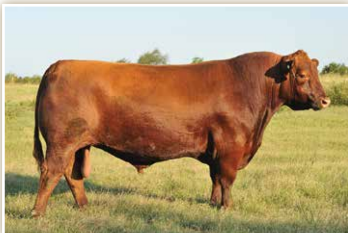
ANDRAS OUTER LIMIT A032 - SIRE OF LOT 145 & 146

AI BRED ON 4/7/21 TO EGL GUIDANCE 9117 (RAAA: 4208972). PE FROM 4/14/21 to 6/4/21 TO JEFFRIES FRANCHISE 786F (RAAA: 4008024). ESTIMATED DUE LATE FEBRUARY.