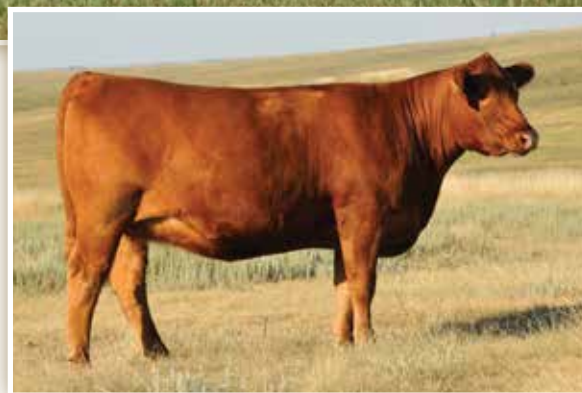
C-BAR ABIGRACE 257Z - DAM OF LOT 29

RREDS SENECA 731C 9 MILE BIG CHIEF 8281 LAZYJ MS BLUBONNT 4146-Y7816 TR COLT 45 UT806 C-BAR ABIGRACE 257Z C-BAR ABIGRACE U875 BIEBER ROLLIN DEEP Y118 RREDS ASTER 309A LSF RAB PERFORMANCE 2772Z BROWN MS SEQUOYA Y7816 BECKTON CODY V E023 BECKTON COCA L388 CK LCC CHEYENNE B221L BROWN MS ABIGRACE P7905 BW: 89 Adj. WW: 667 Scan Wt: 1475 Act. REA: 12.3 Act. BF: 0.16 Act. IMF: 3.27 SC: 40 CM DMPPA: 106