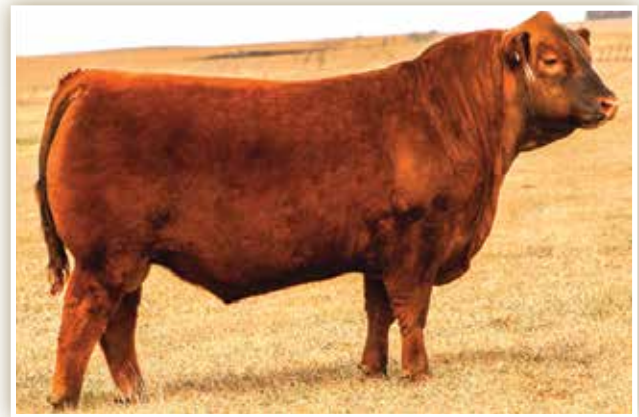
RREDS SENECA 731C - PATERNAL GRANDSIRE OF LOTS 29 - 40

20H comes to us from the Basin Primrose cow line that also incorporates the influence of the maternal great, Red Fine Line Mulberry 26P. Jeffries Big Chief 20H is among the elite 1% for WW, top 1% YW, top 2% ADG. 20H is a flush mate brother to 53H. What a powerful pair of flush mate brothers that sell as lot 38 and 39!