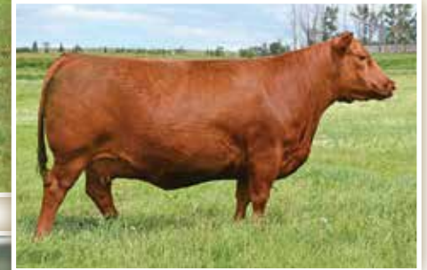
RED BRYLOR PRISCILLA 67W FAMOUS MATERNAL SISTER TO LOT 27

Jeffries Alliance 19H is a standout marbling son of the popular Brown Alliance X7795 that ranks among the elite 17% of the breed for Marb. The dam of 19H is the legendary Red Brylor Priscilla 304S that is also the dam of the famous Red Brylor Priscilla 67W matriarch. Power in the blood!