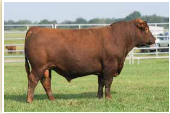
LOT 50 - JEFFRIES OLY 261G

Stout, heavy structured, and dense made... we really like the rugged look that this dark red son of VGW Oly 903 offers. The dam of him is a productive Fritz Justice 8013 daughter with a MPPA of 101. 263G offers a moderate birth weight of 75 pounds, while spreading to a WW Ratio of 110. Additionally, this big testicled herd sire prospect is among the top 16% for YW, top 4% for CEM, top 6% ADG, and top 23% for CW.