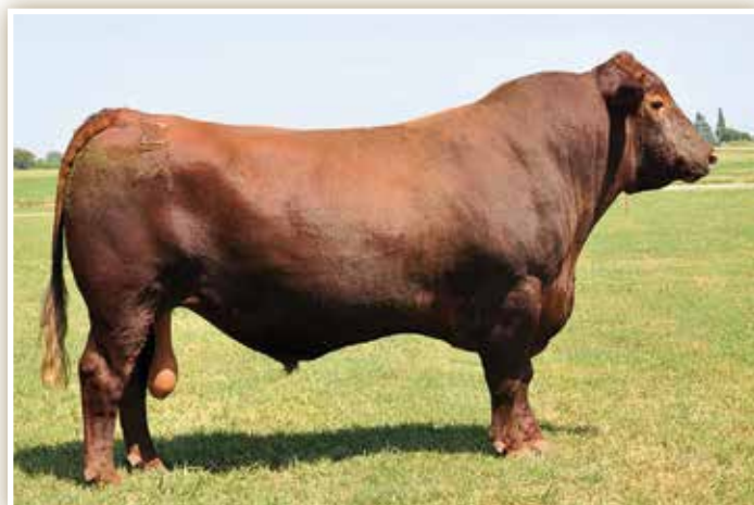
TJS COWBOY WAY Y423 - MATERNAL GRANDSIRE OF LOT 146