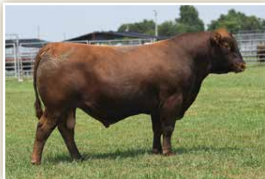
LOT 13 - JEFFRIES FRANCHISE 116H