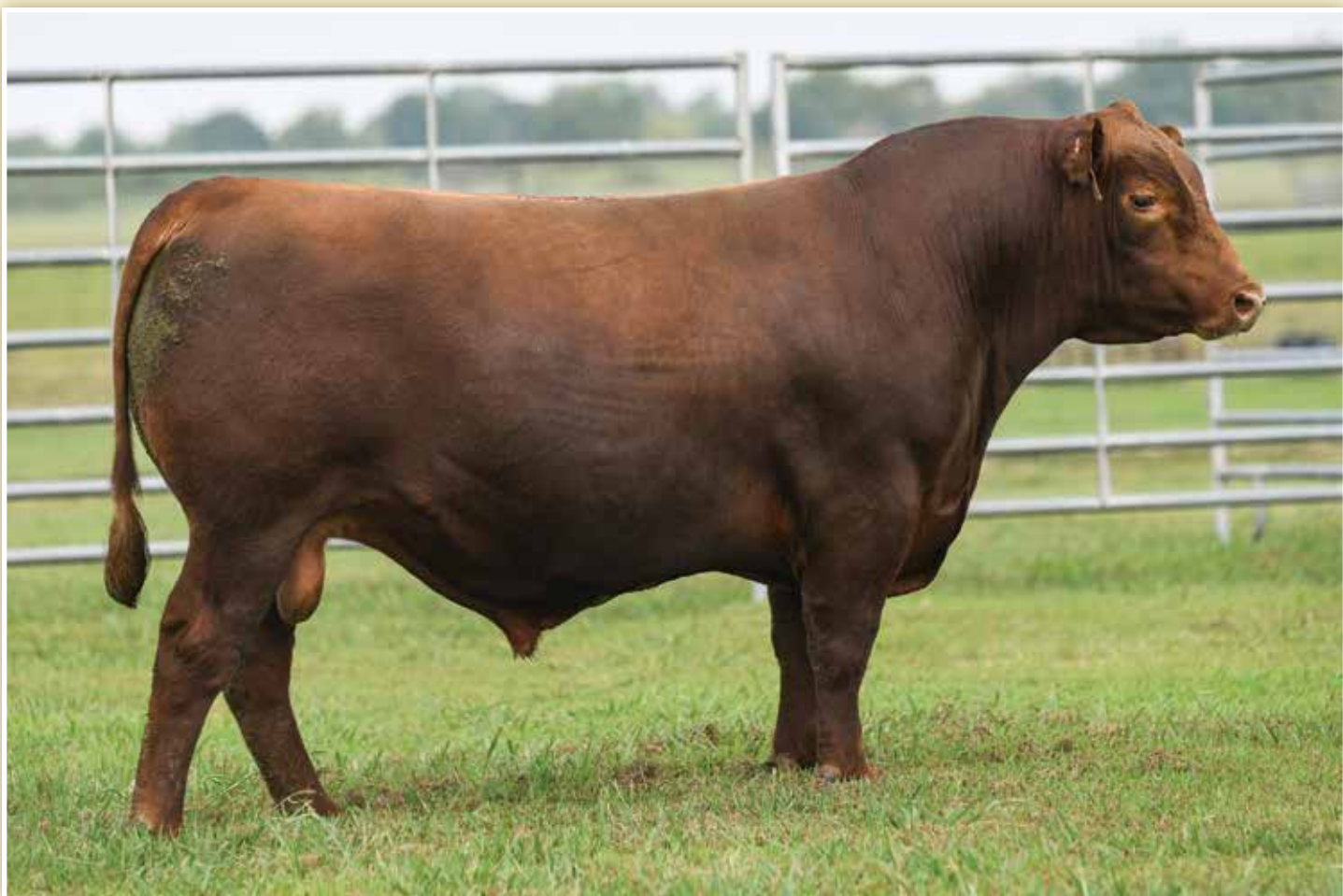
LOT 11 - JEFFRIES REDDINGTON 297G

Jeffries Reddington 297G is a tremendous son of Jeffries Reddington 865C, a member of our 2016 NWSS Pen of Three Bulls that was a high seller in the Mile High city commanding a five-figure hammer price to Pieper Red Angus and McEntire Red Angus. 297G is a smooth shouldered, clean jointed calving ease specialist that ranks among the top 15% for CED with a negative 3.3 BW EPD. He further solidifies his calving ease credentials with a moderate 60 pound actual birth weight. 297G ranks top 11% ProS, top 14% HB, top 22% BW, top 20% ME, top 13% HPG, top 12% CEM, and top 19% Marb.