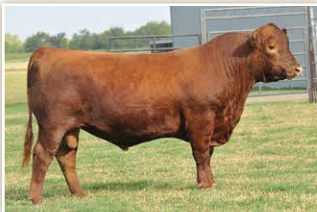
JEFFRIES COMMANDER 793C SIRE OF LOTS 126 & 127

AI BRED ON 4/7/21 TO EGL GUIDANCE 9117 (RAAA: 4208972). PE FROM 4/14/21 to 6/4/21 TO JEFFRIES FRANCHISE 786F (RAAA: 4008024). ESTIMATED DUE EARLY FEBRUARY.