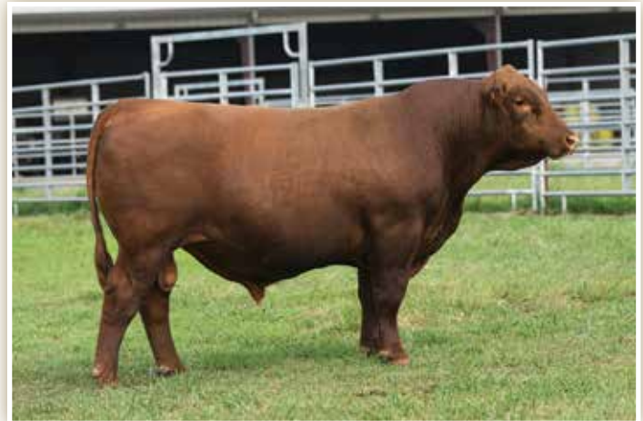
LOT 33 - JEFFRIES BIG CHIEF 56H

56H is a more moderate outlined son of Big Chief that certainly does not disappoint in terms of shape, body dimension, and base width. This sound footed, athletic striding herd bull candidate ranks top 9% CW, top 18% HPG, top 24% WW, top 22% YW, and top 22% ADG. 56H is one of the largest scanning IMF prospects in the sale.