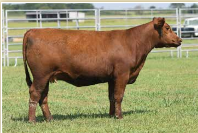
LOT 118 - JEFFRIES MS EXTEND H75