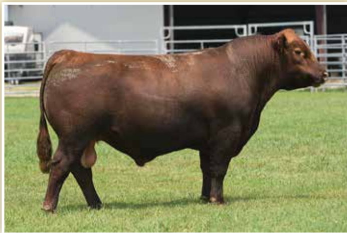
LOT 22 - JEFFRIES ROLLIN DEEP 169H