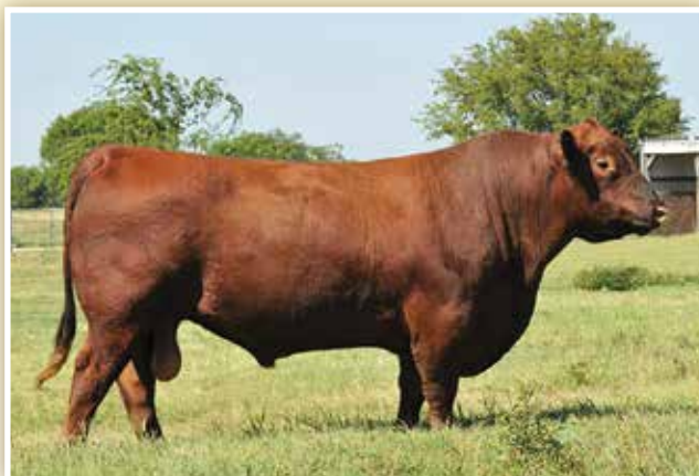
ANDRAS THUNDER A092 SIRE OF LOTS 130 - 133