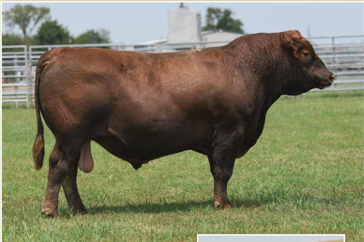
LOT 29 - JEFFRIES BIG CHIEF 121H