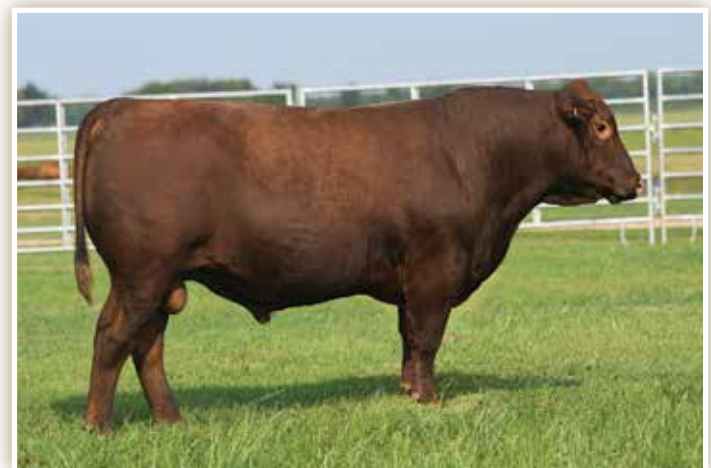
LOT 40 - JEFFRIES BIG CHIEF 68H

68H is a long bodied, thick made son of Big Chief that is from an Andras Thunder dam. Here is a bigger framed bull that charts balanced data across the board. He offers an optimum balance of REA and Marbling. Ready for heavy service!