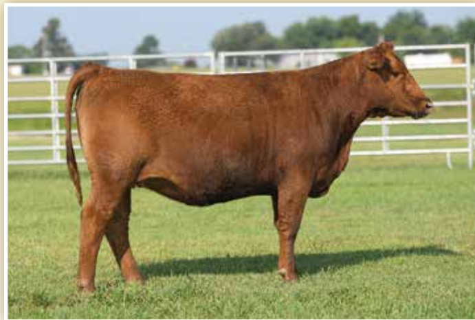
LOT 114 - JEFFRIES FULL HOUSE H216