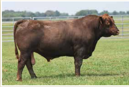
LOT 48 - JEFFRIES OLY 263G