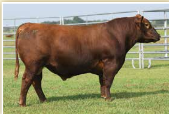
LOT 14 - JEFFRIES FRANCHISE 314G

Calving Ease specialist! 116H will be on the shortlist of the most discriminating on sale day. Here is a stylish son of the $105,000 9 Mile Franchise 6305 that is backed by a standout Conquest daughter. He ranks top 24% CED, top 11% BW, top 13% GM, top 2% Milk, top 11% CEM, and top 21% REA. He also boasts a 16+ inch REA. His moderate birth weight further solidifies his calving ease candidacy. Recommended for use on heifer!