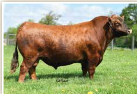
9 MILE FRANCHISE 6305 - SIRE OF LOTS 12-14

314G is another solid calving ease option that will not sacrifice quality, muscularity, or carcass merit. He boasts a moderate birth weight of 60 pounds yet scans with a 15+ inch REA and a 3 for IMF. Balanced, proven genetics that will never go out of style! 314G ranks top 11% GM, top 20% CED, top 12% BW, top 14% ADG, top 7% Milk, top 16% CEM, top 4% CW, and top 5% REA. Carcass, calving ease, and maternal... this heifer safe option checks all the boxes!