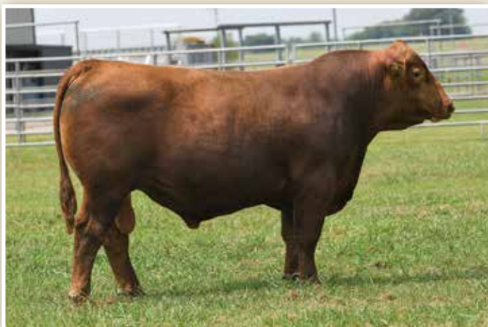
LOT 36 - JEFFRIES BIG CHIEF 63H

Moderate birth weight combined with explosive growth make this this Big Chief son a logical choice for any operation that is looking for a multi-purpose herd sire that will add body shape, depth of rib, structural soundness, and real world performance. He also posted a WW Ratio at 105.