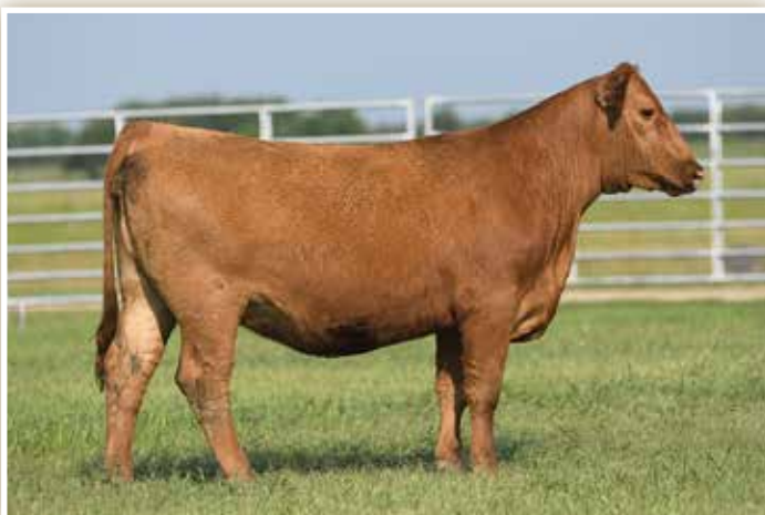
LOT 115 - JEFFRIES FULL HOUSE H298

The perfect outline of Jeffries Samarie H249 will catch the eye of any astute cattle enthusiast. Her sire SR Full House A66 has built a legacy through his daughters in our herd, they are great uddered, with a strong motherly instinct and we think they will have long and illustrious breeding tenures in Checotah, Oklahoma. This level spined, big middled and pretty headed female will calve in early November to the much anticipated $70,000 EGL Guidance 9117. AI BRED ON 2/1/21 TO EGL GUIDANCE 9117 (RAAA: 4208972). PE FROM 2/27/21 TO 5/6/21 TO EGL GUIDANCE 9117 (RAAA: 4208972). ESTIMATED DUE EARLY NOVEMBER.