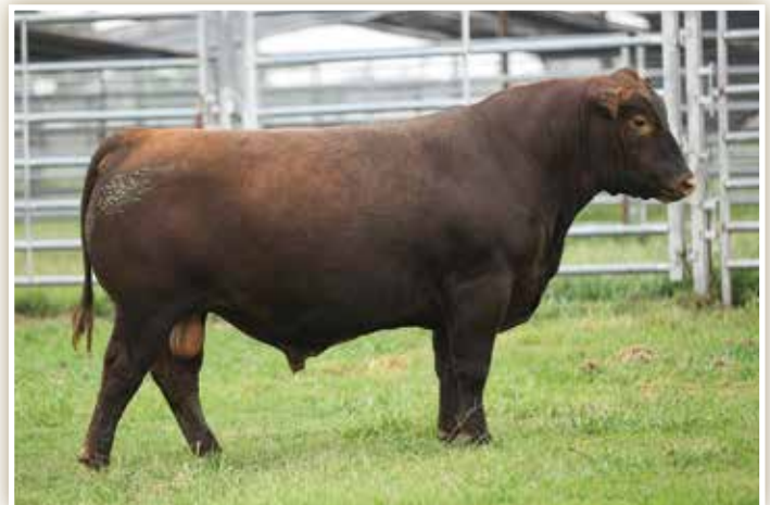
LOT 54 - JEFFRIES FRANCHISE 67H

Moderate, shapely, and good looking from every angle! Here is another Franchise son that is safe for use on well managed heifers or more moderate framed mature cows. 67H is a bold ribbed, thick ended, dark cherry red stud that is among the top 11% for GM, top 11% ADG, top 4% Milk, top 5% CEM, top 5% CW, and top 3% REA. Heifer safe!