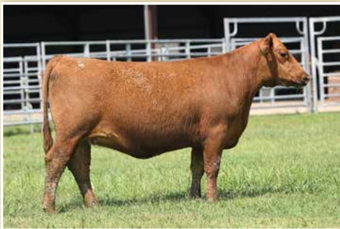
LOT 113 - JEFFRIES SAMARIE H249