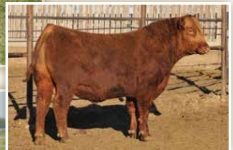
TJS EMPIRE E045 SIRE OF LOTS 17-18

Power, substance, and mass... HERD BULL alert! 109H is a big boned, stout made, wide based son of TJS Empire E0456 that is backed by the Mimi cow family with the influence of LSF RR Extend 2313Z. 109H is a truly unique herd sire prospect that boasts an impressive IMF of 3.62!