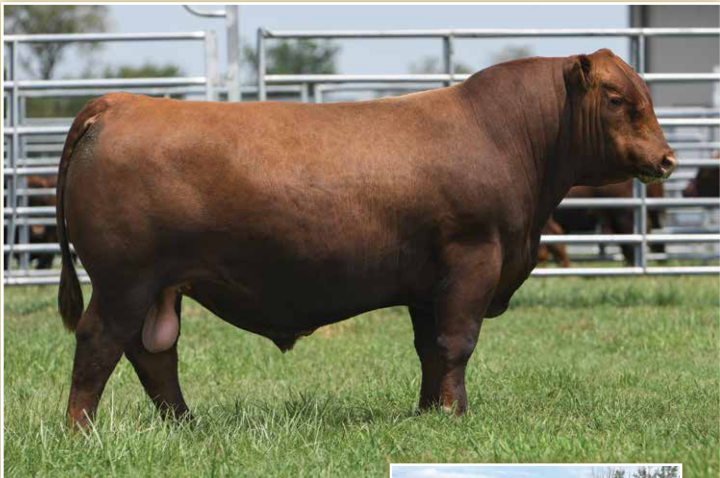
LOT 8 - JEFFRIES ALLIANCE 128H