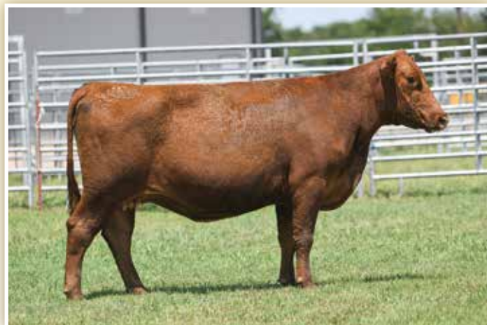
LOT 149 - JEFFRIES REBELLO E516

AI BRED ON 4/7/21 TO EGL GUIDANCE 9117 (RAAA: 4208972). PE FROM 4/14/21 to 6/4/21 TO JEFFRIES FRANCHISE 786F (RAAA: 4008024). ESTIMATED DUE MID JANUARY.