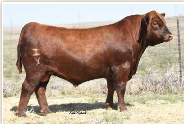
HXC DAWSON 7003E - SIRE OF LOTS 5-7