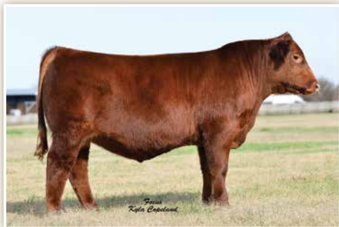
JEFFRIES REDDINGTON 865C - SIRE OF LOT 11