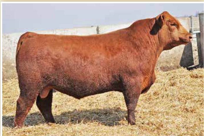
ANDRAS JLJ SMART CHOICE R264 - SIRE OF LOTS 134 - 136

AI BRED ON 4/7/21 TO EGL GUIDANCE 9117 (RAAA: 4208972). PE FROM 4/14/21 to 6/4/21 TO JEFFRIES FRANCHISE 786F (RAAA: 4008024). ESTIMATED DUE LATE JANUARY.