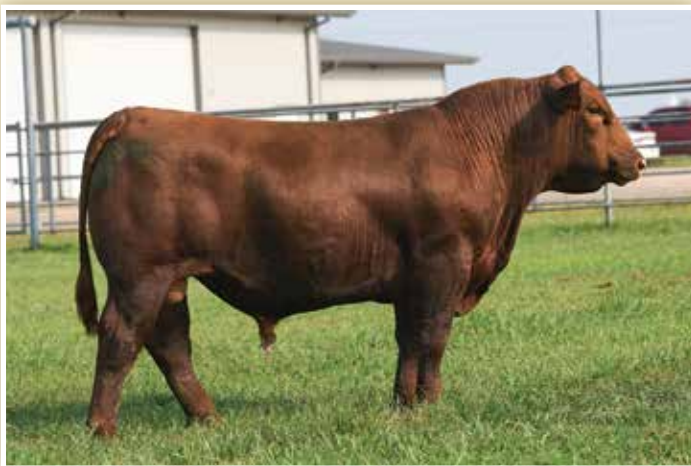
LOT 45 - JEFFRIES GLADIATOR 61H