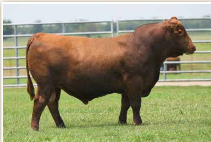
LOT 23 - JEFFRIES ROLLIN DEEP 210H

The number one performance bull in the offering! Jeffries Rollin Deep 210H boasts an impressive WW Ratio at 126, while ranking among the elite 1% for WW, YW, and ADG. Additionally, 210H charts top 11% Milk, top 13% CEM, top 5% REA, and top 2% CW. 210H is a big topped, thick ended, wide based bull that sets down on a flawless foot design. A true powerhouse that will enhance the bottomline for any operation!