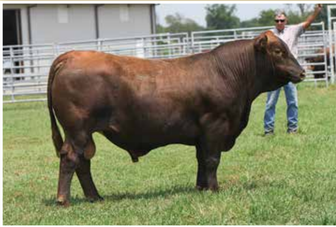
LOT 76 - JEFFRIES SAGA 174H