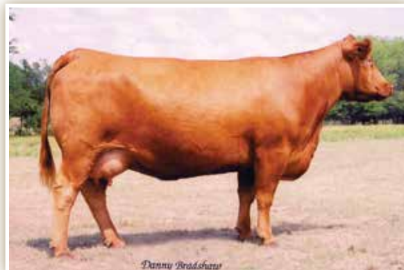
BROWN MS ABIGRACE L7730 LEGENDARY MATRIARCH OF THE RED ANGUS BREED

Jeffries Big Chief 121H is rugged, masculine, and massive in his type and kind. 121H is sure to impress even the most critical cattlemen. The dam of 121H is a member of the legendary Abigrace cow family that traces to the highest dollar generating cow line in the Red Angus breed. Brown Ms Abigrace L7730 has generated well over a million dollar in progeny sales. He ranks top 6% WW, top 7% YW, top 9% ADG, top 24% HPG, and top 14% CW. Make plans now to join us in Checotah on the 24th of September... this one is worth the trip!