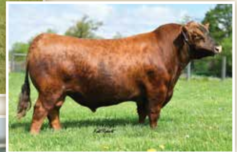
9 MILE FRANCHISE 6305 SIRE OF LOTS 51-56

48H leads off a series of calving ease standouts that are sired by the $105,000 9 Mile Franchise 6305. He is backed by a tremendous New Direction dam from the Dixie tribe. He ranks top 5% GM, top 12% ADG, top 14% Milk, top 12% CEM, top 7% CW, and top 4% REA. 48H is a larger framed calving ease option that will add carcass merit and performance to any set of calves. Recommended for use on well managed heifers.