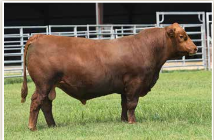
LOT 34 - JEFFRIES BIG CHIEF 140H

Jeffries Big Chief 140H embodies the power and performance that is known from this sire group yet maintains a smooth and clean build that allows him to balance with eye appeal and added style. 140H boasts an impressive WW Ratio at 121 with nearly 800 pounds of pay weight at weaning time. Performance, longevity, and carcass merit combined in this powerful individual!