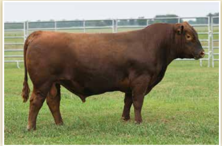
LOT 53 - JEFFRIES FRANCHISE 281G

281G offers a unique combination of low birth, calving ease genetics with a blend of breed leading performance and carcass quality. Here is the opportunity to purchase a Franchise son that boasts a sensible 62 pound actual birth weight and posts a WW Ratio at 107. 281G ranks top 4% GM, top 14% BW, top 18% WW, top 10% YW, top 5% ADG, top 1% Milk, top 18% CEM, top 19% Marb, top 2% CW, and top 3% REA. Heifer safe!