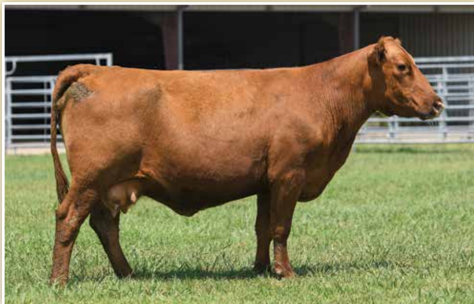
LOT 138 - JEFFRIES LARKABA E611