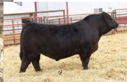
HOOK`S CORNERSTONE 32C PATERNAL GRANDSIRE OF LOTS 32-36

Big scaled, baldy faced son of our herd sire W/C Foundation 2315E that is sure to generate the type and kind even the most discriminating cowman will admire, regardless of sex. A maternal brother by CCR Cowboy Cut 5048Z was a $10,000 feature on our 2020 Profit Through Performance sale.