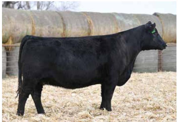
ES C2 - DAM OF LOT 2