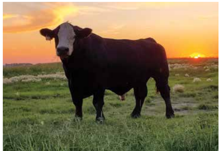
ES SURELOCK ZW15 SIRE OF LOTS 1-10