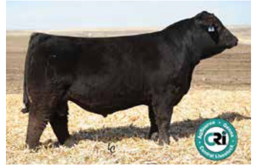
CCR COWBOY CUT 5048Z PATERNAL GRANDSIRE OF LOTS 25-31