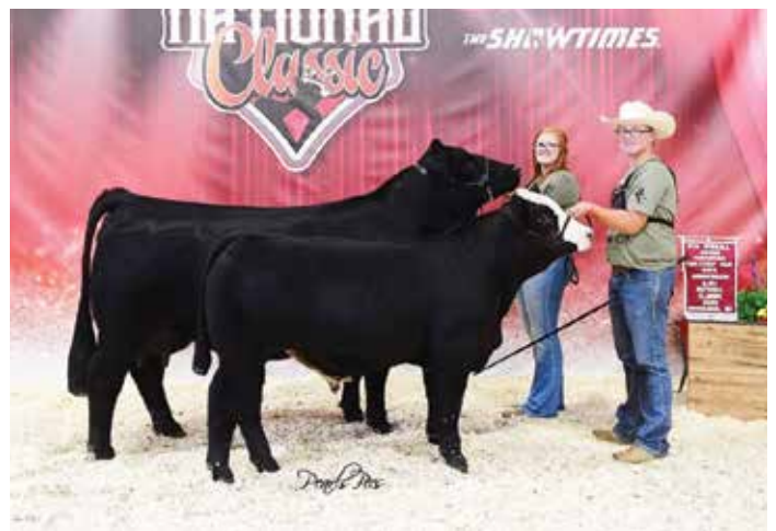
WIREGRASS BARBIE 705F DAM OF LOT 16 WITH BLAG HUGO 1H AT SIDE