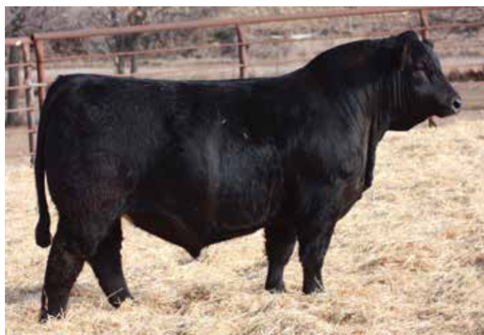
W/C FOUNDATION 2135E - SIRE OF LOTS 32-36