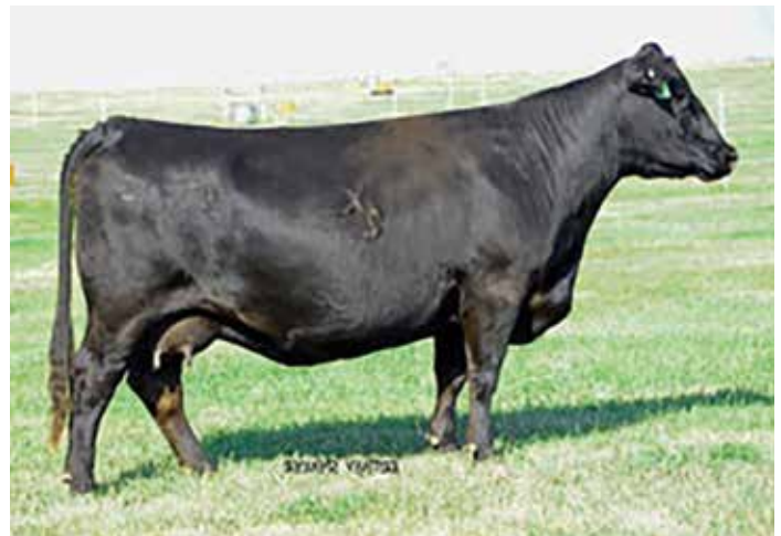
ALC TREASURE C50P MATERNAL GRAND DAM OF LOT 1