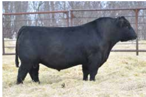
CDI LEGENDARY 364D SIRE OF LOT 24