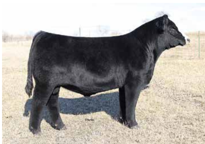
MR TR HAMMER 308A ET - $200,000 SIRE OF LOTS 43-45