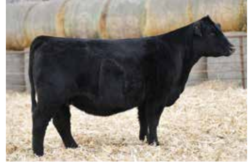
HOLT MS TESS F945 - DAM OF LOT 38