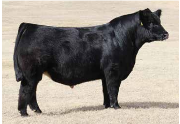
W/C EXECUTIVE 187D - SIRE OF LOT 59