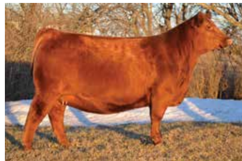
WEBR EXPECTATION 7104 DAM OF LOT 35