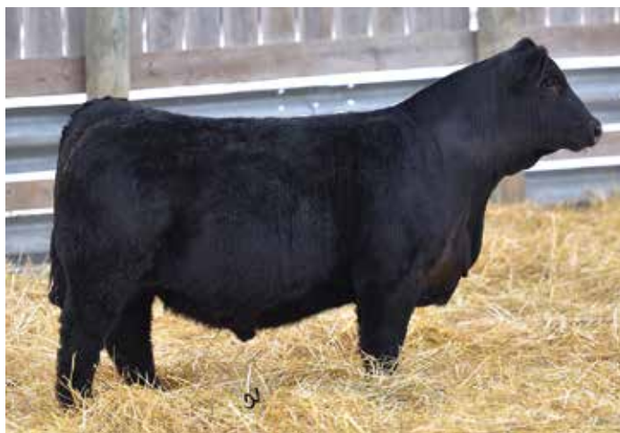
CDI CEO 281D - SIRE OF LOTS 21-23

A full brother in blood to our lead off CDI CEO son who sells as lot 21 and a 3/4 brother to lot 22. You will notice the presence of ALC Treasure C50P on the maternal lineage of all three of these CEO brothers, consistency is key to providing your calf procurement agents with an easily marketable product come sale time.