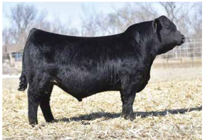
WS CERTIFIED E151 - SIRE OF LOTS 37-38