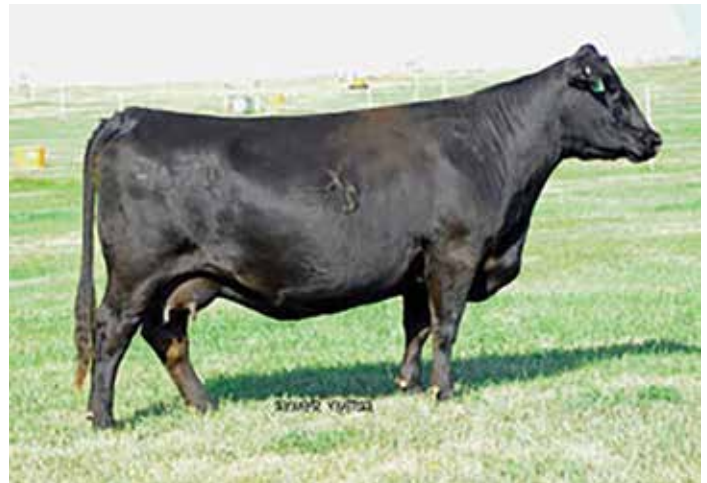
ALC TREASURE C50P - DAM OF LOT 64