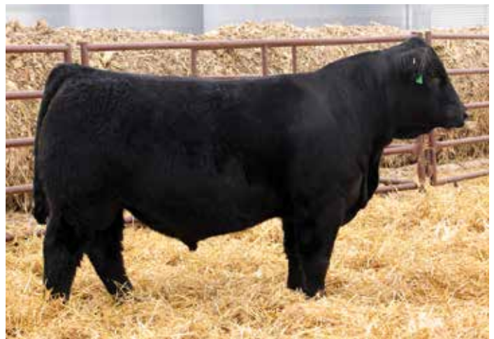
ES STATEMENT GZ33 SERVICE SIRE TO SEVERAL FEMALES SELLING