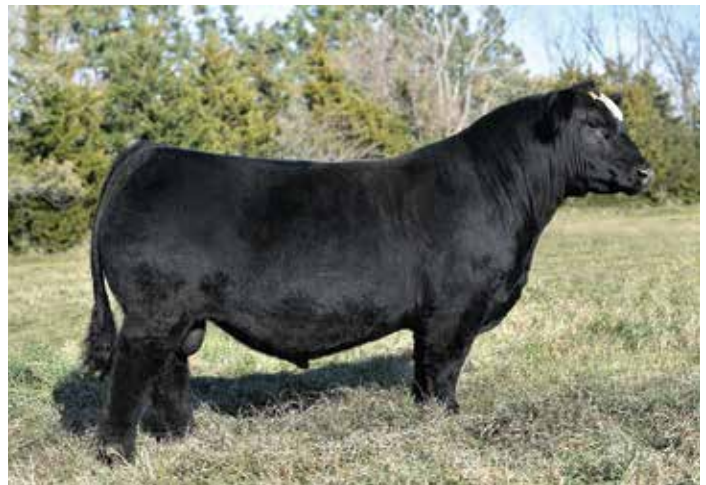
W/C FORT KNOX 609F - $180,000 SIRE OF LOTS 17-20

W/C BANKROLL 811D Adj. BW 83 W/C FORT KNOX 609F Adj. WW 798 K-LER DOLLY'S QUEEN 609D Adj. YW 1427 SS EBONYS MASTERPIECE ADG 4.08 KAPPES SADIE T635 Y302 BW Ratio ET KAPPES SADIE T635 WW Ratio ET PB SM YW Ratio ET