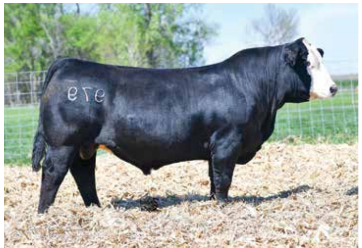
WINC MAHOMES 979G MATERNAL BROTHER TO DAM OF LOT 26