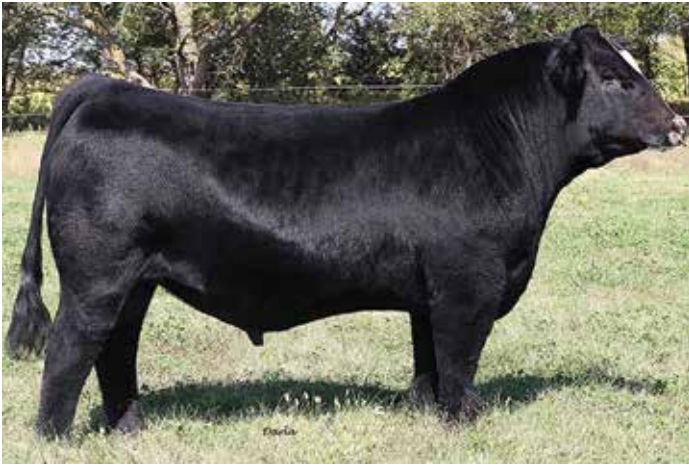
MR CCF 20-20 - SIRE OF LOTS 46-47