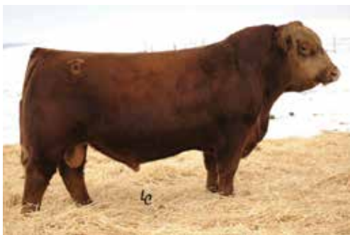
CDI AUTHORITY 77X SIRE OF LOT 25