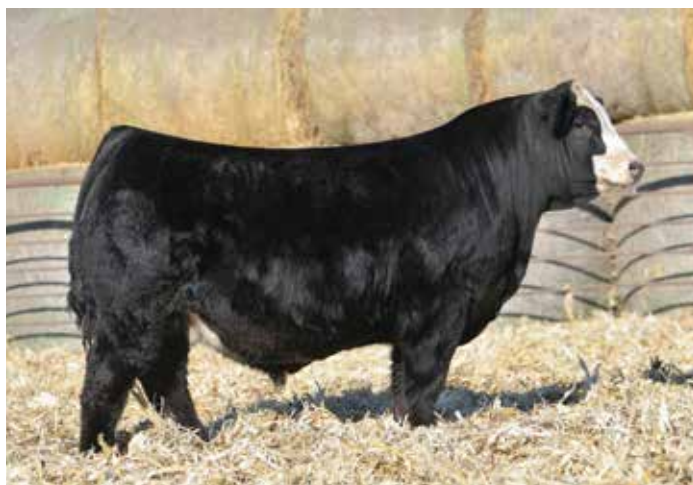
WINC SURELOCK 031H - SON OF LOT 65 HE SELLS AS LOT 2

Purebred Simmental cow who is maternally pedigreed and has aged gracefully, honestly we probably should be keeping her, being bred up early to ES Surelock ZW15! She will have a calf at side on sale day! CONFIRMED SAFE IN CALF TO ES SURELOCK ZW15 (ASA: 2659302). ESTIMATED DUE 2/17/21.