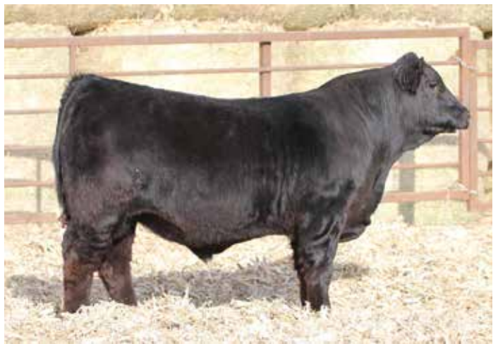
WINC FARMHAND 857F - SIRE OF LOTS 11-15

ES SURELOCK ZW15 Adj. BW 92 WINC FARMHAND 857F Adj. WW 676 KAPPES SADIE T635 Y302 Adj. YW 1385 DJA TANK X142 ADG 4.55 114A BW Ratio 101 WAGNER ELDORENE 227U WW Ratio 90 3/4 SM 1/4 AN YW Ratio 99