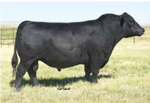
TJ FRANCHISE 451D SIRE OF LOTS 26 - 30