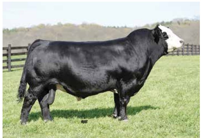
REMINGTON LOCK N LOAD54U INFLUENTIAL PATERNAL GRANDSIRE OF LOTS 1-20