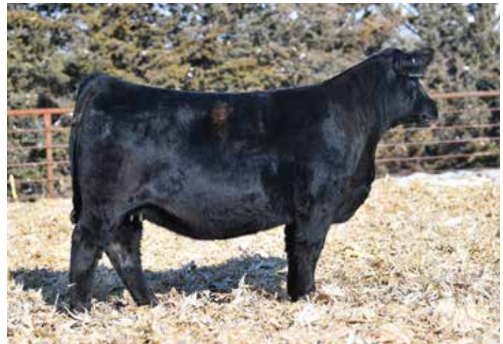
CKCC BOBBI KRISTINA 8827F ET - DAM OF LOT 53

This E111 son ranks in the top 4% for YW and ADG, 10% for WW, and 15% for TI. He is from the Profit sister to Bobbi for an added advantage for your breeding program. Maternal function and consistency can never be denied!