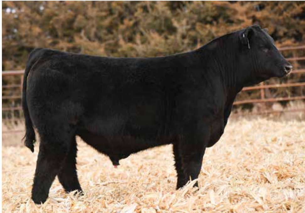
LOT 60 - CKCC MR HIGH CALIBRE 0673H