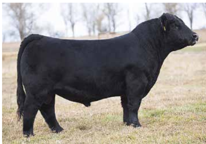
PROFIT - SIRE OF LOTS 101 - 108

9735G is a stunning Profit sired daughter of 54Z2. Angular and smooth about her front end, robust in her rib cage, and square in her basic build. She sells with an estimated due date of 4/27/21 to the P.E. sire SWC First Choice 845F (ASA: 3542824) 6/16/20 to 8/21/20. She was AI bred to MR CCF 20-20 (ASA: 3964446) 6/11/20.