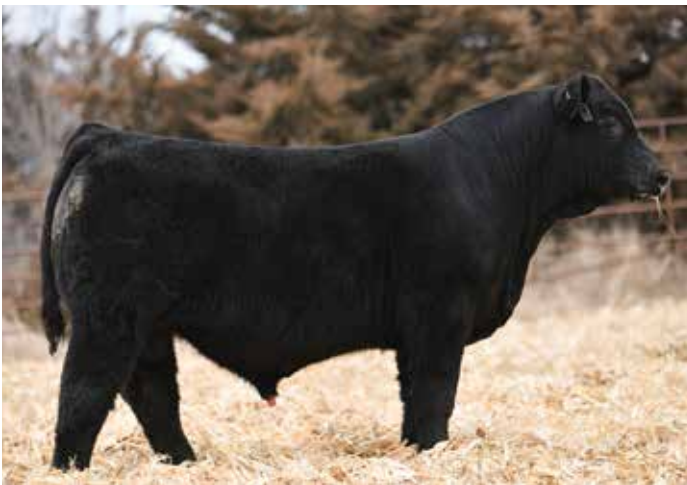
LOT 13 - WAGR MR PROFIT 0055H

This is another Profit influenced by an Eclipse bred dam. A stout featured homozygous black and homozygous polled bull that should sire the right kind of stock to perform in whatever phase of production one wishes to enhance. We cannot discuss hoof quality and athleticism enough when you set out to replace your older bulls, so make sure one such as 0058H is on your list.