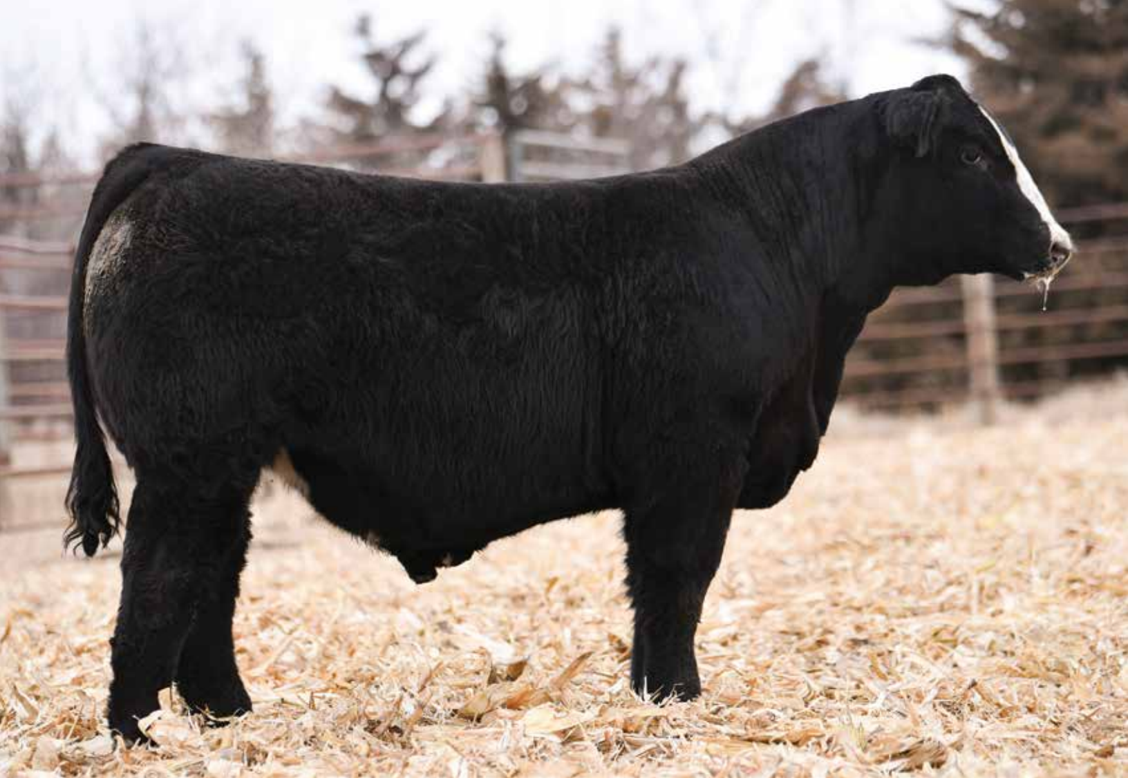
LOT 20 - CKCC LD MR HAMMER 0901H ET

Here's a trio of Hammer sons from an incredible SimAngus, Profit sired dam that is a surefire generator! One of her daughters would have been a $25,000 sale feature in Hartman's female sale as well as countless high selling steers and other females alike for Doris Cattle. These three brothers are very uniform in build and kind. So, if you are a SimGenetic breeder wanting to enhance extra features without sacrificing shape, growth, or skeletal integrity, then these would be of serious consideration for just that. The dam factor is enough to make one very intrigued by the opportunity itself, so take some serious time to evaluate and for the commercial cattlemen with a need for several bulls, strongly consider tying these three together and make your neighbors want to cut the fence to share in what lies ahead.