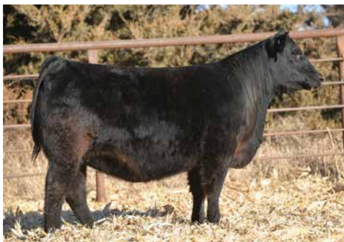
LOT 136 - CKCC PAY POWDER 9604G

This female sells without a set of registration papers, yet she offers the powerful influence E111. A perfect candidate to mate a variety of different ways. It will be a perfect day on her estimated due date of 4/28/21 when she calves to SWC First Choice 854F (ASA: 3542824).