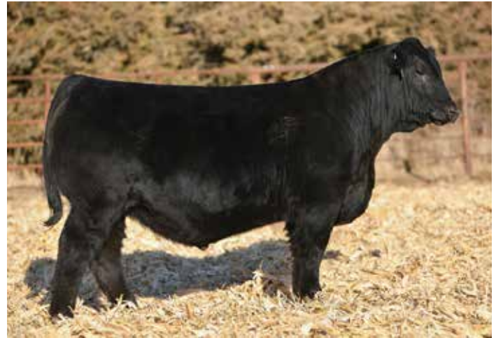
LOT 38 - WAGR MR RIGHT TIME 6009 0042H

Here is a deep, bold centered, loose built stud that charts the top 15% rank for WW and YW. He is from a 1682 sired dam with the influence of the predictable Eclipse.