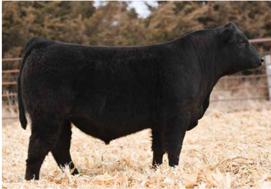
LOT 51 - CKCC MR SOLUTION 0682H