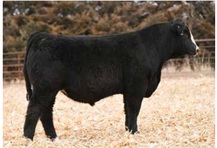
LOT 30 - KTE FRKG MR RIGHT TIME 001H ET