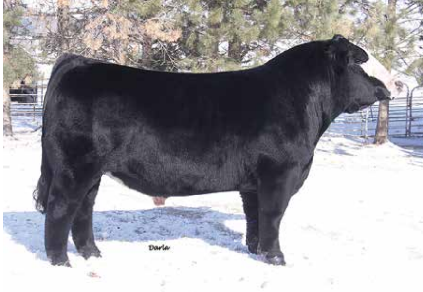
MR HOC BROKER MATERNAL GRANDSIRE OF SEVERAL LOTS SELLING