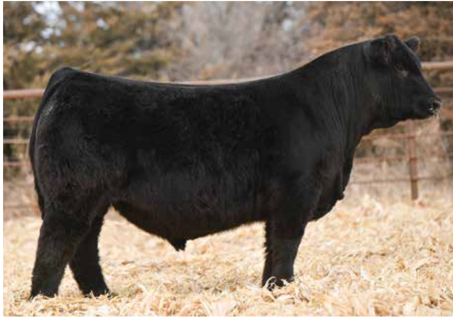
LOT 53 - FRKG CKCC MR SOLUTION 004H