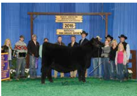
J6RA BADA BING MATERNAL SISTER TO LOT 113