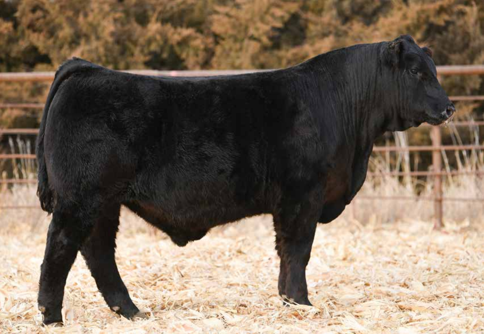
LOT 63 - TMAS CKCC HIGH CALIBRE 0658H