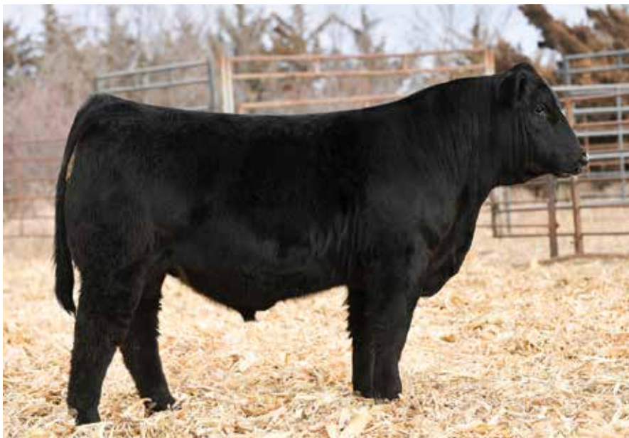
LOT 62 - WAGR HANNITY 0040H ET

Here is a snip nosed, long bodied, smooth, and square ended son of High Calibre. 0040H is from the very productive WAGR Lullaby 703T donor. He possesses the added substance of bone and foot necessary to leave behind a functional set of daughters.