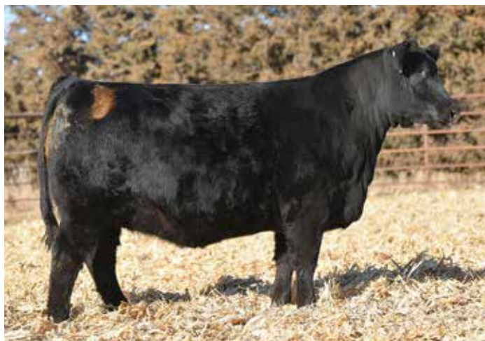
LOT 128 - CKCC MS EMBRANCE 9512G

TMS MS Terri 9749G is a powerful Purebred that offers a look of presence and style. Her basic build possesses significant skeletal integrity. She is estimated to calve on 4/27/21 to TT Gritt 694G (ASA: 3614416) with P.E. dates of 6/12/20 to 8/21/20.