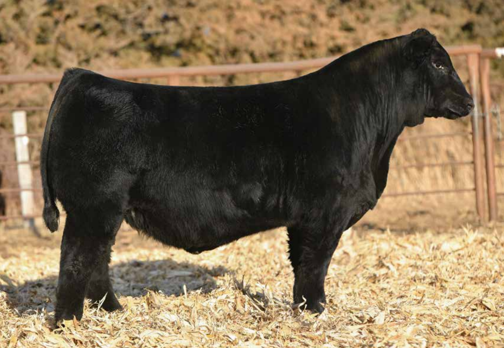
LOT 43 - CKCC MR CURRENCY 0631H ET