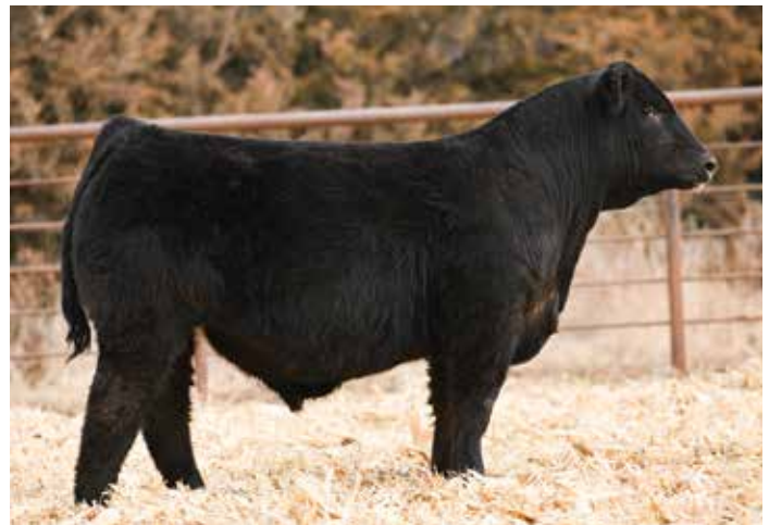
LOT 23 - CKCC LD MR 20-20 0905H ET

The 20-20 sired stud from the prolific and multi useful 615. He may be the best of the four direct sons of 615, but we will leave that for you to decide. He is a well-designed, attractive herd sire prospect with a big, stout, square end in him that is accompanied by plenty of body and center rib dimension.