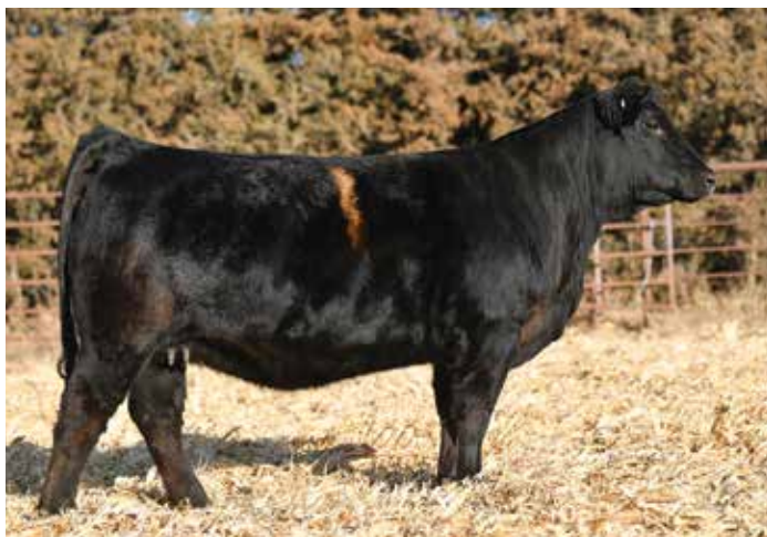
LOT 130 - WAGR MS TURNPIKE 9059G

A direct daughter of CCR Frontier with a moderate, deep, dense look. She is a rancher type female for certain. She sells with an estimated due date of 3/26/21 to Musgrave Crackerjack (AAA: 19202253) A.I. bred on 6/11/20. She was P.E. as well to TT Gritt 694G (3614416) from 6/12/20 to 8/21/20.