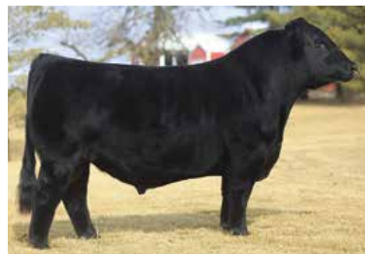
CDI INNOVATOR 325D SIRE OF LOTS 116 - 120