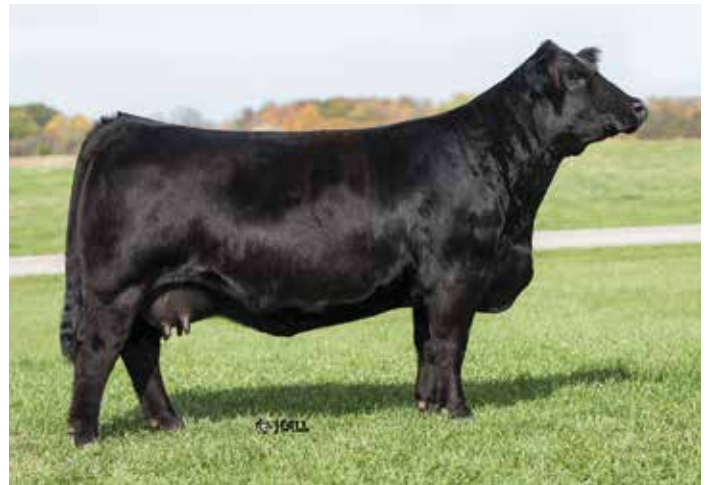
HF SERENA - DAM OF LOTS 17 & 18