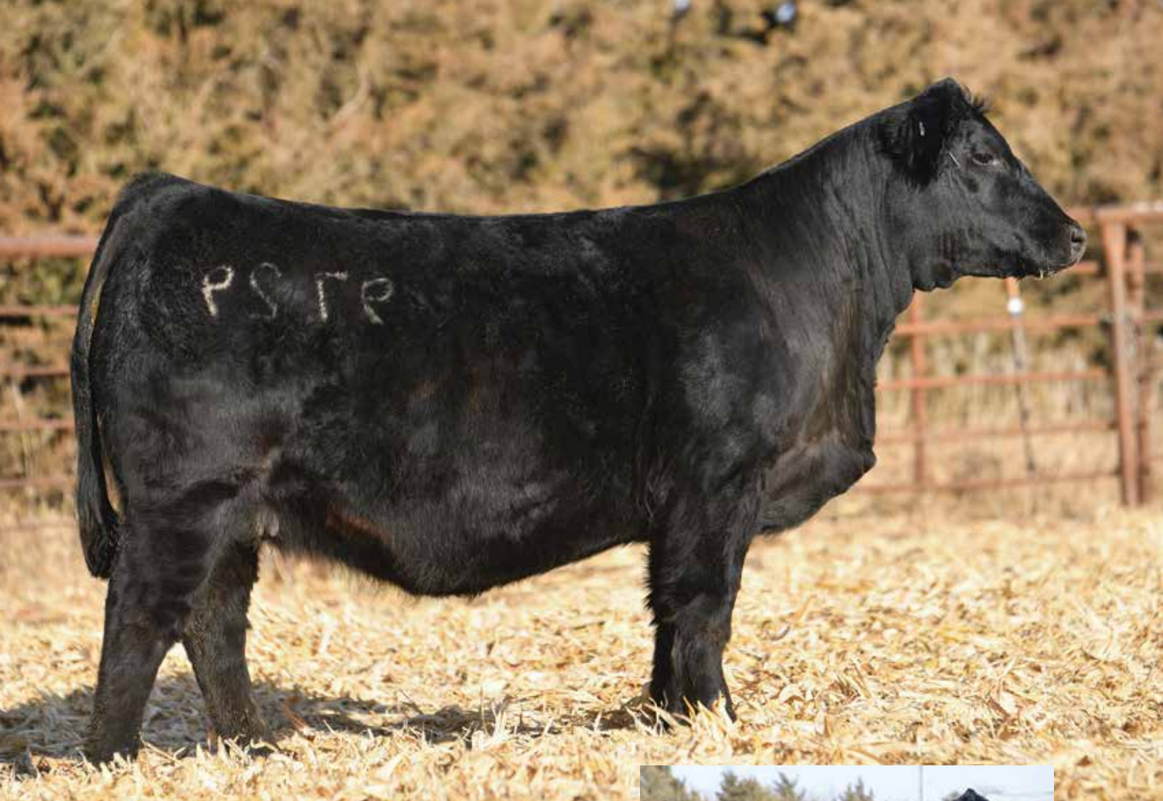
LOT 101 - CKCC MS PROFIT 9729G ET