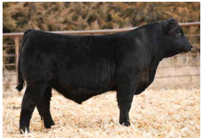
LOT 32 - CKCC MR RIGHT TIME 0662H

SimGenetics at work with a double shot of the Right Times from both sides of the SimAngus equations. The Angus, Right Time, sired dam of this stud is a very productive female that's a member of our donor lineup as well. We'll keep it simple here and just tell you that this creature is really good.