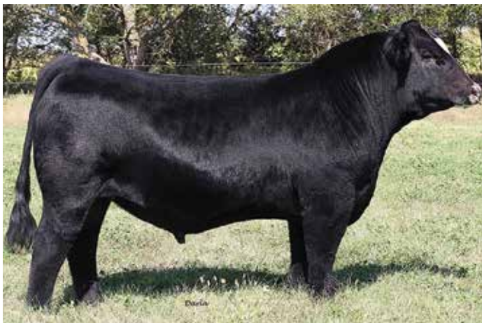
MR CCF 20-20