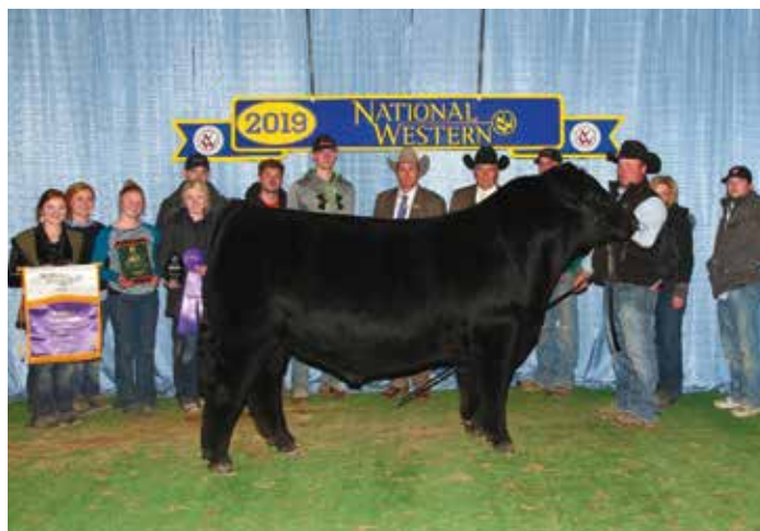
CKCC EDGE 7692E - SIRE OF LOT 44 & 45