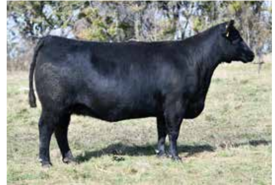
MS TR PANDORA 2770Z MATERNAL GRANDDAM OF LOTS 6 & 7