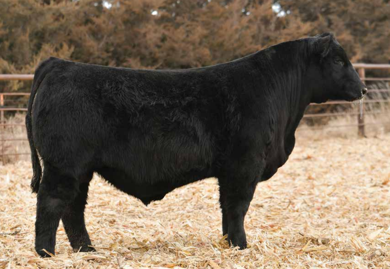
LOT 42 - CKCC MR CURRENCY 0625H ET