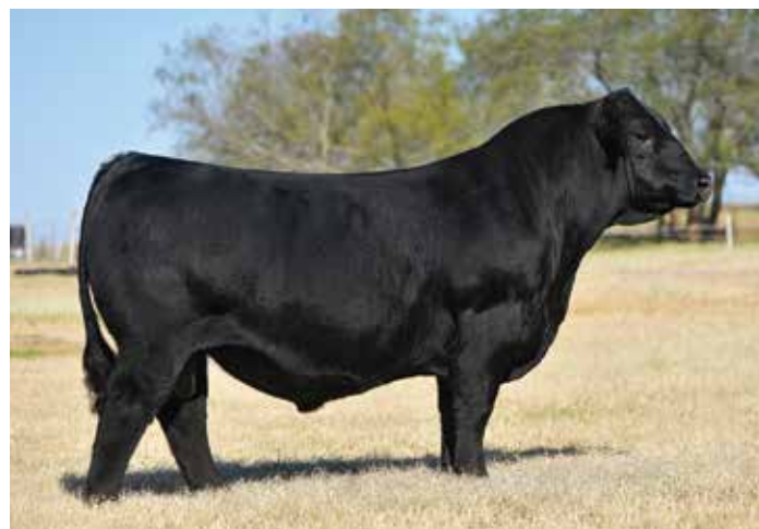
ES RIGHT TIME FA110-4 - SIRE OF LOT 29 - 41