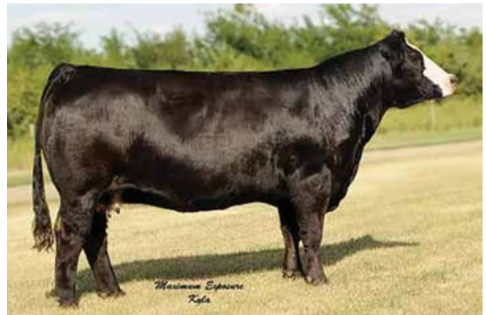
3C MELODY M668 BZ - MATERNAL GRANDDAM OF LOT 123

This female is influenced by the maternal prowess of the Broker x Melody blend on the bottom as indicated by the stout build, deep, dense body design. She should calve 4/13/21 to TT Gritt 694G (ASA: 3614416) with P.E. dates of 6/12/20 to 8/21/20. She too was A.I. serviced on 6/11/20 to Musgrave Stunner 316 (AAA: 18467508).