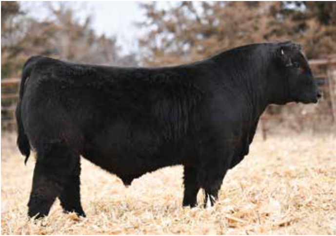
LOT 8 - ECC CKCC MR PROFIT 0900H