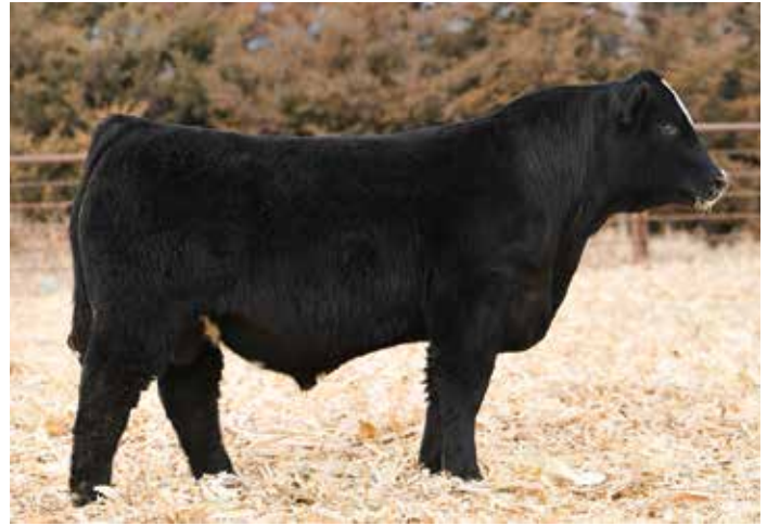
LOT 21 - CKCC LD MR HAMMER 0907H ET