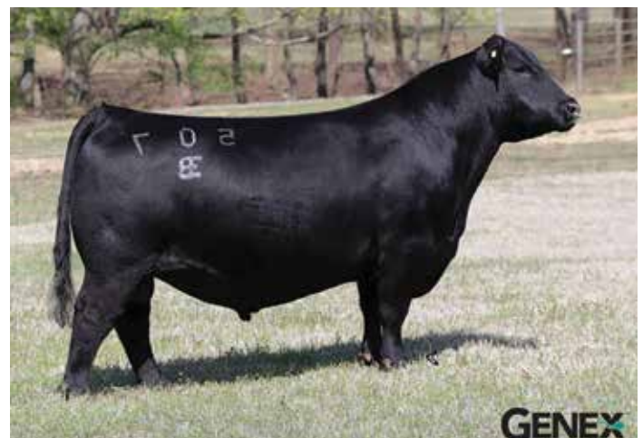
E&B CONFEDERATE 507 - SIRE OF LOT 50