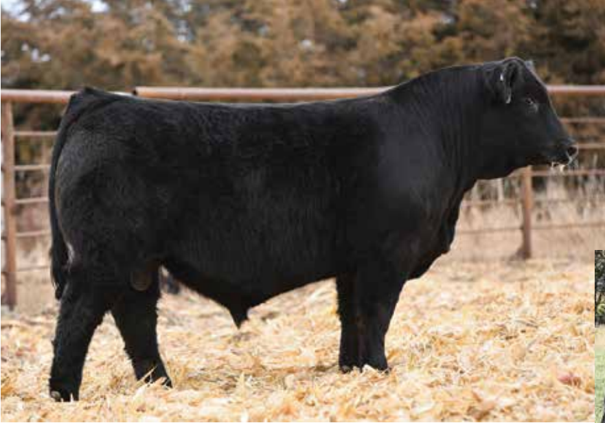
LOT 2 - FRKG CKCC MR 20-20 008H ET