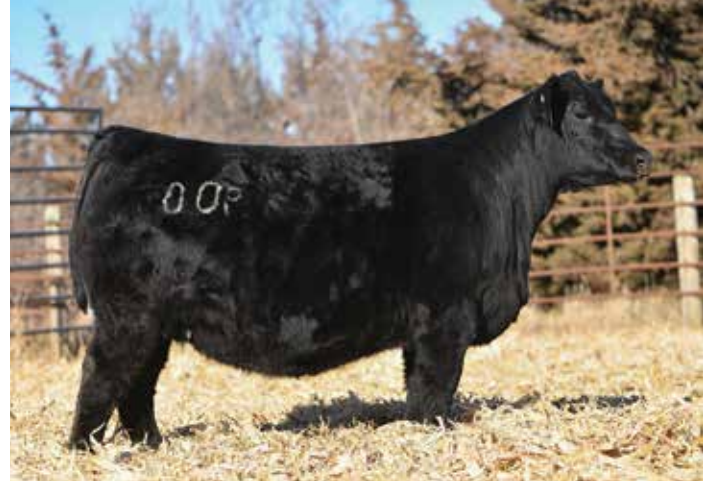
LOT 121 - WAGR MS DAKOTA 9005G