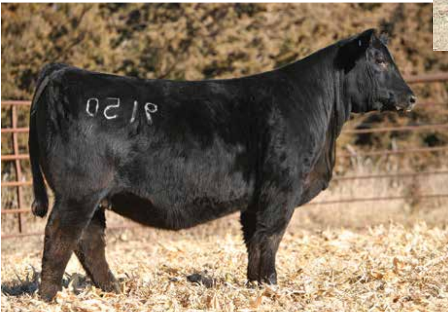
LOT 140 - WAGR MS ENOUGH SAID 9150G

139 WAGR MS ENOUGH SAID 9125G BD: 4/29/19 PB SM REG: 3679811 TATT00: 9125G