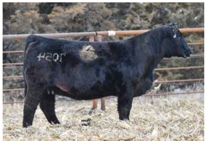
WAGR MS PROFIT 7054E FULL SISTER TO LOT 11 AND DAM OF LOTS 1 - 3