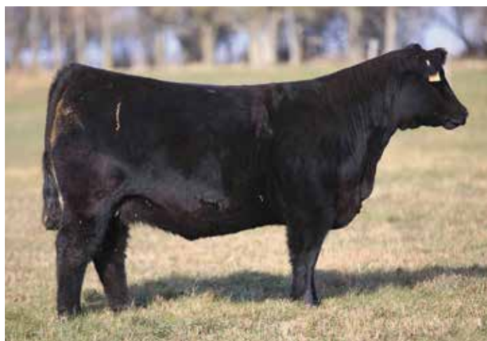
CKCC LD MS WARDS PROFIT 615D - DAM OF LOT 112

In the bull division there would be some maternal brothers to this female and just like the boys, this girl is substantial in terms of quality and kind! This stout made big bodied brood cow matriarch is set on a tremendous foundation in regard to foot and bone. This is one 3/4 female that does not need missed on sale day in Highmore. The dam of this female, CKCC LD Ms Wards Profit 615D, has solidified her spot as one of the top generating females in the business. She sells safe in calf to Brilliance Daddy (Brilliance x Daddy's Money x Whiskey) with an April 1, 2021 estimated due date.