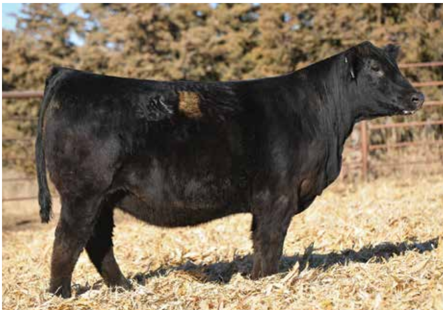
LOT 142 - WAGR MS ENOUGH SAID 9107G

This moderate framed, deep sided female is supported by Dream On, Melody, and the influential Angus sire, Grid Maker. She should calve approximately on 3/25/21 to R5 Solution E111 (ASA: 3631982) with P.E. from 6/6/20 to 8/1/20.