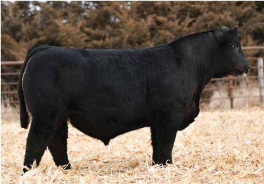
LOT 56 - WAGR MR PAYWEIGHT 0049H