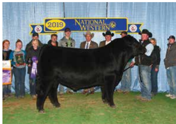
CKCC EDGE 7692E MATERNAL BROTHER TO LOTS 101 & 102

101 CKCC MS PROFIT 9729G ET BD: 3/30/19 REG: 3631954 TATT00: 9729G