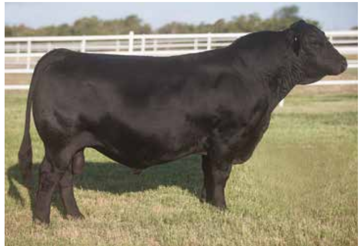
HOC DAKOTA 111D - SIRE OF LOT 121

This homozygous black and homozygous polled Innovator daughter is easy fleshing, bold ribbed, and sound built. She will calve approximately on 4/5/21 to R5 Solution E111 (ASA#3631982) P.E. dates of 6/12/20 to 8/21/20.