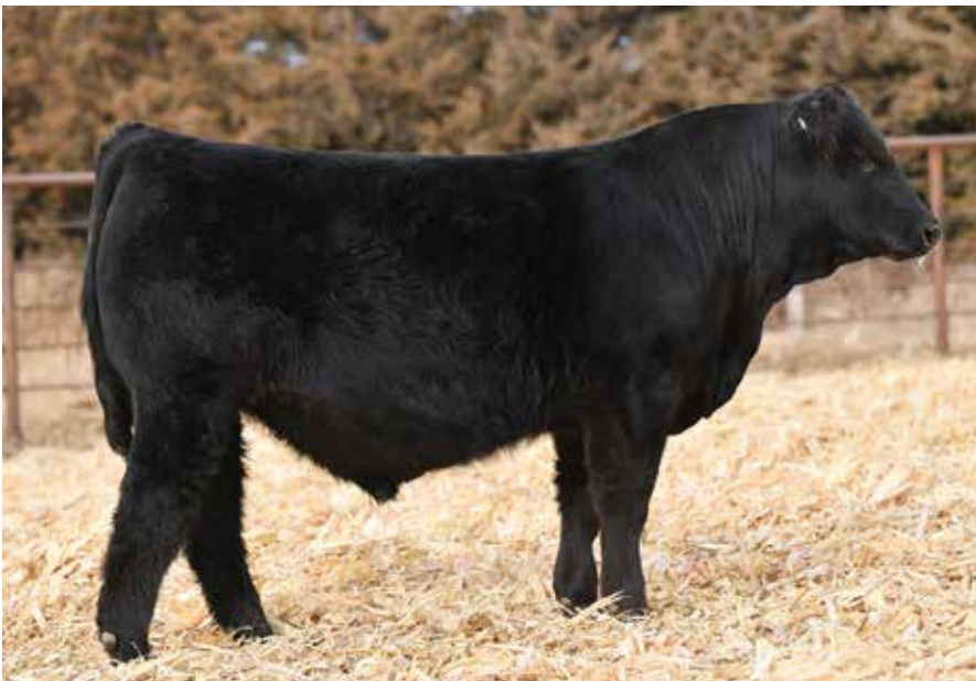
LOT 7 - TMAS CKCC PROFIT 0680H