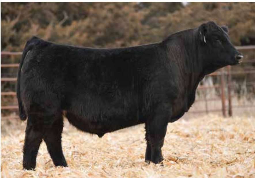
LOT 57 - WAGR MR TURNING POINT 0003H