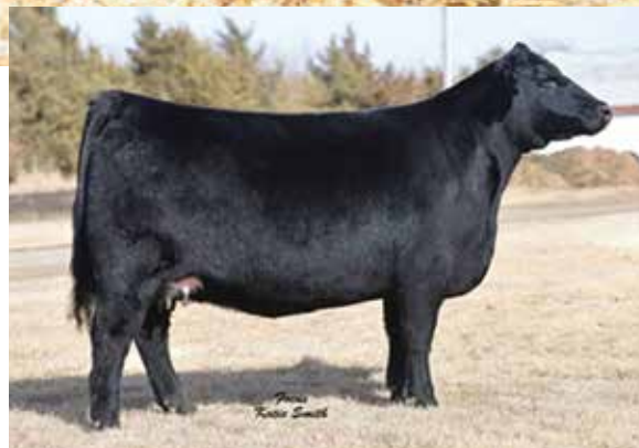
FSC2 BELLA - DAM OF LOT 101 & 102