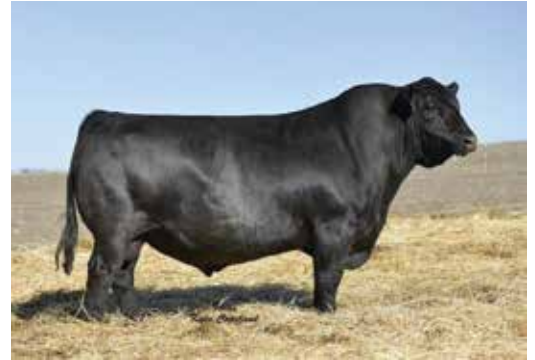
BASIN PAYWEIGHT 1682 SIRE OF LOT 56