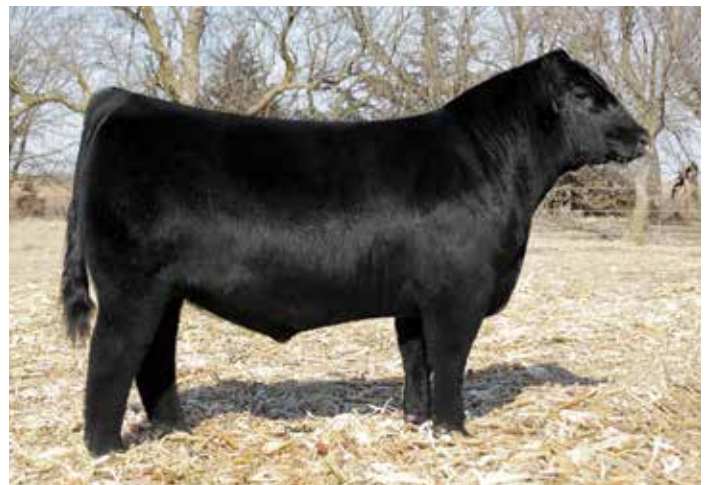
KMJ REVENUE - SIRE OF LOT 19

This direct son of Revenue is from one of two popular and potent Angus cow families in the TR program up the road in Harrold. The Rosie descendants have been only rivaled by the daughters from the prolific 3208N. He is certainly a deep sided, square ended, good back shaped individual with awesome feet and legs. His agility is like none other to further insure your curiosity come sale day.