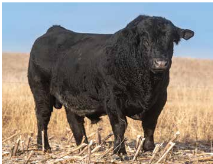
OUTLAW - SIRE OF LOTS 67 - 70