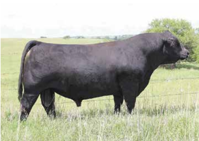
WS PILGRIM H182U PATERNAL GRANDISRE OF LOTS 4 - 17