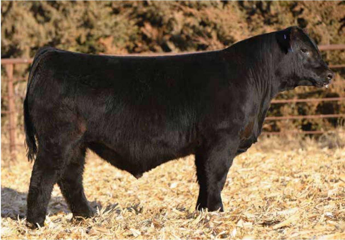
LOT 4 - KTE MR PROFIT 0668H ET

The pair of brothers from the 2018 AJSA Percentage Champion Female by the senior stud, Profit! If you like your stock with extra length, smoothness, and something that will weigh, don't let the fact that their dam was a show heifer stand in the way of your better judgement. Their dam has withstood the pressure and the environment and is the kind that definitely out produces herself in every aspect of production. She is an absolute calf raising beast that leaves nothing and no one to question her ability. Look them over but don't overlook them and miss the boat. Pounds pay!