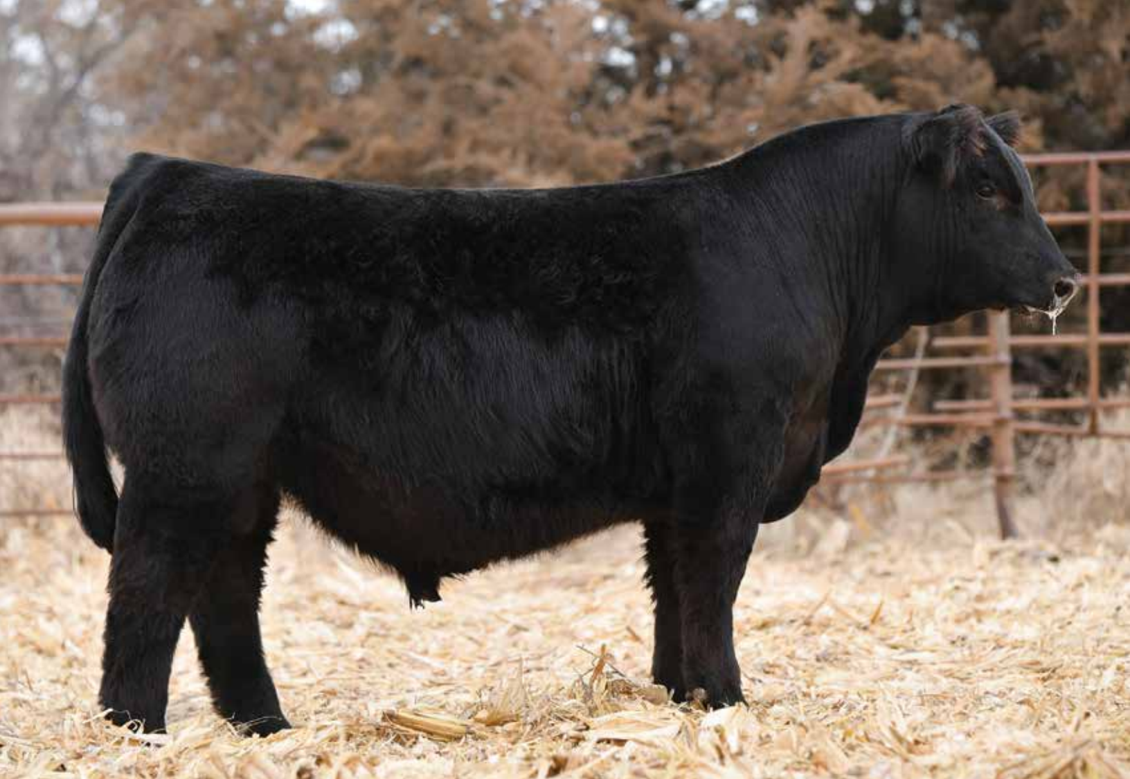
LOT 44 - WAGR MR EDGE 0034H

WAGR MR Edge 0034H is a performance standout and the lead-off son of Edge. 0034H is massive through the center portion of his body, bold in his shape, and stout from every angle. His dam is a standout daughter of Earthquake that never misses. With the influence of Earthquake, you can count on superior udder quality, structural integrity, and fleshing ease. A homozygous black and homozygous polled Purebred herd sire prospect that is worthy of strong consideration on sale day!