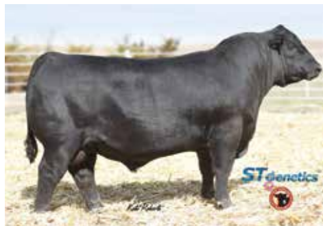
MUSGRAVE CRACKERJACK SERVICE SIRE TO LOT 129

9059G is a long-sided Turnpike sired female with longevity built in. She will calve approximately on 3/23/21 to R5 Solution E111 (ASA: 3631982).