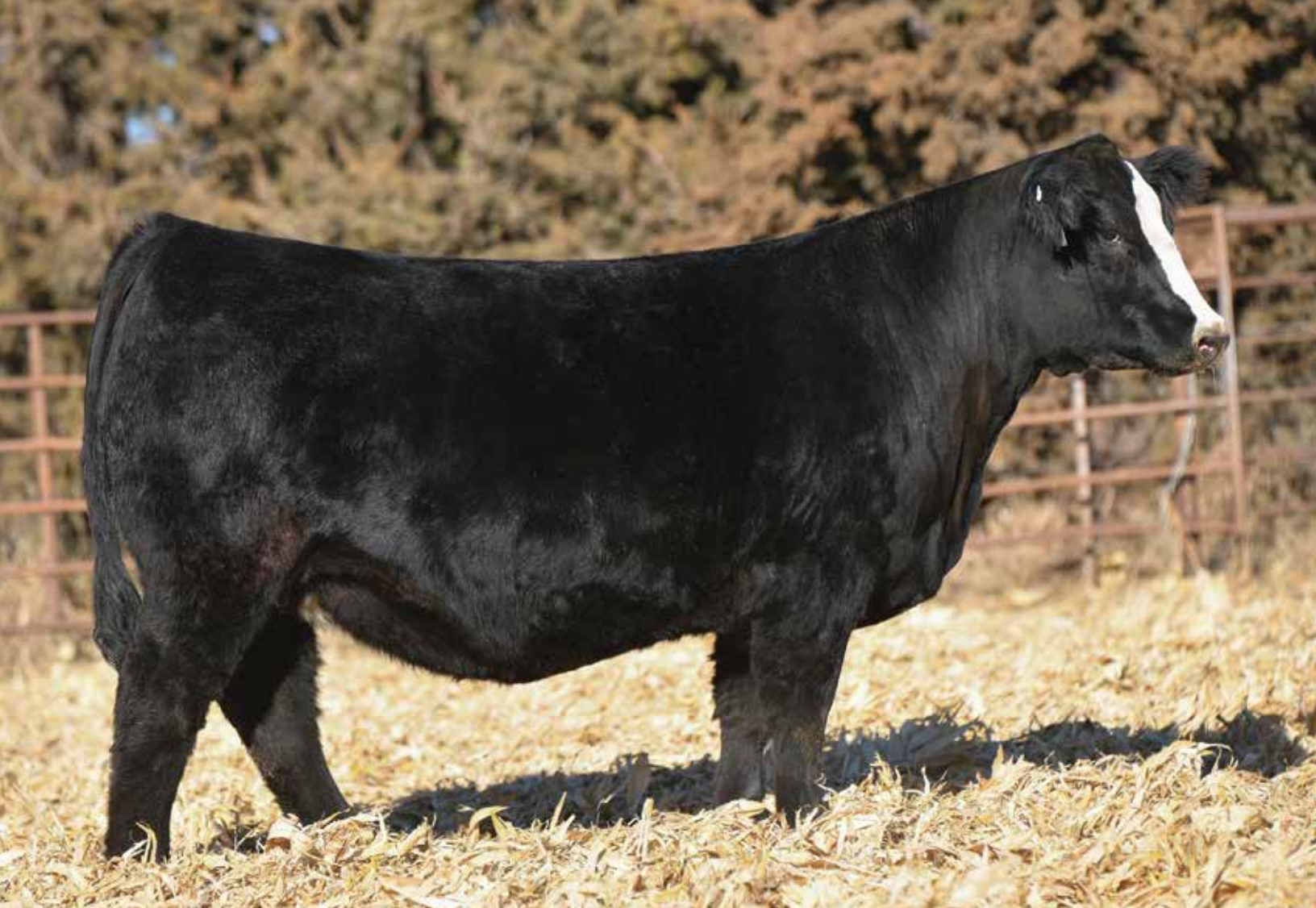
LOT 109 - CKCC MS CURRENCY 9696G