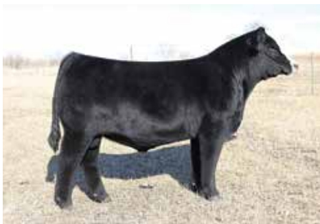
MR TR HAMMER 308A ET SIRE OF LOT 113