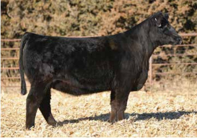
LOT 119 - WAGR MS INNOVATOR 9033G