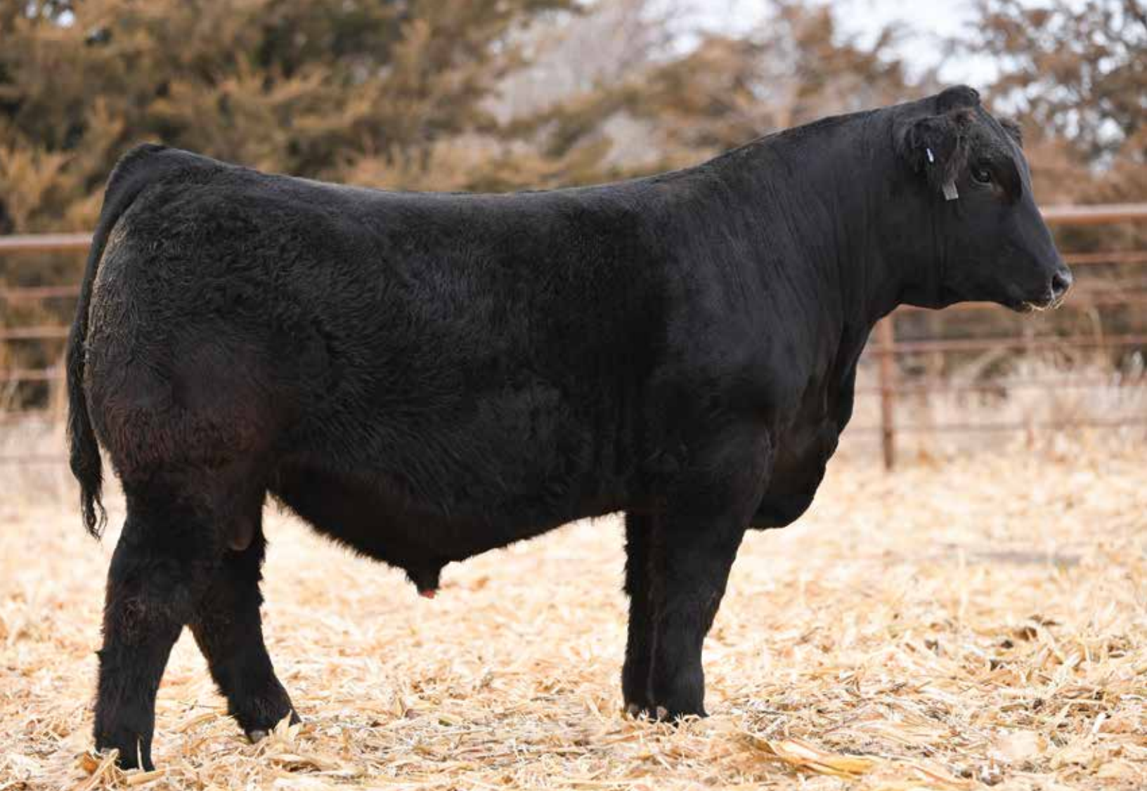
LOT 11 - WAGR MR PROFIT 0082H

Here would be the full brother to the dam of the trio of lead off bulls in the catalog for the offering. Big sister set the stage for you to take notice in a stud that would work for any discriminating breeder or to be a substantial asset to a progressive commercial outfit that may focus on the cow herd and marketing of high-end replacements. He definitely has the credentials and type that deserve notice on sale day, a simple must see.