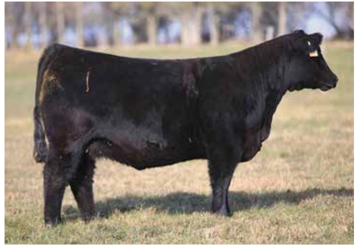
CKCC LD MS WARDS PROFIT 615D DAM OF LOTS 20 - 23