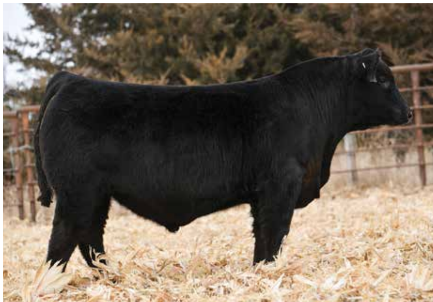
LOT 52 - WAGR MR SOLUTION 0026H

This quarter-blood SimGenetic stud comes to you in a deep, long bodied, bigger outlined, smooth built performance enhanced package with a top 1% rank for YW and ADG, along with a 2% ranking for WW and TI, to be complimented by a 10% chart for marbling.