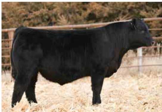
LOT 33 - TMAS CKCC RIGHT TIME 0690H