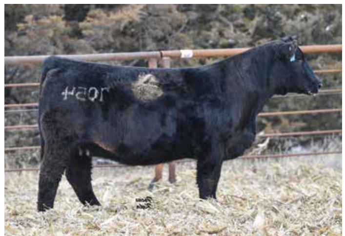
WAGR MS PROFIT 7054E DAM OF LOTS 1-3 AND FULL SISTER TO LOT 11