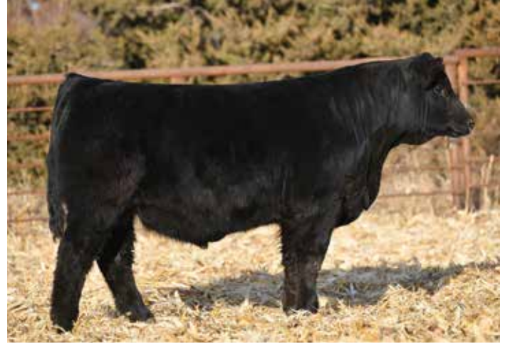
LOT 48 - TMAS CKCC INTEL 8700 0648H