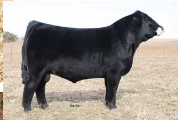
SFI ENOUGH SAID D3 - SIRE OF LOTS 139 - 146