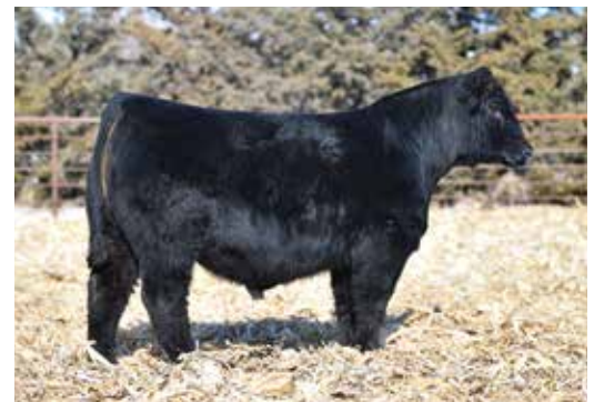
TMAS CKCC REMINGTON 9653G MATERNAL BROTHER TO LOT 7