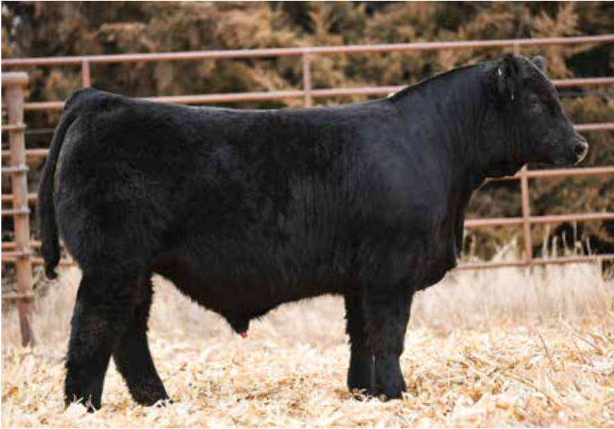
LOT 6 - TMAS CKCC PROFIT 0663H