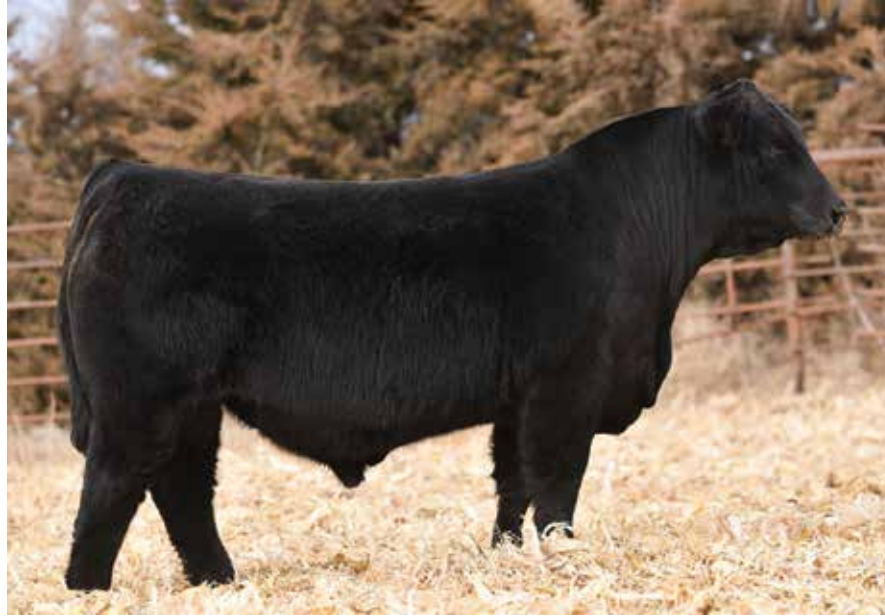
LOT 61 - TMAS CKCC HIGH CALIBRE 0671H