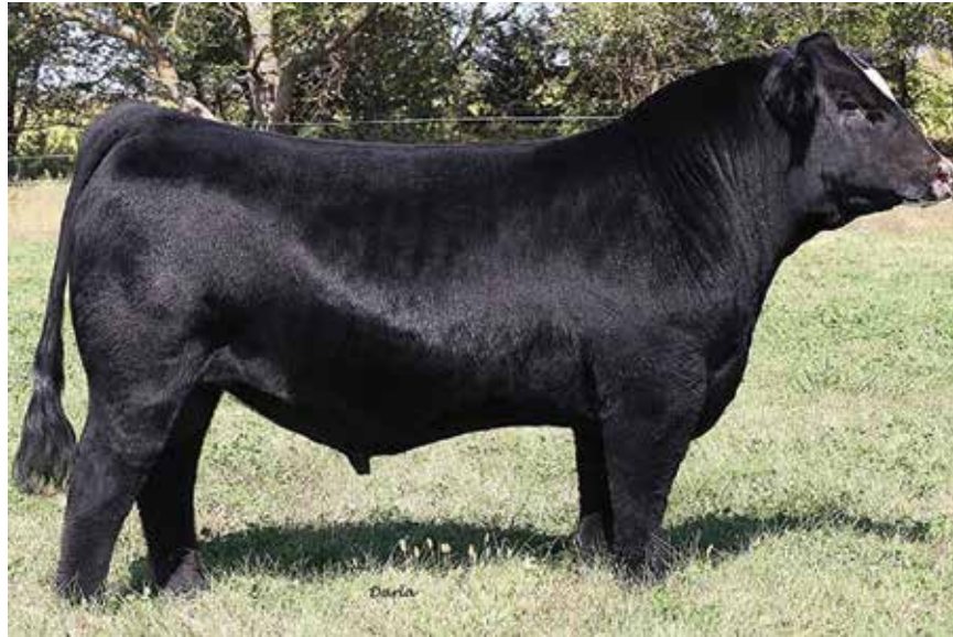
MR CCF 20-20 - SIRE OF LOTS 23 - 26