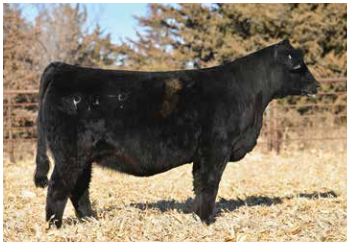
LOT 125 - TMS MS TERRI 9749G