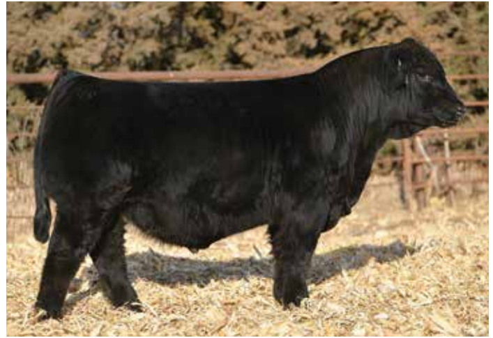
LOT 17 - CKCC SERENA`S CASH 0813H ET