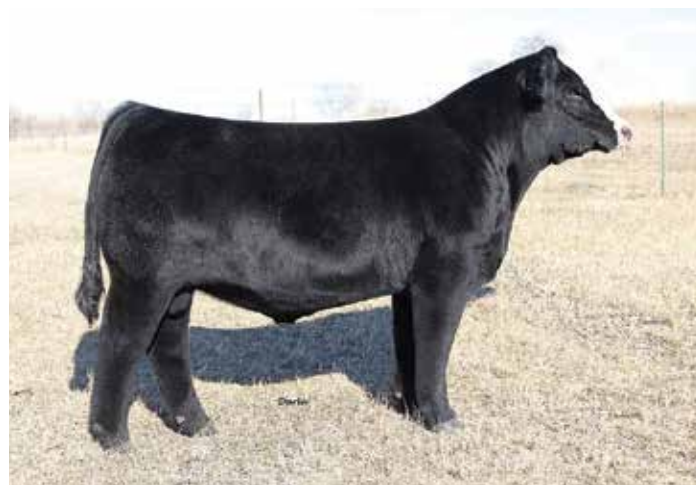
MR TR HAMMER 308A ET PATERNAL GRANDSIRE OF LOT 28

A deep, square built SimAngus stud that is from an awesome Frontman influenced, Dikoff bred Angus dam. He should be acceptable to sample on heifers. 0628H was a twin, take this into consideration when evaluating his performance data.