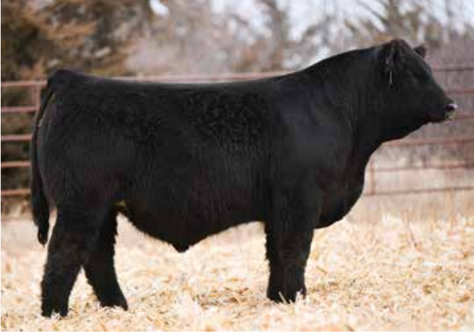
LOT 46 - TMAS CKCC EDGE 0646H