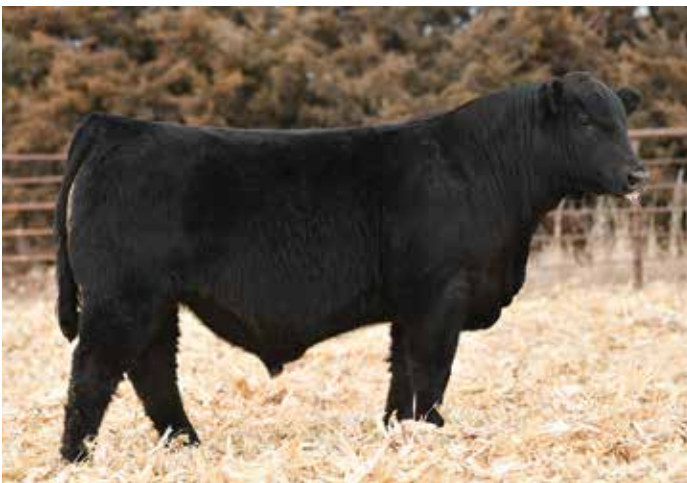
LOT 14 - WAGR MR PROFIT 0057H

0055H is a homozygous black and homozygous polled herd sire prospect that is backed by some of the breeds oldest and most proven genetics. He is from a dam that hosts both ABS vintage sires, Goldmine and Ranch Hand. The influence of those two sires is known for longevity and leaving daughters that are significant in production while remaining in the herd for years on end. He has the length and shape necessary to add pounds to your next calf crop.