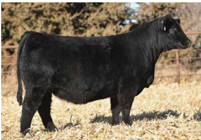
LOT 114 - CKCC LD GORGIA 936G