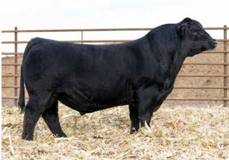
OMF EPIC E27 - SERVICE SIRE TO LOT 144