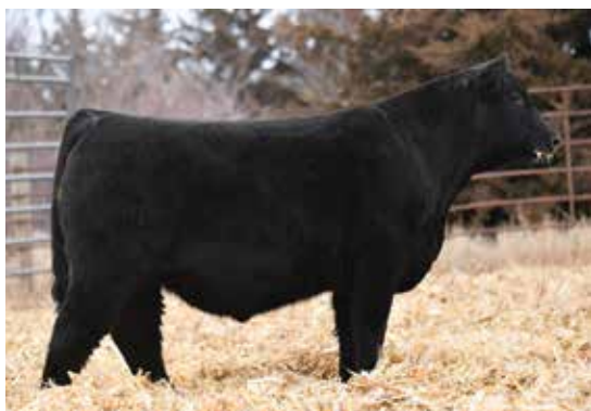
LOT 37 - CKCC RIGHT TIME 0640H

This bulls High Calibre dam entered our donor pen this year and rightfully so. A purebred stud that ranks in the top 25% of the breed for Payweight, YW, and API, with the important TI rank of 20%. He is deep and smooth, yet shapely in his muscle pattern. We are certain he is one for your consideration on sale day!