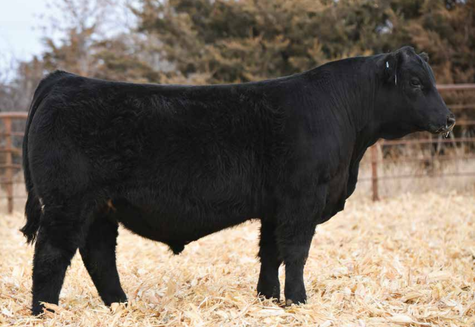
LOT 69 - WAGR MR OUTLAW 0085H

Here would be one of the younger studs in the offering, but he does not come up short on weight or performance. The Final Answer influence with the Chamberlain x Melody accent on the bottom side to enhance the proven Outlaw herd sire. Generations upon generations of individuals that have made an impact line his pedigree.