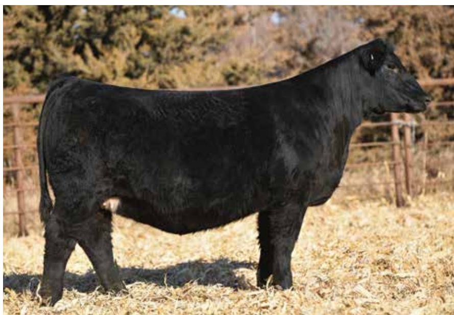
LOT 118 - WAGR MS INNOVATOR 9689G