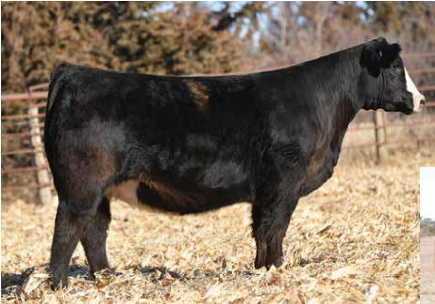
LOT 139 - WAGR MS ENOUGH SAID 9125G