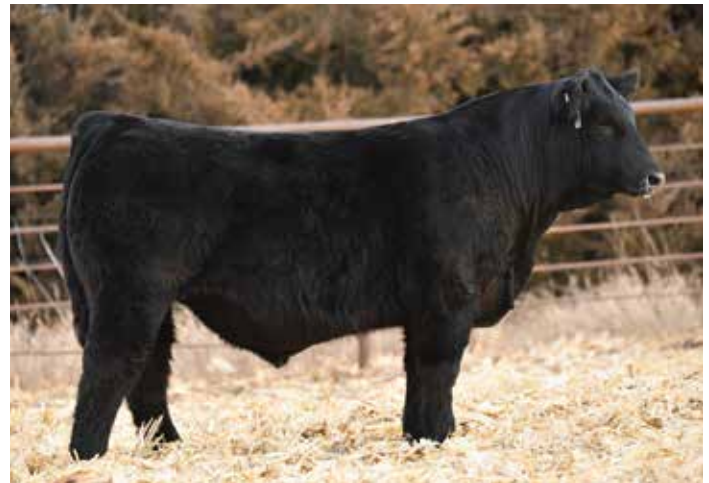
LOT 39 - CKCC MR RIGHT TIME 0664H

0664H is another Purebred son of Right Time with an Outlaw x Chamberlain bred dam. His lineage leaves no doubt about where the look and shape is derived from. He is a performance oriented, product driven herd bull.