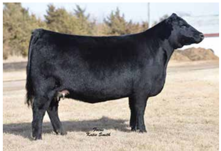
FSC2 BELLA - DAM OF LOTS 42 & 43