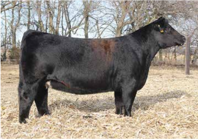
WAGR PANARAMA 204Z PATERNAL GRANDDAM OF LOT 12