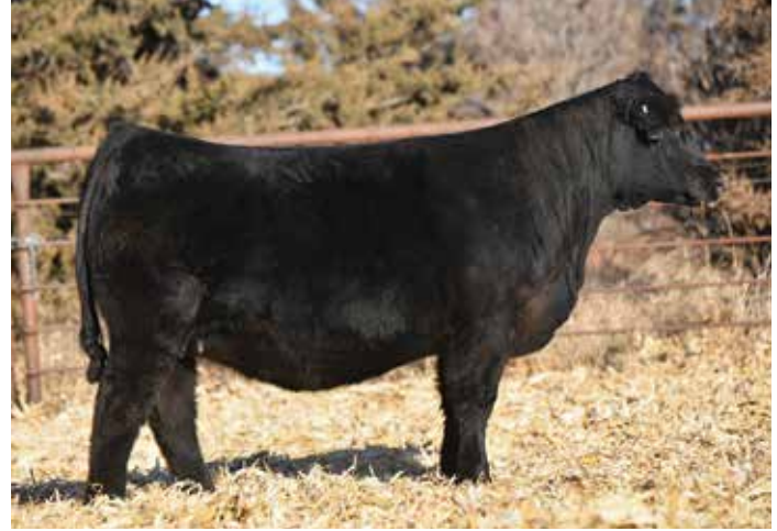
LOT 124 - TMAS MS KATINKA KAY 9741G