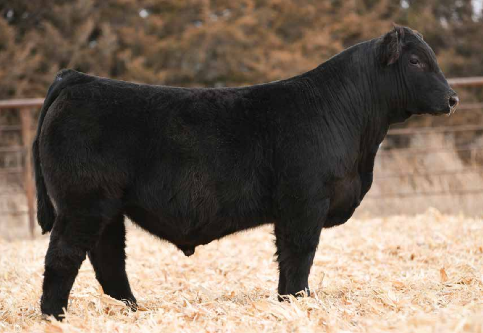
LOT 15 - PTC CKCC MR. PROFIT 0908H