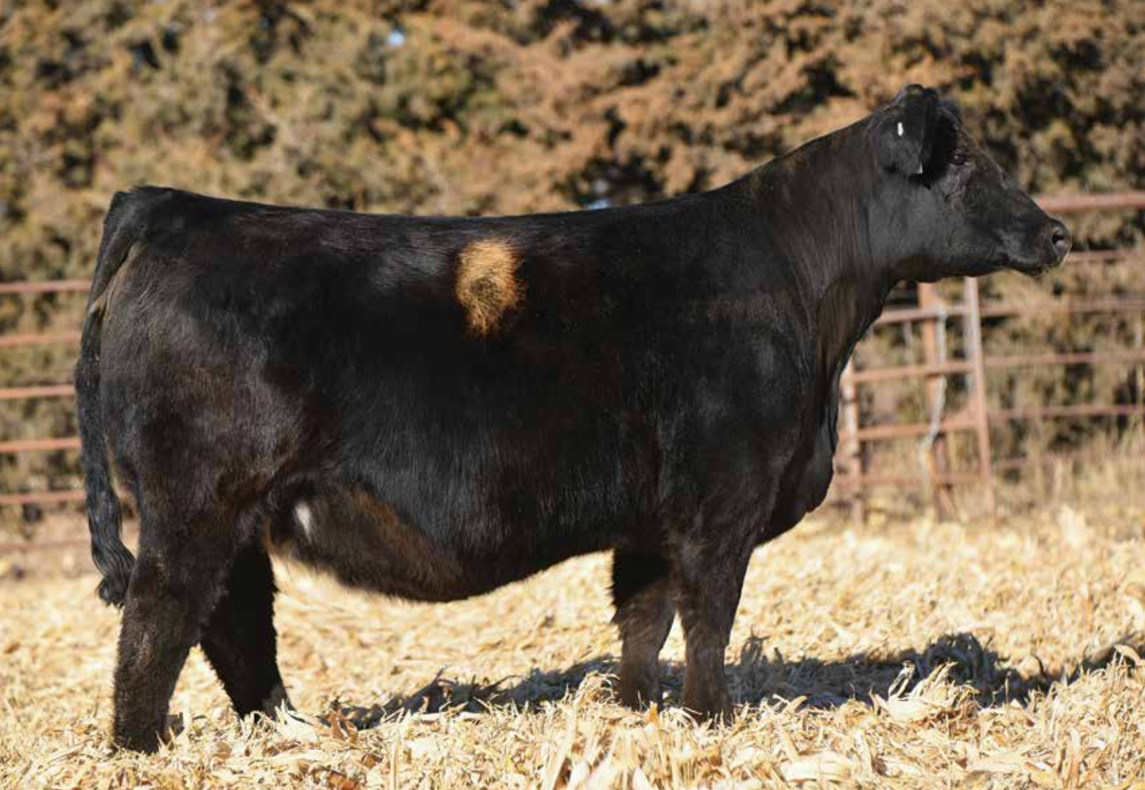
LOT 116 - WAGR MS INNOVATOR 9026G