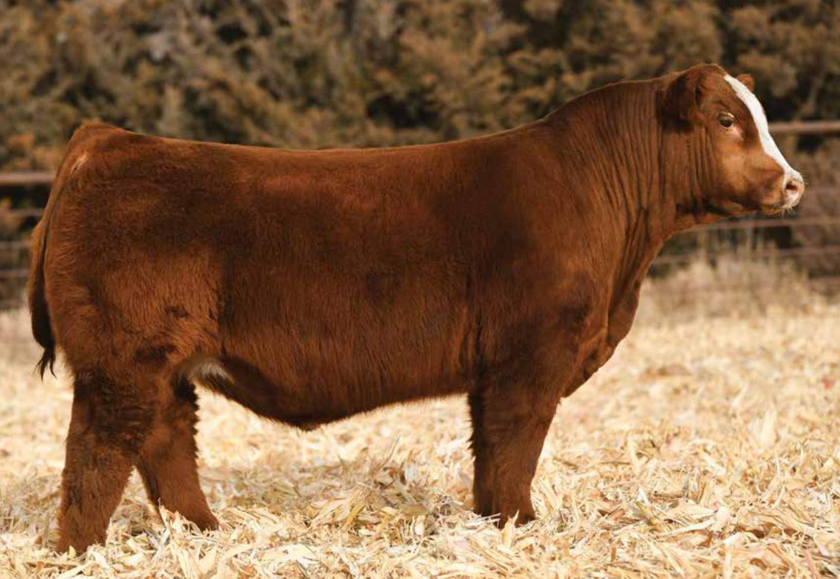
LOT 70 - WAGR MR OUTLAW 0076H