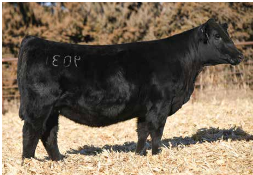
LOT 117 - WAGR MS INNOVATOR 9031G