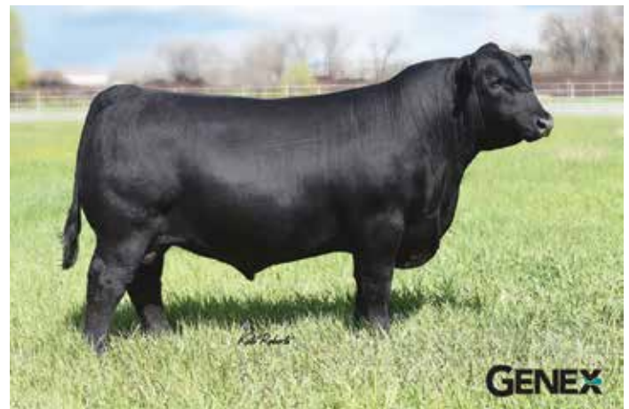
MUSGRAVE STUNNER 360

SERVICE SIRE TO MANY OF THE BRED FEMALES