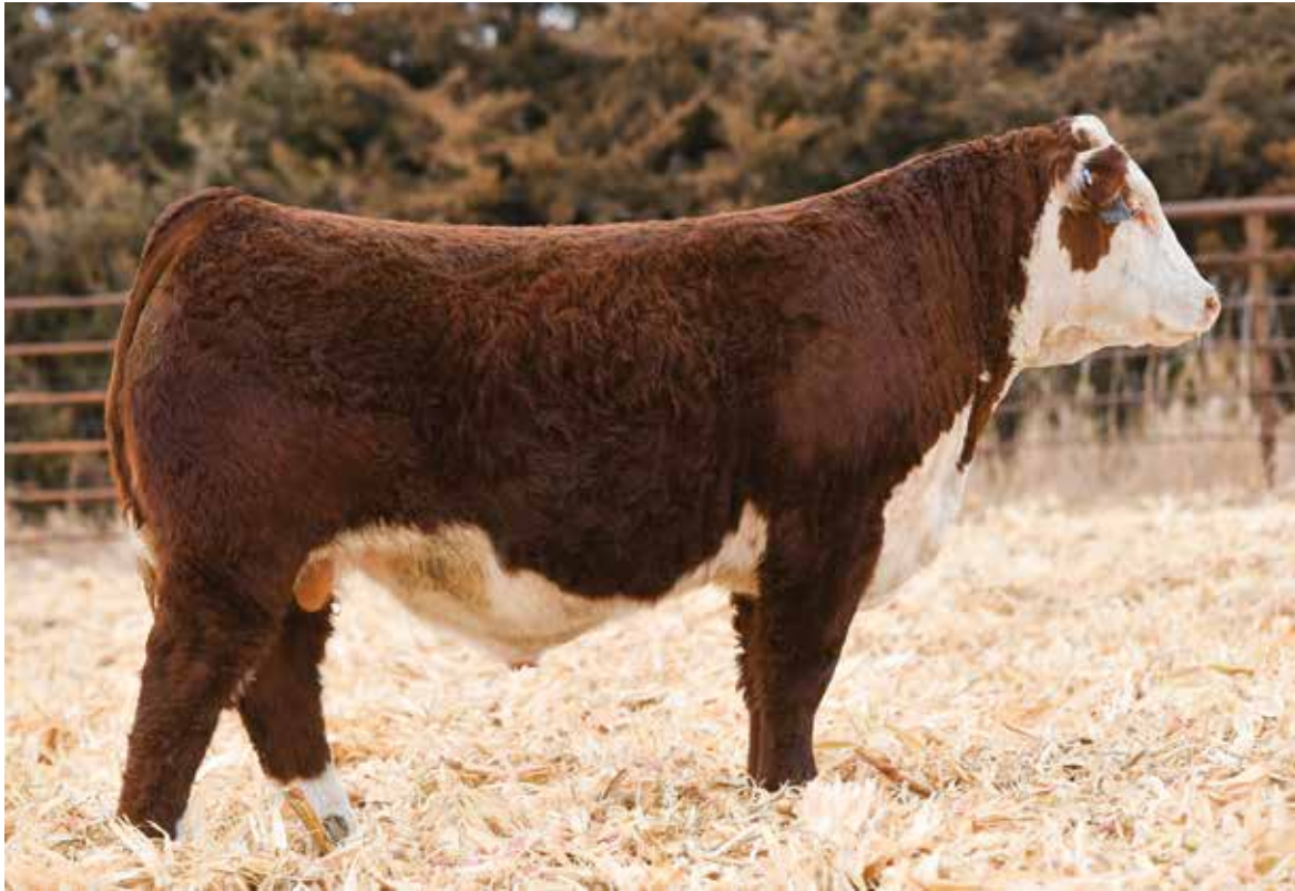
LOT 72 - CHEZ MR SOONER 0817H ET

The Hereford division at CK Cattle is backed by a strong maternal foundation. 0817H and 0819H are sired by the maternal legend, DM BR Sooner, and from the influence of RV Golden Lady 5064. 0817H and 0819H are stout, wide based, heavy muscled Hereford bulls that will add heterosis to any set of Angus based cows. 0644H is the Laramie 619D son that is from the line-one influenced pedigree of JCS 0144 Dominette 4659. Look to the Hereford division if you are interested in producing a heavy weaning set of baldy calves.