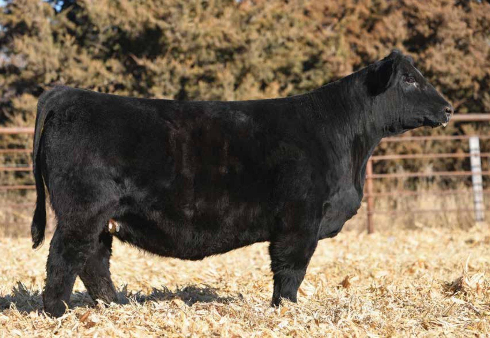
LOT 112 - CKCC LD GABBY 907G ET