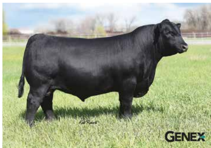
MUSGRAVE 316 STUNNER - SIRE OF LOT 136 - 138

This direct daughter of Stunner is influenced by Broker, Goldmine and the Melody brand. She comes to you in a modern framed, deep, functional package with added look and appeal. She sells safe in calf to a 5/21/20 A.I. date to Hook's Eagle 6E (ASA: 3253742) and P.E. to R5 Solution E111 (ASA: 3631982) from 6/6/20 to 8/21/20.