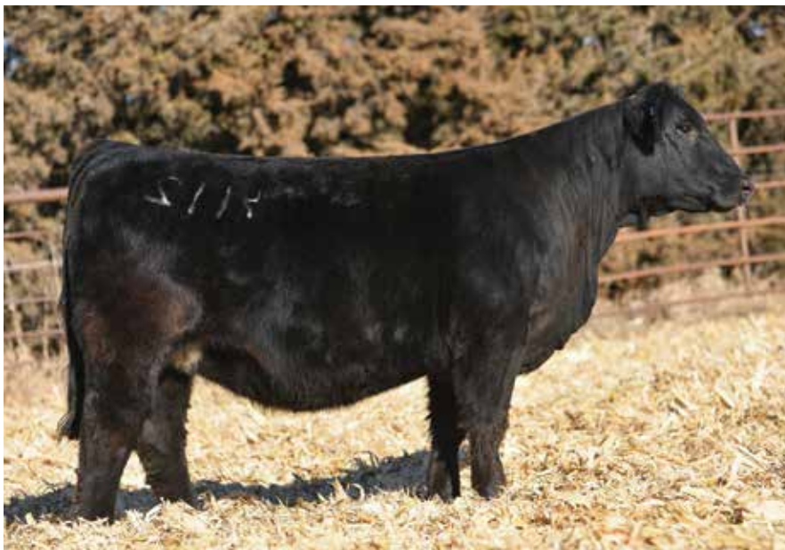
LOT 141 - WAGR MS ENOUGH SAID 9112G