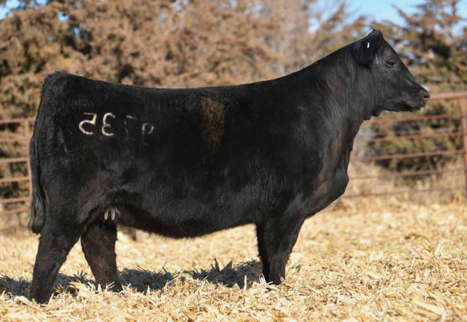
LOT 102 - CKCC MS PROFIT 9735G ET