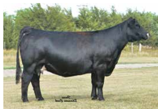
WAGR LULLABY 703T MATERNAL GRANDDAM OF LOT 118