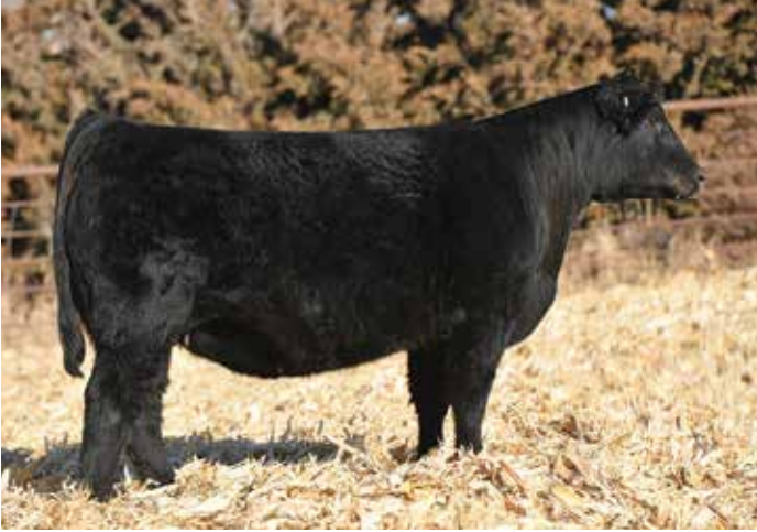
LOT 122 - HEIMS MISS DAKOTA OUTLAW