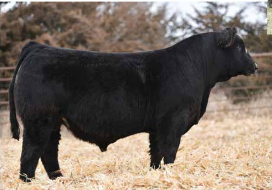
LOT 3 - FRKG CKCC MR 20-20 005H ET