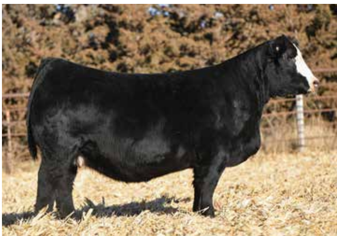
LOT 113 - CKCC LD GWEN 912G ET