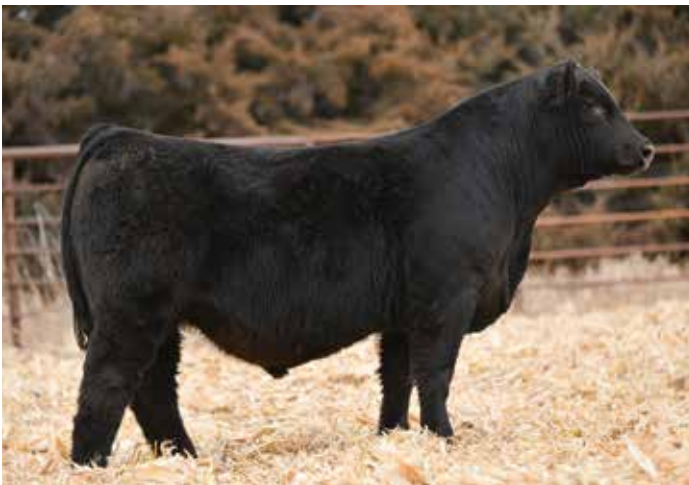
LOT 9 - CKCC RJ MR PROFIT 0881H ET

We present quite possibly the stoutest, boldest bodied direct son of Profit in 0900H. He is from a Bieber Red Angus female that packs an extra punch in genetic power straight up heterosis! He is stout and wide for days on end, and he ultimately defines center dimension and mass to the utmost degree.