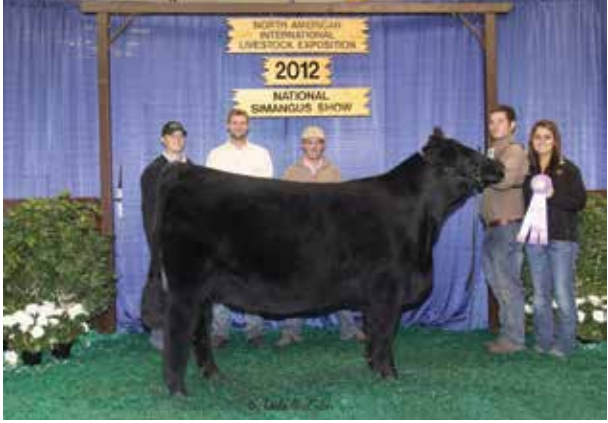
GLS/KB FINESSE Y187 - MATERNAL GRANDDAM OF LOT 20