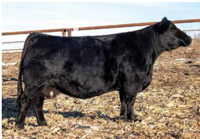
OMF BLACK BETTY Y12 - DAM OF LOT 17

OMF Herman H28 is a performance driven son of Mainline that is homozygous black and homozygous polled. He is supported by the influence of Finesse Y9, a leading daughter of the immortal T60. H28 charts top 2% WW, top 2% YW, top 10% ADG, top 5% MWW, top 10% CW, top 15% Marb, top 10% BF, top 25% REA, top 15% Shr, top 20% API, and top 4% TI. He offers an impressive 991-pound adjusted weaning weight and boasts a 110 WW Ratio. He also boasts an impressive YW Ratio of 106. A true performance standout among the class of 2020 that will sell on February 14, 2021 in Cresco, Iowa.