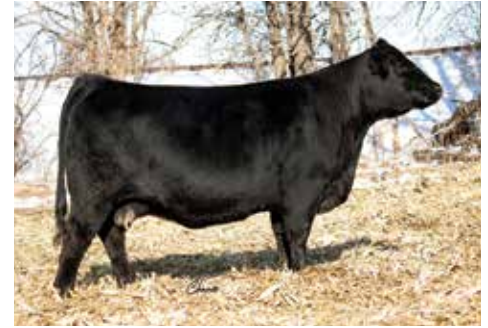
AHLB CORTNEY 553C - DAM OF LOTS 14 & 15