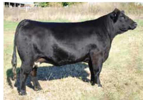
T60 MATERNAL GRANDDAM OF LOTS 105 & 106