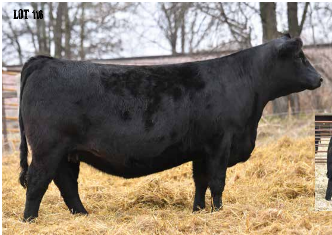
HOOK'S BLACK HAWK 50B SIRE OF LOTS 116 & 117