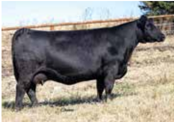
HOOKS ANGEL 11A - DAM OF LOTS 10 - 12