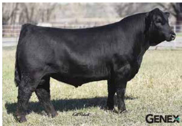
CDI MAINLINE 265D SIRE OF LOTS 108 & 109

OMF Gelody G48 is the bold bodied, deep flanked, easy fleshing CDI Mainline 265D daughter that is backed by the Hooks Shear Force 38K influence. She is a performance standout genomically, charting among the top 15% WW, top 25% YW, top 20% Milk, top 10% MWW, top 2% Stay, top 10% Doc, top 15% YG, top 25% Marb, top 20% REA, top 10% Shr, top 20% API, and top 10% TI. AI BRED ON 5/14/20 TO CCR BOULDER 1339A (ASA: 2880309). NO BULL EXPOSURE. SAFE AI. ESTIMATED DUE 2/20/21.