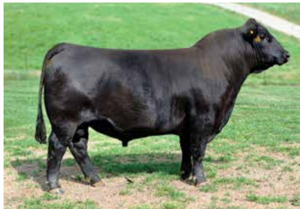
TJ DIPLOMAT 294D SIRE OF LOT 106

DKSM Gage 10G is sired by the half-blood stud, TJ Diplomat 294D. Her dam is from the Cowboy Cut sired daughter of T60. Power in the blood once again! You'll love the udder quality, fleshing ability, fertility, and calf raising capabilities that this three-quarter blood brood cow prospect offers. She charts top 25% WW, top 10% Milk, top 10% MWW, top 20% Stay, top 20% CW, top 25% BF, and top 25% REA. OBSERVED BRED ON 7/15/20 TO FIVE STAR GUNNIE G35 (ASA: 3608070). PE 5/11/20 TO 10/21/20. CONFIRMED SAFE IN CALF. ESTIMATED DUE 4/23/21.