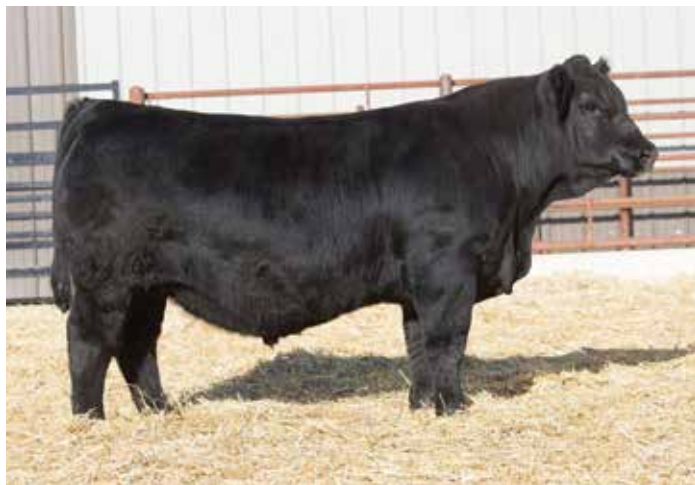
HOOK'S EAGE 6E - SIRE OF LOT 201 EMBRYOS

OMF Black Betty Y12 is a proven matriarch in the donor pen here at OMF. She has the uncandid ability to inject her stoutness, body capacity, and skeletal quality into her progeny time after time. Lot 4 in this year's sale is OMF Hombre H56, the Epic sired son of Y12. He is massive in terms of his rib cage, perfect footed, big hiped, and balanced numerically. This mating to Hook's Eagle 6E is certain to yield a breed leading individual that excels phenotypically and genomically. Eagle boasts a stellar phenotype, complimented by a sound and prolific cow family with great fertility and consistency. This mating is sure to yield elite performance cattle with trend setting numeric values. Hang your hat on the cowboy logic that supports this power mating!