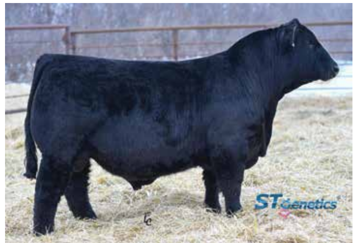
CDI TRUSTEE 387F - SIRE OF LOT 34