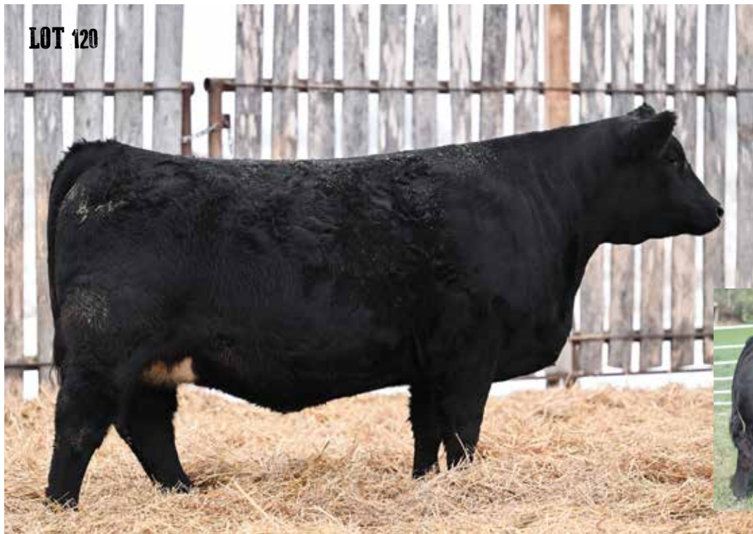
WS PROCLAMATION E202 SIRE OF LOTS 120 & 121