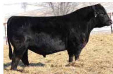
RUBYS TURNPIKE 771E - SIRE OF LOT 118

Five Star Georgina G7 is a powerful individual that is massive through the mid-section of her rib cage and transcends into a three-dimensional hip and pin set. G7 is sired by the $71,000 Ruby's Turnpike 771E and backed by a Kenner Simmentals bred dam on the bottom side. She ranks top 25% YW, top 15% ADG, top 20% MCE, top 20% BF, and top 25% Shr. G7 is a homozygous black female that is sure to turn heads on sale day with her exceptional brood cow presence. OBSERVED BRED ON 5/30/20 TO FIVE STAR GUNNIE G35 (ASA: 3608070). PE 5/11/20 TO 10/21/20. CONFIRMED SAFE IN CALF. ESTIMATED DUE 3/8/21.