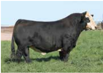
W/C BANKROLL 811D - $205,000 SIRE OF LOT 10