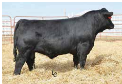
HOOK'S YELLOWSTONE 97Y - SIRE OF LOT 111