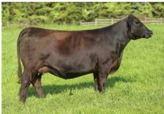
OMF/DK CHEERS C88 - DAM OF LOTS 21 - 23