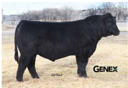
LBRS GENESIS G69 - SIRE OF LOT 200B EMBRYOS

Offering 1 package of 3 unsexed IVF embryos. Guaranteeing 1 pregnancy if transferred by a certified technician.