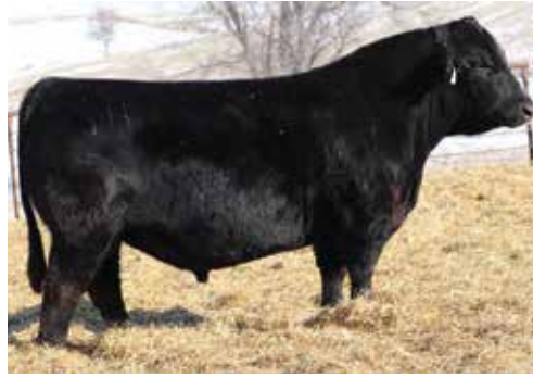
RUBYS TURNPIKE 771E SIRE OF LOTS 11- 13

OMF Hardy H25 is another son of the great Hooks Angel 11A, sired by the $71,000 Ruby's Turnpike 771E, one of the most widely used AI sires in the business. Hardy H25 is a dense made, stout hipped, wide based herd sire prospect that exemplifies the fundamentals of beef cattle production. H25 is flawless at the surface, flexible on the move, and robust in his rib cage. H25 is a homozygous black and homozygous polled herd sire prospect that charts top 20% CE, top 20% WW, top 10% YW, top 10% ADG, top 20% MCE, top 15% Marb, top 20% BF, top 25% API, and top 10% TI. Power in the blood!