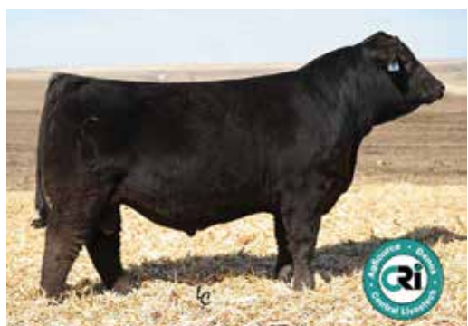
CCR COWBOY CUT 5048Z - SIRE OF LOT 200A EMBRYOS

OMF/DK Cheers C88 is without question one of the most prolific females in the Oak Meadow Farms and Diamond K Simmentals. From the ground up C88 is superior in terms of her foot design, skeletal quality, and squareness of build. Her udder quality, body density, and dimension combined set her into a league of her own. C88 is the dam of the $22,000 red hided stud that topped our 2020 Production Sale. C88 did it again this year, producing seedstock caliber progeny that have the credentials to make an impact on even the most progressive programs in North America. A bred heifer sired by All Aboard will highlight the bred division. G50 is the striking red head that exemplifies the brood cow fundamentals. We firmly believe she will follow in the footsteps of her dam. We are hesitantly opening the genetic vault and allowing you access to our most proven and profitable young female, Cheers C88. The matings include Cowboy Cut, Genesis, and Boulder. February 14, 2021 is the opportunity to add your prefix to the C88 legacy.