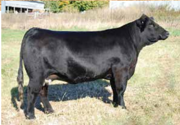
T60 - MATERNAL GRANDDAM OF LOTS 2, 32, 35, & 37