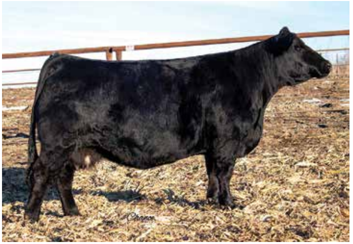
OMF BLACK BETTY Y12 - DAM OF LOT 4

OMF Hombre H56 is another example of why the Epic sire group has the entire country crowing! H56 is dense, function in his basic build, wide at the surface, stout hiped, and bold in his shape. He offers an impressive 934-pound adjusted weaning weight and boasts a WW Ratio of 108. H56 charts top 20% BW, top 25% WW, top 20% MCE, top 15% Milk, top 10% MWW, top 10% Doc, top 20% Marb, top 1% Shr, top 15% API, and top 10% TI.