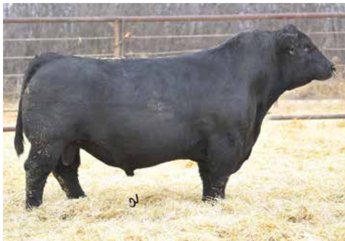
TJ MAIN EVENT 503B - SIRE OF LOT 19

OMF Harry H8 is a homozygous black and homozygous polled half-blood SimAngus stud that is sired by TJ Main Event 503B. He is backed by the strong and predictable maternal influence of the legendary OMF Commander Y69, tracing to BC Lookout 7024. H8 charts top 25% CE, top 15% BW, top 4% Milk, and top 15% MWW.