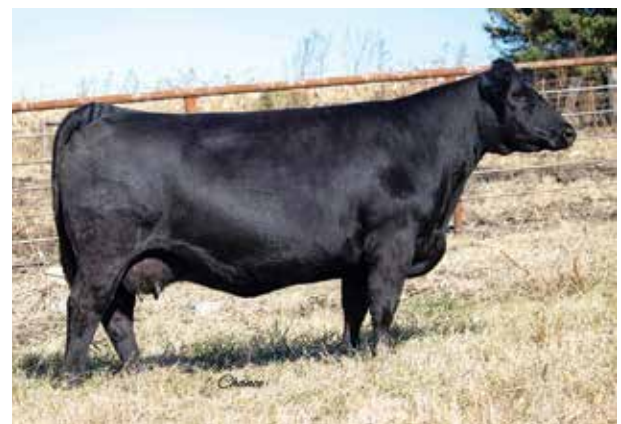
HOOKS ANGEL 11A - DAM OF LOT 1