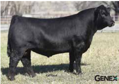
CDI MAINLINE 265D - SIRE OF LOTS 14 - 18