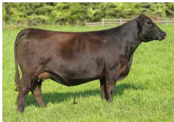
OMF/DK CHEERS C88 - DAM OF LOT 103

Adj. BW | 78 Adj. WW | 639 BW Ratio | ET WW Ratio | ET