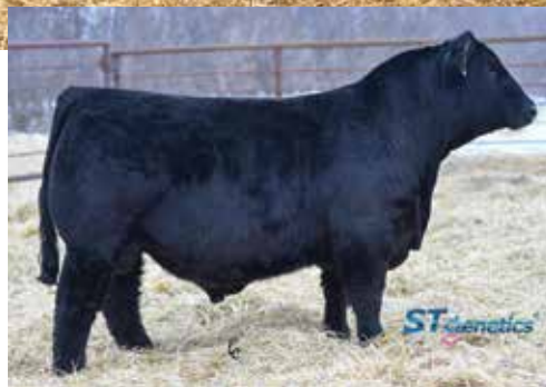
CDI TRUSTEE 387F - SERVICE SIRE TO LOT 101