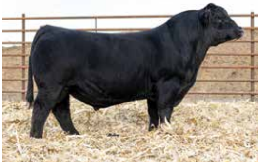
OMF EPIC E27 POPULAR MATERNAL BROTHER TO LOT 35