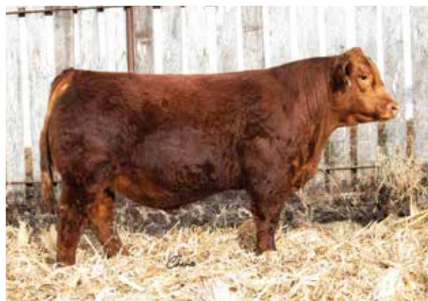
OMF/DKS GUINNESS G67 - $22,000 FULL BROTHER TO LOT 103