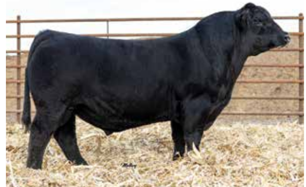
OMF EPIC E27 - SIRE OF LOT 1

OMF Hancock H21 initiates the 2021 offering with the presence and stoutness of a true herd sire prospect. Hancock is sired by the widely admired OMF Epic E27 and backed by the strong maternal influence of Hooks Angel 11A. OMF Hancock H21 is flawless in his basic build, big footed, deep heeled, and sets to the surface with extreme comfort and flexibility. Hancock is one of the most unique Purebred herd sire prospects to ever carry the OMF prefix. A homozygous black and homozygous polled herd bull candidate that is as impressive on paper as he is on the hoof. H21 charts top 15% CE, top 20% WW, top 10% YW, top 10% ADG, top 15% MCE, top 15% Stay, top 15% Marb, top 10% API, and top 10% TI. He boasts an 889-pound adjusted WW with a WW ratio of 103 and a YW Ratio of 103 as he pressed down the scales with a 1334 pound adjusted yearling weight. Hancock has the credentials to make a substantial impact on the business... make plans to be in Cresco, Iowa on February 14, 2021 to evaluate his real-world functionality for yourself! Terms Announced Sale Day.