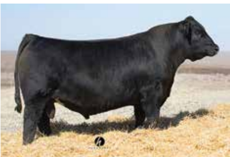
CCR BOULDER 1339A SIRE OF LOTS 32 & 33

OMF/DK Heavy Duty 13H is one of the true performance standouts among a deep, powerful, rugged set of service aged bulls. 13H charts top 1% WW, top 3% YW, top 25% ADG, top 2% MWW, top 15% Doc, top 15% CW, top 10% YG, top 4% BF, top 3% REA, top 5% Shr, and top 5% TI. Another standout performance sire prospect that traces to the influence of the legendary T60 cow family. Look to 13H if your operation is searching for a bull to add market topping performance.