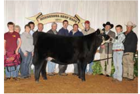
OMF ELIN X58 MATERNAL GRANDDAM OF LOT 9