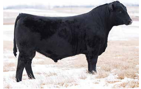
HOOK'S ENCORE 65E SIRE OF LOTS 30 & 31