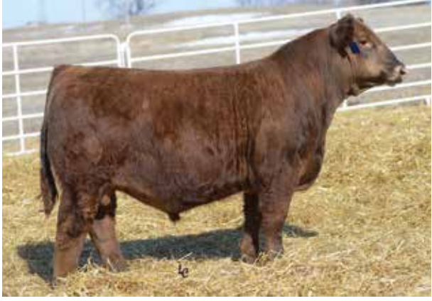
KBHR SNIPER E036 - SIRE OF LOT 20

Five Star Harvard H3 is the lone son of KBHR Sniper E036 to be offered on February 14, 2021 in Cresco... but we are quite fond of the type and kind of beef cattle that he represents. H3 is an extremely attractive, well designed herd sire prospect that sets to the surface with comfort and flexibility. Harvard H3 boasts a proud presence with true symmetry and balance from every angle. The dam of H3 is a Cowboy Cut daughter of the great GLS/KB Finesse Y187, a foundation breeding piece at Five Star Ranch. E3 is a young and productive female that is quickly following in the footsteps of her dominant producing dam. H3 charts top 10% CE, top 15% BW, top 15% Stay, top 5% Doc, top 15% CW, top 5% Marb, top 25% REA, top 4% API, and top 20% TI. A truly unique breeding bull prospect that deserves serious consideration on sale day!