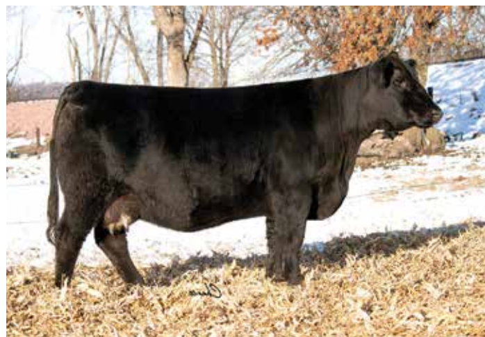
FIVE STAR SHEILA C1 - DAM OF LOT 38

OMF Geronimo G120 is a standout age advantage bull that is sired by resident herd sire at Oak Meadow Farms, B60. B60 is the Dew It Right x Finesse Y9 son that has been used with tremendous success at OMF and Diamond K. G120 is backed by the famed Elin X58 cow family that has served as a cornerstone cow family in Harmony. G120 is a calving ease prospect that charts top 15% CE, top 10% BW, top 20% Milk, top 10% Stay, top 10% Marb, and top 15% API.