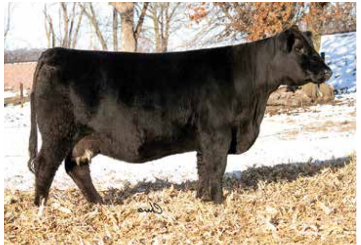
FIVE STAR SHEILA C1 - DAM OF LOT 7