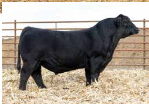
OMF EPIC E27 - SON OF LOT 101