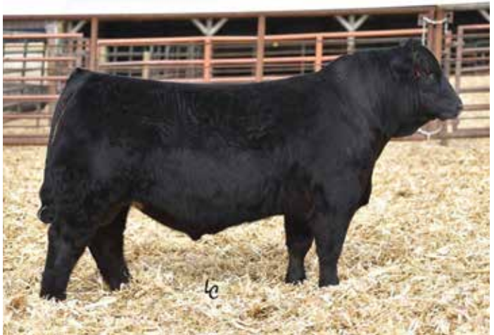
HOOK'S BALTIC 17B - SIRE OF LOT 29

OMF Hatchet H65 is the homozygous black and homozygous polled three-quarter blood sired by Hook's Baltic 17B. H65 is from a standout daughter of OMF Commander Y69. You can count on superior fleshing ability, udder quality, and a strong maternal instinct if you retain daughters from H65 due to the generations of strong maternal influence that supports his maternal lineage. He charts top 10% Stay, top 20% Marb, top 25% REA, top 15% Shr, and top 15% API.