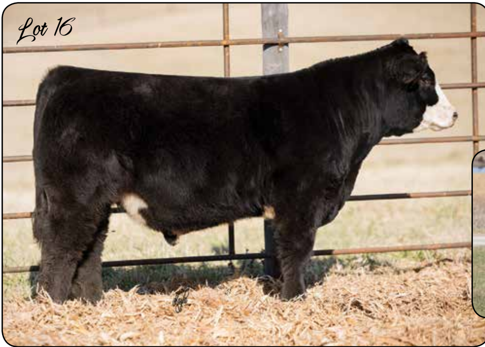
LONGS CAROLINE DAM OF LOT 16