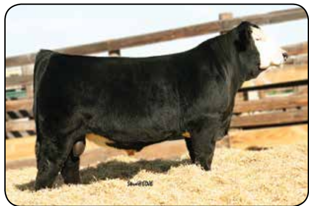
TLCC ONE EYED JACK