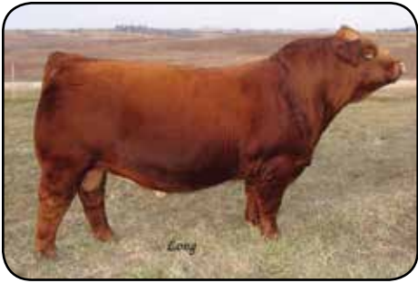
LONGS STEEL SHOT