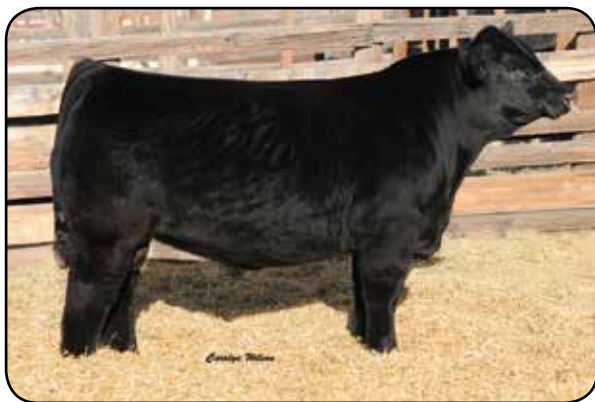
LONGS STAND ALONE