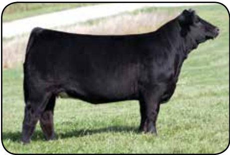
LONGS FOXY LADY