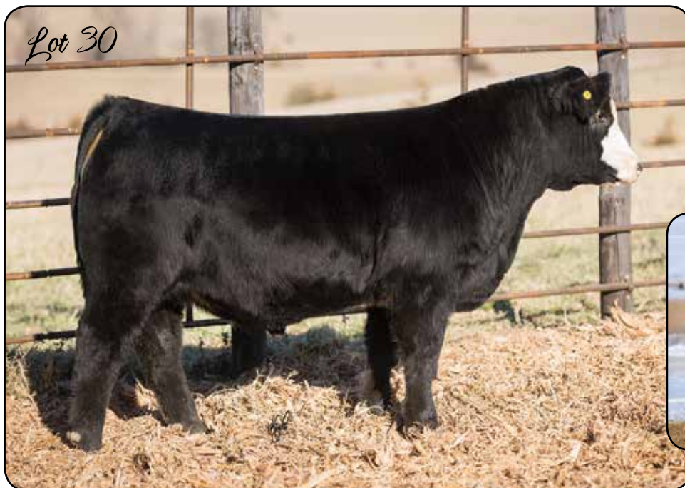
LONGS PAY TO PLAY SIRE OF LOT 30

Stout, rugged, baldy that is made unique with good shoulders. He is sired by the upcoming Long's Pay to Play bull that sold in Denver for $15,000. His dam is a moderate-made cow that always brings in a big calf. Homo polled. This bull is a naturally raised twin!