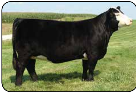
LONGS SHEAR SASS