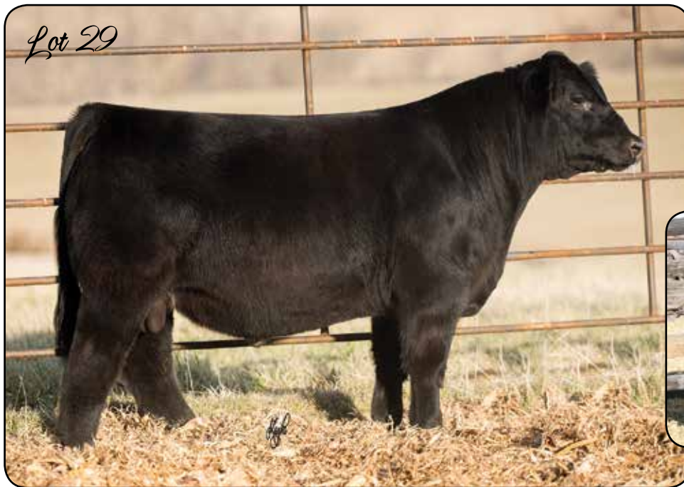
LONGS THE PLAYER SIRE OF LOT 29