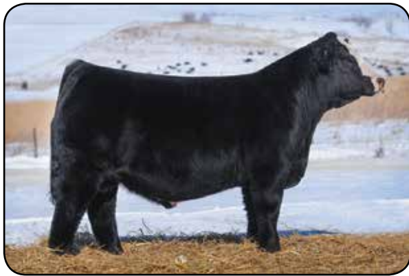
LONGS PAY TO PLAY