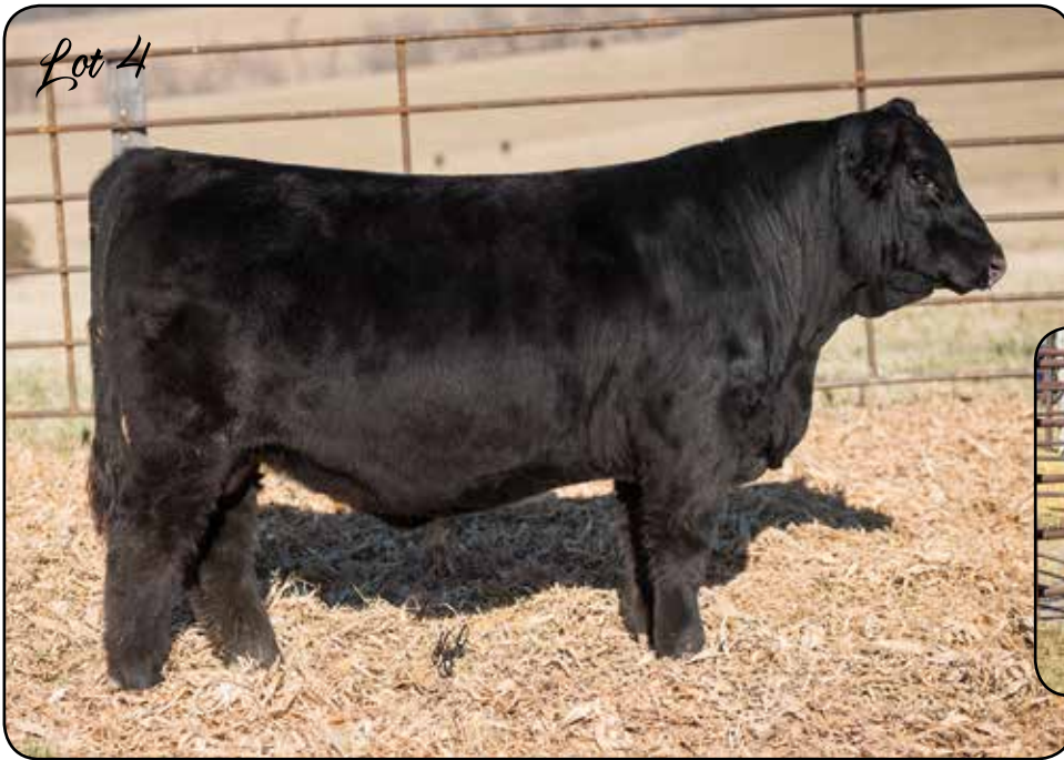
LONGS PAY THE MAN E16 SIRE OF LOT 4