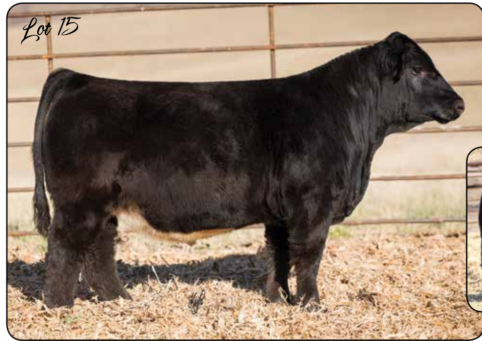
W/C ROLEX 0135E SIRE OF LOT 15

This bull is a moderate tank! He is huge barreled with massive center body capacity. If you need to power up a set of cows and reduce some frame size, he is the one. Sired by W/C Rolex going back to a great producing, longevity MCM (Mike McDermott) cow. You will appreciate this one!