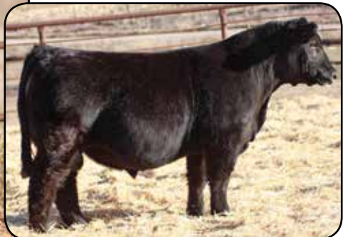
W/C ROLEX 0135E SIRE OF LOT 32