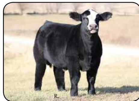
LONGS CAME TO PLAY