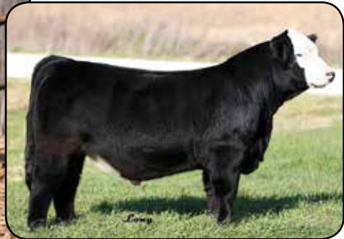
LONGS JERRIN SIRE OF LOT 31