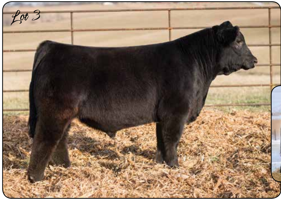
LONGS PAY TO PLAY MATERNAL BROTHER TO LOT 3

Possibly the best W/C Rolex son on the market and raised to date! His dam is an exceptional SVF Steel Force cow that raised the Denver Sale $15,000 highlight, Long's Pay to Play AI sire. Homo polled and homo black. This bull is a stacked powerhouse! Wide topped, big square hip, massive bone, and homozygous AWESOME! Selling full possession and retaining 1/3 semen interest.