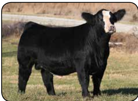
LONGS AMERICAN MUSCLE