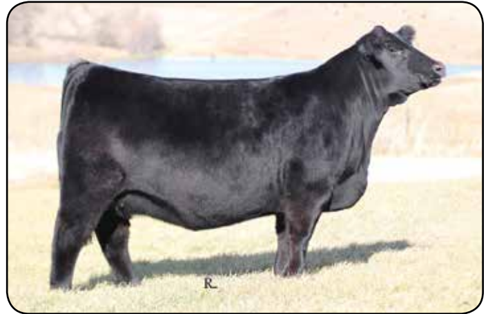
LONG'S CARMEN - DAM OF LOT 1 AND FULL SISTER TO DAM OF LOT 7