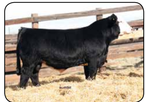
LONGS SHEAR PLEASURE