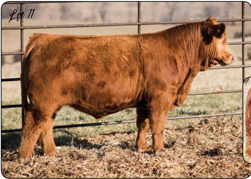
W/C HOC HCC RED ANSWER 33B SIRE OF LOT 11

Here is another high-quality HOC Red Answer son and out of an excellent, well-proven, older cow that has raised many good offspring. At 12 years old, she is a model of longevity and never misses. These Red Answer sons are high in demand and short in supply. This bull will do anyone a real good job!