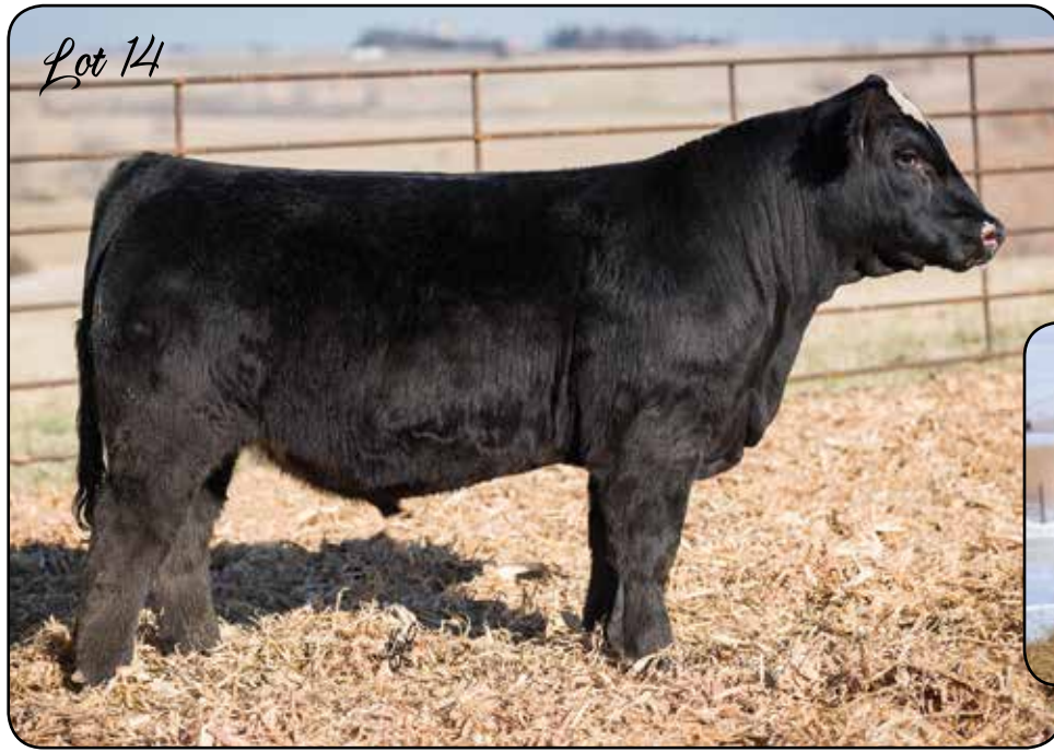
LONGS PAY TO PLAY SIRE OF LOT 14