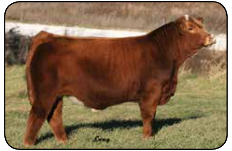
LONGS COMPADRE E20