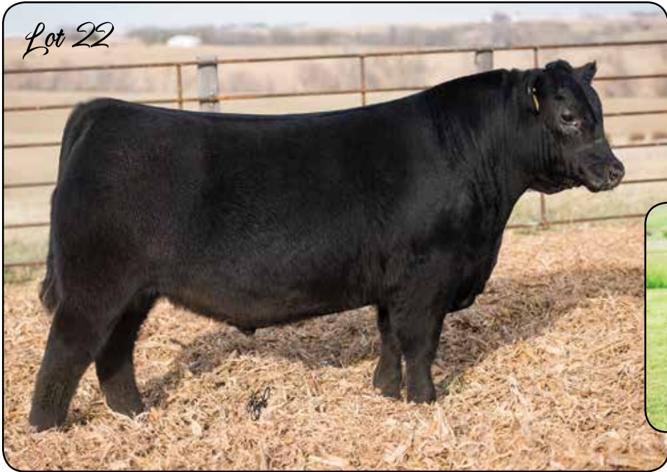
MUSGRAVE SKY HIGH 1535 SIRE OF LOT 22