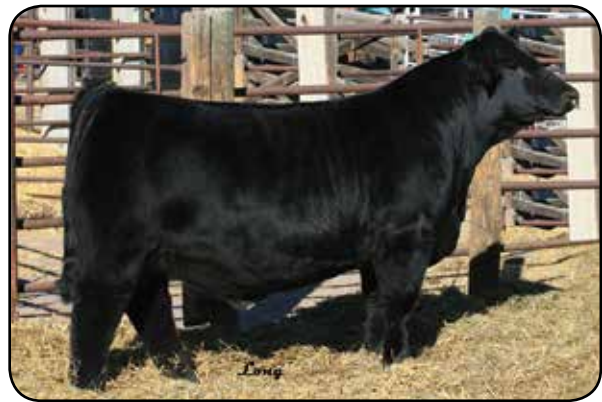
LONGS PAY THE MAN E16