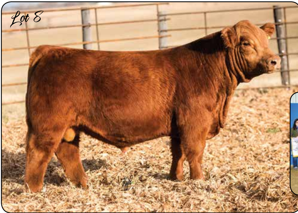
2019 NWSS RESERVE GRAND CHAMPION PEN OF THREE - DAM WAS A MEMBER OF THE PEN