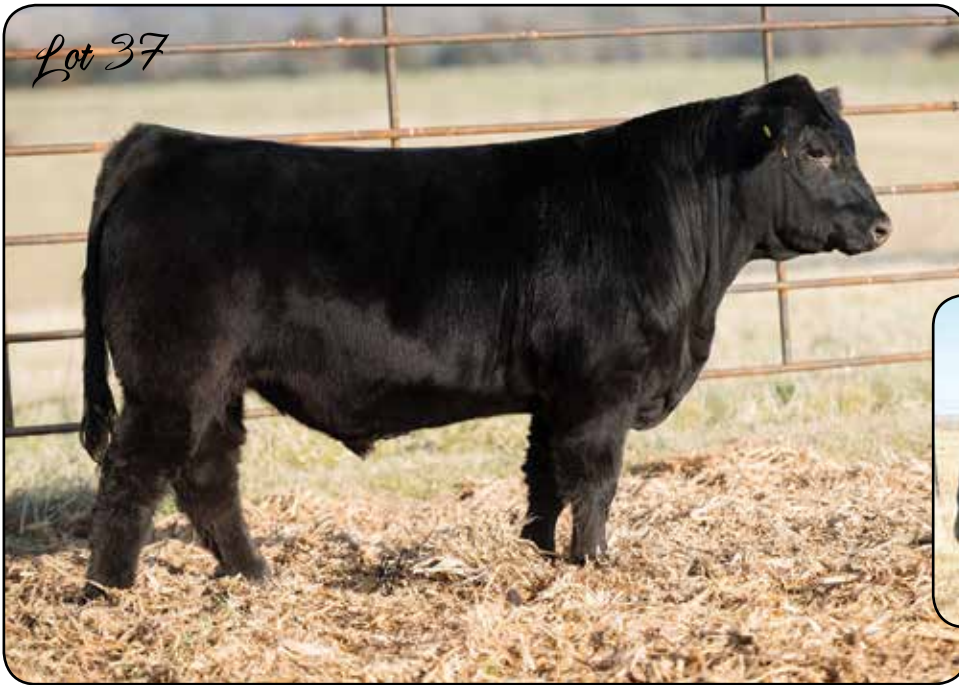
THSF LOVER BOY B33 SIRE OF LOT 37