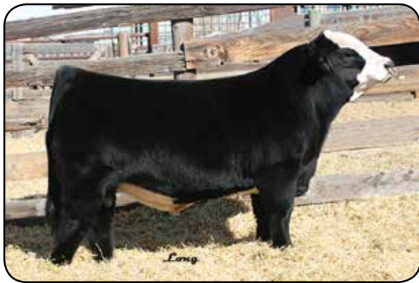
LONGS THE PLAYER