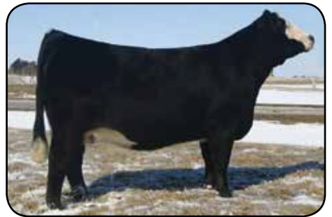
LONGS SWEET TREAT