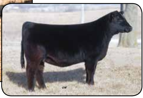
LOT 43 AS A CALF

Just bid until the gavel drops on this one, trust me! A moderate made, big barreled, cool fronted, sound female with good EPD's in a purebred package. The In Dew Time females make outstanding cows. Study her reference picture as a calf also. We were planning on selling her as an open in Ohio last spring until Covid spoiled the spring sale season. AI'd to W/C Nightwatch. AI BRED 5/2/20 TO W/C NIGHT WATCH 84E (ASA: 3336327) .PE 6/8/20-7/24/20 TO PE 6/8/20-7/24/20 TO LONGS G019 (ASA: 3638279). SAFE AI. ESTIAMTED DUE 2/8/21.