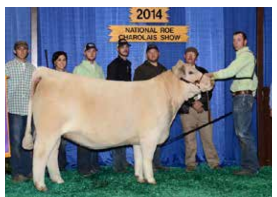
TR PZC MS ANGELA 31A 2014 NAILE Reserve Grand Champion Charoais Heifer