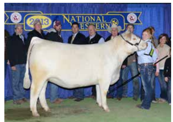
TR PZC MS Firefly 1746 ET 2013 NWSS Grand Champion Charolais - Full Sister