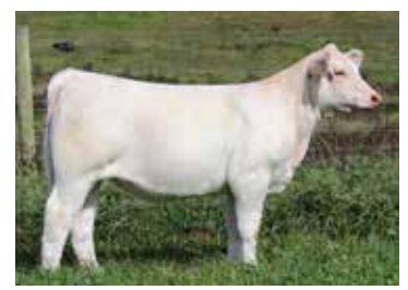
Outsider x Angela Daughter