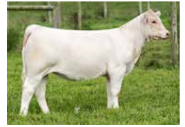
Outsider x Angela Daughter