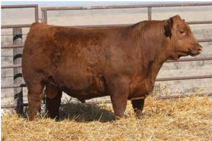
Smoky Y Sub Zero 7169 - Maternal Brother to Lot 9

Smoky Y Hallucination 8197F is another top herd sire prospect by AHL Flashback 446B and backed by the Red Geis Prime Rib 411 sired female on the bottom side of his pedigree. The dam of 8197F is Red SY Yvette 78Y, she is also the dam of the 2018 High Selling Bull, Smoky Y Now or Never that topped the 2018 sale at $16,500 to Lee's Cattle Company in Brush, Colorado. Much like his brother, Hallucination is a big centered, wide based, thick-ended herd sire prospect. He charts top 13% WW, and top 17% YW. Study the mass, dimension, and squareness of build that he possesses.