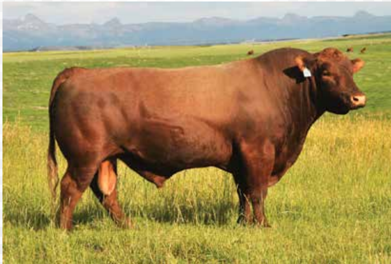
BUF CRK The Right Kind U199 - Paternal Grand sire of Lot 72