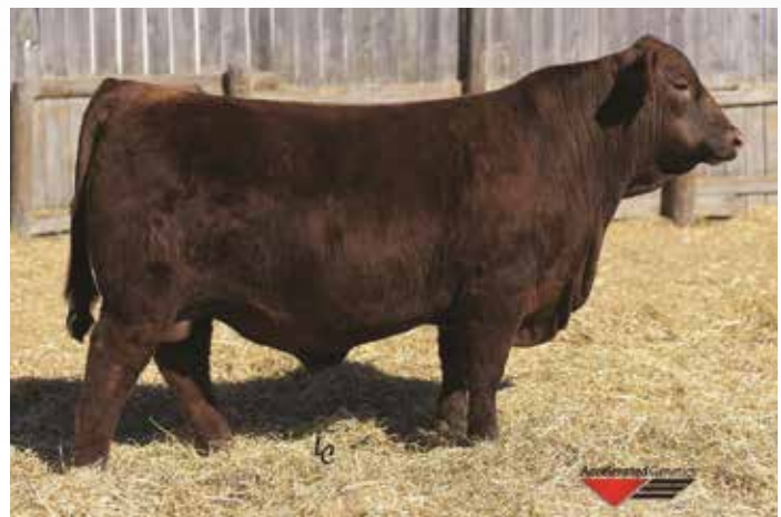
Bieber CL Atomic C218 - Sire of Lots 32 - 44

A STANDOUT SINCE BIRTH, HE CHECKS ALL THE BOXES!