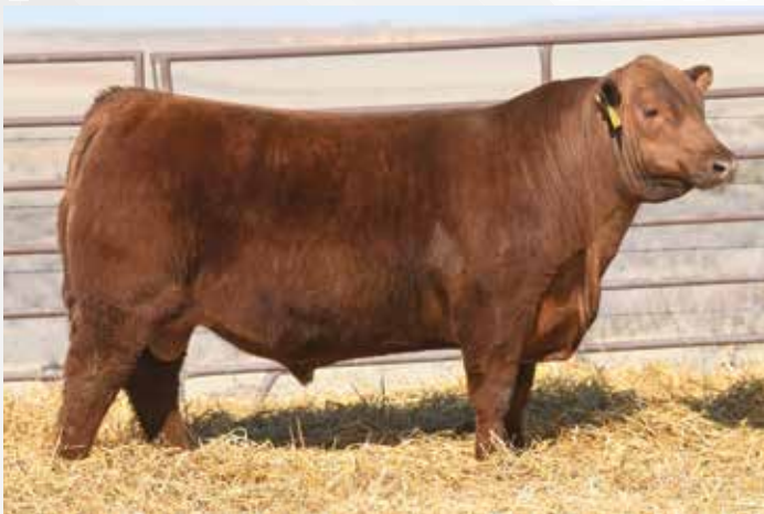
Smoky Y Now or Never 7139E - Maternal Brother to Lot 6