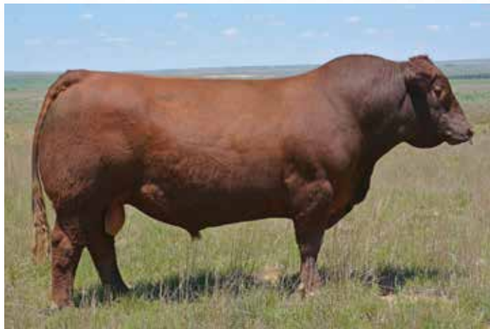
PZCTMAS Red Sky 2794 - Sire of Lots 10 - 23

RED SKY... HIS IMPACT WILL BE EVERLASTING!