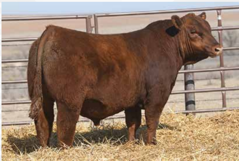
SMOKY Y RTG 7113E - Maternal Brother to Lot 77