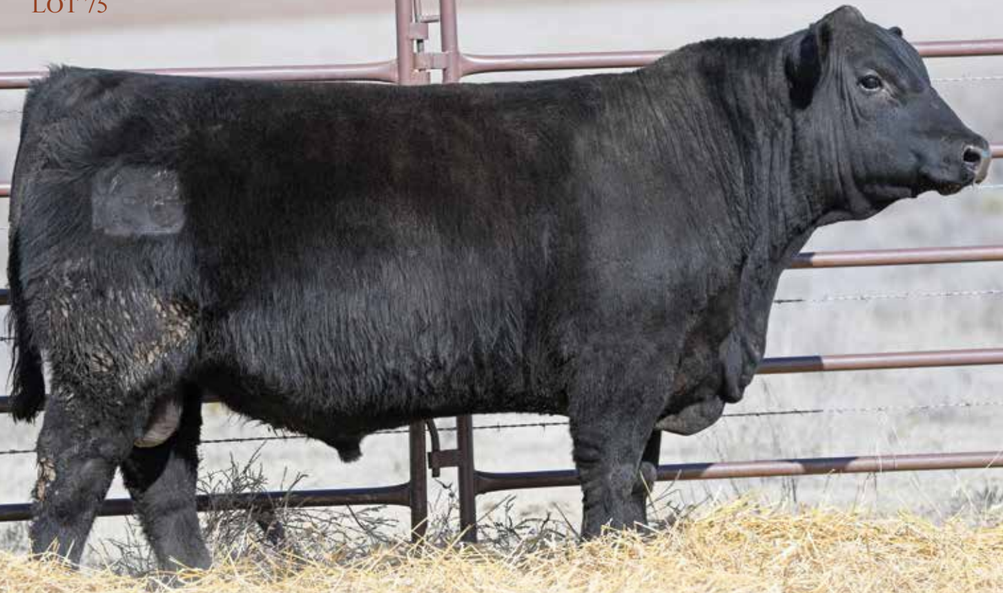
Red Lazy MC Spyder 149A - Sire of Lots 75 - 76