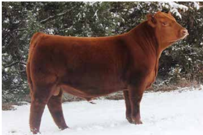
AHL Flashback 446B - Sire of Lots 5 - 9

Smoky Y Flashback 7324 is one of the premier son's in the 2019 offering by our herd sire AHL Flashback 4468. Flashback was the six-figure valued promotional sire that sold through the Western Heritage Sale on "The Hill" at the National Western Stock Show. We had the opportunity to acquire Flashback through the Englewood Farms Dispersal Sale. He has done an exceptional job for our program siring cattle with structural integrity, body mass, quality, and eye-appeal. The females sired by Flashback are some of the best replacement females that we have ever kept back and we look forward to watching the impact that they will make. 7324 ranks among the top 20% for WW, top 18% YW, top 17% ADG, top 18% ME, and top 15% Stay. A true sale feature!