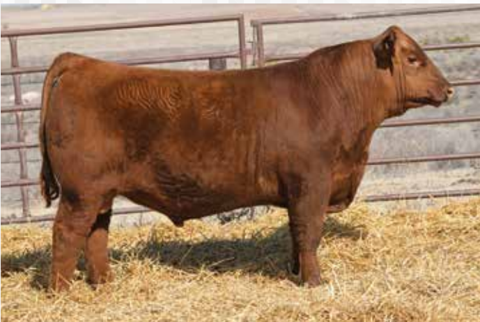
Smoky Y ProfitBuilder 7154E - Maternal Brother to Lot 49! He was selected by the Schumacher Family Trust Ranch in 2018

Smoky Y Renown 8201F is sired by Red U-2 Renown 193C and from a great producing female that is saturated with genetics from the Camp 1A program. He ranks among the top 15% of the breed for WW, top 28% YW, top 18% ME, and top 16% CW.