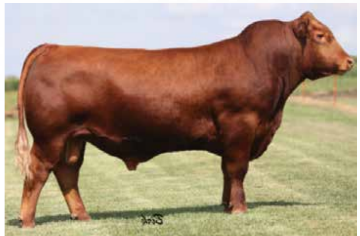
Bar-E-L Concept 49C - Sire of Lots 1 - 3