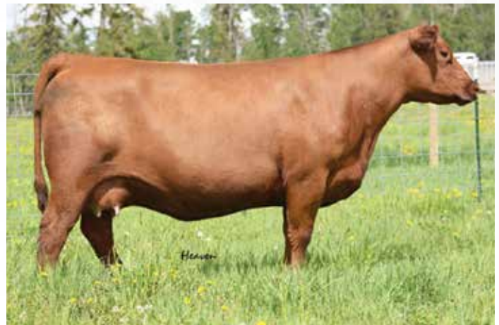
Red Rainbow Lois 7U - Dam of Lot 4

Smoky Y Dagger 8108F is a full brother to lots 12 and 13 from last year's offering. Sired by Bar-E-L Concept 49C and backed by the stunning Red Rainbow Lois 7U donor. When we first saw Lois 7U we knew she was a female that we needed to get back to the ranch due to her unparalleled presence, eye appeal, and maternal functionality. Smoky Y Dagger 8108F is one of the premier herd sire prospects produced in the class of 2019 and we believe that his strong maternal backing will aid in his success as a herd sire.