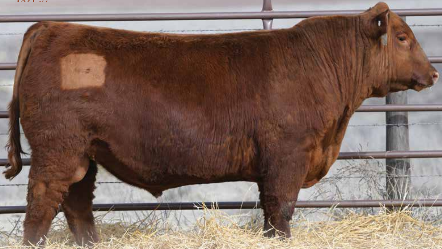
Red Lazy MC Detour 2W - Sire of Lots 57 - 58