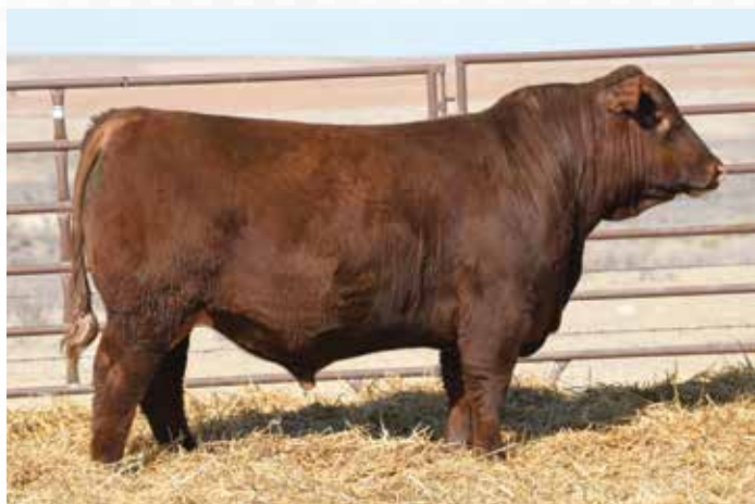
Smoky Y Born Ready 7161E - Maternal Brother to Lot 47!

Smoky Y Renown 8128F is the lead off herd sire prospect from the Red U-2 Renown 193C sire group. Renown was the $75,000 high selling bull from the famed U-2 program that has taken the breed by storm. His sire is the great Red U-2 Reckoning 149A stud that is leaving behind beautiful daughters and powerful sons. Renown is from a no-miss producing female that has a picture perfect udder. 8128F s backed by a Brown Premier X7876 daughter that produced a $7,500 bull in our 2018 sale that was selected by some of the top cattlemen and cattlemen in the country, Schumacher Family Trust Ranch of Hays, Kansas. 8128F ranks among the top 5% of the breed for GridMaster, top 5% YW, top 4% YW, top 6% ADG, top 11% ME, top 18% Milk, top 28% Marb, and top 11% CW. He has a WW Ratio of 107, a YW Ratio of 105, a IMF Ratio of 103, and a REA Ratio of 112! A multi-purpose herd sire prospect that we believe has a bright future!