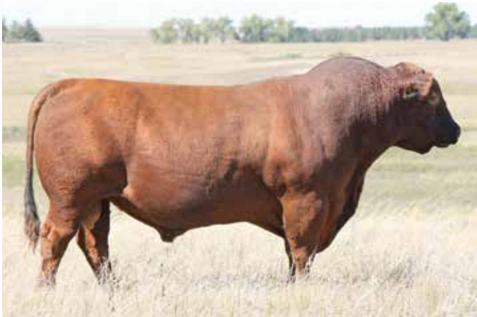
LSF Optimism 1107Y - Paternal Grand sire of Lots 73 - 74

8190F is a 3/4 brother in blood to 8194F. This pair of brothers that will add uniformity and consistency to your next calf crop. He is a top IMF herd sire prospect with an impressive 111 IMF Ratio!