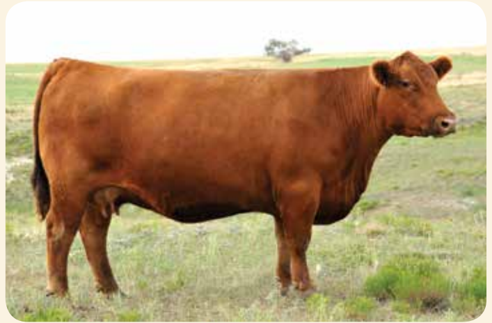
C-Brown&KM Abigrace T715 - Dam of Lot 116