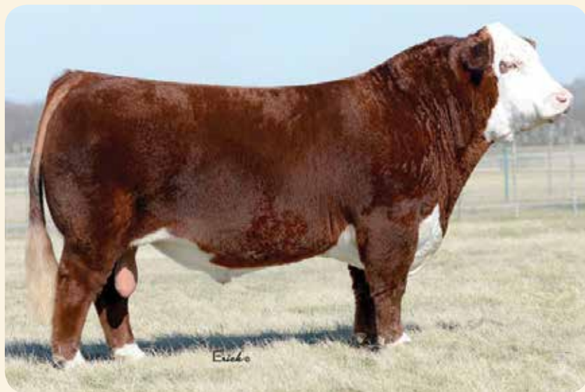
CHAC Mason 2214 - Sire of Lot 125