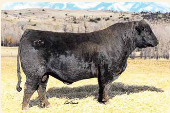
Spur Franchise of Garton - Sire of Lot 117