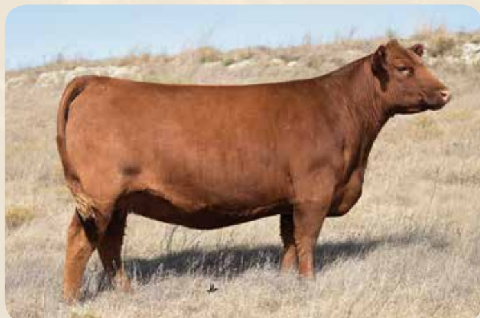
C-Bar Miss Mimi 458B - Dam of Lot 53

BW: 97 AIMF: 3.91 AWW: 751 AREA: 14.08 AYW: 1169 ABF: 0.18