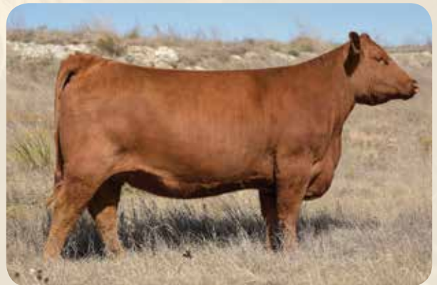
ADHM Stony 503C - Dam of Lots 9 - 11