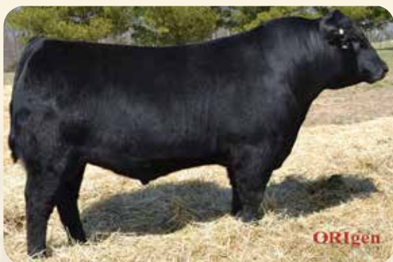
Musgrave Aviator - Sire of Lots 70 - 74

Lots 70 - 74 - These five black-red carrier flush mate brothers offer superior uniformity, structural integrity, body mass, performance, and muscle shape. They are sired by Musgrave Aviator and backed by the famed $60,000 valuation Laso Leanna BC114R donor dam. Many consider their dam, BC114R, to be the most impressive Basin Hobo 79E daughter they have ever laid eyes on. 8170F may be one of the most phenotypically superior bulls in the entire sale regardless of hide color. From a number standpoint they offer an extremely impressive profile. Top 6% HerdBuilder, top 13% GridMaster, top 4% CED, top 8% BW, top 4% Milk, top 10% ME, top 1% CEM, top 6% Marb, top 7% CW, and top 18% REA. 10 different EPD's that rank among the top 20% of the breed or better. These black hided bulls are herd bulls in the making and certainly will add pay weight to your calf crop.