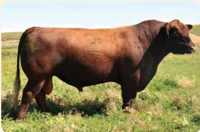
C-Bar El Dorado 114Z - Sire of Lot 107 - 109

Lots 107 - 109 - The next trio of flush brothers are sired by the legendary C-Bar El Dorado 114Z and supported by the impact of the great Beckton Nebula P P707. The dam that these brothers are from was produced in the famed Hueftle Cattle Co. program of Nebraska. They chart top 8% GridMaster, top 19% ADG, top 6% Marb, and offer extremely balanced data across the board. These bulls offer sensible birth weights in the low 80's as a convenience added trait of importance. They are true performance cattle with added value from a carcass merit standpoint.