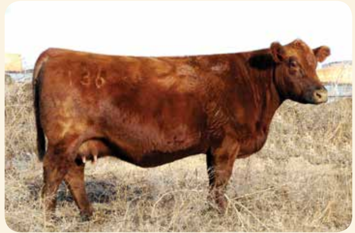
HXC Jaylo LB136 - Dam of Lot 91