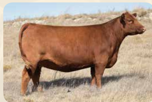
C-Bar Miss Mimi 458B - Dam of Lots 29 - 31