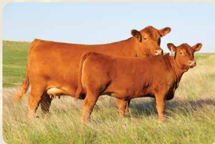
C-Bar Ms Stony A302 - Dam of Lot 48