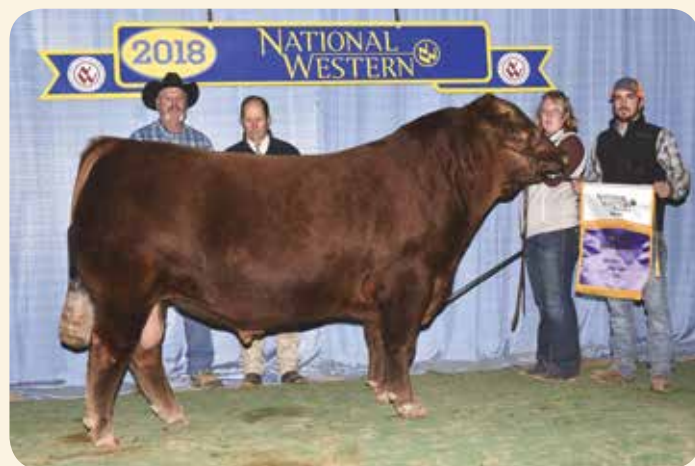
Bonanza - Sire of Lot 69

BW: 81 AIMF: 4.15 AWW: 627 AREA: 13.4 AYW: 1044 ABF: 0.21