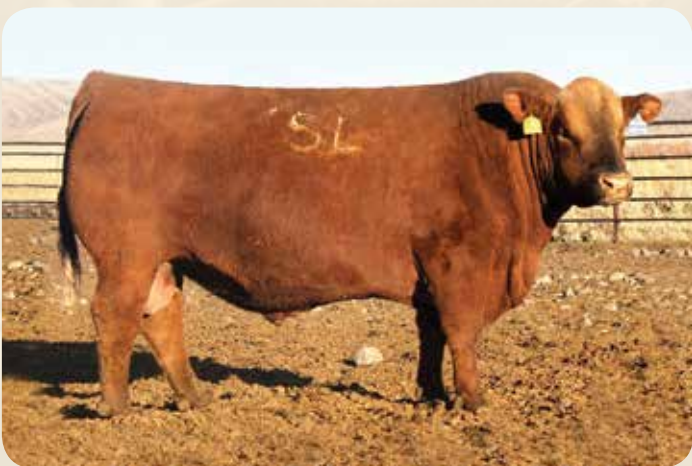
5L Defender 560-30Z - Sire of Lot 110

555E is a standout Defender son that is from the Abigrace S602 cow family. He is a true heifer bull option that offers an actual birth weight of 78 pounds and solidifies his candidacy on paper. He charts top 8% CED, top 7% BW, top 9% ME, top 14% Marb, and top 18% YG.