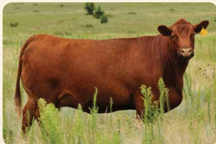
Pelton Miss Reba 6027Y - Dam of Lots 118 - 119

The two-year old division at C-Bar Red Angus is nothing short of impressive. These bulls are rugged, stout made, long bodied, and ready for heavy service. They are from the most proven and prolific cow families on the ranch. 7721E is sired by the carcass focused Spur Franchise of Garton and backed by the prolific and time-tested LB136 donor dam that continues to produce at the highest levels. This is a strong aged bull that is ready for heavy service and will add longevity and carcass merit to your program.