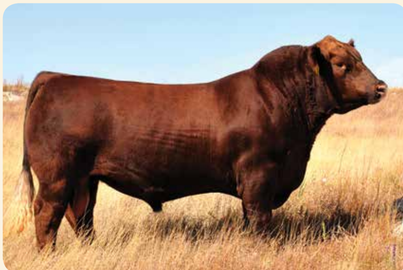
C-Bar RJ Genesis 359E- Sire of Lots 112-113