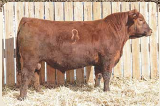
Leachman Pledge A282Z - Sire of Lot 75

What a bull to lead off this powerful set of strong aged Red Angus bulls. His name implies his body type and kind. C-Bar Big Kahuna 157E is massive in his rib shape, big hipped, wide topped, thick ended. He is a true beef bull that offers exceptional phenotype and genomics, a true combination herd sire prospect! He charts top 1% GridMaster, top 6% WW, top 3% YW, top 2% ADG, top 1% Marb, top 5% REA and top 1% CW. His dam was a hard working two-year-old that is an integral part in the C-Bar program moving forward as an own daughter of W914 by Brown Alliance. Big Kahuna is a true sale feature!