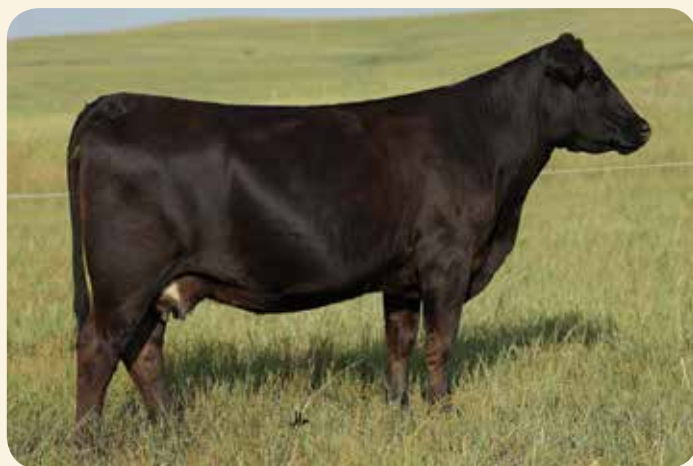
C-Bar Abigrace 564C - Dam of Lot 34