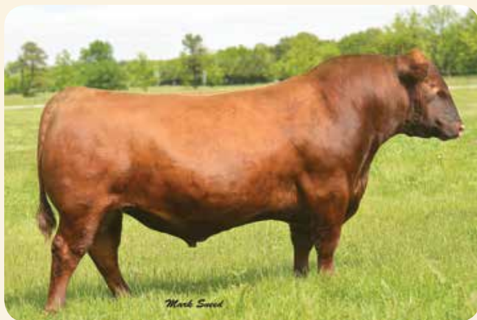
Brown BLW Legend A1965 - Sire of Lots 65 - 68

BECKTON EPIC R397 K BROWN BLW LEGEND A1965 HXC PATRICIA ROSE 102Y RED SSS SOLDIER 365W DAMAR TARMILY 016A DFRA TARMILY N512