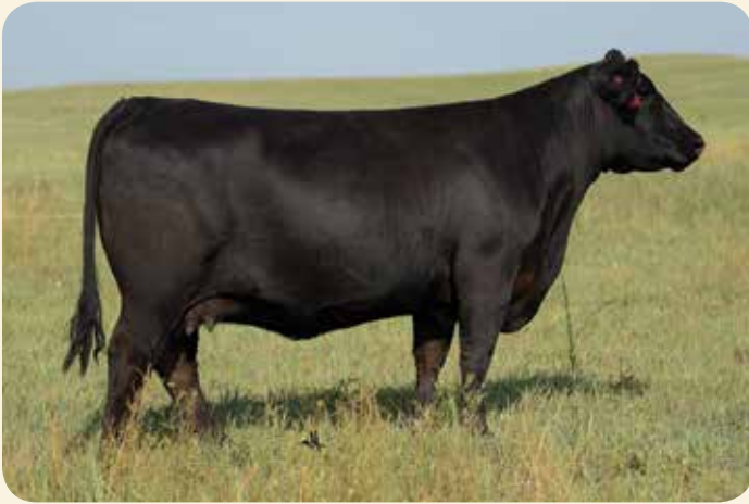
C-Bar Abigrace 563C - Dam of Lot 90