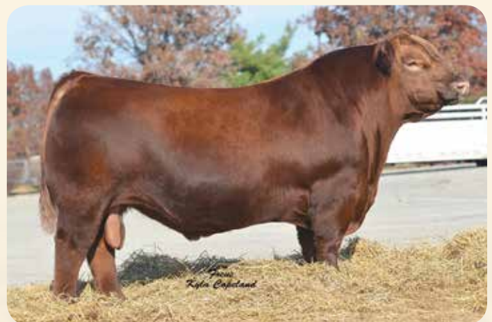
Silveiras Mission Nexus 1378 - Sire of Lot 123

This pair of flush brothers is sure to impress from a phenotype and cow family standpoint. Sired by the great 5L Defender, these brothers are from the Mimi W085 cow family. Their dam, 404B, is a top daughter of W085 by Anticipation 101W. They rank top 6% GridMaster, top 3% Marb, and top 9% YG. Use these full brothers to add uniformity and consistency to your calf crop!