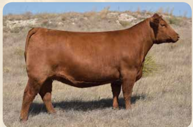
C-Bar Stony 502C - Dam of Lot 75