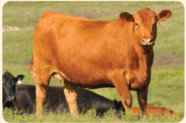
C-Bar Ms Stony A305 - Dam of Lot 49 - 50

826F is another top prospect by Red U-2 Reckoning 149A that is backed by the legendary Stony cow family. His dam, W928 is the Mulberry sired daughter of the great Brown C-Bar Ms Stony ML P7500. He is balanced numerically with solid performance and dimension.