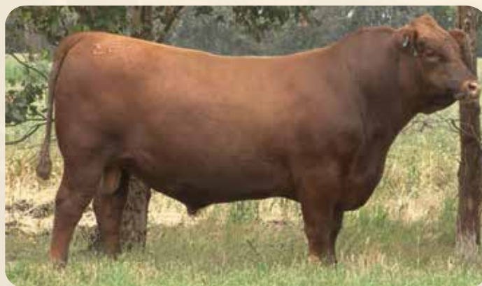
Milwillah Marble Bar J53 - Sire of Lot 93

BW: 73 AIMF: 6.28 AWW: 671 AREA: 15.04 AYW: 1176 ABF: 0.31