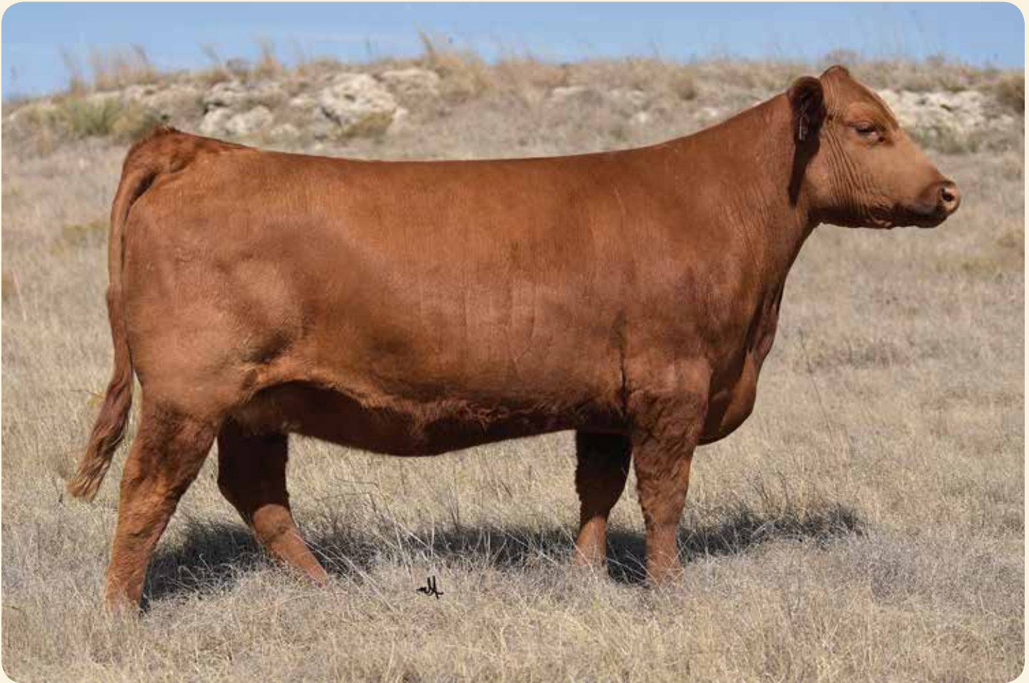
C-Bar Abigrace 417B - Dam of Lots 16 - 18