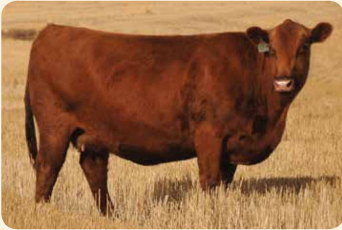
LASO Leanna BC114R - Maternal Granddam of Lot 114