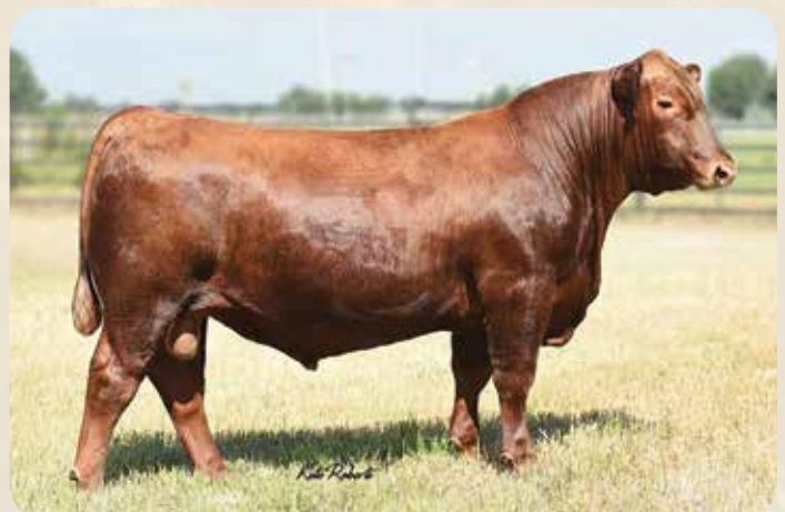
Big River - Full Brother to Lots 1 - 8

BW: 83 AIMF: 5.57 AWW: 681 AREA: 15.65 AYW: 1148 ABF: 0.21