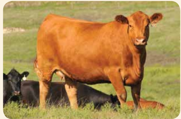
C-Bar Ms Stony A305 - Dam of Lots 23 - 24

Lots 23 - 24 - A305 is the full sister to A302, two of the most impressive females to ever walk the pastures of Brownell, Kansas. This pair of full brothers from A305 are sired by 5L Independence, making them full brothers to the late C-Bar Creedence 131D, an impressive herd sire that is represented by a stout set of sons in this offering. 809F and 8308F rank among the top 9% for BW and top 14% for CED. They are impressive individuals that are sure to offer calving ease genetics with real-world performance and power!