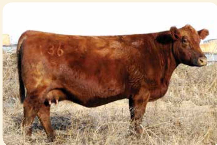
HXC Jaylo LB136 - Dam of Lot 117