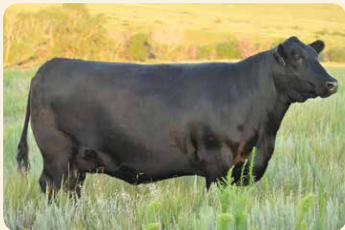
C-Bar Abigrace 214Z - Dam of Lot 82