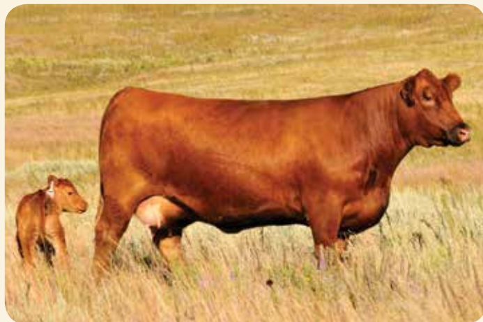
C-Bar Abigrace 264Z - Dam of Lots 98 - 101

Lots 98 - 101 - What a set of bulls by the $46,000 1/2 Interest Red U-2 Reckoning 149A that are from the $13,500 high selling donor dam in the C-Bar "Roses" Part I Herd Reduction Sale selling to Bowling Ranch of Oklahoma. There is no denying the structural integrity, body mass, capacity, and thickness that these herd bull prospects offer. Numerically they offer balanced figures with top rankings among the most elite in the breed for Milk. Study this set of flush brothers if you are interested in adding the power and potency of the great Abigrace cow family to your operations genetic make-up.