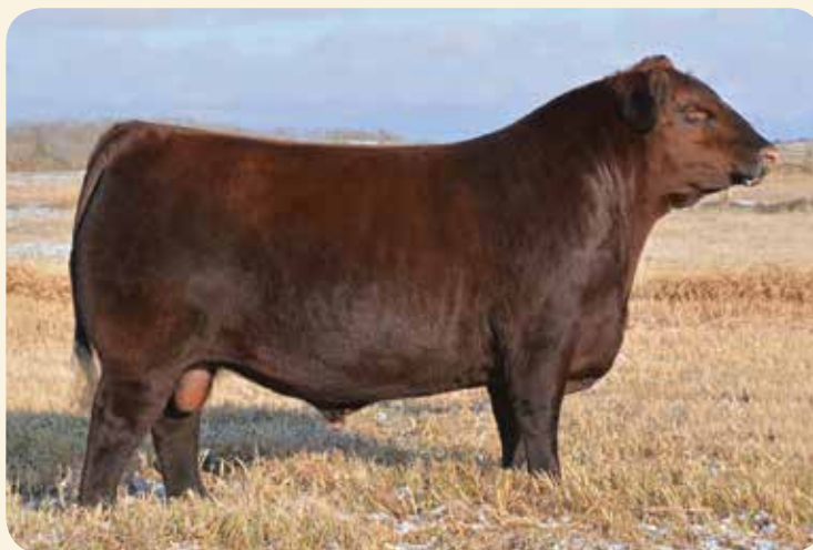
Red Six Mile Signature 295B - Sire of Lots 51 - 53

The Winning Bidder has the option to pick and choose or sweep the ring