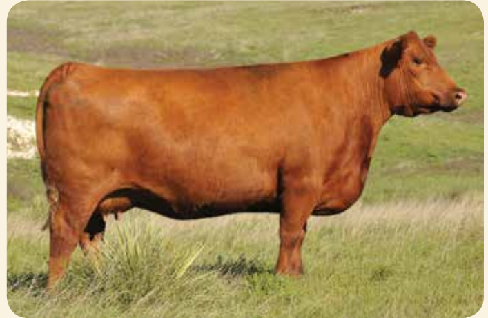
Red Geis Countess 20'10 - Dam of Lots 19 - 20

Lots 19 - 20 - 8135F and 8176F are flush brothers by Spur Franchise of Garton and backed by the 20X Canadian donor that was a highlight in the "Roses" Part I Herd Reduction selling to Nixon Family Farms in Texas for $9,250 this past spring. One of these brothers is red and the other is a black-red carrier. In terms of substance, power, and stoutness, these brothers check all the boxes. They are big topped, thick-ended bulls with exceptional shape to their lower quarter and center body. Both brothers offer sensible birth weights and weaned off heavy. Look to these two brothers from the productive 20X donor for added substance and dimension without sacrificing the convenience traits of calving ease.