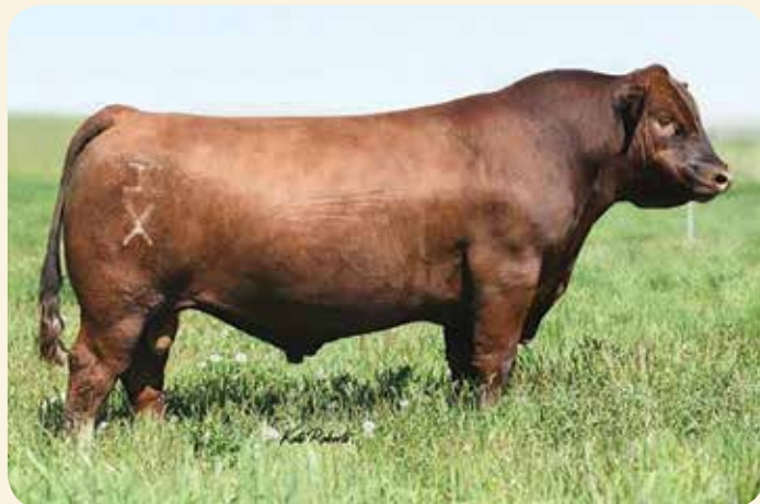
HXC Allegiance 5502C - Sire of Lots 36 - 47

851F is sired by HXC Allegiance and from an Angus female that is a daughter of Spur Franchise of Garton. He offers superior carcass merit. Study his elite number profile and scan data that are sure to set him apart on sale day!