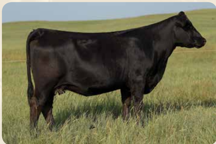
C-Bar Abigrace 562C - Dam of Lot 68