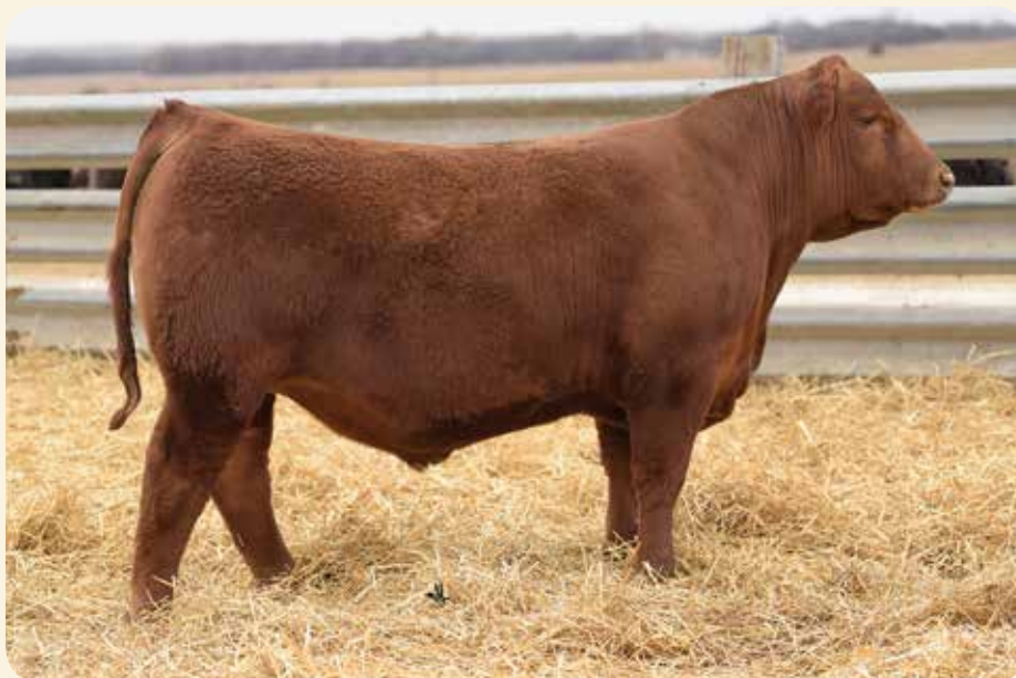
C-Bar Legit - Full Brother in Blood to Lots 36 - 37

The Winning Bidder has the option to pick and choose or sweep the ring