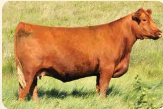
Jeffries Ms Joline Z243 - Dam of Lot 21