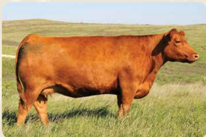
C-Bar Stony W914 - Dam of Lot 81

550E is an Independence son that is backed by HXC 108Y, an own daughter of the iconic P707. He charts top 12% GridMaster, top 16% CED, top 12% BW, top 18% WW, top 14% YW, top 13% ADG, and top 9% Marb. This number profile combined with his 72-pound birth weight make him a logical option for heifers.