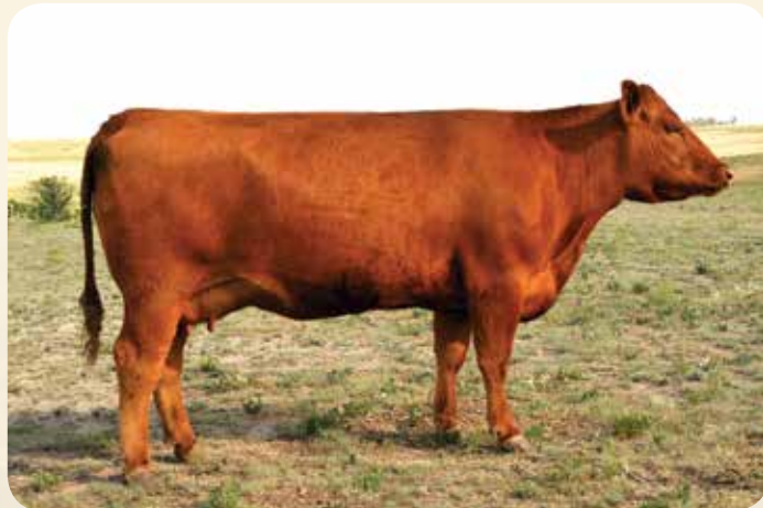
C-Bar Stony W909 - Dam of Lots 36 - 37

Lots 36 - 37 - What an exciting pair of flush mate brothers that are full brothers in blood to the $60,000 2018 High Selling Bull in the C-Bar Bull Sale, C-Bar Legit. There is no denying the impact that W909 and W914 have had on the progression of the C-Bar cowherd when it comes to generating beef bulls with superior carcass quality, predictability, and consistency on a large-scale level. These full brothers offer superior carcass merit with top ranking figures across the board. As an added bonus to the carcass potential that they will infuse into their progeny, they are supported by the famed Abigrace cow family that has left a monumental impact on the Red Angus breed and beef industry as a whole. Here is your change to put proven genetics from one of the most elite pedigrees in the business to work in your progressive operation.