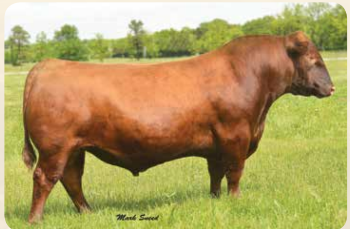
Brown BLW Legend A1965 - Sire of Lot 76

357E is son of Legend and backed by an own daughter of the $3 Million generating L7730 matron that has been a cornerstone within the Red Angus breed. He is a stout constructed, wide centered, thick-ended bull that offers balanced numbers. Top 17% BW, top 13% HPG, and top 18% Marb.