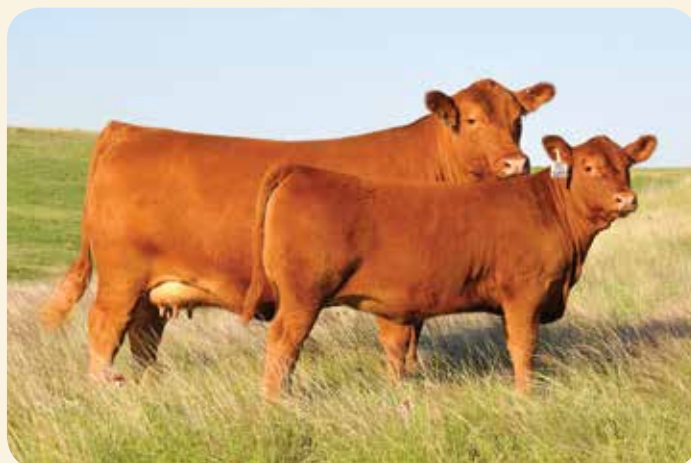
C-Bar Ms Stony A302 - Dam of Lots 12 - 14

The Winning Bidder has the option to pick and choose or sweep the ring