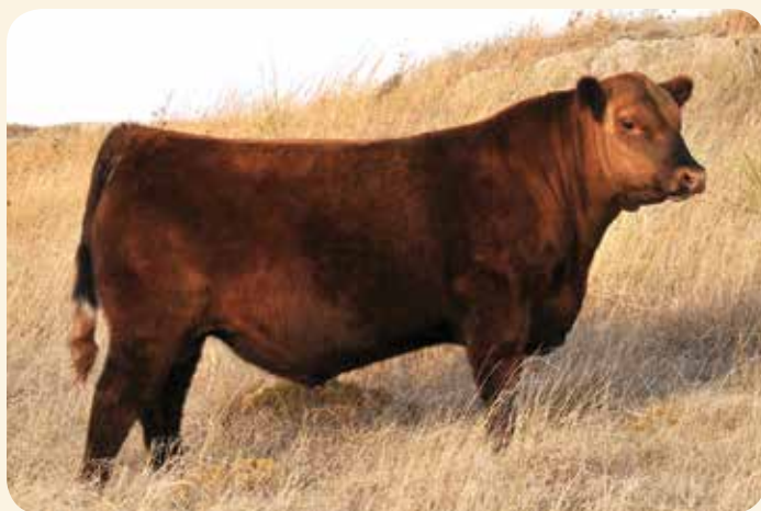
Creedence 131D - Sire of Lots 32 - 35