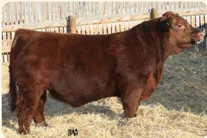
Red U-2 Reckoning 149A - Sire of Lots 98 - 101