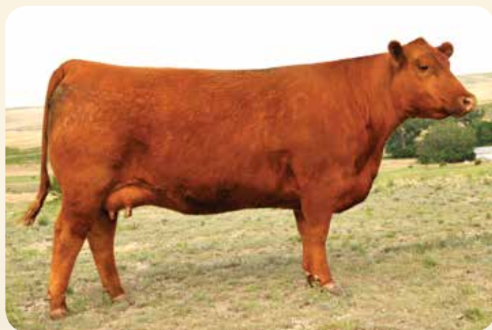
C-Bar Stony W928 - Dam of Lot 15

Lot 12 - 14 - An exciting trio of flush mate brothers that are sired by the legendary sire, Spur Franchise of Garton, the black red carrier carcass king that has made a major impact on the breed and beef cattle industry. These brothers offer uniformity, structural integrity, and carcass merit. They chart impressive data as they rank top 10% GridMaster, top 19% ADG, top 10% HPG, top 13% CEM, top 7% YG, top 12% CW, and top 1% REA. From the maternal side of his pedigree he is backed by the great A302 donor dam that has become one of the premier females in the breed due to her captivating presence, body mass, udder quality, and generating power! Look to these bulls to add carcass merit, real-world performance, and maternal power!