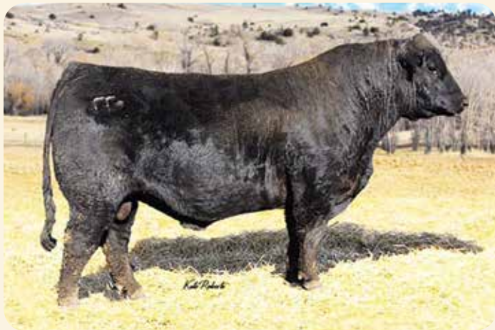
Spur Franchise of Garton - Sire of Lots 102 - 106