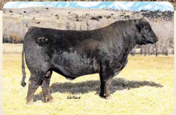
Spur Franchise of Garton - Sire of Lots 9 - 22

C-Bar Leverage 8115F leads o the Spur Franchise of Garton sire group. Another truly unique herd sire prospect that offers great promise. Leverage is an eye-appealing, well-balanced herd sire prospect that is smooth in his build, clean jointed, and long sided with exceptional shape and performance. On paper he continues to impress with a top 7% GridMaster, top 19% CED, top 18% YW, top 12% ADG, top 14% Marb, top 12% YG, top 13% CW, and top 1% REA. His dam, ADHM Stony 503C is an own daughter of C-Bar Ms Stony A302, the cover girl for past C-Bar marketing events and one of the most impressive females on the ranch. Leverage is the #1 YW and #1 REA bull in the entire offering! From a maternal standpoint, 8115F continues to impress. Consider the mating options and flexibility that 8115F offers and the impact that this multi-purpose sire offers to the Red Angus breed and beef cattle industry!