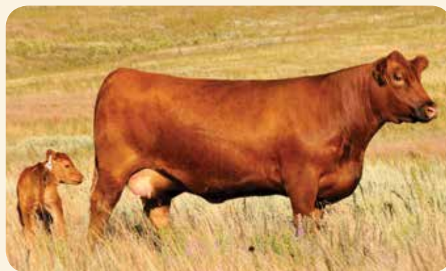
C-Bar Abigrace 264Z - Dam of Lots 54 - 59