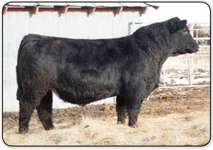
LOT 3 - VOLK BULL E734