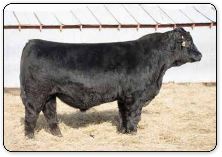
LOT 5 - VOLK BULL E733