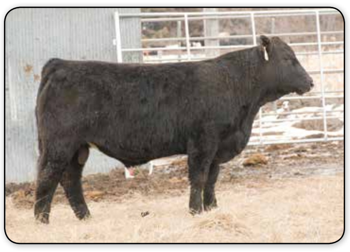
LOT 37 - HEALY BULL F25