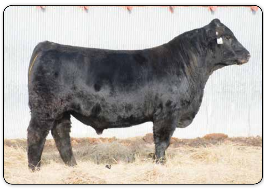
LOT 19 - VOLK BULL E738