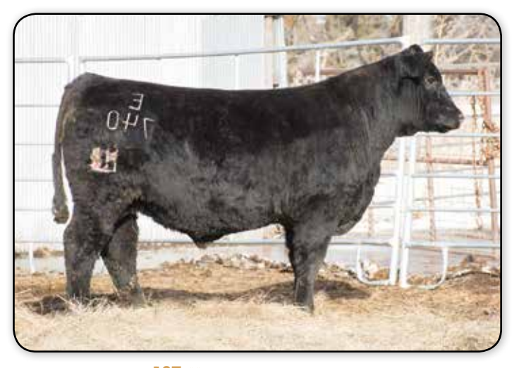
LOT 22 - THSF 740 BULL