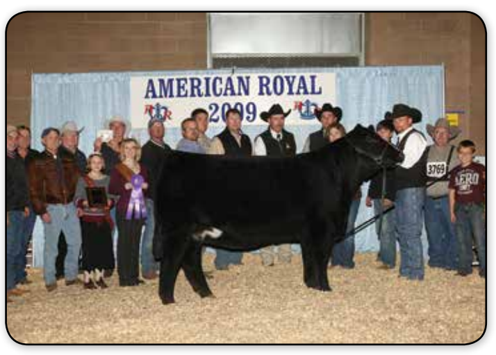
DAM OF LOTS 8 - 10 RP/MP RIGHT TO LOVE 015U