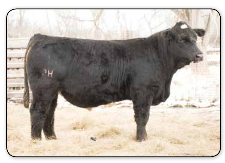
LOT 8 - THSF E744 BULL