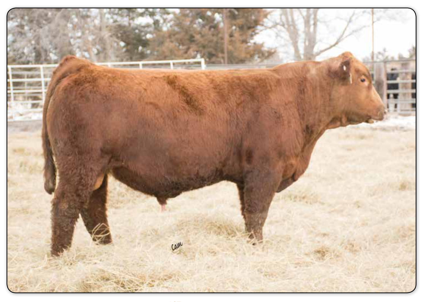
LOT 28 - THSF 714 BULL