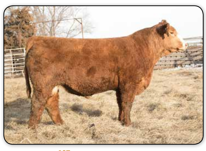
LOT 11 - THSF E718 BULL