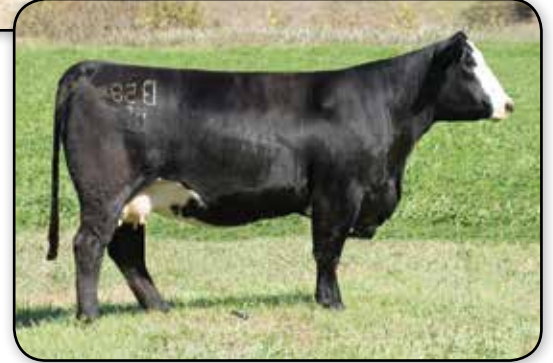
DAM OF LOT 15 THSF DOMINATING LOVE B58