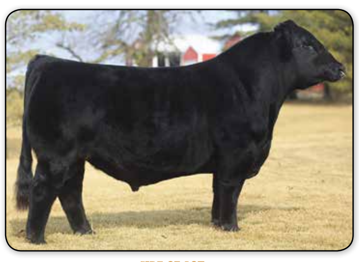
SIRE OF LOT 36 CDI INNOVATOR 325D