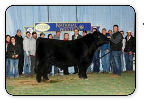
SIRE OF LOT 36 CDI INNOVATOR 325D