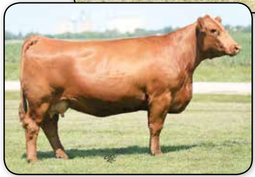
MATERNAL GRANDDAM TO LOT 32 JS SHES SO FINE 14P