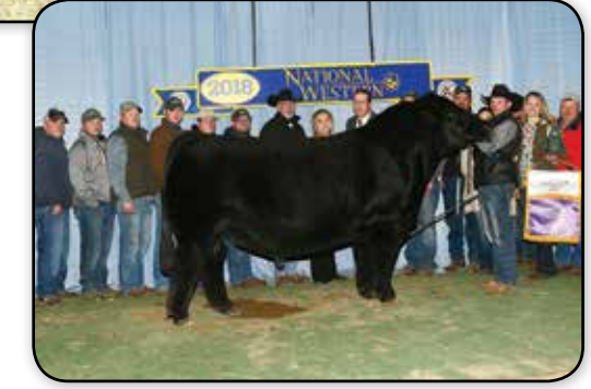
SIRE OF LOT 32 & 33 SC PAY THE PRICE C11