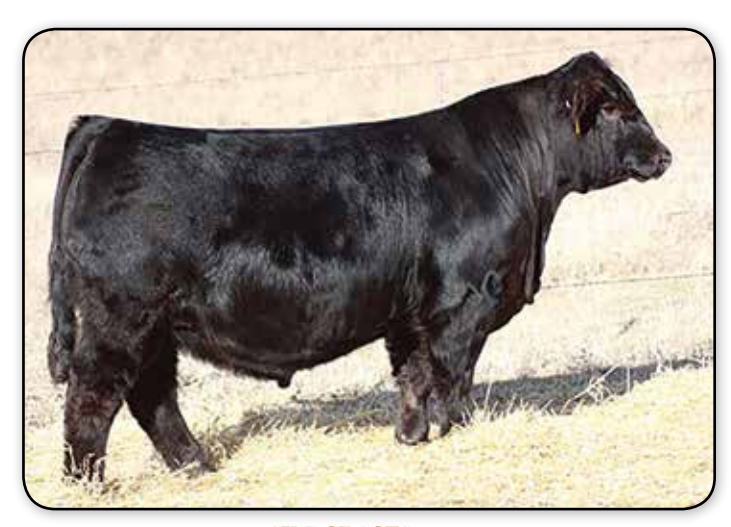
SIRE OF LOTS 3 - 6 W/C EXECUTIVE ORDER 8543B