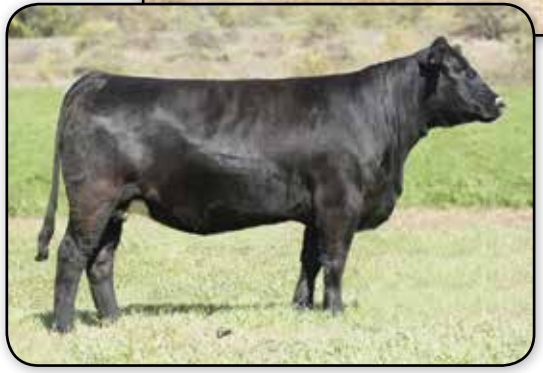
DAM OF LOT 14 THSF POWER LOVE B36