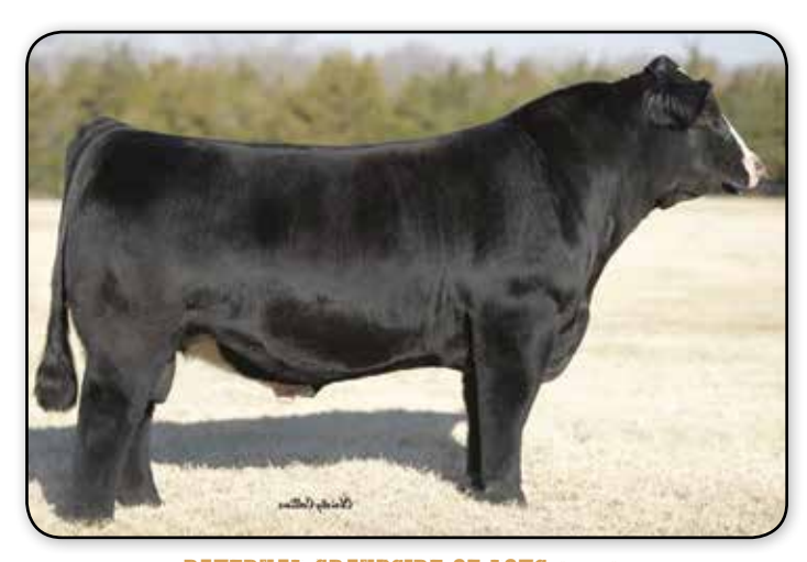
PATERNAL GRANDSIRE OF LOTS 21 - 23 SVF STEEL FORCE S701