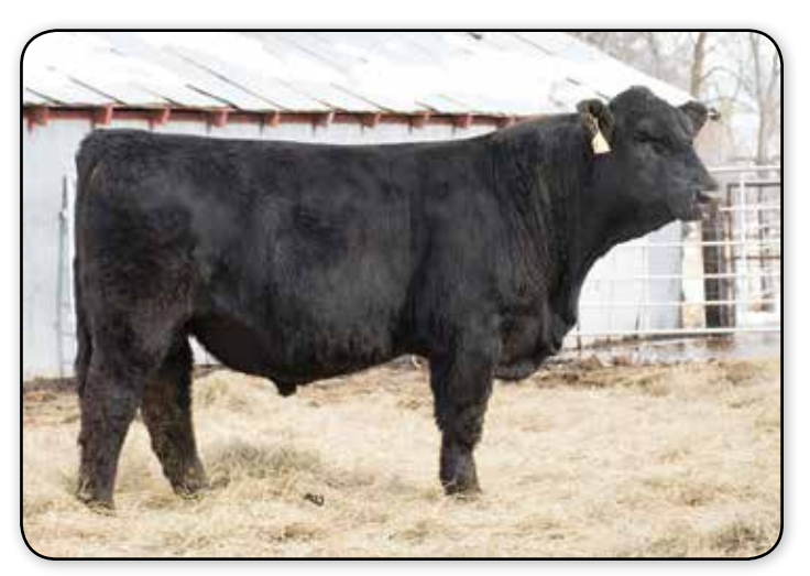
LOT 6 - VOLK BULL E724