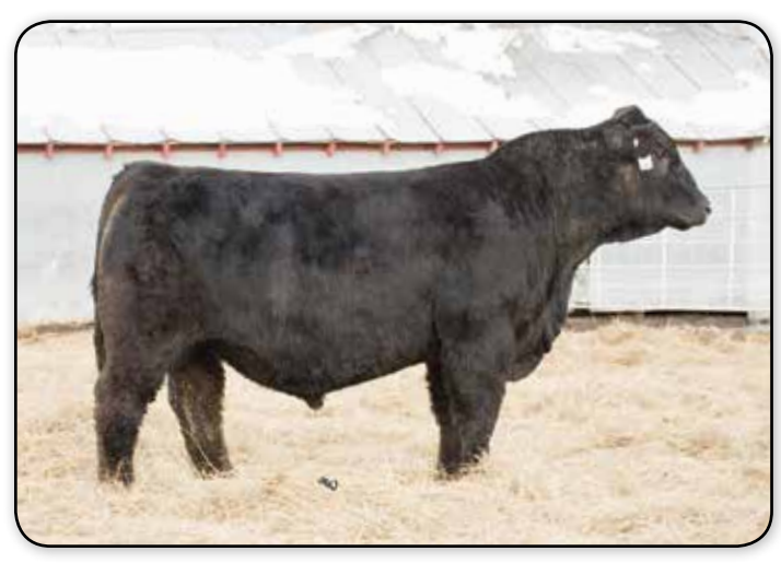
LOT 4 - VOLK BULL E736