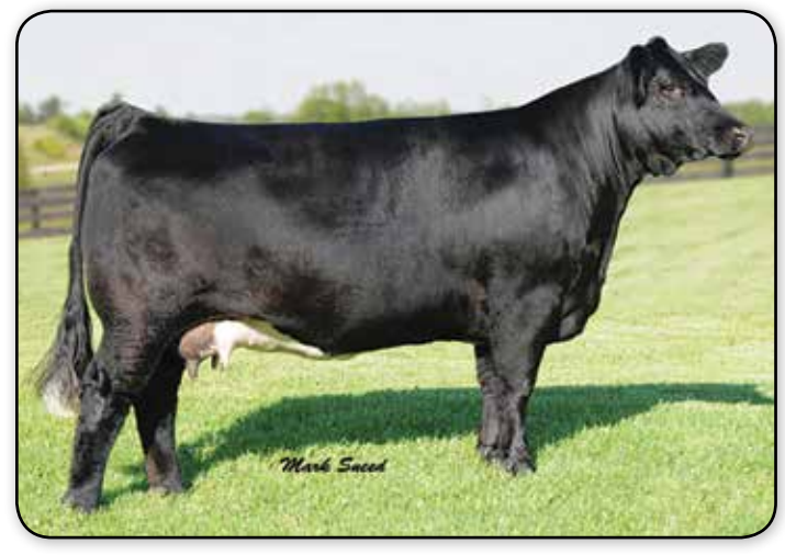
MATERNAL GRANDDAM TO LOTS 3 - 6 KENCO MILEY COTTONTAIL