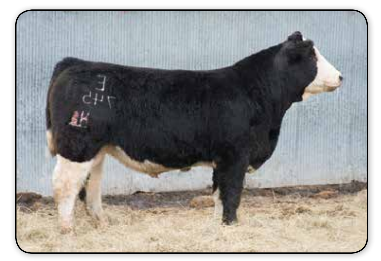
LOT 12 - THSF E745 BULL