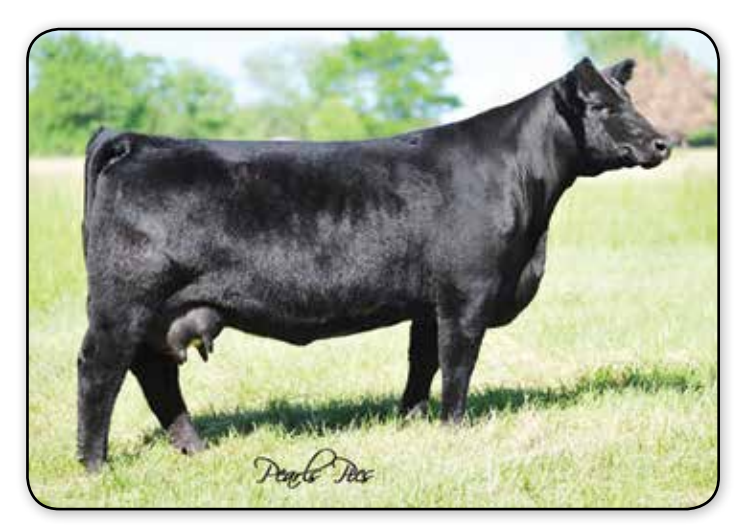
PATERNAL GRANDDAM OF LOTS 11 - 13 CAYENNE