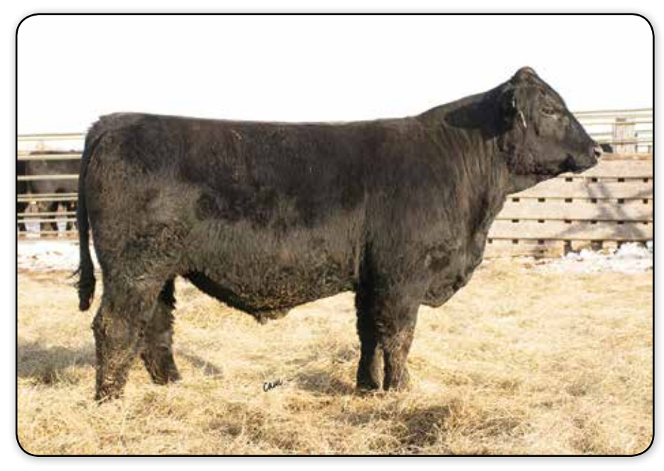
LOT 24 - THSF E735 BULL