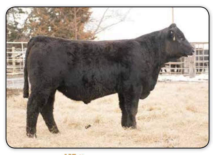
LOT 21 - THSF 708 BULL