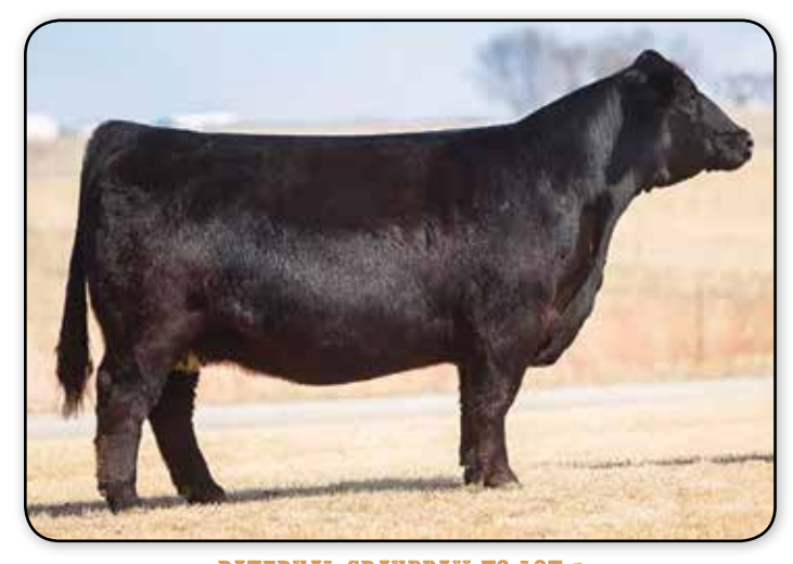
PATERNAL GRANDDAM TO LOT 7 JS FLAT OUT FLIRTY 46T