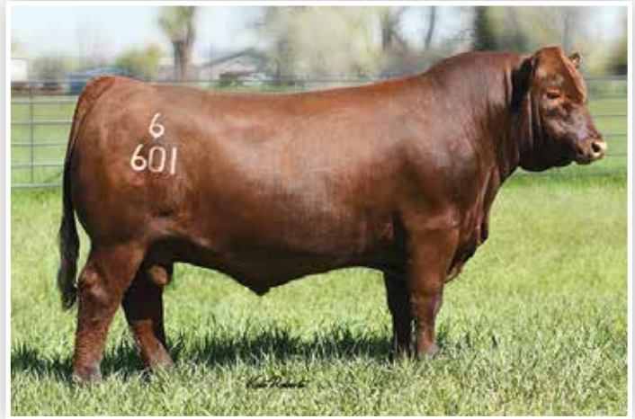
Crump Forerunner - Sire of Lot 36

Twedt Red Angus selected Crump Forerunner 6601 in the spring of 2017. He was a standout in all dimensions, sired by Pacesetter and backed by a proven donor dam on the bottom side. He offers exceptional foot design and structural integrity. 106F possesses quality both phenotypically and on paper as he charts with balanced and uniform figures. A 72 lb. actual BW makes him a viable heifer bull option.