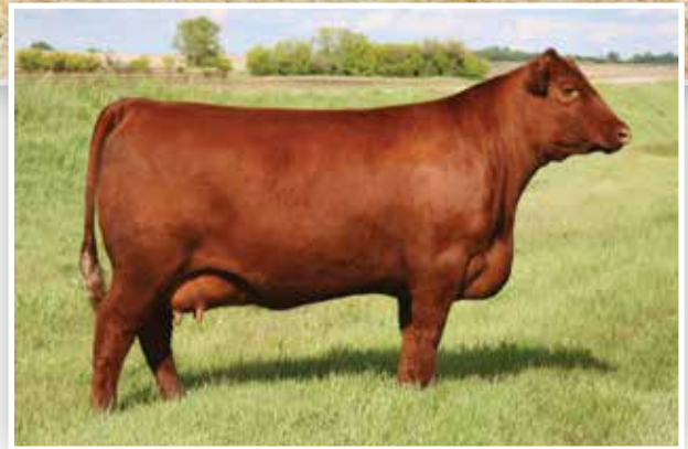
Red Soo Line Anne 7249 - Dam of Lots 68 - 69

An exciting pair of full sister bred heifers to lead off a powerful division of females! Sired by the six-figure WPR Legacy A-314 and backed by the famed Red Soo Line Annie 7249, arguably one of the most prolific and dominant cow families that the Red Angus breed has ever known. These females are big boned, sound footed, bold centered, and loaded with volume and capacity from end to end. We admire the phenotype, quality, and genuine dimension that these brood cow prospects offer. The mating flexibility, maternal power, and future that these females offer is second to none. We hate to part with females of this caliber but are committed to offering the best of the best!