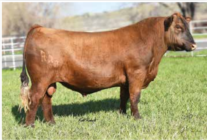
Driven - Sire of Lot 11

Another standout Hard Drive son that is sure to impress! This stout constructed, wide based, bold ribbed herd sire prospect is from a powerful Ram daughter that does an exceptional job time after time. He charts top 10% WW, top 13% YW, top 8% CW, and top 13% REA. A beef bull with strong maternal ties tracing back to the time-tested Lacy Gold 8123, a true maternal legend!