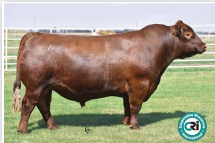
New Direction - Sire of Lot 35