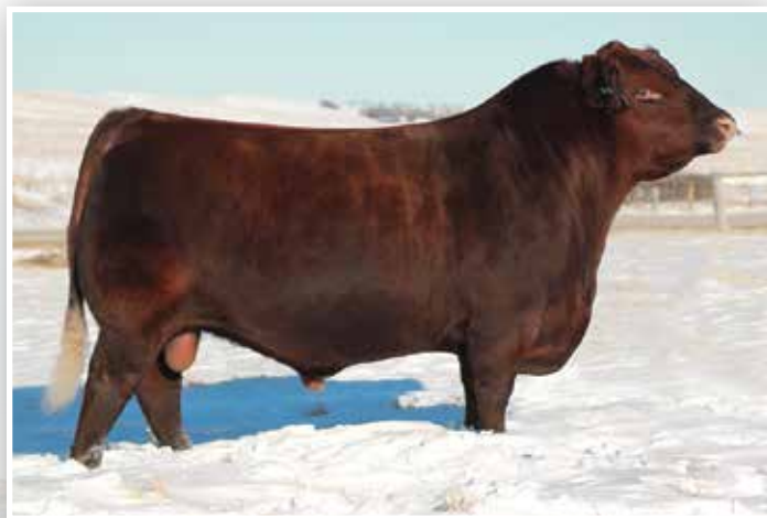
Signature - Sire of Lot 1