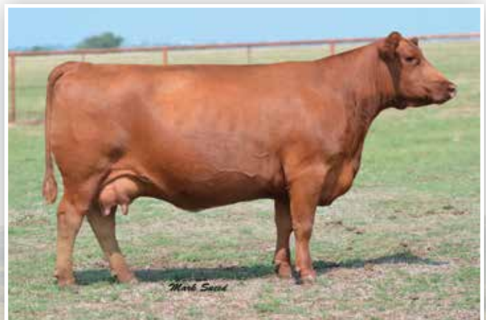
Sierra Indeed 549X - Dam of Lots 43 - 45