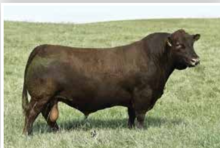
Rollin Deep - Sire of Lots 12 - 13

807 and 808 are standout flush mate brothers that are sired by the great Bieber Rollin Deep Y118 and backed by the powerful and prominent A-1 Sierra Indeed 549X donor that is now employed in the progressive Smoky Y Ranch program of Western Kansas. These herd bull prospects are big ribbed, easy fleshing, dark red, and sound built bulls that offers visual performance and eye-appeal, with a rugged and athletic structural base. We have admired this pair of flush mate brothers since they first hit the ground. Sierra Indeed 549X was a featured female in the historical A-1 Dispersal in Texas, where Wildcat Creek Ranch of Kansas purchased her. In the Wildcat Creek Ranch Dispersal, Smoky Y Ranch selected this picture perfect Red Angus breeding piece. 549X is an own daughter of the great Red Towaw Indeed 104H, a bull that when semen is offered has commanded in excess of $1,000 per unit! Rest assured, these full brothers are ready to make an impact on your program!