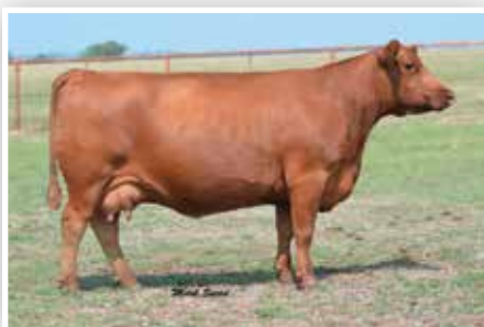
Sierra Indeed 549X - Dam of Lots 12 - 13