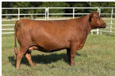
New Era A7084 - Dam of Lot 26