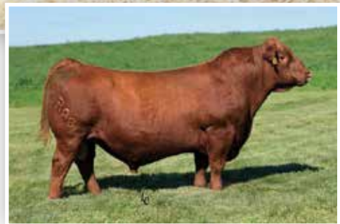
Hard Drive - Sire of Lots 7 - 10