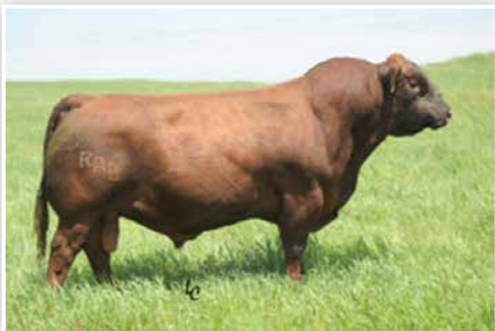
Roosevelt - Sire of Lots 31 - 32

63% 87% 57% 85% 59% 67% 23% 4% 82% 48% 47% 82% 77% 47% 51% Rushmore 24F is another Bieber Roosevelt son that offers tremendous structural integrity and overall performance. An exceptional PIE Venture daughter backs him on the south side of his lineage. With an actual birth weight of 64 lbs. we strongly feel that he is a logical heifer safe option if managed correctly.