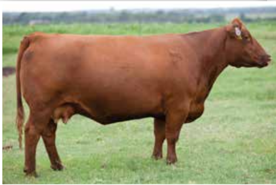
Harmony's Windsong 110 - Dam of Lots 46 - 47