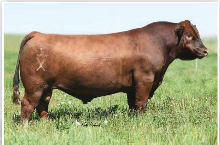
Allegiance - Sire of Lots 22 - 24

116F is another standout from the Allegiance sire group. His dam is a top producing female that is sired by Red RMJ Redman 1T. Balanced on paper, he ranks among the top 4% of the breed for Herd Builder and top 11% for GM. He offers a sensible actual birth weight of 74 lbs., making him a legitimate heifer bull candidate.