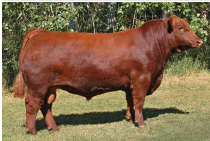
Detour - Paternal Grand sire of Lot 34