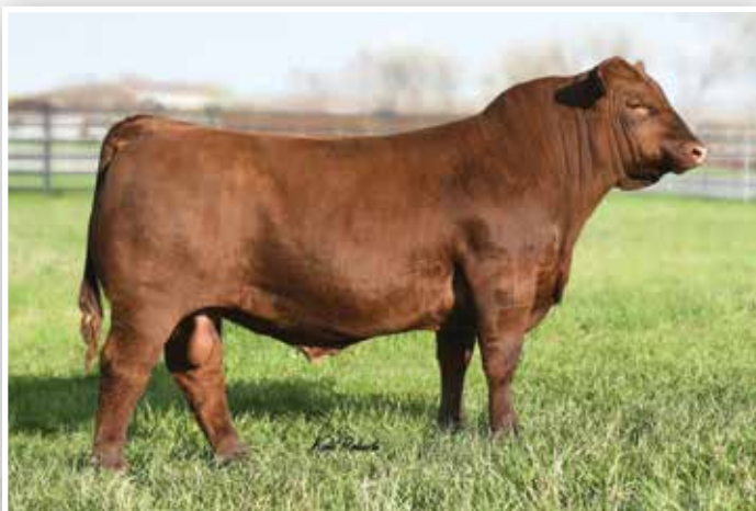
My Kind - Sire of Lots 2 - 6