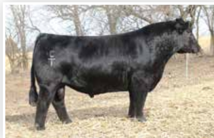
High Calibre - Sire of Lot 34

AI BRED 4/20/18 TO W/C NIGHT WATCH 84E (ASA: 3336327).