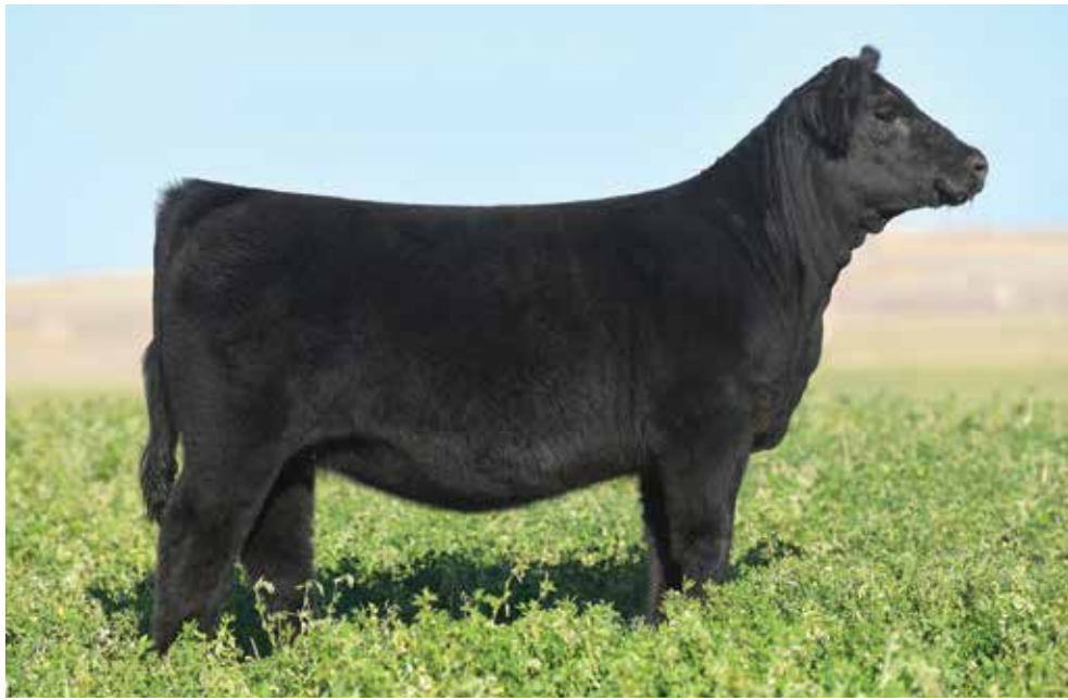
Lot 3C - TKCC DOLLY 62F