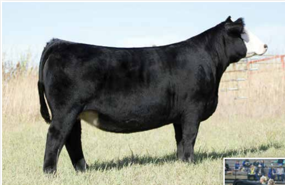
Miss Up - Dam of Lot 202

Miss Up D46 was one of the featured bred heifers in the 2017 edition of The Event. Her undeniable body shape, capacity, and density was admired by all. This mating to the 2018 NE State Fair Supreme Champion Bull and 2018 American Royal Reserve Grand Champion Simmental Bull, Voyager, is sure to be a big time mating!