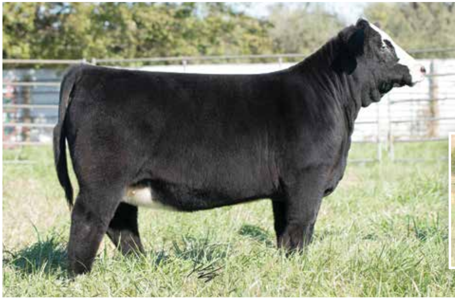
Lot 1A - VCL LKC LADY DI 274F