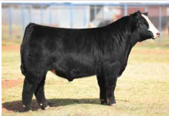
Counter Attack - Sire of Lots 200 & 200A