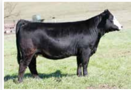
Lot 57 - VCL MISS PROFIT 727E

AI BRED 4/12/18 TO W/C NIGHT WATCH 84E (ASA: 3336327).