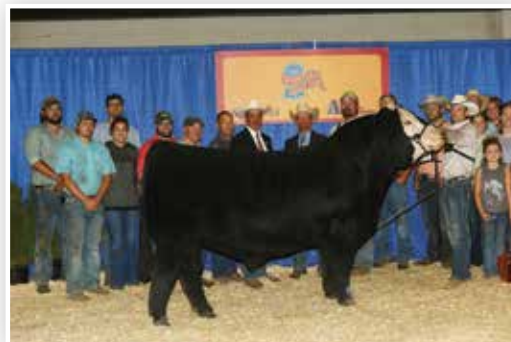
Lot 105 - JMG VOYAGER4242D