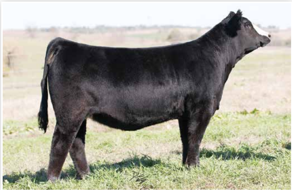
Lot 2C - VCL LKC FIONA 804F