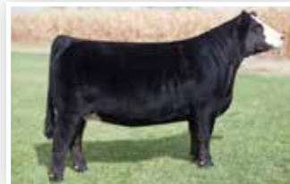
Dolly - Dam of Lot 47

The first-born natural calf from the 49C donor employed by Rains and Bird. There is no denying the presence and balance that this female offers. Sired by the Circle M Farms produced Angus stud, Tejas! The direct daughter of the famed Dolly, a female that has produced countless five-figure sires and daughters for Kearns Cattle Company, backs her. We highly anticipate this half-blood female to make a name for herself as she combines the lineage of the legendary Queen 414 and Dolly! AI BRED 4/18/18 TO W/C EXECUTIVE ORDER 8543B (ASA: 2900283). PE 5/1/18-7/1/18 TO RAINS DROVER E30 (ASA: 3377718). TOO CLOSE TO CALL.