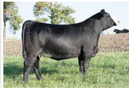
Lot 49 - BT MISS MAIDEN E52

E52 offers an exciting genomic profile that is further enhanced by her phenotype and structural integrity! This baldy faced, bold ribbed, high volume female is one that is sure to turn heads visually and on paper! She charts impressive figures as she ranks among the top 10% of the breed for MCE, Milk, MWW, Marbling, and TI, while the top 15% for Doc and API! 7 Traits in the top 15 percent of the breed with the phenotype that is sure to generate at the highest levels. With her impressive 140.5 API this female offers unlimited upside from a mating flexibility standpoint! AI BRED 5/7/18 TO THOR 503C (ASA: 3208952).