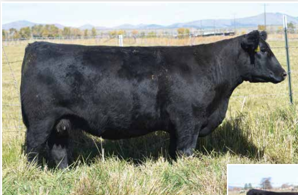
Miss Yardley Y55 - Dam of Lots 203A & 203B