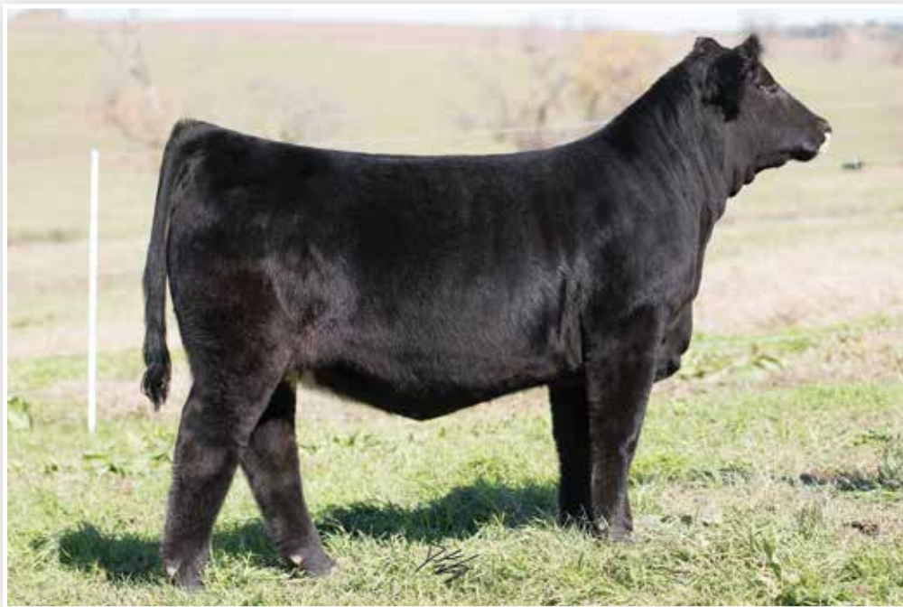
Lot 9A - VCL FARRAH 801F

Foxy Lady, the up and coming donor at Vogler Cattle Company that continues to kick out the “good ones!” Although she doesn’t have the ASA seal of approval from an API standpoint, she is sired by arguably the greatest Simmental sire of our generation, MR HOC Broker. She is a big footed, wide based; bold ribbed female that personifies what a donor dam should look like! We mated her to the Triple Crown winning Primary Candidate with hopes of creating elite show heifers, and that is just what she did! 801F and 803F are big boned, stout constructed females that have been blessed with the added look and presence from the profile, while having the big hair as an added bonus! The undefeated Pays to Believe also clicked on Foxy Lady, generating a big footed, long necked, bold ribbed female that is tagged 854F. We truly believe that this trio will endure a successful run at the end of a leather lead, but more importantly they will make a valuable contribution to their new owners once in production!