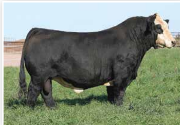
Bankroll - Sire of Lot 14

A smooth made, attractive daughter of the $205,000 Bankroll that is sure to turn heads on sale day! She is backed by the Cowboy Cut sired two-year old that is a direct daughter of the Y10 donor in the Rains program. She is loose structured; square hiped, long fronted, and has the futuristic look about her profile. Her phenotype and balance are further complimented by her balanced number profile!