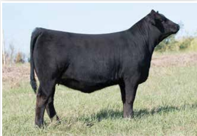
Lot 16A - BT ELOISES ERICA F62

Without a doubt two of the most impressive percentage females in the offering, backed by the Eloises Erica B3 donor dam, these females offer unlimited upside from a production standpoint! The $400,000 TJ High Caliber stud sires F62. She boasts an impressive spread from 1 at birth to a 108.3 at a year! This combined with her bold and dimensional rib cage that is further enhanced by the substance and density that she possesses from every angle. F18 is her maternal sister that is sired by the six-figure valued Fortune stud that is an own son of the American Royal Champion, Firefly. She is an elegant made female that is neat about her head and neck, bold ribbed, and sets to the surface with authority. She is our pick to lead, but her true value will come after entering production. Just imagine the mating flexibility and options when it comes to the next generation of purebred seedstock that is to come!