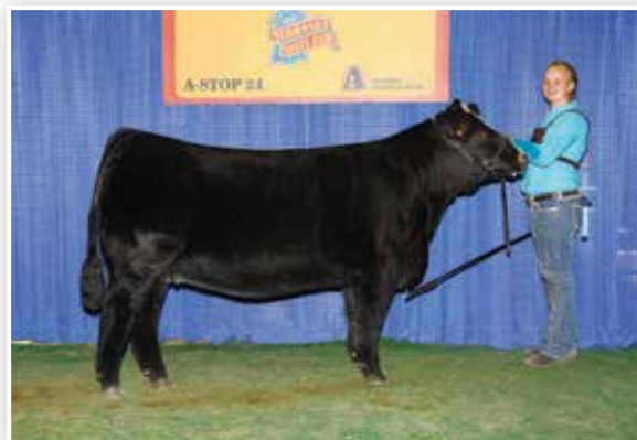
Shannon - Dam of Lots 10A & 10B