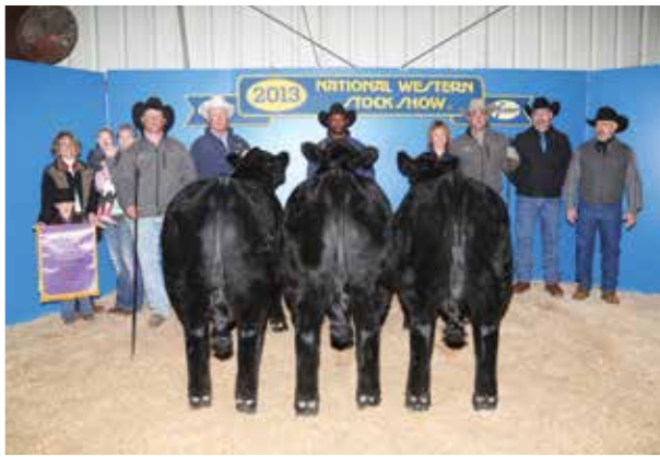
2013 NWSS Champion Pen of Three Simmental Bulls Kearns Cattle Company