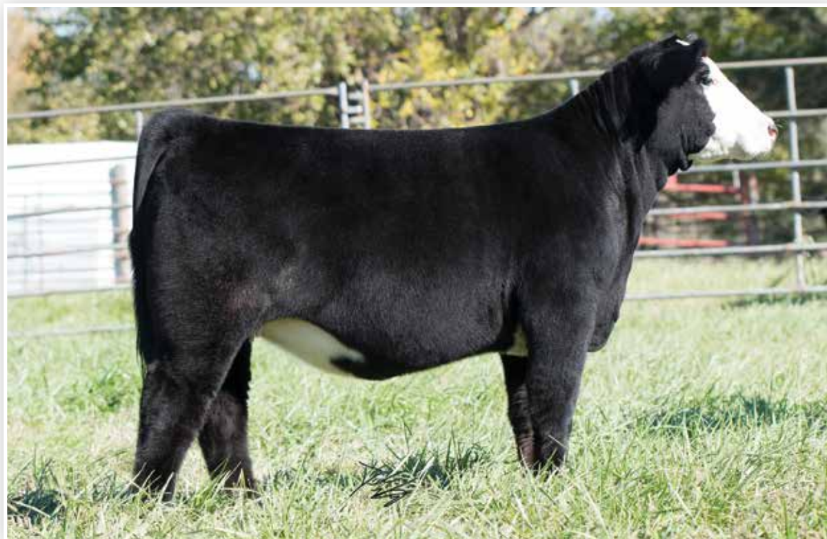
Lot 19 - LKCC JACK`S DREAM 87F