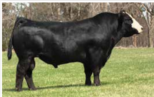
Dream Catcher - Sire of Lot 62

E357 is a direct daughter of the legendary Dream Catcher! She offers a tremendous profile, bold rib design, and remains flawless in her structural build on the move. She is sired by the herd sire responsible for one of the highest dollar generating females in the breed, nearly approaching $5 Million in progeny sales, the great 8543U! AI BRED 5/9/18 TO THOR 503C (ASA: 3208952).