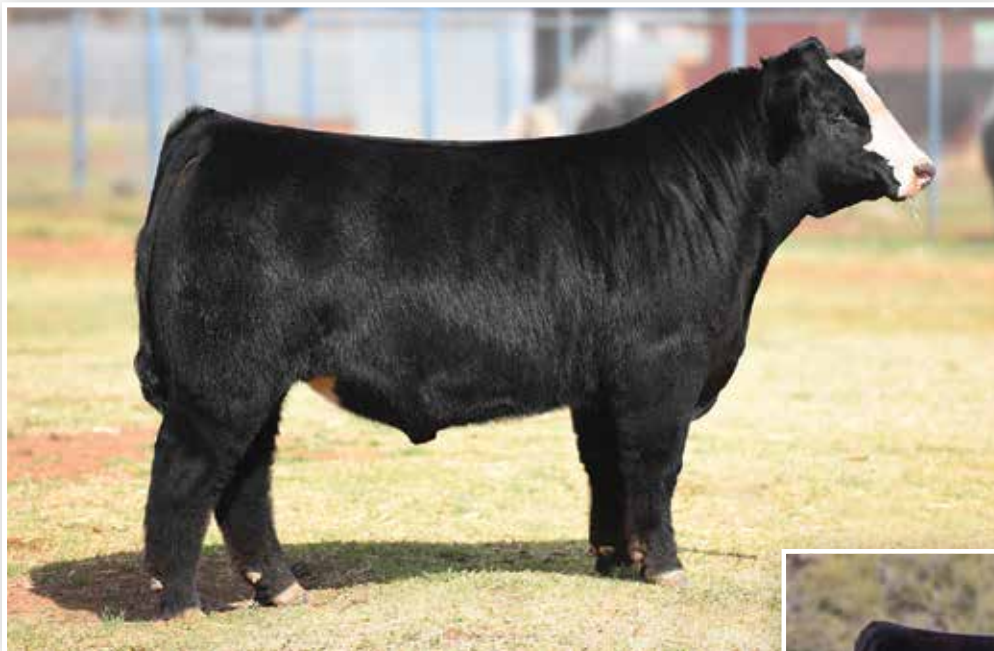
Counter Attack - Sire of Lots 201 & 201A

Counter Attack continues to make waves across the breed, siring cattle that offer an extreme look of quality and future. He sired the high selling open in the 2018 Black Label Event Spring Sale and continues to sire the good ones! Rains Dream Edition 117 has been a prolific female for the Rains program, producing the D117 and E117 females that were featured in The Event for the last two years. Big time opportunity here in the form of a heifer pregnancy and embryos!