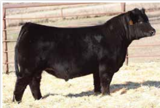
Night Watch - His service is featured throughout the offering!