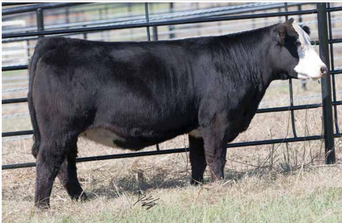
Lot 46 - RAINS MO LOOKS E7

Without a doubt this bald faced beauty is sure to make the short list of even the most critical cowboys and cowgirls on sale day. Her sensible frame size is further complimented by her flawless build and bold sprung rib shape. Her dam is a highly productive BC Lookout daughter that doesn't miss! This direct daughter of Bullseye sells safe in calf to the breed leading Battle Cry, arguably Broker's most consistent siring son! AI BRED 4/17/18 TO RUBY SWC BATTLE CRY 431B (ASA: 3134619). UTRASOUNDED SAFE WITH A HEIFER CALF PREGNANCY.