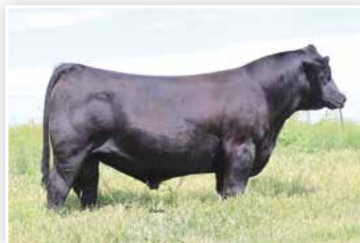
Perfect Vision - The full brother to MR CCF 20-20 that walks the pastures of Kersten Cattle Company and is now listed with Cattle Visions!