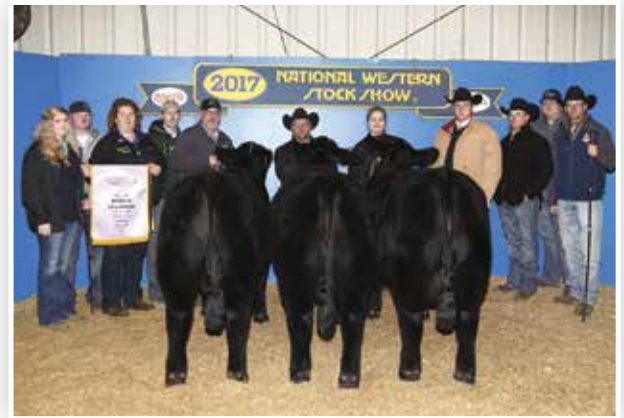
2017 NWSS Reserve Champion Pen of Three Simmental Bulls Vogler Cattle Company & Kersten Cattle Company