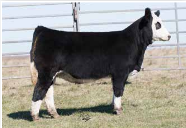
Lot 24 - LLW MAGGIE MAE 831F

An exciting pair of maternal sisters from the famed Queen 414 cow family. Their dam is the powerful full sister to Lydia and Renegade, two influential individuals within the Simmental breed that were raised in the Walter Cattle Company program of Oklahoma and are responsible for multiple national champions! Lot 24 is by the Triple-Crown winning Broker, while the NAILE Grand Champion, Blaze of Glory, sires lot 25. There is no denying the maternal power and stability that backs this powerful pair of foundation building females.