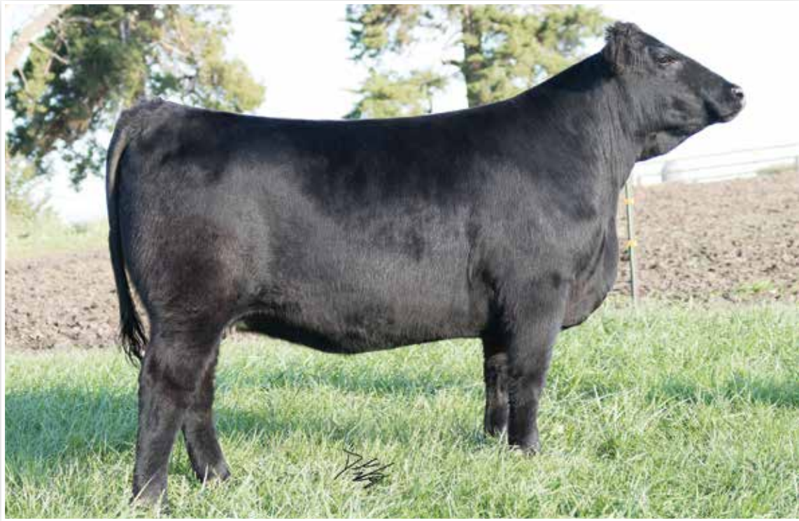
Lot 70 - TCC Miss Sunset E10

The lone Angus female in the offering but certainly one that is worthy of your evaluation! Sired by the K Bar D stud Joe Canada, this female is moderate, bold ribbed, and powerfully constructed. Her Venture sired dam was a leading donor dam for K Bar D in Oregon before her demise, leaving behind countless sons and daughters behind, including a top son of New Standard. There is no denying the impact of powerful Angus genetics, especially when considering the mating options the Simmental breeds most proven sires. Half-blood females have commanded record prices this fall; here is your opportunity to get in on the ground floor! AI BRED 5/18/18 TO SFG THE JUDGE D633 (ASA: 3208952).