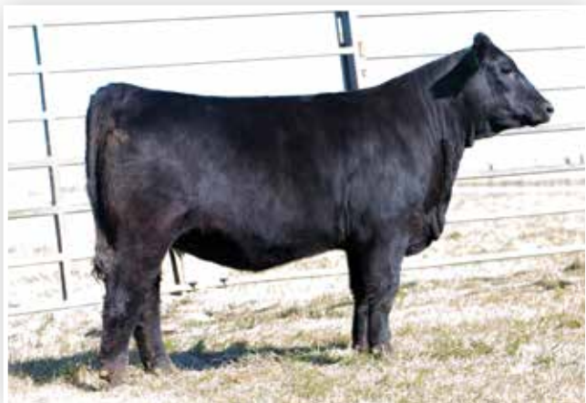
Lot 28 - MDH PRIMROSE 793E