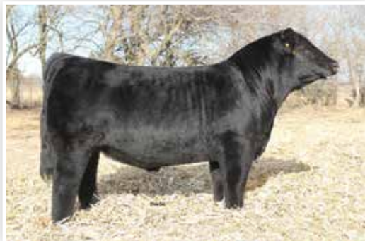
Lot 100 - PROFIT