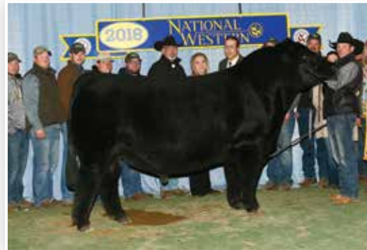
Pays the Price - Sire of Lot 12

From Tucker and Wolfe comes an own daughter of the two-time National Western Stock Show Grand Champion SC Pay The Price! Many have argued Pay The Price to be the most dominant show bull to grace "the hill" at the 2018 NWSS regardless of breed, and we wouldn't disagree! Much like her sire, this female is stout footed, big boned, loose made in her structural design, and offers a captivating presence at the end of the lead. Her dam is a role model type female that does an exceptional job year after year. A surefire option to lead and at the end of the day a legitimate contributor in production!