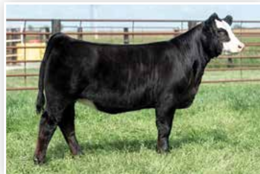
Maternal Sister to Lots 203A & 203B