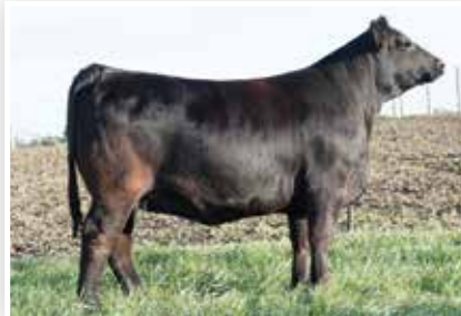
Lot 50 - SCHRAM DIXIE E117

E117 is a top daughter of Cowboy Cut. She is a big boned, stout made, soft-bodied type female that exemplifies volume and capacity. She is fluent in her movement and sells safe in calf to her AI sire with no pasture exposure! AI BRED 4/25/18 TO HIGH CALIBRE 556B (ASA: 2891465).