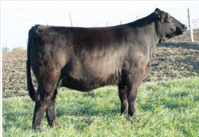
Lot 54 - SCHRAM RUBY E407