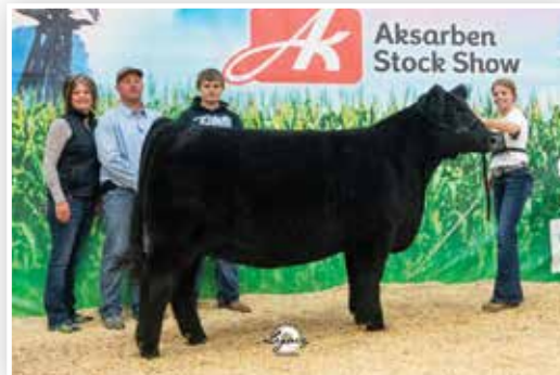
RBCK Black Satin 15E