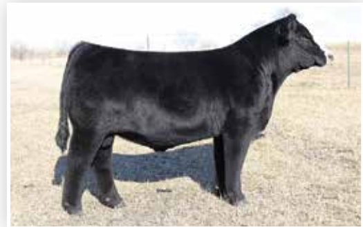
Hammer - Sire of Lots 35 & 36

AI BRED 4/13/18 TO W/C NIGHT WATCH 84E (ASA: 3336327).