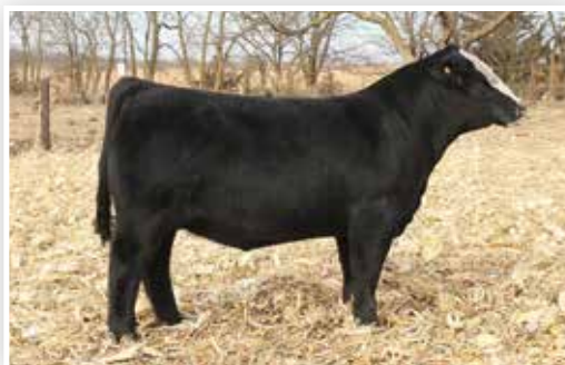
Cannon - Sire of Lots 37 & 38