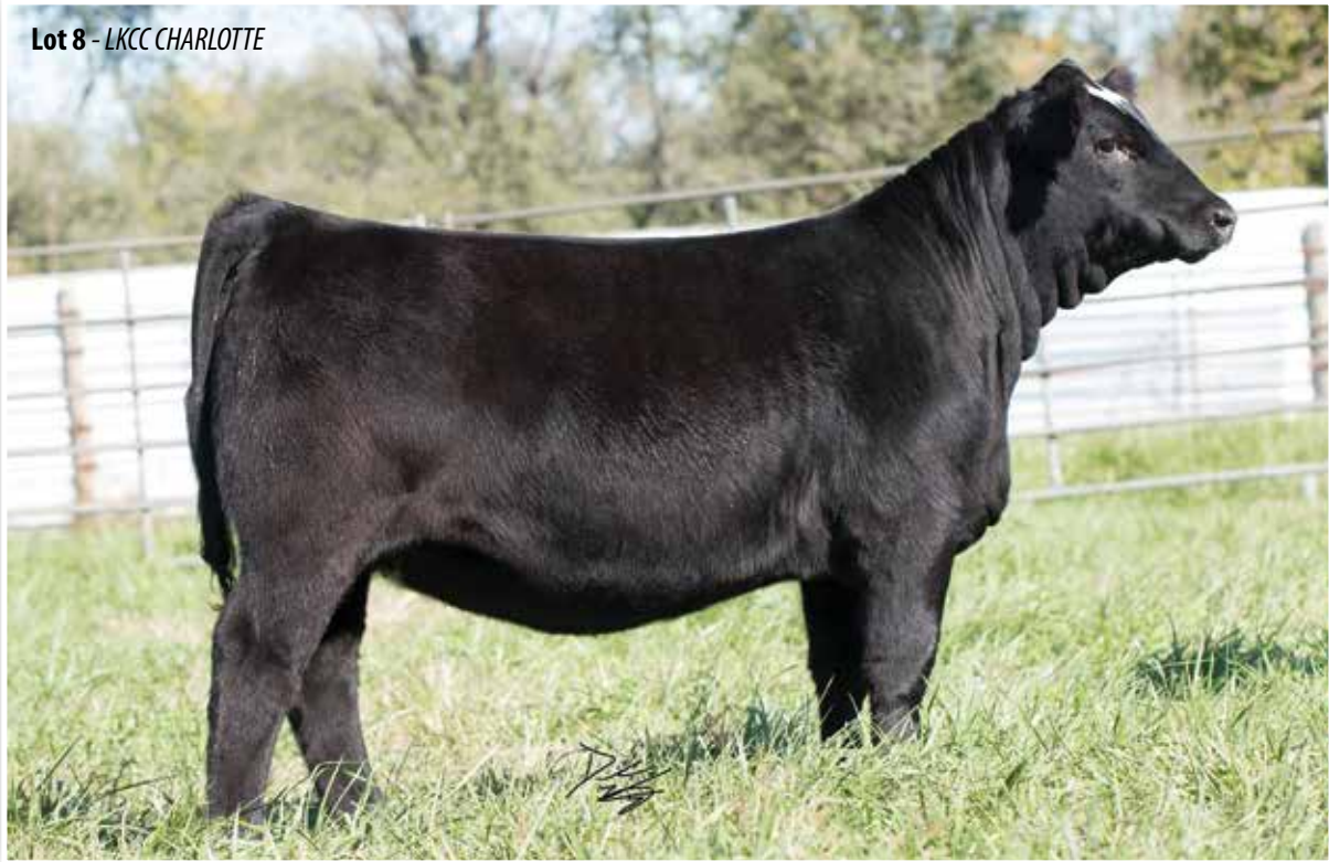
Lot 8 - LKCC CHARLOTTE