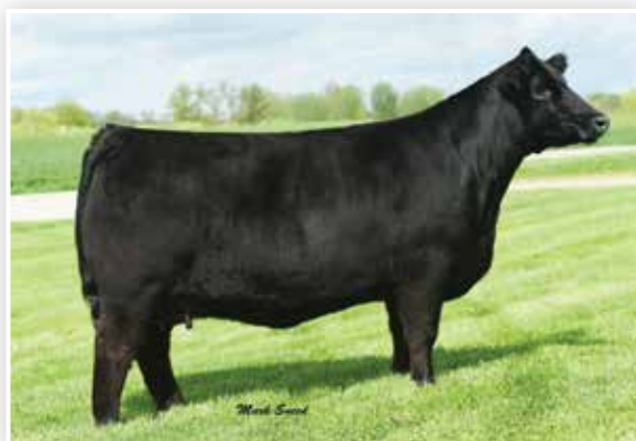
Queen of Spades - Dam of Lot 24 & 25