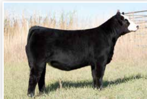
E117 - Maternal Sister to Lots 201 & 201A