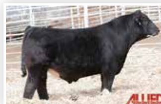
TJ Frosty 318E - Service Sire to Lot 48

The impact that JS Sure Bet has had on the breed as a female maker is quite possibly second to none! Here is another Tejas sired half-blood that is backed by the Sure bet x Miss Fantastic female on the south side of her pedigree. She is big boned, bold ribbed, and wide centered. A brood cow in the making! AI BRED 4/17/18 TO TJ FROSTY 318E (ASA: 3288449). ULTRASOUNDED SAFE WITH A BULL CALF PREGNANCY.