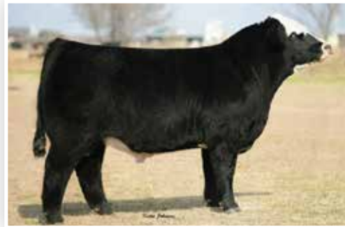
Conagher - Service Sire to Lots 52 & 53

E8 is an ultra attractive daughter of the great Cowboy Cut. She charts among the top 20% or better in 8 different traits of economic importance. Her well-balanced look from the profile further compliments her basic build and fundamental correctness. Double digit calving ease that spreads to triple digits at a year only offers that much more incentive from a mating flexibility perspective. AI BRED 4/17/18 TO SWC HOC CONAGHER 019C (ASA: 3100807). ULTRASOUNDED SAFE WITH A HEIFER CALF PREGNANCY.