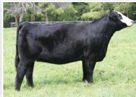
BT Miss Voyage Y956 - The $17,500 dam of Lot 43

E1 is a captivating blaze face female that offers a different twist from a pedigree standpoint. Sired by Revival, the Uprising son produced in the Walsh Simmentals program, this female offers a balanced look from the profile and remains flawless in her movement. She is bold ribbed, neat chested, deep flanked and ultra feminine about her head and neck. This females overall symmetry and proud head carriage is further complimented by her maternal backing on the south side of her lineage. Her Banito sired dam has been a steady and reliable producer! AI BRED 5/9/18 WITH SEXED HEIFER SEMEN TO HETN NO WORRIES 138Z (ASA: 2951156 or AMAA: 435803). PE 5/24/18-8/24/18 TO PCC 245 (ASA: 3442689).