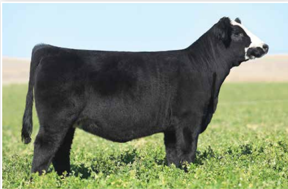
Lot 7 - KCC1 FALLON 4032F

Here is another top Purebred prospect in the offering that is backed by the Pilgrim x Coco donor at Kearns Cattle Company known as "Beyonce." She is sired by Gentleman's Jack, the TLLC One Eyed Jack son of the potent Yetti 143Y donor dam in Murray, Iowa. She is a big footed, stout constructed, wide centered female that offers a three-dimensional body type, while balancing from the profile with the best of them! Her unique color pattern on her head further enhances her captivating presence. A different twist from a pedigree standpoint but is a surefire candidate to campaign at the highest levels!