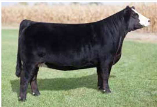
Dolly - Dam of Lots 200, 200A & 200B