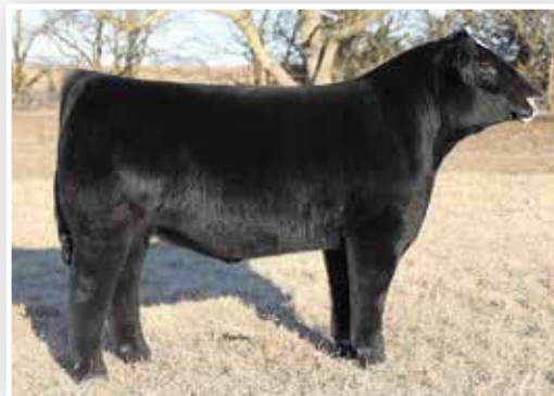
Thunderstruck - Sire of Lots 60 & 61

E107 is a top daughter of Thunderstruck that is angular, smooth shouldered, and bold centered. She is big hipped and sets to the surface with authority. Sells safe AI to the $435,000 Currency! AI BRED 5/5/18 TO TO RUBY'S CURRENCY 7134E (ASA: 3282185).