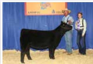
Lot 20 - Nebraska State Fair

F102 is a top 3/4-blood prospect from the Rains Simmental program that is sired by one of the most popular sires in the business today, W/C Loaded Up. Her dam was bred by one of best cowboys the breed has ever known, Gib Yardley of Beaver, Utah. This female offers a captivating presence with her proud head carriage and sleek neck and shoulder design. She is clean chested and transcends into an ultra bold and three-dimensional rib design that is further enhanced by her square hip and pin set. She has already been to the winner's circle, as she was crowned Calf Champion at the NE State Fair Open and FFA Show, as well as the Grand Champion Feeder heifer at the Saline County Fair. There is no denying the excitement that female will create for her new owner... enjoy the ride!