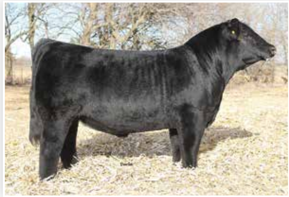
Profit - Sire of Lot 2A & 2B

Over the course of time dominant donors will produce females that not only follow their footsteps, but also in certain instances fill their tracks. Here is a trio of females that are maternal granddaughter of the great Cyrsteel Tango. The first two females are from the Desire 1027D female and sired by the $400,000 Profit. This pair of March Purebred females is sure to turn heads on sale day with their striking profile, added substance, and maternal support staff. The influence of Profit continues to be a dominant force on the tan bark, siring the 2018 AJSA Summer Classic Grand Champion Purebred shown by the Sullivan family of Iowa. Look to this powerful pair of females to be the show stopping kind!