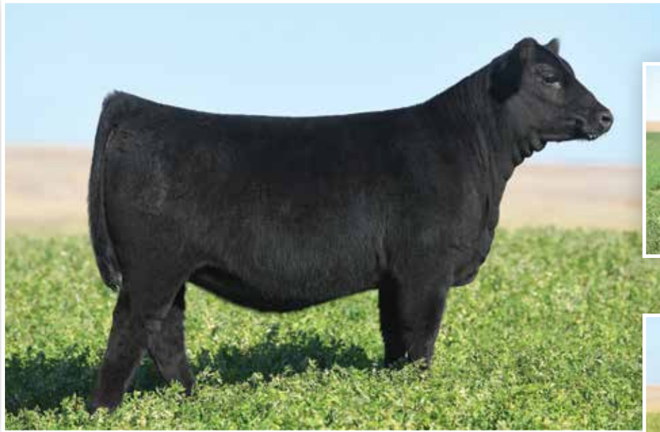
Lot 4 - KCC1 FAITH 4033F