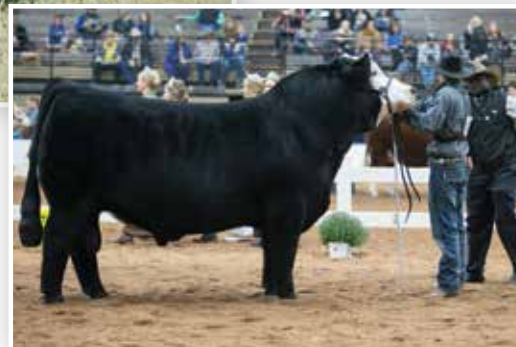
Voyager - Sire of Lot 202

Miss Up D46 was one of the featured bred heifers in the 2017 edition of The Event. Her undeniable body shape, capacity, and density was admired by all. This mating to the 2018 NE State Fair Supreme Champion Bull and 2018 American Royal Reserve Grand Champion Simmental Bull, Voyager, is sure to be a big time mating!