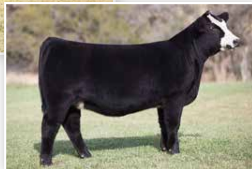
D117 - Maternal Sister to Lots 201 & 201A