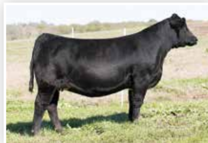
Lot 59 - VCL CHEERLEADER 701E

AI BRED 4/12/18 TO W/C NIGHT WATCH 84E (ASA: 3336327).