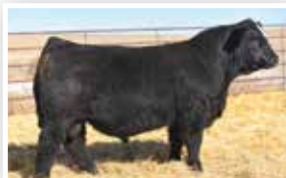
Defiant - Sire of Lot 5