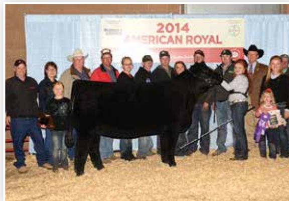
Firefly - Paternal Granddam to Lot 16B