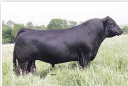
Lot 102 - WAGR DRIVER 706T