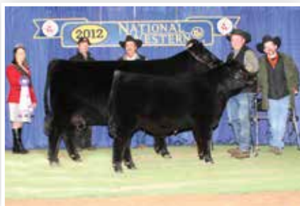
Primrose - Dam of Lot 28

An exciting Pays to Dream daughter that is backed by the potent and proven Lafin's Primrose 8153, the 2012 NWSS Grand Champion Angus Cow/Calf Pair. Long lines of females that have positively contributed to the improvement of the beef cattle industry support this female.