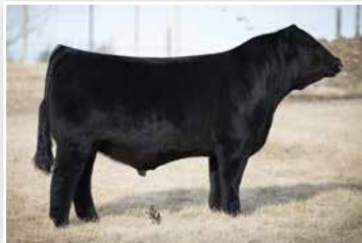
Battle Cry - Service Sire to Lot 46