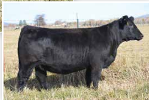
Maternal Sister to Lots 203A & 203B

Y55 was produced in the famed Yardley program. She has been a reliable producer and continuously exceeds expectations. A set of embryos by Counter Attack and a set by Loaded Up are sure to generate highly marketable progeny!