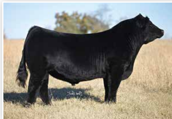
Pays to Believe - Sire of Lot 9C