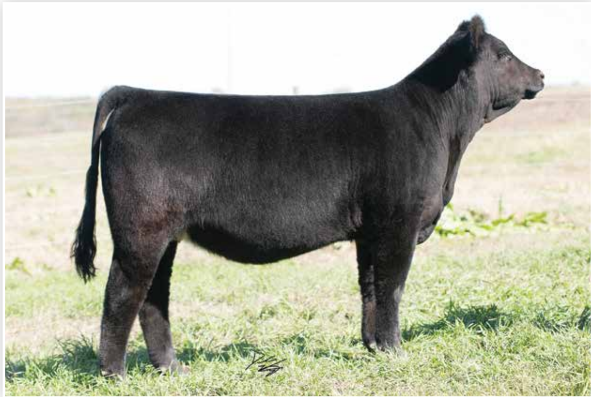
Lot 11 - VCL FABIANNA 813F