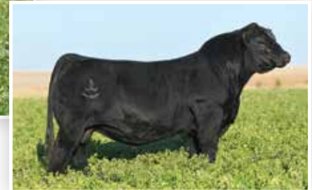
Exclusive - The 2018 $120,000 1/2 Interest Cowntown Classic High Seller and maternal brother to Lot 4.