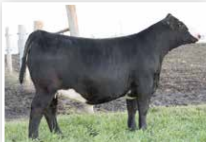
Lot 51 - SCHRAM QUEEN E507

E507 is the definition of a ground sow! She is a female that has stood out from a mass and volume standpoint from a young age. Her fore rib, center body, and hip stoutness are sure to impress. She sells safe AI to the Hammer x Crysteel Tango son that walks the pastures at Moser Ranch in North Dakota that is known as Thor 503C. He is proving himself as the go to calving ease sire that consistently makes them solid black. Safe AI BRED 4/24/18 TO THOR 503C (ASA: 3208952) no pasture exposure.