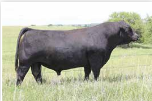
Lot 101 - WS PILGRIM H182U