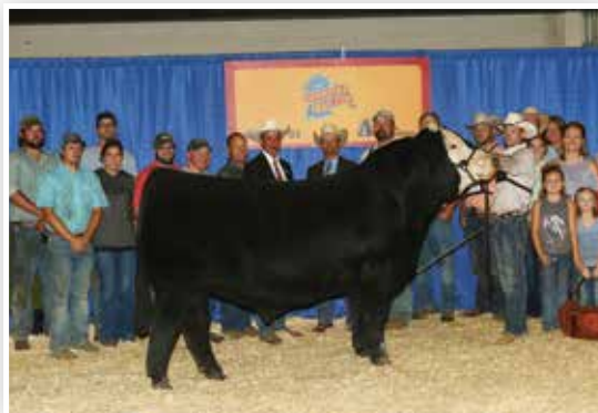
Voyager - Sire of Lot 200B