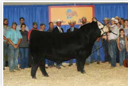
Voyager - Sire of Lot 202