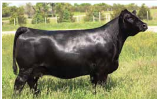
8543U - Paternal sister to Lots 62-64 that is nearly approaching $5 Million in progeny sales!