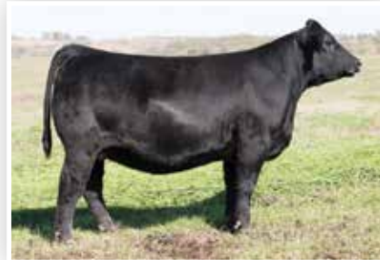
Lot 58 - VCL MICKY 716

Here is an exciting pair of sisters that are sure to garner attention on sale day. Sired by the American Royal and NAILE Grand Champion and NWSS Reserve Grand Champion TL Bottomline, this duo is supported by the WSSC Cheerleader cow family on the south side of their pedigree. These full sisters combine body mass, dimension, and real world maternal power with the added shot of elegance and design. AI BRED 4/13/18 TO W/C NIGHT WATCH 84E (ASA: 3336327).