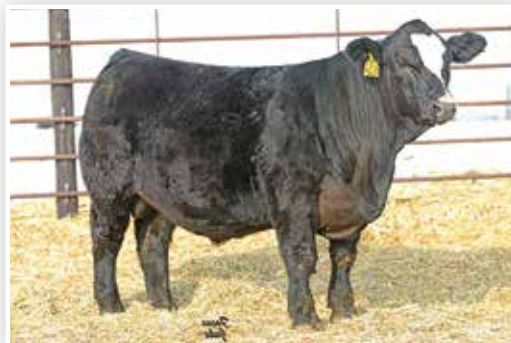
Lot 103 - WBF SIGNIFICANT B132

SA 104A 2 UNITS OF RUBY'S CURRENCY 7134E