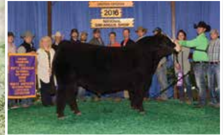
Primary Candidate - Sire of Lot 1B