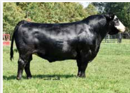
True Blood - Sire of Lot 45

This Innocent Man 5/8 Simmental bred female is sure to draw your attention. Her added stoutness, style, and presence are no mistake it's bred into her! A full sister to this female was Champion Percentage Female at the Missouri State Fair. Backed by a phenomenal Style sired dam, this female is the type and kind to generate those highly sought after show heifers that just keep setting records in the market place! AI BRED 5/20/18 TO SS EBONYS GRANDMASTER (ASA: 2281133). PE 5/24/18-8/24/18 TO PCC 24S (ASA: 3442689).