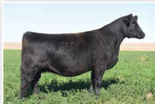
Beyonce - Dam of Lot 7