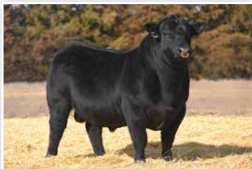
Carver - Sire of Lot 2C