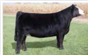
Dolly 49C - Dam of Lot 6