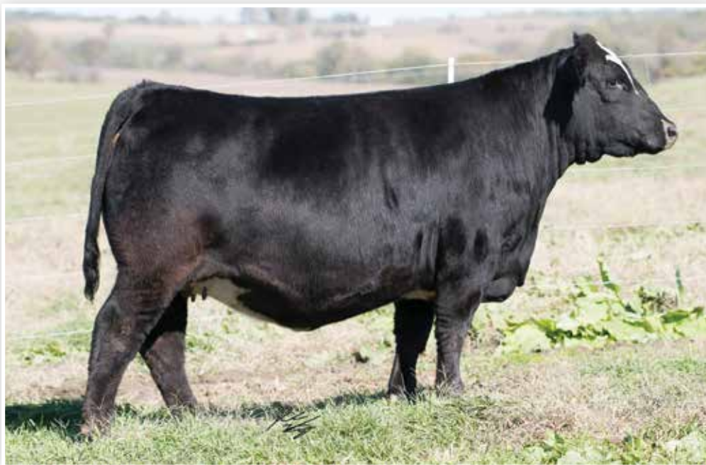
Lot 39 - VCL MISS CALIBRE 714E

714E has been a standout among this set of bred females since she was born. There is no denying the genuine capacity, density, and body shape that this powerful High Caliber sired female offers. A standout 3/4 blood female that sells safe in calf to the up and coming Night Watch, a combination that is sure to yield profitability! AI BRED 4/12/18 TO W/C NIGHT WATCH 84E (ASA: 3336327).