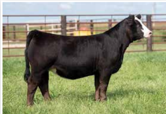
Maternal Sister to Lots 200, 200A & 200B