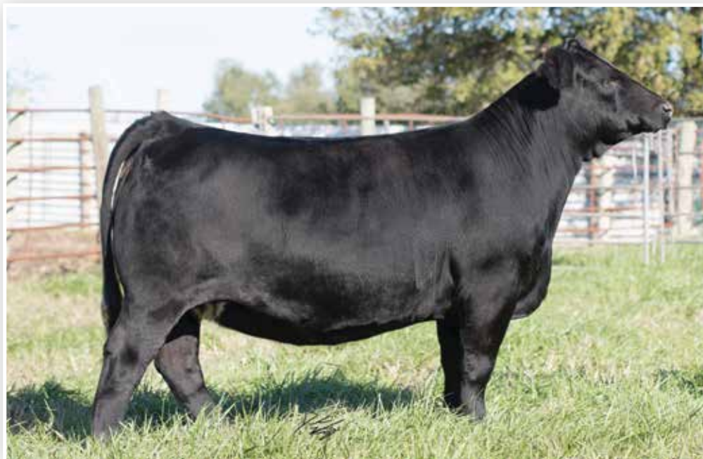
Lot 32 - LADY EZRA 202E

A full sister to The Event Vol. I high selling female and an own daughter of the leading donor dam at Kersten Cattle Company, Aria. This female is ultra stout boned, wide based, and unmatched from a center rib standpoint. A top Purebred bred female that sells safe in calf to the full brother to 20-20, Perfect Vision, the up and coming herd sire in Gretna, Nebraska! A true sale feature from one of the most proven cow families with deep roots in The Event. PE 4/13/18 - 5/13/18 TO PERFECT VISION 26D (ASA: 3251627).