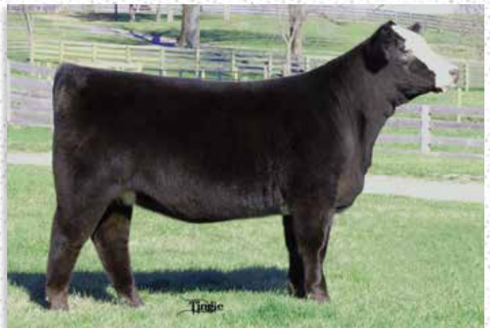
TNGL GLIMMER C860 - DAM OF LOT 151 PREGNANCY