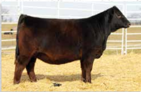
MISS CCF SURE BET D3 - LOT 7 DAUGHTER