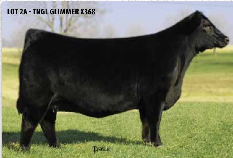
LOT 2A - TNGL GLIMMER X368