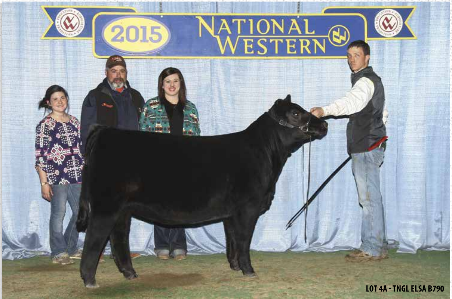
LOT 4A - TNGL ELSA B790

These Elsa daughters certainly have the capacity to maintain their dam's status in the Simmental breed. While Z453 is tried and true in her production, B790 has her whole career ahead of her. Either way, you can be assured of the consistent genetic backing of their truly great dam, Elsa W11!