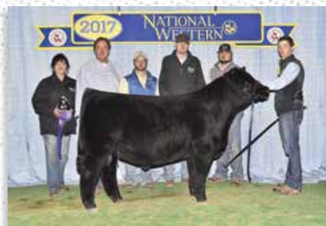
TNGL IMPRINT D989 - LOT 37 PREGNANCY SIRE

PE 4/5/18-6/1/18 TO TNGL RAMBLIN MAN C835 (ASA: 3032636). PE 6/1/18-7/1/18 TO TNGL GRAND FORTUNE Z467 (ASA: 2654876)