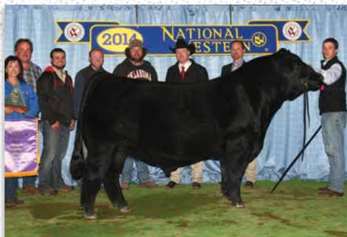
TNGL GRAND FORTUNE Z467 - SIRE OF LOT 28A AND 32A