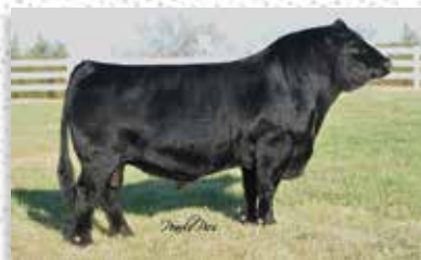
LOT 208 SIRE CNS PAYS TO DREAM