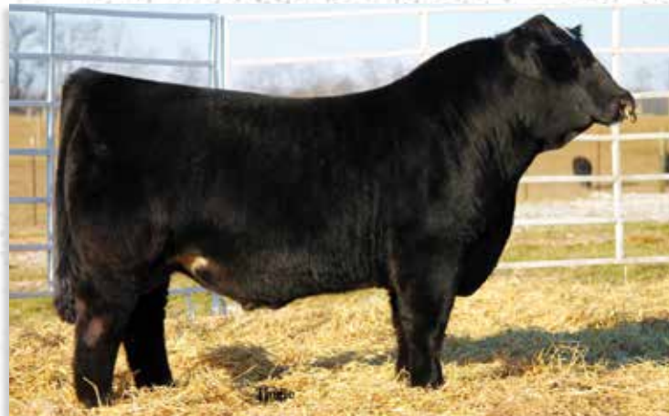
TNGL DESTINATION D935 - SON OF LOT 1E

Hopes Influence brings a different element to the table. Made with the most likeness to her dam, Influence sets herself apart with the same length, mass, and beautifully extended front one third. In fact, we have often done a double take in the pasture she is so similar to Hope. A different stroke of genetics lends this great young donor endless possibilities. We have only begun to dip into the depth of her productivity; so we offer her to you with great anticipation of the superior progeny we know she is capable of producing! Raise your hand if you want greatness!