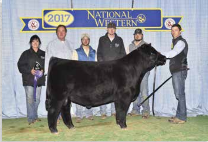
TNGL IMPRINT D989 - SIRE OF LOT 152 PREGNANCY