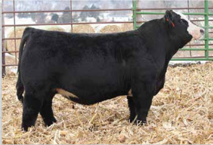
WS STEPPING STONE - SIRE OF LOT 150 PREGNANCY