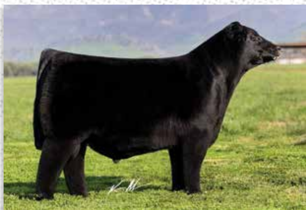
COLBURN PRIMO - SIRE OF LOT 84A, 85A & 86A