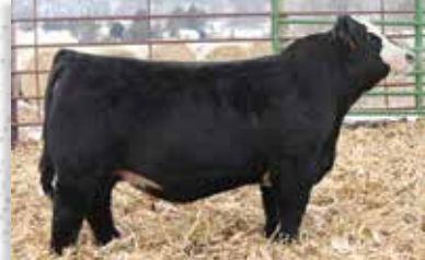
LOT 210 SIRE WS STEPPING STONE B44