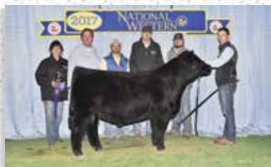
LOT 205 SIRE TNGL IMPRINT D989