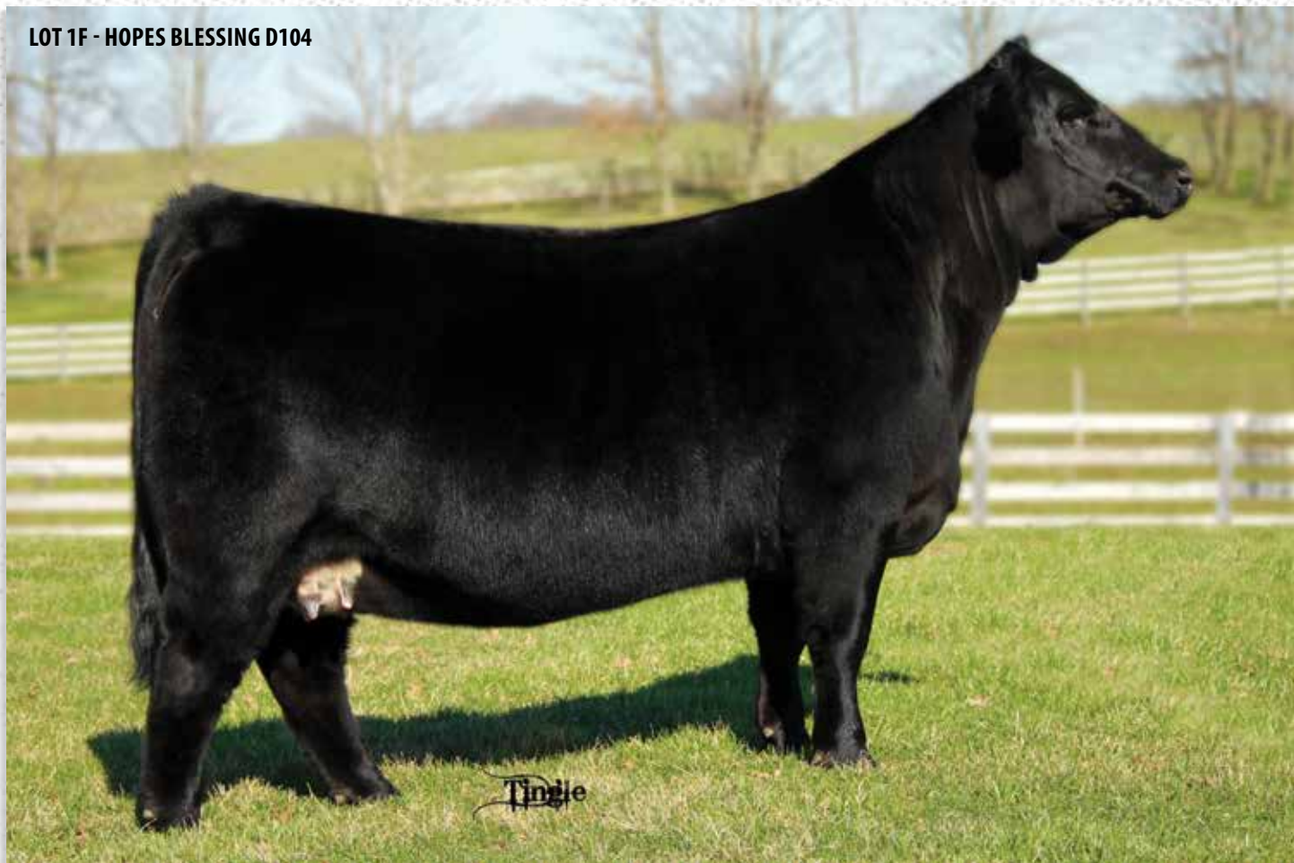
LOT 1F - HOPES BLESSING D104

These first calf flushmate sisters have just gotten started on their production adventure. We venture to say they are backed by two cow families who need no introduction. Out of the great Hope Floats and Upper Hand's famous dam, Glimmer, these girls are backed by success all across the U.S and Canada. An open book ready for your signature, just dive in and write your own success story.