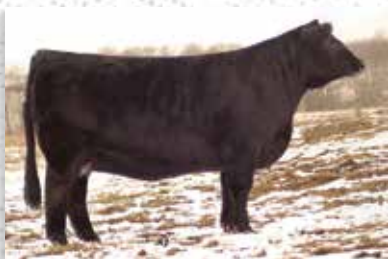
LOT 213 DAM GCF MISS ELSA W11

MR HOC BROKER CNS ANTOINETTE P411 CNS PAYS TO DREAM T759 SILVERSTONE LPC MISS AWE