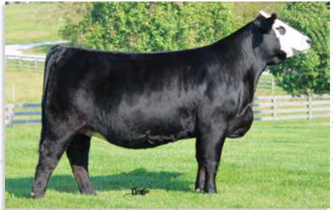
TNGL A DOLL D931 - LOT 3 DAUGHTER