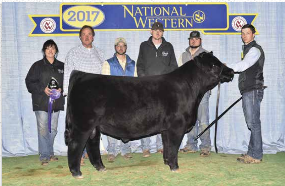
TNGL IMPRINT - LOT 3 SON