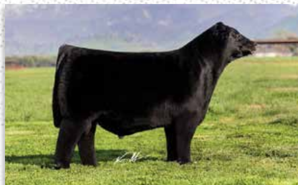
COLBURN PRIMO 5153 - LOT 11 PREGNANCY SIRE

Embryo was implanted on 12/6/17. Estimated due date 9/14/18.