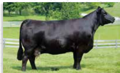
LOT 208 DAM SILVERSTONE LPC MISS AWE