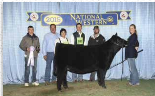
TNGL SPARKLE B770 - LOT 13 PREGNANCY DAM