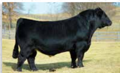
LOT 206 SIRE TNGL OBR FORTUNE 500C

JF SHOCK AND AWE 6207S SILVERSTONE CHYNA MARIE