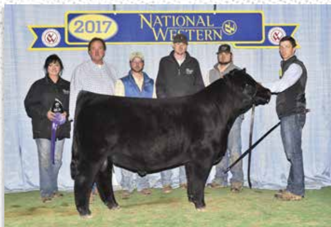
TNGL IMPRINT D989 - SERVICE SIRE TO FALL CALVING FEMALES