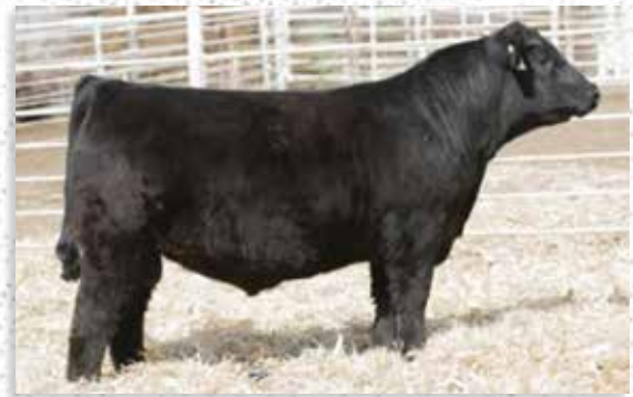
TJ ROOSEVELT 366E - LOT 46 PREGNANCY SIRE

Embryo was implanted on 5/28/18. Estimated due date 3/6/18.