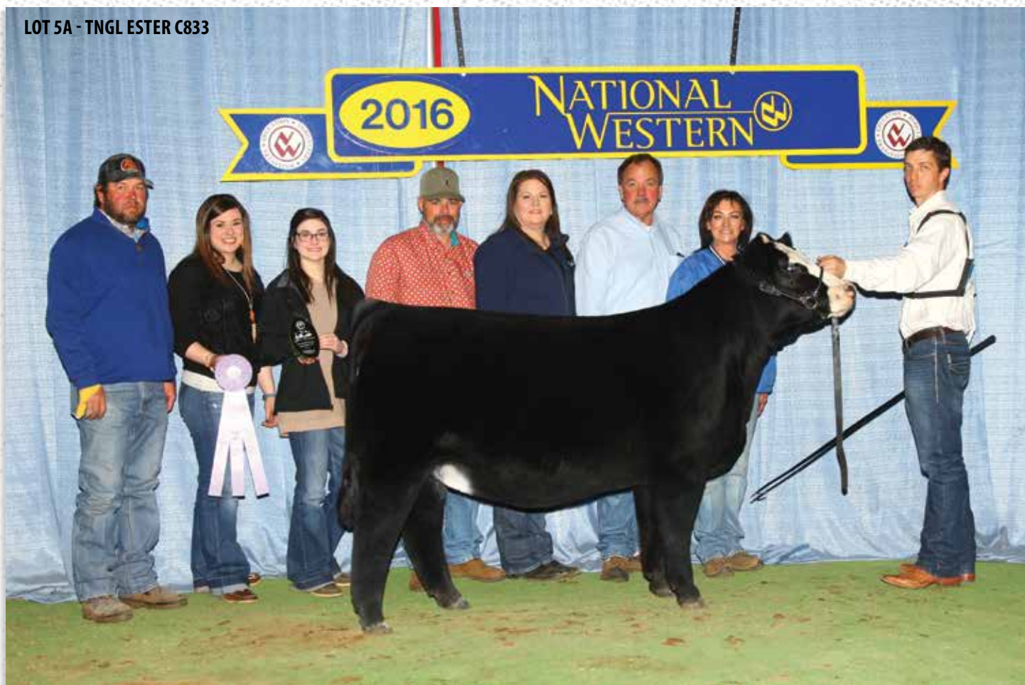
LOT 5A - TNGL ESTER C833