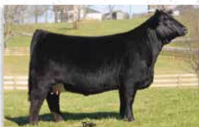
LOT 201 DAM TNGL HOPE'S DESIRE A572