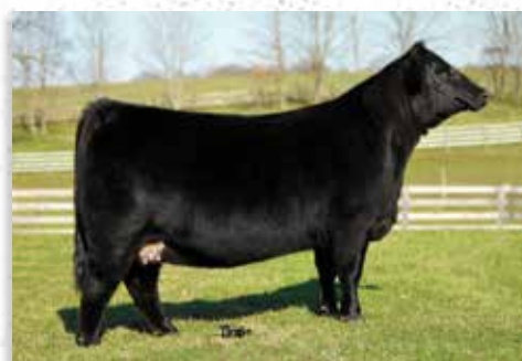
TNGL HOPES BLESSING D104 - LOT 37 PREGNANCY DAM