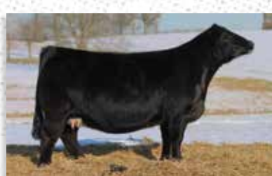
LOT 210 DAM TNGL AWE STRUCK Y417