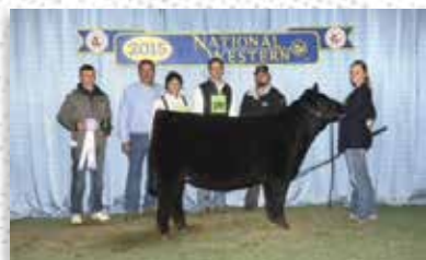
LOT 206 DAM TNGL SPARKLE B770

STF SHOCKING DREAM SJ14 SILVERSTONE LPC MISS AWE