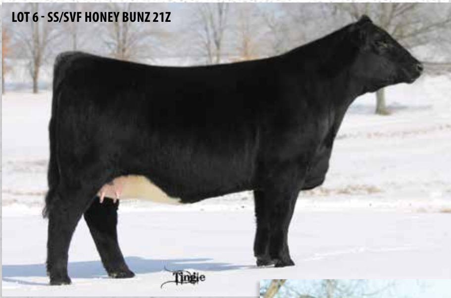
LOT 6 - SS/SVF HONEY BUNZ 21Z