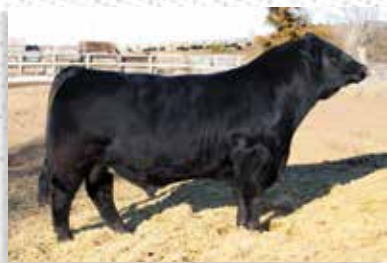
LOT 217 SIRE TNGL TRACK ON B748