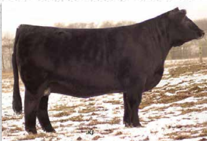
GCF MISS ELSA W11 - DAM OF LOT 150 PREGNANCY

Embryo was implanted on 12/13/17. Estimated due date 9/21/18.