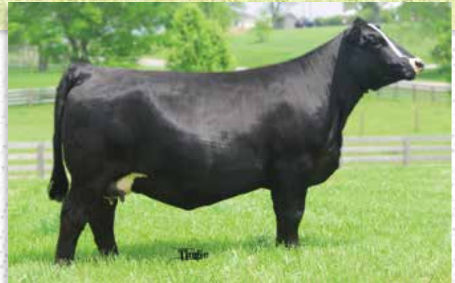
LOT 2B - TNL OBSESSION B758