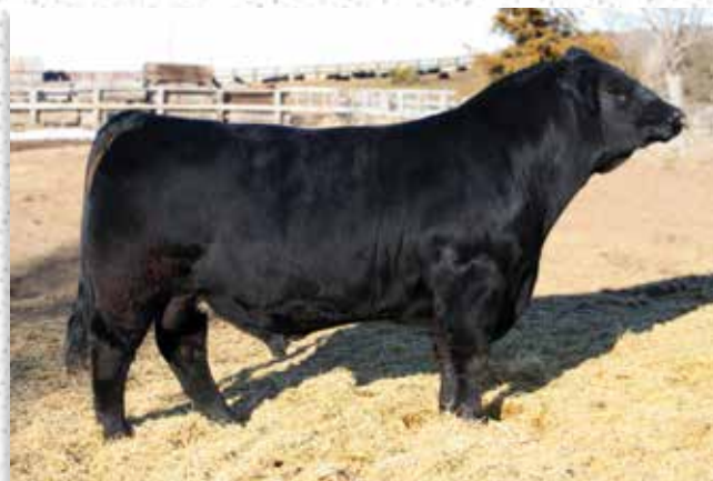
TNGL TRACK ON B748 - LOT 4 SON