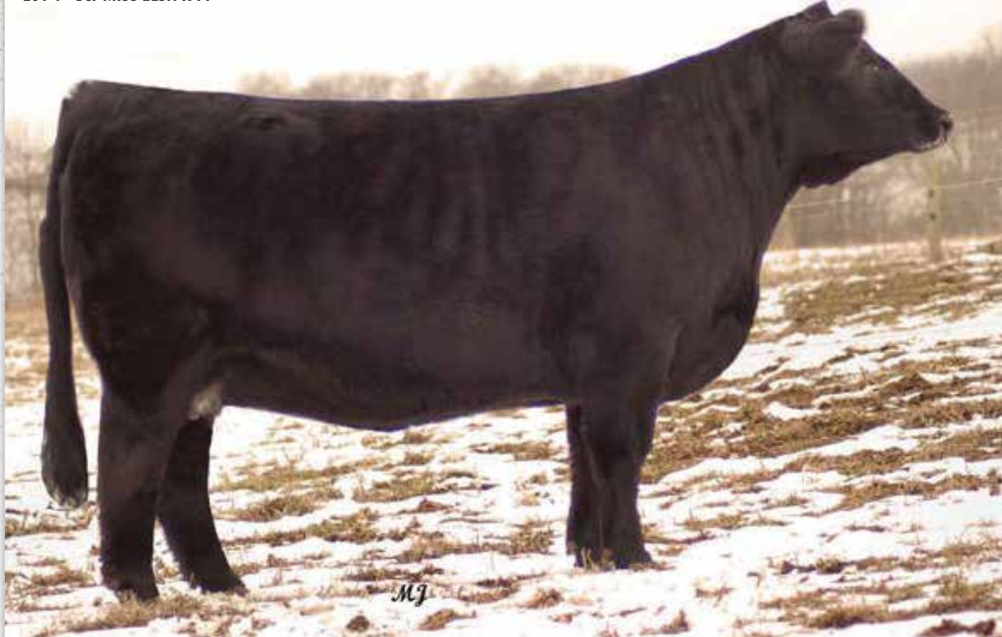
LOT 4 - GCF MISS ELSA W11