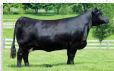
LOT 200 DAM AJE/HS/MBCC HOPE FLOATS