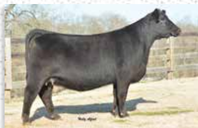
LOT 219 DAM MISS SURE BET