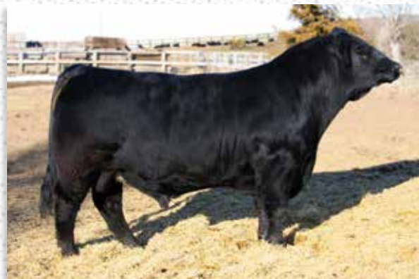
TNGLTRACK ON B748 - LOT 13 PREGNANCY SIRE