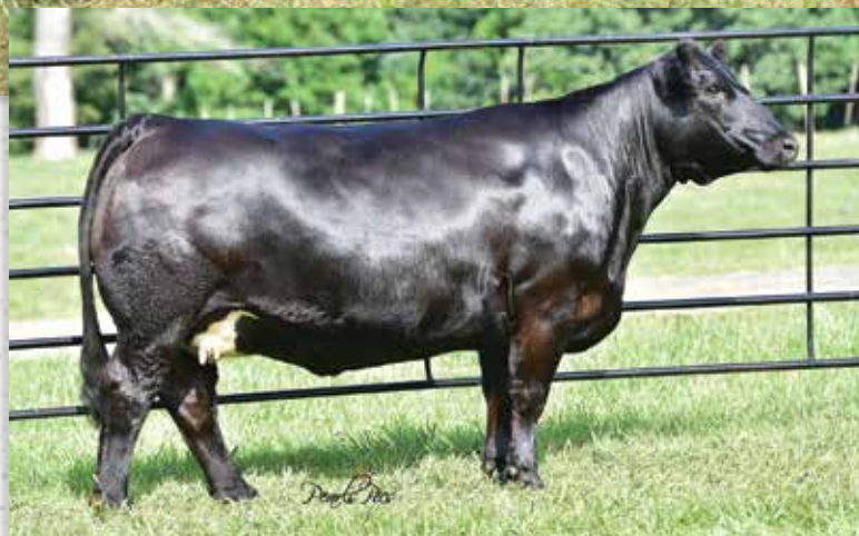
TNGL HOPES DESIGN A589 - FULL SISTER TO LOTS 1A-1D