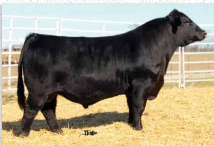
TNGL RAMBLIN MAN C835 - SERVICE SIRE TO FALL CALVING FEMALES