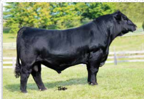
TNGL REFLECTION D918 - SERVICE SIRE TO SPRING CALVING FEMALES

PE 3/6/18-8/9/18 TO TNGL REFLECTION D918 (ASA: 3173570). PE 8/15/18-9/30/18 TO TNGL RAMBLIN MAN C835 (ASA: 3032636)