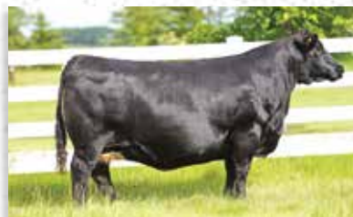
LOT 221 DAM SS EMPRISS 302Y