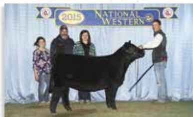
LOT 215 DAM TNGL ELSA B790