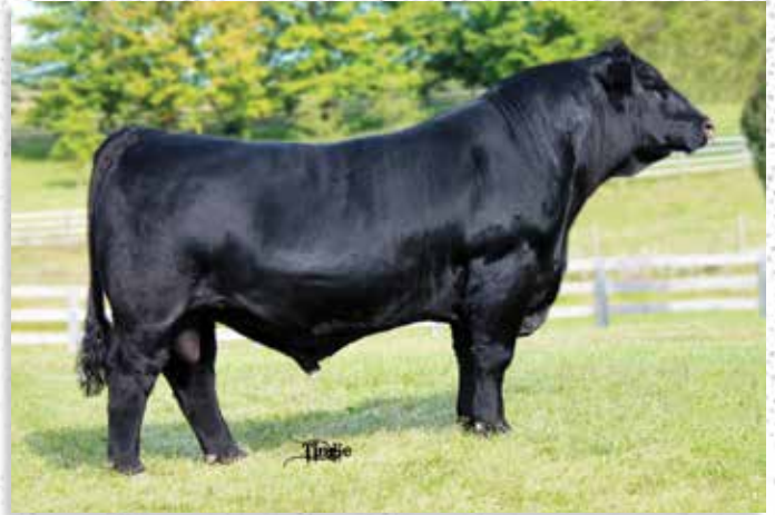
TNGL REFLECTION D918 - SIRE OF LOT 151 PREGNANCY