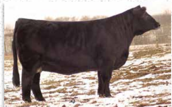
GCC MISS ELSA W11 - LOT 46 PREGNANCY DAM