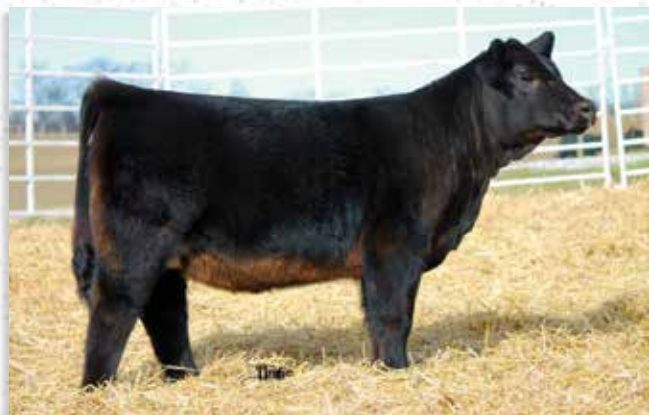
TNGL A COVER GIRL D217 - LOT 3 DAUGHTER