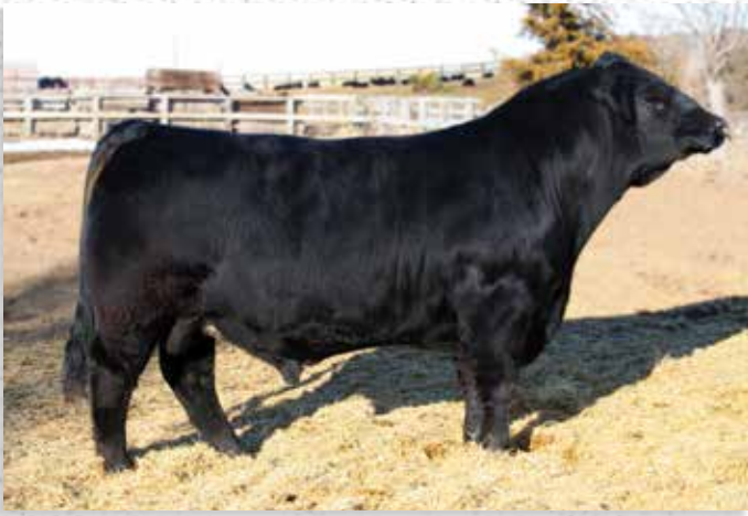
TNGL TRACK ON B748 - LOT 14 PREGNANCY SIRE