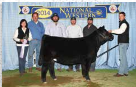
TNGl HOPES DESIRE A572 - RES. DIVISION - 2014 NWSS