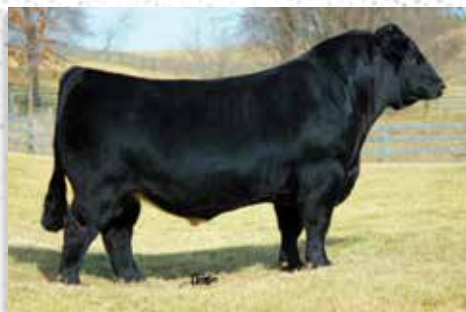
TNGL OBR FORTUNE 500 - LOT 3A SON