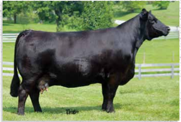
SILVERSTONE LPC MISS AWE - LOT 14 PREGNANCY DAM