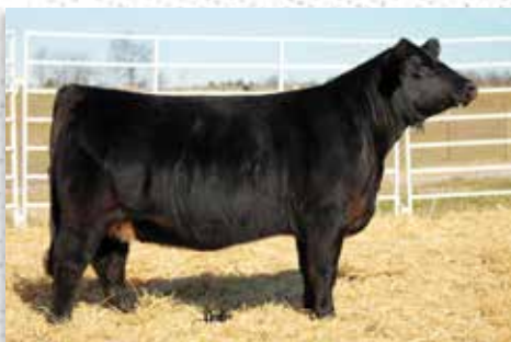
TNGL STAR STRUCK C906 - LOT 3A DAUGHTER