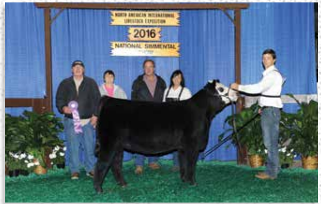
TNGL A DOLL D931 - LOT 3 DAUGHTER