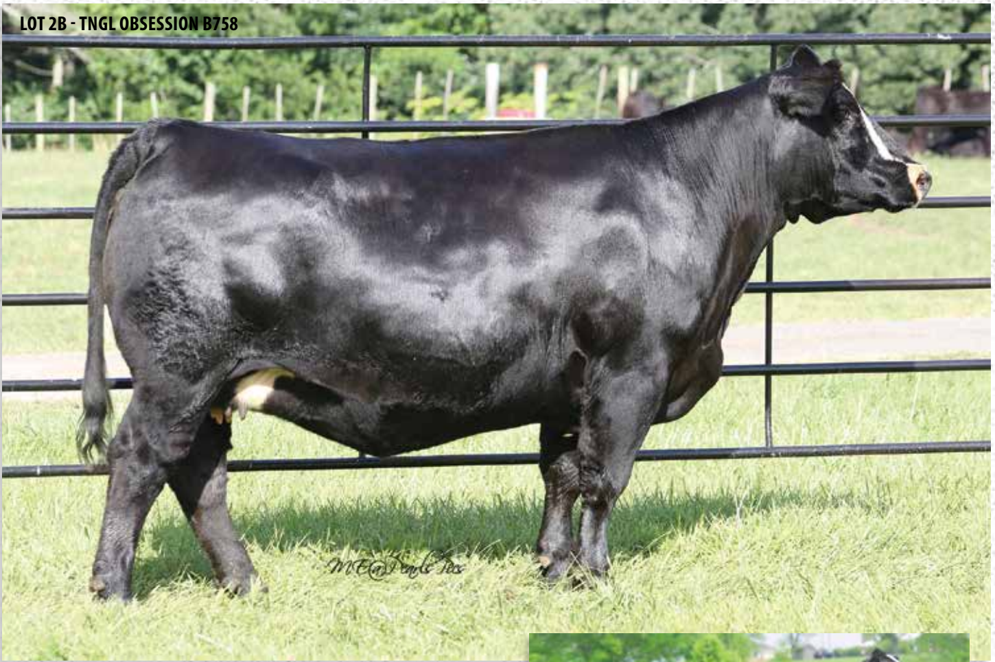
LOT 2B - TNL OBSESSION B758