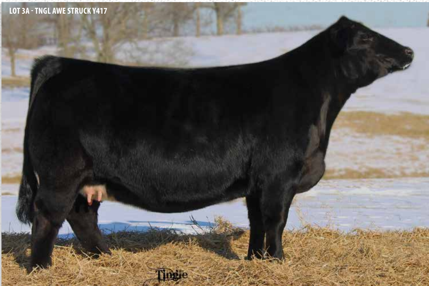
LOT 3A - TNGL AWE STRUCK Y417