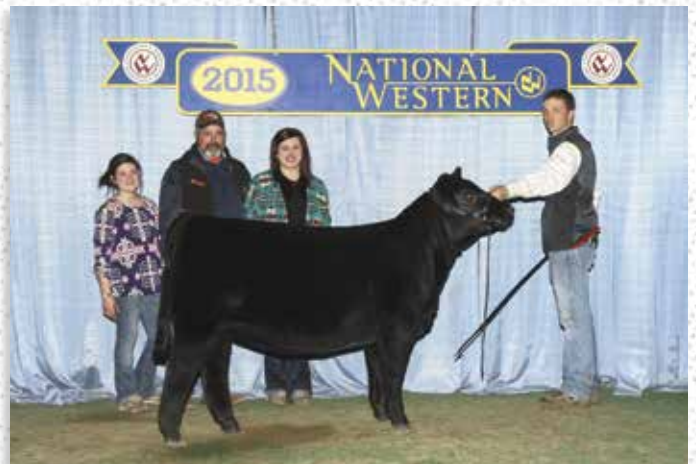
TNGL ELSA B790 - DAM OF LOT 153 PREGNANCY