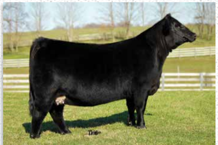
TNGL HOPES BLESSING D104 - DAM OF LOT 155 PREGNANCY

Embryo was implanted on 5/28/18. Estimated due date 3/6/18.