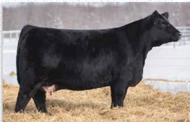
TNGL A GEMSTONE A527 - LOT 3 DAUGHTER