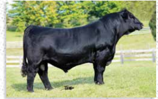
TNGL REFLECTION D912 - LOT 6 SON