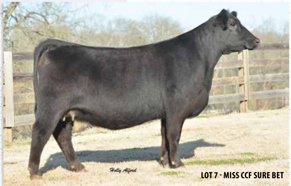
LOT 7 - MISS CCF SURE BET