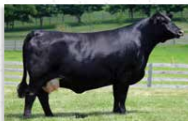
LOT 204 DAM TNGL HOPE'S INFLUENCE