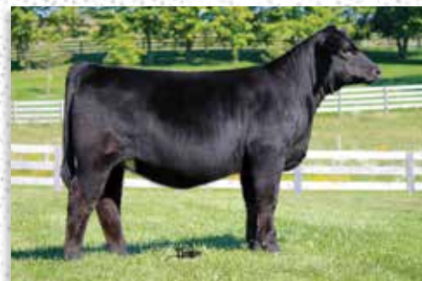
TNGL AWE STRUCK E308 - LOT 3A DAUGHTER