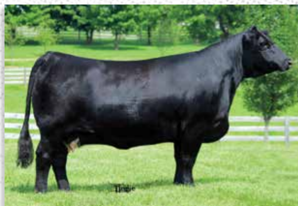
HOPE FLOATS - DAM OF LOT 84A, 85A & 86A