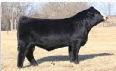
LOT 218 SIRE TKCC CLASSIFIED

218 CLASSIFIED X HONEY BUNZ EMBRYO 1 CONVENTIONAL EMBRYO