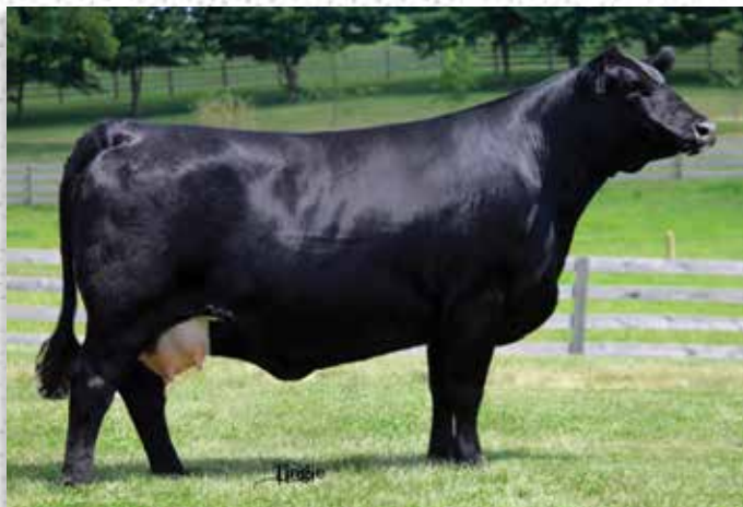
TNGL HOPES INFLUENCE - DAM OF LOT 152 PREGNANCY

Embryo was implanted on 12/13/17. Estimated due date 9/21/18.