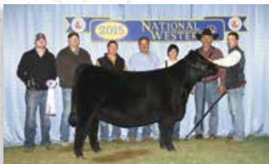
LOT 212 DAM TNGL A VISION A590

REMINGTON LOCK N LOADS4U MISS WERNING KP 8543U JF MILESTONE 999W SILVERSTONE LPC MISS AWE