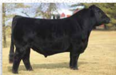
LOT 202 SIRE CDI INNOVATOR 325D

W/C WIDE TRACK 694Y AJE/HS/MBCC HOPE FLOATS