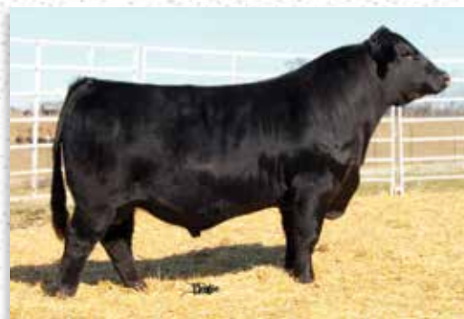
TNGL RAMBLIN MAN C835 - SERVICE SIRE TO SPRING CALVING FEMALES

Embryo was implanted on 5/28/18. Estimated due date 3/6/18.