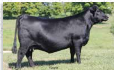
LOT 216 DAM E/T ESTER 020