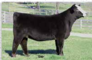
LOT 207 DAM TNGL GLIMMER C860

STF SHOCKING DREAM SJ14 SILVERSTONE LPC MISS AWE