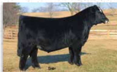
LOT 200 SIRE TNGL UPPER HAND B575