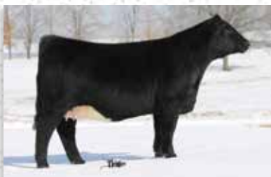
LOT 218 DAM SS/SVF HONEY BUNZ 421Z

219 IMPRINT X SURE BET EMBRYOS 4 CONVENTIONAL EMBRYOS