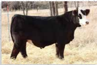
LOT 211 SIRE W/C BULLSEYE 3046A