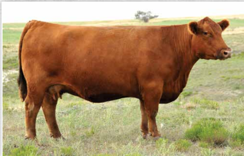
C-Brown&KM Abigrace T715 - The powerful Dam of Lots 23-29!