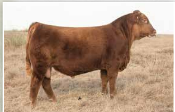
C-Bar Big River 119E – Full sib to Lots 73-75