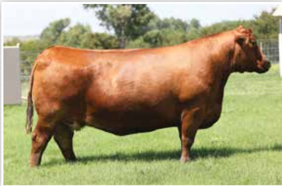
HXC Patricia Rose 102Y - Full Sister to Lot 83