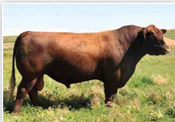
C-Bar Eldorado 114Z - Sire of Lots 27 & 28