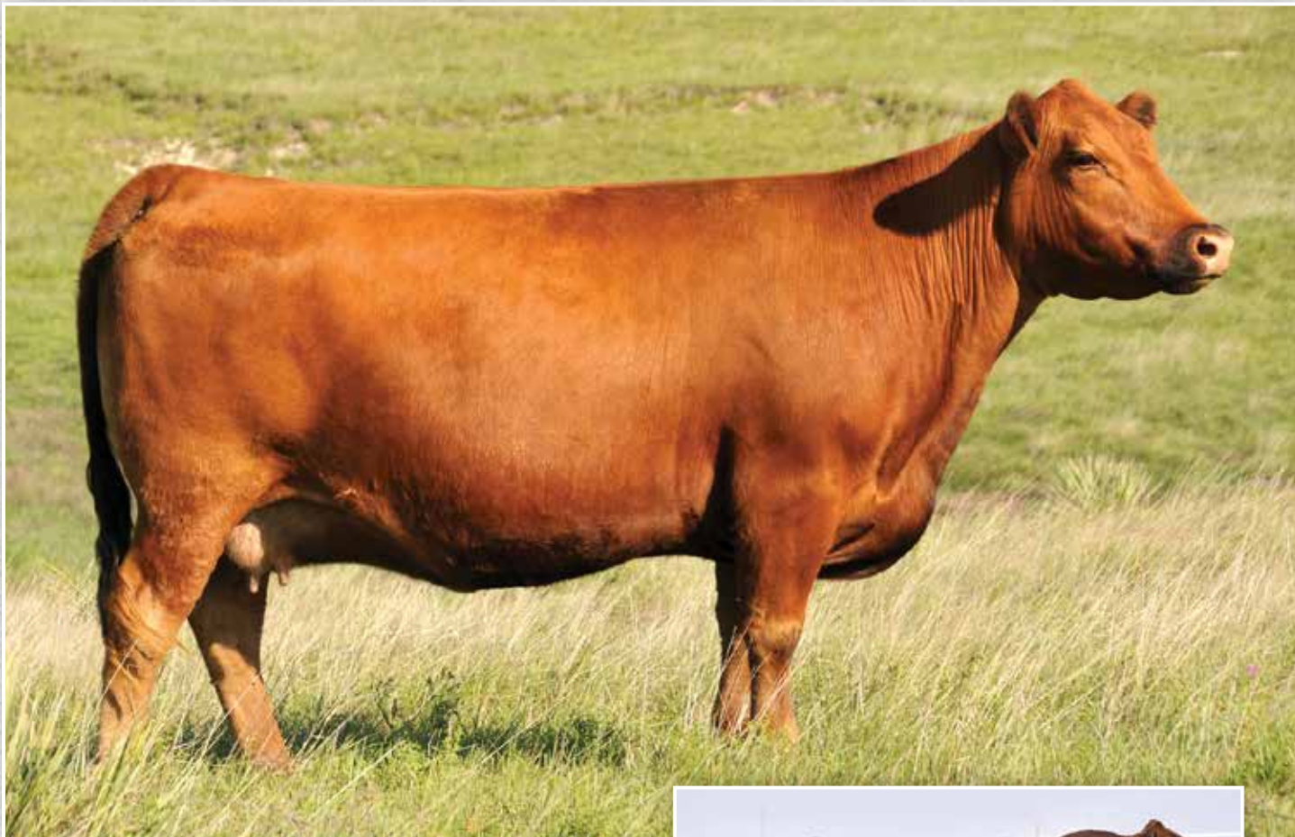
C-Bar Abigrace Y11 - Dam of Lot 32

725E is a dynamic bred heifer that is an own daughter of the late Y11. She is sired by the breed-leading Andras New Direction and from arguably one of the most impressive donor dams to ever grace the pastures of Brownell. She combines a negative BW EPD and spreads to triple digits at a year, while ranking in the top 9% for CW, and top 12% ADG. The upside of this female is unlimited and with her reputable pedigree, proven genotype, and balanced number profile we anticipate she will make her way to the donor pen wherever she is newly employed.