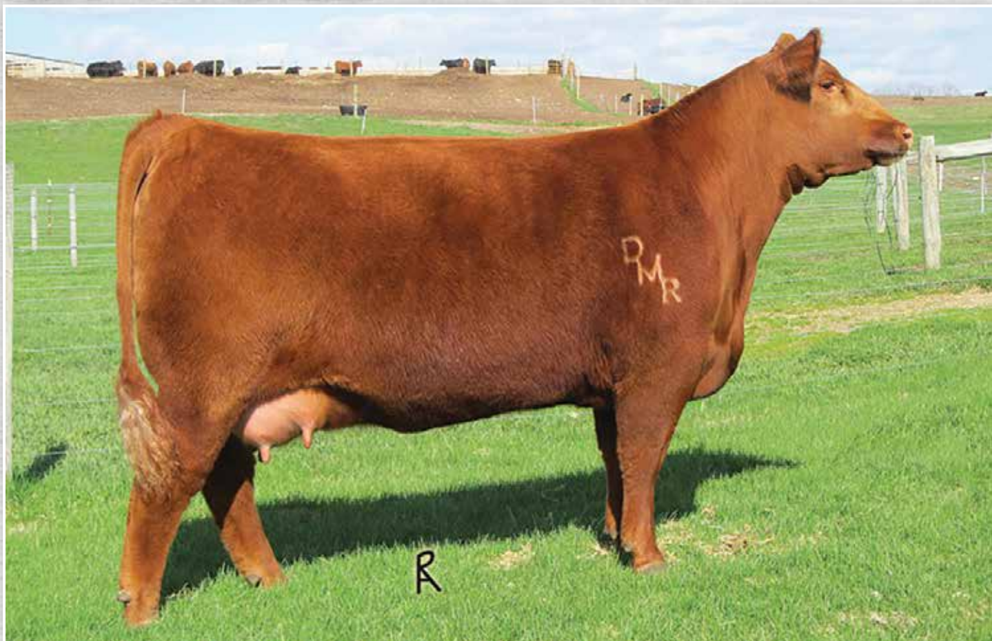
Damar Mimi W085 – Maternal Granddam of Lots 84-90

Cow families are critical when it comes to advancing a program and we are firm believers in this philosophy. This pair of sisters combines the good from several of the foundation females that help build this program. 404B is the Anticipation sired daughter of the great Mimi W085 that was a highlight in the May sale, Roses Part I. C-Bar Anticipation 101W is the Ole's Oscar sired son of the $3 Million L7730. There is no denying the power in the blood on the bottom side of the pedigree that backs these females. 757E and 764E are sired by the 5L Defender stud, who has emerged as one of the breed's elite carcass sires. He injects carcass merit, genuine power, rib shape, and capacity into his progeny. These females rank among the elite in the breed for the following traits; top 6% GM, top 4% Marb, top 7% YG, and top 7% Fat. Elite carcass cattle that are backed by the influence of L7730 and W085!