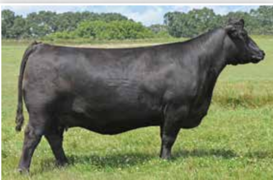
Blair's Blackbird 107X – Maternal Great Granddam of Lots 109 & 110