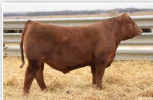
C-Bar Legit 133E – $60,000 Maternal Brother to Lots 13-15!

865F has been a standout since the calves were pulled in from the pasture. This is a female that we feel has a bright future and we are anxious to watch her make an impactful difference for her new owners. She offers an elite numeric profile, a stunning presence of balance and eye-appeal, and does so without sacrificing structural integrity, power, or performance. Her sire is the Canadian bred stud, Reckoning, that was raised in the U-2 program and was sold to the famed 6 Mile Ranch outfit. We anticipate this female to find great success on the tan bark, but whole heartedly believe her true value will come once she enters the production phase of her career. Keep in mind; she is a maternal sister to the $60,000 1/2 Interest C-Bar Legit!