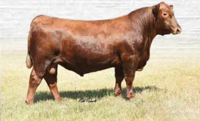
C-BAR BIG RIVER 119E

FEATURING THE SERVICE OF THESE ELITE SIRES