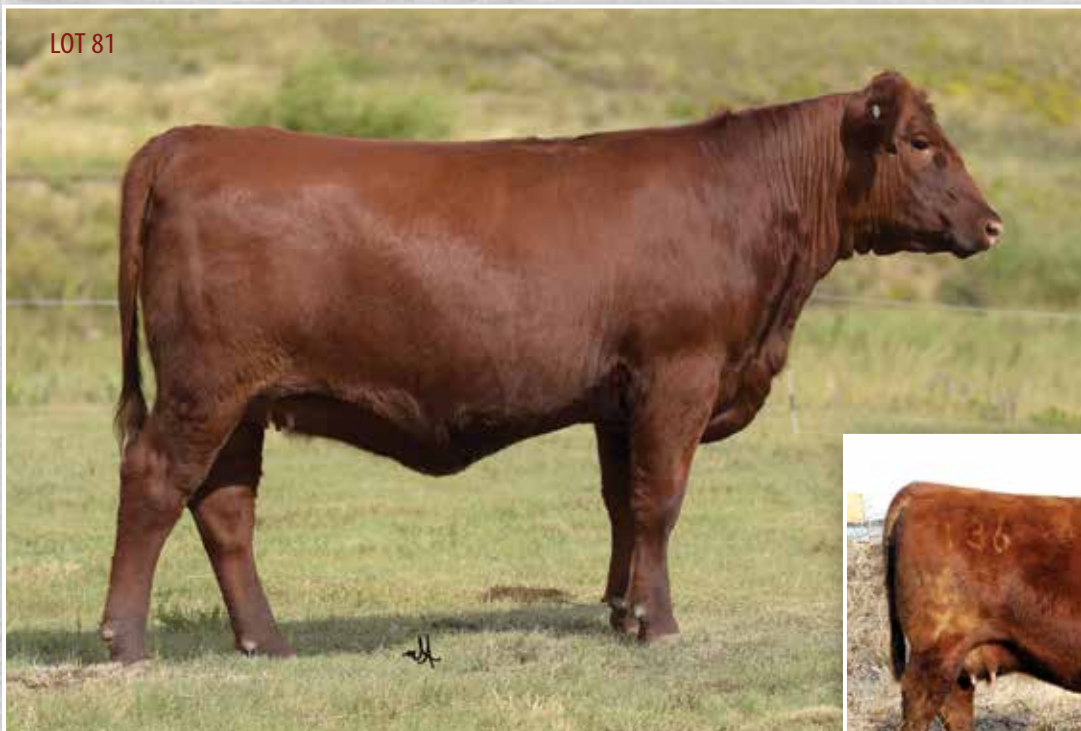
HXC Jaylo LB136 Dam of Lots 80 - 82