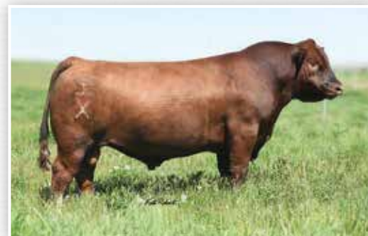
HXC Allegiance 5502C - Sire of Lots 8 - 10

Here is a trio of females are full sisters in blood to the $60,000 1/2 Interest C-Bar Legit, the high selling bull in the 2018 C-Bar Ranch Bull Sale this past March. Legit was the most elite scanning bull that we have ever raised, and ranks among the top 1% of the breed for Marbling, top 1% for GridMaster, and top 4% for REA. Legit is quickly becoming a carcass icon in the beef industry and we couldn't be more anxious about the potential that he offers to our feeder calf buy back program. These flush sisters from the W909 donor dam are sure to catch your attention. Particularly we admire these females for their unsurpassed volume, depth, and rib capacity, while offering a functional and sound structural base. They are much like their prolific donor dam in terms of the maternal power that they tie together in a feminine and well-balanced phenotype. It is difficult to cut loose of females that offer this much earning potential, carcass merit, and real-world performance, however in the event of scaling back our program to make the day to day tasks more manageable it is a must to let females like this leave. Consider this a true buying opportunity that will allow you to escalate your program to the next level in a single generation!