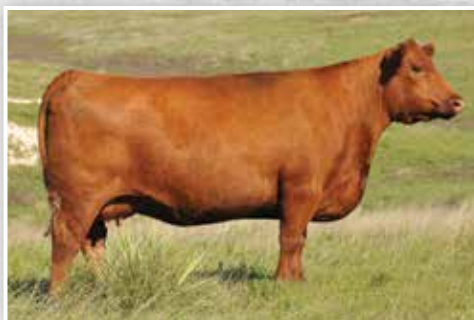
Red Geis Countess 20'10 Dam of Lot 104

8153F is a Franchise of Garton sired female that is from the Countess 20'10 donor cow that was a past high seller from the Geis program and is now employed by Nixon Family Farms in Floydada, Texas. Look to this female for added dimension, body mass, and structural integrity, with strong carcass merit from the sire side of her lineage!