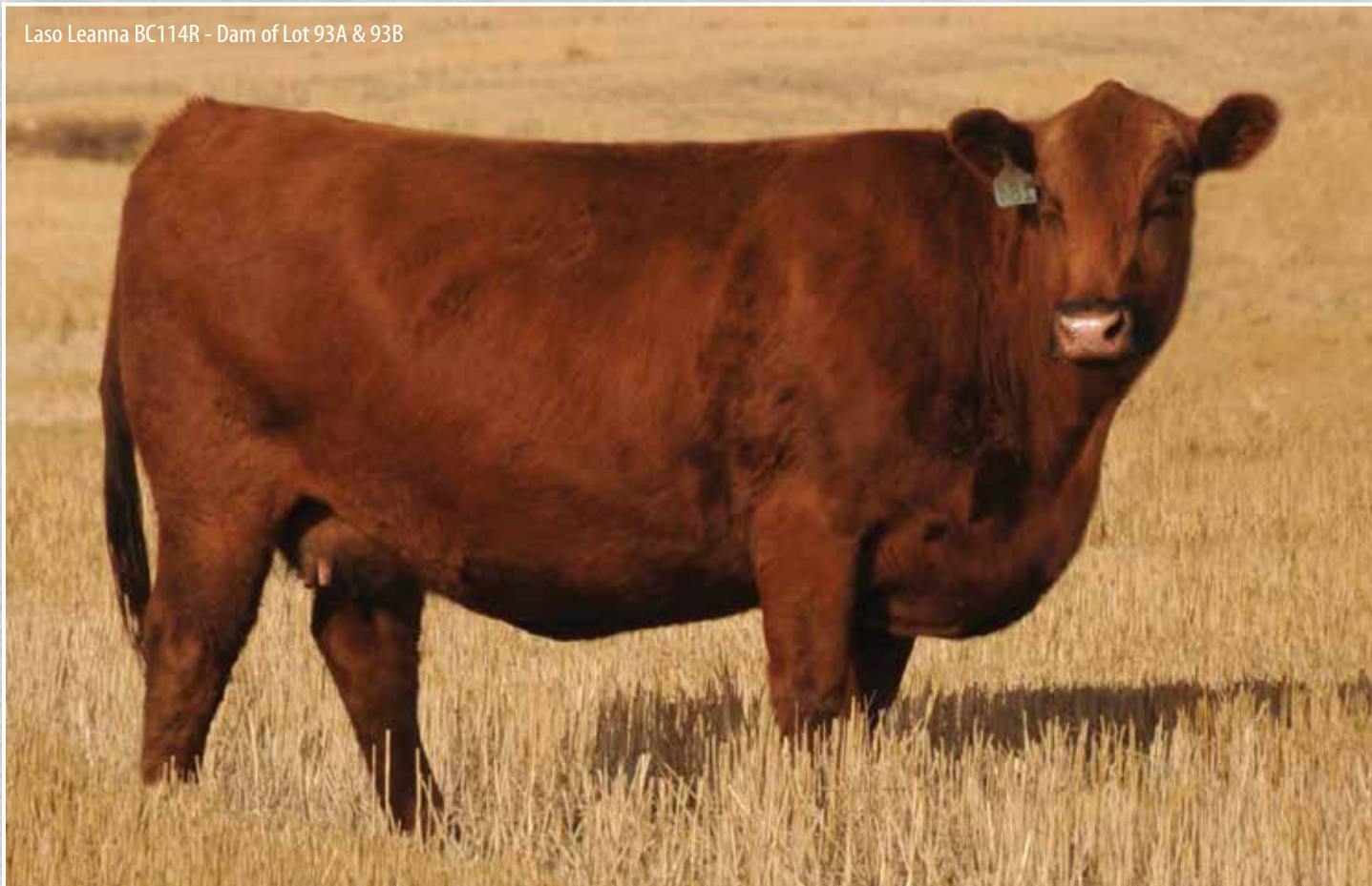
Laso Leanna BC114R - Dam of Lot 93A & 93B