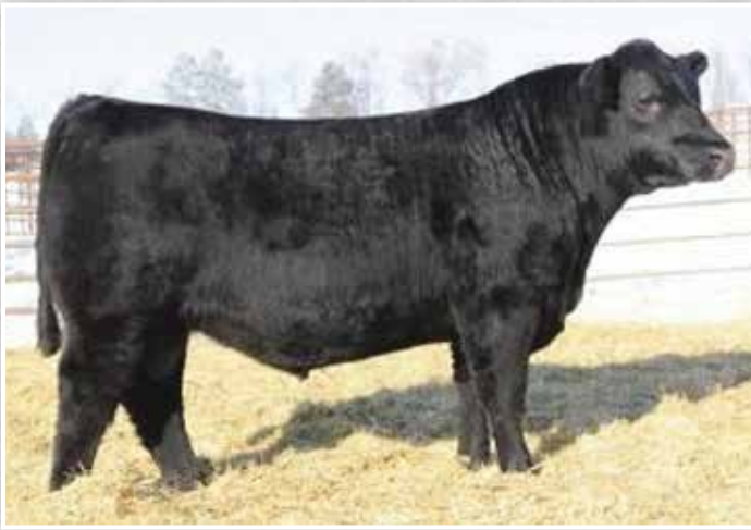
SAV Potency 0641 - Sire of Lot 29