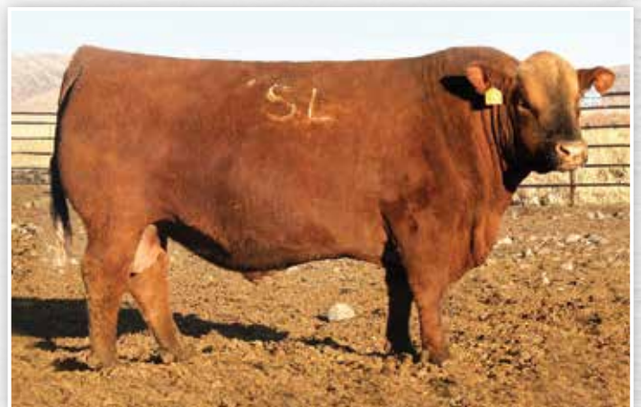
5L Defender 560-30Z - Sire of Lot 77

5L Defender has emerged as one of the breed's most elite carcass sires, boasting top percentile rankings that chart him among the most dynamic and proven sires. This female is sired by the carcass oriented and low BW sire, yet backed by the ultra maternal and powerful donor dam, Z243. By combining the quality of each side of her pedigree the results have proven to yield a balanced genetic gem that is capable of enhancing the bottom line of any outfit! AI BRED 4/18/18 TO C-BAR BIG RIVER 119E (RAAA: 3791207). PE 5/1/18-7/31/18 TO C-BAR CREEDENCE 131D (RAA: 3534624). PROBABLE SAFE AI.