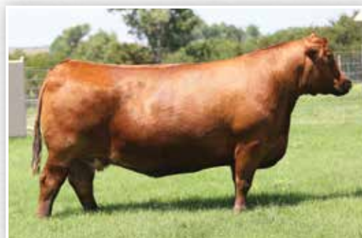
HXC Patricia Rose 102 - Paternal Granddam of Lots 18 & 19