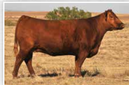
Brown C-Abigrace S602 Maternal Graddam of Lots 43 - 46

A364 is responsible for producing one of the most decorated bulls in the recent history of the Red Angus breed, C-Bar Blake's Bonanza! Bonanza went on a dominant run on the show road, where he first won his division as a calf at the NWSS, then the next summer was crowned Grand Champion Red Angus Bull at the 2017 Iowa State Fair, making him the 2017 National Champion Red Angus Bull. His success soon didn't end, as he then dominated the field in Minnesota, first winning the title of Grand Champion Red Angus Bull before being named the Supreme Grand Champion Bull Overall Breeds. He capped off his career in January of 2018 when he was slapped Grand Champion Red Angus Bull on "the hill" at the National Western Stock Show in Denver. This victory made him the 2018 National Champion Red Angus Bull. The two-time, back to back National Champion Red Angus bull was then sold to our good friends at Niobrara Red Angus of Nebraska. What a ride! A364 has done it again, and we are proud to offer three maternal sibs and one full sib to the great Bonanza. The Brown BLW Legend stud that needs no introduction sires the maternal sibs to Bonanza. These females are sound, big ribbed, wide centered, and built to last. The full sister to Bonanza reminds us of him at this age, ultra smooth, sound, and impeccably well balanced. We truly believe that A364 is following in the footsteps of her powerful dam, S602. Here is another prime opportunity to add cutting edge genetics to your outfit!