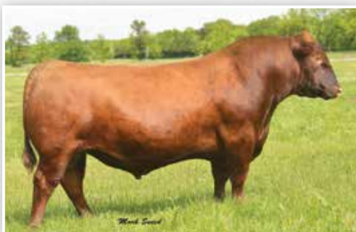
Brown BLW Legend A1965 - Sire of Lots 18 & 19