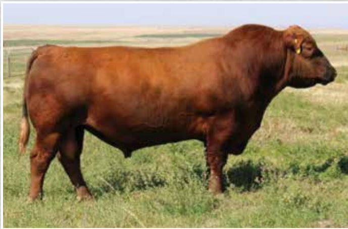
Brown Premier X7876 - Sire of Lot 76

This pair of Z243 daughters is the kind necessary to move any program forward, especially considering the influence of their sire, 5L Independence. They offer a top 6% GM, top 17% CED, top 13% BW, top 16% WW, top 16% YW, top 20% ADG, and top 4% Marb. Maternal, carcass, and phenotype wrapped into a single package without sacrificing performance or fleshing ability is the result of generations of disciplined breeding decisions and dedication to improving the breed.