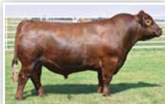
New Direction - Sire of Lot 97