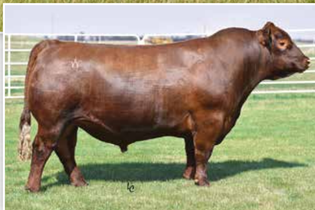
Andras New Direction R240 - Sire of Lot 32

725E is a dynamic bred heifer that is an own daughter of the late Y11. She is sired by the breed-leading Andras New Direction and from arguably one of the most impressive donor dams to ever grace the pastures of Brownell. She combines a negative BW EPD and spreads to triple digits at a year, while ranking in the top 9% for CW, and top 12% ADG. The upside of this female is unlimited and with her reputable pedigree, proven genotype, and balanced number profile we anticipate she will make her way to the donor pen wherever she is newly employed.