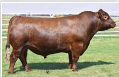
Andras New Direction - Sire of Lot 2

A305 and her sister, A302 have been standouts throughout every stage of their lives. As calves they were the ones that constantly drew in the added attention, and as females in the prime of their production careers they continue to be the ones that visitors to the ranch gravitate towards this dynamic duo. A305 is the powerful donor dam of this future pair of matriarchs that are sired by breed legends Andras New Direction and PIE One of A Kind. These females offer unparalleled phenotype, genomics, and are backed by the potent Stony cow line. This pair of females offers tremendous spread from birth to yearling and possess the key traits of uniqueness that their dam exemplifies. New Direction has been a surefire candidate to infuse body mass, dimension, and marbling in an outcross pedigree. PIE One Of A Kind has been a trustworthy sire to inject power and real world performance. This pair of up and coming donor prospects is sure to follow in their dominant donor dam's footsteps.