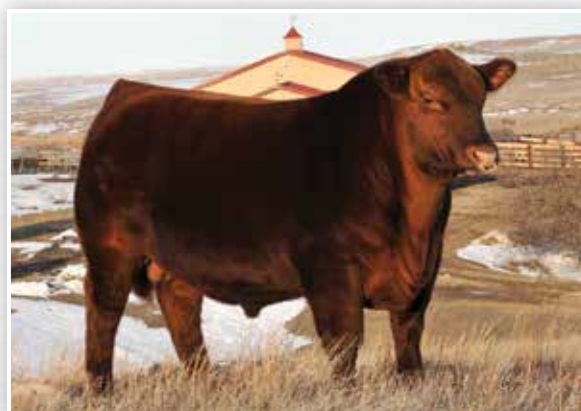
El Grande - Full Brother to Lots 27 & 28