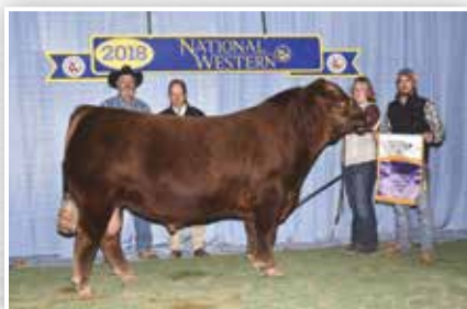
C-Bar Blake's Bonanza - Maternal Brother Lots 43 - 45 and Full Brother to Lot 46

AI BRED 4/18/18 TO C-BAR ONE WAY 37E (RAAA: 3843883). PE 5/1/18-7/31/18 TO C-BAR CREEDENCE 131D (RAA: 3534624). PROBABLE SAFE AI.