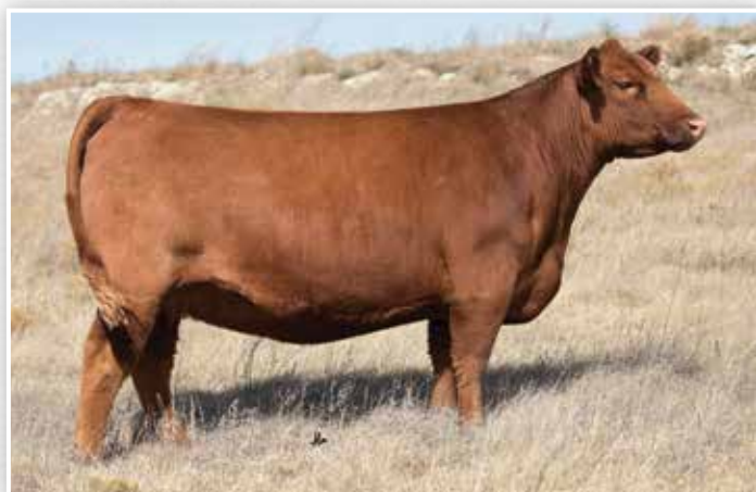
C-Bar Miss Mimi 458B - Dam of Lots 84 - 86