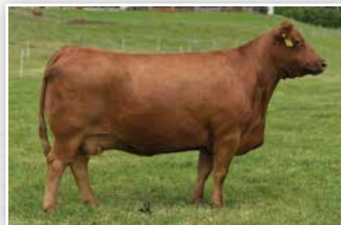
Bonnebell N327 Maternal Granddam of Lot 107