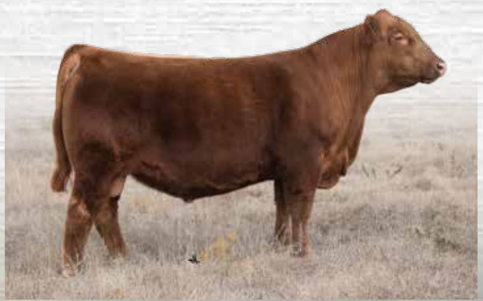
C-BAR ONE WAY 37E