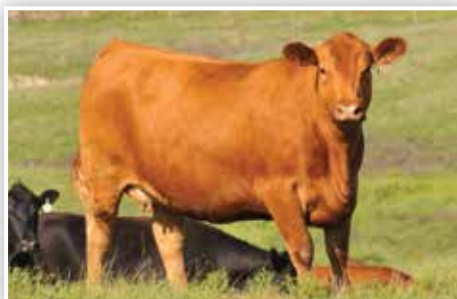
C-Bar Ms Stony A305 - Dam of Lot 2 & 3