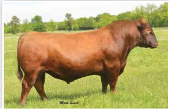
Brown BLW Legend - Son of Sister to Lot 83