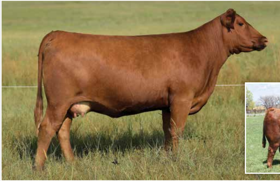
C-Bar Abigrace 636D Dam of Lots 33 & 34