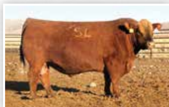
5L Defender - Sire of Lot 95