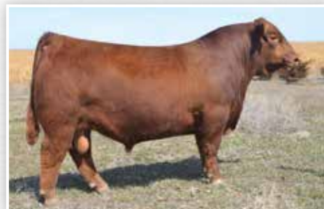
PIE One of a Kind - Sire of Lot 3