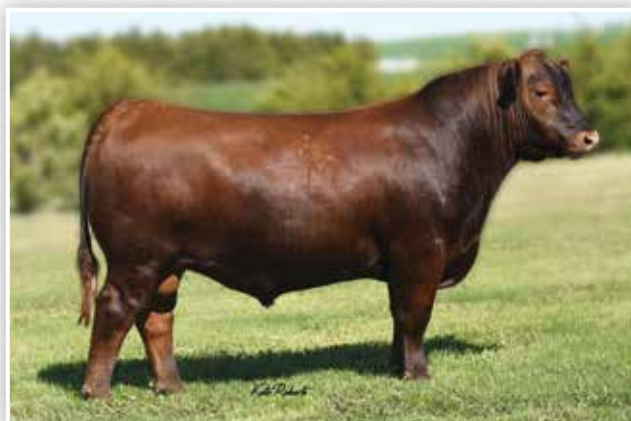
9 Mile Franchise 6305 – The $105,000 Maternal Brother to Lot 32!