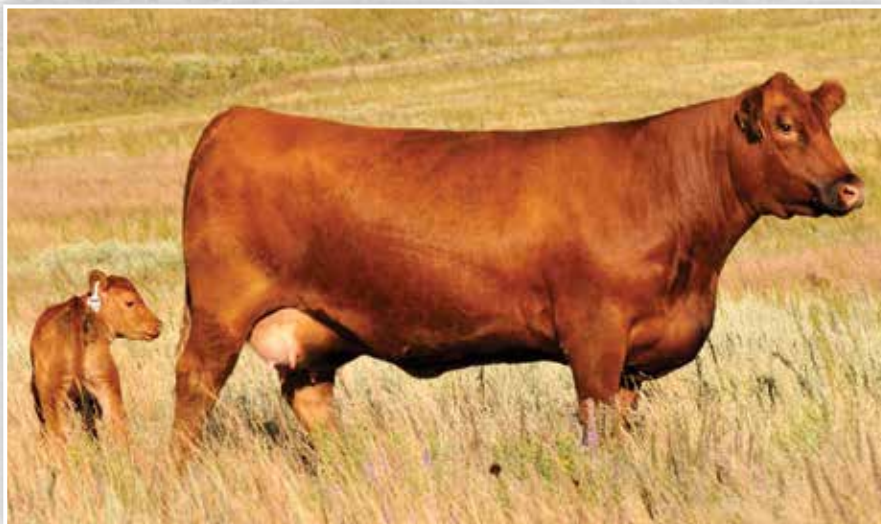
C-Bar Abigrace 264Z - Dam of Lots 53 - 57