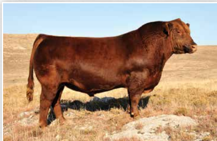
C-Bar Evolution 107Y - Sire of Lot 72