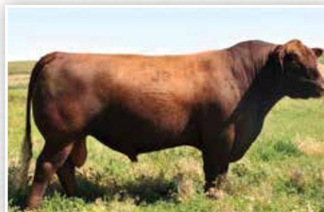
C-Bar El Dorado 114Z - Sire of Lot 93B

The second set of embryos from the prolific Leanna female are sired by El Dorado, the Anticipation x W914 son that has done an exceptional job in countless programs across the country, including 9 Mile Ranch, Lautenschlager & Sons, and 5L Ranch. He combines the influence of L7730 on the top side with the powerful Stony cow family on the bottom. El Dorado charts in the top 9% for GM, top 19% CED, and top 6% Marb. He is well noted for his ability to sire phenotypically correct cattle with added substance, style, and quality. He has been responsible for high sellers including El Grande, now employed in the Pieper program. This mating is sure to yield exciting results!