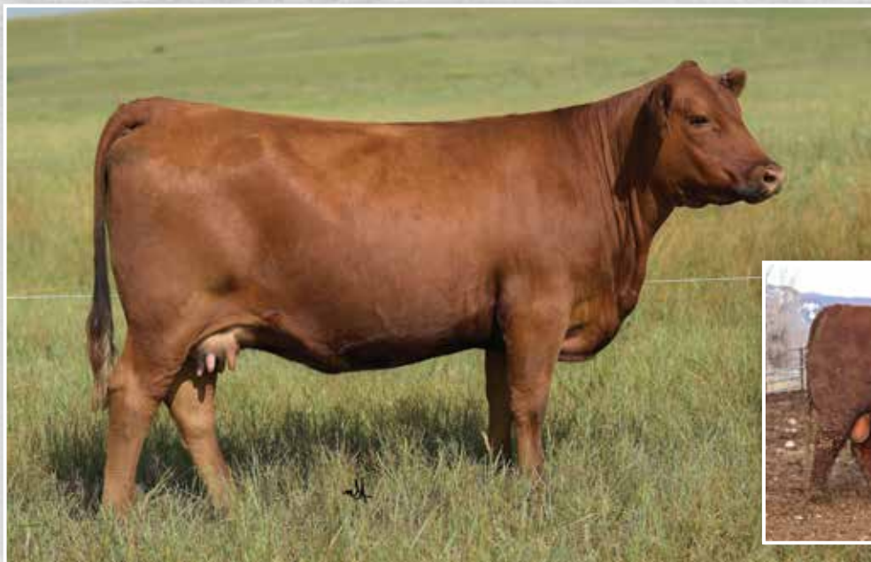
C-Bar Abigrace 635D Dam of Lots 35 & 36