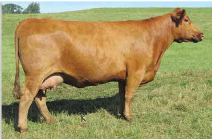
DFRA Tarmily N512 – Maternal Granddam of Lots 91-92 The dam of the iconic Damar Mimi W085!