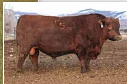
5L Bourne 117-48A Sire of Lots 35 & 36

5L Bourne just might offer one of the most impressive phenotypes of any Red Angus bull we've seen. Unsurpassed mass, dimension, thickness, and genuine upper rib shape accompany his carcass merit and calving ease abilities. 635D is another rookie to the donor pen that we struggle to contain excitement about. Much like her sister she is flat shouldered, angular and feminine about her front third, and transitions into a bold, three-dimensional rib cage with the structural integrity that we demand. Longevity is one of the major attributes of the legendary Abigrace cow line. This mating is sure to excite any and all progressive Red Angus enthusiasts!