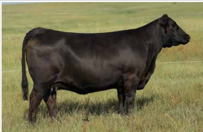
C-Bar Abigrace 633D - Dam of Lot 127A Pregnancy

462 is the Pieper bred female that is sired by Prospect and backed by the Hay Cow stud, Cutting Edge. She offers low birth calving ease genetics with added eye-appeal and extension. We selected this female for her added eye-appeal, structural correctness, and overall symmetry with our old friend Seth Leachman. She has been a consistent and reliable producer! PE 5/1/18-7/31/18 TO C-BAR CREEDENCE 131D (RAA: 3534624). PROJECTED TO CALVE IN MARCH.