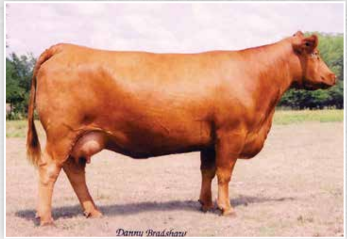
Brown Ms Abigrace L7730 - Maternal Granddam of Lot 30