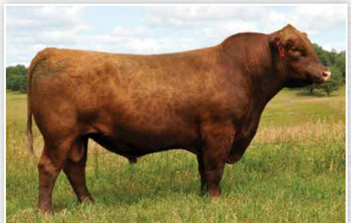
5L Independence 560-298Y - Sire of Lots 84 - 86