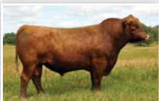
5L Independence - Sire of Lot 94

PE 5/1/18-9/1/18 TO C-BAR ROCKMOUNT 197C (RAAA: 3593628). PROJECTED TO CALVE IN MAY.