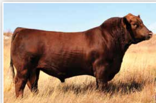
C-Bar-RJ Genesis A31 - Sire of Lot 110