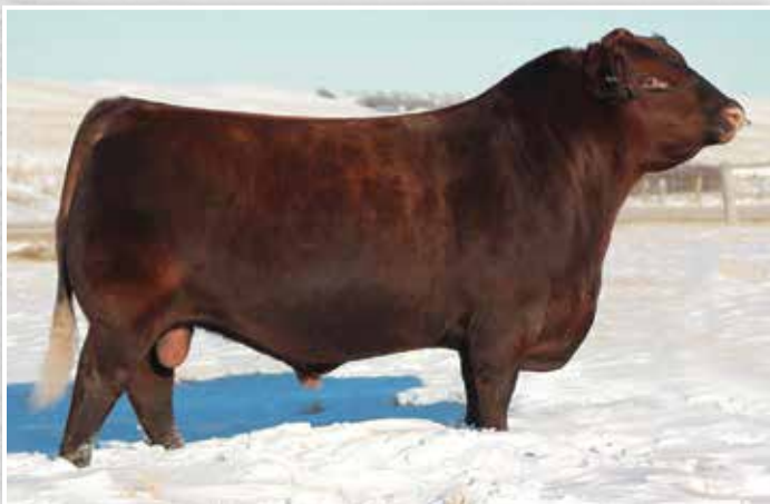
Six Mile Signature 295B - Sire of Lot 103

Here is a big centered, soggy made female sired by the performance and phenotype stud, PIE One Of A Kind and backed by the Mulberry daughter 205T that originated in the Brylor program in Alberta. The cow potential that this heifer calf offers is unlimited!