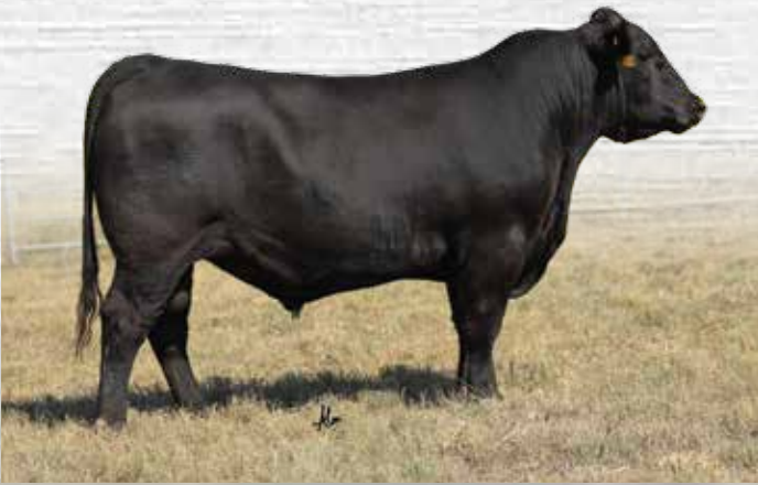
C-BAR ROCKMOUNT 197C

FEATURING THE SERVICE OF THESE ELITE SIRES