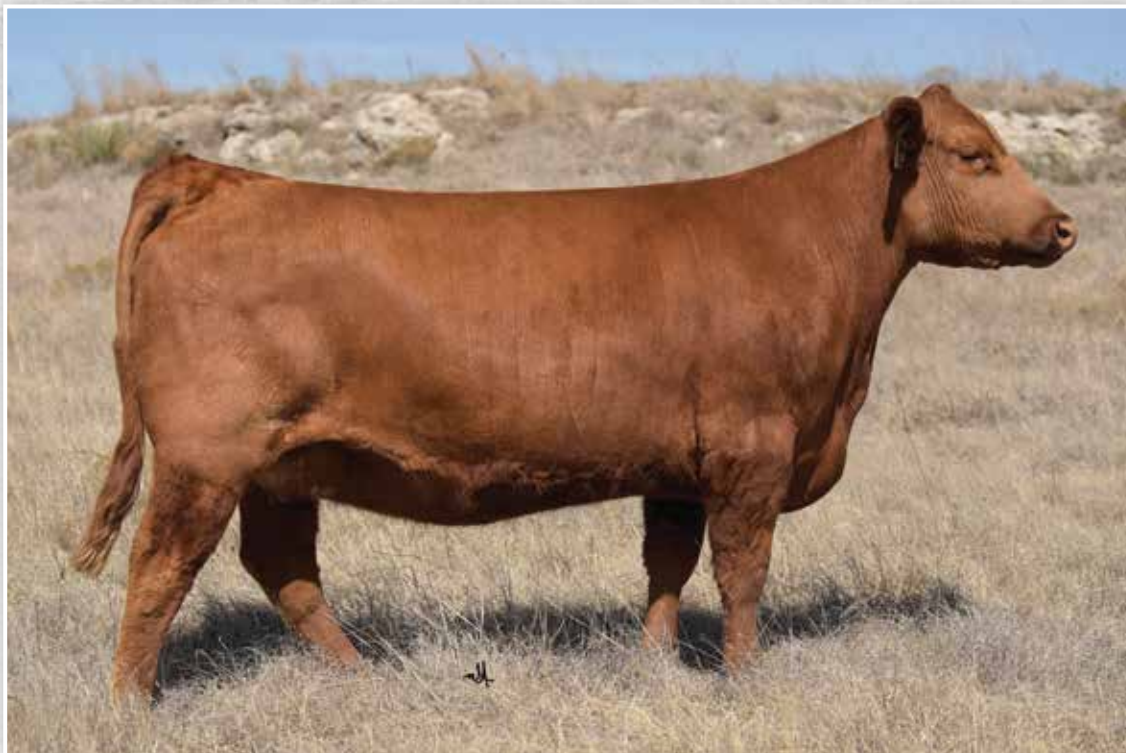
C-Bar Abigrace 417B - Dam of Lots 64 - 66

The carcass and performance superstar Spur Franchise of Garton sires this trio of heifer calves. He ranks among the top 1% for Marb, top 1% YG, top 1% REA, top 3% GM, top 14% YG, top 16% WW, top 13% ADG, and top 6% MPG. His elite number profile combined with the maternal influence of the impressive Abigrace T715, tracing to the $3 Million L7730. T715 is the dam of the Pieper owned El Grande sire. 417B is an up and coming female in the donor pen with a bright future. These females have major potential as trait leading females blending carcass merit, phenotypic appeal, and longevity through the maternal strength they are supported by.