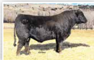
Spur Franchise of Garton Sire of Lot 98

Here is the only heifer calf from the Leanna cow family and we believe she is truly special. Her sire is the great Spur Franchise of Garton stud that sets the stage for carcass merit and is the sire of the $105,000 9 Mile Franchise 6305. Big time carcass merit and potential to be an influential female with a pedigree second to none!