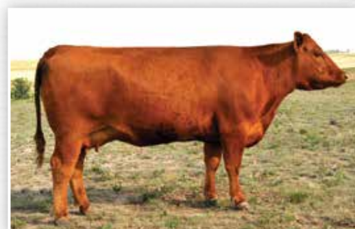
C-Bar Stony W909 - Dam of Lots 8 - 12