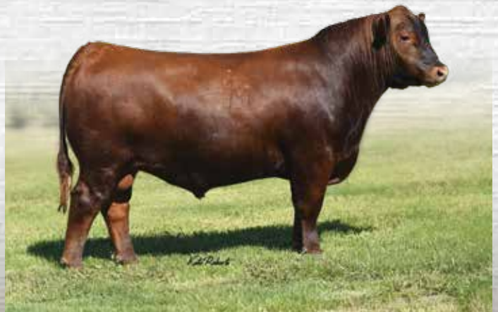
9 MILE FRANCHISE 6305