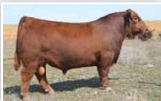
PIE One of a Kind - Sire of Lot 96