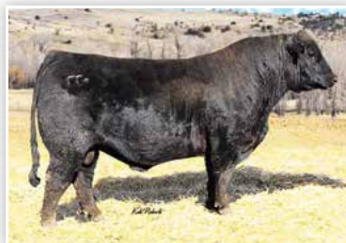
Spur Franchise of Garton - Sire of Lots 64 - 66