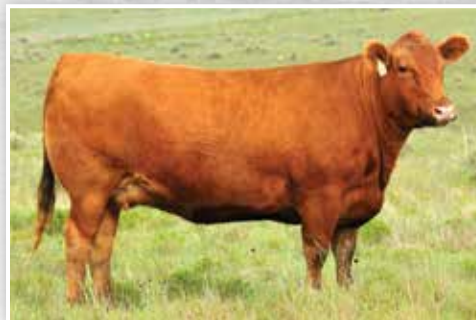
C-Bar Abigrace W9100 Dam of Lots 37 - 42

An exciting flush of sisters sired by two proven, breed-leading AI sires makes for tremendous buying opportunity. It is in our very best efforts to offer the best, and this is a prime example of the quality represented on October 15th. W9100 is the Heritage sired daughter of P7905 that is the direct daughter of the legendary L7730. W9100 has done a tremendous job for the C-Bar Ranch program and we firmly believe her to be one of the truly elite members of this notable cow family. Andras New Direction sires the first pair of daughters from W9100. With a balanced number profile, this duo is equipped with the potential to serve as program enhancing brood cow prospects that offer phenotypic excellence, true rib shape, and longevity. The larger flush, which yielded 4 daughters is sired by the own son of the legendary Patricia Rose 102Y, Brown BLW Legend A1965. These females chart equally as impressive numbers with several top percentile rankings. Regardless of which female from these two powerful flushes that your eye prefers, rest assured that the dominant lineage that supports them will continue to shine through in future generations of Red Angus seedstock